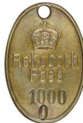
3270 Rehoboth , Brass Native Pass, stamped O 1000, 52 x 35mm (Hern 810w). Very fine £80-100