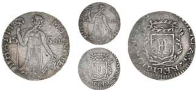
3320 North Haiti, 15 Sols, 1807 (KM. 6). Good fine or better for issue, rare £150-200