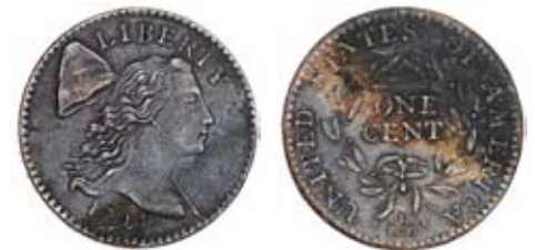
3460 Cent, 1794 (Sheldon 55). Nearly extremely fine but the surfaces with irregular staining and discolouration, the variety very rare in this grade £2,000-2,500