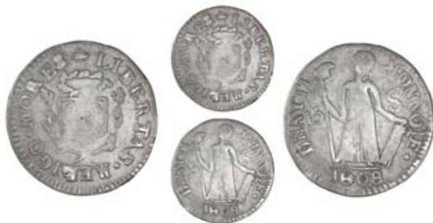
3321 North Haiti, 15 Sols, 1808 (KM. 6). Fine, rare £100-150