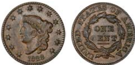
3467 Cent, 1828, large narrow date. A few small surface marks, otherwise better than extremely fine £150-200