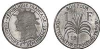
3168 Pattern Franc, 19[–] (1921), by H.-A.-J. Patey, in cupronickel, radiate head left, rev. value and palm, edge plain, without facets, 7.18g/12h (GC –; Byrne –). About as struck, extremely rare £300-400 Provenance: Bt C. Plante 1987