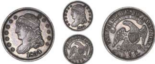
3452 Half-Dime, 1834. Extremely fine £80-100