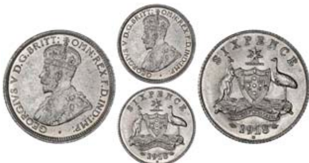
3275 George V , Sixpence, 1918M (KM. 25). Light scratch in reverse field, otherwise good extremely fine £300-400