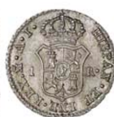
3396 José Napoléon , Réal, 1812 AI , Madrid (Cayón 14660; KM. 553). Practically as struck, very rare £300-400