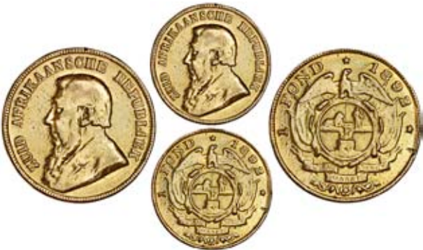
3221 Paul Kruger, Pond, 1892, single shaft (Hern Z45; KM. 10.2; F 2). Has been removed from a mount, fine, rare ₤ £300-400