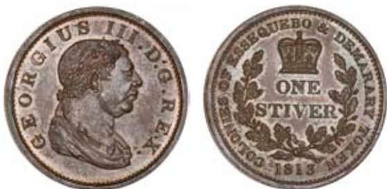
3118 George III, Stiver, 1813 (Prid. 9; KM. 10). Mint state but dull £80-100