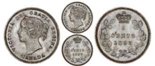
3291 Victoria, 5 Cents, 1893 (KM. 2). Good extremely fine or better £150-200