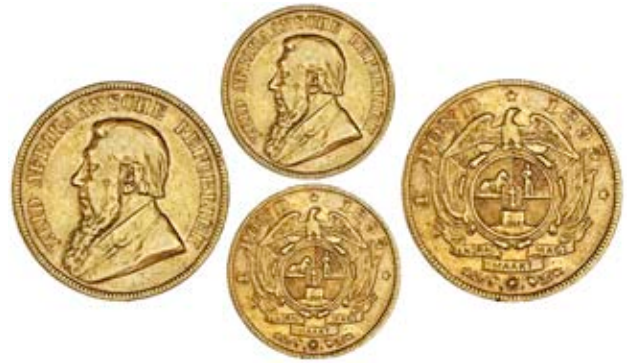
3224 Paul Kruger, Pond, 1895 (Hern Z48; KM. 10.2; F 2). Good fine ₤ £250-300