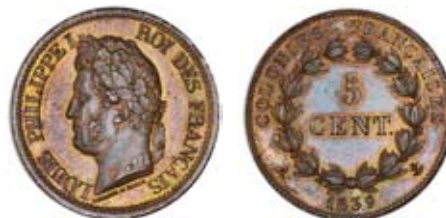
3149 Louis Philippe , Proof 5 Centimes, 1839 A , edge with traces of graining right, 10.10g/6h (KM. E12). Brilliant, rare £120-150 Provenance: Bt R. Zander December 1965