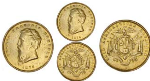
3218 Thomas Burgers, Pond, 1874, fine beard, 7.85g/6h (Hern B1; KM. 1.2; F 1a). Probably removed from a ring mount, sweated, nearly fine, rare £1,200-1,500