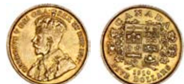
3293 George V, 5 Dollars, 1914 (KM. 26; F 4). Mount removed at 12 o'clock, otherwise nearly very fine, rare £300-350