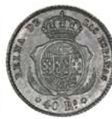
3397 Isabella II , 40 Réales, 1862, Madrid, a contemporary forgery in platinum, 3.32g/12h (cf. Cayón 17262; cf. KM. 616.2; cf. F 332). Small dig above Queen's head, otherwise extremely fine or better £200-250