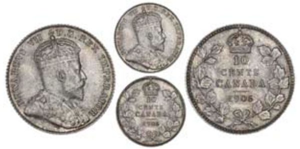
3289 Edward VII, 10 Cents, 1906 (KM. 10). Practically as struck, toned £150-200