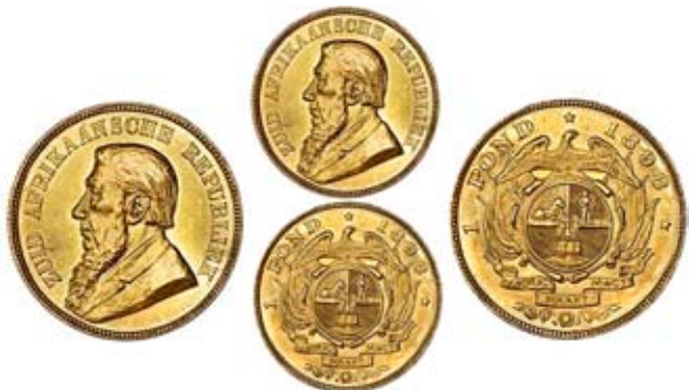
3228 Paul Kruger, Pond, 1898 (Hern Z51; KM. 10.2; F 2). A few rim nicks and perhaps lightly cleaned at some time, otherwise nearly extremely fine ₤ £250-300