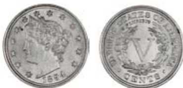
3456 Nickel 5 Cents, 1894. Extremely fine or better £100-150