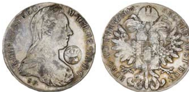
3215 Luis I, AUSTRIA, Maria Theresa, Thaler, 1780, obv. countermarked with crowned PM in circle (Gomes 12.03; KM. 46.1). Coin good fine, counterstamp better £80-100