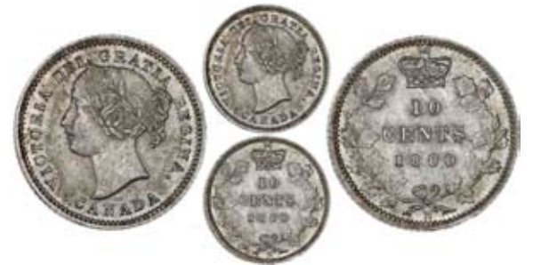
3290 Victoria, 10 Cents, 1880H (KM. 3). Better than extremely fine, lightly toned £300-500