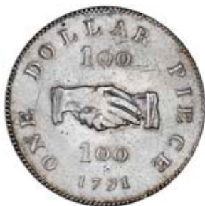
3388 Sierra Leone Co , Dollar, 1791, 25.89g/5h (Vice 2; KM. 6). Scratch on reverse, otherwise very fine or better £400-600