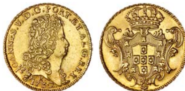
3282 John V , 12,800 Réis, 1732, Rio (Gomes 60.07; KM. 139; F 55). Perhaps lightly cleaned at some time, otherwise good very fine, rare £3,500-4,500