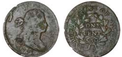
3461 Cent, 1797, stemless wreath (Sheldon 131). Fair to fine £100-150