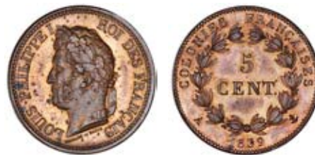
3148 Louis Philippe , Proof 5 Centimes, 1839 A , edge plain, 9.90g/6h (KM. E12). Minor corrosion spots on obverse, otherwise extremely fine, very rare £90-120 Provenance: Henry Christensen Auction 79 (New York), 11 December 1981, lot 34 (part)