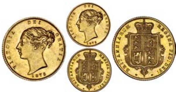
3273 Victoria , Half-Sovereign, 1875s (M 462; S 3862B; KM. 5). Some surface marks, otherwise extremely fine £500-600