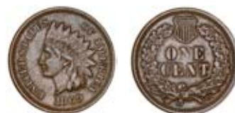
3473 Cent, 1869, 9 over 9 in date. Very fine £250-300