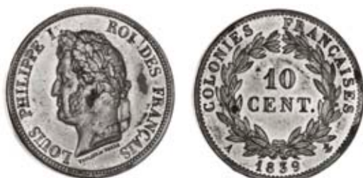
3147 Louis Philippe , Proof 10 Centimes, 1839 A , in white metal, edge plain, 20.58g/6h (cf. KM E13; cf. Byrne 1424). Minor corrosion spots both sides, otherwise extremely fine, very rare £120-150 Provenance: R.A. Byrne Collection, Jess Peters Auction 78 (Los Angeles), 13-15 June 1975, lot 1424