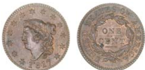
3466 Cent, 1817. Good extremely fine with some original colour £400-600 Slabbed in NGC holder, graded MS 63BN