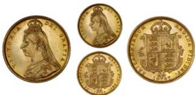
3274 Victoria , Half-Sovereign, 1887M, small close J.E.B (M 483A; S 3870A; KM. 9; F 21). Virtually as struck, very rare £1,200-1,500