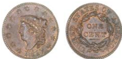
3465 Cent, 1817. Good extremely fine with some original colour £400-600 Slabbed in NGC holder, graded MS 63BN