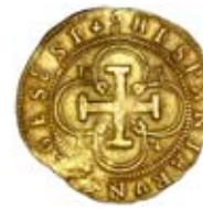
3391 Carlos and Joanna (1516-55), Escudo, undated, Segovia, assayer p, 3.37g/7h (Cayón 3144; F 156). Creased and straightened and with a small flat patch, otherwise good very fine, scarce £400-600