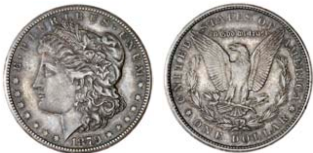
3432 Dollar, 1879cc. Good very fine £200-300