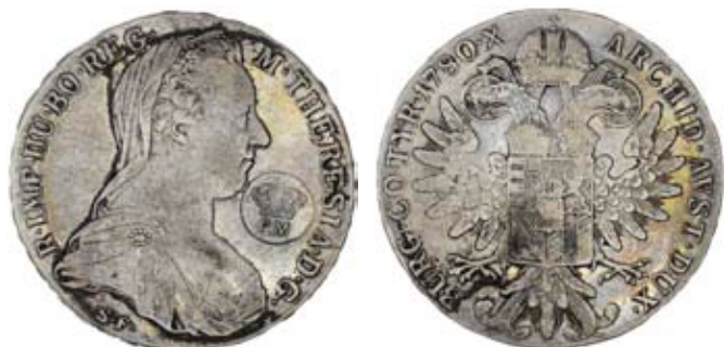
3214 Luis I, AUSTRIA, Maria Theresa, Thaler, 1780, obv. countermarked with crowned PM in circle (Gomes 12.03; KM. 46.1). Coin good fine, counterstamp better £80-100