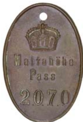
3268 Maltahöhe , Brass Native Pass, stamped 2070, 52 x 35mm (Hern 810o). Good very fine £80-100