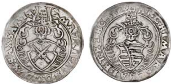
3316 Saxony, Albertine Line, Moritz, Half-Thaler, 1552, Freiberg, 14.32g/9h (Keilitz/Kahnt 14). Very fine, scarce £200-250