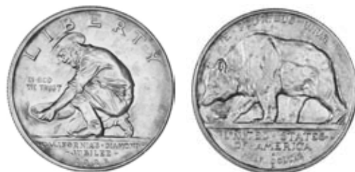
3491 Half-Dollar, 1925s, California, Diamond Jubilee. Practically as struck £150-250