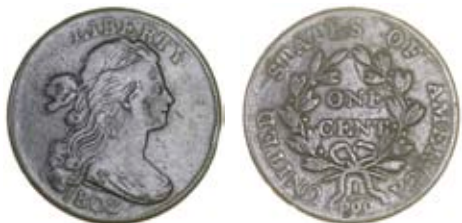
3464 Cent, 1802, fraction reads 1/000 (Sheldon 228). Good fine, the error sought-after £90-120