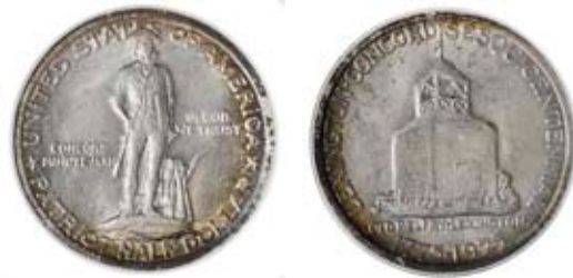
3493 Half-Dollar, 1925, Lexington-Concord Sesquicentennial. Practically as struck £80-100 Slabbed in PCGS holder, graded MS 64