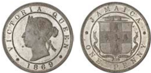
3172 Victoria, Proof Penny, 1869, edge plain, 9.25g/12h (Prid. 9a; KM. 17). Brilliant £150-200