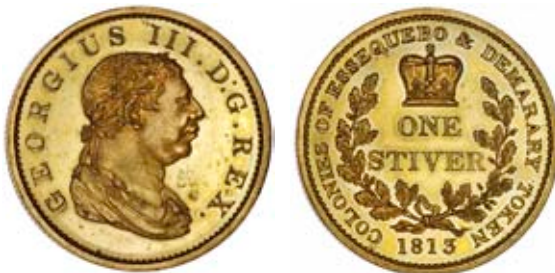
3121 George III, Proof Stiver, 1813, in copper-gilt, edge centrally grained left, 18.88g/6h (Prid. 29B; KM. 10a). Brilliant, very rare £600-800

Provenance: F. Pridmore Collection, Part I, Glendining Auction, 21-2 September 1981, lot 60