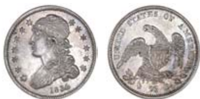
3437 Quarter-Dollar, 1834. Good extremely fine £800-1,000 Slabbed in NGC holder, graded AU 58