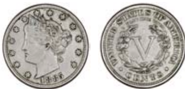
3454 Nickel 5 Cents, 1885. Good fine, rare date £250-300