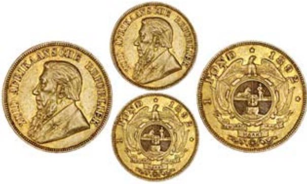
3220 Paul Kruger, Pond, 1892, double shaft (Hern Z44; KM. 10; F 2). Very fine ₤ £400-500