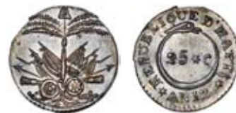
3324 Western Republic, 25 Centimes, AN 12 [1815] (KM. 12.2). Good extremely fine £80-100

Provenance: Münzen und Medaillen Auction, 16 April 2004, lot 1236