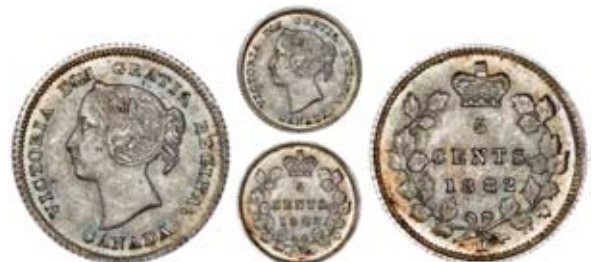
3292 Victoria, 5 Cents, 1882H (KM 2). Light surface marks, otherwise extremely fine or better, toned £80-100