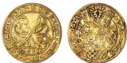
3318 Silesia-Münsterberg-Oels, Heinrich Wenceslas and Karl Friedrich, 3 Ducat, 1621, 10.18g/9h (KM. 3259; F -). Lightly creased, otherwise nearly very fine, rare £1,500-2,000