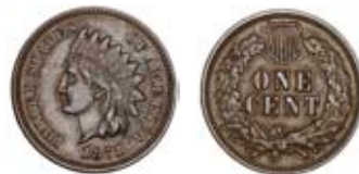
3475 Cent, 1871. Extremely fine £150-200