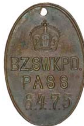
3271 Swakopmund , Brass Native Pass, stamped 6475, 52 x 35mm (Hern 810y). Very fine £80-100