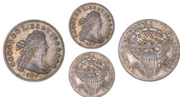
3446 Dime, 1805. Extremely fine or better, lightly toned £2,000-2,500 Slabbed in NGC holder, graded AU 58