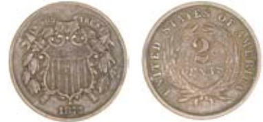
3458 Two Cents, 1872. Fine or better, rare £200-250