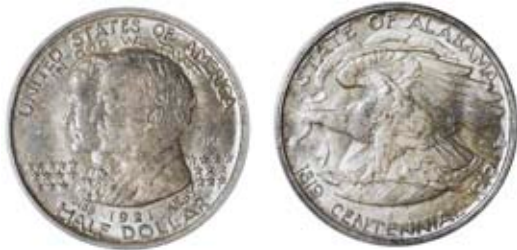
3488 Half-Dollar, 1921, Alabama Centennial, 2 x 2 in obv. field. Good extremely fine £150-200 Slabbed in PCGS holder, graded MS 64