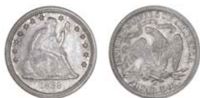
3440 Quarter-Dollar, 1888s. Practically as struck £500-700 Slabbed in NGC holder, graded MS 65