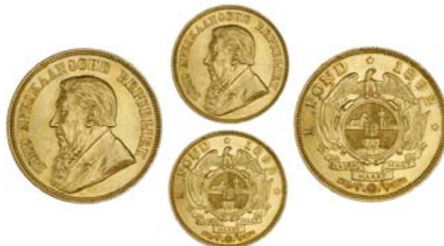
3219 Paul Kruger, Pond, 1892, double shaft (Hern Z44; KM. 10.1; F 2). Nearly extremely fine £600-800