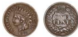
3474 Cent, 1869, possibly 9 over 9 in date. About very fine £200-250