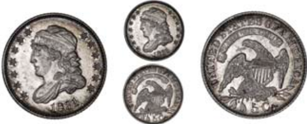
3451 Half-Dime, 1831. Better than extremely fine, the fields somewhat prooflike £150-200