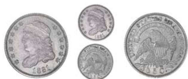
3449 Half-Dime, 1831. Better than extremely fine £120-150 Slabbed in NGC holder, graded Unc details