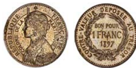
3178 Piédfort Pattern Franc, 1897, by A. Borrel, in nickel-brass, female bust left within double legend, rev. value in wreath, edge MCHOR ESSAI, 12.22g/6h (KM. PE 2; Guttag 2423; VG 4311). Overall carbon spots, otherwise mint state £200-250

Provenance: R.A. Byrne Collection, Jess Peters Auction 78 (Los Angeles), 13-15 June 1975, lot 924