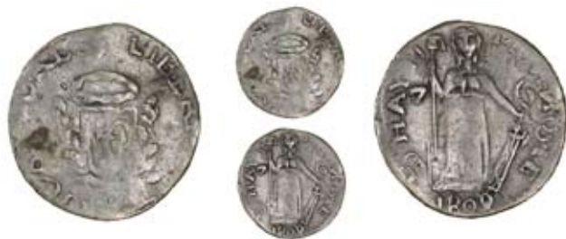
3322 North Haiti, 7 Sols 6 Deniers, 1809 (KM. 3). Fair to fine, rare £80-100