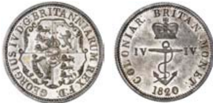
3284 George IV, Anchor Money, Proof Quarter-Dollar, 1820, 6.74g/12h (Prid. 9). Surfaces hairlined but still mirror-like, better than extremely fine, rare £300-400