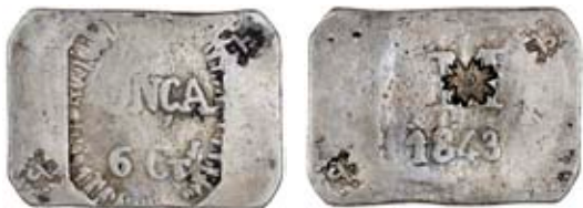
3209 Maria II, Onça (Canelo), 1843, with central flower counterstamp on rev., 26.45g (Gomes 12.01; KM. 26.1). Very fine for issue £120-150