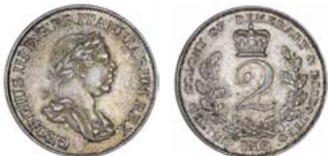
3111 George III, 2 Guilders, 1816 (Prid. 8; KM. 14). Dull appearance, otherwise almost extremely fine £120-150