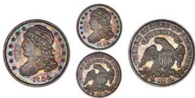
3448 Dime, 1834, large 4. Extremely fine or better, lightly toned £200-250