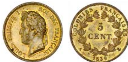
3150 Louis Philippe , Proof 5 Centimes, 1839 A , in brass, edge plain, 10.36g/6h (cf. KM. E12). Carbon spot on obverse rim, otherwise brilliant, very rare £120-150 Provenance: Bt P. Bosco