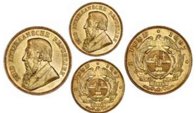
3226 Paul Kruger, Pond, 1897 (Hern Z50; KM. 10.2; F 2). Good very fine ₤ £250-300