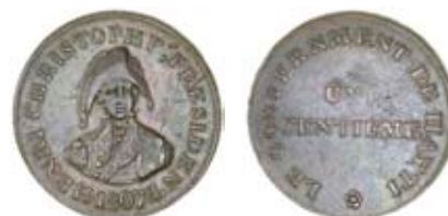
3323 North Haiti, Pattern Centime, 1807, in copper, bust three-quarters right, rev. value, edge grained, 3.07g/12h (KM. Pn 1). Scratched in obverse field, otherwise nearly very fine, very rare £400-600

Provenance: Münzen und Medaillen Auction, 16 April 2004, lot 1236