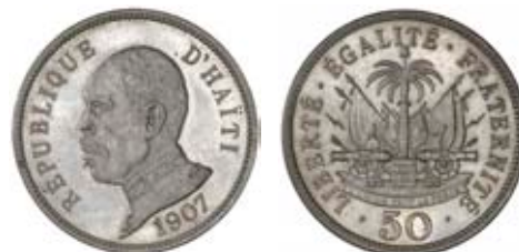
3325 Republic, Proof 50 Centimes, 1907, edge plain, 10.06g/6h (KM. 56). Small scratch in obverse field, otherwise practically as struck, rare £100-150