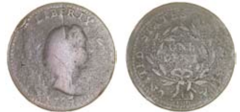
3459 Cent, 1793 (Sheldon 14). Vertical bisecting crack through obverse die, edge knock at 10 o'clock, very good, very rare £1,200-1,500