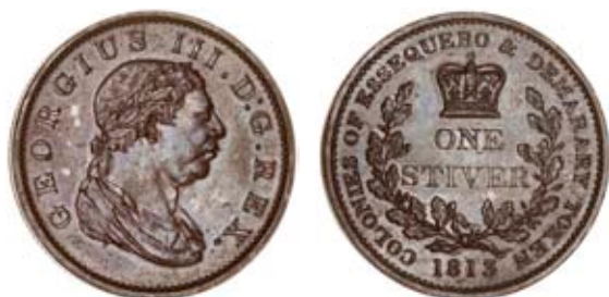
3119 George III, Stiver, 1813 (Prid. 29; KM. 10). Mint stated, toned to appear if bronzed £80-100