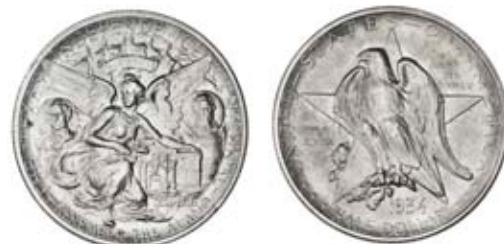
3500 Half-Dollar, 1934, Texas Independence Centennial. Practically as struck £70-90