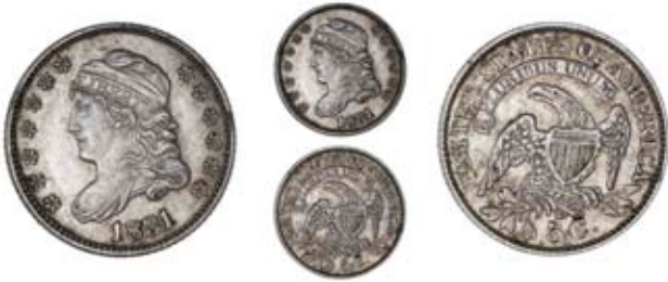
3450 Half-Dime, 1831. Extremely fine or better £100-150