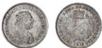
3115 George III, Half-Guilder, 1816 (Prid. 16; KM. 12). Tarnished, otherwise almost extremely fine £60-80