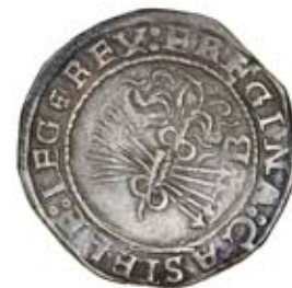
3390 Ferdinand and Isabella , 4 Réales, undated, Burgos, mm. ermine, five arrows in bundle, 13.58g/10h (Cayón 2795). Nearly very fine, very rare £400-600