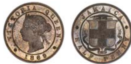
3174 Victoria, Trial Halfpenny, 1869, in bronze, edge plain, 5.66g/12h (Prid. 51B; cf. KM. Pn 1). Extremely fine but dull, very rare £150-200