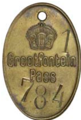
3265 Grootfontein , Brass Native Pass, stamped 784, 52 x 35mm (Hern 810g). Very fine £80-100