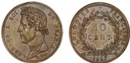
3143 Charles X , 10 Centimes, 1827 H , La Rochelle (KM. 11.2). Extremely fine £70-90 Provenance: Bt H. Christensen April 1971