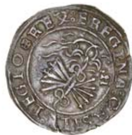
3389 Ferdinand and Isabella (1476-1516), 4 Réales, undated, Burgos, mm. pellet, five arrows in bundle, 13.70g/10h (Cayón 2796). Very fine, very rare £400-600