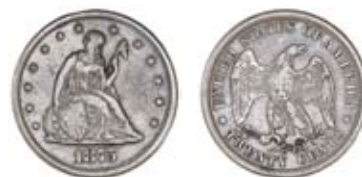
3444 Twenty Cents, 1875cc. Fine £200-250