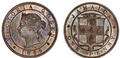
3173 Victoria, Trial Penny, 1869, in bronze, edge plain, 9.51g/12h (Prid. 9b; KM. Pn 2). Extremely fine but dull, very rare £200-250 Provenance: Bt C. Plante October 1970