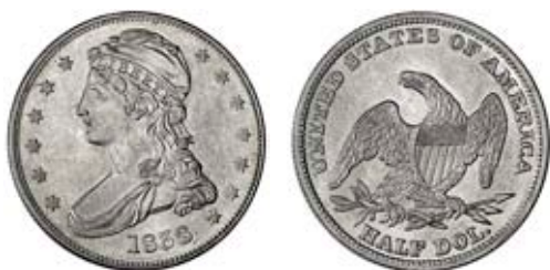
3435 Half-Dollar, 1838. Some surface marks, otherwise good extremely fine with some original bloom £400-500