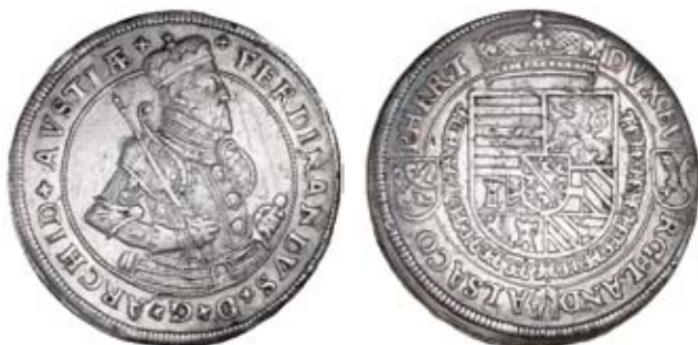
3276 Archduke Ferdinand (1564-95), Thaler, Ensisheim, 27.77g/12h (Dav. 8088-9). Some edge irregularities and lightly scored in obverse field, otherwise very fine or better £120-150