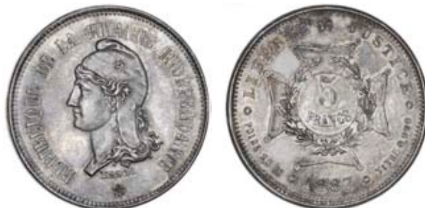
3154 Republic , Pattern 5 Francs, 1887, by C. Wurdén, in silver, Liberty head left, ESSAI below, rev. Maltese cross with value in centre, edge grained, 25.22g/6h (GC 11; Gutttag 1830). Good extremely fine, toned, extremely rare £1,200-1,500 Provenance: R.A. Byrne Collection, Jess Peters Auction 78 (Los Angeles), 13-15 June 1975, lot 1405