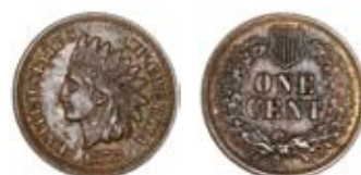
3477 Cent, 1878. Extremely fine with traces of original colour £120-150