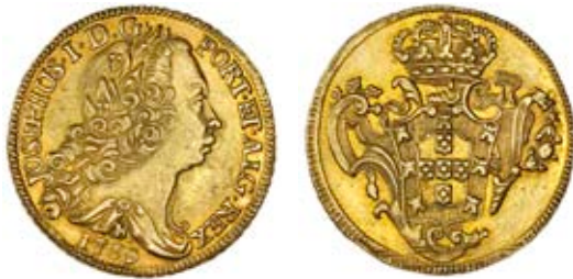
3283 Joseph I, 6,400 Reis, 1765/4, Bahia (Gomes 42.17; KM. 172.1; F 69). Adjustment marks at date (and corresponding on reverse), otherwise good very fine, the overdate scarce £800-1,000