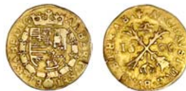
3278 Brabant , Albert and Isabella, Albertin, 1600, Antwerp, mm. hand, 2.81g/1h (Delmonte 146; F 89). Two tiny edge splits, otherwise fine or better £200-250