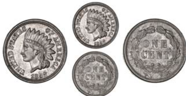
3471 Cent, 1859. Better than extremely fine £90-120