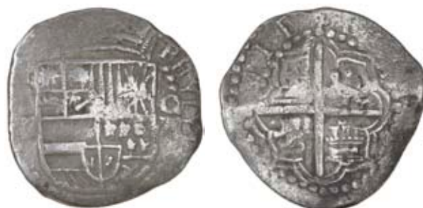
3280 Philip IV , 8 Réales, date unclear, Potosí, assayer P (?), reads PHILYPVS, 26.80g/11h (cf. Cayón 6201). Fine or better £100-150