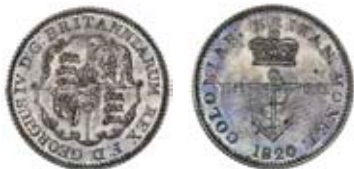
3285 George IV, Anchor Money, Proof One-Eighth-Dollar, 1820, 3.38g/12h (Prid. 11). Hairlined, extremely fine, the surfaces retaining some brilliance £150-200