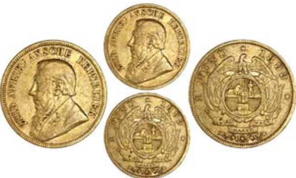
3222 Paul Kruger, Pond, 1893 (Hern Z46; KM. 10.2; F 2). Good fine ₤ £250-300