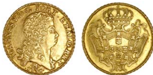
3281 John V , 12,800 Réis, 1731/0, Minas Gerais (Gomes 61.05; KM. 139; F 55). Good very fine, rare £3,000-3,500