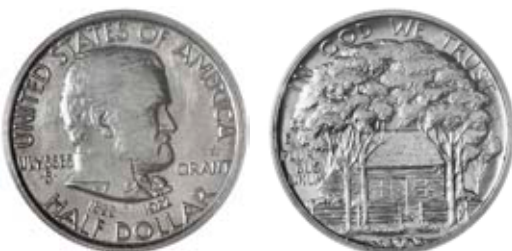
3490 Half-Dollars (2), both 1922, General Grant, with and without star in obv. field [2]. Practically as struck £700-900