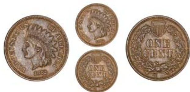
3476 Cent 1872. Obverse rim marks, otherwise nearly extremely fine with traces of original colour £250-300