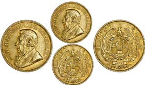
3223 Paul Kruger, Pond, 1894 (Hern Z47; KM. 10.2; F 2). Scuffed, otherwise better than very fine ₤ £300-350