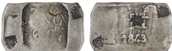
3210 Maria II, Onça (Canelo), 1843, with central flower counterstamp on rev., 26.64g (Gomes 12.01; KM. 26.1). Weakly struck as usual, good fine £90-120