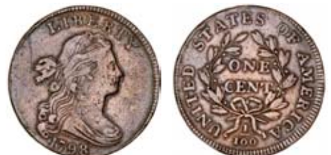
3462 Cent, 1798 (Sheldon 176). Sometime cleaned, fine or better; estimated by Sheldon as R5 £200-250