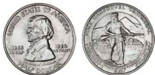
3492 Half-Dollar, 1925, Fort Vancouver Centennial. Virtually as struck £150-200