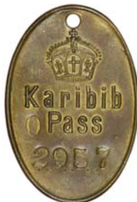
3266 Karibib , Brass Native Pass, stamped O 2957, 52 x 35mm (Hern 810j). Very fine £80-100