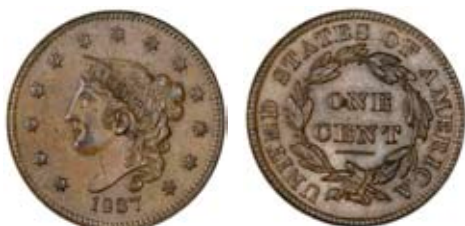
3468 Cent, 1837, plain cord, medium letters. Reverse die crack, otherwise extremely fine or better with vestiges of original colour £100-150