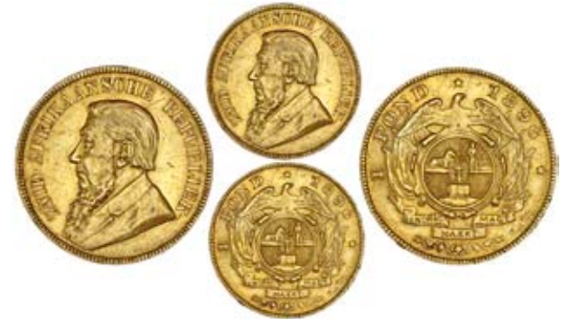
3225 Paul Kruger, Pond, 1896 (Hern Z49; KM. 10.2; F 2). Surface marks and rim nicks, otherwise very fine ₤ £200-250