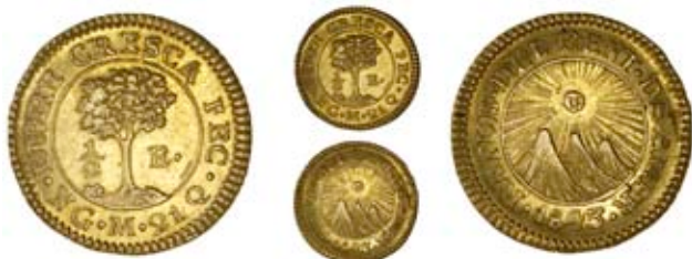
3319 Republic of Central America, Half-Escudo, 1843m, Guatemala City (KM. 5; F 30). Better than extremely fine £300-400

Provenance: Ponterio Auction 47 (Chicago), 8-9 March 1991, lot 1791