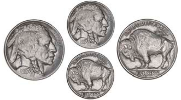
3457 Nickel 5 Cents, 1913s, variety 2. Good fine £150-200