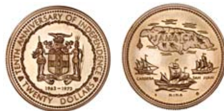
3176 Elizabeth II, 20 Dollars, 1972, 10th Anniversary of Independence (KM. 61; F 6). Mint state £300-400 §