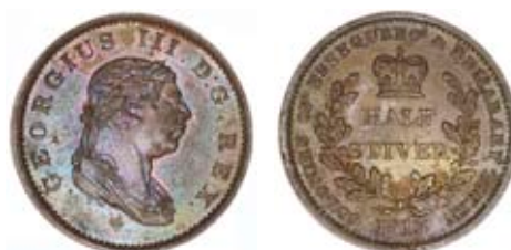
3124 George III, Proof Half-Stiver, 1813, edge centrally grained left, 9.52g/6h (Prid. 30A; KM. 9). Mint state but dull £600-800

Provenance: A.G. Carter Collection, Stack's Auction, 18-20 January 1984, lot 1684; Coin Galleries Mailbid Sale, 25 February 2004 (577)