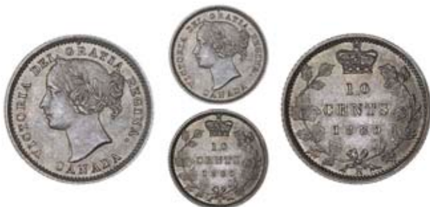
3288 Victoria, 10 Cents, 1880H (KM. 3). Good extremely fine, toned £300-500