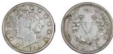
3455 Nickel 5 Cents, 1886. Fine £200-250