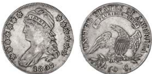
3434 Half-Dollar, 1807, large stars, 50c over 20. Good fine or better £150-200