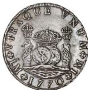
3387 Charles III , 8 Réales, 1770 JM , Lima (Cayón 11976; KM. 55). Very fine or better £150-200