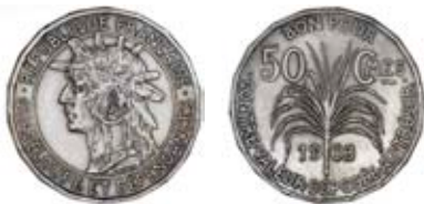
3167 Proof 50 Centimes, 1903, edge ARGENT incuse, 4.02g/12h (GC 43; KM. E2; Byrne 567). Brilliant but traces of lacquer, rare £150-200