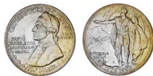
3497 Half-Dollar, 1928, Hawaiian Sesquicentennial. Good extremely fine £800-1,000

First* slabbed in PCGS holder, graded MS 63