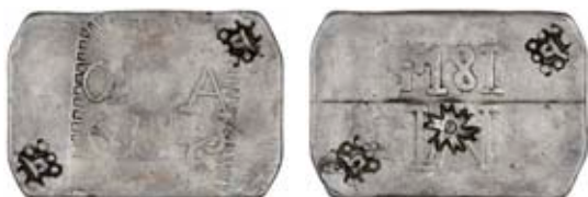
3211 Maria II, Onça (Canelo), 1845, with central flower counterstamp on rev., 26.11g (Gomes 12.02; KM. 26.2). Weakly struck as usual, good fine, countermarks better £120-150