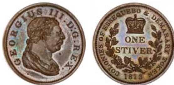
3120 George III, Proof Stiver, 1813, edge centrally grained left, 19.11g/6h (Prid. 29A; KM. 10). Carbon spot below chin, otherwise brilliant, rare £600-800

Provenance: F. Pridmore Collection, Part I, Glendining Auction, 21-2 September 1981, lot 60