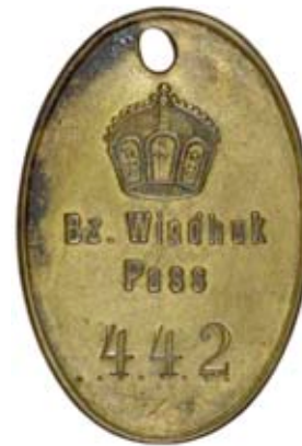
3272 Windhoek , Brass Native Pass, stamped 442, 52 x 35mm (Hern 810ac). Very fine £80-100