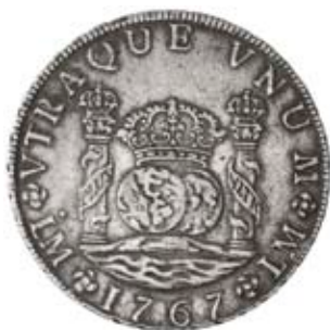
3386 Charles III , 8 Réales, 1767 JM , Lima (Cayón 11948; KM. 55). A few edge nicks, otherwise very fine or better £150-200