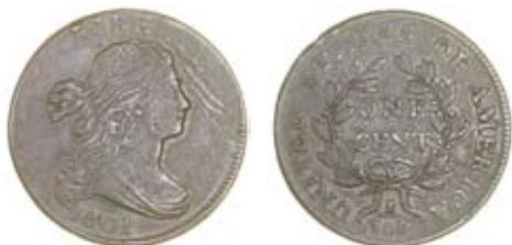
3463 Cent, 1801 (Sheldon 213). Distinctive diagonal die cracks in obverse field, edge knock at 11 o'clock, otherwise good fine or better, rare £150-200