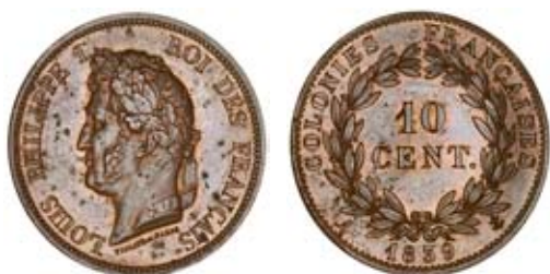
3145 Louis Philippe , Proof 10 Centimes, 1839 A , edge plain, 19.22g/6h (KM. E13; cf. Byrne 1425). Some carbons spots, otherwise extremely fine with some original colour, very rare £200-300 Provenance: Bt L. Merkin 1965