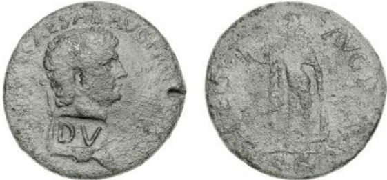
3172 Countermarked imitative Sestertius, Moesia and Thrace, DV [= Dvpondivs], 19.46g/6h (cf. RIC 99; cf. Pangerl 90). Fine, sage-green patina £100-150