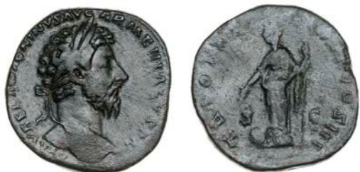
3711 Sestertius, Rome, 164/5, laureate bust right, rev. Providentia standing left, holding wand and sceptre, 27.71g/6h (RIC 906). Very fine, dark patina £100-150