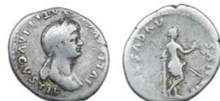
3685 Denarius, Rome, c. 80-1, draped and diademed bust right, rev. VENVS AVGVST, Venus standing right, naked to waist, leaning on cippus, holding helmet in right hand and sceptre in left, 3.14g/6h (RIC Titus 388; RSC 14). Fine, rare £200-250