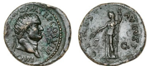
3684 Dupondius, Rome, 80-1, radiate bust right, rev. Ceres standing left, holding corn-ears and long torch, 13.36g/6h (RIC 189; BMC 193). Very fine, dark green-brown patina £100-150