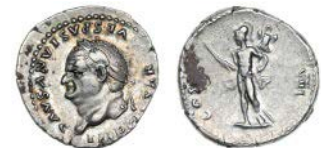
3682 Denarius, Rome, c. 77-8, laureate bust left, rev. Mars standing left, holding spear and trophy, 3.44g/5h (RIC 938; RSC 126) Good very fine, toned £100-150