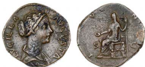
3714 Sestertius, Rome, draped bust right, rev. Juno seated left, holding patera and sceptre, 23.30g/12h (RIC 1746). Very fine, brass tone £100-150