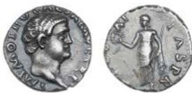
3676 Denarius, Rome, 69, bust right, wearing wig, rev. Securitas standing left, holding wreath and sceptre, 3.38g/6h (RIC 10; RSC 15). Very fine, toned £500-600