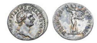
3686 Denarius, Rome, c. 80, laureate bust right, rev. PRINCEPS IVVENTVTIS, Minerva standing right, holding spear in right hand overhead, shield on left arm, 3.22g/5h (RIC 41; CBN Titus 72; RSC 381a). Good very fine, toned £100-150