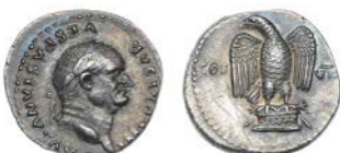
3680 Denarius, Rome, c. 76, laureate bust right, rev. eagle standing facing, head left, wings spread, on low cippus, 3.10g/6h (RIC 99a; RSC 121). Some faint scratches, otherwise extremely fine, toned £100-150