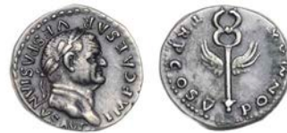
3681 Denarius, Rome, c. 74, laureate bust right, rev. winged caduceus, 3.45g/5h (RIC 703; RSC 362). Good very fine, toned £100-150