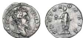
3716 Denarius, Rome, laureate bust right, rev. Emperor, togate, standing left, holding globe in outstretched right hand and roll in left, 2.70g/11h (RIC 3; RSC 15). Very fine, toned £300-400