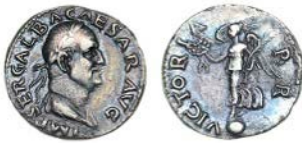
3675 Denarius, Rome, c. 68-9, laureate and draped bust right, rev. Victory standing left on globe, holding wreath and palm, 3.10g/5h (RIC 217; RSC 328). Some erosion, otherwise very fine, toned £100-150