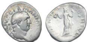
3678 Denarius, Rome, 69, laureate bust right, rev. LIBERTAS RESTITVTA, Libertas standing facing, head right, holding pileus and long staff, 3.08g/5h (RIC 105; RSC 47). Fine £100-150