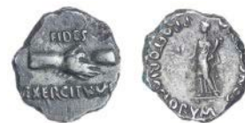
3183 Plated Denarius, Southern Gaul (?), FIDES EXERCITVM, clasped hands, rev. CONCORDIA PRAETORIARVM, Concordia standing left, holding branch and cornucopia, 1.73g/6h (RIC 118; Martin 3; RSC 359). Very fine £100-150