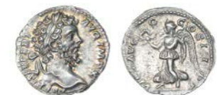
3719 Denarius, Rome, 197/8, laureate bust right, rev. Victory advancing left, holding wreath and palm, 3.45g/12h (RIC 120; RSC 693). Extremely fine £100-150