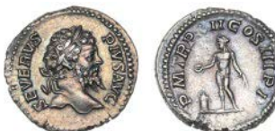
3720 Denarius, Rome, 204, laureate bust right, rev. Genius standing left, holding patera and corn-ears, 3.45g/12h (RIC 195; RSC 464). Extremely fine, toned £100-150