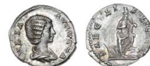
3721 Denarius, Rome, 196-211, draped bust right, rev. Isis standing right, Horus at her breast, foot on prow, 3.34g/12h (RIC 577; RSC 174). Extremely fine, toned £100-150