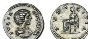
3722 Denarius, Laodicea, 196-202, draped bust right, rev. Pudicitia seated left, 3.68g/12h (RIC 644; RSC 168). Extremely fine, toned £100-150