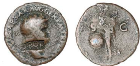
3185 temp. Iulius Vindex (Rebel, 68), countermarked As of Nero, Lugdunum, S P Q R [= Senatus populus que romanvs], 9.12g/6h (cf. Pangerl 27). Fine, brown tone, very rare £100-150