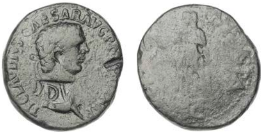
3171 Countermarked imitative Sestertius, Moesia and Thrace, DV [= dvpondivs], 20.02g/6h (cf. RIC 99; cf. Pangerl 90). Fine, sage-green patina £100-150