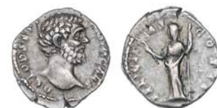
3718 Denarius, Rome, 194/5, bust right, rev. Minerva standing left, holding olive branch and resting hand on shield set on the ground, spear leaning against arm, 3.30g/6h (RIC 7; RSC 48). Very fine, toned £150-200