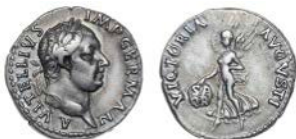
3677 Denarius, Lugdunum, 69, laureate bust right, globe at point of neck, rev. Victory flying left, holding shield, 3.54g/7h (RIC 62; RSC 99). Good very fine, toned £250-300