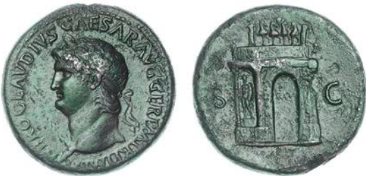
3175 Sestertius, Lugdunum, c. 65, laureate bust left, globe at point of bust, rev. Arcus Neronis, triumphal arch surmounted by statuary group of Nero in quadriga, escorted by Victory and Pax and flanked by soldiers; statue of Mars in niche on side of arch, 26.66g/6h (RIC 148; WCN 117; Hill, Monuments 84). Good very fine, good portrait style with fine brown patina £700-800