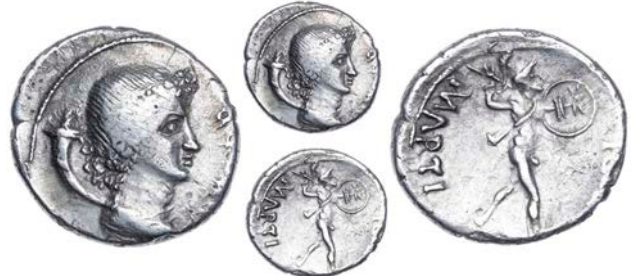
3181 Denarius, Spain, Tarraco (?), c. April-June 68, head of Genius right, cornucopiae behind, rev. MARTI VLTORI, helmeted Mars advancing right, armed with javelin, shield and parazonium, 3.20g/5h (RIC 17; Martin 34; RSC 384a). Very fine and very rare £700-800