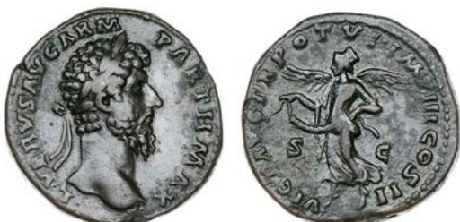
3713 Sestertius, Rome, 165, laureate bust right, rev. Victory flying left, holding diadem, 25.99g/4h (RIC 1454). Very fine, dark green-brown patina £150-200