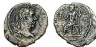
3717 Denarius, Antioch, laureate bust right, rev. IOVI PRAE ORBS, Jupiter seated left, holding Victory and sceptre, 2.70g/11h (RIC -, cf. 43; Cohen -, cf. 41; BMC -, cf. 303). Very fine and toned, rare £300-400