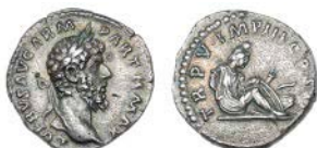
3712 Denarius, Rome, 165, laureate bust right, rev. Parthian prisoner seated right, weapons at feet, 2.92g/6h (RIC 540; RSC 273). Extremely fine, toned £100-150