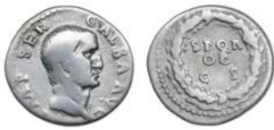
3674 Denarius, Rome, c. 68-9, similar, 3.18g/6h (RIC 167; RSC 287). Fine £150-200