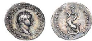
3683 Denarius, Rome, c. 80, laureate bust right, rev. dolphin coiled around anchor, 2.92g/6h (RIC 112; RSC 309). Some faint scratches, otherwise very fine, toned £100-150