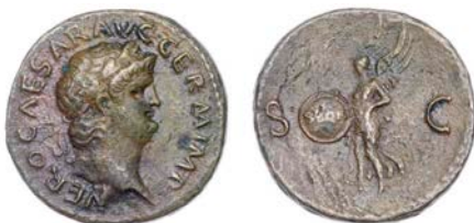
3176 As, Rome, c. 65, laureate bust right, rev. Victory advancing left, holding shield inscribed S P Q R, 8.88g/6h (RIC 312; WCN 285 and 290). Very fine, yellow-brown tone £100-150