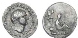
3679 Denarius, Rome, c. 69-71, laureate bust right, rev. IVDAEA, Judæa seated right in attitude of mourning, trophy to left, 3.20g/6h (RIC 2; RSC 226). Small metal flaw in obverse field, otherwise very fine, toned £150-200