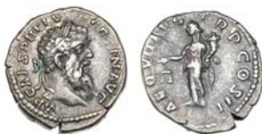
3715 Denarius, Rome, laureate bust right, rev. Æquitas standing left, holding scales and cornucopia, 3.49g/1h (RIC 1a; RSC 2). Very fine, toned £300-400