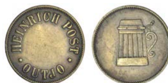
2096 Outjo , Heinrich Post, brass beer check, 20mm (Hern 276a; Theron p.152). Very fine, scarce £100-150