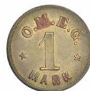
2094 Otavi , Otavi Minen und Eisenbahn Gesellschaft [Mining and Railway Co], uniface brass One Mark, 23mm (Hern 410a; Theron 4). Very fine and very rare £200-300