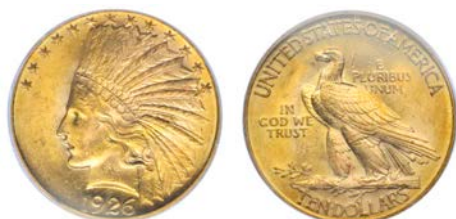
2242 Ten Dollars, 1926. Practically as struck £800-1,000 Slabbed in PCGS holder, graded MS 63