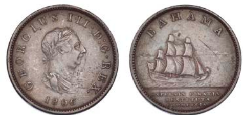
2120 George III , Penny, 1806 (Prid. 2; KM. 1). Very fine £150-200