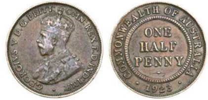
2117 George V , Halfpenny, 1923 (KM. 22). About very fine, very rare £600-800