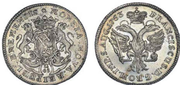
2155 BREMEN, City, Two-Thirds Thaler, 1753, in the name of Francis I (KM. 200). Nearly extremely fine £150-200