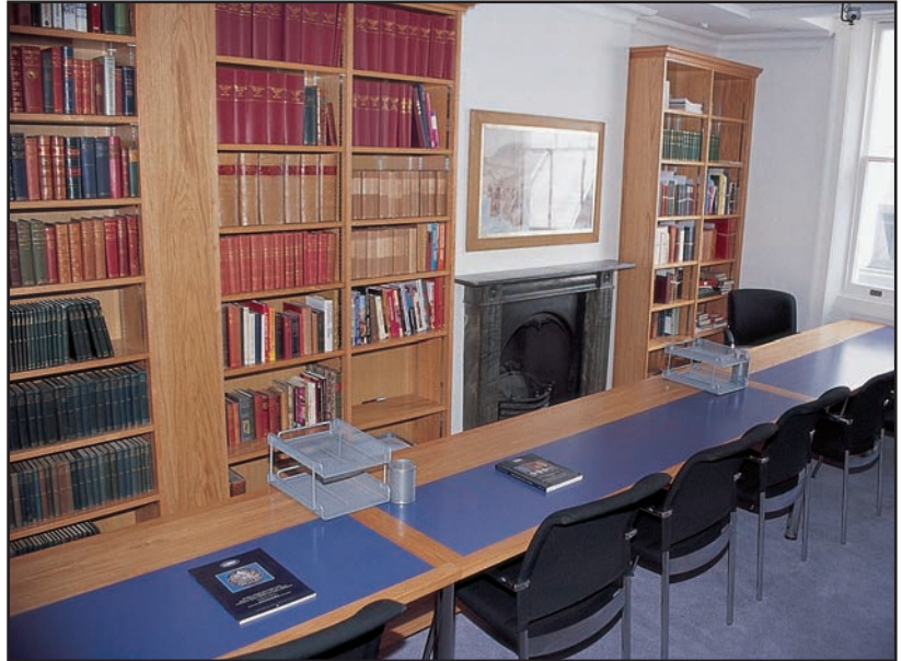
Auction viewing room

In addition, we stage online-only Desktop Auctions, offering a choice of material at all price levels, as well as handling private treaty sales of fine orders, decorations and campaign medals.