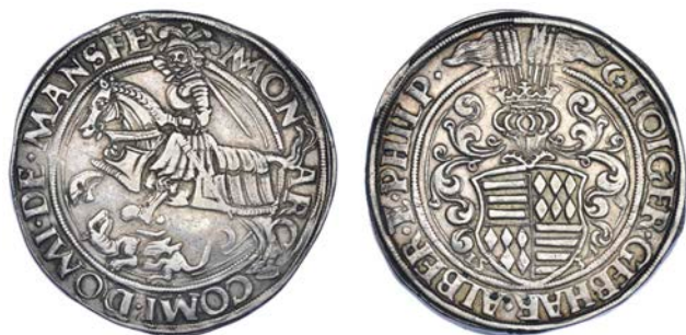
2156 MANSFELD-ARTERN, Hoyer VI, Gebhard VII, Albrecht II and Philipp II, Thaler, 1531, 29.15g/2h (Dav. 9479). Very fine or better £150-200