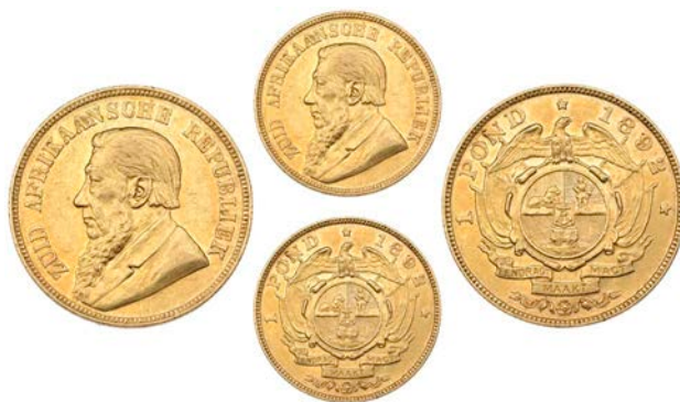
2203 Paul Kruger, Pond, 1892, single shaft (Hern Z45; KM. 10.2; F 2). "Mai" lightly scratched beneath the bust, otherwise good very fine, reverse better, rare £1,500-2,000