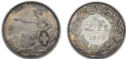
2231 Confederation, 2 Francs, 1862 B (KM. 10a). Better than very fine, toned £100-150