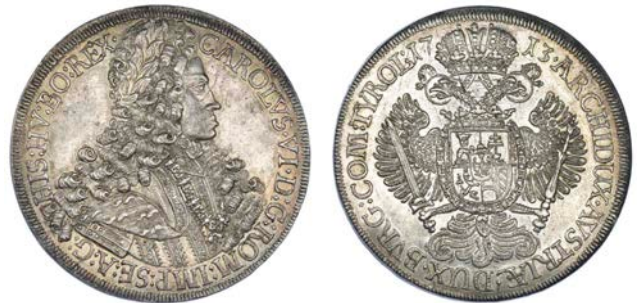
2119 Charles VI , Thaler, 1713, Hall (KM. 1552; Dav. 1050). Extremely fine £250-300