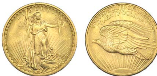
2237 Twenty Dollars, 1908. Extremely fine £1,000-1,100 §