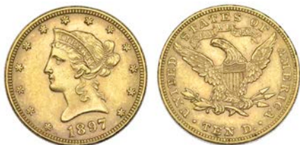
2239 Ten Dollars, 1897; together with a silver Dollar, 1897 [2]. About extremely fine £500-550