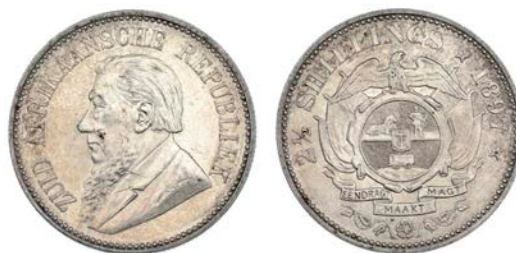
2204 Paul Kruger, Halfcrown, 1897 (Hern Z35; KM. 7). Surfaces hairlined, otherwise extremely fine £60-80