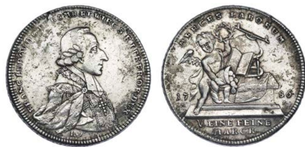
2160 WÜRZBURG, Franz Ludwig, Double-Thaler, 1786MP (KM. 427; Dav. 2906). Sometime cleaned, otherwise better than very fine, rare £300-400