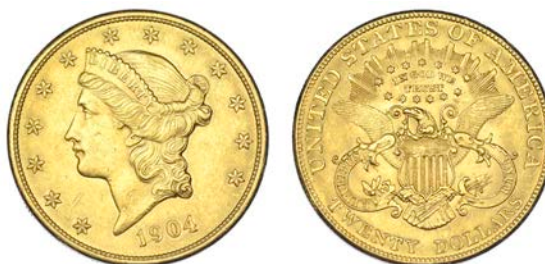
2236 Twenty Dollars, 1904. Extremely fine £1,000-1,100 §