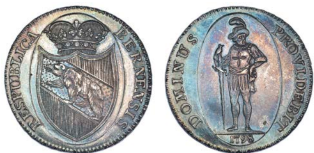
2230 Berne, Thaler, 1798 (D-T 508; KM. 164; Dav. 1760A). Tooled in fields, otherwise extremely fine, dark tone £200-250