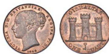
2161 Victoria, Quart, 1842/0 (Prid. 6; KM. 2). Extremely fine with considerable original colour £150-200