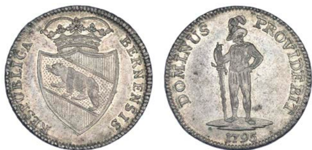
2229 Berne, Thaler, 1795 (D-T 507a; KM. 149; Dav. 1759). About extremely fine £200-250