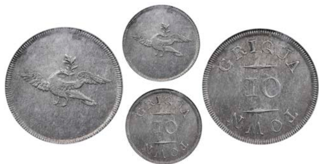
2199 GRIQUATOWN, Ten Pence (Hern GT1; KM. Tn5). Good very fine, lightly toned Slabbed in NGC holder, graded XF 45 £1,500-2,000