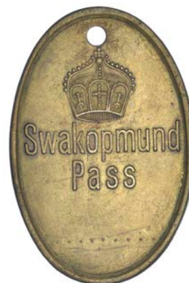
2097 Swakopmund , Brass Native Pass, unstamped, 52 x 35mm (Hern 810y). Very fine £100-150