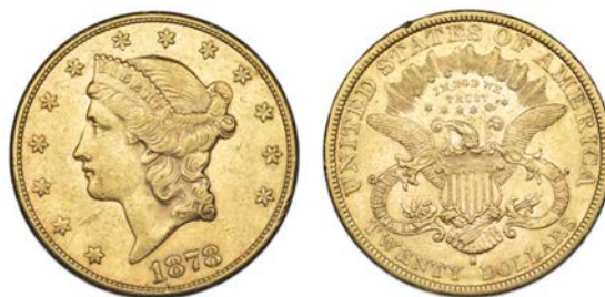
2234 Twenty Dollars, 1878s. Good very fine £900-1,000 §