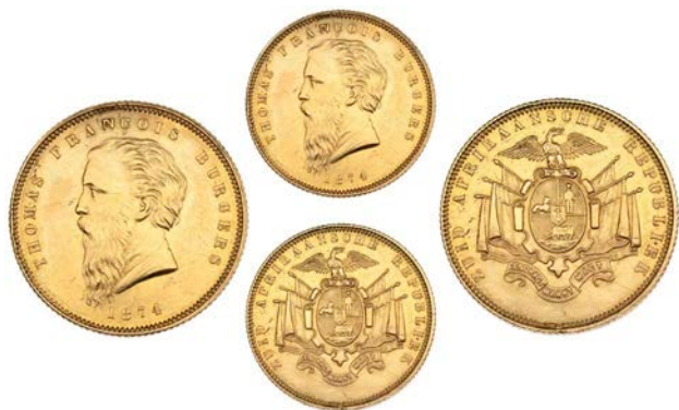
2201 Thomas Burgers, Pond, 1874, fine beard, 7.79g/6h (Hern B1; KM. 1.2; F 1a). Has been pierced and plugged at 12 o'clock, otherwise very fine and very rare £2,500-3,000