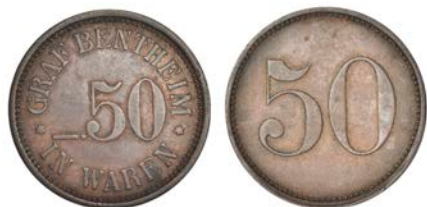
2092 Okombahe , Graf Bentheim, copper 50 Pfennigs, 25mm (Hern 248, denomination unlisted; Theron p.149, denomination unlisted). Very fine and extremely rare £300-500