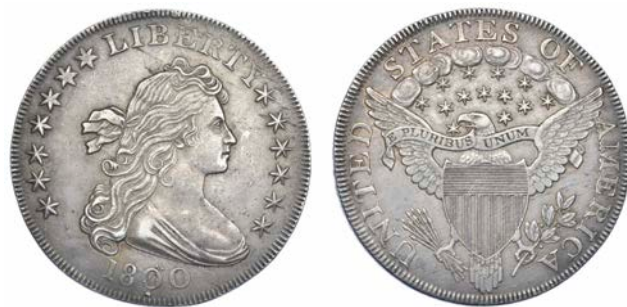
2246 Dollar, 1800, dotted date (Bowers Borckardt 194; Bolender 14). Extremely fine or better £3,000-4,000