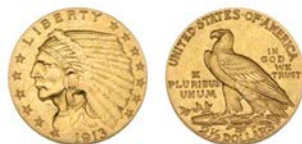
2243 Two-and-a-Half Dollars, 1913. Extremely fine £150-200