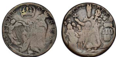
2233 St Patrick's coinage, Halfpenny, edge straight grained, 8.68g/12h (S 6568; DF 339; Durst 189). Better than fine £800-1,000