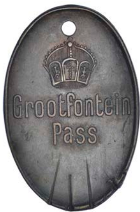
2087 Grootfontein , Brass Native Pass, unstamped, 52 x 35mm (Hern 810g). Cancellation scratches, otherwise fine £90-120