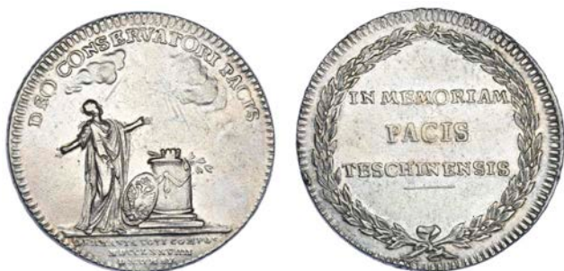
2154 BRANDENBURG-ANSBACH, Alexander, Thaler, 1779, Peace of Teschen (KM. 318; Dav. 2023). Small reverse edge nick, otherwise very fine or better, scarce £250-350