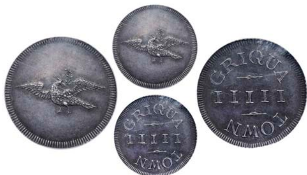
2200 GRIQUATOWN, Five Pence (Hern GT2; KM. Tn4). Extremely fine or better, toned £1,500-2,000