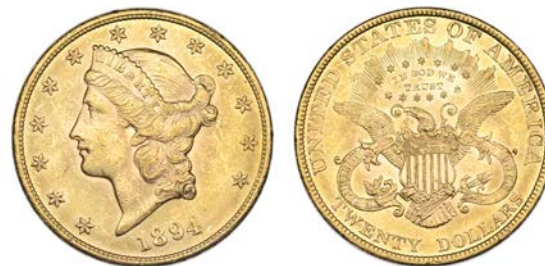
2235 Twenty Dollars, 1894. Extremely fine or better £1,000-1,100 §