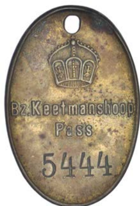
2089 Keetmanshoop , Brass Native Pass, stamped 5444, 52 x 35mm (Hern 810k). Fine £100-150