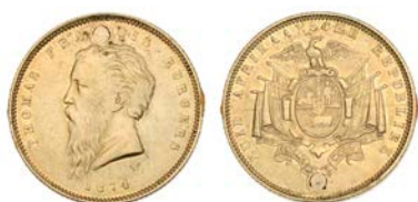
2202 Thomas Burgers, Pond, 1874, fine beard (Hern B1; KM. 1.2; F 1a). Removed from a swivel mount and plugged, good fine or better but sweated £1,000-1,200