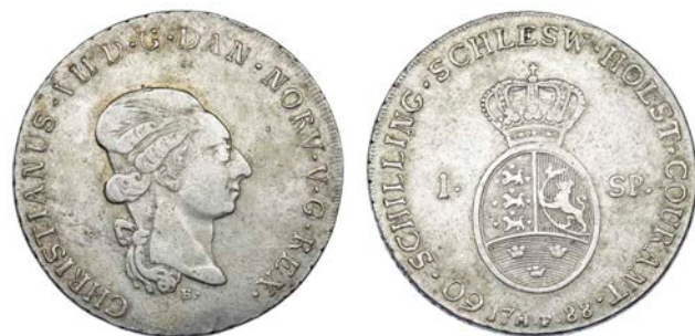
2159 SCHLESWIG-HOLSTEIN, Christian VII, Speciedaler, 1788B-MF (KM. 138.1; Dav. 1311). Nearly very fine £90-120