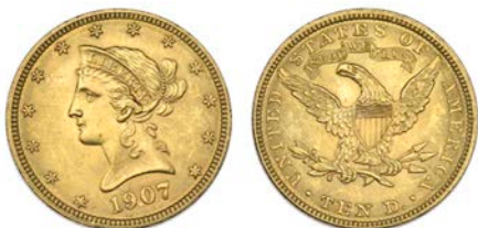
2240 Ten Dollars, 1907. Extremely fine or better £500-550