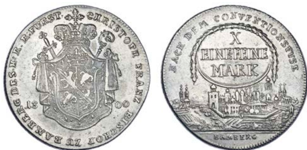
2153 BAMBERG, Christoph Franz, Thaler, 1800 (KM. 151; Dav. 1940). Good very fine £200-250