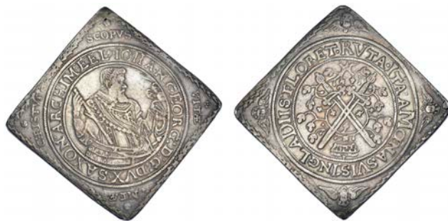
2157 SAXONY, Johann Georg I, Klippe Thaler, 1614, Baptism of the Duke's son August, 28.85g/12h (Dav. 7583). Trace of mount removed at 12 o'clock, otherwise very fine £200-250