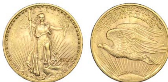
2238 Twenty Dollars, 1923. Extremely fine £1,000-1,100 §