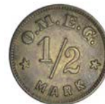
2095 Otavi , Otavi Minen und Eisenbahn Gesellschaft [Mining and Railway Co], uniface brass Half-Mark, 18mm (Hern 410b; Theron 4). Good very fine and very rare £200-300