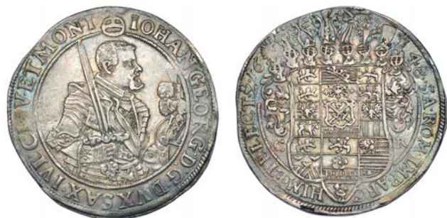
2158 SAXONY, Johann Georg I, Thaler, 1648 (KM. 525; Dav. 7612). Good very fine £100-150