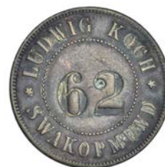
2098 Swakopmund , Ludwig Koch, uniface brass, stamped 62, 29mm (Hern 318a; Theron p.155). Fine, rare £150-200