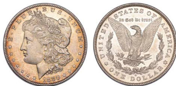
2248 Dollar, 1881cc. Minor bag marks and scuffing in the fields, otherwise almost as struck, proof-like £100-150