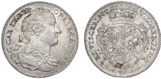
2111 JÜLICH-BERG, Karl Theodor , Gulden, 1758 (KM. —; Dav. 753 [Pfalz]). Nearly extremely fine, scarce £200-250