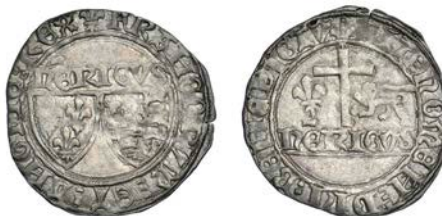
1060 Grand Blanc aux écus, St Lô, mm. lis, 3.24g/8h (E 288). Very fine or better £120-150