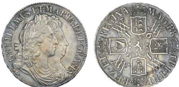
423 Crown, 1691, edge TERTIO (ESC 82; S 3433). Die break on King's hair, otherwise nearly extremely fine £1,500-2,000