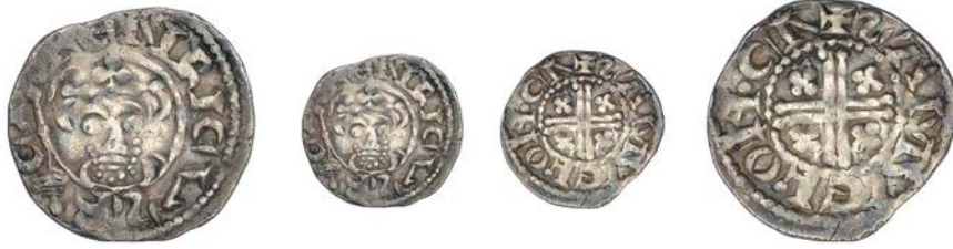
18 Penny, class IVc, Canterbury, Samuel, SAMVEL · ON · EA, e for c, extra drapery, 1.38g/8h (SCBI Mass 1158; N 968/3; S 1349). Nearly very fine, rare £200-250

Provenance: J.P. Mass Collection, Part II, DNW Auction 65, 16 March 2005, lot 631 [from M.P. Senior 1993]