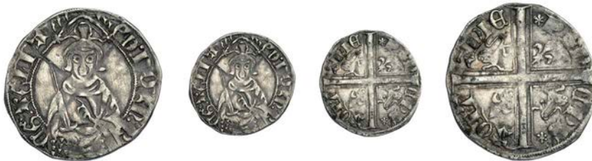
1035 Hardi d'argent, Agen, mint letter on obv. , 1.06g/5h (E 201). About very fine, scarce