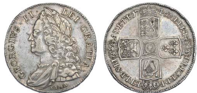
483 Crown, 1746 LIMA, edge DECIMO NONO (ESC 125; S 3689). Numerous edge marks and bruises, otherwise very fine or better £400-600