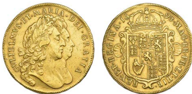
421 Five Guineas, 1693, edge QUINTO (MCE 140; S 3422). Light scratch by Queen's forehead, other minor surface marks and a slight edge flaw at 7 o'clock, otherwise good very fine or better £6,000-8,000