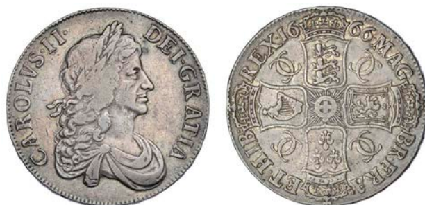
389 Crown, 1666, second bust, edge xviii, no stop after MAG (cf. ESC 32; S 3355). Better than very fine and very rare, the punctuation variety not listed in ESC £800-1,000

Provenance: H.M. Lingford Collection, Part I, Glendining Auction, 24-6 October 1950, lot 298 (part)