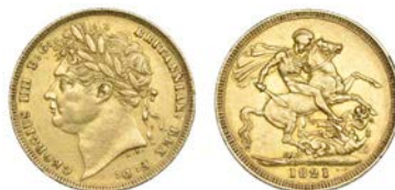
527 Sovereign, 1821 (M 5; S 3800). Surface marks, otherwise very fine or better £500-600