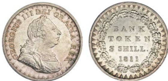
514 Three Shillings, 1811 (ESC 408; S 3769). Of bright appearance, extremely fine or better £150-200