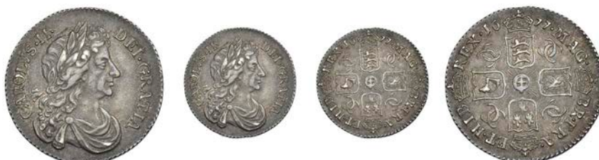
404 Sixpence, 1677 (ESC 1516; S 3382). Nearly extremely fine £300-350 Provenance: DNW Auction 102, 18 September 2012, lot 2522