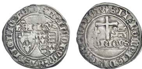
1063 Grand Blanc aux écus, St Lô, mm. lis, 2.80g/4h (E 288). Good fine