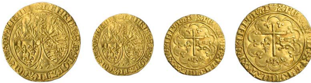
1052 Salut d'or, Paris, mm. crown, AVE inscribed downwards, Roman M on rev., 2.95g/10h (E 264b). Slightly creased and some ghosting on obverse, otherwise about very fine £600-800