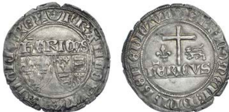
1053 Grand Blanc aux écus, Paris, mm. crown, 3.09g/7h (E 279). On a large flan, better than very fine £150-200