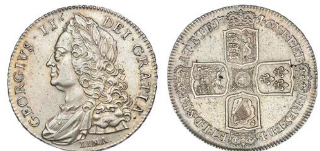
482 Crown, 1746 LIMA, edge DECIMO NONO (ESC 125; S 3689). Extremely fine £1,200-1,500