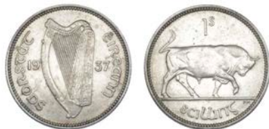
680 Free State, Shilling, 1937 (S 6627). About extremely fine £150-200