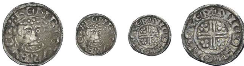
22 Penny, class IVc, York, Nicole, NICOLE · ON · EVER, 1.41g/8h (SCBI Mass 1189; N 968/3; S 1349). Rough surface, otherwise nearly very fine and full, very rare £200-250