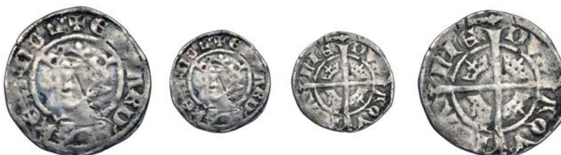
1018 Esterlin, trefoil after ANGL, 1.25g/8h (E 56i). Fine or better