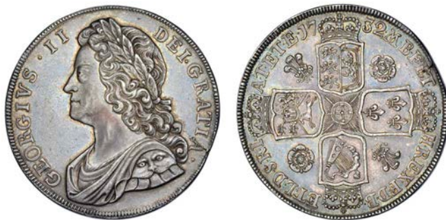
479 Proof Crown, 1732, roses and plumes, edge plain, 30.25g/6h (L & S 6; ESC 118; S 3686). Tiny reverse rim flaw, otherwise good extremely fine, toned, very rare £5,000-6,000