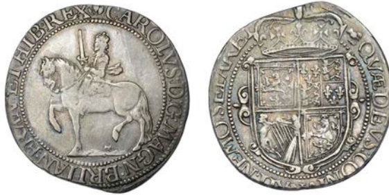
663 Charles I , Third coinage, Falconer's Second issue, Thirty Shillings, mm. leaved thistle, similar, 14.80g/6h (Murray 6; SCBI 35, -; B -; S 5556). Small mark above crown, good fine or better £150-200