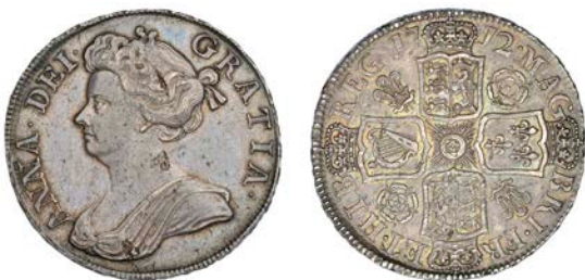
459 Halfcrown, 1712, roses and plumes, edge UNDECIMO (ESC 582; S 3607). Small metal flaws on obverse, otherwise good very fine, attractively toned £350-400