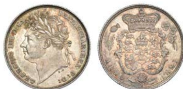
538 Shilling, 1821 (ESC 1247; S 3810). Better than extremely fine