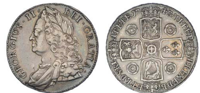
481 Crown, 1743, roses, edge DECIMO SEPTIMO (ESC 124; S 3688). Mount probably removed at 2 o'clock, otherwise about very fine £150-200