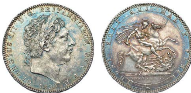
524 Crown, 1820, edge LX (ESC 219; S 3787). Lightly cleaned at some time, otherwise extremely fine, toned £200-250