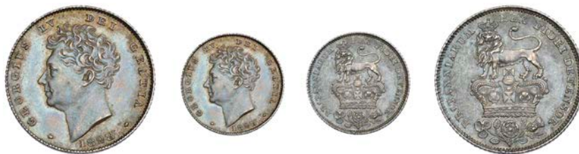
540 Sixpence, 1828 (ESC 1665; S 3815). Extremely fine or better