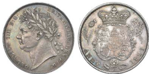
536 Halfcrown, 1821 (ESC 631; S 3807). Extremely fine or better with proof-like fields