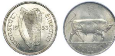
678 Free State, Shilling, 1933 (S 6627). Light bagmark above bull, otherwise brilliant mint state £100-150