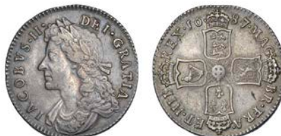
419 Shilling, 1687/6 (ESC 1072; S 3410). Very fine or better, grey tone £400-600