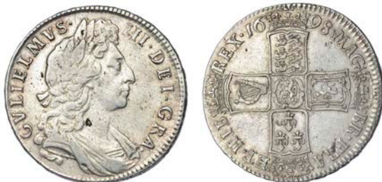
442 Halfcrown, 1698, edge DECIMO (ESC 554; S 3494). Almost very fine