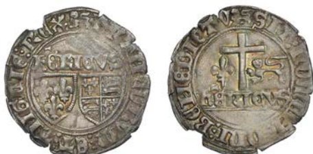
1058 Grand Blanc aux écus, Rouen, mm. leopard, 2.92g/6h (E 287). Small edge chip, otherwise about very fine, toned £90-120