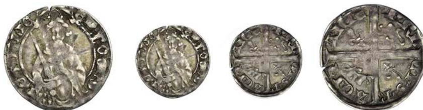
1038 Hardi d'argent, La Rochelle, R in rev. legend, 1.07g/4h (E 206a). Good fine or better