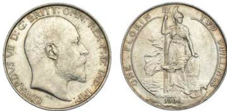
594 Florin, 1906 (ESC 924; S 3981). Good extremely fine