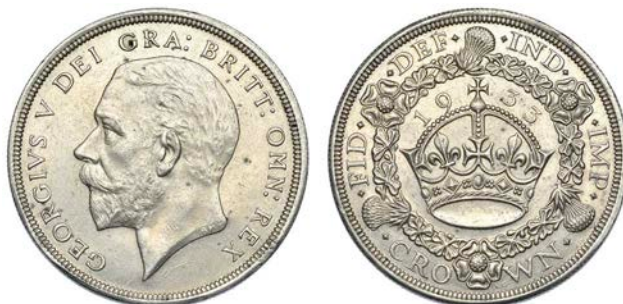
607 Crown, 1933 (ESC 373; S 4036). Some surface marks, otherwise almost extremely fine