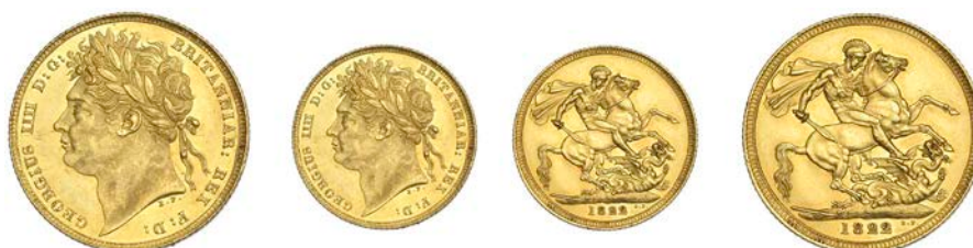
528 Sovereign, 1822 (M 6; S 3800). Tiny rim nick, otherwise practically as struck £1,800-2,200