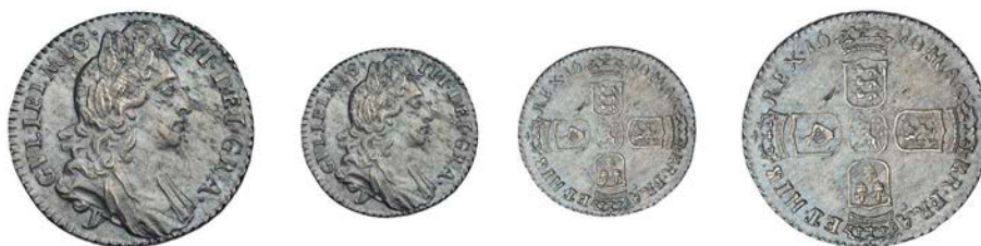
447 Sixpence, 1696y, first bust, large crowns, early harp (ESC 1539; S 3525). Slight haymarking, otherwise extremely fine, dark tone