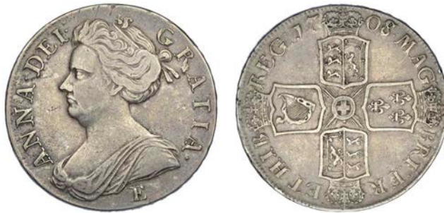
453 Crown, 1708/7 E , second bust, edge SEPTIMO (ESC 107; S 3600). A few edge nicks, otherwise nearly very fine, the overdate clear £200-250