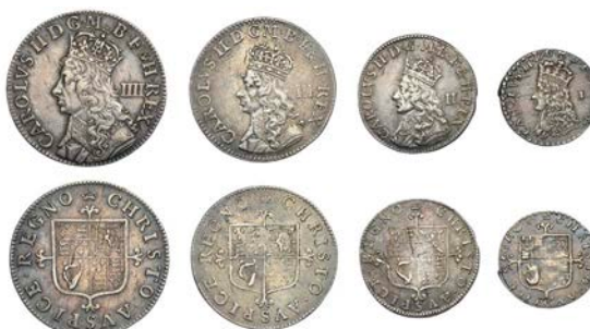
407 Maundy set, undated (ESC 2365; S 3391) [4]. Die flaw on reverse of Twopence, otherwise very fine, toned £150-200 Provenance: Bearne's Auction (Exeter), 23 June 1998, lot 762