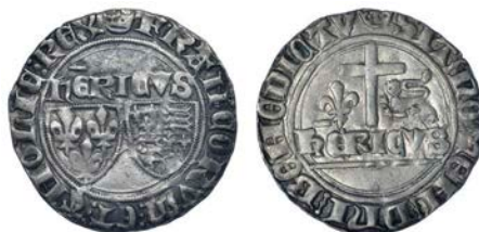
1054 Grand Blanc aux écus, Paris, mm. crown, 3.14g/11h (E 279a, this coin ). Very fine or better £150-200 Provenance: E.R.D. Elias Collection, Spink Auction 77, 21 June 1990, lot 393 [from Spink 1979]