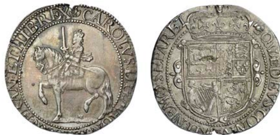
664 Charles I , Third coinage, Falconer's Second issue, Thirty Shillings, mm. leaved thistle, similar, slightly rough groundline, 14.97g/6h (Murray 6; SCBI 35, -; B -; S 5556). Slightly small of flan and tiny striking split at 12 o'clock, otherwise about very fine but scratched behind head £150-200