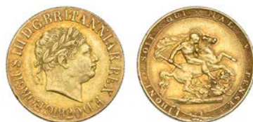
519 Sovereign, 1820, open 2 (M 4; S 3785C). Good very fine £400-500