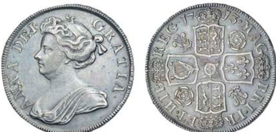
461 Halfcrown, 1713, roses and plumes, edge DVODECIMO (ESC 584; S 3607). Has been cleaned at some time and now toned, otherwise better than very fine £350-400