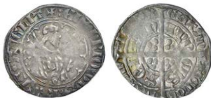
1033 Demi-Gros, second issue, Tarbes, 2.02g/12h (E 184). Flat in places, otherwise good fine or better