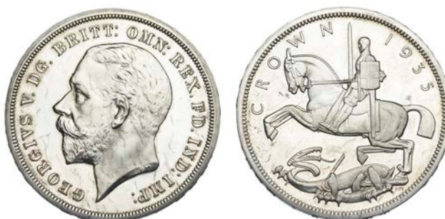
610 Proof Crown, 1935, edge xxv, 28.26g/12h (ESC 378; S 4050). Has been dipped and with hairlines, otherwise about as struck, brilliant