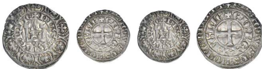
1013 Maille Blanche 'Hibernie', trefoil of pellets below gateway, 1.84g/1h (E 32). About very fine