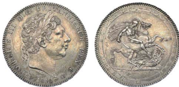
522 Crown, 1818, edge LVIII (ESC 211; S 3787). Some light hairlining, otherwise good extremely fine, toned £200-250