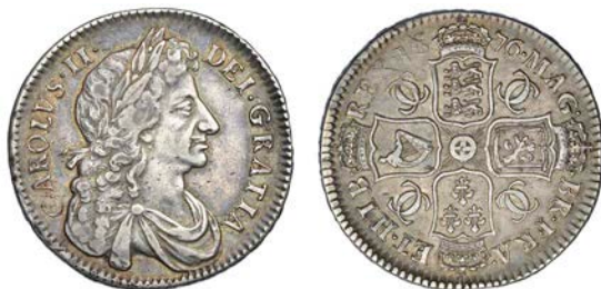
402 Halfcrown, 1676, fourth bust, edge, VICESIMO OCTAVO (ESC 478; S 3367). Very fine £350-400 Provenance: SCMB June 1973 (D 9)