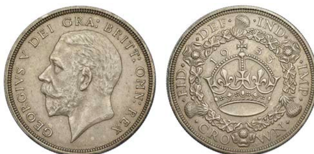
608 Crown, 1933 (ESC 373; S 4036). Some surface marks, otherwise about extremely fine