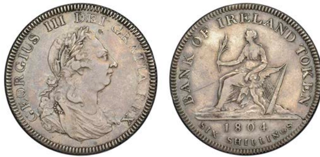
675 George III, Bank of Ireland coinage, Six Shillings, 1804, wide initials, first leaf to upright in E in DEI (S 6615). Small metal flaw by forehead and longer flaw to right of exergue on reverse, otherwise good fine, light grey tone £150-200