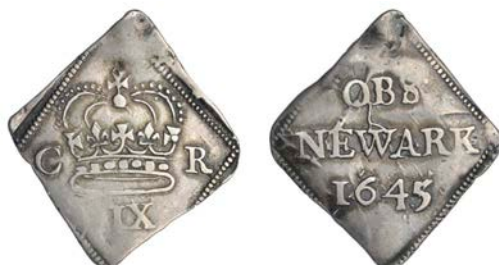
360 Newark, Ninepence, 1645, crown with jewelled band, reads NEWARK, 4.43g/12h (Hird 260-1, same obv. die; SCBI Brooker 1226, same dies; N 2641; S 3144). Slightly creased at top, otherwise very fine £800-1,000