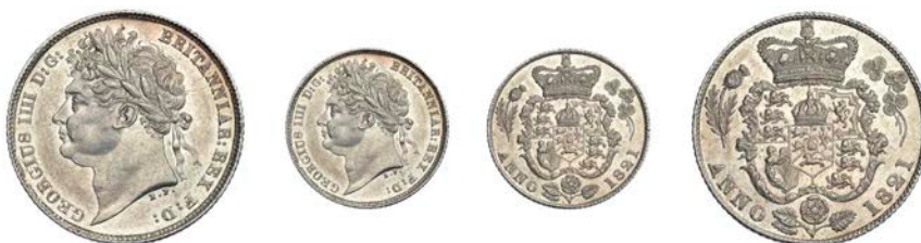
539 Sixpence, 1821 (ESC 1654; S 3813). Extremely fine or better