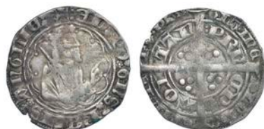
1032 Demi-Gros, second issue, La Rochelle, 2.11g/6h (E 182). Good fine