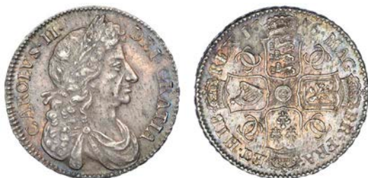
401 Halfcrown, 1676, fourth bust, edge, VICESIMO OCTAVO (ESC 478; S 3367). Surfaces a little haymarked, otherwise good extremely fine, some original brilliance, lightly toned £1,200-1,500