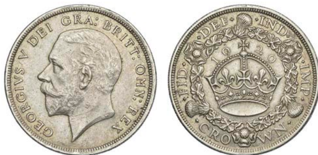
604 Crown, 1929 (ESC 369; S 4036). About extremely fine, toned £150-200