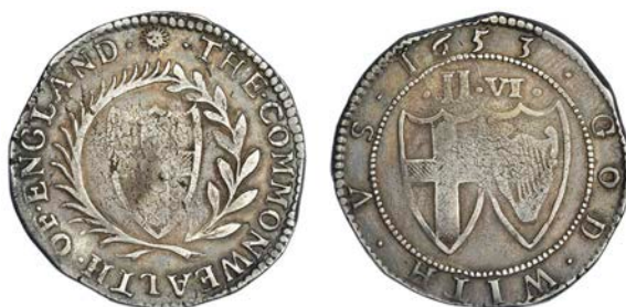
363 Halfcrown, 1653, mm. sun on obv. only, 14.51g/2h (ESC 431; N 2722; S 3215). Weak in centres, otherwise nearly very fine £250-300