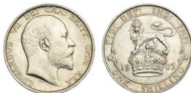
596 Shilling, 1905 (ESC 1414; S 3982). A few tiny rim nicks, otherwise about extremely fine, rare