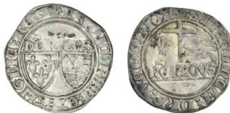
1062 Grand Blanc aux écus, St Lô, mm. lis, 3.18g/11h (E 288). Good fine or better