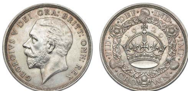
605 Crown, 1929 (ESC 369; S 4036). About extremely fine, toned £150-200