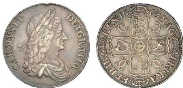
387 Crown, 1663, first bust, edge xv (ESC 22; S 3354). Edge knock at 12 o'clock on obverse, otherwise good fine £150-200