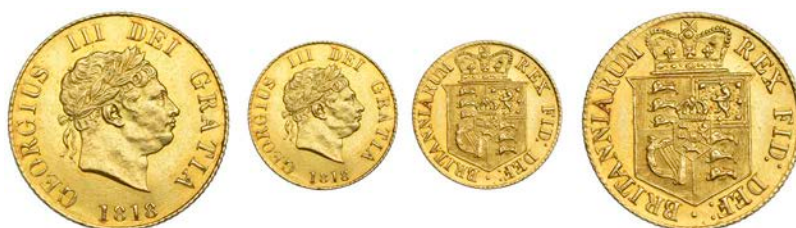
521 Half-Sovereign, 1818 (M 401; S 3786). Edge flaw on reverse, otherwise extremely fine or better £400-450