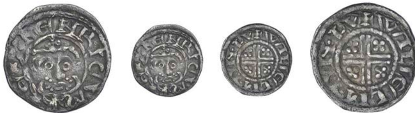
21 Penny, class IVc, London, Willelm, WILLELM · ON · LV, 1.36g/6h (SCBI Mass 1177; N 968/3; S 1349). Nearly very fine, rare £200-250

Provenance: M.R. Allen Collection [from Baldwin 1986]; J.P. Mass Collection, Part II, DNW Auction 65, 16 March 2005, lot 638