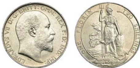
595 Florin, 1909 (ESC 927; S 3981). Minor surface marks, otherwise extremely fine or better