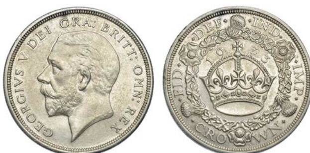
609 Crown, 1933 (ESC 373; S 4036). Some surface marks, otherwise good very fine