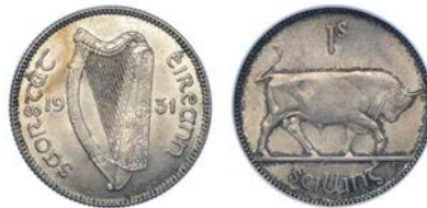
677 Free State, Shilling, 1931 (S 6627). Practically mint state, lightly toned £100-150