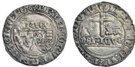
1061 Grand Blanc aux écus, St Lô, mm. lis, 3.11g/4h (E 288). Nearly very fine