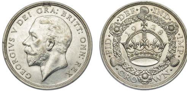
602 Crown, 1928 (ESC 368; S 4036). Some surface marks, otherwise good very fine £150-200