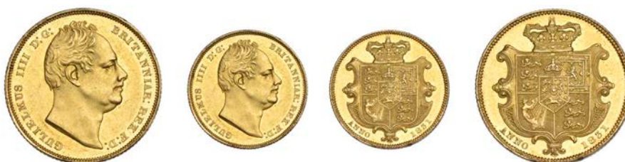
543 Proof Sovereign, 1831, edge grained, 7.96g/5h (WR 262; S 3829). Surface marks and hairlines, otherwise extremely fine or better, extremely rare, very few specimens known