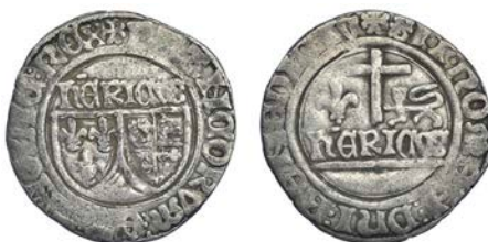
1055 Grand Blanc aux écus, Auxerre, mm. fer de moulin, 2.74g/7h (E 281). Better than fine, rare £100-150