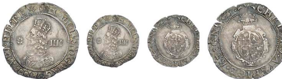
359 Dovey Furnace mint, Groat, mm. crown, plume before bust, rev. plume above scroll-garnished shield, 1.99g/4h (SCBI Brooker 790, same dies; N 2354; S 2911). Three minor striking cracks, otherwise very fine, rare £400-600