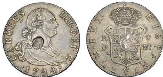
513 SPAIN, Charles III, 4 Réales, 1794 MF , Madrid, obv. countermarked with head of George III in oval (ESC 611; S 3767). Good very fine, toned £300-350