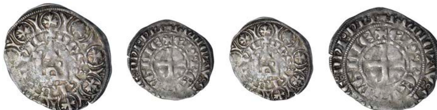
1014 Maille Blanche 'Hibernie', trefoil of pellets below gateway, 1.40g/10h (E 32). Good fine