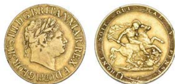
520 Sovereign, 1820, short date, closed 2 (M 4; S 3785C). Good fine £300-400