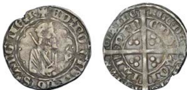
1031 Demi-Gros, second issue, La Rochelle, 2.44g/6h (E 182). Nearly very fine