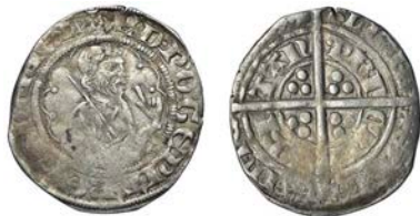
1030 Demi-Gros, second issue, Limoges, 2.16g/12h (E 178b). Legends flat in places, otherwise good fine with a reasonable portrait