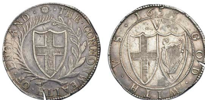
361 Crown, 1653, mm. sun on obv. only, 29.85g/3h (ESC 6; N 2721; S 3214). Edge crack at 6 o'clock, otherwise very fine or better £1,000-1,200