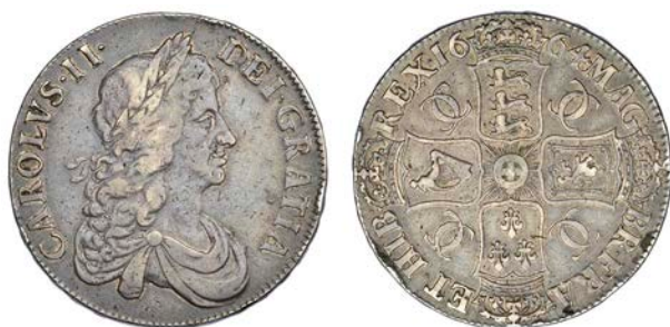
388 Crown, 1664, second bust, edge xvi (ESC 28; S 3354). Edge nicks, otherwise fine, toned £150-200