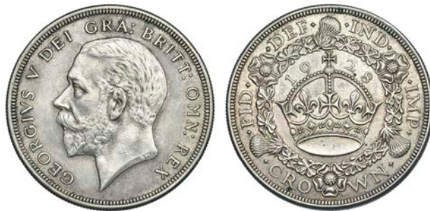
603 Crown, 1928 (ESC 368; S 4036). Some surface marks, otherwise good very fine £150-200