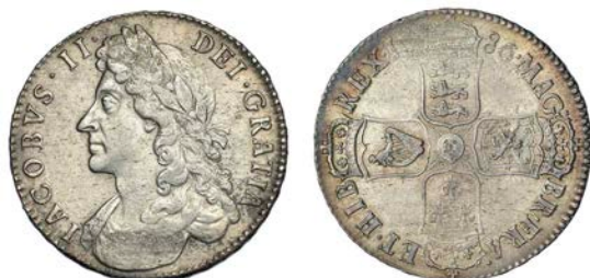
418 Halfcrown, 1686, first bust, edge TERTIO (ESC 496; S 3408). Weak in places, otherwise very fine or better £350-400 Provenance: SCMB July 1981 (F 378)