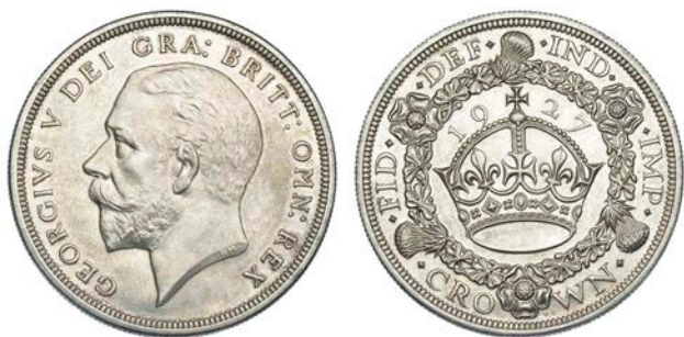
599 Proof Crown, 1927 (ESC 367; S 4036). A few minor surface marks, otherwise practically as struck, brilliant