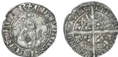
1029 Demi-Gros, second issue, Bordeaux, 2.28g/12h (E 172b). Very fine or better