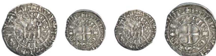
1015 Maille Blanche 'Hibernie', quatrefoil of pellets below gateway, 1.70g/5h (E 32b). Reverse double-struck, otherwise good fine, rare