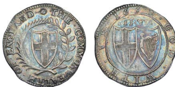
362 Halfcrown, 1652, mm. sun on obv. only, 15.00g/7h (ESC 429; N 2722; S 3215). Very fine with attractive blue tone, rare £500-700