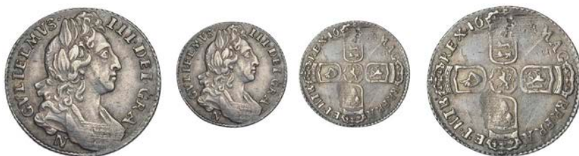
446 Sixpence, 1696N, first bust, large crowns, early harp (ESC 1538; S 3524). Weak on bust (and corresponding on reverse), otherwise better than very fine