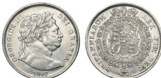
526 Halfcrown, 1817, large head (ESC 616; S 3788). Lightly cleaned at some time, otherwise extremely fine or better £120-150