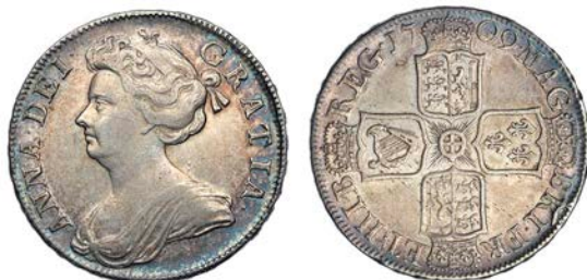
458 Halfcrown, 1709, edge OCTAVO (ESC 579; S 3604). Weak in parts, otherwise good very fine, olive tone £250-300