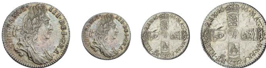
445 Sixpence, 1696, first bust, large crowns, early harp (ESC 1533; S 3520). Clash mark behind head, otherwise virtually mint state, attractively toned