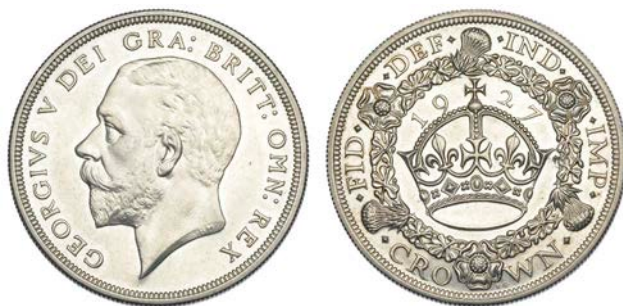
598 Proof Crown, 1927 (ESC 367; S 4036). A few minor surface marks, otherwise practically as struck, brilliant