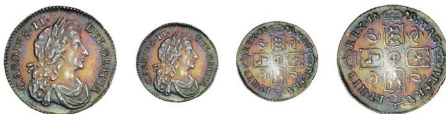
405 Sixpence, 1679 (ESC 1518; S 3382). Small edge flaw, otherwise good very fine, attractively toned £400-500