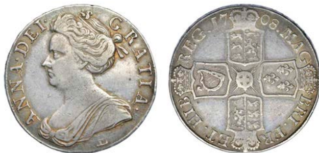
454 Crown, 1708 E , second bust, edge SEPTIMO (ESC 106; S 3600). Has been tooled in the fields, otherwise very fine £200-250