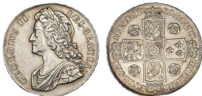
480 Crown, 1739, roses, edge DVODECIMO (ESC 122; S 3687). Small reverse edge flaw, otherwise nearly extremely fine, reverse better £1,200-1,500