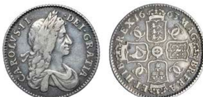
403 Shilling, 1663, first bust variety (ESC 1025; S 3372). About very fine, toned £120-150