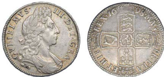
441 Halfcrown, 1698, edge DECIMO (ESC 554; S 3494). Very fine, toned