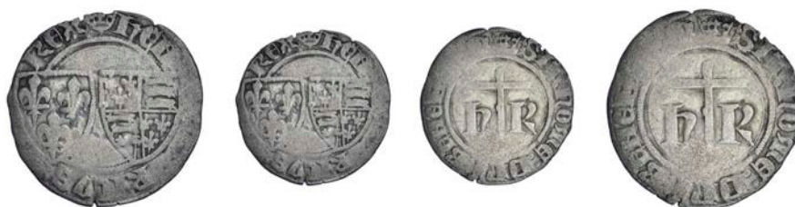
1066 Petit Blanc aux écus, Paris, mm. crown, 1.31g/11h (Elias 292). Fine or better, rare