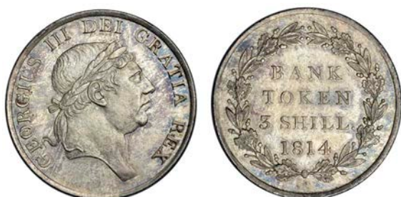
515 Three Shillings, 1814 (ESC 422; S 3770). Good extremely fine, lightly toned £100-150