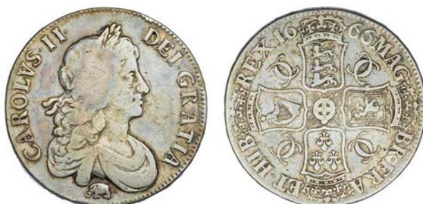
390 Crown, 1666, second bust, elephant below, edge xviii (ESC 33; S 3356). About fine, very rare £300-400

Provenance: H.M. Lingford Collection, Part I, Glendining Auction, 24-6 October 1950, lot 298 (part)