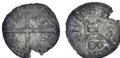
1016 Gros Tournois à la croix longue, three annulets in castle, key between n and i on rev. , 2.02g/5h (E 53f). Chipped, otherwise good fine