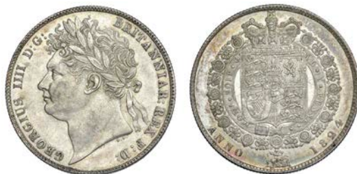
537 Halfcrown, 1824 (ESC 636; S 3808). Extremely fine