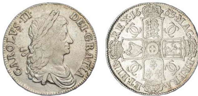
386 Crown, 1663, first bust, edge xv (ESC 22; S 3354). Weakly struck, otherwise about very fine, reverse better £300-400