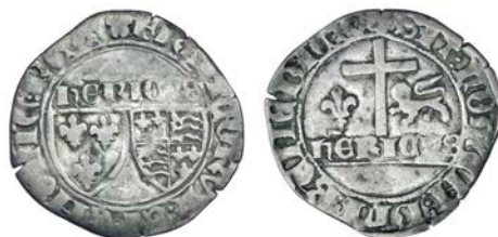
1065 Grand Blanc aux écus, Troyes, mm. rose, 2.86g/6h (E 290). Fine or better, rare