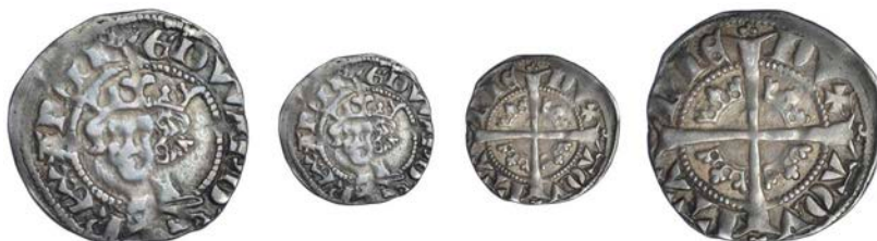
1017 Esterlin, nothing after ANGL, 1.36g/12h (E 56). About very fine, toned

Provenance: E.R.D. Elias Collection, Spink Auction 77, 21 June 1990, lot 94 [from Crédit de la Bourse 1977]; CNG Mailbid Sale 45, 18 March 1998 (2933)