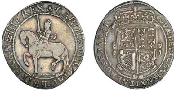
662 Charles I , Third coinage, Falconer's Anonymous issue, Thirty Shillings, mm. leaved thistle on obv. , thistle head on rev. , similar, 14.80g/6h (Murray 4; SCBI 35, 1519; B 51; S 5557). On a slightly oval flan, nearly very fine £150-200