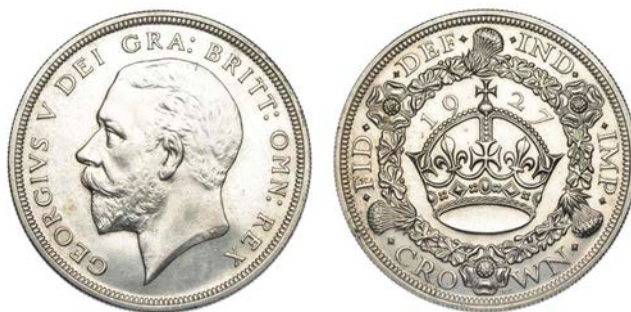
597 Proof Crown, 1927 (ESC 367; S 4036). A few minor surface marks, otherwise practically as struck, brilliant