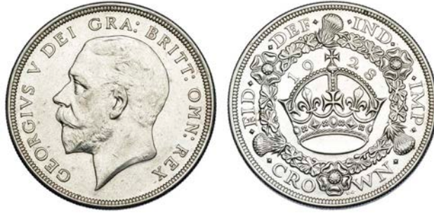
601 Crown, 1928 (ESC 368; S 4036). Has been lightly cleaned and with some surface marks, otherwise almost extremely fine £150-200