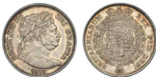
525 Halfcrown, 1816 (ESC 613; S. 3788). Extremely fine, olive tone £200-250