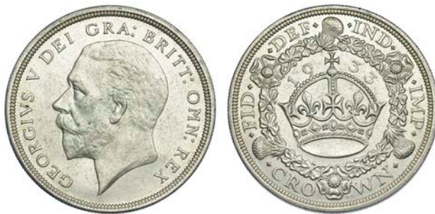
606 Crown, 1933 (ESC 373; S 4036). Some surface marks, otherwise extremely fine