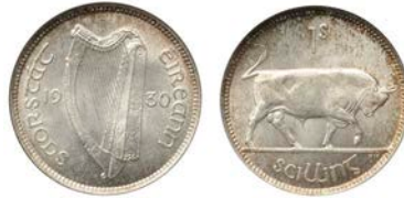
676 Free State, Shilling, 1930 (S 6627). Minor spotting on obverse, otherwise brilliant and virtually as struck, toned £150-200