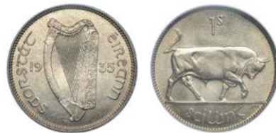
679 Free State, Shilling, 1935 (S 6627). Brilliant mint state £70-90