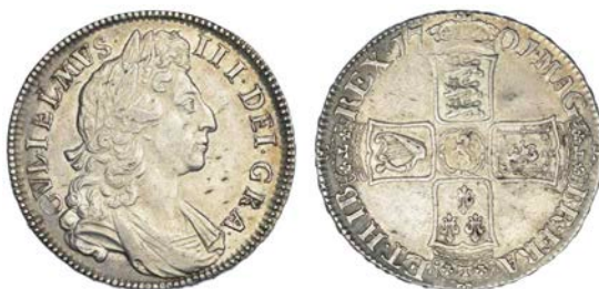
444 Halfcrown, 1701, edge DECIMO TERTIO (ESC 564; S 3494). About very fine, bright