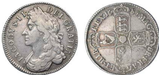
416 Halfcrown, 1685, edge PRIMO (ESC 493; S 3408). Some weakness and haymarking in third quarter of reverse, otherwise about very fine, toned £300-350