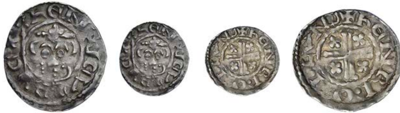
19 Penny, class IVc, London, Henri, HENRI · ON · LVND, 1.43g/3h (SCBI Mass 1164; N 968/3; S 1349). Very fine with attractive dark tone, rare £200-250

Provenance: J.P. Mass Collection, Part II, DNW Auction 65, 16 March 2005, lot 631 [from M.P. Senior 1993]