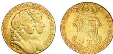
422 Guinea, 1692 (MCE 154; S 3426). Scratched in reverse field, otherwise about fine £400-500