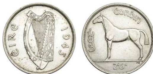
681 Eire, Halfcrown, 1943 (S 6633). Brightly cleaned and with associated surface marks, otherwise very fine, rare £250-300