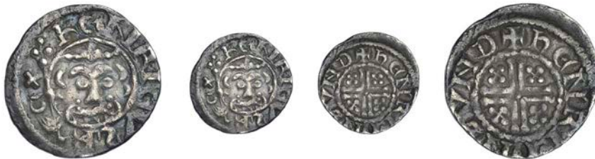
20 Penny, class IVc/Va 1 mule, London, Henri, HENRI · ON · LVND, 1.30g/3h (SCBI Mass 1167; N 968; S 1349/1350A). Slightly off-centre, otherwise very fine, very rare £200-250

Provenance: P. Woodhead Collection, Spink Auction 75, 29 March 1990, lot 91; W.J. Conte Collection; J.P. Mass Collection, Part I, DNW Auction 61, 17 March 2004, lot 245