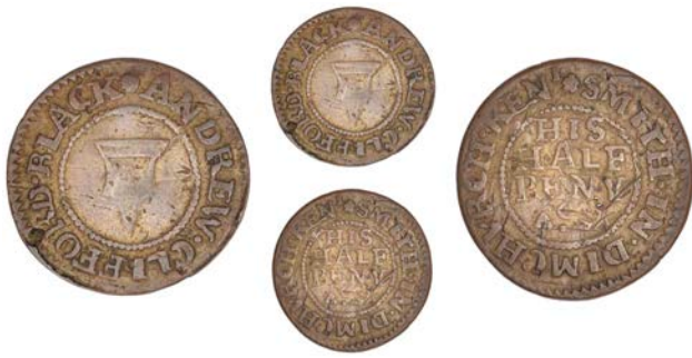
220 Dymchurch , Andrew Clifford, Halfpenny, 1.56g/3h (N 2547; BW. 197). Partly weak, otherwise fine; the only issue for the town £70-90