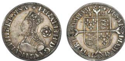
431 Sixpence, 1562, mm. star, bust B, 3.11g/6h (Borden and Brown 23, O7/R8; N 2025/2; S 2594). Some surface marks on obverse and lightly tooled in reverse field, otherwise very fine £200-250