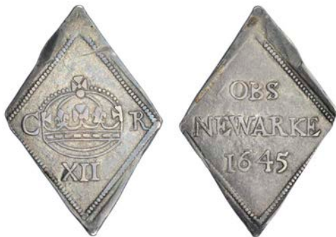
537 Shilling, 1645, crude flat crown, rev. OBS NEWARKE, 5.94g/12h (Hird 247-8, same dies; SCBI Brooker 1223, same dies; N 2639; S 3141). Faint crease at top of obverse, otherwise very fine, very rare £2,000-2,500