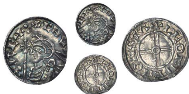
213 Penny, Short Cross type, Stamford, Leofthegn, LEOFDÆN ON STA, 0.94g/3h (BEH 3292; N 790; S 1159). Good very fine £200-250