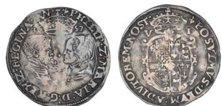
381 Sixpence, 1557, mm. lis, English titles, reads AN and NOST, 3.01g/7h (N 1971; S 2506). Slightly creased, otherwise nearly very fine £400-600