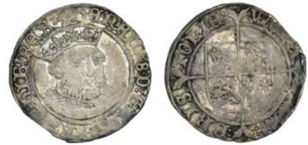
356 Groat, Bristol, mm. WS on rev. only, bust 2, Lombardic letters both sides, annulets in forks, pellet stops, colons in rev. legend, pellet below shield in third quarter, 2.54g/3h (Whitton 2; N 1846; S 2372). Very fine for issue, scarce thus £200-250