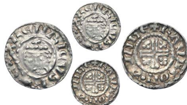
18 Penny, class Ic, London, Raul, RAVL · ON · LVNDE, 1.48g/9h (SCBI Mass 608; N 964; S 1345). Bust weakly struck, otherwise very fine, a little bright £90-120

Provenance: DNW Auction 56, 11 December 2002, lot 115 (part); DNW Auction 64, 14 December 2004, lot 45