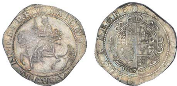
521 Halfcrown, undated, mm. rose, sash tied in bow, rev. oval scroll garnished shield, pellets around, 14.45g/6h (Besly J14; SCBI Brooker 1027, same obv. die; N 2550/1; S 3065). Legend weak, otherwise good very fine £500-700