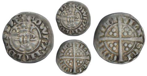
240 Penny, class 8b, Bury St Edmunds, reads VILA SCI EDM VNDI, 1.35g/9h (SCBI North 333; N 1034; S 1406). Nearly very fine, very rare £100-150

This does not appear to be from the normal 8b obverse die used at Bury which has a distinctive flaw over the crown. More remarkable is the spelling and spacing of the reverse legend, which is not represented in the North Sylloge