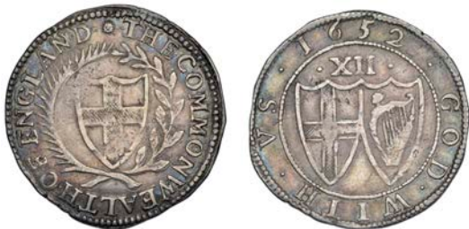
546 Shilling, 1652, mm. sun on obv. only, no stop after THE, 5.94g/10h (ESC 986; N 2724; S 3217). Nearly very fine, round £250-300