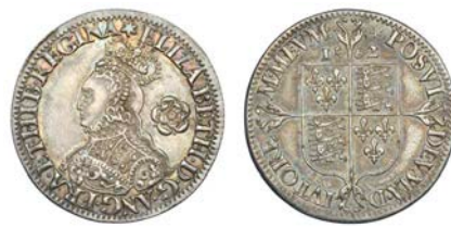
432 Sixpence, 1562, mm. star, bust C, no stops by date, 3.08g/6h (Borden and Brown 24, O2/R1; N 2026; S 2595). Nearly extremely fine, attractively toned £400-500