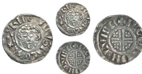
48 Penny, class VIb 1, London, Ilger, ILGER · ON · LVNDE, reads HNERICVS, 1.47g/6h (SCBI Mass 1777-8; N 975/1; S 1354). Lightly cleaned, otherwise very fine £80-100