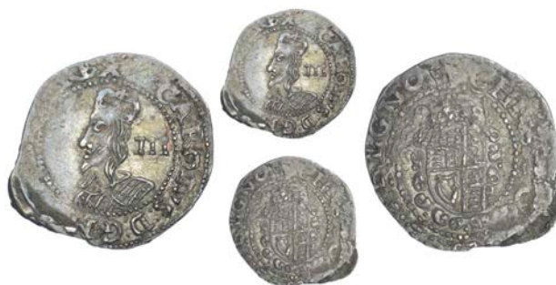
526 Threepence, mm. lis, rev. oval scroll garnished shield, lis after AVSPICE, 1.41g/11h (SCBI Brooker 1178, same dies; Allen A-2; N 2624; S 3117). Legends partly flat and reverse double-struck, otherwise good very fine with well struck portrait, rare £400-600