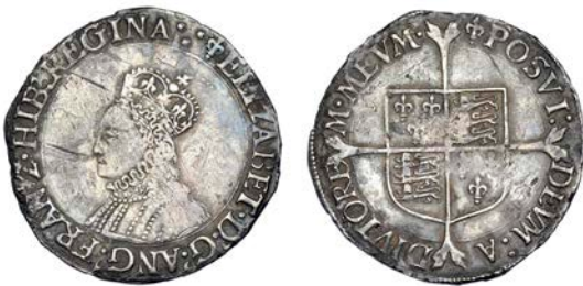
384 Shilling, mm. lis, bust 1A, wire-line inner circles, trefoil of pellets after REGINA, 5.14g/4h (N 1985; S 2548). Some scratches, otherwise nearly very fine, very rare £600-800