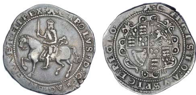
520 Crown, 1645, mm. castle, 29.25g/11h (Besly D20; SCBI Brooker 1041; N 2561; S 3062). Nearly very fine £600-800