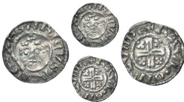
220 Penny, class Ic, London, Raul, RAVL · ON · LVNDE, 1.36g/9h (SCBI Mass 606-7; N 964; S 1345). Very fine £100-150