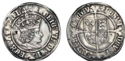
332 Groat, regular type, mm. cross-crosslet, 2.93g/6h (N 1747; S 2258). Metal flaw behind head, otherwise very fine with a strong portrait £150-200