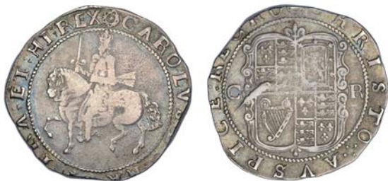
518 Halfcrown, undated, mm. rose, rev. oblong garnished shield dividing CR, 14.78g/8h (Besly H7; SCBI Brooker 1018, same dies; N 2538; S 3048). Obverse fine, reverse with die flaw on shield, very fine, rare £800-1,000