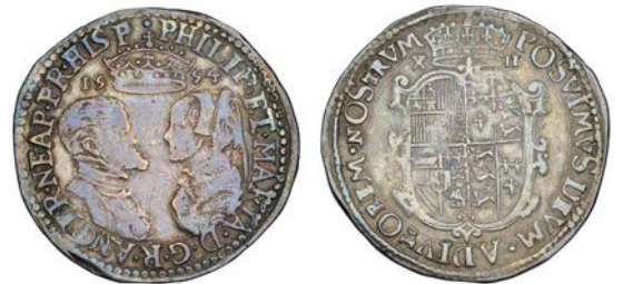
379 Shilling, 1554, full titles, reads HISP, mark of value divided by crown above shield, legend of large and small letters, 6.08g/11h (N 1967; S 2500). Good fine or better, toned £500-700