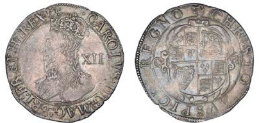
457 Shilling, Gp D, mm. harp, bust 2, semi-colon and pellet stops, rev. shield 1, no stops, 5.92g/12h (Sharp D2/1; SCBI Brooker 474-5; N 2223; S 2789). Very fine with attractive light blue-grey tone £150-200