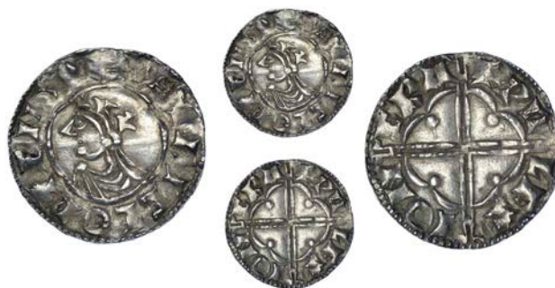
210 Penny, Quatrefoil type, Cambridge, Wulfsige, PVLFSI ON GRA, 0.95g/9h (Jacob, SCMB 1984, p.36; BEH 1066; N 781; S 1157). Better than very fine £200-250