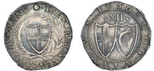
550 Shilling, 1656, mm. sun on obv. only, 5.86g/10h (ESC 995; N 2724; S 3217). Light scratch on obverse, otherwise very fine or better £300-400