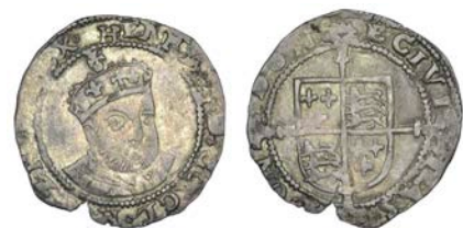
360 Groat, Southwark, mm. E on rev. only, bust 6, Roman lettering, roses in forks, annulet stops, 2.36g/10h (cf. Whitton f; N 1872; S 2404). Small striking split, otherwise about very fine, scarce thus £150-200