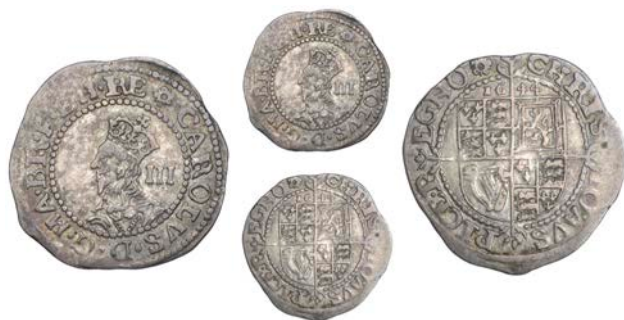
524 Threepence, 1644, mm. rose, square-topped shield over cross fleury, date above, 1.16g/10h (Besly 1A; SCBI Brooker 1072, same dies; N 2580; S 3089). Nearly very fine, patchy toning £250-300