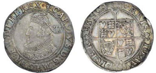
455 Shilling, Gp A, mm. lis, bust 2, colon and pellet stops, rev. shield 1, pellet stops, 5.97g/9h (Sharp A2/1; SCBI Brooker, 385-9; N 2216; S 2776A). Nearly very fine £150-200