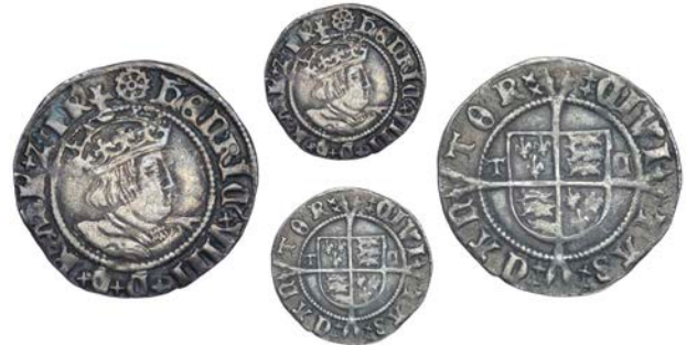
345 Halfgroat, Canterbury, Abp Cranmer, mm. Catherine wheel on obv. only, rc by shield, 1.26g/11h (Whitton vi; N 1804; S 2345). Nearly very fine £90-120