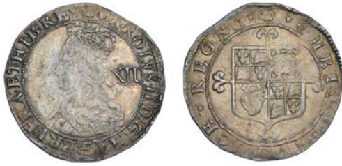
568 Shilling, mm. crown, large mark of value, 5.82g/12h (ESC 1019; N 2764; S 3322). Portrait weakly struck, otherwise about very fine, toned £250-350