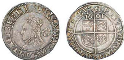
426 Sixpence, 1601, mm. 1, bust 6C, 3.00g/11h (N 2015; S 2585). Nearly very fine, toned £120-150