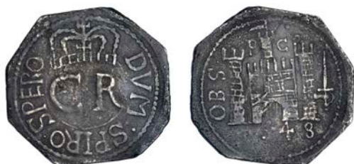
539 Shilling, 1648, type I, thick lettering, large CR, 4.84g/11h (Hird 272-4, same dies; SCBI Brooker 1231, same dies; N 2646; S 3148). Surfaces granular and partly fire-damaged (?), otherwise nearly very fine, very rare £2,000-2,500

Provenance: St James's Auction 2, 11 May 2005, lot 138, where a footnote suggests the coin may derive from the Duke of Devonshire Collection.