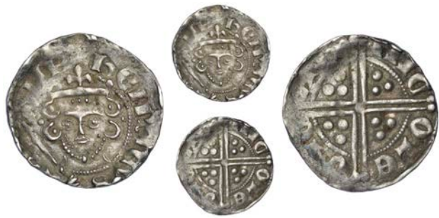
78 Penny, class IVab, Canterbury, Nicole, NICOLE ON CANT, 1.49g/3h (N 989/1; S 1365). Weak in parts, otherwise very fine, rare £120-150

Provenance: Patrick Finn FPL 17, September 1999 (133); Baldwin Auction 38, 4 October 2004, lot 177