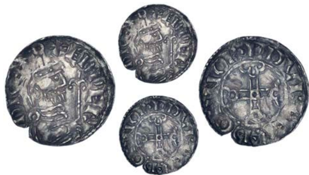
216 Penny, Pointed Helmet type, Norwich, Thurfurth, DVR·FVRD ON NOR, 1.31g/9h (Freeman 146; N 825; S 1179). Tiny edge chip, otherwise very fine £200-250