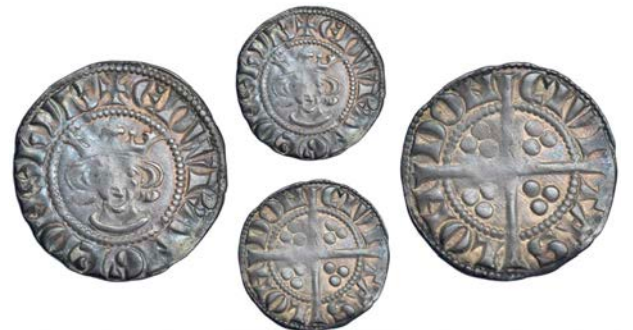
229 Penny, class 3a, London, 1.32g/4h (SCBI North 76; N 1016; S 1387). Very fine or better, toned, scarce £70-90