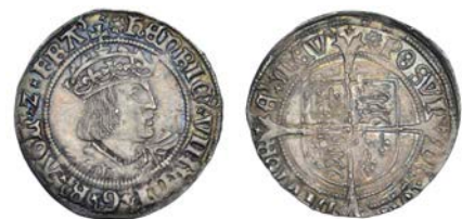
336 Groat, Tower, mm. rose, reads FRA , saltires in forks, 2.66g/3h (Whitton i, 3; N 1797; S 2337E). Reverse slightly double-struck, otherwise good very fine with well-struck portrait and attractive tone £250-300