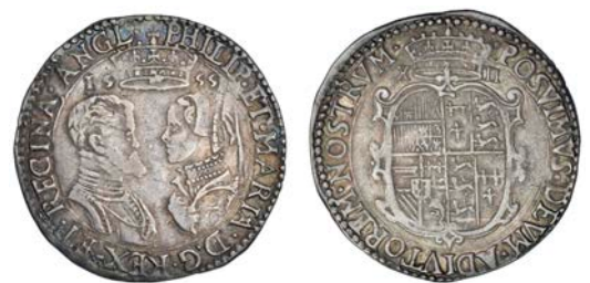
380 Shilling, 1555, English titles, reads ANGL, mark of value divided by crown above shield, 5.64g/7h (N 1968; S 2501). Scratched in the legends, otherwise about very fine with pleasant tone £700-900