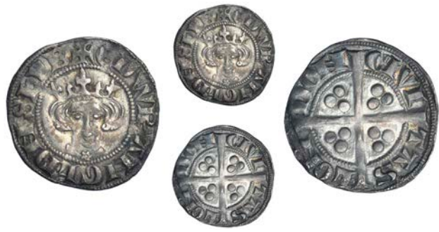
238 Penny, class 7b, London, rose on breast, double-barred ns, 1.39g/2h (SCBI North 315ff; N 1033; S 1404). Better than very fine £100-150