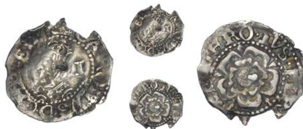
525 Penny, 1644, mm. rose, 0.35g/3h (Besly A-1; SCBI Brooker 1075, same dies; N 2583; S 3092). Chipped and creased, otherwise good fine, very rare £200-250