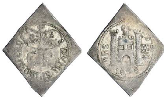
540 Shilling, 1648, type II, large crown, rev. value dividing PC, 5.16g/12h (Hird 276-8; SCBI Brooker 1233, same dies; N 2647; S 3149). Slightly weakly struck, otherwise nearly very fine £3,500-4,000

Provenance: St James's Auction 2, 11 May 2005, lot 138, where a footnote suggests the coin may derive from the Duke of Devonshire Collection.