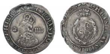
534 Groat, mm. crown, plume before bust, rev. plume above scroll-garnished shield, 1.91g/4h (SCBI Brooker 790, same dies; N 2354; S 2911). Weak in places, otherwise nearly very fine and toned, rare £400-600