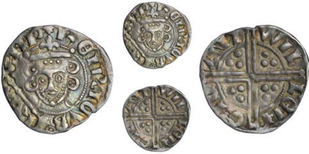
77 Penny, class IVa, Canterbury, Willem, WILLEM ON CANT, 1.41g/8h (N 989; S 1365). Very fine, rare £200-250

Provenance: Patrick Finn FPL 17, September 1999 (134); Baldwin Auction 38, 4 October 2004, lot 178