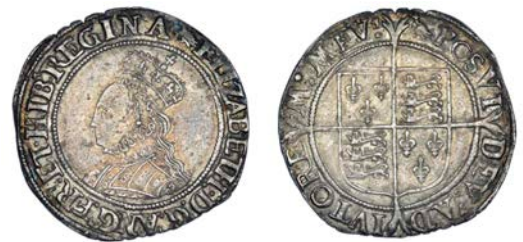
389 Shilling, mm. martlet, bust 3C, 5.64g/12h (N 1985; S 2555). A few light surface marks, otherwise good very fine, lightly toned £400-600