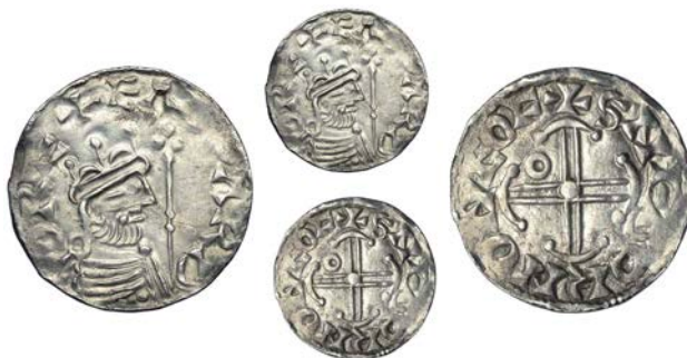
218 Penny, Hammer Cross type, York, Snæborn, SNÆBORN ON EOF, annulet in one quarter, 1.37g/6h (Freeman 338; N 828; S 1182). Flat in places, otherwise very fine or better £200-250