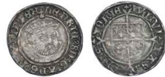
357 Halfgroat, Bristol, mm. WS on rev. only, local bust, Lombardic letters both sides, trefoils in forks, pellet stops, quatrefoil after CIVITAS and trefoil (?) before BRISTOLIE, pellet below shield in third quarter (?) and on inner circle, 1.39g/10h (Whitton 2; N 1851; S 2377). Struck on a full round flan, nearly very fine with a good portrait £200-250