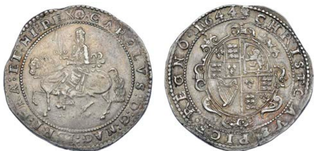
519 Crown, 1644, mm. rose, 27.36g/12h (Besly C9; SCBI Brooker 1033, same dies; N 2557; S 3058). Obverse slightly double-struck, good very fine, scarce thus £1,000-1,200