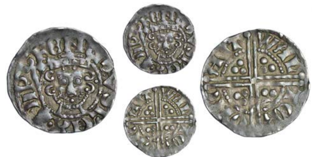
85 Penny, class Ve, Canterbury, Walter, WALTER ON CANT, 1.48g/7h (N 995; S 1371). Very fine and very rare £250-300

Provenance: Patrick Finn FPL 17, September 1999 (140); Baldwin Auction 38, 4 October 2004, lot 182