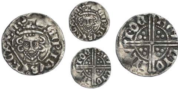
76 Penny, class IVa, London, Henri, HENRI ON LVNDE, 1.40g/4h (N 989; S 1365). About very fine, rare £150-200