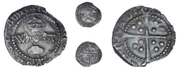
348 Second coinage, Halfpenny, Canterbury, Abp Warham, mm. unclear, wa by bust, 0.41g/5h (Withers 1; N 1816; S 2357). Nearly very fine £100-150