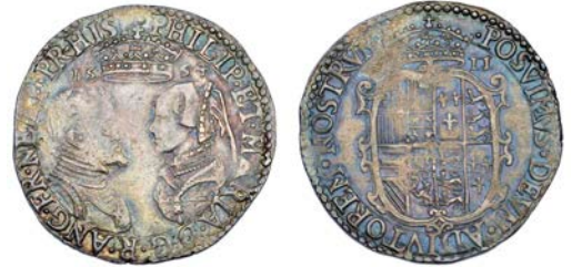
378 Shilling, 1554, full titles, reads HISP, mark of value divided by crown above shield, 6.22g/4h (N 1967; S 2500). A few minor scratches, otherwise nearly very fine with attractive blue-grey tone £600-800