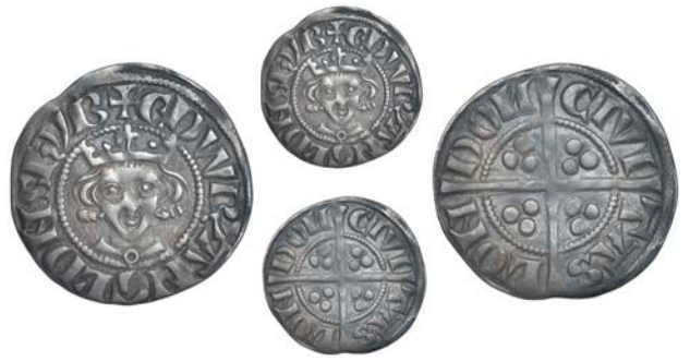
226 Penny, class 1d, London, annulet on breast, issue for the Abbot of Reading, 1.38g/7h (SCBI North 45; N 1013; S 1384). Very fine, dark tone, rare £200-250