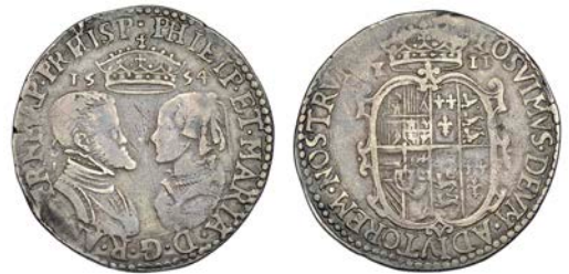
377 Shilling, 1554, full titles and mark of value, reads HISP, 6.11g/4h (N 1967; S 2500). Scratches on obverse, otherwise good fine or better £400-600