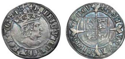
331 Groat, Tentative type, mm. cross-crosslet, 2.87g/11h (N 1743; S 2254). A few light surface scratches, otherwise about very fine, toned £300-400