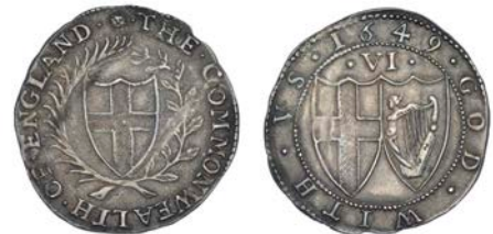
552 Sixpence, 1649, mm. sun on obv. only, 2.98g/4h (ESC 1483; N 2726; S 3219). Slightly creased, otherwise good very fine, toned £400-500