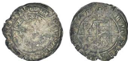
355 Groat, Southwark, no mm., bust 2, Lombardic lettering, e and s in forks, trefoil stops, 2.30g/9h (Whitton 2; N 1845; S 2371). Edge slightly ragged, otherwise nearly very fine for issue £150-200