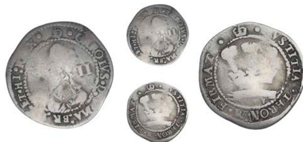
536 Halfgroat, mm. crown, 0.98g/12h (SCBI Brooker 793, same dies; N 2356; S 2913). Centres smoothed and dent before bust, fair to fine only but very rare £200-300