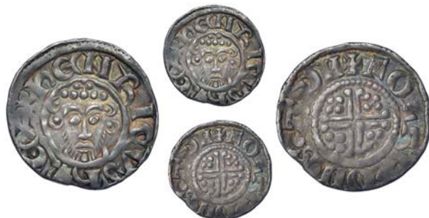
46 Penny, class Vc, Bury St Edmunds, Fulke, FULKE · ON · S · ADM, 1.45g/10h (Eaglen 95; cf. SCBI Mass 1705; N 971; S 1352). Minor weakness in legends, otherwise very fine and toned, rare £200-250

Provenance: H.P. Whittle Collection, Noble Numismatics Auction 65 (Sydney), 15-16 November 2000, lot 751 (part); bt M.P. Senior May 2006