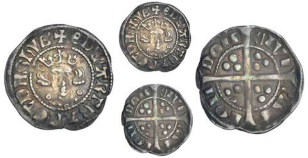
243 Penny, class 10ab/9b mule, London, annulets at neck and on breast, 1.41g/12h (SCBI North 530; N 1038/2 note; S 1409A). About very fine and toned, the variety very rare £200-300