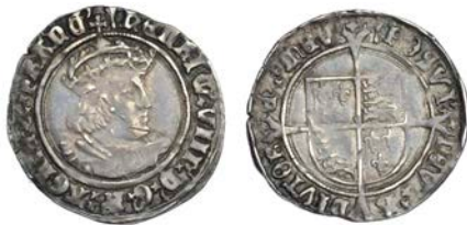
340 Groat, Tower, mm. mm. arrow, saltires in forks, reads AGLIE, 2.76g/5h (Whitton viii; N 1797; S 2337E). Mark on chin, otherwise very fine £150-200