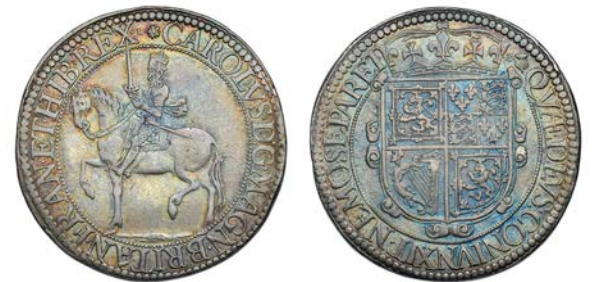
576 Thirty Shillings, mm. flower on obv. , thistle on rev. , signed B both sides, 14.67g/6h (Murray pl.iii, 14; SCBI 35, 1427-9; B 6, fig. 1006; S 5553). Very fine, toned £200-250