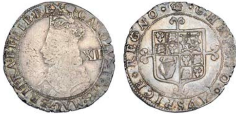
569 Shilling, mm. crown, large mark of value, 6.33g/5h (ESC 1019; N 2764; S 3322). Portrait weak, otherwise good fine, reverse better £200-300