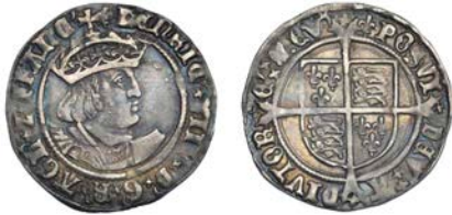
339 Groat, Tower, mm. lis (phase 3), reads FRANC, saltires in forks, 2.68g/9h (Whitton v, a; N 1797; S 2337E). Obverse nearly very fine, reverse better £150-200