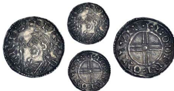
211 Penny, Short Cross type, London, Godere, GODERE ON LVN, 1.12g/2h (BEH 2400; N 790; S 1159). Very fine or better £200-250