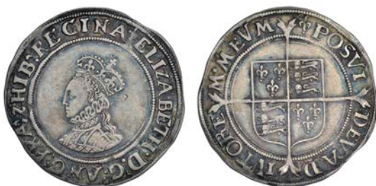
385 Shilling, mm. lis, bust 2B, beaded and wire-line inner circles, 5.94g/6h (N 1985; S 2549). Small mark behind Queen's head, otherwise about very fine £500-700