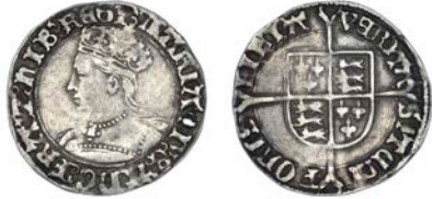
373 Groat, mm. pomegranate, 2.15g/2h (N 1960; S 2492). Nearly very fine £150-200