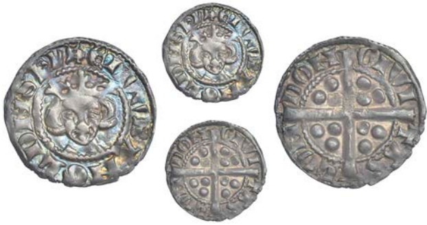
235 Penny, class 6a 1, London, B of HYB over initial cross, 1.39g/1h (SCBI North 285, same obv. die; N 1030; S 1401). Good very fine and toned, very rare £200-300