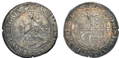
530 Shilling, Gp 2 [type 5], mm. lion, 5.39g/12h (Besly 2Ee; SCBI Brooker 1097, same obv. die; N 2320; S 2874). Flan flaw at crown, otherwise good fine £150-200