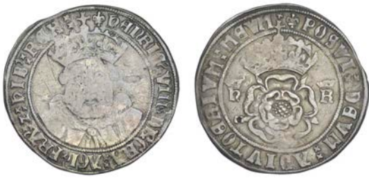
350 Testoon, Tower, mm. lis, saltire stops, 7.30g/10h (Jacob dies O1/R2; N 1841; S 2364). Struck on a full round flan, some surface marks on obverse, small dig on reverse, otherwise good fine for issue, reverse better, very rare thus £2,000-2,500