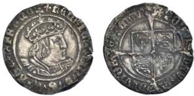
338 Groat, Tower, mm. lis, reads AGL, saltires in forks, 2.49g/7h (Whitton v; N 1797; S 2337E). Small edge crack and surfaces rather porous, otherwise nearly very fine with a good portrait £90-120