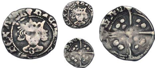
329 Penny, Durham, Bp Sherwood, mm. lis on obv. only, S on breast, rev. D in centre, 0.72g/4h (N 1687; S 2169). Small of flan as usual, RICA legible, better than fine, toned, rare £250-350