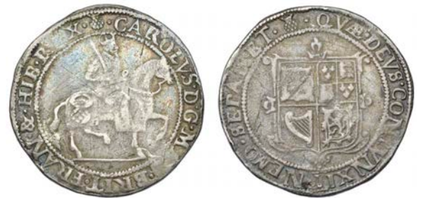
575 Thirty Shillings, mm. thistle-head, 14.40g/10h (Murray pl. iii, 13; SCBI 35, 1411-12; B 2, fig. 997; S 5541). Some surface scratches, otherwise better than fine £150-200