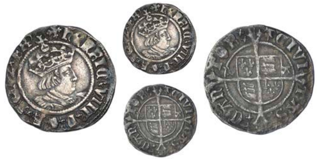
344 Halfgroat, Canterbury, Abp Warham, mm. cross patonce on obv., T on rev., wa by shield, 1.23g/5h (Whitton iv; N 1802; S 2343). Nearly very fine £90-120