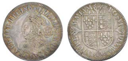
429 Sixpence, 1561, mm. star, bust A, 3.17g/6h (Borden and Brown 21, O2/R2; N 2024; S 2593). Some surface marks, otherwise about very fine £200-250