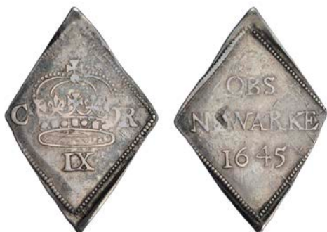
538 Ninepence, 1645, crown with pearls and jewels (some oval) on band, reads NEWARKE, 4.52g/12h (Brooker –; Hird 262, same dies; N 2641; S 3145). Obverse very fine, reverse nearly so £800-1,000