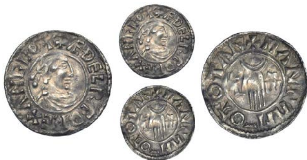
206 Penny, First Hand type, Totnes, Manna, MANNA M-O TOTAN, 1.30g/3h (BEH 3855; N 766; S 1144). Slightly creased, otherwise very fine or better, very rare £500-700