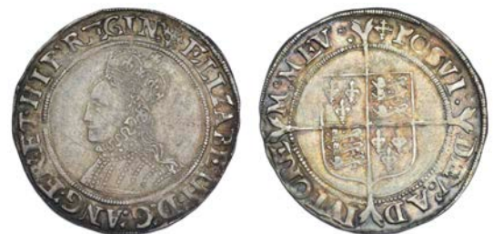
391 Shilling, mm. cross-crosslet, bust 1A, reads ANG ; FR, 5.94g/12h (N 1985; S 2555A). Very fine on a full round flan, toned £350-400