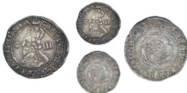
535 Threepence, mm. crown, plume before bust, no stops by mm., rev. plume above scroll-garnished shield, 1.44g/9h (SCBI Brooker 791, same dies; N 2355; S 2912). Reverse double-struck at top and with a couple of scratches, otherwise about very fine, toned, rare £600-800