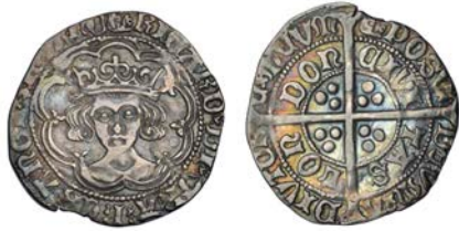
328 Groat, London, type 2b, mm. boar's head no. 2, 2.85g/5h (N 1679; S 2156). Flan a little irregular, otherwise better than very fine, attractively toned, rare £1,200-1,500