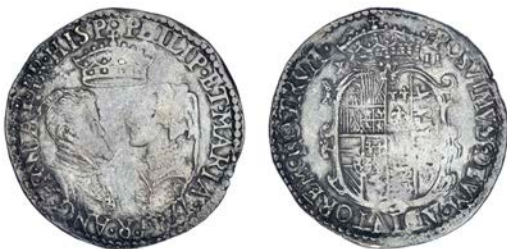
375 Shilling, undated, full titles and mark of value, reads HISP, 6.13g/6h (N 1967; S 2498). A little weak in places, otherwise nearly very fine £600-800