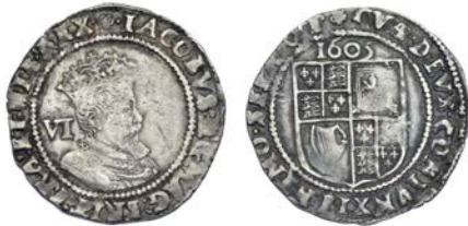
450 Sixpence, 1605, mm. rose, third bust, 2.92g/10h (N 2102; S 2657). Nearly very fine £90-120