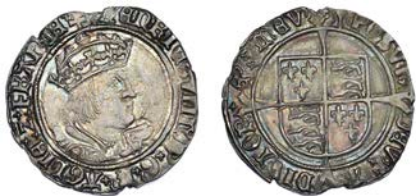
341 Groat, Tower, mm. arrow, reads FRANCE, saltires in forks, 2.71g/6h (Whitton viii, 2; N 1797; S 2337E). Flan slightly ragged, otherwise very fine or better with attractive tone £200-250