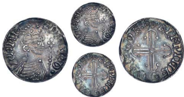
217 Penny, Hammer Cross type, London, Ælfwine, ÆLFWINE ON LVNDE:, 1.33g/3h (Freeman 128; N 828; S 1182). Better than very fine, toned £250-300