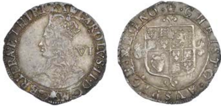
570 Sixpence, mm. crown, 3.05g/3h (ESC 1510; N 2767; S 3323). A few surface marks, otherwise very fine or better, toned £300-400