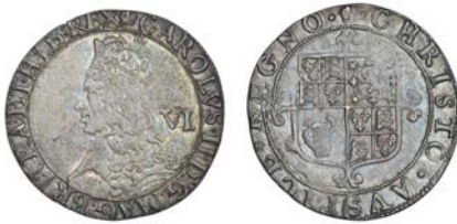
571 Sixpence, mm. crown, 2.95g/10h (ESC 1510; N 2767; S 3323). A few surface marks and some haymarking on obverse, otherwise very fine, reverse better, toned £300-400