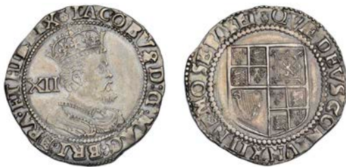
451 Shilling, mm. thistle, sixth bust, 5.97g/9h (N 2124; S 2668). Better than very fine with attractive light tone £250-300