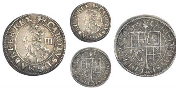
533 Threepence, mm. lion, reads F · E · H · and AVSPCE, 1.24g/9h (Besly 1H; SCBI Brooker 1109, same dies; N 2323; S 2877). About very fine £90-120