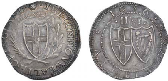
543 Halfcrown, 1656, mm. sun on obv. only, 14.45g/10h (ESC 437; N 2722; S 3215). Obverse lightly tooled in and around shield, otherwise very fine, reverse better £350-400