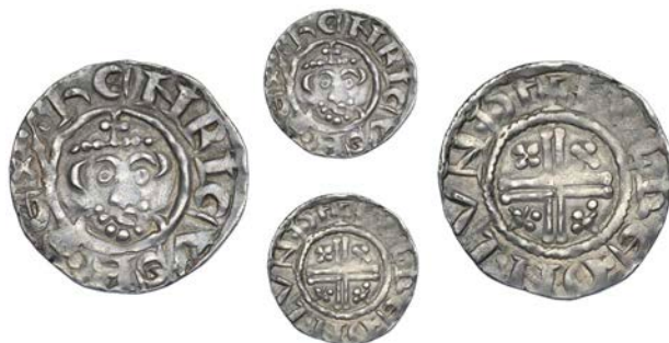
23 Penny, class IVb, London, Fulke, FULKE · ON · LVNDI, 1.43g/3h (SCBI Mass 1099; N 968/2; S 1348C). Very fine £120-150 Provenance: Bt G.A. Singer January 2006