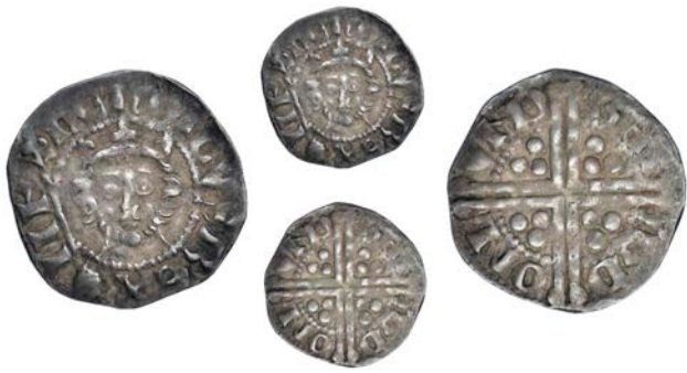
222 Penny, class VII, London, Renaud, RENAVD ON LVND , 1.47g/9h (N 1002; S 1378). Nearly very fine with old cabinet toning £300-400