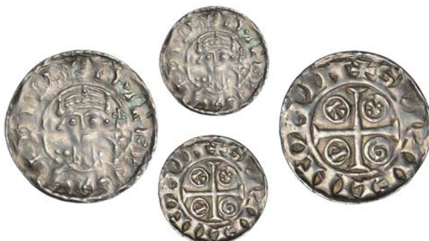
219 Penny, PAXS type, Winchester, Sprælinec, SPRACLINC ON PIN, 1.40g/12h (BMC 1142-3; N 848; S 1257). Some flatness, otherwise very fine £350-450