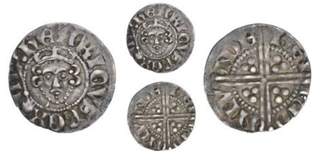
83 Penny, class Vd, London, Henri, HENRI ON LVNDE, 1.32g/11h (N 994; S 1370). Very fine, rare £120-150

Provenance: Patrick Finn FPL 17, September 1999 (137); Baldwin Auction 38, 4 October 2004, lot 180