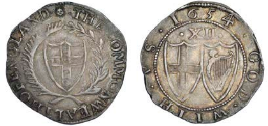
549 Shilling, 1654, mm. sun on obv. only, 6.03g/6h (ESC 990; N 2724; S 3217). Very fine, toned £300-400