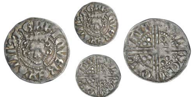
84 Penny, class Vd, Canterbury, Willem, WILLEM ON CANT, 1.45g/10h (N 994; S 1370). King's face weak, otherwise very fine, rare £200-250

Provenance: Patrick Finn FPL 17, September 1999 (140); Baldwin Auction 38, 4 October 2004, lot 182