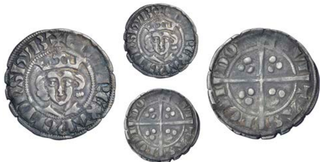
225 Penny, class 1a/1c mule, London, 1.39g/10h (SCBI North 21-3; N 1010/1012; S 1380/1382). Good fine, rare £150-200