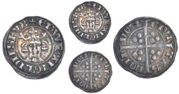
237 Penny, class 7a, London, rose on breast, double-barred n, non-composite s, 1.32g/9h (SCBI North 307; N 1032; S 1403). Better than very fine, toned £100-150