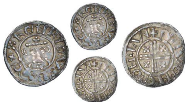
25 Penny, class IVb, London, Stivene, STIVENE · ON · LVN, 1.37g/4h (SCBI Mass 1113 var.; N 968/2; S 1348C). Very fine £200-250

Provenance: B.M. Greenaway Collection, DNW Auction 72, 13 December 2006, lot 67 (part)