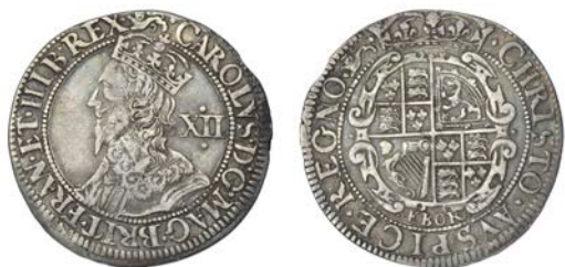
529 Shilling, Gp 2 [type 4], mm. lion, 5.04g/12h (Besly 2Cc; SCBI Brooker 1094, same dies; N 2319; S 2873). Nearly very fine £200-250