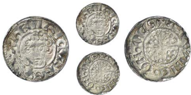
39 Penny, class Vb 2, Oxford, Ailwine, AILWINE · ON · OCS, 1.31g/3h (SCBI Mass 1574; N 970; S 1351). Centres slightly weak, otherwise very fine, scarce £200-250