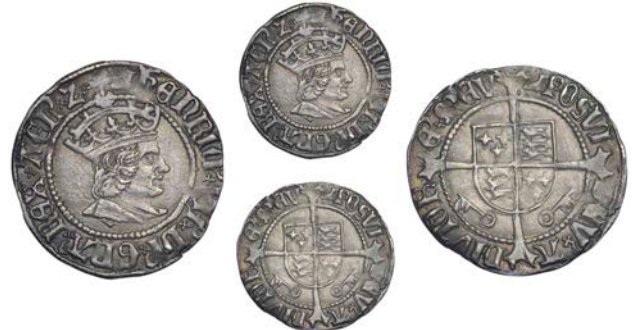
334 Halfgroat, York, Abp Bainbridge, mm. martlet, keys below shield, 1.18g/8h (N 1769; S 2323). Better than very fine, toned £120-150