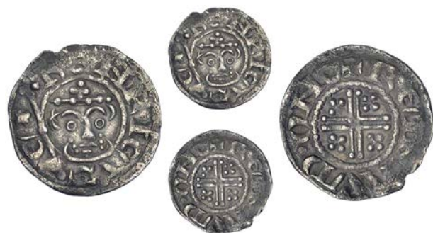
27 Penny, class IVb, Shrewsbury, Reinald, REINAVD · ON · S, 1.29g/8h (SCBI Mass 1141-2, same dies; N 968/2; S 1348C). Minor weakness in legends, otherwise very fine, rare £400-500