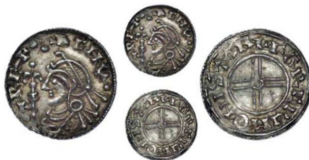
212 Penny, Short Cross type, Stamford, Færgrim, FARGRIM ON STAN, 1.09g/6h (BEH 3256; N 790; S 1159). Nearly extremely fine £250-300