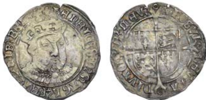
353 Groat, Tower, mm. lis, bust 2, Lombardic lettering, annulets in forks, trefoil stops, 2.37g/12h (Whitton A3; N 1844; S 2369). Nearly very fine £150-200