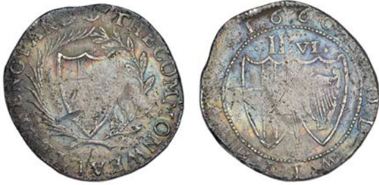
544 Halfcrown, 1660, mm. anchor on obv. only, 14.68g/2h (ESC 442; N 2723; S 3216). Surfaces porous and scratched, weakly struck, otherwise fine, very rare £600-800