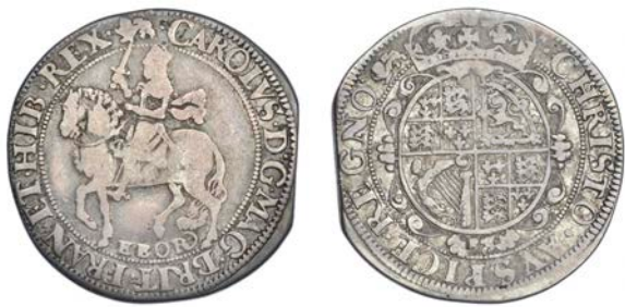
527 Halfcrown, Gp 2 [type 7], mm. lion, small E to right of crown on rev. , frosted caul and garniture, 13.63g/12h (Besly 2B; SCBI Brooker 1088A, same dies; N 2315; S 2869). Fine or better £200-250