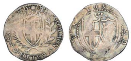
553 Sixpence, 1657/6, mm. sun on obv. only, 2.61g/8h (ESC 1493; N 2726; S 3219). Creased, otherwise nearly fine, extremely rare £400-500