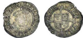
358 Halfgroat, Canterbury, no mm., bust 1 var., Lombardic lettering, pierced forks, trefoil stops, pellet (or pellet-in-annulet) in fourth quarter below shield, 1.21g/2h (Whitton a; N 1852; S 2378). Very fine, scarce thus £150-200