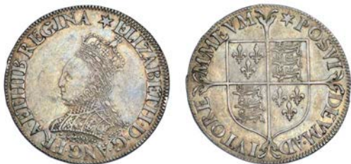
427 Shilling, intermediate size, mm. star, 30mm, 6.25g/5h (Borden and Brown 16, O1/R2; N 2023; S 2591). Good very fine with attractive light grey tone £700-900