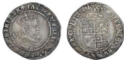
452 Sixpence, 1624, mm. trefoil, sixth bust, 2.93g/3h (N 2126; S 2670). Nearly very fine £150-200