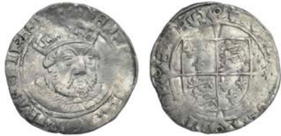
351 Groat, Tower, mm. lis, bust 1, Lombardic lettering, pellet-in-annulets in forks, trefoil stops, 2.44g/5h (Whitton A3; N 1844; S 2369). Some weakness in legends, otherwise very fine or better for issue with a detailed portrait £200-250