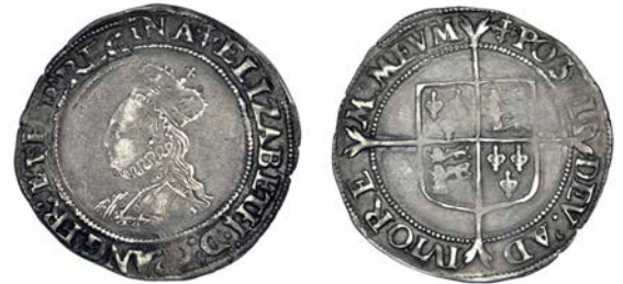
388 Shilling, mm. cross-crosslet, bust 3C, 5.71g/4h (N 1985; S 2555). Weakly struck, otherwise nearly very fine £100-150