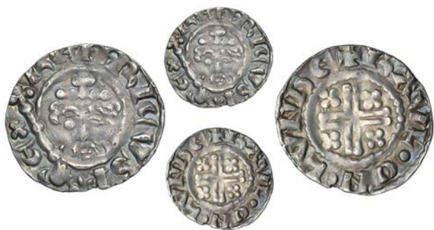
19 Penny, class II, London, Raul, RAVL · ON · LVNDE, 1.43g/12h (SCBI Mass 680-5; N 965; S 1346). Very fine £200-250 Provenance: J. Hall Collection, DNW Auction 71, 28 September 2006, lot 92