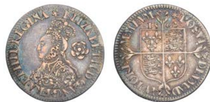
433 Sixpence, 1562, mm. star, bust C, 3.09g/7h (Borden and Brown 24, O3/R6; N 2026; S 2595). About very fine £200-250