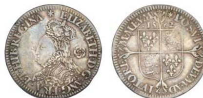
434 Sixpence, 1562, mm. star, bust D, 2.96g/6h (Borden and Brown 25, O8/R4; N 2027; S 2596). A little creased, otherwise nearly very fine £200-250