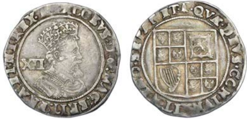
449 Shilling, mm. bell, fifth bust, 5.92g/7h (N 2101; S 2656). Very fine £120-150