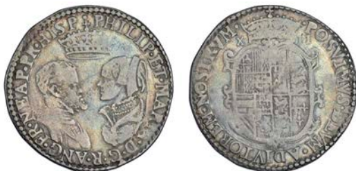
376 Shilling, undated, full titles, mark of value divided by crown above shield, 6.01g/4h (N 1967; S 2498). Full and round, good fine or better, attractively toned £700-900