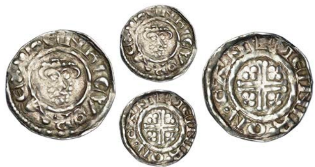
20 Penny, class IVb, Canterbury, Meinir, MEINIR · ON · CANT, 1.46g/1h (SCBI Mass 1071; N 968/2; S 1348C). Very fine £120-150

Provenance: B.M. Greenaway Collection, DNW Auction 72, 13 December 2006, lot 67 (part)