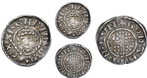
10 Penny, class Ib 1, London, Godard, GODARD · ON · LVN, 1.30g/8h (SCBI Mass 266-8 var.; N 963; S 1344). Face slightly weak, otherwise very fine £150-200 Provenance: WAG Auktion 30 (Dortmund), 13 June 2005, lot 4850