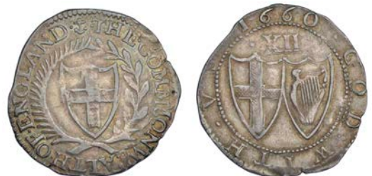
551 Shilling, 1660, mm. anchor on obv. only, 5.97g/4h (ESC 1001; N 2725; S 3218). Good fine or better, lightly toned, very rare £1,200-1,500