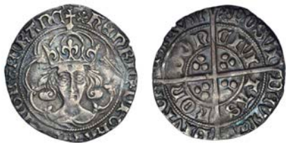
330 Groat, class II, mm. cinquefoil, trefoil stops, trefoil after DEVN and ADIVTORE , 2.94g/11h (cf. SCBI Ashmolean 218ff; N 1704; S 2195). Scored in obverse field, otherwise nearly very fine, reverse better £100-150