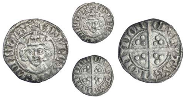
223 Penny, class 1a, London, lis in crown, wedge after HYB , 1.27g/5h (cf. SCBI North 18; N 1010; S 1380). Some surface marks and porosity, otherwise nearly very fine, very rare £400-500