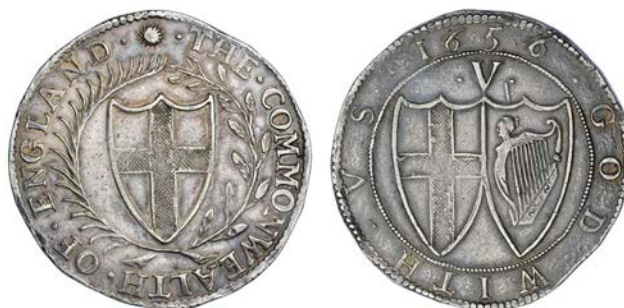
541 Crown, 1656/4, mm. sun on obv. only, large 6s in date, 29.91g/7h (ESC 9A; N 2721; S 3214). Small die break above Irish shield, nearly extremely fine, toned £2,500-3,000