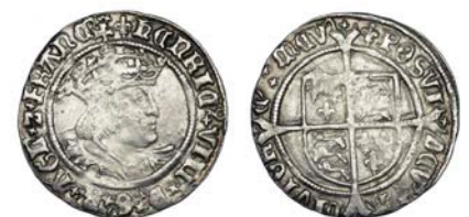
337 Groat, Tower, mm. lis, reads AGL' , saltires in forks, 2.65g/2h (Whitton v; N 1797; S 2337E). Nearly very fine £150-200