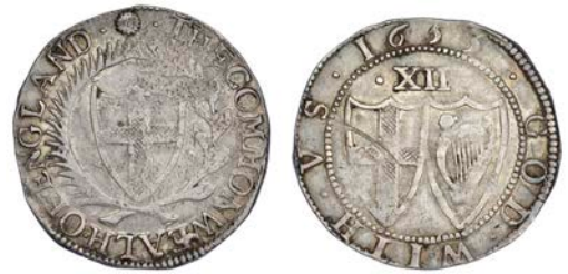
548 Shilling, 1653, mm. sun on obv. only, reads COMMONWEALH, 5.97g/3h (ESC 988B; N 2724; S 3217). Good fine, very rare £300-350