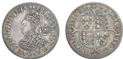
428 Sixpence, 1561, mm. star, bust A, 2.85g/6h (Borden and Brown 21, O2/R2; N 2024; S 2593). A few surface marks, otherwise very fine or better, toned £250-300