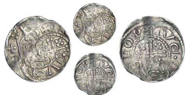
26 Penny, class IVb, Shrewsbury, Ive, IVE · ON · SALOP, 1.45g/4h (SCBI Mass 1139-40; N 968/2; S 1348C). Severely double-struck and creased, otherwise good very fine, rare £200-250

Provenance: J.P. Mass Collection, Part III, DNW Auction 69, 15 March 2006, lot 998 [from Baldwin 1989]