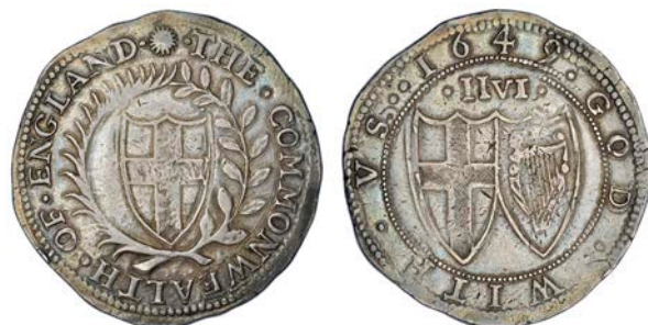
542 Halfcrown, 1649, mm. sun on obv. only, rev. no central stop to mark of value, 14.88g/5h (ESC 425; N 2721; S 3215). Reverse very slightly double-struck, otherwise very fine with attractive light tone, rare £600-800