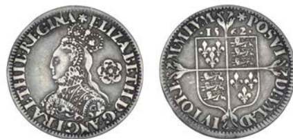
436 Sixpences (2), both 1562, mm. star, bust C, 3.08g/6h, bust D, 2.74g/6h (Borden/Brown 24, O2/R2, 26, O10/R6; N 2026-7; S 2595-6) [2]. First nearly very fine, second better than fine but surfaces marked £150-200 First only illustrated