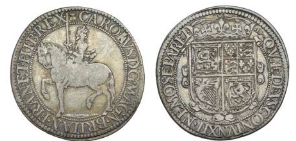
577 Thirty Shillings, mm. thistle-head, 14.63g/6h (Murray pl. iii, 14; SCBI 35, 1457; B 20, fig. 1015; S 5554). Good fine £120-150