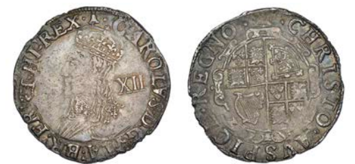
458 Shilling, Gp D, mm. bell, bust 1, semi-colon and pellet stops, rev. shield 1, pellet stops, 6.00g/10h (Sharp E1/1; SCBI Brooker 487; N2225; S 2791). About very fine, lightly toned £100-150