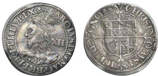
528 Shilling, Gp 1 [type 1], mm. lion, 5.68g/9h (Besly 1A; SCBI Brooker 1089, same dies; N 2316; S 2870). Slightly creased, otherwise very fine £250-300