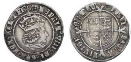
335 Groat, Tower, mm. crowned portcullis (without chains on rev. ), 2.77g/12h (N 1762; S 2316). Nearly very fine, toned £200-250