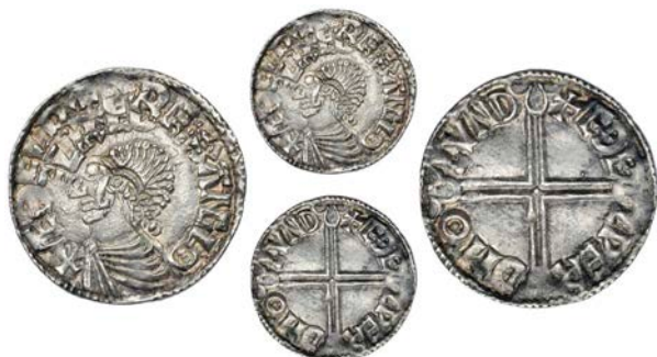
208 Penny, Long Cross type, London, Æthelweard, +EDELPERD M'O LVND, 1.62g/9h (BEH 2166; N 774; S 1151). Obverse rather double-struck, otherwise very fine £200-250