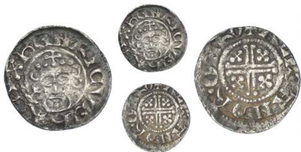
41 Penny, class Vb 2, Rochester, Alisandre, ALISANDR · ON · RO, 1.32g/2h (SCBI Mass 1588-90; N 970; S 1351). Good fine, rare £200-250