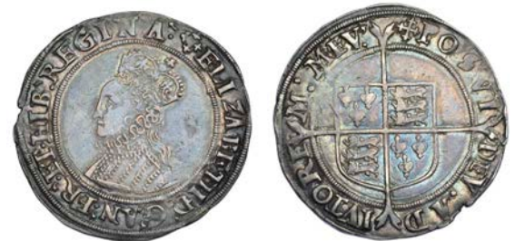
390 Shilling, mm. cross-crosslet, bust 1A, reads AN ; FR, 6.07g/10h (N 1985; S 2555A). A few light surface marks and scratches, otherwise about very fine with attractive blue-grey tone £350-400