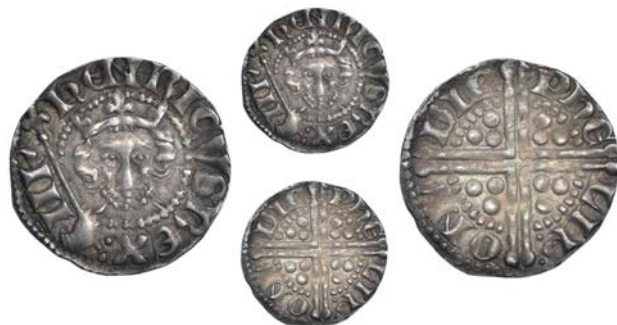
221 Penny, class VII, London, Phelip, PHELIP ON LVND, 1.51g/9h (N 1002; S 1378). Very fine or better, toned £150-200