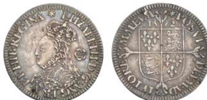
435 Sixpence, 1562, mm. star, bust D, 3.09g/6h (Borden and Brown 25, O8/R4; N 2027; S 2596). Hairline scratches on obverse and a knock below bust, otherwise very fine £150-200