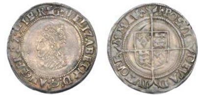
387 Groat, mm. lis, wire line and beaded inner circles, legend ends REG', bust 1G, rev. small shield, 2.11g/12h (N 1986; S 2551A). Tiny dent in front of face, small metal flaw on reverse, otherwise about very fine, rare £250-300