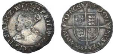
383 Groat, mm. lis, reads PHILIP · Z · MARIA · D · G · REX · Z · REGI ·, 1.89g/6h (N 1973; S 2508). Many surface marks on obverse, otherwise good fine £100-150