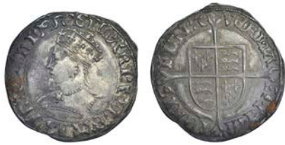
372 Groat, mm. pomegranate, 2.11g/7h (N 1960; S 2492). Very fine or better £200-250