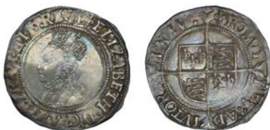
386 Groat, mm. lis, wire-line and beaded inner circles, legend ends REGI', bust 1F, 1.95g/3h (N 1986; S 2551). A little creased and dented and a couple of scratches on obverse, otherwise about very fine, scarce £150-200