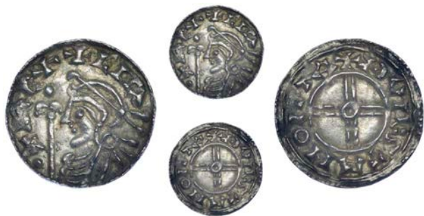
214 Penny, Short Cross type, Stamford, Thurstan, DVR·STAN ON TAN, 0.82g/6h (cf. BEH 3354; N 790; S 1159). Good very fine £200-250