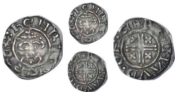
21 Penny, class IVb, Canterbury, Reinald, REINAVD · ON · C, 1.16g/6h (SCBI Mass 1074; N 968/2; S 1348C). Legends weak in places, otherwise very fine £90-120

Provenance: L.A. Lawrence Collection, Part II, Glendining Auction, 14 March 1951, lot 398 (part); St James's Auction 5, 27 September 2006, lot 136