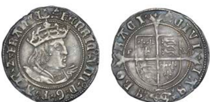
343 Groat, York, Abp Wolsey, mm. acorn, bust D, reads FRANCE, rev. tw by shield, cardinal's hat below, saltires in forks, 2.57g/4h (Whitton iii; N 1799; S 2339). Minor marks on bust but very fine with attractive grey tone £250-300