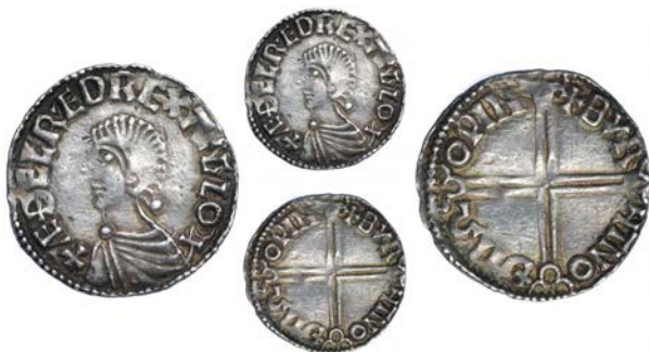
209 Penny, Long Cross type, Winchester, Byrhtnoth, BYRHTNOD M'ΩO PIN, 1.73g/3h (BEH 4178; N 774; S 1151). Minor peckmarks on obverse, otherwise about very fine, reverse better £200-250