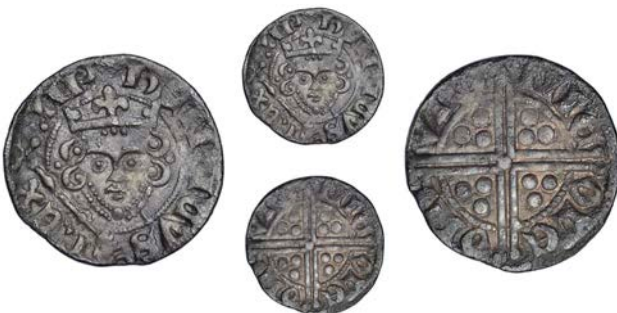
79 Penny, class IVb, London, Nicole, NICOLE ON LVND, 1.33g/10h (N 990; S 1366). Minor surface corrosion, otherwise very fine, rare £200-250

Provenance: Patrick Finn FPL 17, September 1999 (133); Baldwin Auction 38, 4 October 2004, lot 177