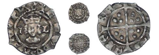
349 Halfpenny, York, Abp Lee, mm. key on obv. only, LE by bust, 0.36g/11h (N 1820; S 2361). About very fine for issue £80-100