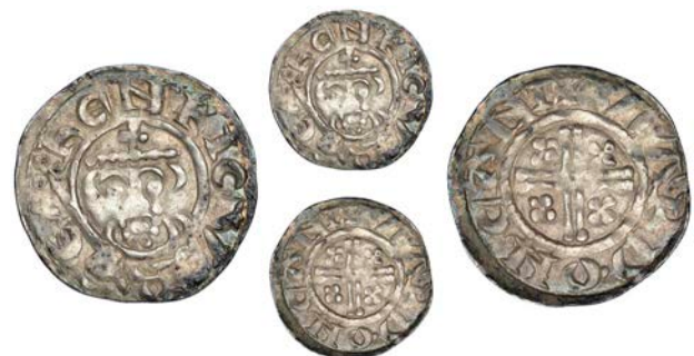
22 Penny, class IVb, Canterbury, Ulard, VLARD · ON · CANT, 1.46g/3h (SCBI Mass 1090; N 968/2; S 1348C). Very fine £120-150