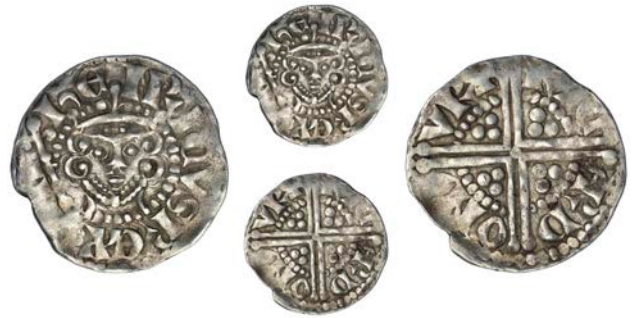
82 Penny, class Vc, Durham, Ricard, RICARD ON DVRH, 1.42g/8h (N 993; S 1369). Very fine, rare £120-150

Provenance: Patrick Finn FPL 17, September 1999 (137); Baldwin Auction 38, 4 October 2004, lot 180