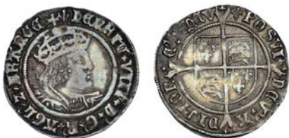
342 Groat, Tower, mm. pheon on obv., lis (phase 3) on rev., reads FRANCE, saltires in forks, 2.75g/3h (Whitton x; N 1797; S 2337E). Obverse from a slightly rusted die, about very fine, toned, the combination of marks scarce £150-200