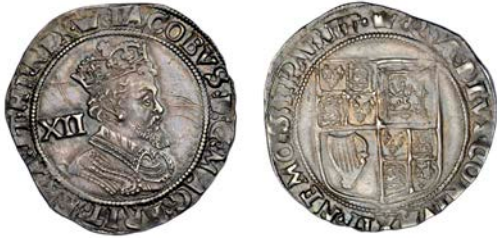
448 Shilling, mm. coronet, fifth bust variety, 5.70g/2h (N 2101; S 2656). Some deep scratches in obverse field and reverse slightly double-struck, otherwise very fine with a detailed and attractive portrait £150-200