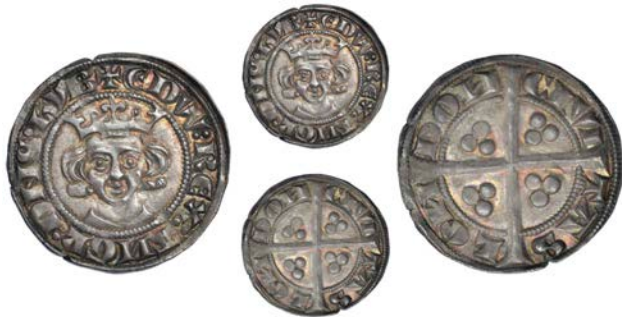
224 Penny, class 1c, London, 1.45g/7h (cf. SCBI North 25-6; N 1012; S 1382). Full and round, extremely fine and lightly toned, rare thus £100-150