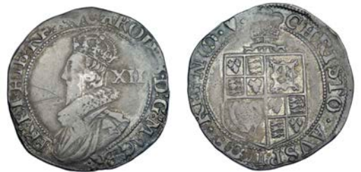
456 Shilling, Gp B, mm. heart, bust 5, semi-colon and pellet stops, rev. shield 2, pellet stops, 5.80g/10h (Sharp B5/2; SCBI Brooker 434; N 2220; S 2785). Scratched in front of face, otherwise fine, grey tone, rare £150-200