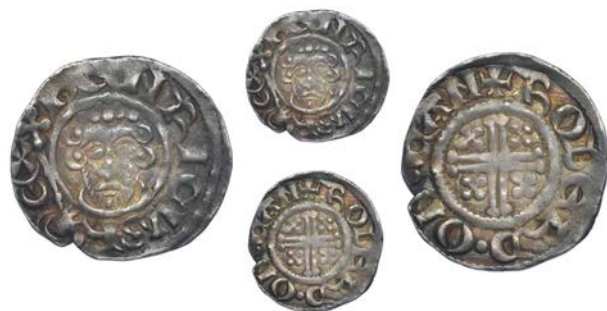
45 Penny, class Vc, Canterbury, Roberd, ROBERD · ON · CAN, 1.48g/8h (SCBI Mass 1678; N 971; S 1352). Small edge flaw, otherwise very fine, toned £90-120

Provenance: H.P. Whittle Collection, Noble Numismatics Auction 65 (Sydney), 15-16 November 2000, lot 751 (part); bt M.P. Senior May 2006