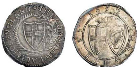
547 Shilling, 1652, mm. sun on obv. only, 5.94g/11h (ESC 985; N 2724; S 3217). Small dig in reverse field and surfaces a little marked, otherwise about very fine £250-350