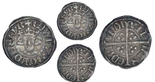
234 Penny, class 5b, Bury St Edmunds, pellet on breast, reads VIL LAS EDM VNDI , 1.41g/8h (SCBI North 284; N 1029; S 1400). Nearly very fine on a large flan, rare £90-120