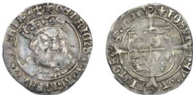
352 Groat, Tower, mm. lis, bust 1, Lombardic lettering, annulets in forks, trefoil stops, 2.46g/5h (Whitton A3; N 1844; S 2369). Some obverse metal flaws, otherwise nearly very fine £150-200