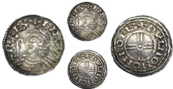
215 Penny, Short Cross type, York, Wulnoth, PVLNOD ON EOFE:, 1.14g/9h (BEH 861; N 790; S 1159). Obverse die crack, otherwise very fine or better £200-250