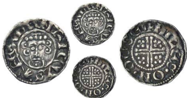
40 Penny, class Vb 2, Oxford, Miles, MILES · ON · OCSE, 1.41g/12h (SCBI Mass 1585-7; N 970; S 1351). Good fine, scarce £90-120