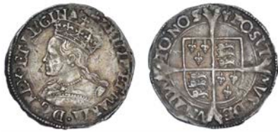
382 Groat, mm. lis, reads PHILIP · ET · MARIA · D · G · REX · ET · REGINA ·, 1.87g/2h (N 1973; S 2508). Hairline cut on jaw, otherwise obverse very fine, reverse nearly so, the portrait clear £250-300