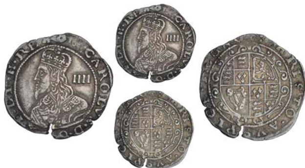
522 Groat, 1644, mm. rose, 1.62g/11h (Besly A1; SCBI Brooker 1071, same dies; N 2579; S 3088). Two striking splits between 4 and 6 o'clock and legends weak in places, otherwise very fine £250-300