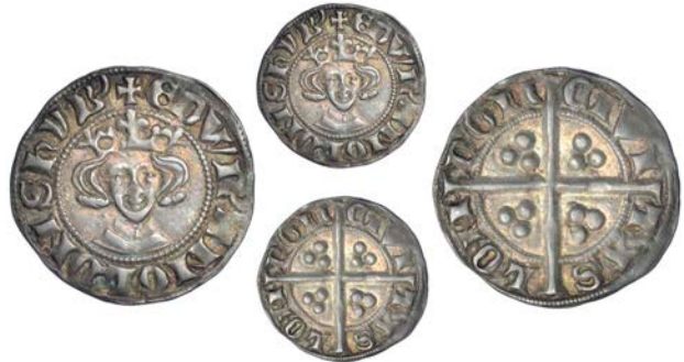
236 Penny, class 6b, London, 1.43g/7h (SCBI North 296; N 1031; S 1402). Good very fine, attractively toned, rare £150-200

This does not appear to be from the normal 8b obverse die used at Bury which has a distinctive flaw over the crown. More remarkable is the spelling and spacing of the reverse legend, which is not represented in the North Sylloge