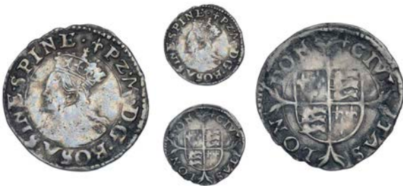
374 Penny, mm. lis, 0.60g/5h (N 1975; S2510). Dress flat and a little corrosion to parts of reverse legend, otherwise almost very fine, extremely rare £800-1,000