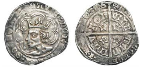
574 Groat, Edinburgh, mm. cross pattée, 'Robert II' style bust, tressure of six arcs, trefoils in spandrels, double crosslet stops, star on sceptre handle, 3.89g/5h (SCBI 35, 421ff; B 41, fig. 302; S 5125). On a slightly irregular flan, otherwise very fine £200-250