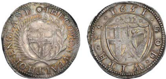
545 Shilling, 1651, mm. sun on obv. only, reads COMONWEALTH, 5.98g/4h (ESC 984C; N 2724; S 3217). Well-centred on a full flan, very fine and attractively toned, very rare £500-700