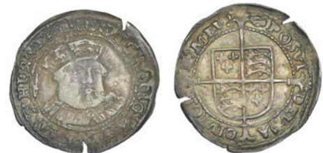
359 Groat, Tower, mm. grapple on rev. only, bust 5, Roman lettering, roses in forks, pellet stops, 2.51g/10h (Whitton d; N 1871; S 2403). A little double struck on obverse, two tiny striking splits, otherwise very fine or better for issue on a full flan £200-300