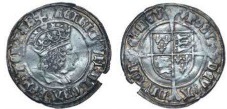
333 Groat, regular type, mm. pheon, 2.85g/12h (N 1747; S 2258). Small edge chip, otherwise good very fine £150-200