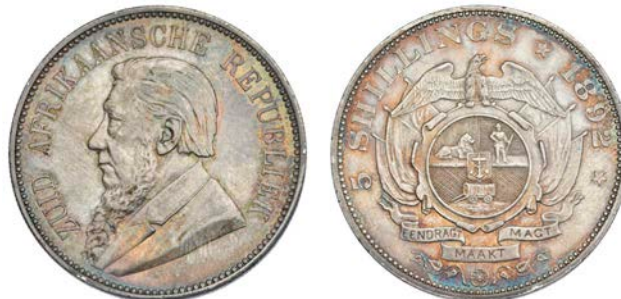
1531 Paul Kruger , Crown, 1892, double shaft (Hern Z36; KM. 8.2). A couple of rim nicks, otherwise about extremely fine with patchy toning