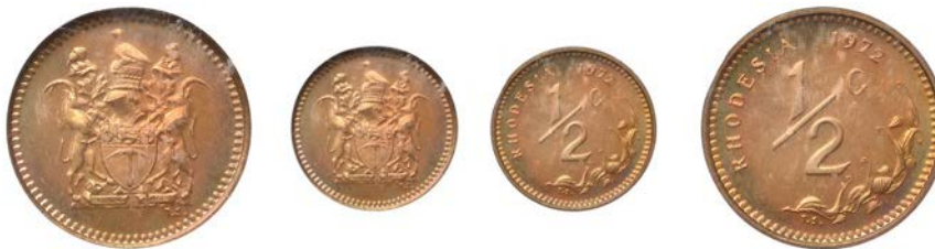
1509 Republic , Proof Half-Cent, 1972, edge plain, 12h (KM. 9). Brilliant FDC, extremely rare 12 struck. Slabbed in PCI holder, graded PR 67