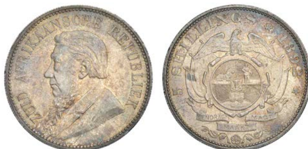
1534 Paul Kruger , Crown, 1892, single shaft (Hern Z37; KM. 8.1). Minor surface marks, otherwise good extremely fine, toned