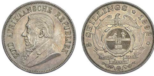
1536 Paul Kruger , Crown, 1892, single shaft (Hern Z37; KM. 8.1). Very fine