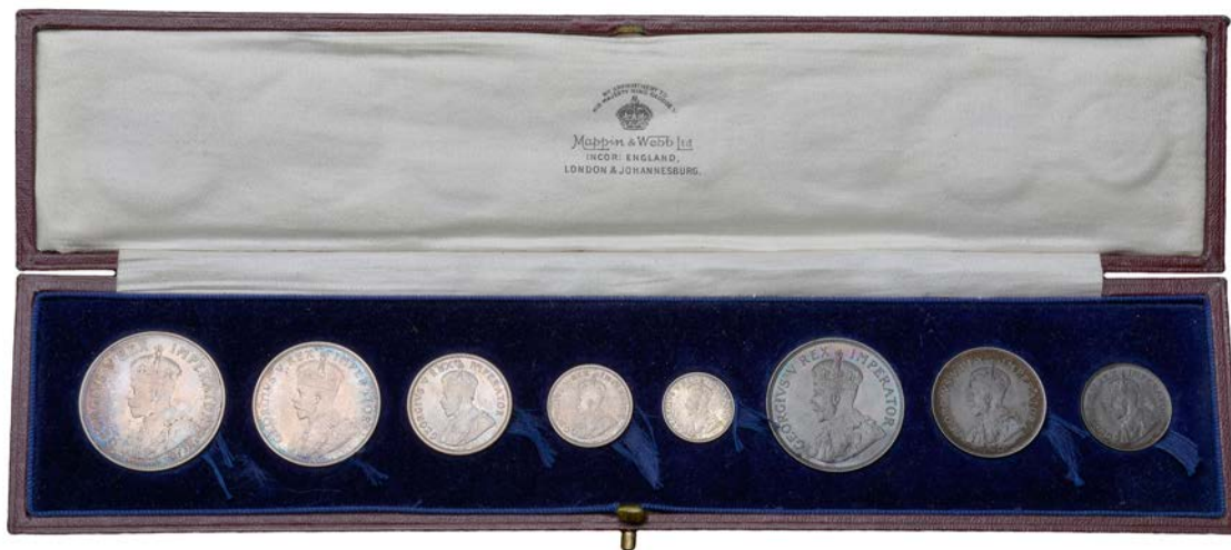
1558 George V, Proof set, 1923, comprising Halfcrown to Farthing (Hern P2; KM. PS 2) [8]. Silver lightly toned, otherwise brilliant and practically as struck, rare; in original maroon fitted case by Mappin & Webb £600-800