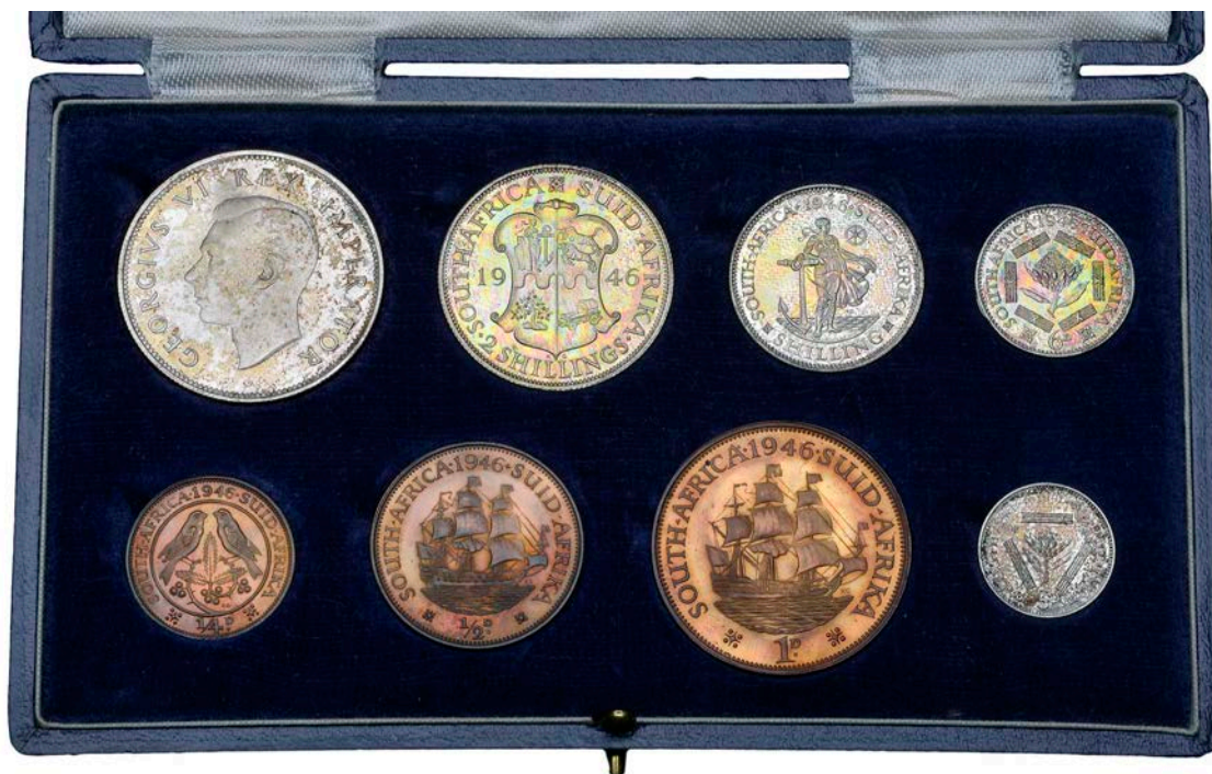
1574 George VI, Proof set, 1946, comprising Halfcrown to Farthing (Hern P19; KM. PS18) [8]. About as struck, silver a little tarnished; in SAM leather case £600-800 150 sets issued