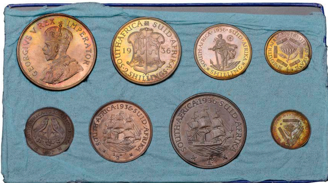
1560 George V, Proof set, 1936, comprising Halfcrown to Farthing (Hern P12; KM. PS11) [8]. Virtually as struck, toned; in embossed card case of issue, rare £2,500-3,000

2 Shillings only illustrated. 40 sets issued. Slabbed in CGS UK holders, graded UNC 90, UNC 92, UNC 92, UNC 91, UNC 90, UNC 88, UNC 90 and UNC 90 respectively