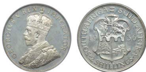
1559 George V, Proof set, 1936, comprising Halfcrown to Farthing (Hern P12; KM. PS11) [8]. About as struck, Halfcrown, Penny and Halfpenny slightly tarnished on reverse, rare; in embossed blue card case of issue [this slightly damaged], rare £3,000-3,500

Provenance: DNW Auction 77, 12 March 2008, lot 438.