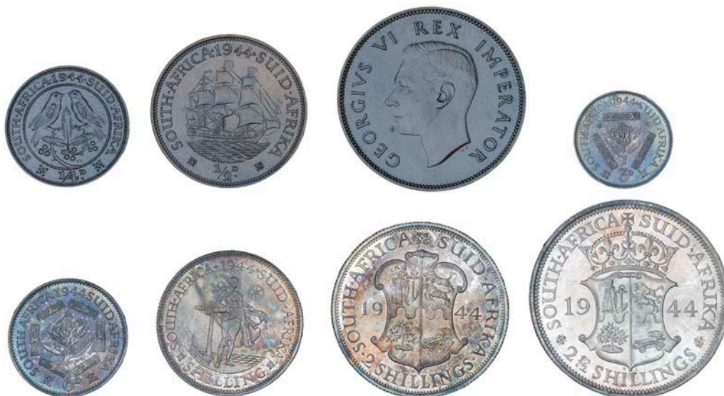
1572 George VI, Proof set, 1944, comprising Halfcrown to Farthing (Hern P17; KM. PS16) [8]. Silver slightly stained, otherwise about as struck, toned; in card case of issue £600-800