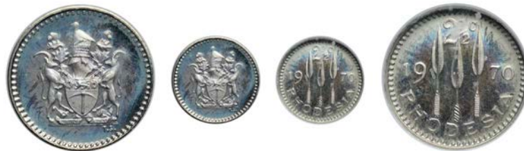
1503 Republic , Proof Two-and-a-Half Cents, 1970, 12h (KM. 11). Light traces of handling, otherwise brilliant, extremely rare 12 struck. Slabbed in PCI holder, graded PR 66 Cameo