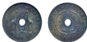
1515 Elizabeth II , Proof Halfpenny, 1958, edge plain, 12h (KM. 1). Brilliant, dark glossy patina, very rare £200-250 Slabbed in CGS UK holder, graded UNC 90