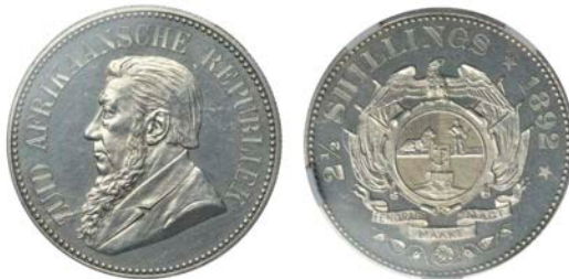
1538 Paul Kruger , Proof Halfcrown, 1892, edge grained, 12h (Hern Z30; KM. 7). Minimal hairlining, otherwise practically as struck

Provenance: Baldwin Auction 48, 26 September 2006, lot 5092