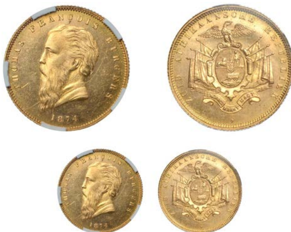
☞ 1517 Thomas Burgers , Pond, 1874, coarse beard, 6h (Hern B2; KM. 1.1; F 1). Light scratch behind head and on beard, otherwise good extremely fine with proof-like fields, extremely rare £40,000-60,000 Slabbed in SANGS holder, graded MS 63. For general eye-appeal, this attractive specimen compares well with the one sold in these rooms in June 2011 for £180,000