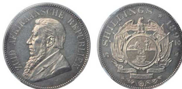
1533 Paul Kruger , Proof Crown, 1892, double shaft, edge grained, 11h (Hern Z36; KM. 8.2). A few light hairlines, otherwise practically as struck, extremely rare