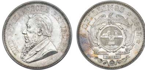
1537 Paul Kruger , Proof Halfcrown, 1892, edge grained, 14.35g/12h (Hern Z30; KM. 7). Small mark in field below A in AFRIKAANSCH and a couple of minor hairlines, otherwise about as struck