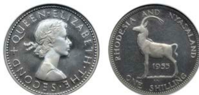
1511 Elizabeth II , Proof Shilling, 1955, in cupro-nickel, edge grained, 12h (KM. 5). Brilliant FDC, very rare