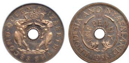
1512 Elizabeth II , Proof Penny, 1956, edge plain, 12h (KM. 2). Brilliant, very rare

10 struck. Slabbed in NGC holder, graded PF 66 Ultra Cameo