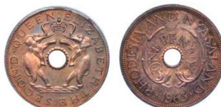
1514 Elizabeth II , Proof Penny, 1963, edge plain, 12h (KM. 2). Brilliant, virtually as struck, very rare £200-250 Slabbed in CGS UK holder, graded UNC 88