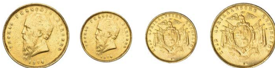
☞ 1516 Thomas Burgers , Pond, 1874, fine beard, 7.83g/6h (Hern B1; KM. 1.2; F 1a). Removed from a mount, surfaces knocked and sweated, otherwise about fine £1,200-1,500 Provenance: Spink Auction 204, 24 June 2010, lot 819