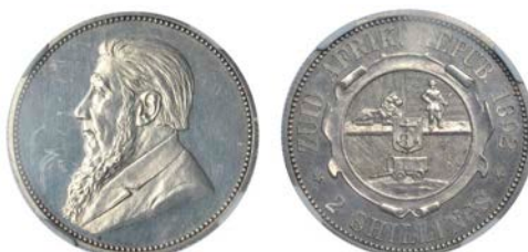
1541 Paul Kruger , Proof 2 Shillings, 1892, 1h (Hern Z23; KM. 6). A few hairlines, otherwise good extremely fine or better

Provenance: Baldwin Auction 48, 26 September 2006, lot 5093