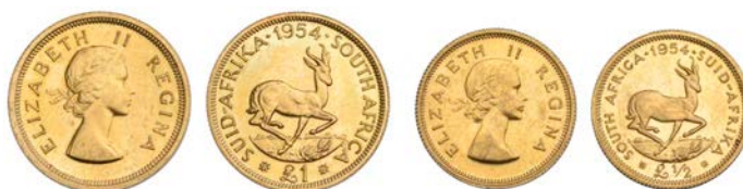
1575 Elizabeth II, Proof set, 1954, comprising gold Pound and Half-Pound (Hern P28; KM. PS29) [2]. Extremely fine or better; in case of issue £350-400