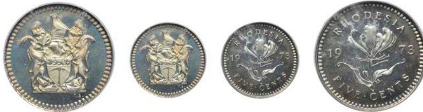
1502 Republic , Proof 5 Cents, 1973, 12h (KM. 12). Brilliant FDC, extremely rare 10 struck. Slabbed in PCI holder, graded PR 68 Cameo