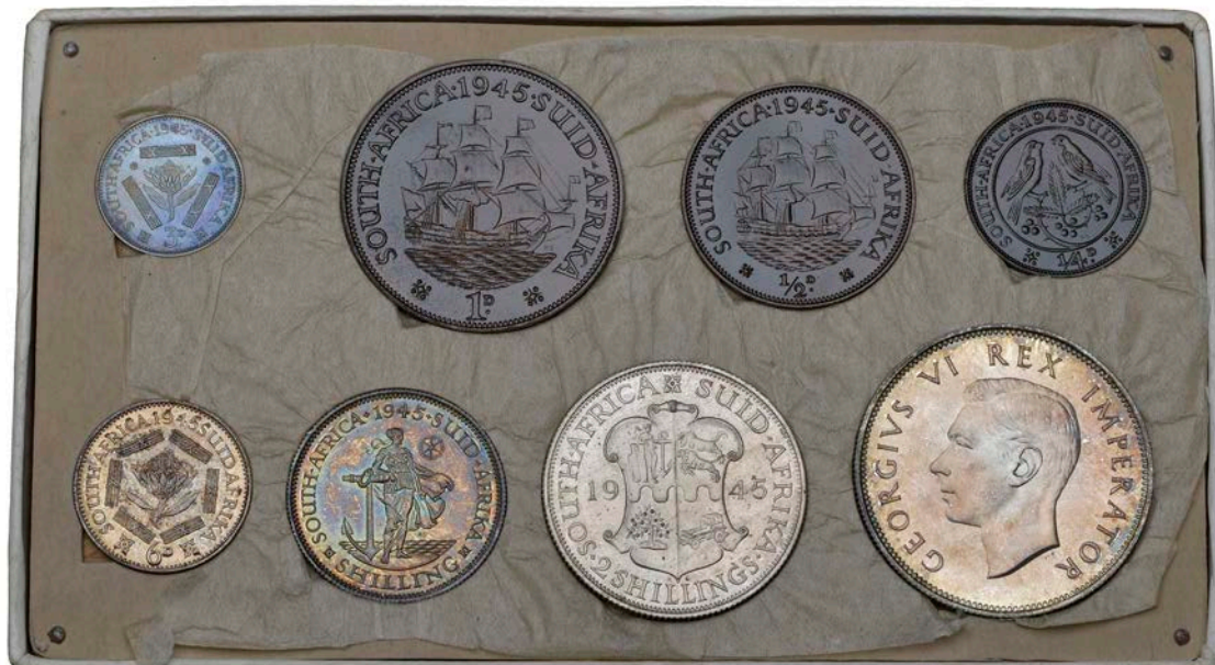
1573 George VI, Proof set, 1945, comprising Halfcrown to Farthing (Hern P18; KM. PS17) [8]. Silver has been lightly cleaned at some time, with hairlines, otherwise about as struck, toned; in card case of issue £600-800 150 sets issued