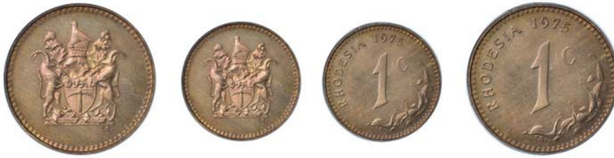
1507 Republic , Proof Cent, 1975, edge plain, 12h (KM. 10). Brilliant, extremely rare 10 struck. Slabbed in CGS UK holder, graded UNC 92