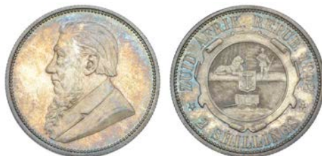
1540 Paul Kruger , Proof 2 Shillings, 1892, edge grained, 11.31g/12h (Hern Z23; KM. 6). Minor hairlines, otherwise about as struck, toned