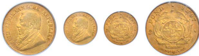
1530 Paul Kruger , Half-Pond, 1897 (Hern Z43; KM. 9.2; F 3). Extremely fine Slabbed in PCGS holder, graded AU 55