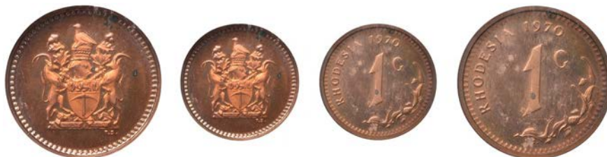
1504 Republic , Proof Cent, 1970, edge plain, 12h (KM. 10). Some spotting both sides, otherwise brilliant, extremely rare 12 struck. Slabbed in PCI holder, graded PR 67 Cameo