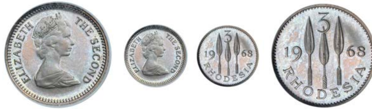
1501 Elizabeth II , Proof Threepence, 1968, 12h (KM. 8). Brilliant, extremely rare 10 struck. Slabbed in NGC holder, graded PF 65