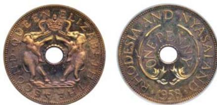
1513 Elizabeth II , Proof Penny, 1958, edge plain, 12h (KM. 2). Brilliant, partial red tone, very rare £200-250 Slabbed in CGS UK holder, graded UNC 92