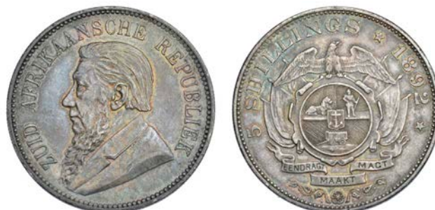
1535 Paul Kruger , Crown, 1892, single shaft (Hern Z37; KM. 8.1). Good very fine or better

Provenance: Baldwin Auction 48, 26 September 2006, lot 5089