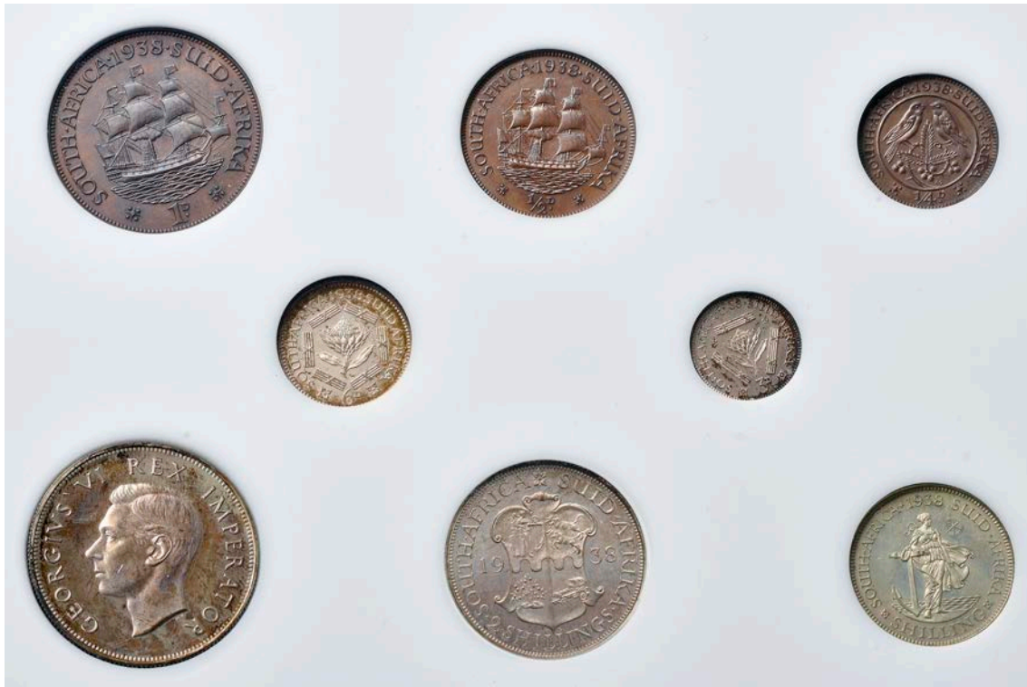
1571 George VI, Proof set, 1938, comprising Halfcrown to Farthing (Hern P14; KM. PS12) [8]. Silver stained, possibly lightly cleaned at some time, otherwise about as struck; in perspex fitted case £1,200-1,500 Provenance: J.J. Pittman Collection, Part III, David Akers Auction (Rosemont, USA), 6-8 August 1999, lot 4849.