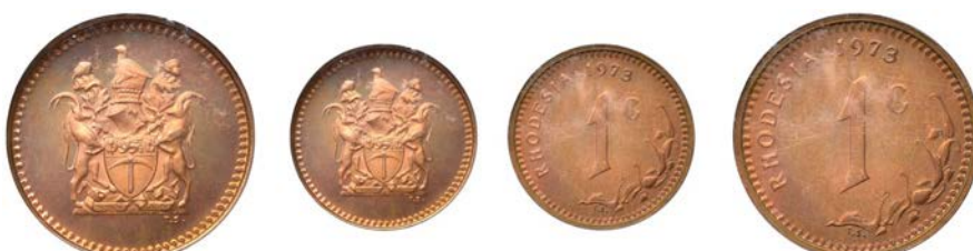
1506 Republic , Proof Cent, 1973, edge plain, 12h (KM. 10). Brilliant FDC, extremely rare 10 struck. Slabbed in PCI holder, graded PR 67 Cameo