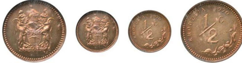
1508 Republic , Proof Half-Cent, 1970, edge plain, 12h (KM. 9). Brilliant FDC, extremely rare 12 struck. Slabbed in PCI holder, graded PR 67