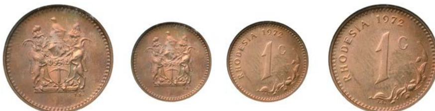
1505 Republic , Proof Cent, 1972, edge plain, 12h (KM. 10). Brilliant, extremely rare 12 struck. Slabbed in PCI holder, graded PR 67