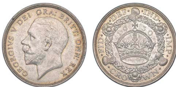
312 Crown, 1930 (ESC 370; S 4036). Extremely fine