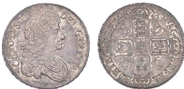
88 Crown, 1673, third bust, edge VICESIMO QVINTO (ESC 47; S 3358). Filed on edge at 9 o'clock on obverse and a little speckled haymarking, otherwise good very fine or better £900-1,200