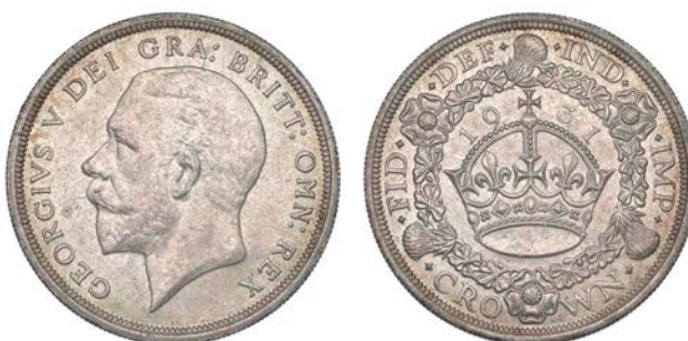
313 Crown, 1931 (ESC 371; S 4036). Extremely fine or better