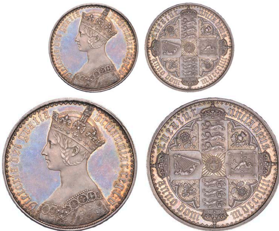
243 Proof Crown, 1853, edge DECIMO SEPTIMO, 28.25g/6h (ESC 293; S 3884). Better than extremely fine, attractively toned, very rare £7,000-9,000