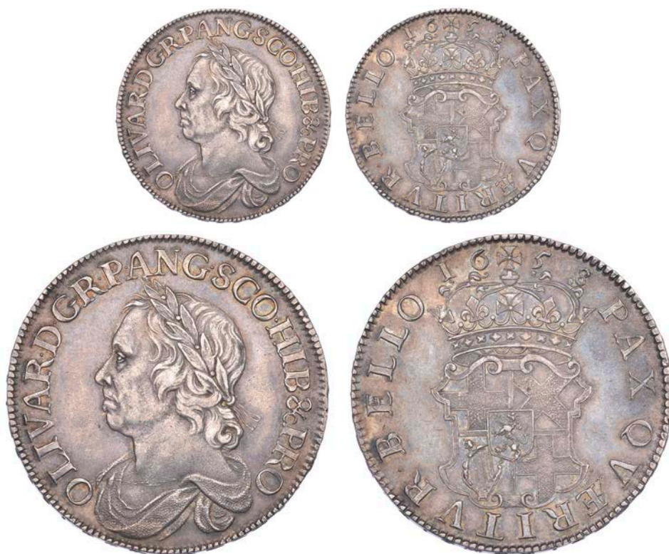
80 Crown, 1658/7 (Lessen E12; ESC 10; S 3226). Die flaw on bust in very early stage, a little wear on high spots, otherwise nearly extremely fine, lightly toned £2,500-3,000 Provenance: Glendining Auction, 19 September 1961, lot 180; bt B. Grover