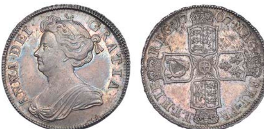
121 Halfcrown, 1707, edge SEPTIMO (ESC 574; S 3604). Extremely fine or better, attractively toned £600-800