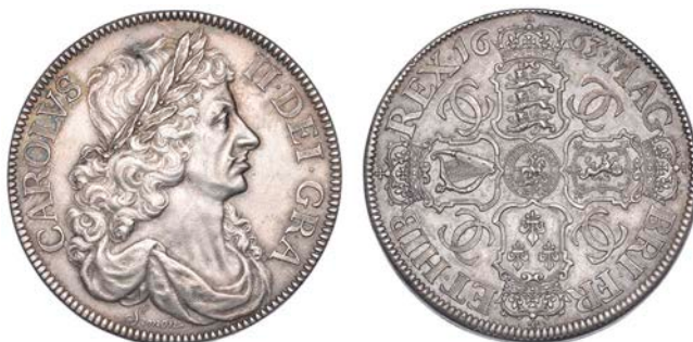
87 Petition Crown, 1663, by T. Simon, an electrotype copy with lettered edge, 32.35g/12h (cf. ESC 72; cf. S 3354A). Well made, extremely fine £250-300