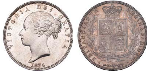
273 Halfcrown, 1874 (ESC 692; S 3889). Obverse bagmarked, otherwise good extremely fine