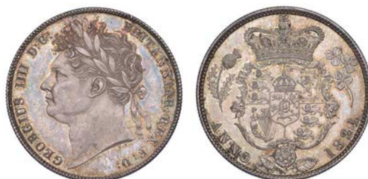
217 Halfcrown, 1821 (ESC 631; S 3807). Extremely fine or better with proof-like fields