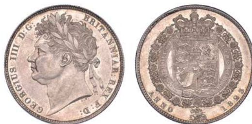
219 Halfcrown, 1823, type 2 (ESC 634; S 3808). Good extremely fine