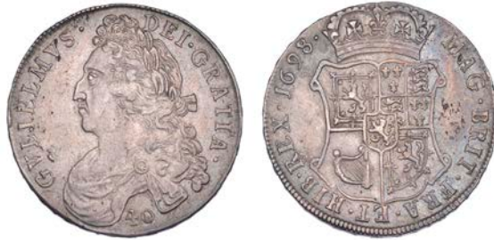
367 Forty Shillings, 1698, edge DECIMO (SCBI 35, 1744; B 7, fig. 1074; S 5683). Good very fine, toned, rare £400-600