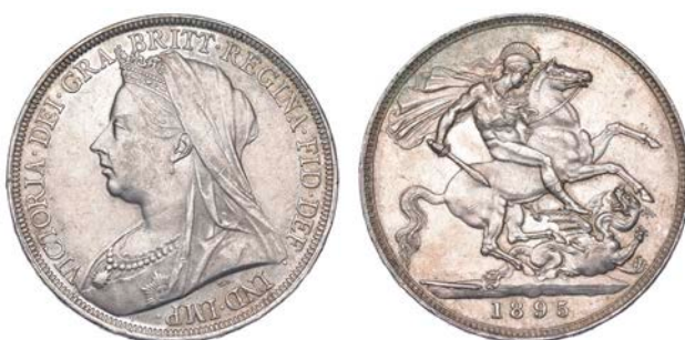
254 Crown, 1895, edge LIX (ESC 309; S 3937). Extremely fine or better