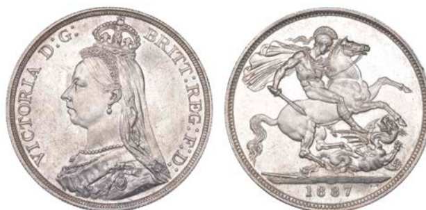
244 Crown, 1887 (ESC 296; S 3921). An early strike, virtually mint state £100-150