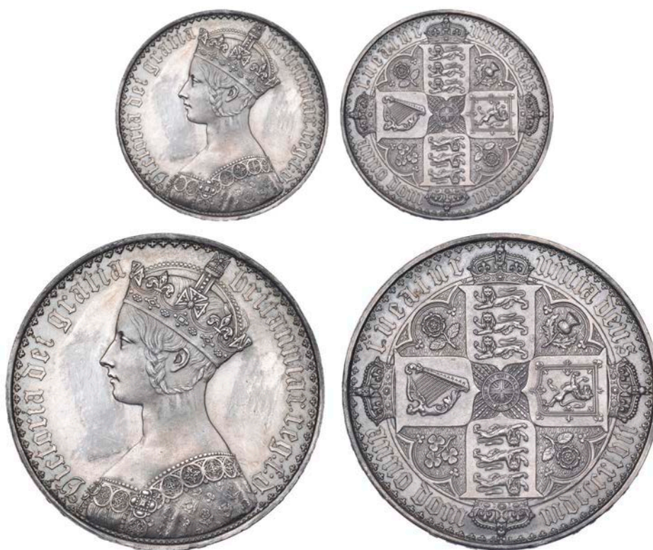
239 Crown, 1847, edge UNDECIMO (ESC 288; S 3883). Some hairlining, otherwise extremely fine, reverse better