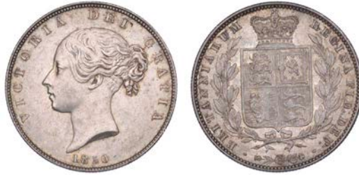
272 Halfcrown, 1850 (ESC 684; S 3888). Better than extremely fine, lightly toned