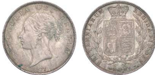
275 Halfcrown, 1877 (ESC 700; S 3889). Surface verdigris, otherwise extremely fine or better