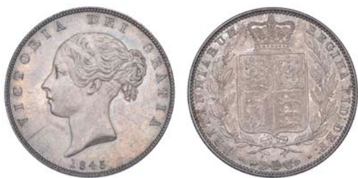
268 Halfcrown, 1845 (ESC 679; S 3888). Light scratches on face and hair, otherwise about extremely fine, toned £250-300