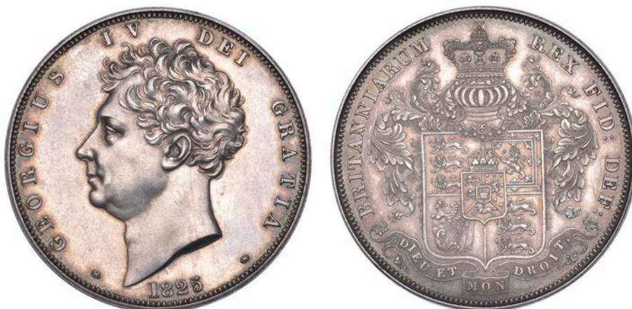
211 Pattern Crown, 1825, by W. Wyon and J.B. Merlen, in silver, bust left, rev. crowned decorated arms, edge plain, raised rims, 27.97g/6h (Davies 150E; L & S 20; ESC 255). Extremely fine, reverse better, lightly toned, very rare