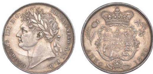
215 Halfcrown, 1820 (ESC 628; S 3807). Nearly extremely fine