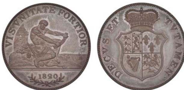
196 Pattern Crown, 1820, by J.-P. Droz after Monneron's pattern by G. Dupré, in copper, Hercules seated, attempting to break sticks across his knee, rev. crowned arms, edge plain, 27.88g/12h (L & S 212; ESC 244; Selig 1209). Better than extremely fine, very rare