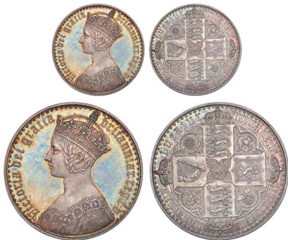
242 Proof Crown, 1847, edge plain, 27.63g/12h (ESC 291; S 3883). Some hairlines, otherwise good extremely fine, lightly toned, rare £2,500-3,000

Provenance: Glendining Auction, 25 March 1957, lot 229; bt B. Grover