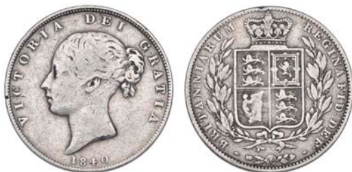
263 Halfcrown, 1840 (ESC 673; S 3887). A couple of edge knocks, otherwise fine