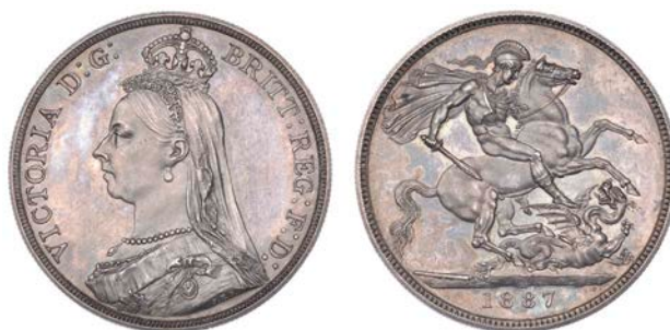
246 Proof Crown, 1887 (ESC 297; S 3921). Some hairlining, otherwise better than extremely fine, toned £400-500