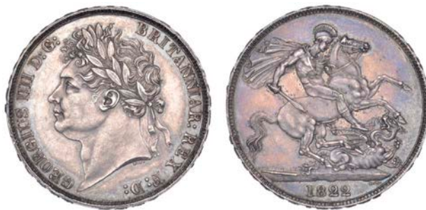
209 Crown, 1822, edge SECUNDO (ESC 251; S 3805). Extremely fine Provenance: Bt L. Sverdloff