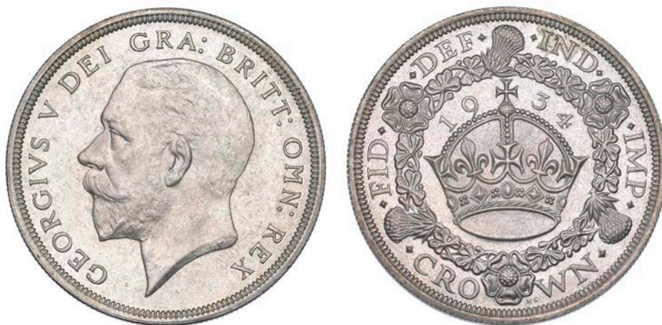
316 Crown, 1934 (ESC 374; S 4036). Virtually as struck with proof-like fields, rare