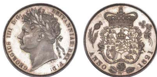
218 Proof Halfcrown, 1821, rev. with heavier garniture and fewer sections to thistle leaves, edge grained, 14.12g/6h (ESC 632; S 3807). Some hairlining, otherwise good extremely fine, rare Provenance: Glendining Auction, 31 January 1958, lot 93 (part); bt L. Sverdlhoff