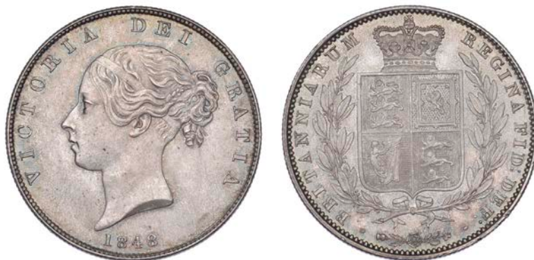
270 Halfcrown, 1848 (ESC 681; S 3888). Better than extremely fine, lightly toned, very rare £1,200-1,500