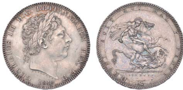
193 Crown, 1819, edge LX (ESC 215; S 3787). Extremely fine or better Provenance: Bt L. Sverdloff