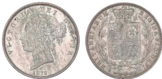
276 Halfcrown, 1878 (ESC 701; S 3889). Surface verdigris, otherwise extremely fine or better