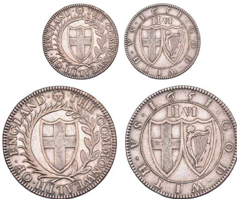
75 Pattern Halfcrown, 1651, by P. Blondeau, in silver, mm. sun on obv. only, shield in wreath of oak and palm, rev. conjoined shields, edge TRVTH AND PEACE 1651 · PETRVS BLONDÆVS INVENTOR FECIT, 14.87g/6h (ESC 444; N 2732). Nearly very fine, very rare £2,000-2,500