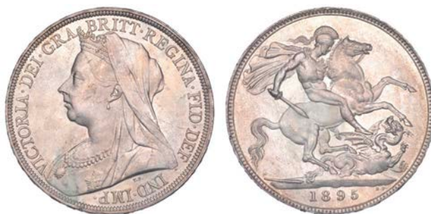
253 Crown, 1895, edge LVIII (ESC 308; S 3937). Virtually as struck, lightly toned