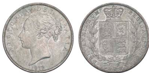
277 Halfcrown, 1879 (ESC 703; S 3889). A little surface verdigris, otherwise better than extremely fine