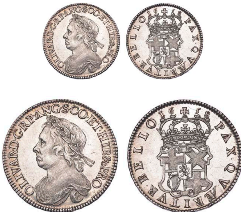
83 Halfcrown, 1658, reads HIB (Lessen I26; ESC 447; S 3227A). About extremely fine with reflective fields £2,000-2,500

It is thought that the 1656 halfcrowns were distributed at a high social level, possibly as an experiment for general circulation, hence they became souvenirs or pocket pieces (Lessen, BNJ 1966, p.169) and most exhibit considerable wear (cf. DNW 12 June 2013, lot 2)