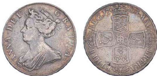
119 Halfcrown, 1703, plain, edge TERTIO (ESC 568; S 3579). Good fine, very rare