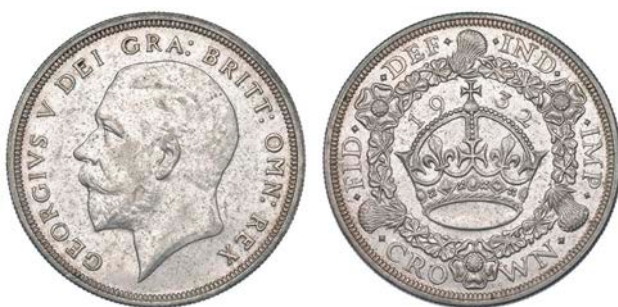
314 Crown, 1932 (ESC 372; S 4036). Some spots of verdigris, otherwise extremely fine, scarce Provenance: Bt Valerie Eaton-Mooney