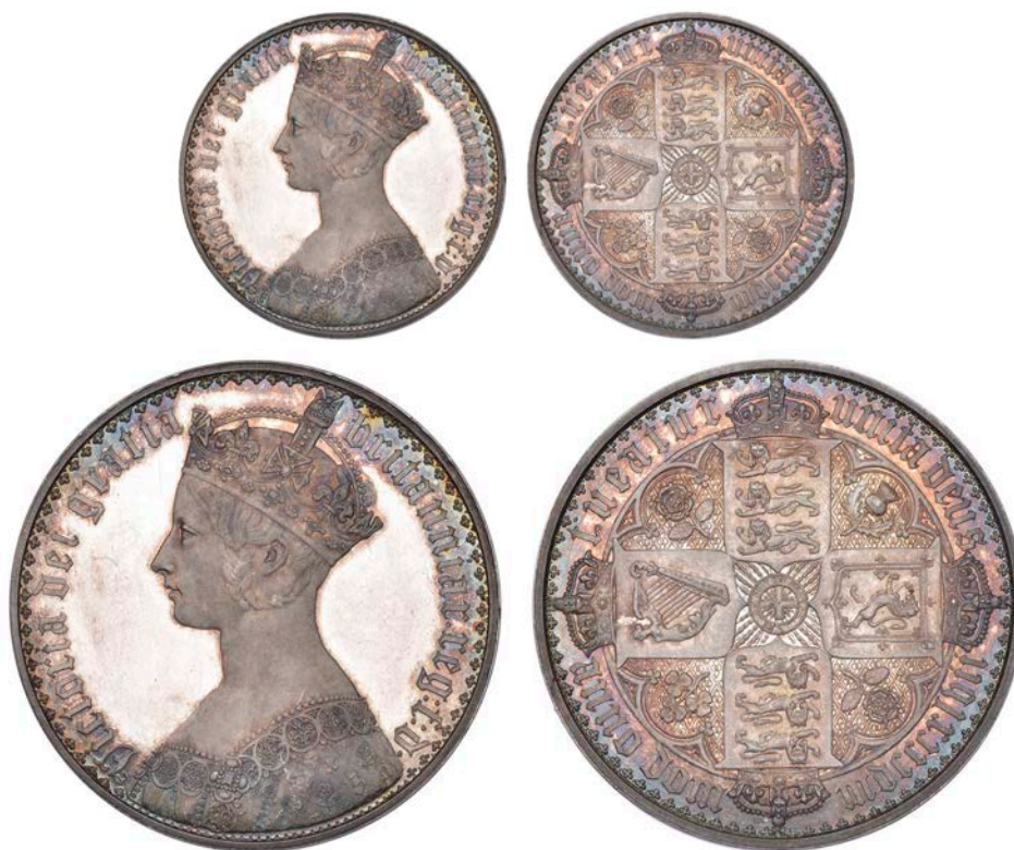
241 Proof Crown, 1847, edge plain, 27.84g/12h (ESC 291; S 3883). Some hairlines, otherwise good extremely fine, lightly toned, rare £2,500-3,000