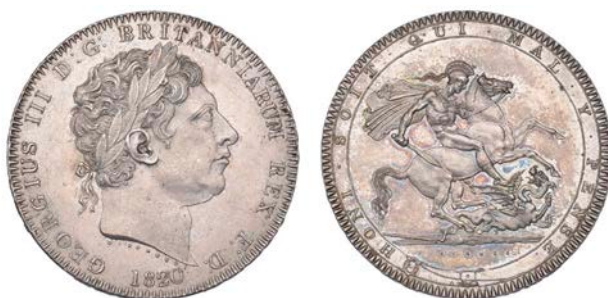
195 Crown, 1820, edge LX (ESC 219; S 3787). Good extremely fine, reverse fields proof-like