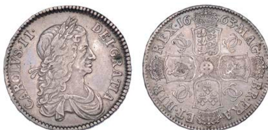
89 Halfcrown, 1663, first bust, edge xv (ESC 457; S 3361). Good very fine £400-600