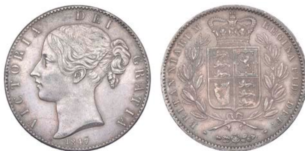
238 Crown, 1847, edge XI (ESC 286; S 3882). Good very fine