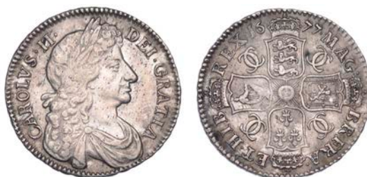
91 Halfcrown, 1677, fourth bust, edge VICESIMO NONO (ESC 479; S 3367). Lightly haymarked, otherwise better than very fine £300-400