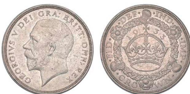
315 Crown, 1933 (ESC 373; S 4036). Extremely fine or better