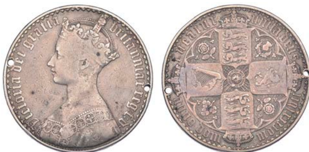
240 Crown, 1847, edge UNDECIMO (ESC 288; S 3883). Pierced at 3 and 9 o'clock, about fine, a pocket piece