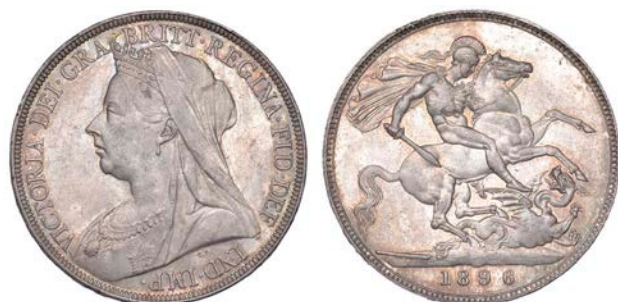
255 Crown, 1896, edge LX (ESC 311; S 3937). A few light surface marks, otherwise practically as struck, lightly toned