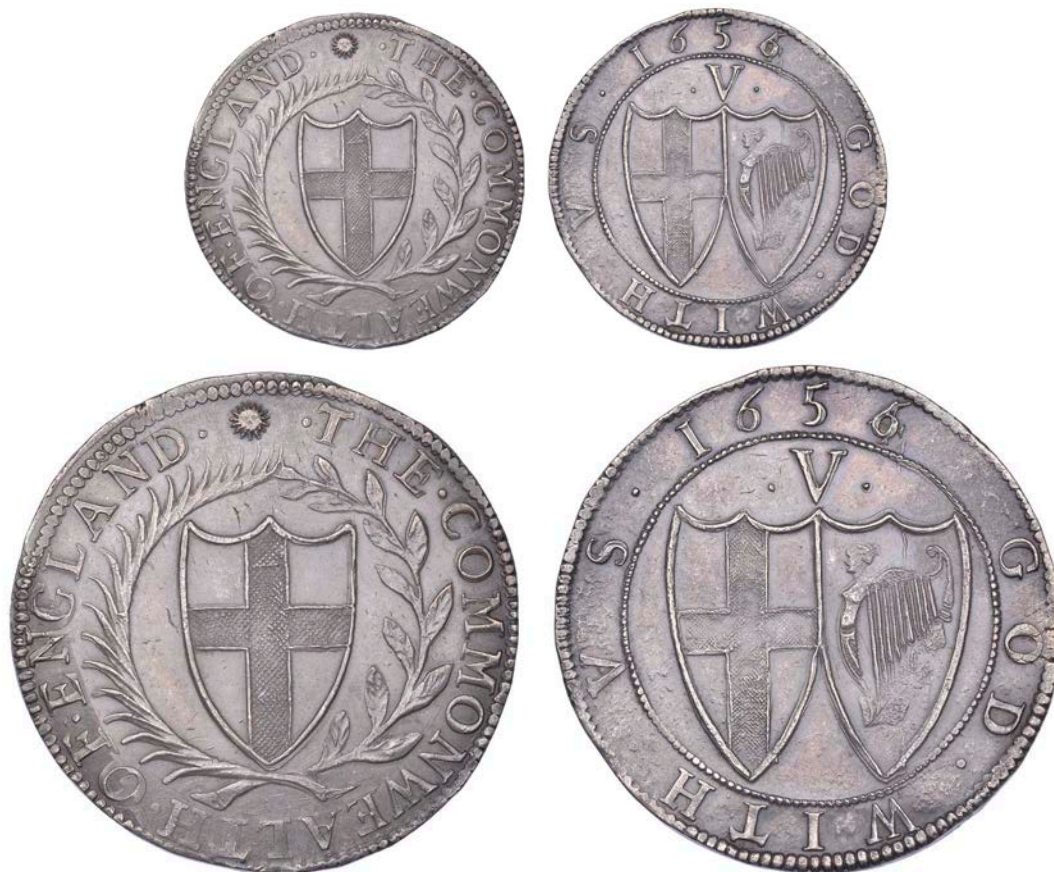
74 Crown, 1656/4, mm. sun on obv. only, small 6 in date, 29.88g/10h (ESC 9; N 2721; S 3214). Full and round, about extremely fine, toned Provenance: Bt L. Sverdlhoff £2,500-3,000