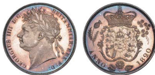
216 Proof Halfcrown, 1820, edge grained, 14.14g/6h (ESC 629; S 3807). A few surface marks, otherwise good extremely fine and toned, rare