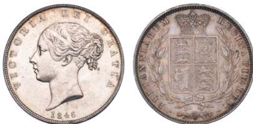
269 Halfcrown, 1846 (ESC 680; S 3888). Nearly extremely fine but obverse cleaned, with resultant hairlines £200-250