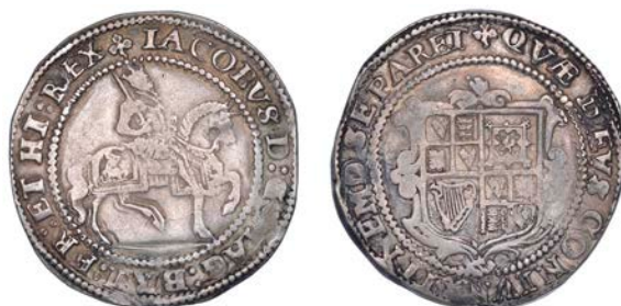
8 Third coinage, Halfcrown, mm. trefoil, 15.93g/11h (N 2122; S 2666). Nearly very fine £400-500 Provenance: Glendining Auction, 30 October 1957, lot 185 (part); bt L. Sverdloff