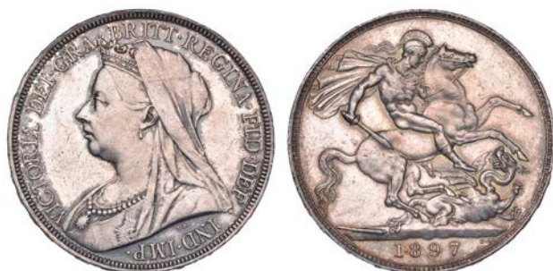
256 Crown, 1897, edge LX (ESC 312; S 3937). Extremely fine or better