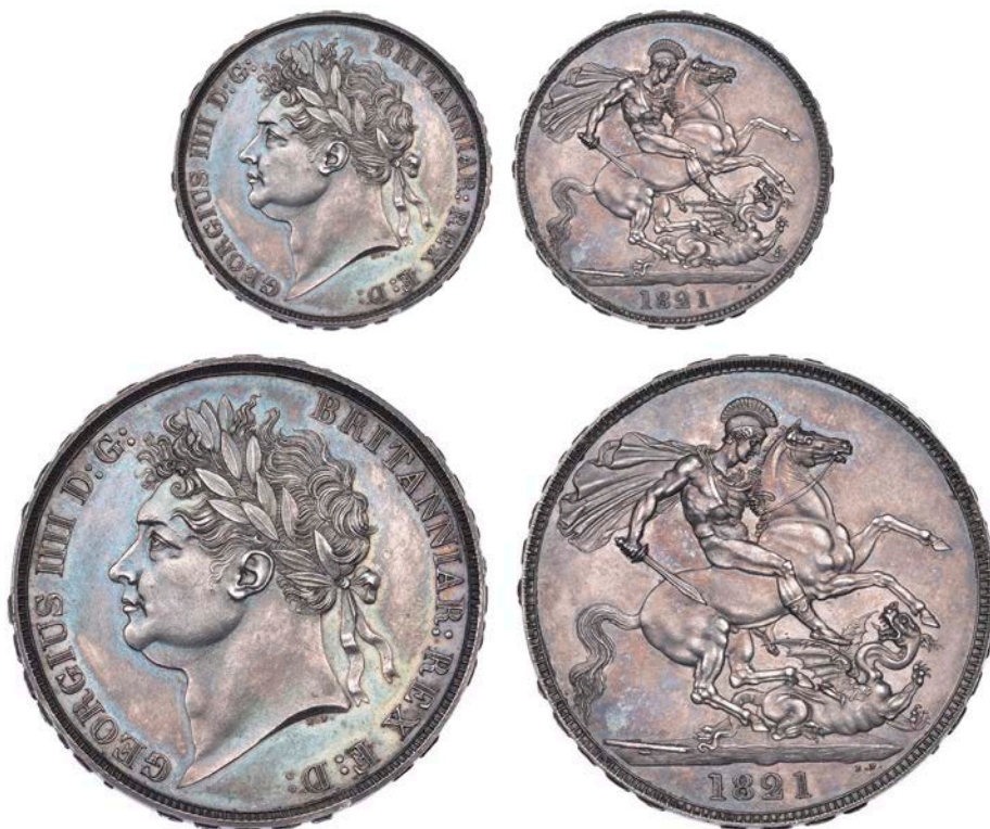
208 Proof Crown, 1821, edge TERTIO, 28.26g/6h (L & S 15; ESC 250; S 3805). Probably sometime cleaned, now retoned, extremely fine or better, very rare £1,500-2,000

Provenance: Glendining Auction, 12 May 1959, lot 345; bt B. Grover