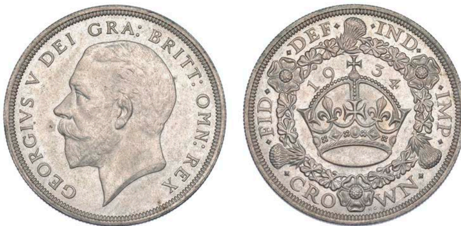
317 Crown, 1934 (ESC 374; S 4036). Extremely fine or better. rare