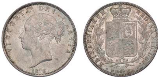
274 Halfcrown, 1876 (ESC 699; S 3889). Extremely fine or better