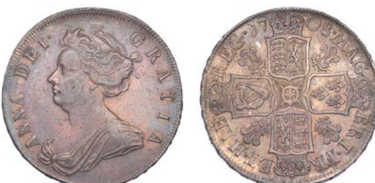
123 Halfcrown, 1708, plumes, edge SEPTIMO (ESC 578; S 3606). Good very fine, toned