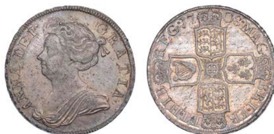
122 Halfcrown, 1708, edge SEPTIMO (ESC 577; S 3604). A little haymarked, otherwise good extremely fine, lightly toned