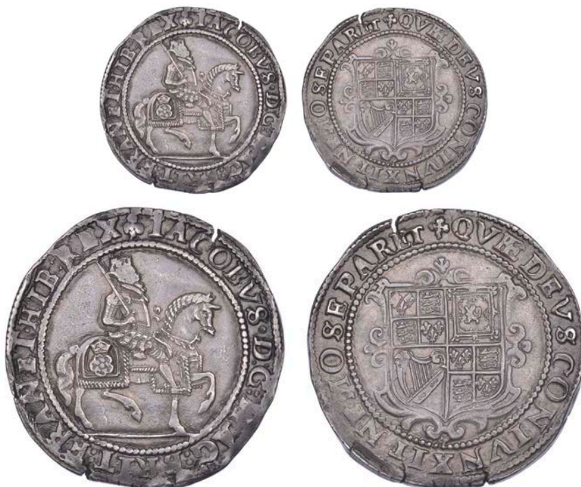
6 Third coinage, Halfcrown, mm. trefoil, 15.09g/12h (N 2122; S 2666). Small edge splits, otherwise good very fine and toned £800-1,000

Provenance: H.M. Lingford Collection, Part II, Glendining Auction, 20-1 June 1951, lot 1254