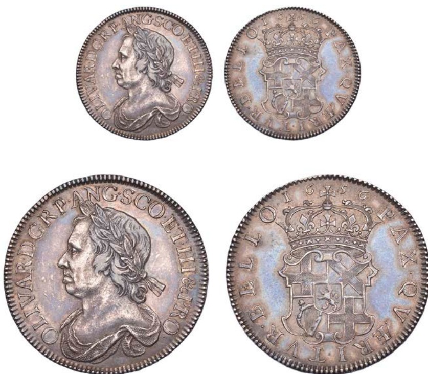
82 Halfcrown, 1656, reads HI (Lessen H25; ESC 446; S 3227). Nearly extremely fine, lightly toned, very rare £5,000-6,000

It is thought that the 1656 halfcrowns were distributed at a high social level, possibly as an experiment for general circulation, hence they became souvenirs or pocket pieces (Lessen, BNJ 1966, p.169) and most exhibit considerable wear (cf. DNW 12 June 2013, lot 2)