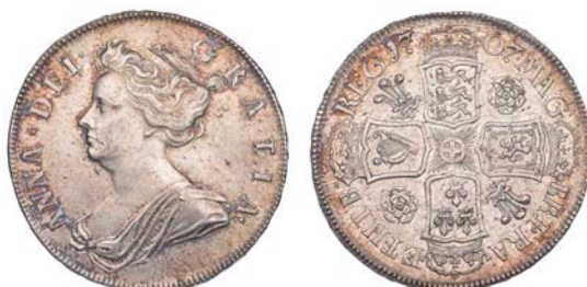
120 Halfcrown, 1707, roses and plumes, edge SEXTO (ESC 573; S 3582). Obverse hairlines, otherwise nearly extremely fine

Provenance: Bt Cutler street market, London