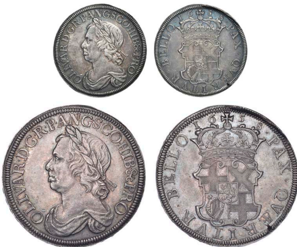
81 Crown, 1658, Tanner's copy [struck 1738], edge lettered, 27.95g/12h (Lessen G22; L & S 3; ESC 13; S 3226B). Tiny metal flaw at 5 o'clock on reverse and a small dig in front of bust, otherwise good extremely fine or better on a spread flan with wide borders and reflective fields, most attractive toning, extremely rare £10,000-15,000 Provenance: Bt Valerie Eaton-Mooney