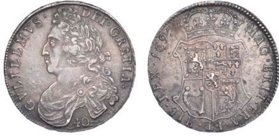
366 Forty Shillings, 1697, edge NONO (SCBI 35, 1742-3; B 6, fig. 1074; S 5682). Good very fine, toned, rare £400-600