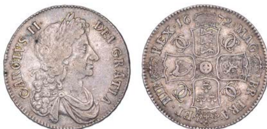
90 Halfcrown, 1672, fourth bust, edge VICESIMO QVARTO (ESC 472; S 3367). Nearly very fine, very rare £300-400