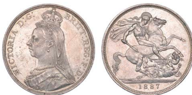
245 Crown, 1887 (ESC 296; S 3921). Good extremely fine £80-100