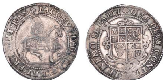
7 Third coinage, Halfcrown, mm. trefoil, 14.93g/10h (N 2122; S 2666). Very fine or better £600-800

Provenance: H.M. Lingford Collection, Part II, Glendining Auction, 20-1 June 1951, lot 1254