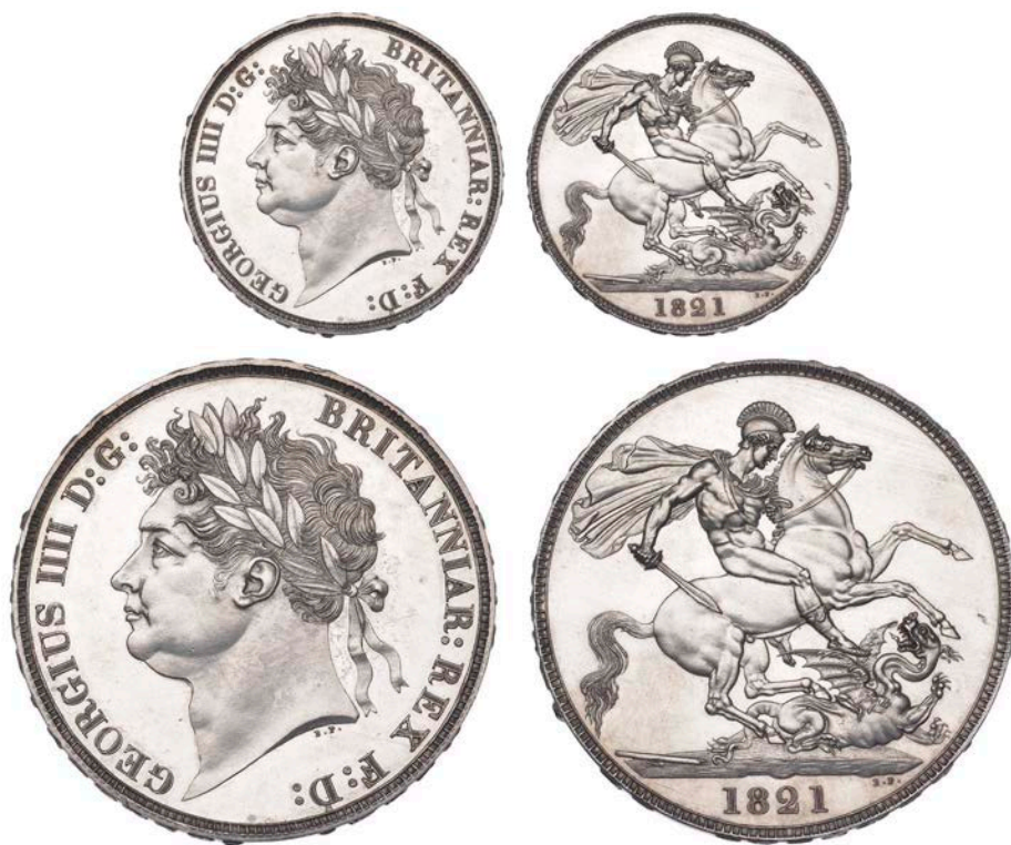
207 Proof Crown, 1821, edge SECUNDO, 28.19g/6h (L & S 10; ESC 247; S 3805). Better than extremely fine but fields hairlined, rare £1,200-1,500

Provenance: Glendining Auction, 12 May 1959, lot 345; bt B. Grover