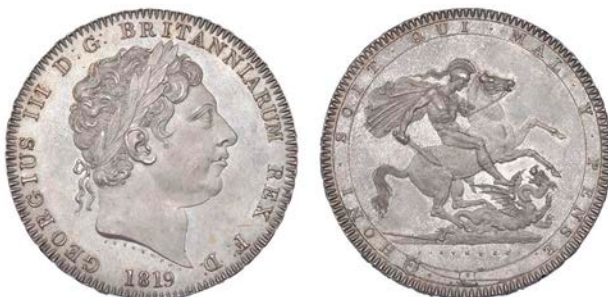
194 Crown, 1819, edge LX (ESC 216; S 3787). A few minor surface marks, otherwise good extremely fine with reflective fields, lightly toned