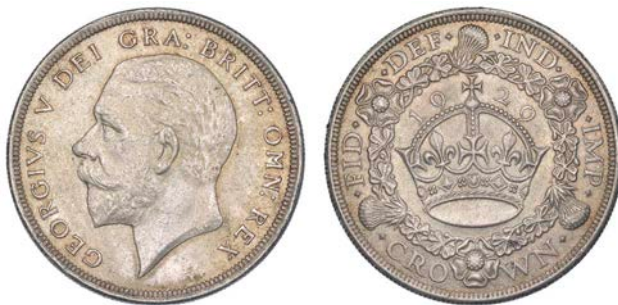
311 Crown, 1929 (ESC 369; S 4036). Better than extremely fine