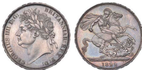
210 Crown, 1822, edge TERTIO (ESC 252; S 3805). Mark on neck, otherwise extremely fine or better with proof-like fields, lightly toned Provenance: Bt L. Sverdloff