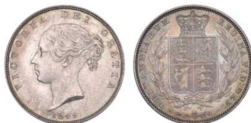
271 Halfcrown, 1849, large date (Davies 573; ESC 683; S 3888). Better than extremely fine, attractively toned £600-800