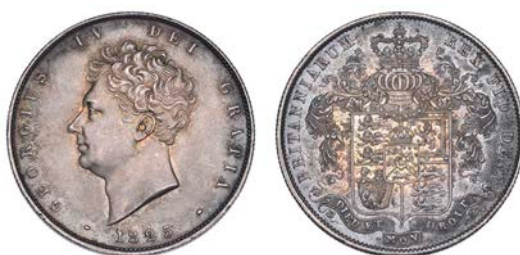
220 Halfcrown, 1825 (ESC 642; S 3809). Extremely fine or better, toned