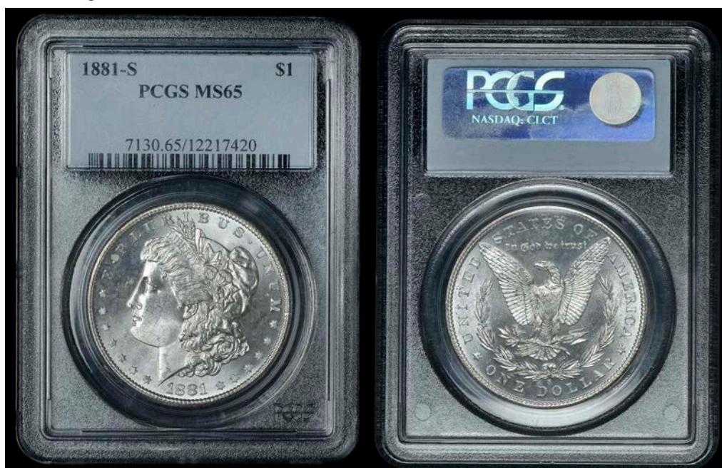
2586 Dollar, 1881s. Virtually as struck, proof-like surfaces Slabbed in PCGS holder, graded MS 65