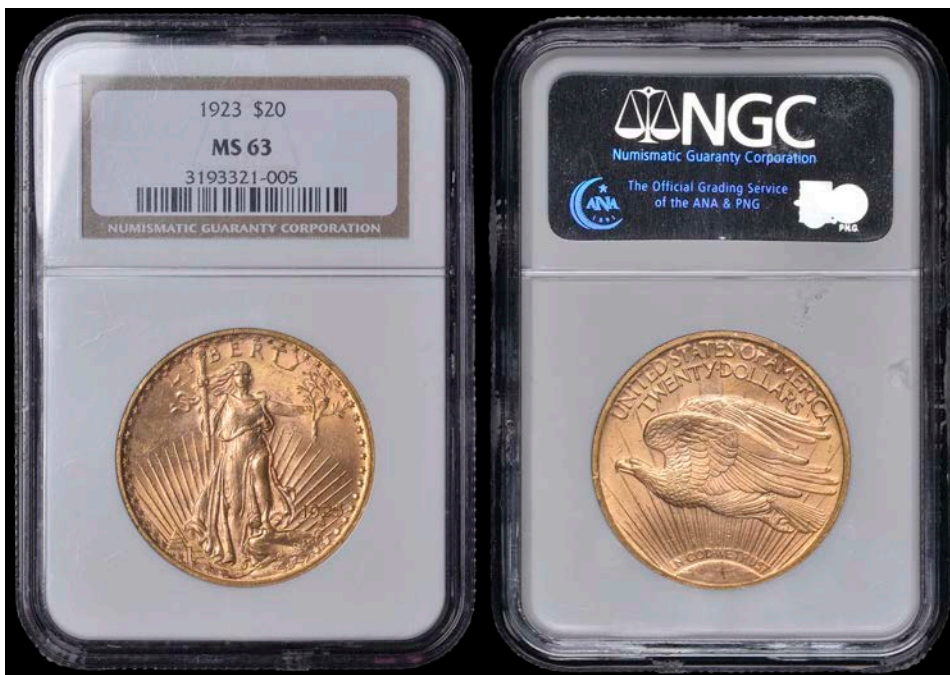
2510 Twenty Dollars, 1923. Some bagmarks, otherwise virtually mint state Slabbed in NGC holder, graded MS 63