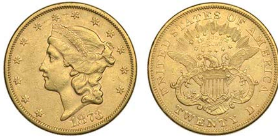
🔗 2501 Twenty Dollars, 1873, open 3. Some surface marks, otherwise nearly extremely fine