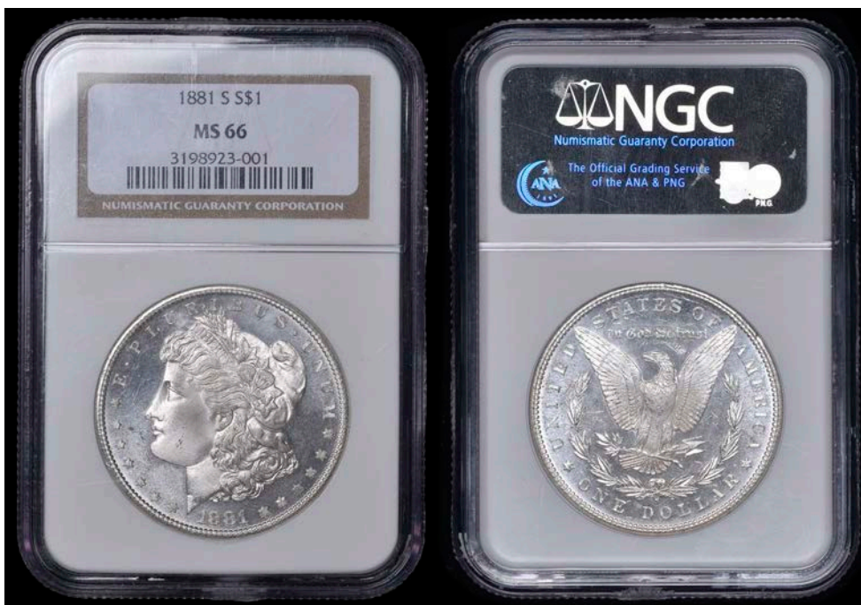
2585 Dollar, 1881s. Virtually mint state with frosted details Slabbed in NGC holder, graded MS 66