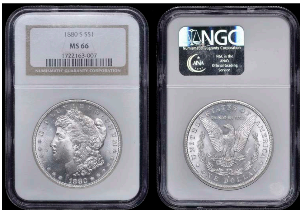
2573 Dollar, 1880s. Virtually mint state with frosted details Slabbed in NGC holder, graded MS 66