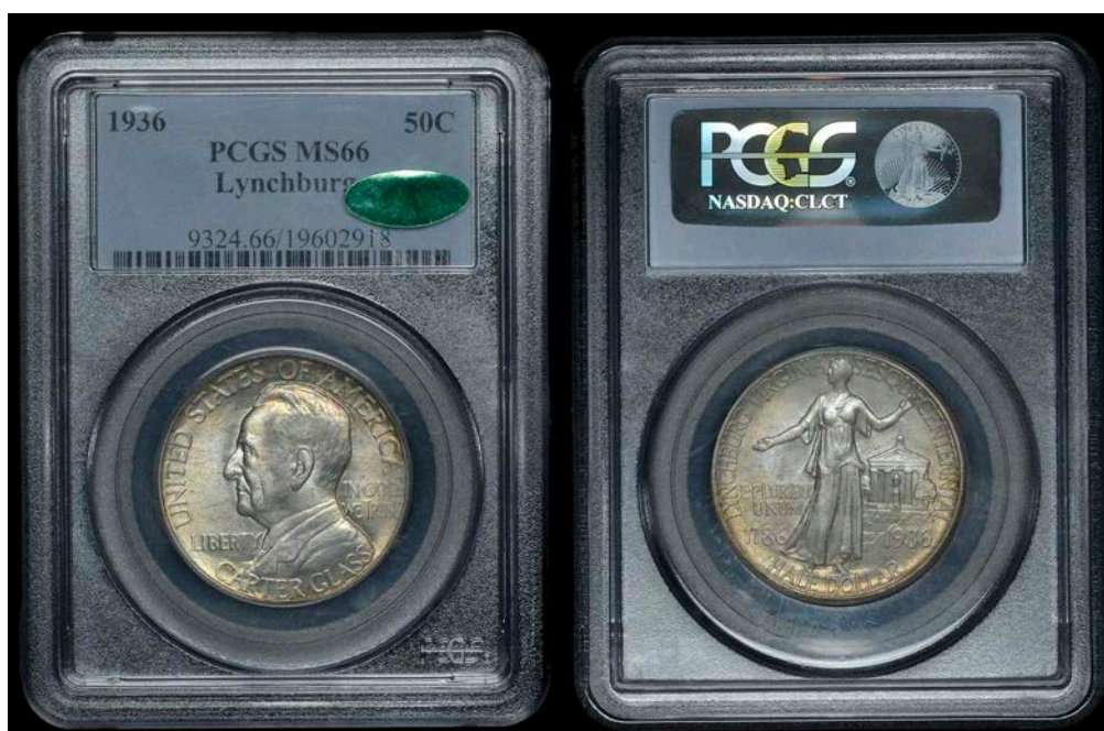
2777 Half-Dollar, 1936, Lynchburg. Practically mint state Slabbed in PCGS holder, graded MS 66 CAC