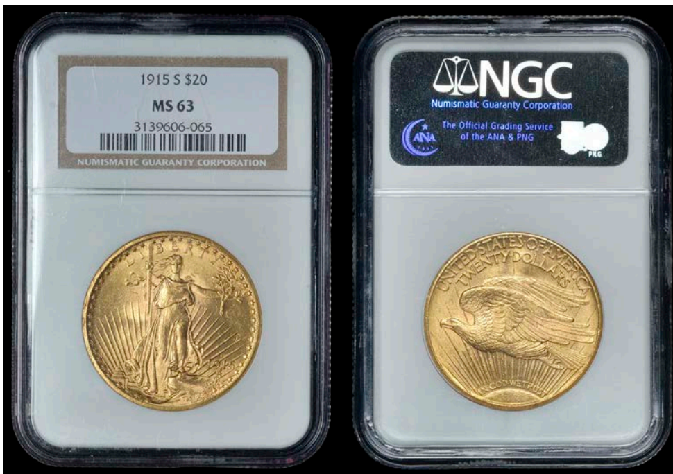
2507 Twenty Dollars, 1915s. Virtually as struck Slabbed in NGC holder, graded MS 63