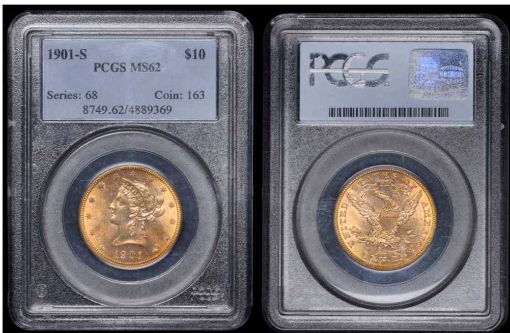
🌀 2525 Ten Dollars, 1901s. Surfaces bagmarked, otherwise practically as struck £600-700 Slabbed in PCGS holder, graded MS 62