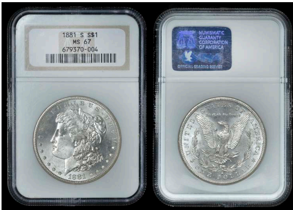
2583 Dollar, 1881s. Practically mint state with cartwheel reflections Slabbed in NGC holder, graded MS 67