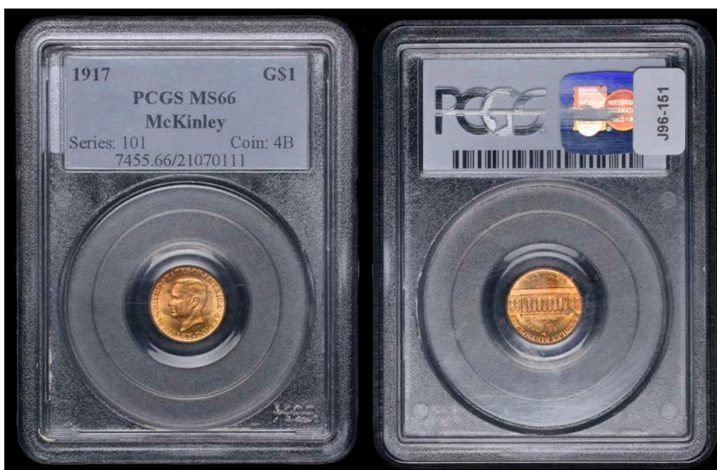
2547 Gold Dollar, 1917, McKinley Memorial. Virtually mint state Slabbed in PCGS holder, graded MS 66