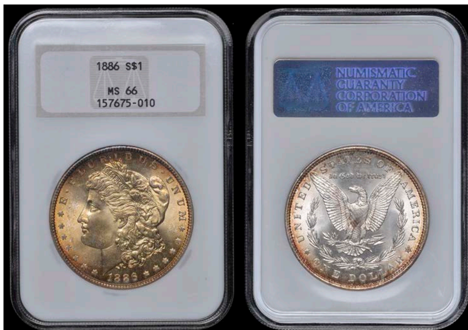
2683 Dollar, 1886. Virtually mint state, obverse with orange-bronze toning Slabbed in NGC holder, graded MS 66