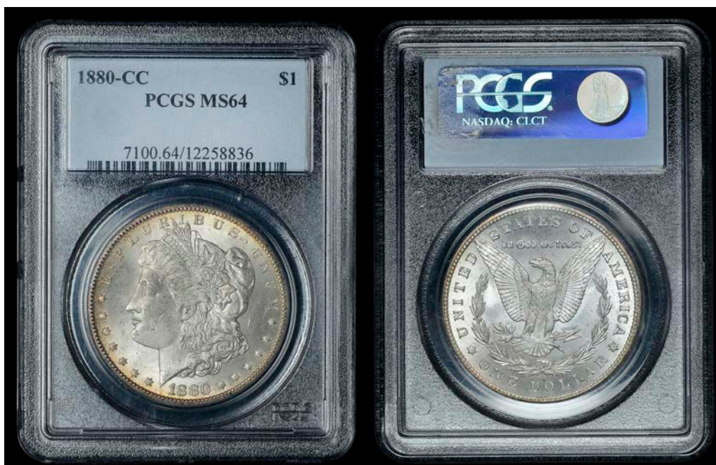
2569 Dollar, 1880cc. Minimal marks on frosty surfaces, otherwise practically mint state Slabbed in PCGS holder, graded MS 64