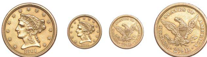
☞ 2538 Two-and-a-Half-Dollars, 1861, type 2. Possible mount removed at 12 o'clock, otherwise good very fine £200-250