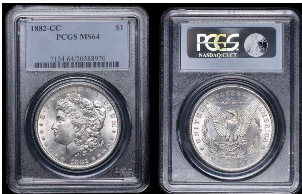
2603 Dollar, 1882cc. Light scratch on face, otherwise practically as struck Slabbed in PCGS holder, graded MS 64