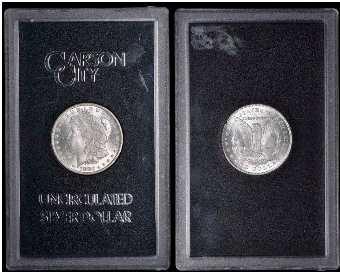
2568 Dollar, 1880cc, reverse of 1878. Virtually mint state; in sealed plastic case