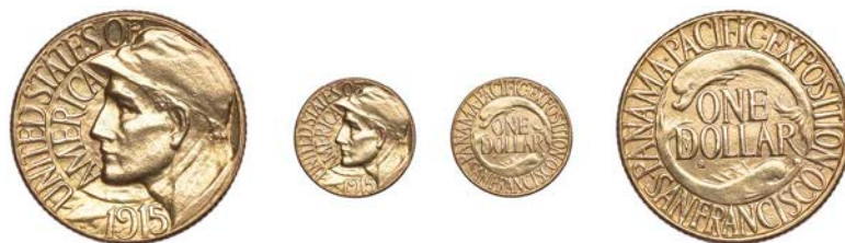
2546 Gold Dollar, 1915s, Panama-Pacific Exposition. Probably sometime cleaned, otherwise extremely fine or better