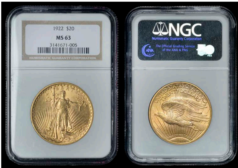
2509 Twenty Dollars, 1922. Practically as struck Slabbed in NGC holder, graded MS 63