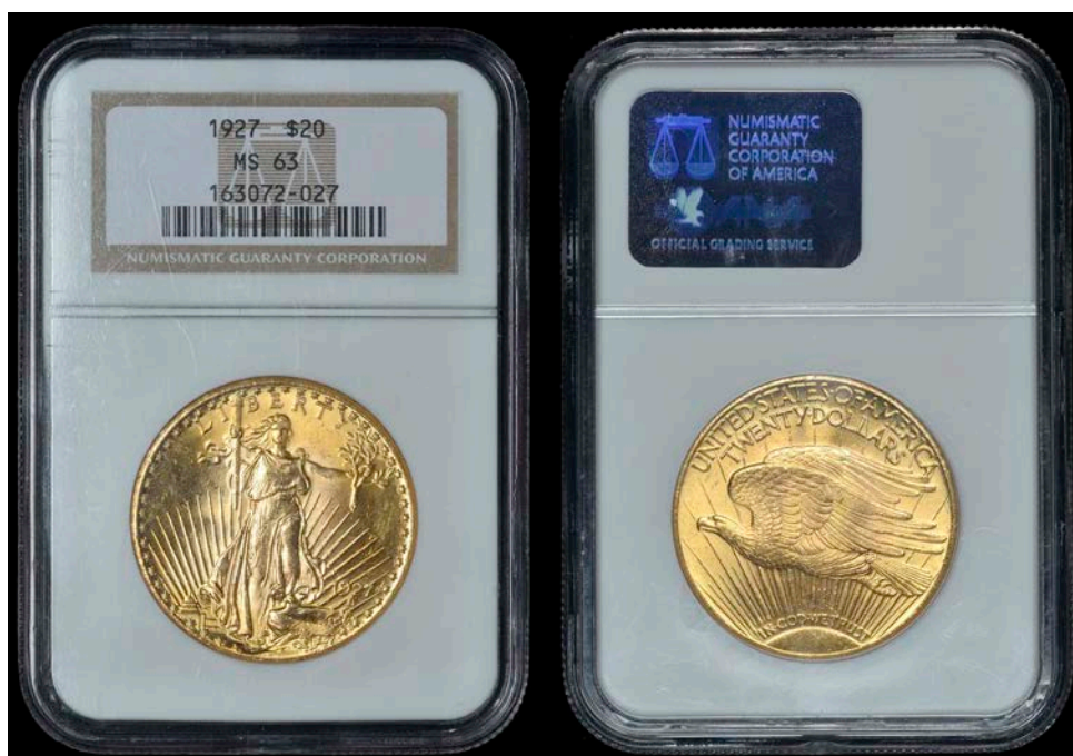
2516 Twenty Dollars, 1927. Virtually mint state Slabbed in NGC holder, graded MS 63