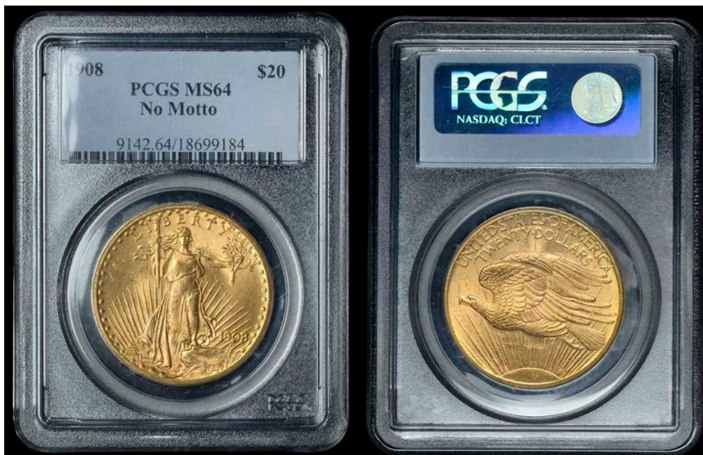
2505 Twenty Dollars, 1908, no motto. Practically mint state Slabbed in PCGS holder, graded MS 64