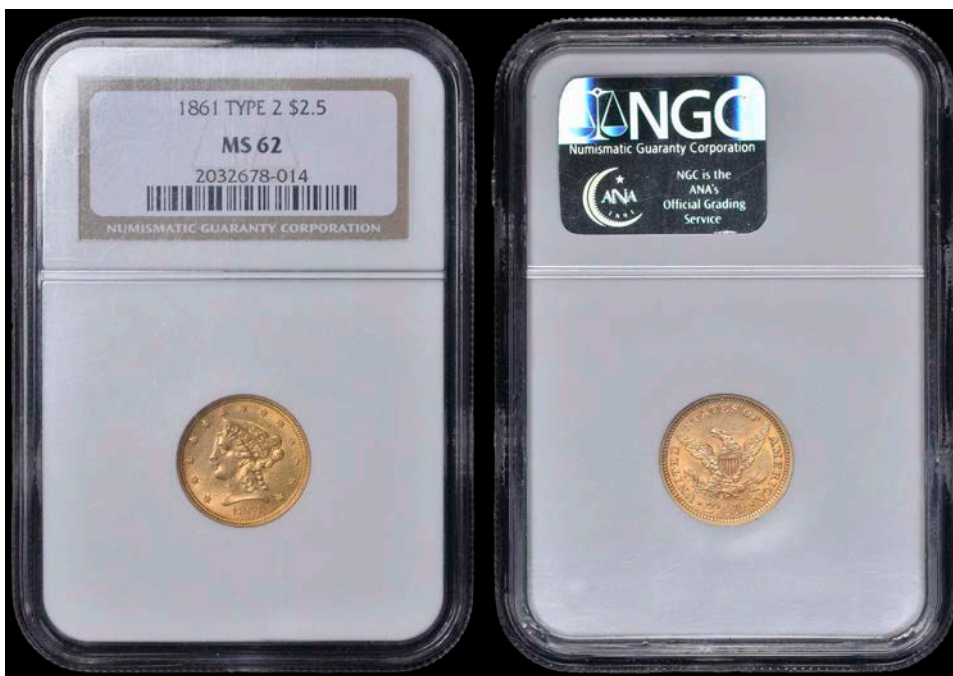
☞ 2537 Two-and-a-Half-Dollars, 1861, type 2. Good extremely fine or better £450-550 Slabbed in NGC holder, graded MS 62