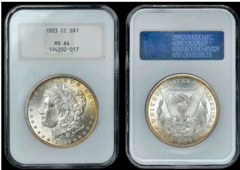
2619 Dollar, 1883cc. Minimal bagmarking, otherwise virtually mint state Slabbed in NGC holder, graded MS 64