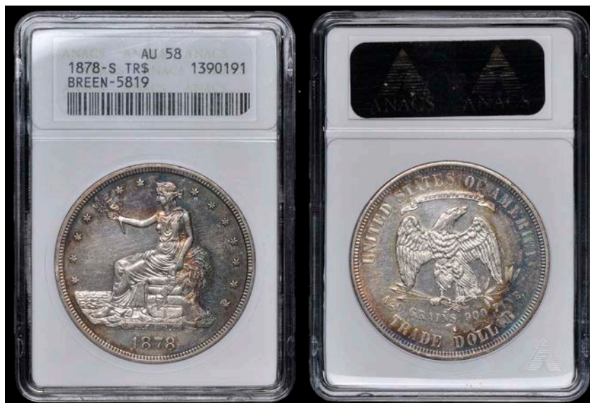
2770 Trade Dollar, 1878s. Some surface marks, otherwise better than extremely fine with patchy tone Slabbed in ANACS holder, graded AU 58