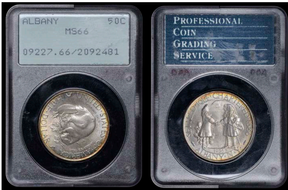
2775 Half-Dollar, 1936, Albany. Virtually mint state with pale peripheral toning Slabbed in early PCGS holder, graded MS 66