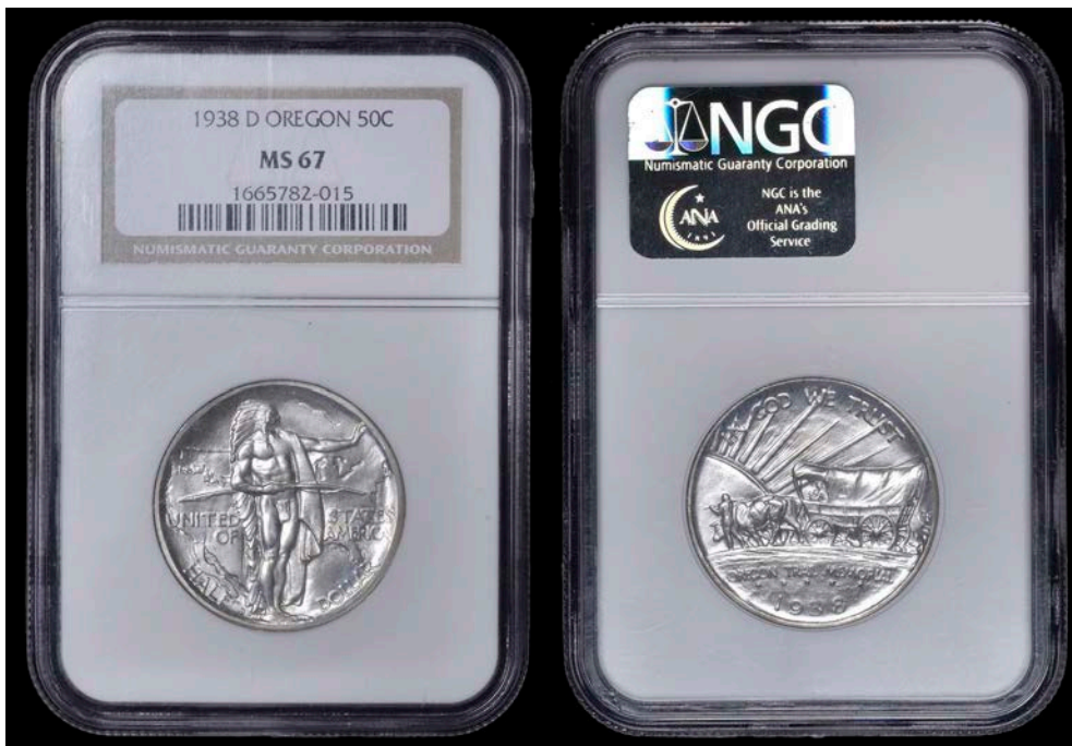
2783 Half-Dollar, 1938b, Oregon. Practically as struck Slabbed in NGC holder, graded MS 67