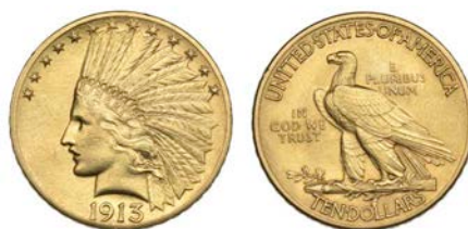
🌀 2532 Ten Dollars, 1913. A few small surface marks, otherwise practically as struck £500-600