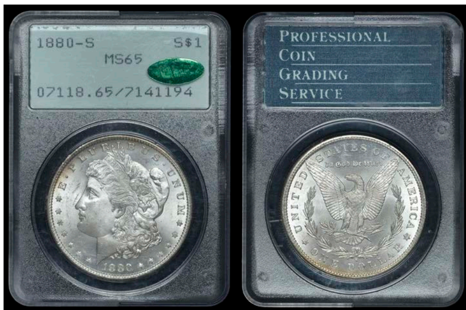
2572 Dollar, 1880s. Practically mint state Slabbed in PCGS holder, graded MS 65 CAC