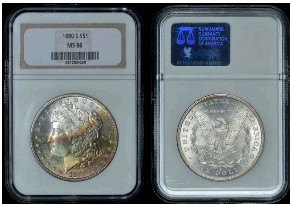
2571 Dollar, 1880s. Practically mint state, obverse with partial rainbow tone Slabbed in NGC holder, graded MS 66