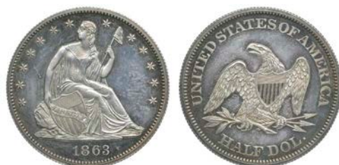
2772 Proof Half-Dollar, 1863, edge grained, 12.44g/6h. Possibly lightly lacquered at some time, a few light marks and hairlines, otherwise virtually as struck with much brilliance, toned