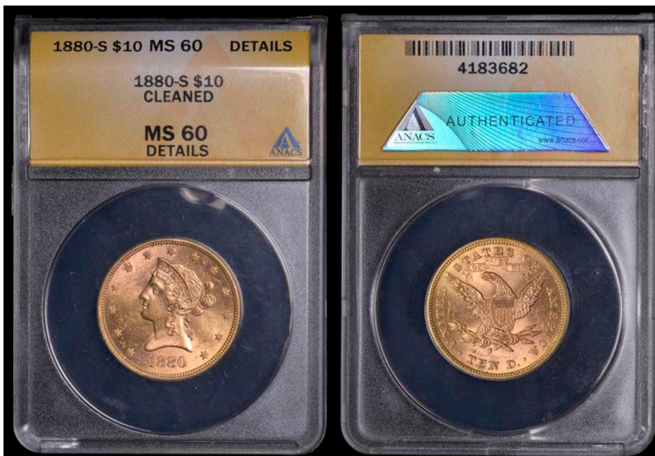
2518 Ten Dollars, 1880s. Good extremely fine

Slabbed in ANACS holder, graded MS 60 Details, Cleaned (in the opinion of the cataloguer this coin has not been cleaned)