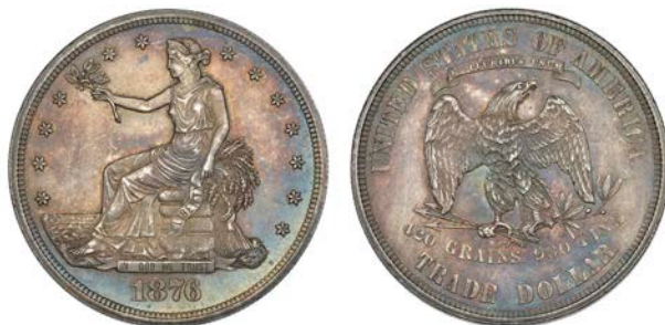
2769 Trade Dollar, 1876. A few surface marks, otherwise better than extremely fine, attractively toned