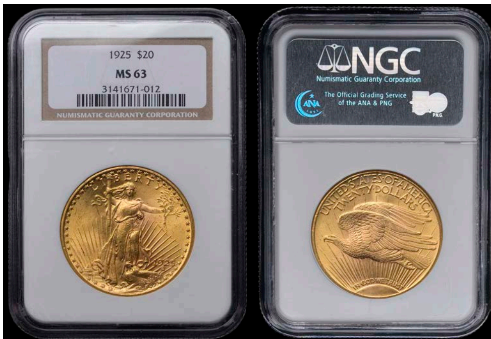
2514 Twenty Dollars, 1925. Virtually as struck Slabbed in NGC holder, graded MS 63