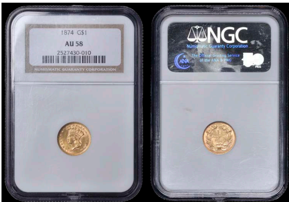
2544 Gold Dollar, 1874. Good extremely fine Slabbed in NGC holder, graded AU 58