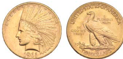
🌀 2529 Ten Dollars, 1911. A few bagmarks and edge nicks, otherwise good extremely fine £600-700