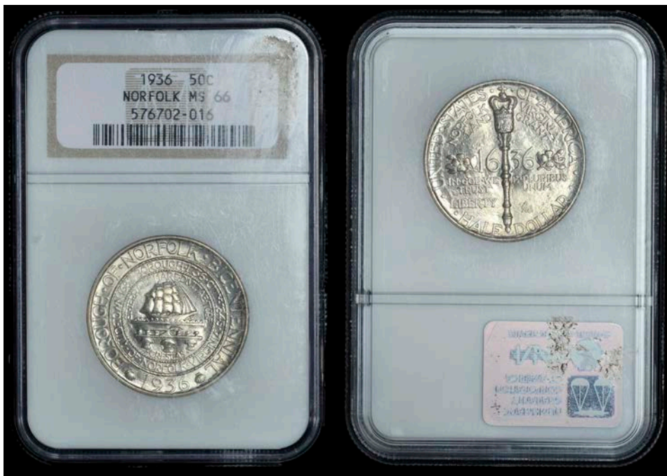
2778 Half-Dollar, 1936, Norfolk. Virtually mint state Slabbed in NGC holder, graded MS 66