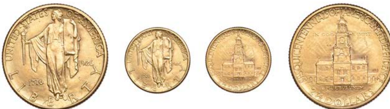
☞ 2541 Two-and-a-Half-Dollars, 1926, Independence Sesquicentennial. Virtually mint state £400-600