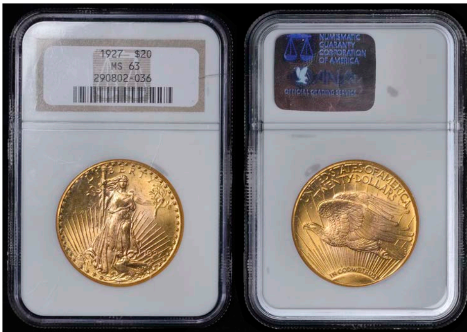
2517 Twenty Dollars, 1927. Some bagmarks, otherwise virtually as struck Slabbed in NGC holder, graded MS 63