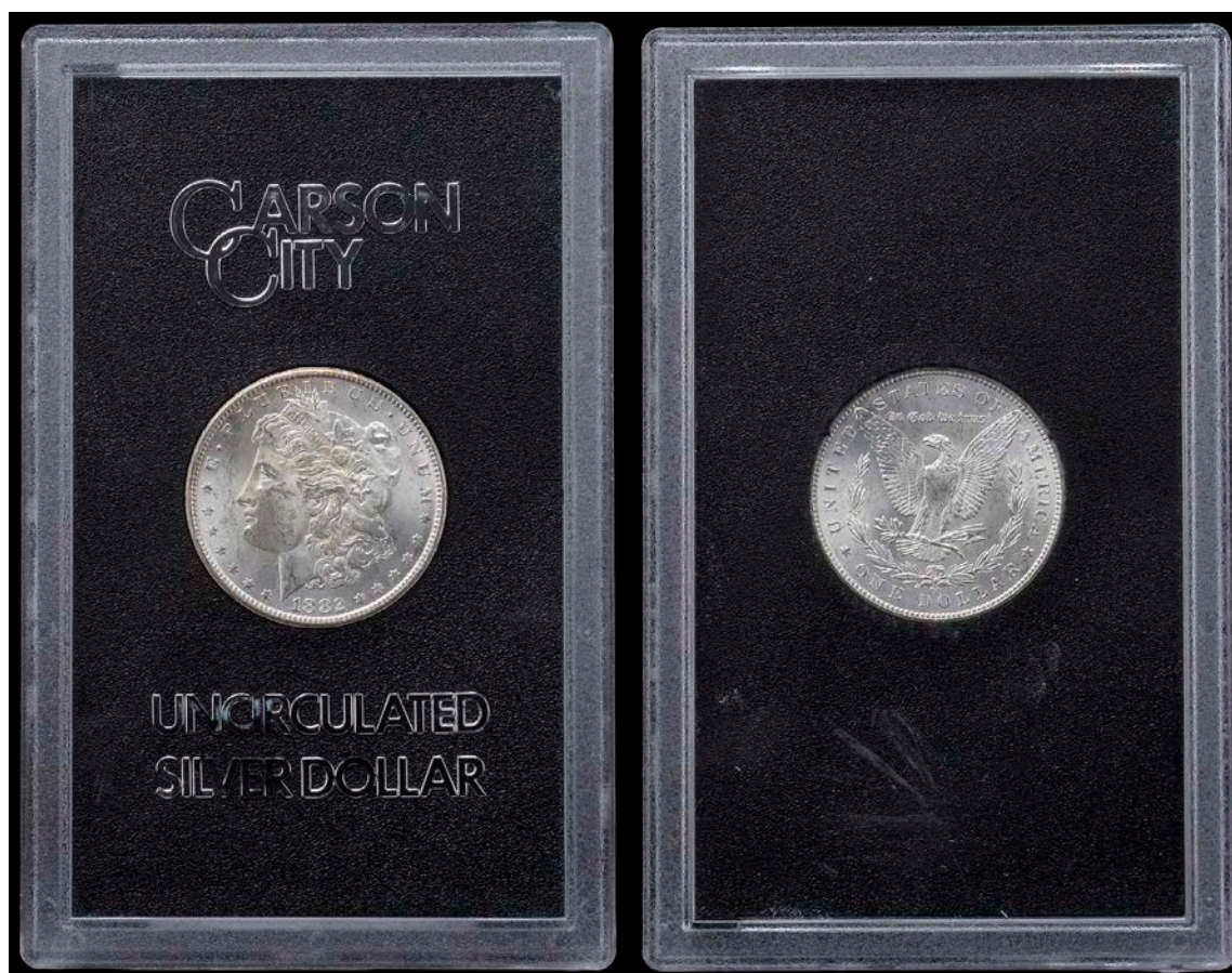
2604 Dollar, 1882cc, doubled date and ear (VAM-3D). Some bagmarking, otherwise virtually as struck, very rare; in plastic holder and black cardboard box of issue