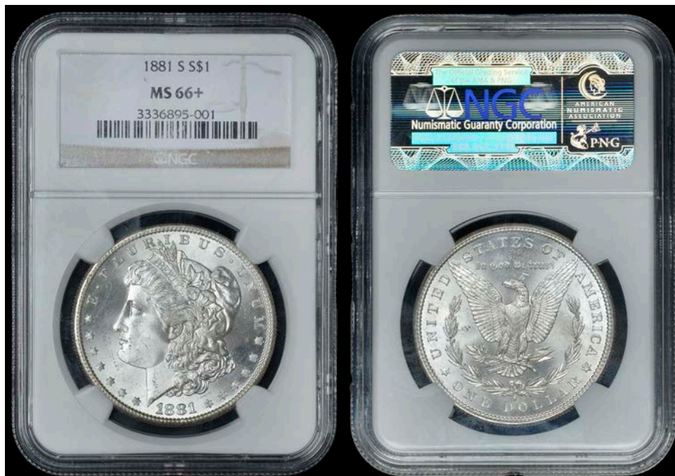
2584 Dollar, 1881s. Virtually as struck with cartwheel reflections Slabbed in NGC holder, graded MS 66+