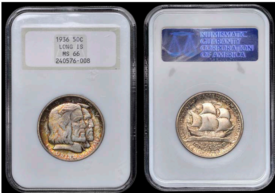
2776 Half-Dollar, 1936, Long Island. Virtually as struck, dappled bronze toning Slabbed in NGC holder, graded MS 66