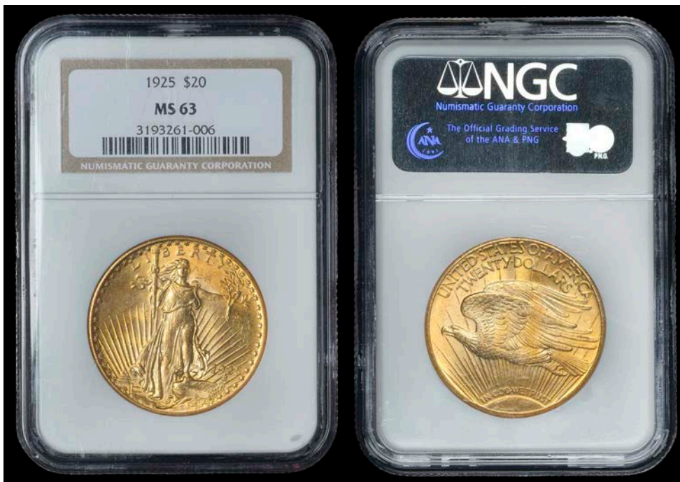
2515 Twenty Dollars, 1925. Virtually as struck Slabbed in NGC holder, graded MS 63