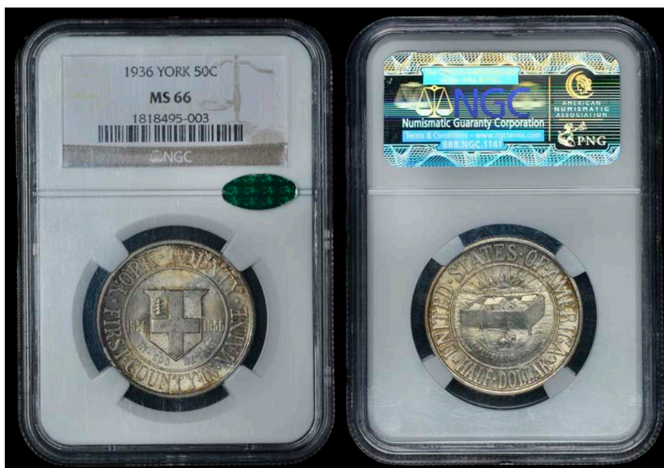
2779 Half-Dollar, 1936, York. Virtually mint state, lightly toned Slabbed in NGC holder, graded MS 66 CAC