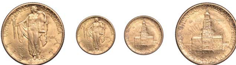
☞ 2542 Two-and-a-Half-Dollars, 1926, Independence Sesquicentennial. Virtually mint state £400-600