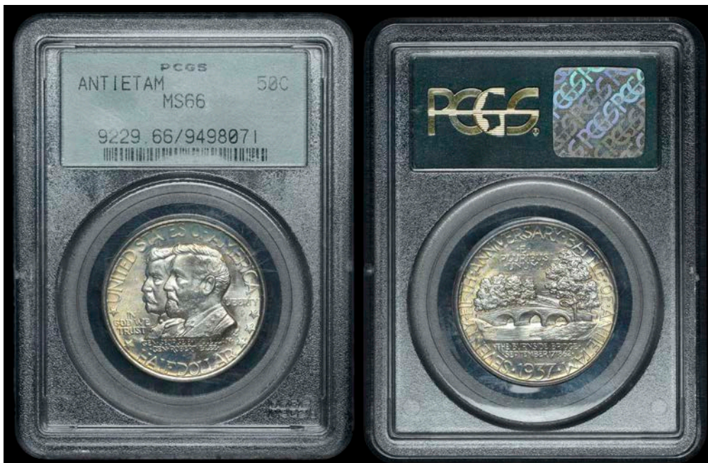
2780 Half-Dollar, 1937, Antietam. Virtually mint state Slabbed in PCGS holder, graded MS 66