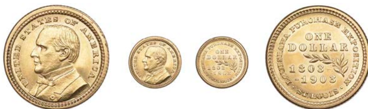
2545 Gold Dollar, 1903, Louisiana Purchase Exposition, William McKinley. Practically mint state