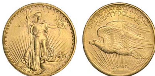
2506 Twenty Dollars, 1914s. Small reverse rim nick at 2 o'clock and a few bagmarks, otherwise virtually as struck