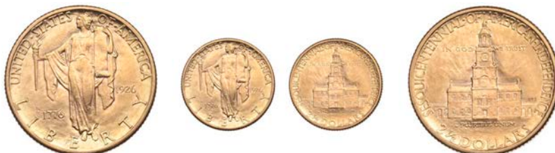
☞ 2540 Two-and-a-Half-Dollars, 1926, Independence Sesquicentennial. Virtually mint state £400-600