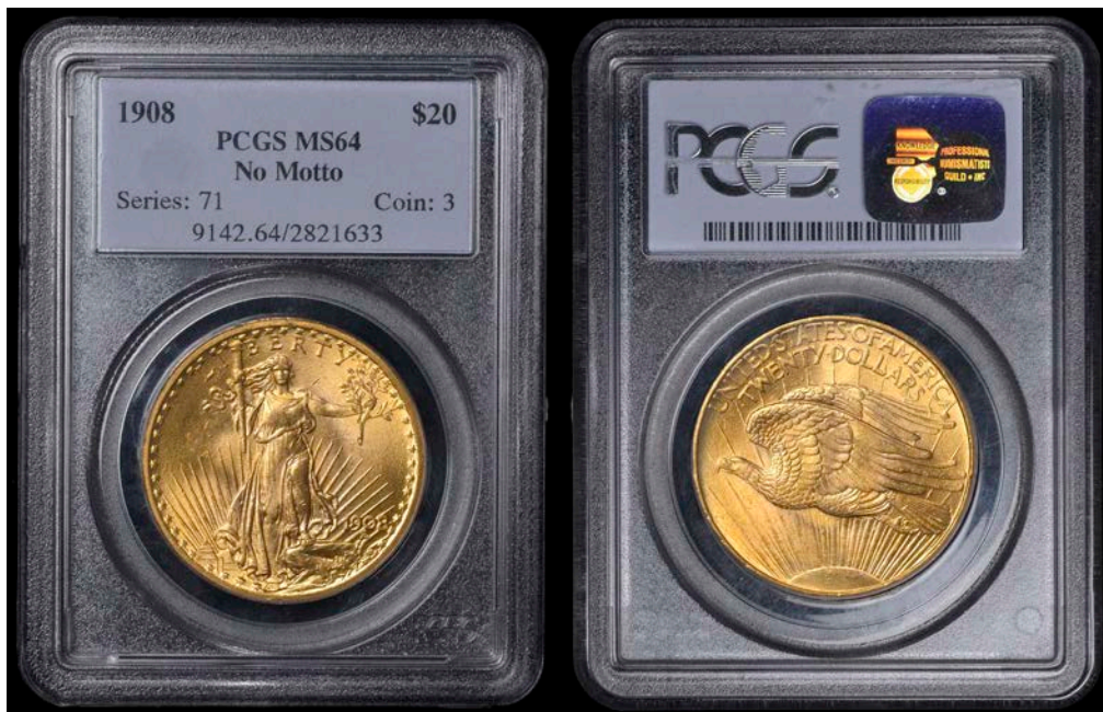
2504 Twenty Dollars, 1908, no motto. Practically mint state Slabbed in PCGS holder, graded MS 64