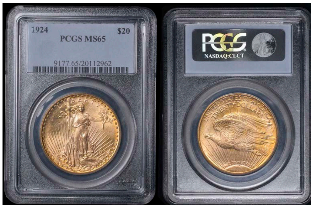
2512 Twenty Dollars, 1924. Virtually as struck Slabbed in PCGS holder, graded MS 65