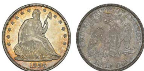
2773 Proof Half-Dollar, 1886, edge grained, 12.50g/6h. Some surface marks and hairlines, otherwise good extremely fine or better, toned