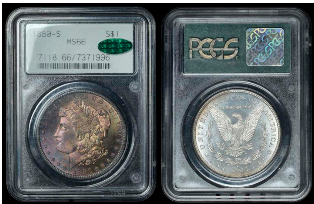
2570 Dollar, 1880s. Practically mint state, obverse with deep russet tone Slabbed in PCGS holder, graded MS 66 CAC