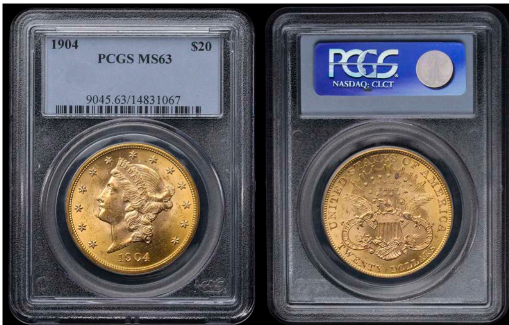
🔗 2503 Twenty Dollars, 1904. Some bagmarks, otherwise virtually as struck Slabbed in PCGS holder, graded MS 63