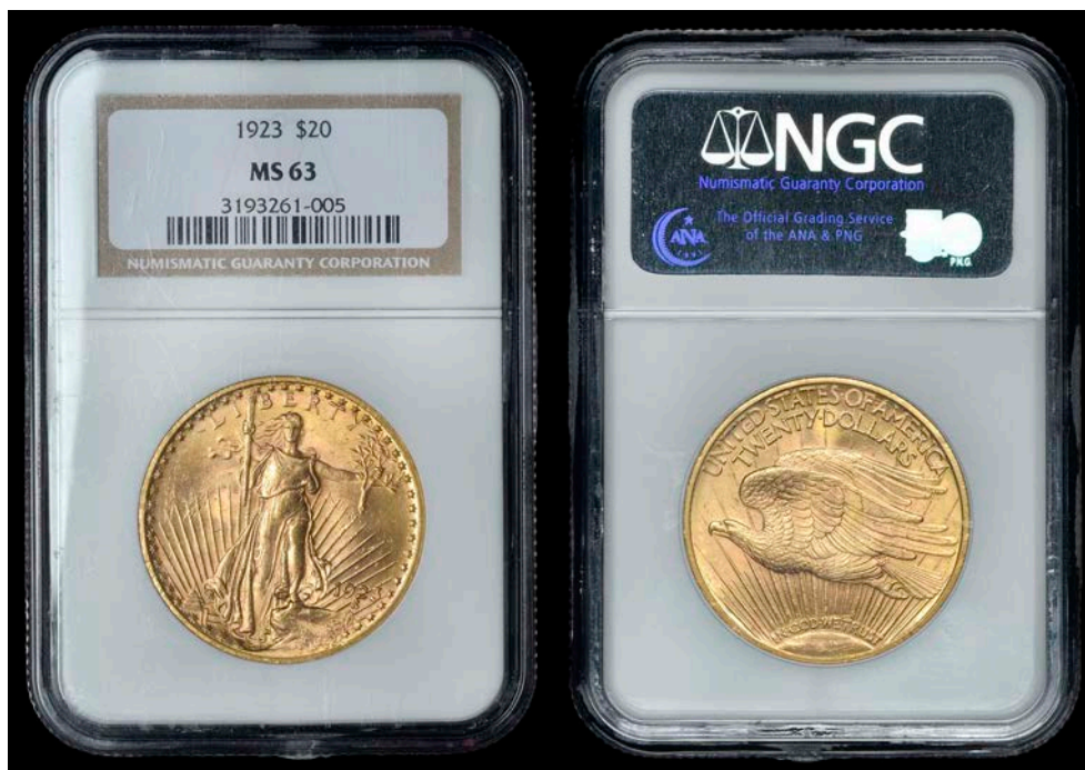
2511 Twenty Dollars, 1923. Practically as struck Slabbed in NGC holder, graded MS 63