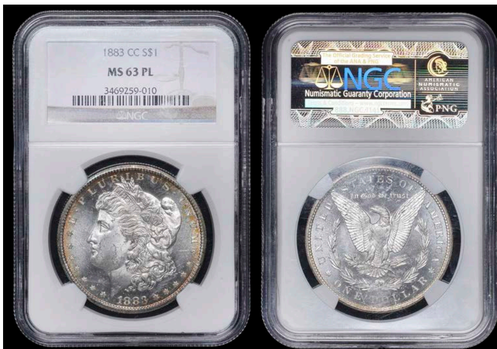
2620 Dollar, 1883cc. A few bagmarks, otherwise virtually mint state with proof-like fields and peripheral toning