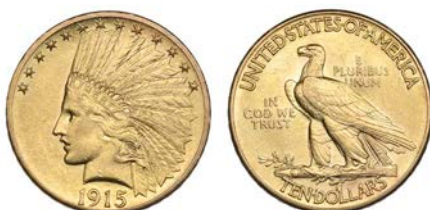
🌀 2534 Ten Dollars, 1915. Virtually mint state £550-650