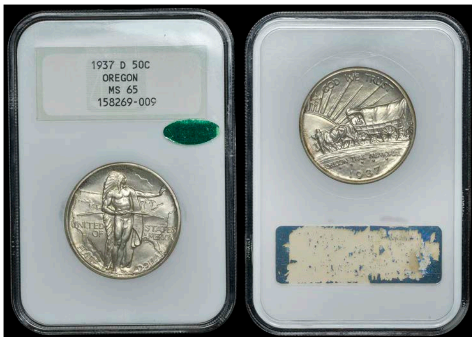
2781 Half-Dollar, 1937D, Oregon. Virtually mint state Slabbed in NGC holder, graded MS 65 CAC