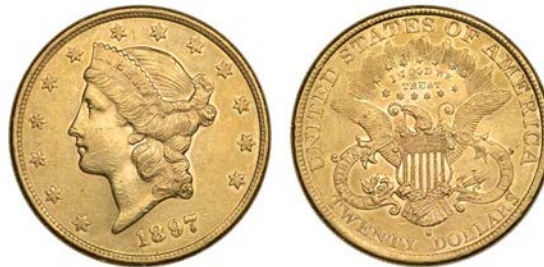
🔗 2502 Twenty Dollars, 1897. Some bagmarks, otherwise virtually as struck