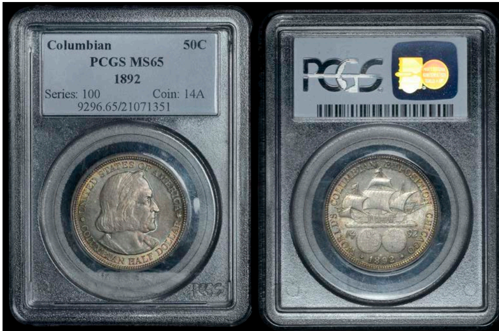
2774 Half-Dollar, 1892, Columbian Exposition. Virtually mint state, lightly toned Slabbed in PCGS holder, graded MS 65