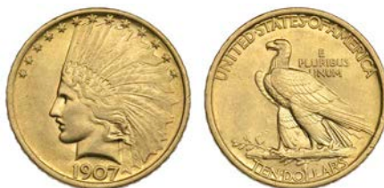
🌀 2526 Ten Dollars, 1907, no motto, no periods. Virtually as struck £500-600