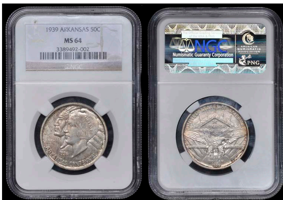
2784 Half-Dollar, 1939, Arkansas. Practically as struck Slabbed in NGC holder, graded MS 64