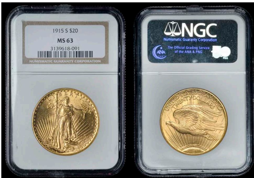
2508 Twenty Dollars, 1915s. A few bagmarks, otherwise virtually as struck Slabbed in NGC holder, graded MS 63