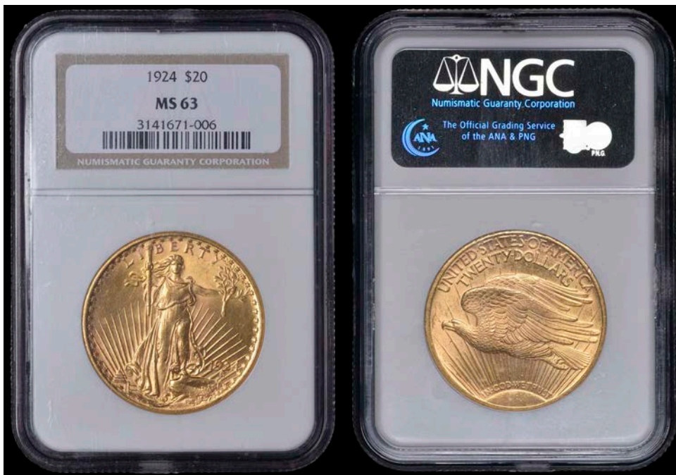
2513 Twenty Dollars, 1924. Some bagmarks, otherwise virtually mint state Slabbed in NGC holder, graded MS 63