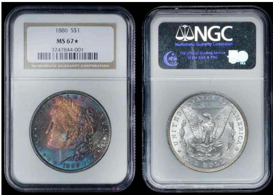
2682 Dollar, 1886. Mint state with impressive blue and russet toning on obverse Slabbed in NGC holder, graded MS 67*