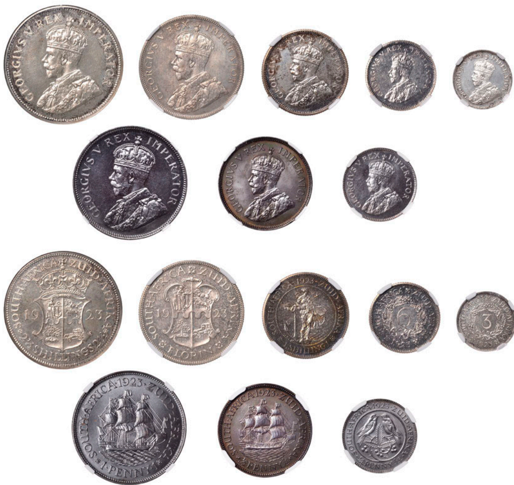
1362 George V, Proof set, 1923, comprising Halfcrown to Farthing (Hern P2; KM. PS 2) [8]. Practically as struck, the silver lightly toned, rare £1,000-1,200

All slabbed in NGC holders, graded PF 65, 63, 64, 64, 64, 66 BN, 65 BN and 65 BN respectively