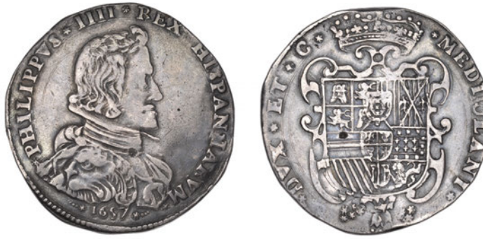
1331 MILAN, Philip IV , Filippo, 1657, bust right, rev. crowned arms, 27.43g/10h (MIR 364; KM. 55). About very fine £300-400