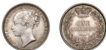
x 1155 Shilling, 1874, die 67 (ESC 1326; S 3906A). Good extremely fine, toned