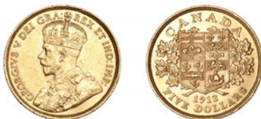
1307 George V , Five Dollars, 1912 (KM. 26; F 4). Scuffed, otherwise extremely fine