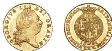
1134 Half-Guinea, 1801, sixth bust (MCE 439; S 3736). Cleaned, otherwise good very fine or better