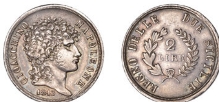
1335 NAPLES, Gioacchino Murat , 2 Lire, 1813 (KM. 258). About very fine £100-150