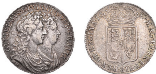
1116 Halfcrown, 1689, first shield, caul and interior frosted, pearls, edge PRIMO (ESC 503; S 3434). Scratch on King's face, otherwise nearly extremely fine