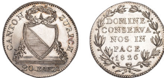
1372 ZÜRICH, Half-Thaler of 20 Batzen, 1826 (DT 19; KM. 192). Sometime cleaned, otherwise extremely fine £100-150