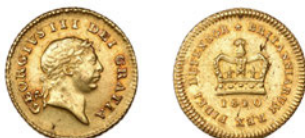
1137 Third-Guinea, 1810, second bust (MCE 460; S 3740). Better than very fine, red tone