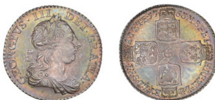
1139 Shilling, 1763 (ESC 1214; S 3742). Virtually mint state, attractively toned