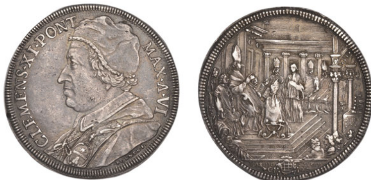
1342 Clement XI , Piastra (Scudo of 80 Bolognini), yr. VI [1705-6], Rome, bust left, rev. Pope enthroned, holding court in the Church of Santa Maria Maggiore (Muntoni 44; KM. 672; Dav. 1433). Edge flaw at 6 o'clock, otherwise very fine or better, rare £300-400