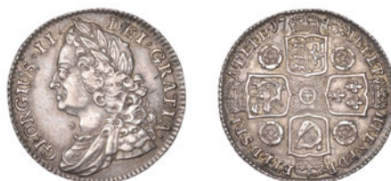
x 1130 Shilling, 1743, roses (ESC 1203; S 3702). A little weak on hair, otherwise nearly extremely fine, toned