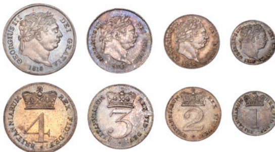
x 1144 Maundy set, 1818 (ESC 2423; S 3792) [4]. Extremely fine or better £150-200