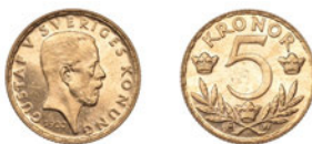
1368 Gustav V , 5 Kronor, 1920 (KM. 797). Light surface marks, otherwise good extremely fine, brilliant