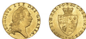
1133 Half-Guinea, 1796, fifth bust (MCE 435; S 3735). Virtually as struck Slabbed in NGC holder, graded MS 63