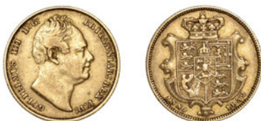
1147 Sovereign, 1832, second bust (M 17A; S 3829B). Better than fine £300-400 G