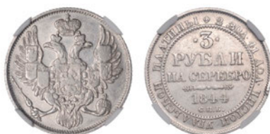
1354 Nicholas I , 3 Roubles, 1844, St Petersburg (KM. C177). Better than very fine Slabbed in NGC holder, graded XF 40 £800-1,000