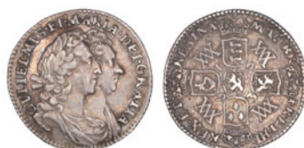
x 1118 Sixpence, 1693 (ESC 1529; S 3438). Very fine, toned