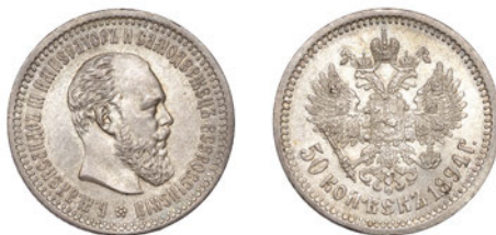
1356 Alexander III , 50 Kopecks, 1894 AF (KM. Y45). Extremely fine