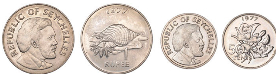
1361 Republic , Pattern or Trial Rupee and 50 Cents, both 1977, in cupro-nickel, with the head of Sir James Mancham, revs. triton conch shell and vanilla orchid, edges grained, 11.64g/12h, 5.82g/12h (KM. -; cf. DNW 127, 2768) [2]. First extremely fine, second brilliant mint state, of the highest rarity