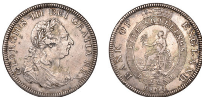
x 1142 Dollar, 1804, types B/2 (ESC 148; S 3768). Very fine