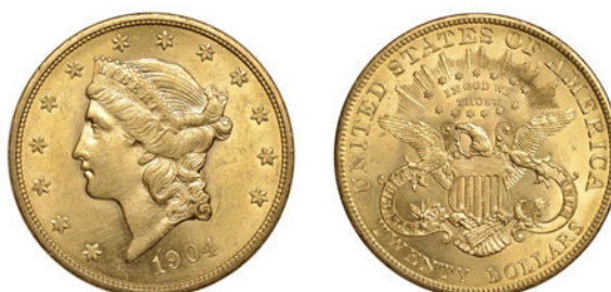
1376 Twenty Dollars, 1904. Good extremely fine