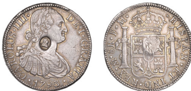
x 1141 MEXICO, Charles III, 8 Réales, 1793 FM , Mexico City, obv. countermarked with head of George III in oval, 26.89g/12h (ESC 129; S 3765A). About very fine, toned