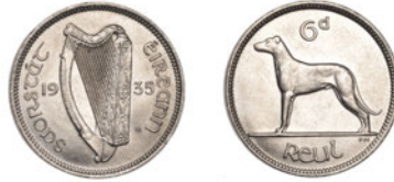
1183 Free State , Sixpence, 1935 (S 6628). Practically as struck £100-150