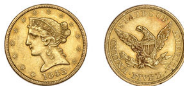
1381 Five Dollars, 1843. Very fine or better