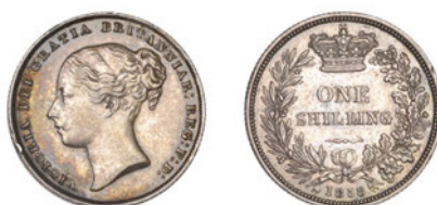
x 1153 Shilling, 1858 (ESC 1306; S 3904). About extremely fine and attractively toned