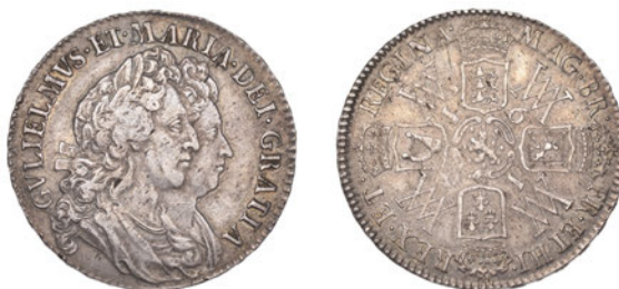
x 1117 Halfcrown, 1691, edge TERTIO (ESC 516; S 3436). Very fine, reverse better, toned