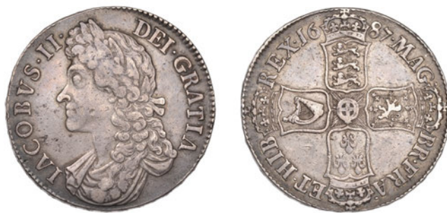
x 1115 Crown, 1687, second bust, edge TERTIO (ESC 78; S 3407). Good fine, toned