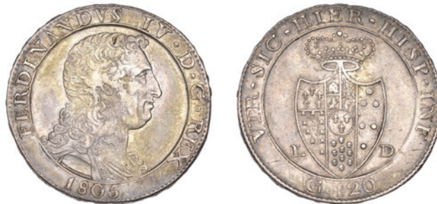
1332 NAPLES, Ferdinand IV , Piastre of 120 Grani, 1805 LD (KM. 247). Very fine, a scarce one-year type £150-200

Provenance: A.M. Huntington Collection; CNG Mailbid Sale 96, 14 May 2014 (1175)