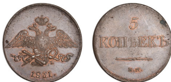
x 1355 Nicholas I , 5 Kopecks, 1831 ФХ , Ekaterinburg (KM. C140.1). Better than extremely fine with traces of original colour, scarce £200-260