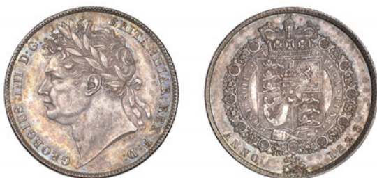
x 1146 Halfcrown, 1823, type 2 (ESC 634; S 3808). Some light surface marks, otherwise nearly extremely fine, toned £120-150