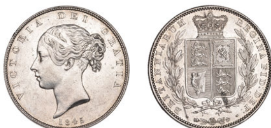
1152 Halfcrown, 1845 possibly over 3 (cf. ESC 679; S 3888). Extremely fine, reverse better with some original mint bloom, possibly extremely rare