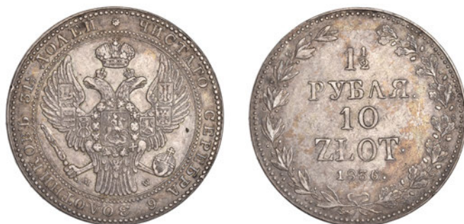
1351 Nicholas I , One-and-a-Half Roubles (10 Zloty), 1836mw (cf. KM. C134). Edge nick, otherwise nearly very fine £100-150