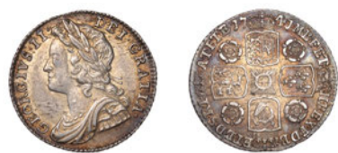
x 1132 Sixpence, 1741, roses (ESC 1613; S 3708). A little haymarking, otherwise almost extremely fine, toned