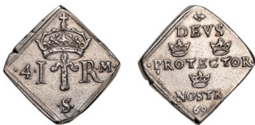
1365 Johann III , 4 Marks Klipping, 1569, Stockholm, 12.82g/6h (Ahlström 124). A few edge marks, otherwise very fine but sometime cleaned £200-300