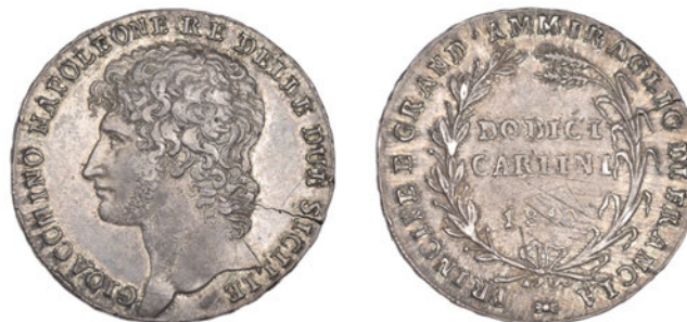
1334 NAPLES, Gioacchino Murat , Piastre of 12 Carlini, 1810 (KM. 250). Better than very fine but some scratching (blank-filing?) by date, scarce £200-260