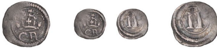
1182 Charles I , Ormonde Money, Twopence, large letters, 0.81g/12h (S 6550; DF 310). Light obverse scratches and reverse slightly double struck, otherwise nearly very fine, very rare £1,500-1,800 Provenance: G. Brady Collection, Whyte's Auction (Dublin), 29 April 2000, lot 247 [from E. Szauer, c. 1970]