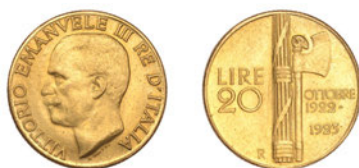
1341 Vittorio Emanuele III , 20 Lire, 1923R (KM. 64; Mont. 55; Pag. 670; F 31). About as struck £400-500