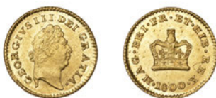
1136 Third Guinea, 1800, first bust (MCE 452; S 3738). Some surface marks, otherwise good extremely fine