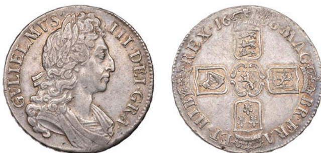
x 1119 Crown, 1696, third bust, edge OCTAVO (ESC 94; S 3472). Weak on date, otherwise very fine, toned