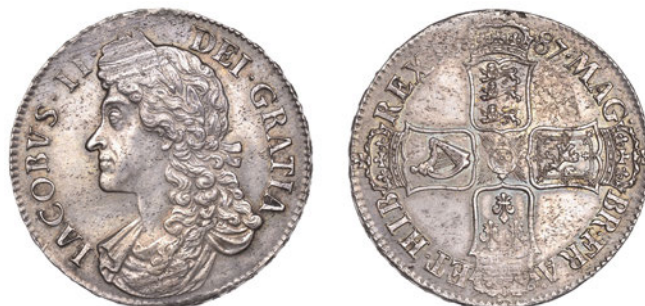
1114 Crown, 1687, second bust, edge TERTIO (ESC 78; S 3407). Some blank filing on laurel and a tiny edge flaw on reverse, otherwise extremely fine and toned £2,000-3,000