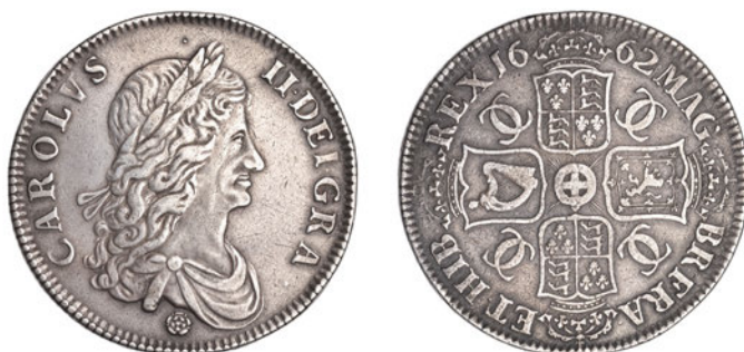
1110 Crown, 1662, first bust, rose below, edge undated (ESC 15; S 3350). Details in high relief, resembling a proof striking, good very fine and very rare £2,600-3,000