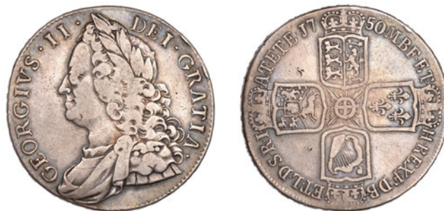
x 1128 Crown, 1750, edge VICESIMO QUARTO (ESC 127; S 3690). Fine, scarce