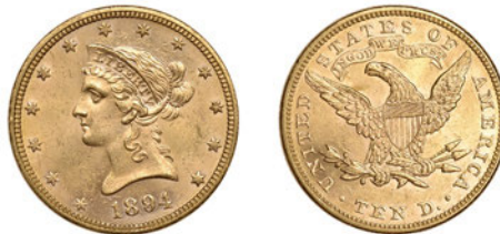
1379 Ten Dollars, 1894. Scuffed, otherwise good very fine