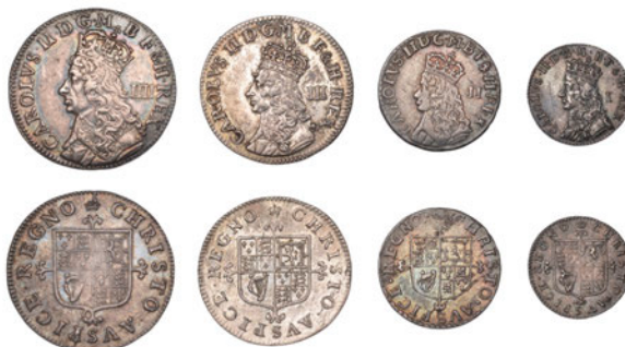
x 1113 Maundy set, undated, Twopence with single-arched crown (ESC 2365; S 3391) [4]. Twopence very fine, others better £200-300