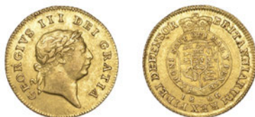
1135 Half-Guinea, 1806, seventh bust (MCE 443; S 3737). Very fine