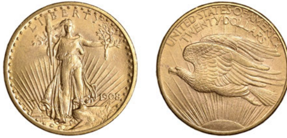
1377 Twenty Dollars, 1908, no motto. Extremely fine or better