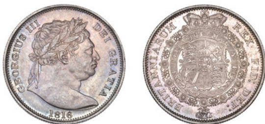
1143 Halfcrown, 1816 (ESC 613; S 3788). Minor graffiti above crown on reverse and friction on high points, otherwise practically mint state and attractively toned £100-150