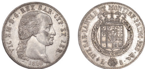
1336 SARDINIA, Victor Emanuel , 5 Lire, 1820L, Turin (MIR 1030e; KM. 113). Adjustment marks on forehead, otherwise good very fine £300-400