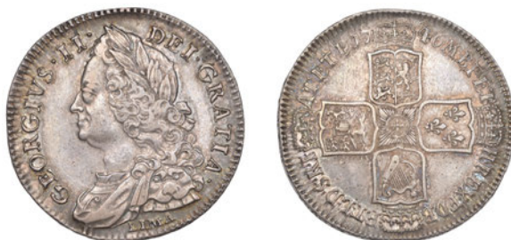
x 1129 Halfcrown, 1746 LIMA, edge DECIMO NONO (ESC 606; S 3695A). Some marks on bust, otherwise good very fine, toned