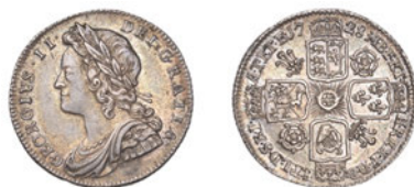
x 1131 Sixpence, 1728, roses and plumes (ESC 1606; S 3707). Almost extremely fine, attractively toned