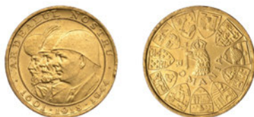
1352 Mihai I , Pattern 20 Lei or medal, 1944, in gold, three conjoined busts left, rev. arms in circle, edge lettered, 6.54g, 12h (KM. Pn. —). Extremely fine £120-150