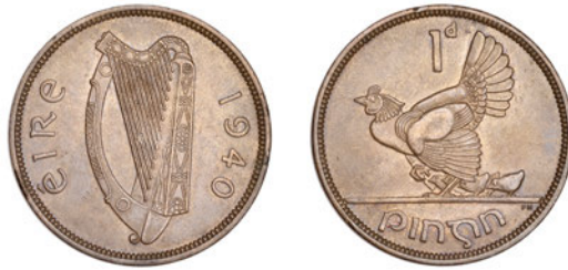
1184 Eire , Penny, 1940 (S 6643). About extremely fine £100-150