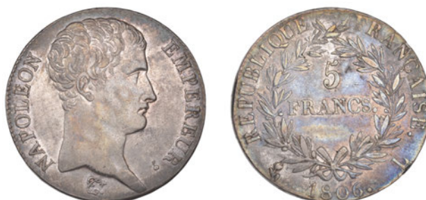
1312 EMPIRE, Napoleon , 5 Francs, 1806L (VG 581; KM 673.8). About extremely fine