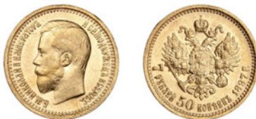
1357 Nicholas II , Seven-and-a-Half Roubles, 1897 (KM. Y63; F 178). Slight edge bruise at 1 o'clock, otherwise extremely fine