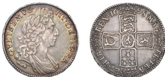
x 1120 Halfcrown, 1698, edge DECIMO (ESC 554; S 3494). Very fine, toned