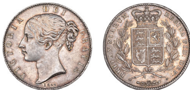
1150 Crown, 1844, edge VIII, star stops (ESC 280; S 3882). A few surface marks, otherwise better than extremely fine with reflective surfaces underlying light toning