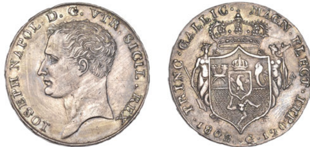
1333 NAPLES, Joseph Napoleon , Piastre of 120 Grani, 1808 (KM. 248). Very fine, rare £260-300