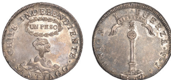
x 1308 Republic , Peso, 1817FJ, Santiago (KM. 82.2). Better than extremely fine, lightly toned with underlying brilliance