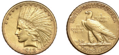
1380 Ten Dollars, 1912s. Scratch in obverse field and cut in reverse edge, otherwise very fine