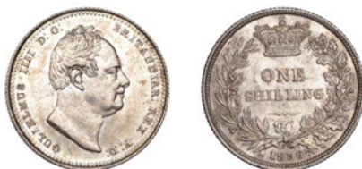
x 1148 Shilling, 1836 (ESC 1273; S 3835). Good extremely fine or better £200-300