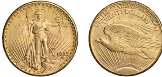
1378 Twenty Dollars, 1925. Extremely fine