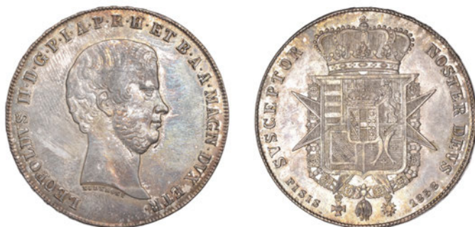
1340 TUSCANY, Leopold II , Francescone, 1858, Florence (KM. C75b; Dav. 160). Extremely fine or better, patchy toning £100-150