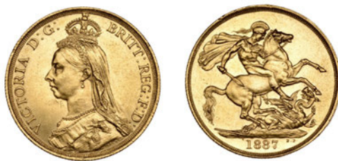
1149 Two Pounds, 1887 (S 3865). A few rim nicks, otherwise good extremely fine, reverse better