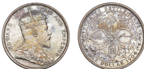
1364 Edward VII, Dollar, 1904B (Prid. 4; KM. 25). Extremely fine or better, patchy toning