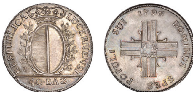
1370 LUCERNE , Thaler of 40 Batzen, 1795 (DT 542; KM. 93). Extremely fine, toned