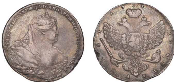
x 1353 Anna , Rouble, 1737 (Diakov 24, Sev. 1261-2; KM. 198). Reverse edge flaw at 8 o'clock, otherwise fine or better £150-200