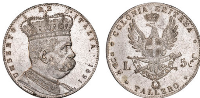
1311 Umberto I , Tallero, 1891 (KM. 4). Some surface marks, otherwise very fine or better