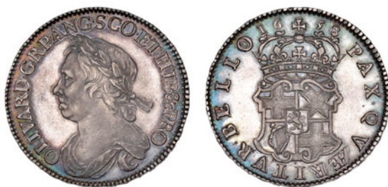
1109 Halfcrown, 1658 (ESC 447; S 3227A). Light hairlines, otherwise good extremely fine, attractive tone £3,400-4,000