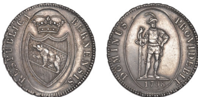
1369 BERN , Thaler of 40 Batzen, 1798, large date (DT 509; KM. 165). A few small surface marks, otherwise about extremely fine £200-300