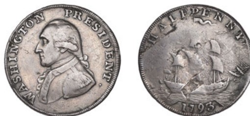
1375 Washington Halfpenny, 1793, edge PAYABLE IN ANGLESEY LONDON OR LIVERPOOL, 10.55g/6h (Baker 18; Durst 336; DH Middlesex 1051). Metal fault in lower reverse, otherwise fine