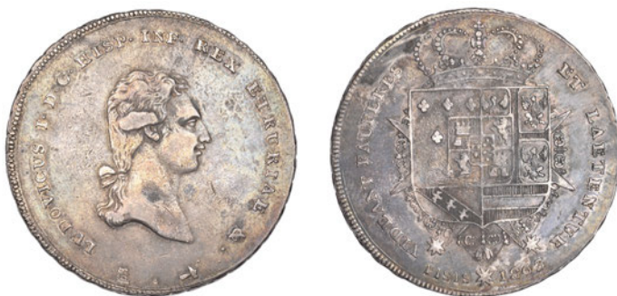
1338 TUSCANY, Louis I , Francescone (10 Paoli), 1803 (KM. 42.2). Better than fine, scarce £100-150