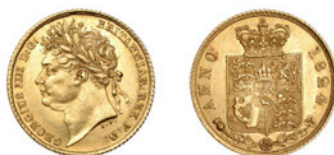
1145 Half-Sovereign, 1824 (M 405; S 3803). Lightly cleaned at some time, otherwise extremely fine £400-500 G