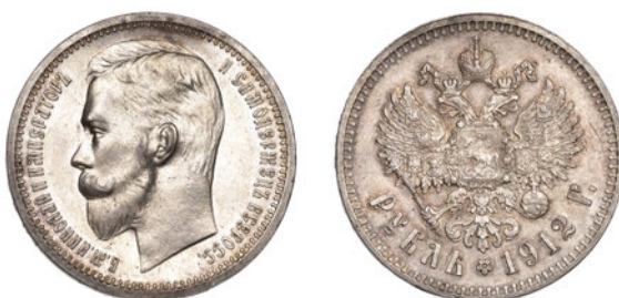
1358 Nicholas II , Rouble, 1912 ЭБ (KM. Y59.3). Extremely fine or better