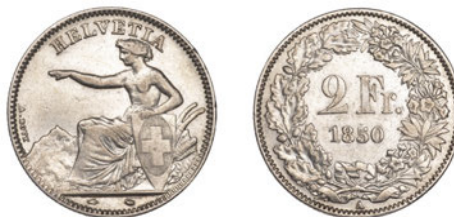
1374 Confederation, 2 Francs, 1850 A (DT 302; KM. 10). Cleaned, otherwise very fine or better