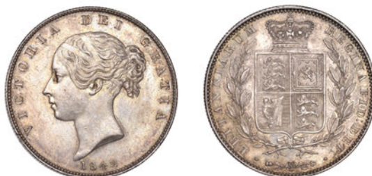
x 1151 Halfcrown, 1842 (ESC 675; S 3888). Minor surface marks, otherwise extremely fine, toned