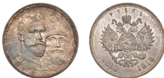
1359 Nicholas II , Rouble, 1913 BC , Romanov dynasty (KM. Y70). Good extremely fine