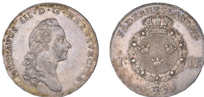
x 1366 Gustav III , Riksdaler, 1779 OL (KM. 527). Very fine, toned