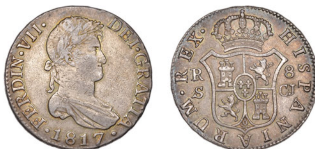
1363 Ferdinand VII, 8 Réales, 1817c1, Seville (Cayón 15986; KM. 466.3). Portrait a little weak, otherwise better than very fine £100-150