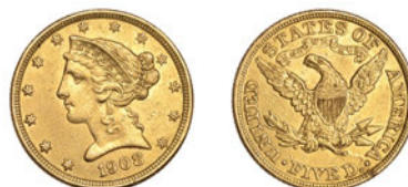
1382 Five Dollars, 1908, Liberty head. Very fine or better