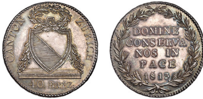
1371 ZÜRICH, Thaler of 40 Batzen, 1813 B (DT 18; KM. 190). Extremely fine, toned