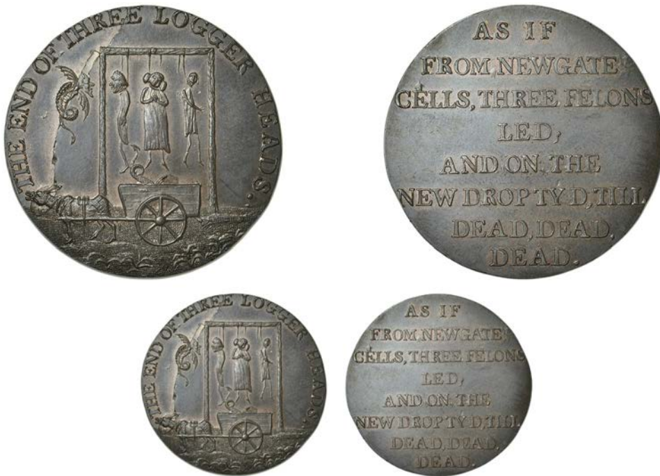
2473 The Greatheed Petition to Dismiss the King's Ministers, Warwick, 1797 , a copper medal, unsigned, cart under gallows from which three men are hanging, THE END OF THREE LOGGER HEADS, rev. AS IF FROM NEWGATE CELLS THREE FELONS LED, AND ON THE NEW DROP TYD, TILL DEAD, DEAD, DEAD, 37mm, 19.71g/12h (DH Warwickshire 11; BHM 445). Usual die flaw on obverse, the hanging men well struck up, extremely fine with diffused original colour and attractive reflective surfaces, extremely rare £1,500-£2,000

Provenance: S.H. Hamer Collection, Glendining Auction, 26-28 November 1930, lot 365; W. Waite-Sanderson Collection, Glendining Auction, 16-17 November 1944, lot 208 (part); J. Spingarn Collection, DNW Auction 52, 28-9 November 2001, lot 1256