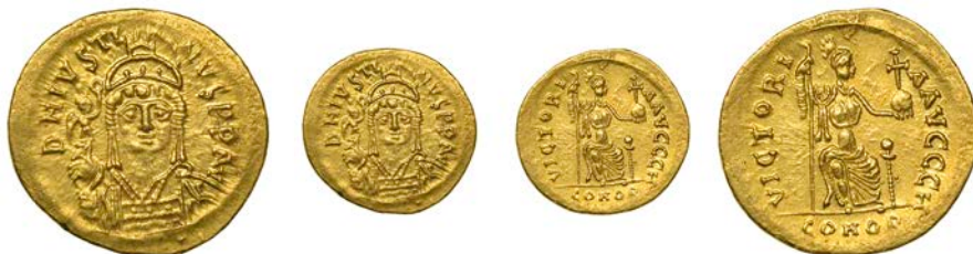
114 Justin II , Solidus, Carthage, indiction \eta [574-5], helmeted bust facing, holding Victory on globe, three pellets on breastplate, rev. Constantinopolis seated facing with head right, holding spear and globus cruciger, 4.39g (Sear 391). About extremely fine, scarce £300-£400