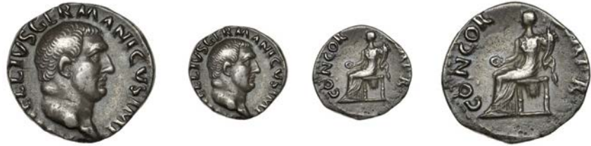
45 Vitellius , Denarius, Rome, 69, bust right, rev. Concordia seated left, holding patera and cornucopia, 2.97g (RIC 66; RSC 21). Very fine, dark-toned £300-£400