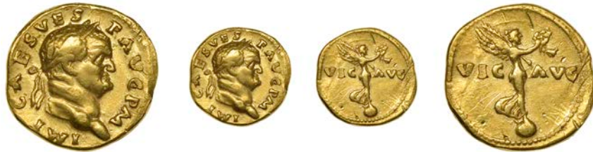
47 Vespasian , Aureus, Rome, 71, laureate bust right, IMP CAES VESP AVG P M, rev. VIC AVG, Victory standing right on globe, holding palm branch and wreath, 7.30g (Calicó 698a; RIC 47). Traces of mounting on edge and some scrapes on reverse, otherwise very fine £1,000-£1,200