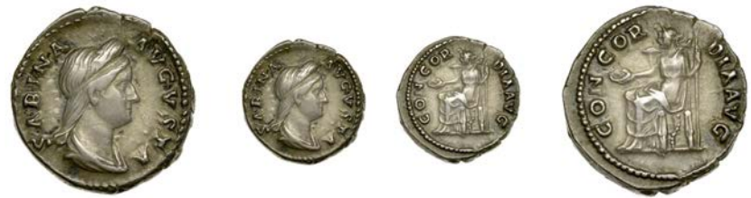
68 Sabina , Denarius, Rome, c. 128-34, bust right, rev. Concordia seated left on throne, holding patera and spear, 3.46g (RIC 399a; RSC 25). Very fine or better, toned £90-£120