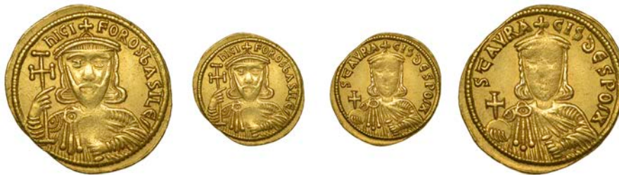
128 Nicephorus I and Stauracius , Solidus, Constantinople, crowned bust of Nicephorus I facing, holding cross potent and akakia, rev. crowned bust of Stauracius facing, holding globus cruciger and akakia, 4.45g (Sear 1604). Faces weak and a tiny edge cut, otherwise about extremely fine £200-£260