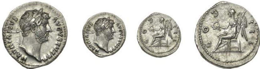
66 Hadrian , Denarius, Rome, c. 128, laureate bust right, rev. Victory seated left, holding wreath and palm, 3.38g (RIC 345; RSC 362). Reverse cleaned, otherwise about extremely fine £90-£120