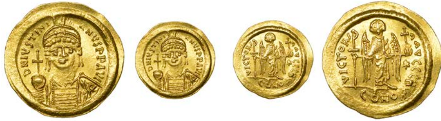
111 Justinian I , Solidus, Constantinople, helmeted bust facing, holding globus cruciger and shield, rev. angel standing facing, holding staff and globus cruciger, star in right field, officina \eta , 4.48g (Sear 140). Very slightly creased, otherwise extremely fine £240-£300