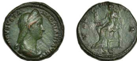
70 Sabina , As or Dupondius, Rome, c. 133, diademed and draped bust right, rev. Vesta seated left, holding palladium and sceptre, s c in exergue, 12.63g (RIC Hadrian 1046). Very fine, scarce £90-£120