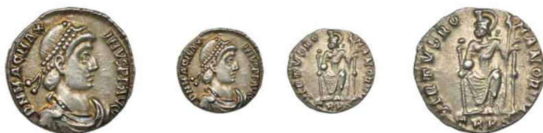
109 Magnus Maximus , Siliqua, Trier, 383-8, similar, 1.76g (RIC 84b). About extremely fine