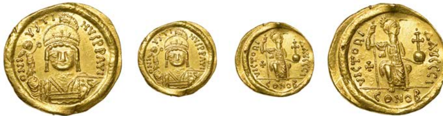
112 Justin II , Solidus, Alexandria, helmeted bust facing, holding globe surmounted by Victory and shield, rev. Constantinopolis seated facing, holding spear and globus cruciger, cross in left field, officina \iota , 4.60g (Sear 347). Edge knock below bust, otherwise about extremely fine, scarce £300-£400