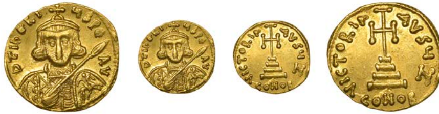
126 Tiberius III , Solidus, Constantinople, similar, officina z, 4.40g (Sear 1360). Minor marks on reverse, otherwise extremely fine £400-£500