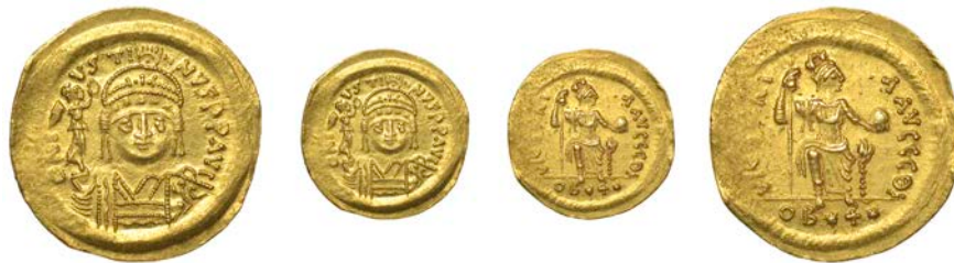
113 Justin II , lightweight Solidus, Antioch, crowned bust facing, holding Victory on globe, rev. Constantinopolis seated facing with head right, holding spear and globus, 3.99g (Sear 376). Minor weakness on reverse, otherwise about extremely fine £200-£260