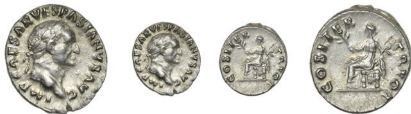
48 Vespasian , Denarius, Rome, 69-71, laureate bust right, rev. Pax seated left, holding branch and caduceus, 3.57g (RIC 10; RSC 94h). About extremely fine £90-£120