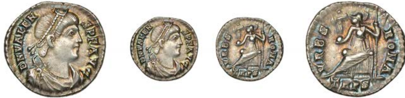
103 Valens , Siliqua, Trier, c. 367-78, similar, 2.19g (RIC 27e and 45b). About extremely fine, attractively toned £90-£120