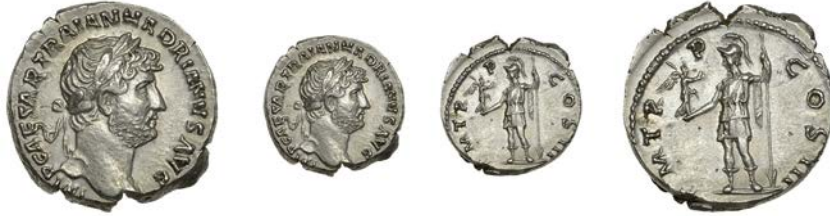
64 Hadrian , Denarius, Rome, 119-22, laureate bust right, rev. Roma standing left, holding Victory and spear, 3.43g (RIC 76; RSC 1108). Extremely fine £200-£260