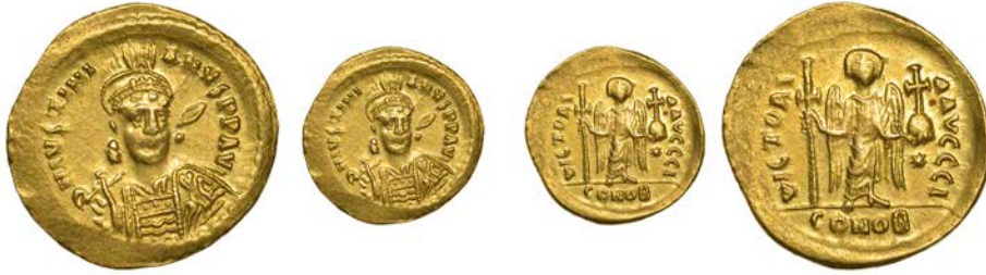
110 Justinian I , Solidus, Constantinople, helmeted bust facing three-quarters right, holding spear and shield, rev. angel standing facing, holding long cross and globus cruciger, star in right field, officina \iota , 4.47g (Sear 137). Light graffiti on reverse, otherwise good very fine £200-£260