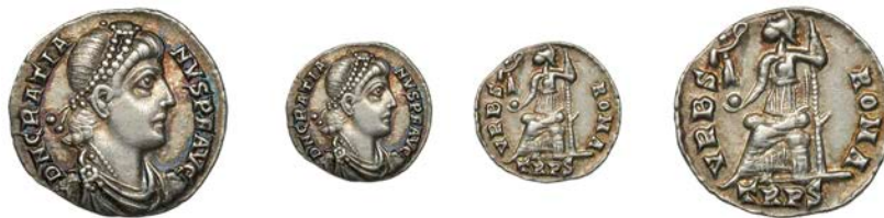
105 Gratian , Siliqua, Trier, c. 375-8, similar, 1.91g (RIC 46b). Good very fine, toned