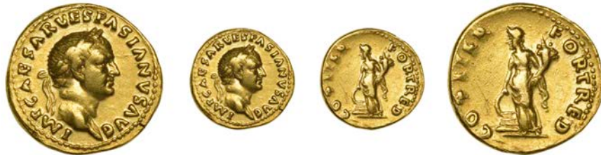
46 Vespasian , Aureus, Rome, 70, laureate bust right, IMP CAES VESPASIANVS AVG, rev. COS ITER FORT RED, Fortuna standing left, holding cornucopia in left hand and resting right hand on prow, 7.06g (Calicó 601; RIC 18). Traces of mounting and a few light scratches, otherwise good very fine, rare £2,000-£2,600