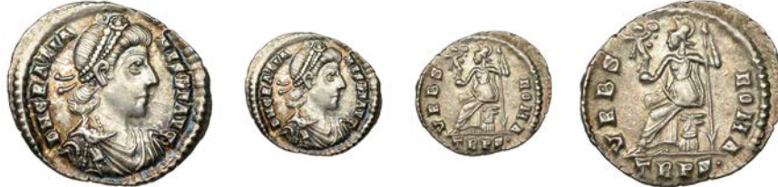
104 Gratian , Siliqua, Trier, c. 375-8, diademed bust right, rev. Roma seated left on cuirass, holding Victory and inverted spear, 1.78g (RIC 46b). About extremely fine, toned £90-£120