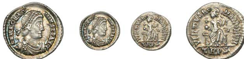
108 Magnus Maximus , Siliqua, Trier, 383-8, diademed bust right, rev. Roma seated facing, holding globe and spear, 2.01g (RIC 84b). Good very fine, toned