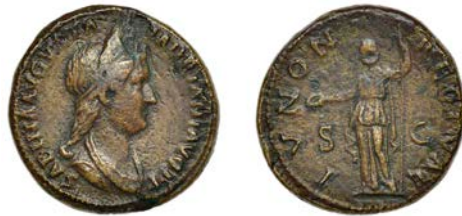
69 Sabina , Dupondius, Rome, c. 132, diademed and draped bust right, rev. Juno standing left, holding patera and sceptre, s c in fields, 13.67g (RIC Hadrian 1038). Very fine, scarce £90-£120