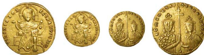
130 Constantine VII and Romanus I , Solidus, Constantinople, nimbate Christ enthroned facing, rev. crowned busts of Romanus I and Christ facing, both holding long cross, 4.39g (Sear 1745). Scratches on obverse and minor edge marks, otherwise very fine £240-£300