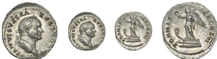
49 Vespasian , Denarius, Rome, 75, laureate bust right, rev. Victory standing left on prow, holding palm and wreath, 3.49g (RIC 93; RSC 368). Extremely fine with some toning £300-£400