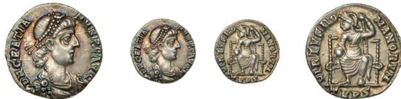
106 Gratian , Siliqua, Trier, c. 378-83, pearl-diademed, draped and cuirassed bust right, rev. Roma seated facing, holding globe and reversed spear, \tau\rho\rho s in exergue, 1.96g (RIC 58a). Extremely fine and toned