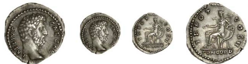
71 Aelius , Denarius, Rome c. 137, bust right, rev. Concordia seated left on throne, holding patera and resting elbow on cornucopiae, 3.51g (RIC Hadrian 436; RSC 1). Good very fine, rare £150-£200