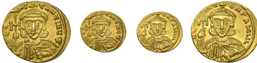
127 Constantine V , Solidus, Constantinople, crowned bust facing, holding cross potent and akakia, s recut over oc at end of legend, rev. crowned bust of Leo III facing, holding cross potent and akakia, 4.46g (Bendall, SNC July-August 1977, p.304, this coin illustrated ; DO 1g4; Sear 1550). Minor marks on edge, otherwise good very fine £300-£400 Provenance: Glendining Auction, 11 May 1977, lot 156