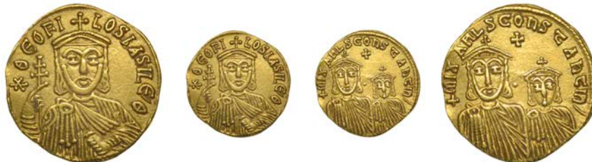
129 Theophilus, Michael II and Constantine , Solidus, Constantinople, crowned bust of Theophilus facing, holding patriarchal cross and akakia, rev. crowned busts of Michael II and Constantine facing, small cross in upper field, 4.41g (Sear 1653). Very fine £300-£400