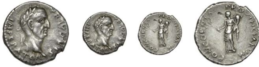
44 Galba , Denarius, Narbo (?), 68, laureate bust right, rev. Concordia standing left, holding branch and cornucopia, 3.51g (RIC 105; RSC 34). Very fine, scarce £300-£400