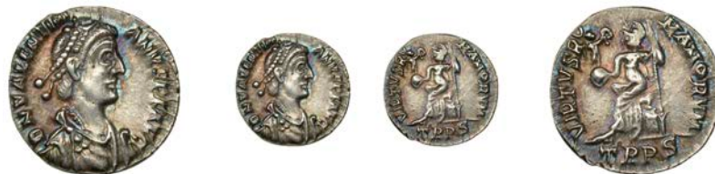
107 Valentinian II , Siliqua, Trier, c. 388-92, pearl-diademed, draped and cuirassed bust right, rev. Roma seated left, holding Victory on globe and reversed spear, \tau\rho\rho s in exergue, 1.67g (RIC 94a). Good very fine, toned