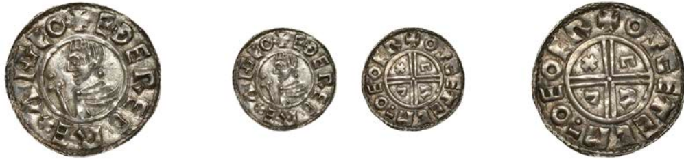
53 York , Asketill, OSCETEL M o EOFR, reads EDERED, 1.24g/1h (cf. BEH 809; N 770 var.; S 1149). Better than very fine, very rare £300-£400