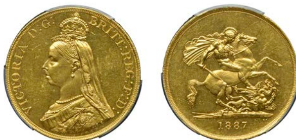
G 453 Five Pounds, 1887 (S 3864). Light hairlines, otherwise good extremely fine [slabbed PCGS MS 61]