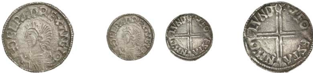
73 London , Leofstan, LEOFSTAN M · O LVND, 1.53g/3h (BEH 2721ff; N 774; S 1151). Good fine £180-£220