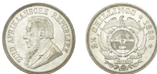
1014 Paul Kruger , Halfcrown, 1892 (Hern Z30; KM. 7). Extremely fine or better [slabbed NGC AU 58] £200-£300