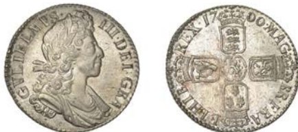
409 Shilling, 1700, fifth bust, small Os in date (ESC 1151 [1121A]; S 3516). Virtually as struck with almost no hairlining