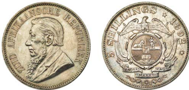
1011 Paul Kruger , Crown, 1892, single shaft (Hern Z37; KM. 8.1). Has been lightly cleaned at some time, now toned, otherwise almost extremely fine £300-£400