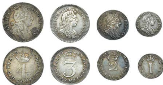
416 Maundy set, 1699 (ESC 1306 [2390]; S 3553) [4]. About very fine