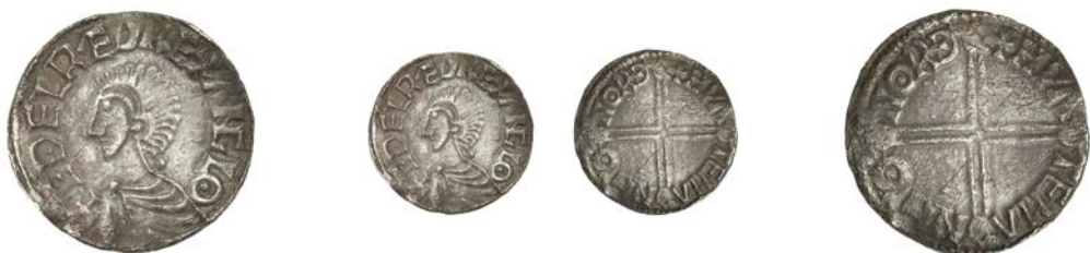
76 Norwich , Hwætman, HPATEMAN M' O NORD, 1.49g/10h (BEH 3140; N 774; S 1151). Slightly buckled, otherwise good fine £150-£200