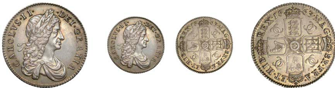
386 Shilling, 1663, first bust variety (ESC 506 [1025]; S 3372). Nearly extremely fine, attractively toned £700-£900