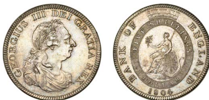
441 Dollar, 1804, types A/2, leaf to upright of E in DEI (ESC 1925 [144]; S 3768). Faint traces of undertype visible, nearly extremely fine, toned