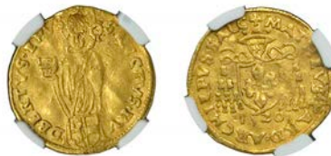
945 SALZBURG, Matthäus Lang von Wellenburg , Ducat, 1520 (Probszt 170; F 600). Very fine [slabbed NGC VF 30]