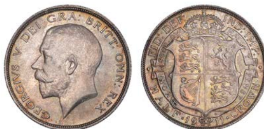
275 Halfcrown, 1911 (ESC 3709 [757]; S 4011). Virtually mint state, lightly toned over original frosty surfaces