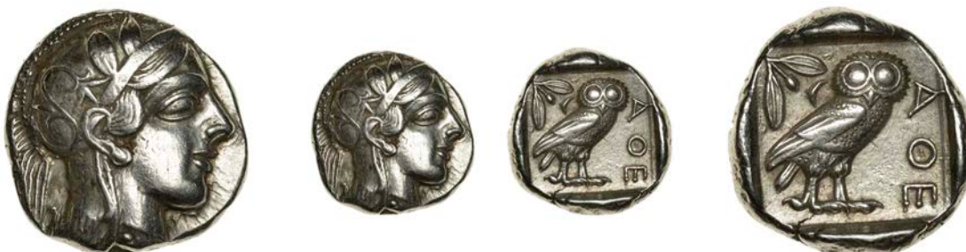
812 ATTICA, Athens , Tetradrachm, c. 450-405, similar, 17.13g (Kroll 8; Sear 2526). Good very fine £500-£700