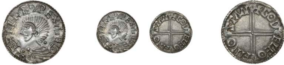
77 Stamford , Godleof, GODELEOF M' O STAN, 1.45g/12h (BEH 3497; N 774; S 1151). Better than very fine £300-£360