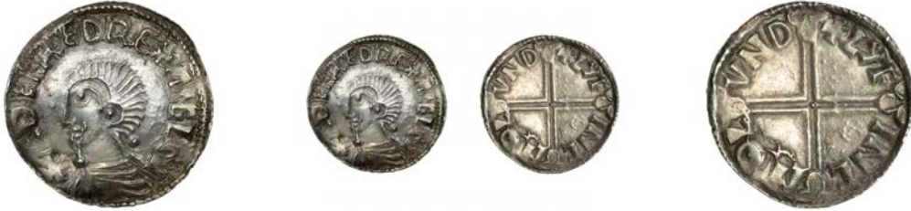
71 London , Leofing, LYFINC M' O LVND, 1.57g/9h (BEH 2824ff; N 774; S 1151). Slightly buckled, otherwise good very fine £240-£300