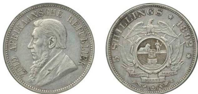
1012 Paul Kruger , Crown, 1892, single shaft (Hern Z37; KM. 8.1). Scuffed, otherwise better than very fine [slabbed SANGS XF 40] £150-£200