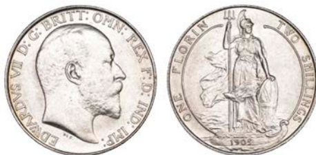
246 Florin, 1905 (ESC 3581 [923]; S 3981). Sometime lightly cleaned, otherwise extremely fine or better, rare £600-£700