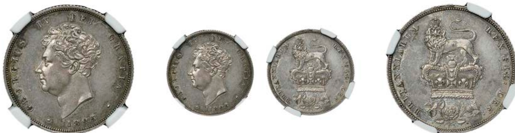
448 Pattern Shilling, 1825, by W. Wyon, in silver, bust left, rev. lion on crown, lettering widely spaced above, edge grained, 7h (ESC 2417 [1264]). About as struck, extremely rare [slabbed NGC PF 62]