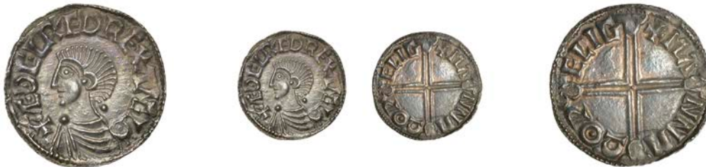
79 Wallingford , Manna, MANN MDO PELIG, 1.69g/9h (BEH 3927; N 774; S 1151). Nearly extremely fine, toned £300-£400