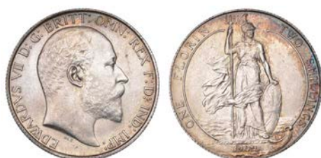
250 Florin, 1909 (ESC 3585 [927]; S 3981). A few bagmarks, otherwise extremely fine or better, light peripheral toning £200-£300