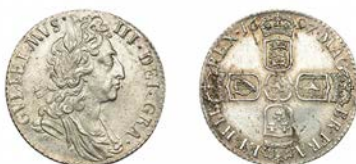
413 Sixpence, 1697, third bust, large crowns, ordinary harp, reads GVLEIMVS (ESC 1237; S 3538). Extremely fine, very rare