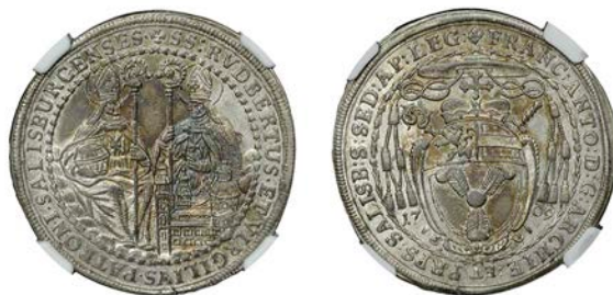
x 946 SALZBURG, Johan Ernst , Half-Thaler, 1709 (KM. 253, date not listed). Extremely fine, toned [slabbed NGC AU 58]