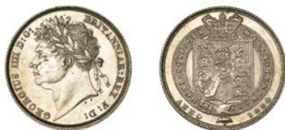
447 Shilling, 1824 (ESC 2400 [1251]; S 3811). Extremely fine