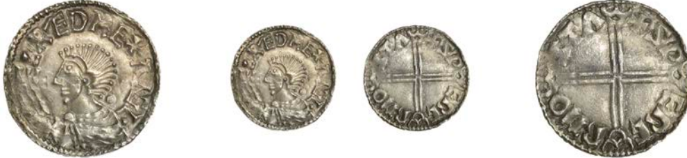
78 Stamford , Svartgeirr, SPERGR MO STA, 1.46g/6h (BEH 3544; N 774; S 1151). Obverse struck from a damaged die, slightly buckled, otherwise good very fine £240-£300