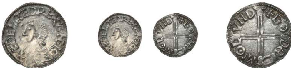
69 London , Godric, GODRIC M o LVNDE, two pellets in field before face, 1.50g/10h (cf. BEH 2586; N 774; S 1151). Very fine £200-£260