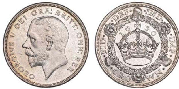
268 Crown, 1930 (ESC 3638 [370]; S 4036). Extremely fine or better