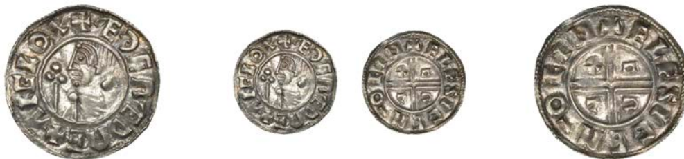
14 Lincoln , Ælfsige, ÆLSIGE M o LIN , reads ÆDERÆD , unusually large pellet behind head, 1.00g/10h (Mossop pl. iii, 29-31; cf. BEH 1627; N 770 var.; S 1149). Very fine or better £240-£300