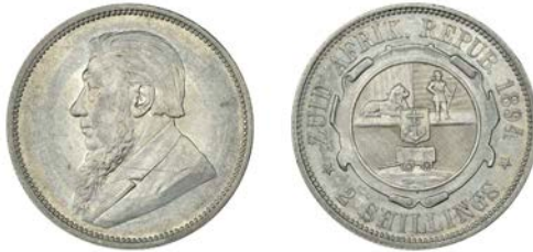
1019 Paul Kruger , Florin, 1894 (Hern Z25; KM. 6). Minor scratches in obverse field, otherwise extremely fine [slabbed NGC AU details] £100-£150