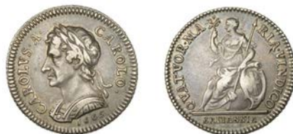
390 Pattern Farthing, 1665, by J. Roettier, in silver, bust left with short hair, rev. Britannia seated left, edge grained, 24mm, 6.38g/12h (Cooke 772; BMC 407). Good very fine, toned £200-£300