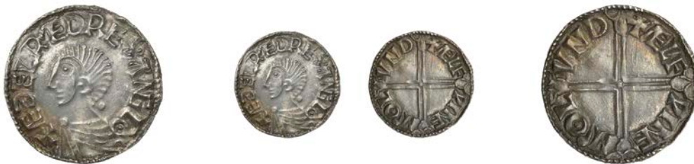
67 London , Ælfwine, ÆLPINE M o LVND, 1.56g/6h (BEH 2129ff; N 774; S 1151). Good very fine £240-£300