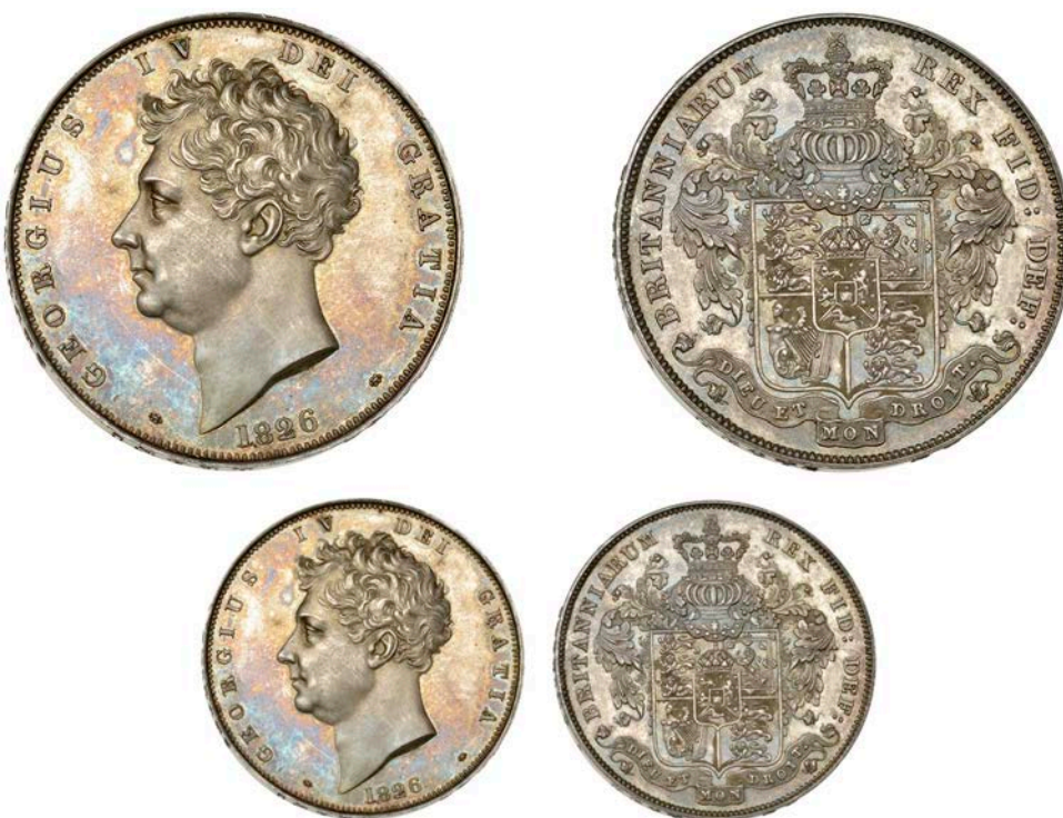
444 Proof Crown, 1826, edge SEPTIMO, 28.31g/6h (L & S 28; ESC 2336 [257]; S 3806). Minor deposit on reverse and fields lightly brushed, otherwise extremely fine and toned £4,000-£5,000