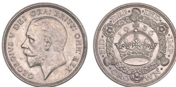
274 Crown, 1936 (ESC 3649 [381]; S 4036). Nearly extremely fine