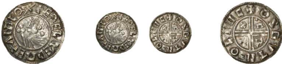
20 Lincoln , Osgvat, OSGVT M o LINC, pellet on inner circle in first quarter, 0.95g/11h (Mossop pl. vi, 4; BEH –; N 770 var.; S 1149). Slightly bent, otherwise nearly very fine, the moneyer rare for the type £240-£300