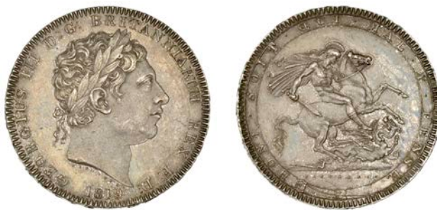
443 Crown, 1819, edge LIX (ESC 2010 [215]; S 3787). Contact marks, otherwise nearly extremely fine, toned £150-£180 Provenance: DNW Auction 136, 8-9 June 2016, lot 677