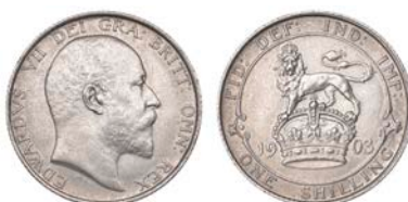
252 Shilling, 1903 (ESC 3589 [1412]; S 3982). Extremely fine or better £150-£200