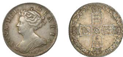
418 Shilling, 1703 vigo , second bust (ESC 1388 [1131]; S 3586). Good very fine or better, toned Provenance: SCMB January 1976 (1051)