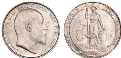
248 Florin, 1907 (ESC 3583 [925]; S 3981). A few bagmarks, otherwise about mint state with some mint bloom £200-£300