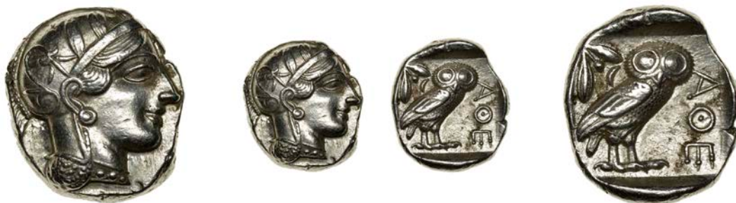
811 ATTICA, Athens , Tetradrachm, c. 450-405, similar, 17.19g (Kroll 8; Sear 2526). Good very fine £500-£700