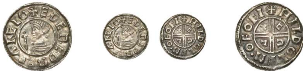
55 York , Hildulfr, HILDOLF M o EOFI, pellets by bust, reads EDERED, 1.09g/12h (cf. BEH 730; N 770 var.; S 1149). Good very fine £240-£300