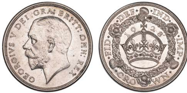
266 Crown, 1928 (ESC 3633 [368]; S 4036). A few surface marks, otherwise better than extremely fine