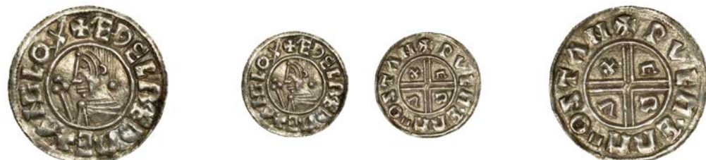
45 Stamford , Wulfmær, PVLMAER M̄O STAN, 1.01g/2h (BEH –; N 770 var.; S 1149). Good very fine and very rare