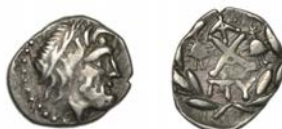
816 ACHAIAN LEAGUE, Lakedaimon , Hemidrachm, c. 80, laureate head of Zeus right, rev. Achaian league monogram flanked by piloi of the Dioskouri, contained within laurel wreath, 2.42g (BCD Peloponnesos 865; cf. BMC 79). Struck from worn dies, about very fine £200-£260