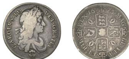
388 Shilling, 1673, second bust, plume below and in centre of rev. (ESC 525 [1038]; S 3376). About fine, very rare £500-£700