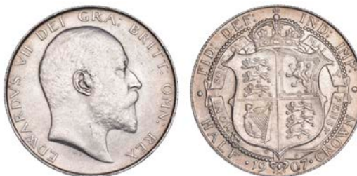
239 Halfcrown, 1907 (ESC 3573 [752]; S 3980). Slight cut on neck, otherwise good extremely fine £240-£300