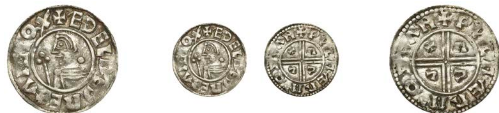
46 Stamford , Wulfmær, PVLMAER M̄O STAN, 1.08g/5h (BEH –; N 770 var.; S 1149). Nearly very fine, very rare