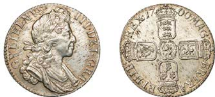
408 Shilling, 1700, fifth bust, tall Os in date (ESC 1150 [1121]; S 3516). Extremely fine Provenance: DNW Auction 142, 13-15 September 2017, lot 913