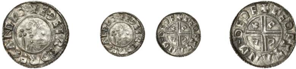
59 York , Leofstan, LEOFSTAN M o EOF, 1.28g/12h (cf. BEH 757; N 770 var.; S 1149). Very fine or better, but weak on face £200-£260