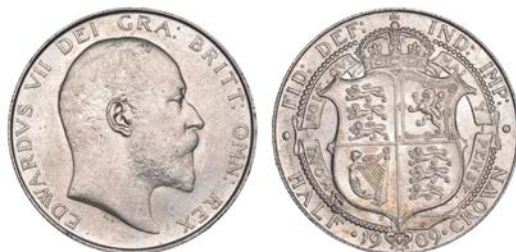
241 Halfcrown, 1909 (ESC 3575 [754]; S 3980). A few light bagmarks, otherwise virtually mint state with some original mint bloom £400-£500