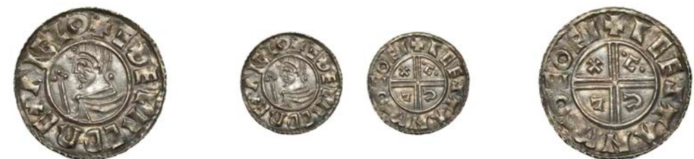
58 York , Leofstan, LEFSTAN M o EOFI, two pellets by c in first quarter, 1.10g/2h (cf. BEH 749-50; N 770 var.; S 1149). Nearly extremely fine, a stylised portrait of accomplished workmanship £300-£360