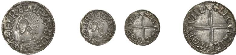
72 London , Leofric, LEOFRIC M' O LVND, 1.55g/12h (BEH 2687ff; N 774; S 1151). Slightly dished, otherwise better than very fine £240-£300