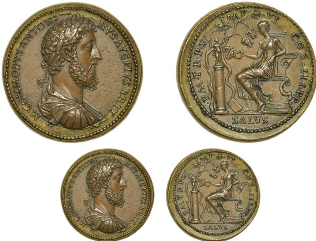
1487 Commodus , a struck bimetallic medal by G. da Cavino, copper centre with brass outer ring, M COMMODVS ANTONINVS AVG PIVS BRIT, laureate, draped and cuirassed bust right, rev. P M TR P X IMP VI COS III P P, Salus seated left, feeding snake from patera, statue of Bacchus on pillar to left, tree behind, SALVS in exergue, 40mm, 51.47g (NGA 466 = [Kress 409]; BDM I, 369). An original striking, extremely fine and extremely rare £4,000-£5,000