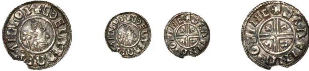
18 Lincoln , Geirfinnr, GARFIN M o LINC, 1.09g/11h (Mossop pl. iv, 23ff; BEH 1768; N 770 var.; S 1149). Small edge chip, otherwise very fine or better £200-£240