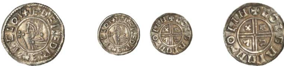
15 Lincoln , Colgrimr, COLGRIM M o LIN , reads EDERED , 0.88g/3h (Mossop pl. iv, 1ff; BEH 1703; N 770 var.; S 1149). Better than very fine £300-£360