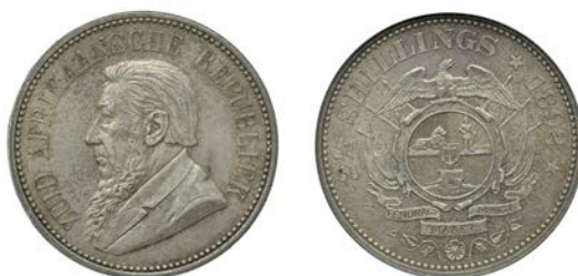
1013 Paul Kruger , Halfcrown, 1892 (Hern Z30; KM. 7). Extremely fine or better [slabbed NGC AU 58] £200-£300