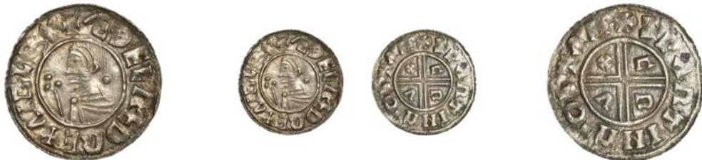
44 Stamford , Svartlingr, SPARTIN M̄O STAN, 0.82g/11h (BEH –; N 770 var.; S 1149). Nearly very fine, the moneyer very rare