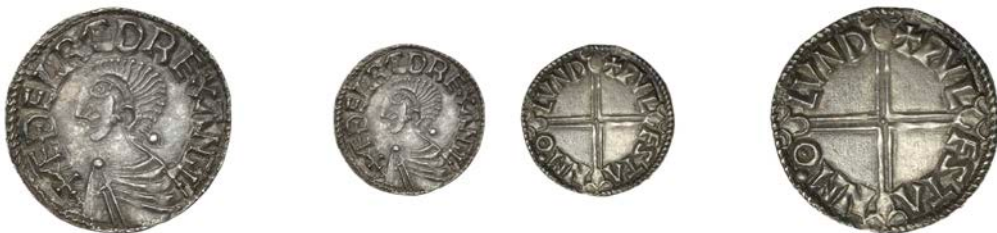
74 London , Wulfstan, PVLFSTAN M' O LVND, 1.56g/12h (BEH 2990; N 774; S 1151). Nearly extremely fine £300-£360