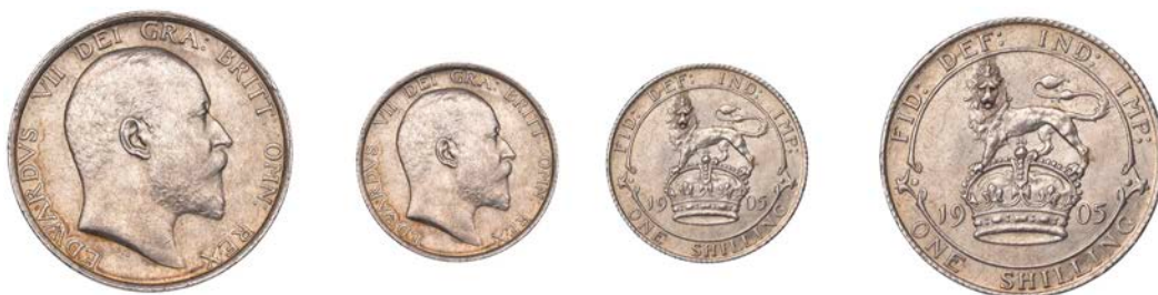
254 Shilling, 1905 (ESC 3591 [1414]; S 3982). Extremely fine, reverse better, rare £1,200-£1,500