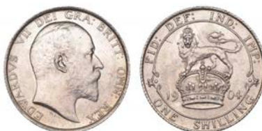
253 Shilling, 1904 (ESC 3590 [1413]; S 3982). About mint state £200-£260