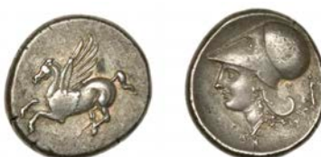
813 CORINTHIA, Corinth , Stater, c. 350-338, Pegasus flying left, rev. head of Athena left, wearing Corinthian helmet, AY to left and right, standing figure in right field, 8.62g (BMC 273). Very fine, toned £200-£260