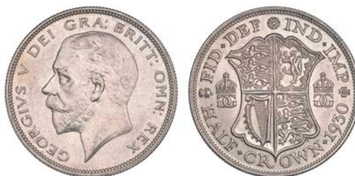
285 Halfcrown, 1930 (ESC 3739 [779]; S 4037). Better than extremely fine, rare