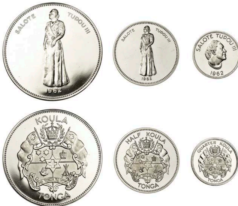
1023 Proof set, 1962, in platinum, comprising Koula, Half- and Quarter-Koula (KM. PS2) [3]. Brilliant, about as struck, extremely rare; in case of issue [this a little distressed] £2,400-£3,000 Mintage 25 sets