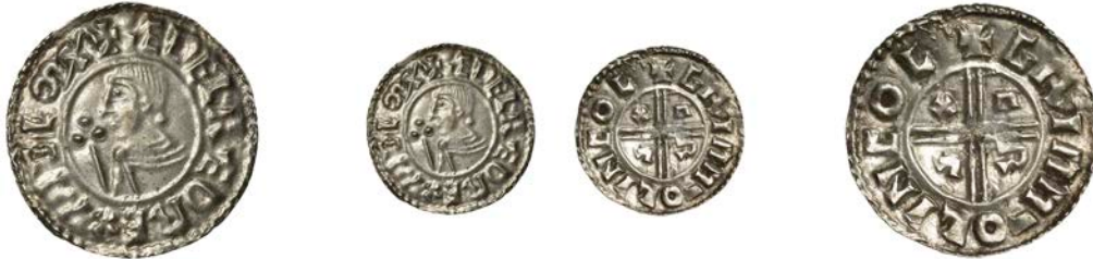
19 Lincoln , Grimr, GRIM M o LINCOL, 1.21g/3h (Mossop pl. v, 19ff; BEH 1784; N 770 var.; S 1149). Portrait weakly struck, otherwise about very fine £200-£240