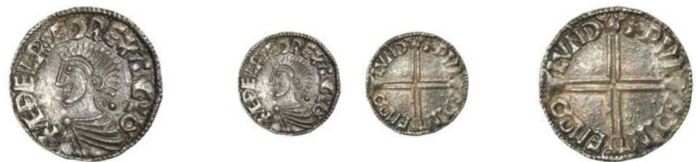
75 London , Wulfwine, PVLPINE M' O LVND, 1.71g/12h (BEH 3011; N 774; S 1151). Good very fine or better, but struck from rusty dies £300-£360