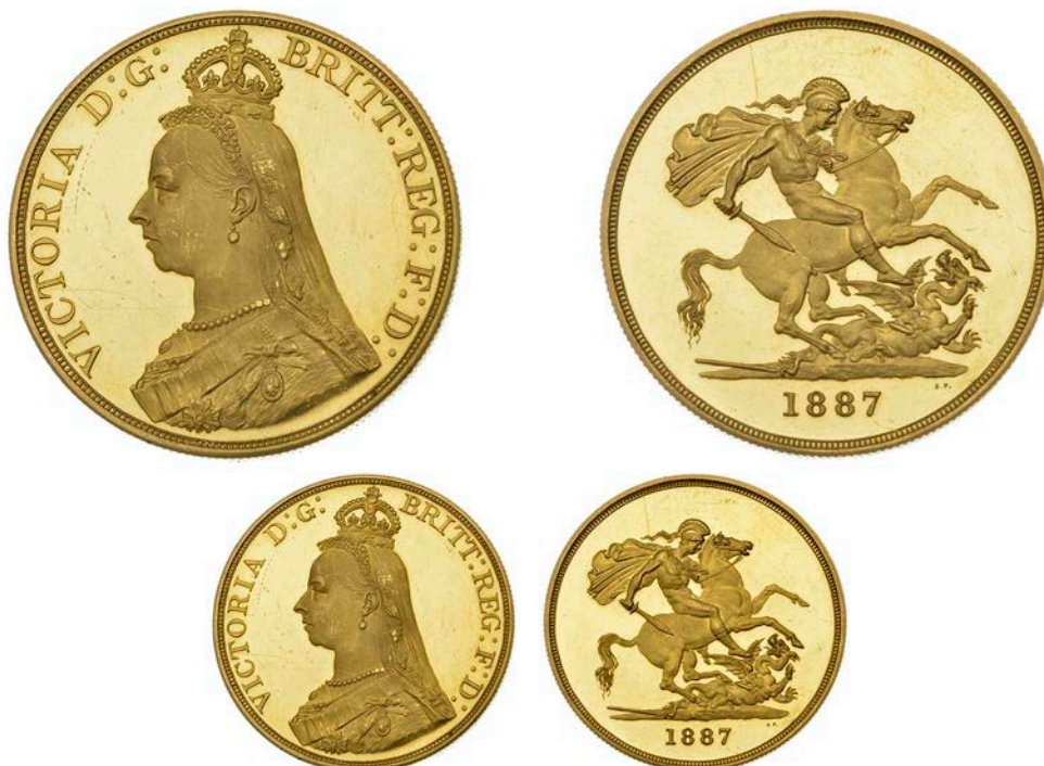
G 454 Proof Five Pounds, 1887 , with initials, edge grained, 39.90g/12h (WR 285; S 3864). Minor hairlines and surface marks, otherwise about as struck [slabbed NGC PF 61 Ultra Cameo] £24,000-£30,000