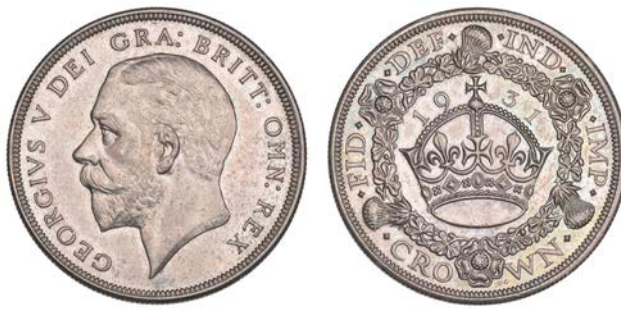
269 Crown, 1931 (ESC 3639 [371]; S 4036). Extremely fine or better