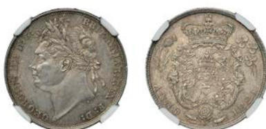
446 Shilling, 1821 (ESC 2396 [1247]; S 3810). Virtually mint state, lightly toned [slabbed NGC MS 63] £400-£500