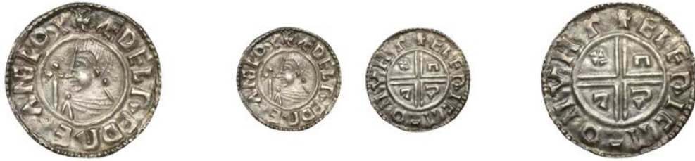
12 Huntingdon , Ælfric, ÆLFRIC M o HVNT , 1.28g/6h (Eaglen 33; BEH 1360; N 770 var.; S 1149). Very fine or better, rare £300-£400