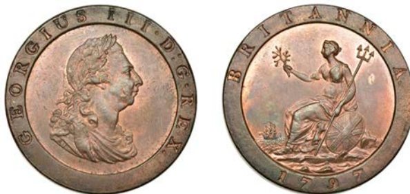
438 Penny, 1797, 10 leaves (BMC 1132; S 3777). Better than extremely fine with much original colour