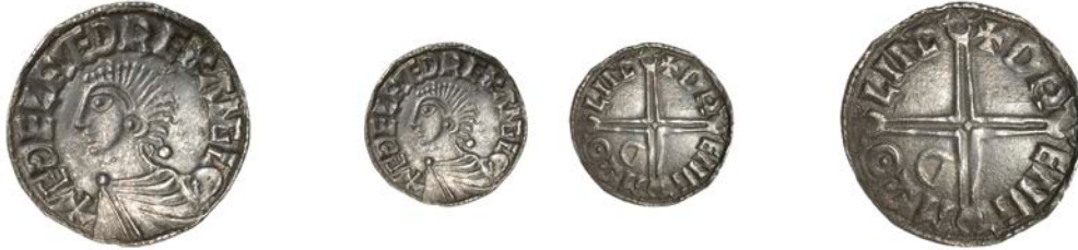
65 Lincoln , Dreng, DRENG M o LINC [NC ligulate], d in third quarter, 1.58g/6h (Mossop pl. xi, 31, same dies; SCBI Copenhagen 535; BEH 1738ff; N 774; S 1151). Slightly bent, otherwise very fine, the variety extremely rare £600-£800