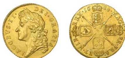
392 Guinea, 1688, second bust (MCE 130; S 3402). Good very fine £2,800-£3,000