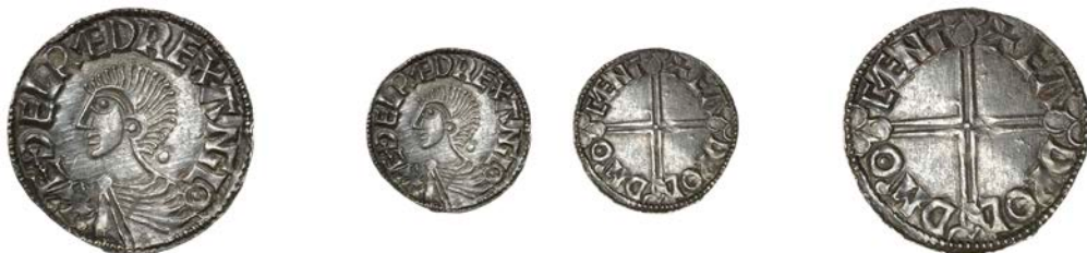
62 Canterbury , Eadweald, EADWOLD M o CÆNT, 1.63g/1h (BEH 150; N 774; S 1151). Nearly extremely fine £300-£400