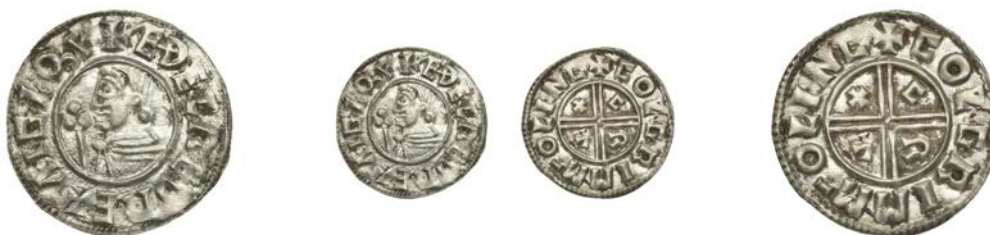
16 Lincoln , Colgrimr, COLGRIM M o LINC , 1.05g/7h (Mossop pl. iv, 17, same obv. die; cf. BEH 1705; N 770 var.; S 1149). Obverse struck from a rusty die, nearly very fine, cleaned £200-£240