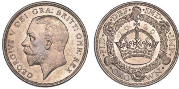
267 Crown, 1929 (ESC 3636 [369]; S 4036). A few surface marks, otherwise better than extremely fine