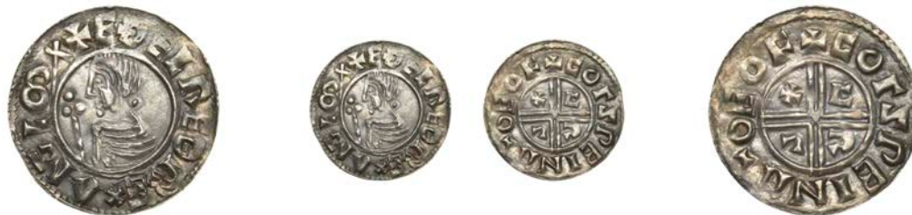
57 York , Kolsveinn, COLSPEIN (L inverted) M o EOF, 1.25g/1h (BEH –; N 770 var.; S 1149). Very fine, the moneyer apparently unpublished for York £300-£400 The moneyer is known for Lincoln in Last Small Cross type