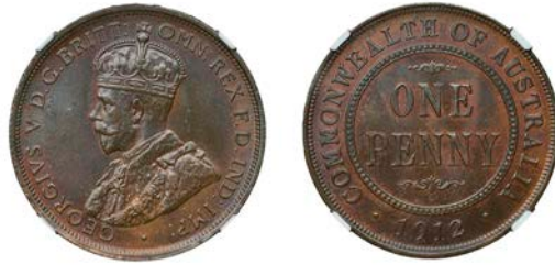
941 George V , Penny, 1912 H (KM. 23). Extremely fine, original colour [slabbed NGC MS 64 BN]