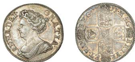
420 Shilling, 1711, fourth bust (ESC 1408 [1158]; S 3618). Light haymarking on obverse, otherwise about extremely fine with reflective fields