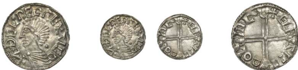
63 Lincoln , Ælfsige, ÆLSIG M o QO LINC ·, 1.46g/12h (cf. Mossop pl. viii, 18; BEH 1630; N 774; S 1151). Better than very fine £240-£300