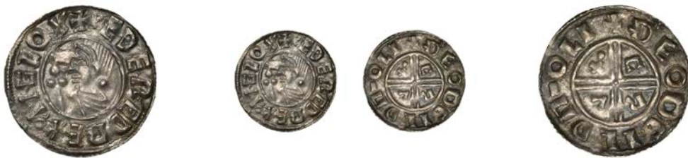
22 Lincoln , Theodgild, DEODGELD M o LI, pellet by x in fourth quarter, 1.11g/6h (cf. Mossop pl. vii, 3; cf. BEH 1932; N 770 var.; S 1149). Nearly very fine, the variety rare £200-£240