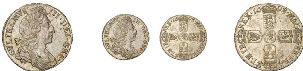
414 Sixpence, 1698, third bust, large crowns, later harp (ESC 1243 [1574]; S 3538). About mint state