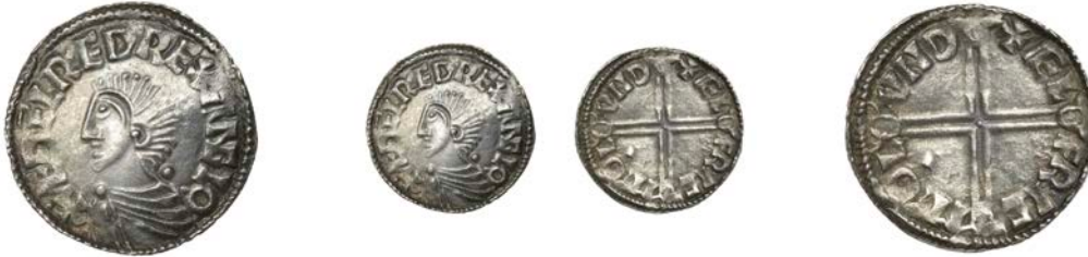
66 London , Ælfric, ÆLFRIC M o LVND, 1.61g/9h (BEH 2080; N 774; S 1151). Slightly bent, otherwise very fine or better £240-£300