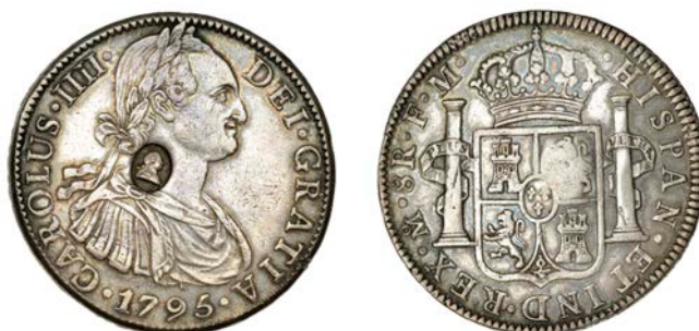
440 PERU, Charles III , 8 Réales, 1795 II , Lima, obv. countermarked with head of George III in oval, 26.93g (ESC 1858 [133]; S 3765A). Coin with nick in edge, otherwise very fine or better, countermark nearly extremely fine