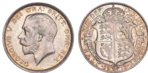
277 Halfcrown, 1913 (ESC 3712 [760]; S 4011). Good extremely fine with peripheral toning