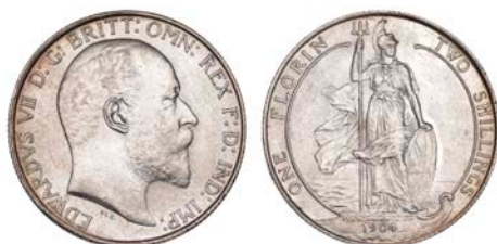
245 Florin, 1904 (ESC 3580 [922]; S 3981). Minor bagmarks, otherwise practically as struck £240-£300