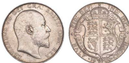
240 Halfcrown, 1908 (ESC 3574 [753]; S 3980). A few surface marks, otherwise better than extremely fine £300-£400