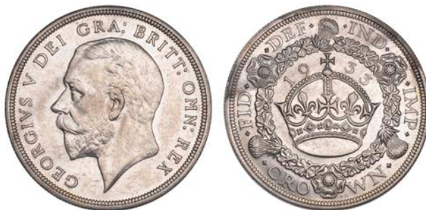
271 Crown, 1933 (ESC 3644 [373]; S 4036). Good extremely fine