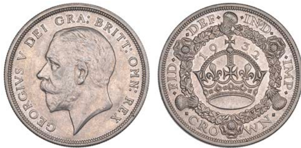
270 Crown, 1932 (ESC 3641 [372]; S 4036). About extremely fine