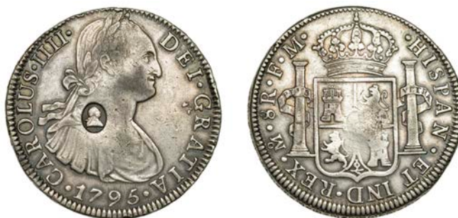
439 MEXICO, Charles III , 8 Réales, 1795 FM , Mexico City, obv. countermarked with head of George III in oval, 26.91g (ESC 1852 [129]; S 3765A). Coin nearly very fine, counterstamp better