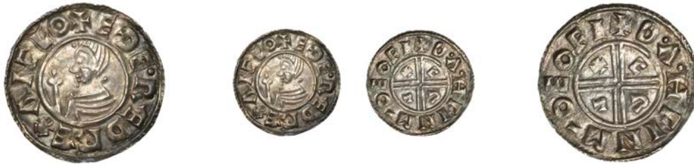
54 York , Dagfinnr, D · A · HFIN M o EOFI, pellets by bust, reads EDE · RÆD, 1.24g/3h (BEH –; 770 var.; S 1149). Good very fine with a stylised bust, very rare £300-£400 Not listed in Hildebrand for CRVX type but known for Last Small Cross