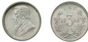
1021 Paul Kruger , Threepence, 1893 (Hern Z6; KM. 10.1). Good extremely fine [slabbed SANGS MS 62] £150-£200