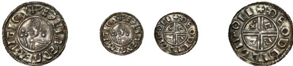
21 Lincoln , Theodgild, DEODGELD M o LI, pellet by x in fourth quarter, 1.11g/11h (cf. Mossop pl. vi, 25-pl. vii, 8; cf. BEH 1932; N 770 var.; S 1149). Good very fine, the variety rare and not recorded by Mossop £300-£360