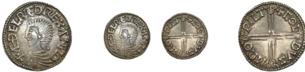
80 Wilton , Goldus, GOLDVS MDO PILT, 1.76g/9h (BEH 3996ff; N 774; S 1151). Slightly creased, otherwise nearly extremely fine £400-£500