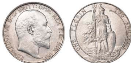
249 Florin, 1908 (ESC 3584 [926]; S 3981). Better than extremely fine, rare £240-£300