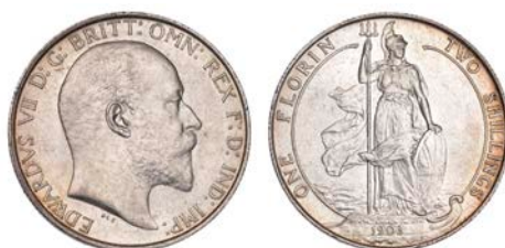
244 Florin, 1903 (ESC 3579 [921]; S 3981). A few bagmarks, otherwise about mint state, light peripheral toning £200-£300