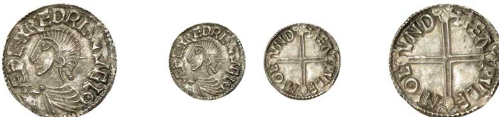
70 London , Heahwulf, HEAPVLF M o LVND, 1.39g/9h (BEH 2659; N 774; S 1151). Several obverse die cracks, good very fine £240-£300