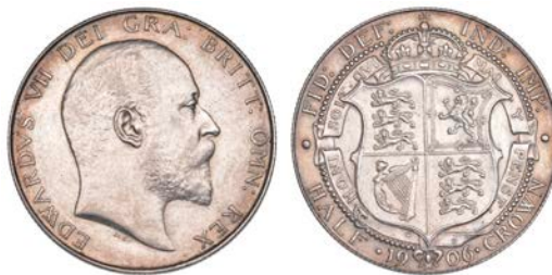
238 Halfcrown, 1906 (ESC 3572 [751]; S 3980). Extremely fine, reverse better, light peripheral toning £240-£300