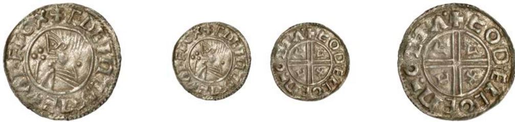
43 Stamford , Godleof, GODELEOF M̄O ZTA ·, reads VXR in quarters, 1.06g/6h (BEH –; N 770 var.; S 1149). Nearly very fine, the variety very rare