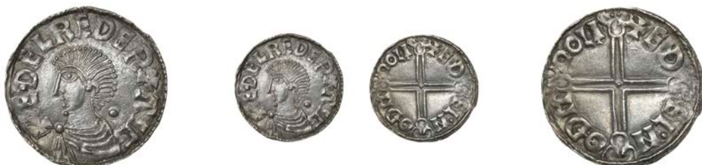
64 Lincoln , Æthelnoth, ÆDEL · NOD M o QO LI, reads ÆDELRED ERX, 1.62g/7h (Mossop pl. ix, 29, same dies; BEH –; N 774; S 1151). Nearly extremely fine, the moneyer rare £300-£360