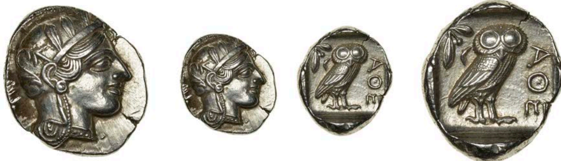
810 ATTICA, Athens , Tetradrachm, c. 450-405, similar, 17.17g (Kroll 8; Sear 2526). Two small edge splits, otherwise about extremely fine £500-£700