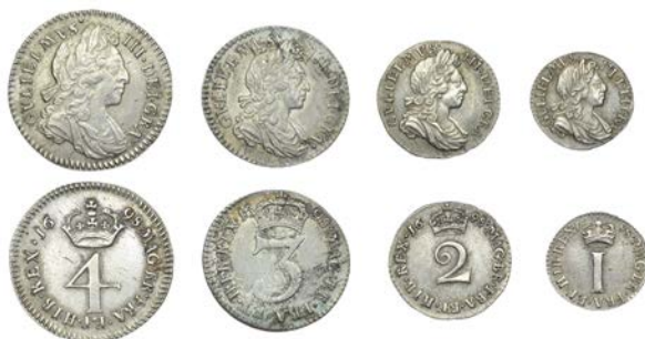
415 Maundy set, 1698 (ESC 1305 [2389]; S 3553) [4]. Cleaned, otherwise very fine