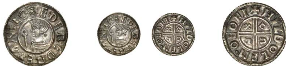
56 York , Hildulfr, HILDOLF M o EOFI, 1.20g/1h (BEH 730; N 770 var.; S 1149). Good very fine £240-£300