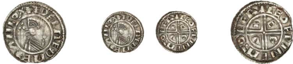
60 York , Leofwine, LEOPFINE M o EFR, 0.80g/3h (cf. BEH 763ff; N 770 var.; S 1149). Tiny edge chip, small flan, light and possibly base with an oddly abstract portrait, nearly very fine, unusual and probably very rare £200-£260 This coin contains less silver than most of the Long Cross cut halfpence in the hoard