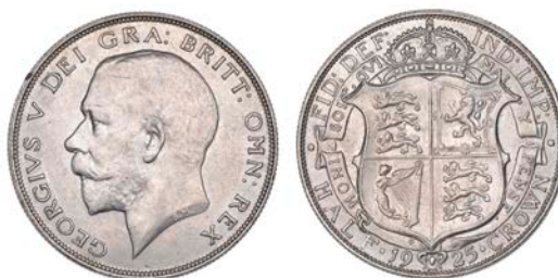
282 Halfcrown, 1925 (ESC 3727 [772]; S 4021A). Better than extremely fine