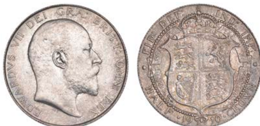
242 Halfcrown, 1910 (ESC 3576 [755]; S 3980). Some surface marks and scratches, otherwise better than extremely fine £200-£300