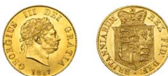
G 442 Half-Sovereign, 1817 (M 400; S 3786). Obverse scuffed, otherwise extremely fine Provenance: Bt Spink 1977