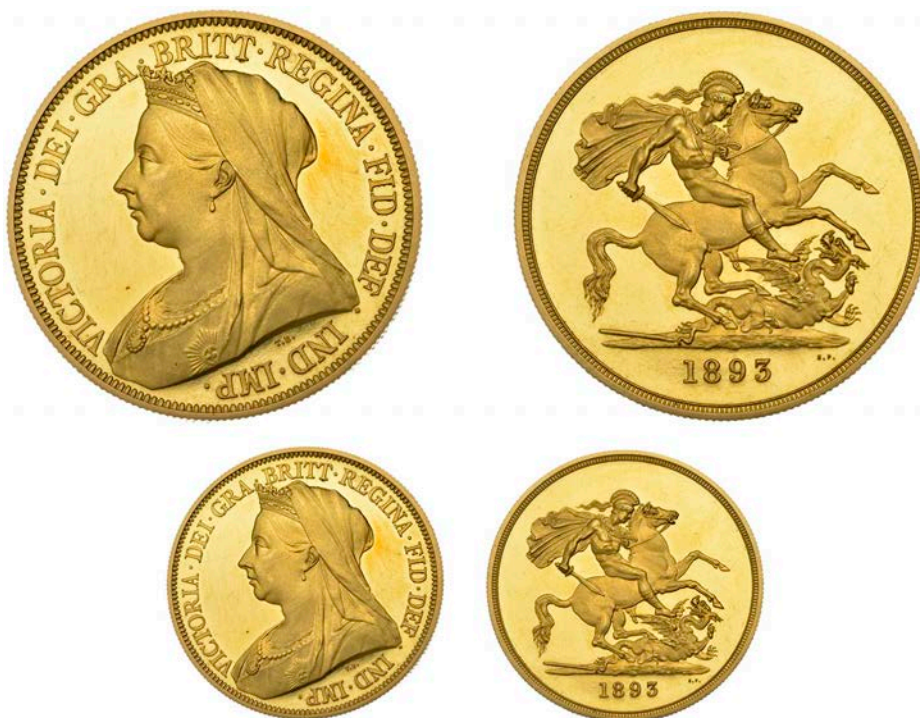
G 455 Proof Five Pounds, 1893 , edge grained, 39.92g/12h (WR 287; S 3872). Very minor surface hairlines, otherwise about as struck, brilliant [slabbed NGC PF 62 Cameo] £24,000-£30,000