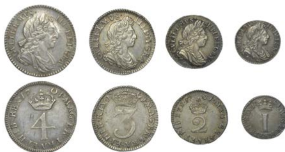
417 Maundy set, 1701 (ESC 1308 [2392]; S 3553) [4]. Very fine or better