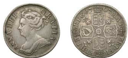
419 Shilling, 1707, third bust, plumes (ESC 1142; S 3611). Three light scratches on reverse, otherwise nearly very fine, toned