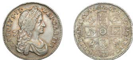
387 Shilling, 1663, first bust variety (ESC 506 [1025]; S 3372). Better than very fine, lightly toned £340-£400