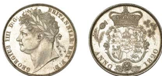
445 Halfcrown, 1820 (ESC 2357 [628]; S 3807). Some light surface marks, otherwise about as struck £500-£600