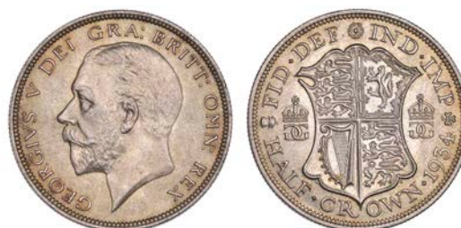
286 Halfcrown, 1934 (ESC 3747 [783]; S 4037). Virtually as struck, scarce