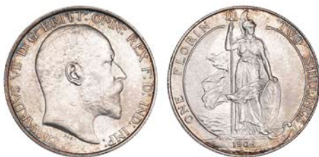
247 Florin, 1906 (ESC 3582 [924]; S 3981). A few bagmarks, otherwise practically mint state with some mint bloom £200-£300