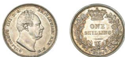
452 Shilling, 1836 (ESC 2494 [1273]; S 3835). Extremely fine