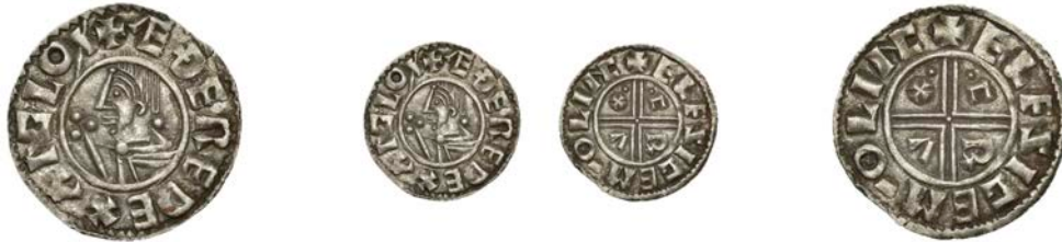
13 Lincoln , Ælfsige, ÆLSIGE M o LINC , NC ligulate, reads ÆDERED EX , pellet by c and x in first and fourth quarters, 1.05g/4h (Mossop pl. iii, 29-31; cf. BEH 1627; N 770 var.; S 1149). Very fine, portrait a little better £240-£300