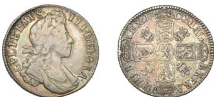
410 Shilling, 1701, plumes (ESC 1157 [1125]; S 3517). Smoothed on face, otherwise good fine