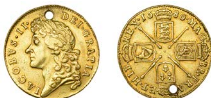
391 Guinea, 1686, second bust (MCE 126; S 3402). Nearly very fine but pierced and polished £300-£400