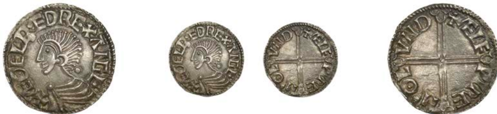
68 London , Ælfwine, ÆLPINE M o LVND, 1.57g/9h (BEH 2129ff; N 774; S 1151). Slightly buckled, otherwise good very fine £240-£300