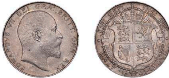
237 Halfcrown, 1905 (ESC 3571 [750]; S 3980). A few tiny surface and rim marks, otherwise virtually mint state, lightly toned, very rare £8,000-£10,000