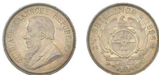
1017 Paul Kruger , Halfcrown, 1896 (Hern Z34; KM. 7). About as struck [slabbed NGC MS 61] £80-£100