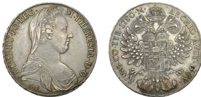
944 Maria Theresa , Thaler, 1780 SF , Günzburg (Eyp. 193a; Dav. 1151A). Good very fine and toned, rare This coin does not have the round brooch and pointed shield characteristic of Italian restrikes of this type