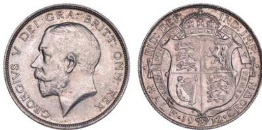
276 Halfcrown, 1912 (ESC 3711 [759]; S 4011). Virtually mint state, lightly toned