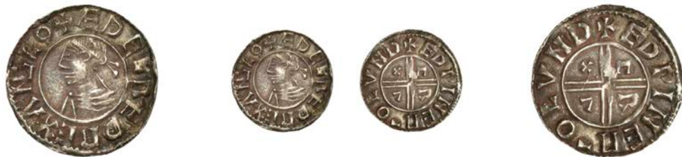
61 London , Eadwine, EDWINE M o LVND, diademed head left with hair ties, no sceptre , 1.04g/6h (BEH 2483; N 771; S 1148 var.). Very fine and extremely rare £800-£1,000