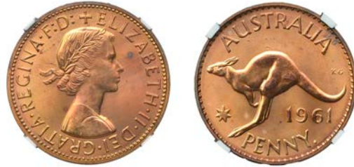
942 Elizabeth II , Proof Penny, 1961, edge plain, 12h (KM. 56). Some spotting and minor marks, partially toned, otherwise virtually as struck [slabbed NGC PF 64 RD]