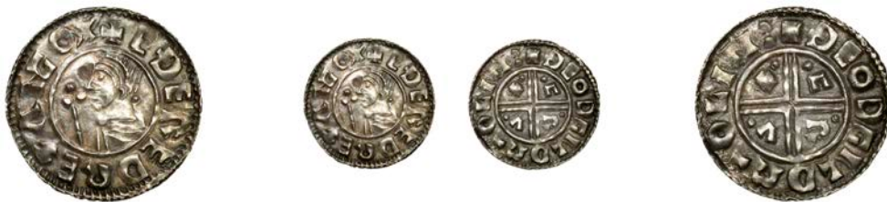
23 Lincoln , Theodgild, DEODGILD M o LIN, reads EDERED, pellets by letters in all four quarters, 1.02g/3h (cf. Mossop pl. vi, 27; BEH 1937-8; N 770 var.; S 1149). Very fine, variety not recorded by Mossop £240-£300