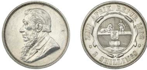
1018 Paul Kruger , Florin, 1892 (Hern Z23; KM. 6). Extremely fine or better [slabbed NGC Unc Details – Cleaned] £80-£100