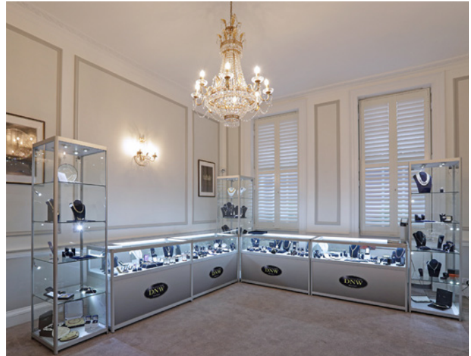
Jewellery viewing room

We hold over 20 auctions each year, the full contents of which are published on the internet around one month before the sale date, together with a unique preview facility which is available as lots are catalogued and photographed. Printed auction catalogues are published three weeks prior to each sale.