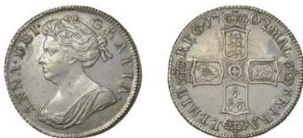
183 Shilling, 1702, first bust (ESC 1385 [1128]; S 3583). Light scratch in reverse field, otherwise good very fine, attractively toned £500-£600