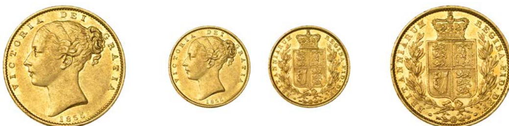
G 213 Sovereign, 1855, ww incuse (M 38; S 3852D). Good very fine £400-£500

The RMS Douro sank off Cape Finisterre on 2 April 1882 following a collision with the Spanish steamer Yrurac Bat. Her cargo of sovereigns was salvaged in 1995