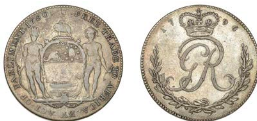
481 George III , Ackey, 1796, reads PARLIMENT (Vice 1; KM. Tn6). About very fine, very rare