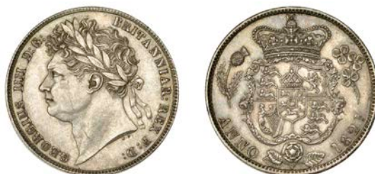
204 Halfcrown, 1821 (ESC 2360 [631]; S 3807). Minor surface marks, otherwise nearly extremely fine