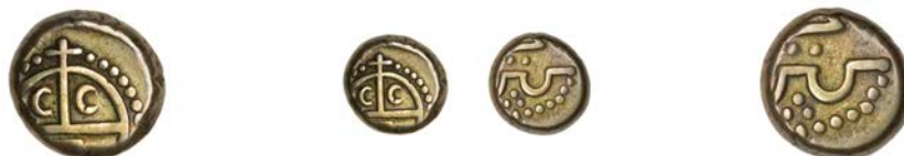
594 BENKULEN, East India Co (Madras Presidency) , 3 Fanams [1693], for Fort York, 3.25g/9h (Stevens 6.3; Pridmore, SNC November 1974, 1; KM. 3). Off-centre as usual, otherwise fine, very rare