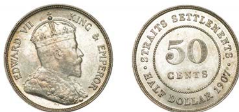
590 CROWN COLONY, Edward VII , 50 Cents, 1907H (Prid. 33; KM. 24). Bright appearance, extremely fine, bagmarked