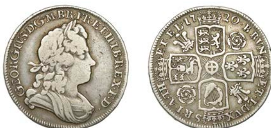
188 Halfcrown, 1720, roses and plumes, edge SEXTO (ESC 1556 [591]; S 3642). Fine, reverse better, toned £200-£260