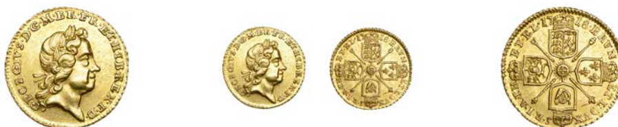
65 Quarter-Guinea, 1718 (MCE 277; S 3638). Nearly extremely fine