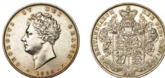
90 Halfcrown, 1826 (ESC 2375 [646]; S 3809). Extremely fine but with minor edge bruises on obverse