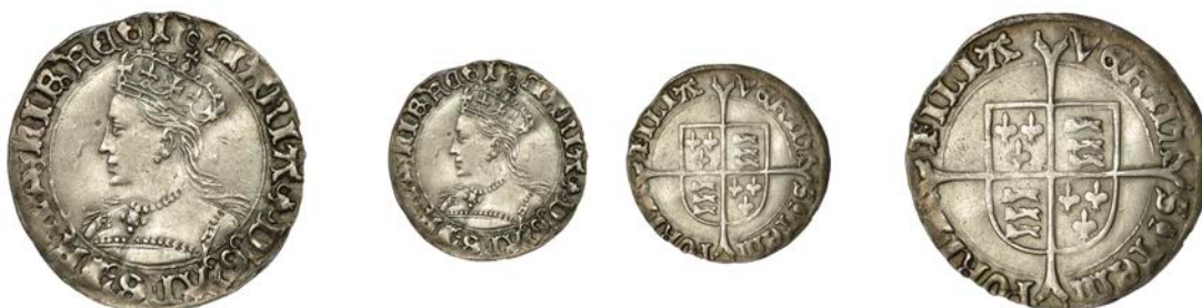
38 Groat, mm. pomegranate, 2.03g/2h (N 1960; S 2492). Very fine