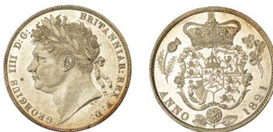
88 Halfcrown, 1821 (ESC 2360 [631]; S 3807). Extremely fine