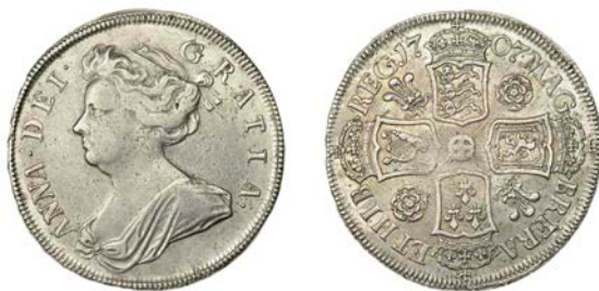
175 Halfcrown, 1707, roses and plumes, edge SEXTO (ESC 1364 [573]; S 3582). Very fine, has been cleaned, now toned £180-£220