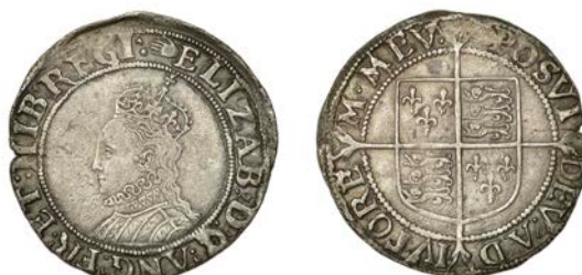
42 Sixth issue, Shilling, mm. hand, bust 6B, 5.58g/12h (N 2014; S 2577). Some surface marks, otherwise very fine, toned £150-£200