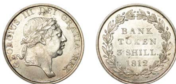
199 Three Shillings , 1812, type 2 (ESC 2079 [416]; S 3770). A few minor surface marks, otherwise about as struck £150-£200