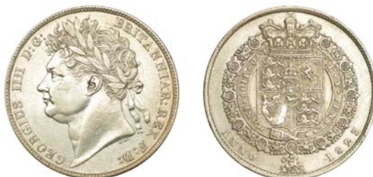
89 Halfcrown, 1823, type 2 (ESC 2365 [634]; S 3808). Light surface marks, otherwise about extremely fine