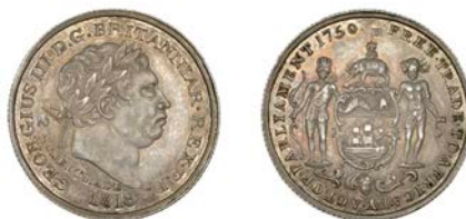
484 George III, Half-Ackey, 1818 (Vice 6; KM. 8). Light scratches on reverse, otherwise extremely fine, toned