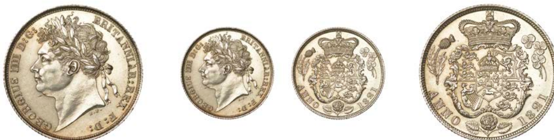
91 Shilling, 1821 (ESC 2396 [1247]; S 3810). Extremely fine or better