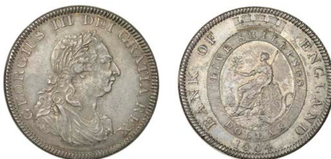
198 Dollar , 1804, types A/2, leaf to upright of E in DEI, pellet after REX (ESC 1925 [144]; S 3768). Good very fine, toned £240-£300