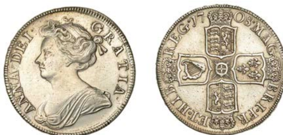
63 Halfcrown, 1708, edge SEPTIMO (ESC 1370 [577]; S 3604). Lightly cleaned and scratched in hair, otherwise extremely fine £200-£260