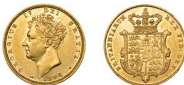
G 203 Sovereign, 1826 (M 11; S 3801). Obverse surface marks, otherwise nearly extremely fine, reverse better