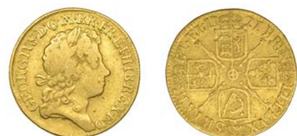
185 Guinea, 1721, fourth bust (MCE 253; S 3631). Nearly fine £400-£500