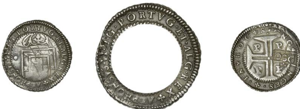
667 Pedro II , countermarked coinage, 250 Réis, a Porto Half-Cruzado of John IV with circular counterstamps on both sides bearing new legends, obv. reading ALPHONSVS VI D G PORTVG ET ALG REX, rev. reading IN HOC SIGNO VINCES, rev. also countermarked '250' beneath lis, 10.74g (Gomes 111.07). Good very fine, extremely rare [slabbed NGC c/s AU weak] £2,000-£2,600 Circular counterstamps of this type almost always bear the name of John IV; those in the name of Alfonso VI are all extremely rare