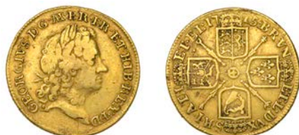
184 Guinea, 1715, third bust (MCE 247; S 3630). Fine £500-£600