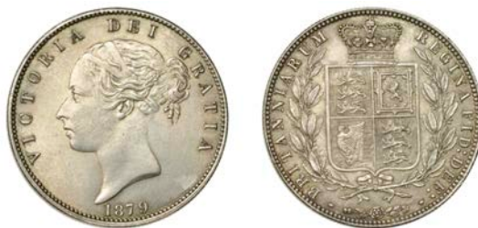
230 Halfcrown, 1879 (ESC 2753 [703]; S 3889). Extremely fine, toned £200-£260