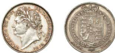
206 Shilling, 1824 (ESC 2400 [1251]; S 3811). Nearly extremely fine, lightly toned