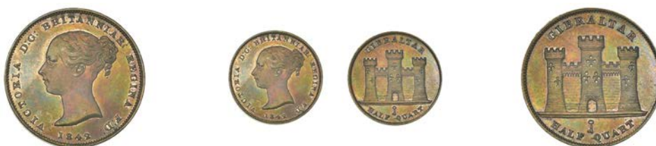
478 Victoria , Half-Quart, 1842 (Prid. 10; KM. 1). Virtually as struck, deep red-gold tone over reflective surfaces, most attractive