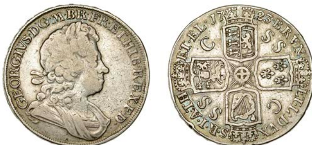
187 Crown, 1723 ss c, edge DECIMO (ESC 1545 [114]; S 3640). Die-alignment 5 o'clock, fine, reverse better but with small edge knock £460-£500