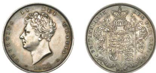
205 Proof Halfcrown, 1826, edge grained, 14.13g/6h (ESC 2376 [647]; S 3809). About extremely fine