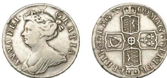
180 Halfcrown, 1709 plain, edge OCTAVO (ESC 1371 [579]; S 3604). Good fine, toned £180-£220