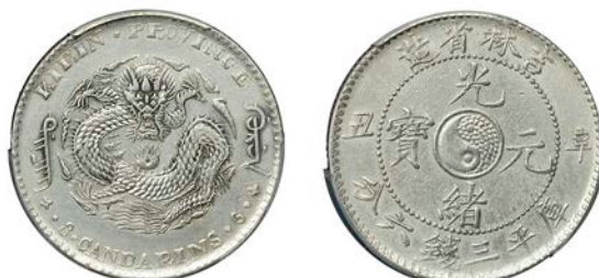
630 EMPIRE, Kirin, 50 Cents, 1901 (L & M 538; KM. Y182a.1). Extremely fine [slabbed PCGS Genuine, Environmental Damage - AU Detail] £200-£260