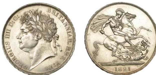
87 Crown, 1821, edge SECUNDO (ESC 2310 [246]; S 3805). Light surface marks, otherwise nearly extremely fine