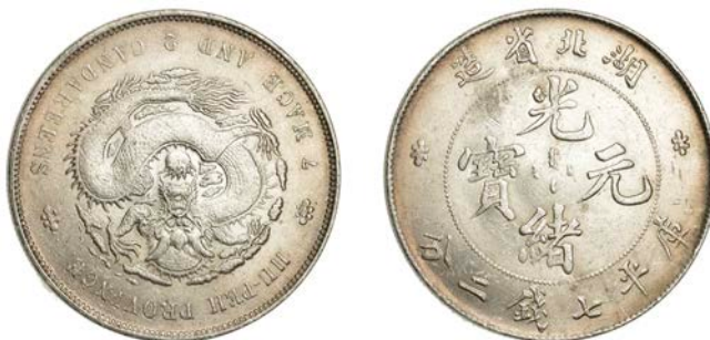
626 EMPIRE, Hupeh, Dollar, undated [1895-1907] (L & M 182; KM. Y127.1). A few minor marks, otherwise good extremely fine £800-£1,000 Provenance: Teutoburger Auction 112 (Borgholzhausen), 23-4 February 2018, lot 15