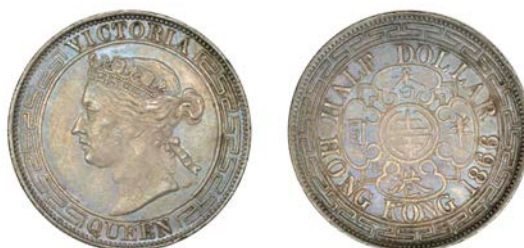
489 Victoria, Half-Dollar, 1866 (Prid. 4; KM. 8). Good very fine, toned