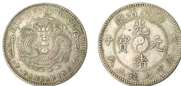
628 EMPIRE, Kirin, Dollar, 1900 (L & M 526; KM. Y183a). Tooled in places, otherwise very fine, rare [with NGC slab tag XF Details - Repaired] £600-£800 Provenance: Ginza Coins Auction 88 (Tokyo), 9 June 2018, lot 353