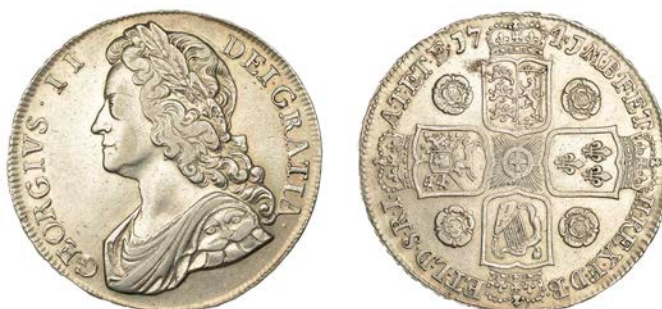
68 Crown, 1741, roses, edge DECIMO QVARTO (ESC 1666 [123]; S 3687). About very fine, reverse better