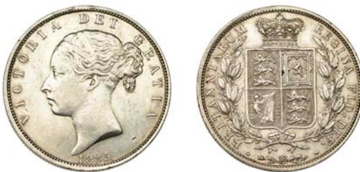
234 Halfcrown, 1885 (ESC 2765 [713]; S 3889). Almost extremely fine, toned £140-£180