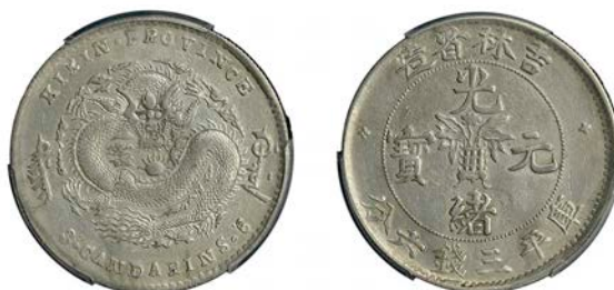
629 EMPIRE, Kirin, 50 Cents, undated [1898] (L & M 511; KM. Y182). Very fine [slabbed PCGS Genuine, Bent - XF Detail] £200-£260