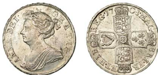
176 Halfcrown, 1708, plain, edge SEPTIMO (ESC 1370 [577]; S 3605). Almost extremely fine or better but with light haymarking and has been lightly cleaned at some time £700-£900