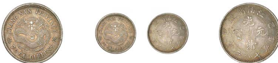
627 EMPIRE, Kiangnan, 10 Cents, 1905 (L & M 266; KM. Y142a.15). Extremely fine, toned £200-£260 Provenance: Ginza Coins Auction 88 (Tokyo), 9 June 2018, lot 350