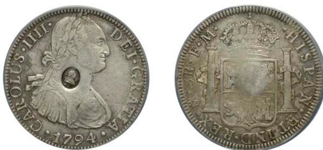
196 MEXICO, Charles III , 8 Réales, 1794 FM , Mexico City, obv. countermarked with head of George III in oval (ESC 1852 [129]; S 3765A). About very fine [slabbed PCGS XF 40] £240-£300