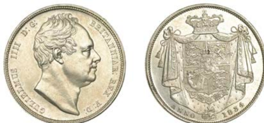
209 Halfcrown, 1834, script initials (ESC 2478 [662]; S 3834). Better than extremely fine £400-£460