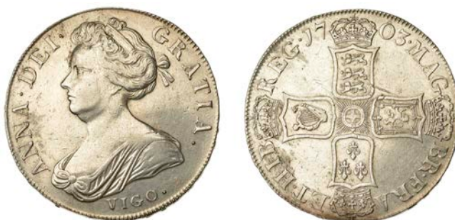
62 Crown, 1703 VIGO, edge TERTIO (ESC 1340 [99]; S 3576). Several light scratches, otherwise good very fine £600-£800