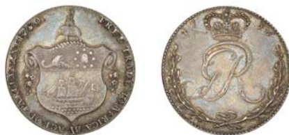
483 George III, Half-Ackey, 1796, reads PARLIAMENT (Vice 5; KM. Tn4). Good very fine and toned, rare