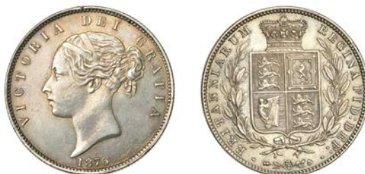
228 Halfcrown, 1876 (ESC 2748 [699]; S 3889). Lightly cleaned at some time, now toned, otherwise good extremely fine £200-£260