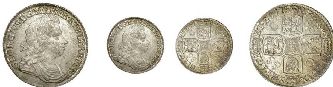
189 Shilling, 1723 ss c, first bust (ESC 1586 [1176]; S 3647). Virtually mint state with attractive light toning £340-£400