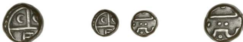
597 BENKULEN, East India Co (Madras Presidency) , Cash, second issue [c. 1695], for Fort York, 3.37g/9h (Stevens 6.7; Pridmore, SNC November 1974, 5; KM. 1). Very fine

Provenance: With Spink 1976; bt Baldwin May 1979