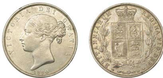
231 Halfcrown, 1880 (ESC 2756 [705]; S 3889). Lightly cleaned at some time, otherwise good very fine but a small spot on reverse £200-£260