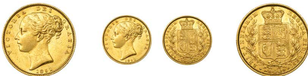
G 212 Sovereign, 1851 (M 34; S 3852C). Some contact marks, otherwise about extremely fine £400-£500