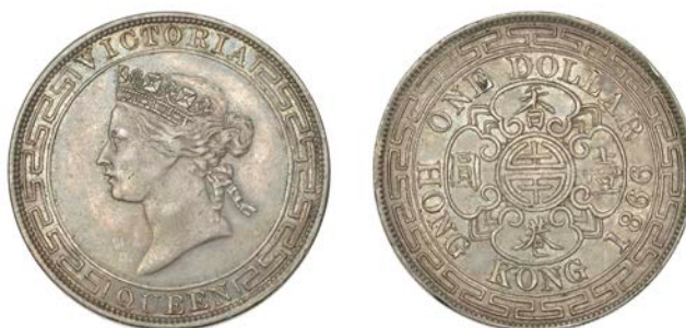
488 Victoria, Dollar, 1866 (Prid. 1; KM. 10). Good very fine, attractively toned