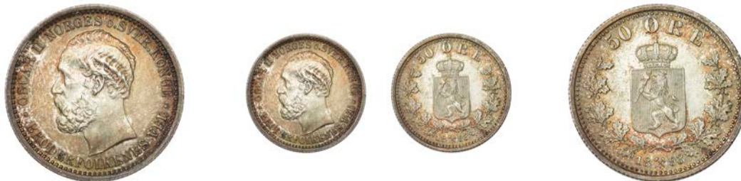
664 Oscar II , 50 Øre, 1893, Kongsberg (NM 59; KM. 356). About as struck, attractively toned £240-£300