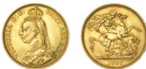
G 211 Two Pounds, 1887 (S 3865). About extremely fine £700-£900