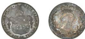
485 George III, Quarter-Ackey, 1796, reads PARLIAMENT (Vice 7; KM. Tn2). Proof-like, traces of lacquer on reverse, otherwise extremely fine and toned, scarce