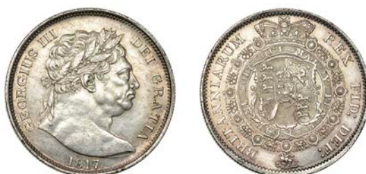
201 Halfcrown , 1817, large head (ESC 2090 [616]; S 3788). Minor edge nicks, otherwise about extremely fine £260-£300