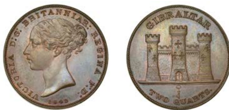
476 Victoria , 2 Quarts, 1842/1 (Prid. 2; KM. 3). Extremely fine, reflective surfaces