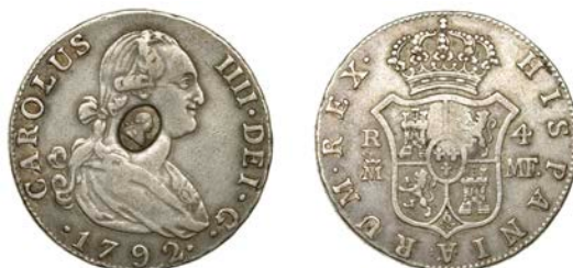
197 SPAIN, Charles III , 4 Réales, 1792 MF , Madrid, obv. countermarked with head of George III in oval (ESC 1875 [611]; S 3767). Coin nearly very fine, countermark better £240-£300