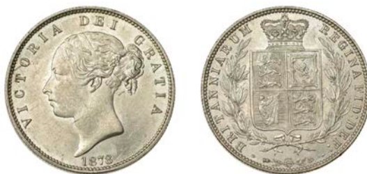
229 Halfcrown, 1878 (ESC 2751 [701]; S 3889). Light surface marks, otherwise good extremely fine, some original brilliance £240-£300