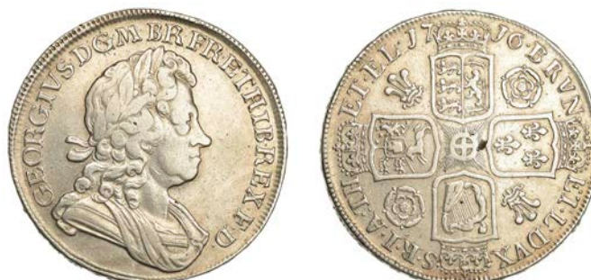
66 Crown, 1716, roses and plumes, edge SECUNDO (ESC 1540 [110]; S 3639). Nearly very fine