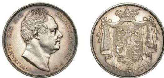
208 Halfcrown, 1834, block initials (ESC 2474 [660]; S 3834A). Nearly extremely fine and toned, scarce £400-£500