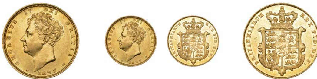
G 86 Sovereign, 1827 (M 12; S 3801). Nearly extremely fine