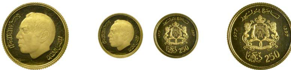
G 663 al-Hasan II , Proof 250 Dirhams, 1977/1397h (KM. Y66; F 6). As struck; in Royal Mint case of issue £200-£260