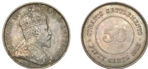
589 CROWN COLONY, Edward VII , 50 Cents, 1903 (Prid. 31; KM. 23). Good very fine, streaky tone Provenance: Bt Seaby 1975