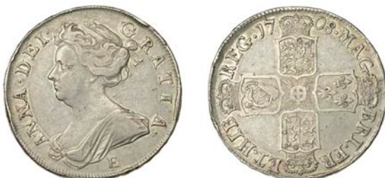
177 Halfcrown, 1708E, plain, edge SEPTIMO (ESC 1382 [576]; S 3605). About very fine £200-£260