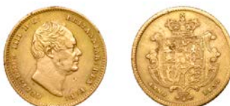
G 207 Half-Sovereign, 1836 (M 412; S 3831). A few rim nicks and marks, otherwise fine