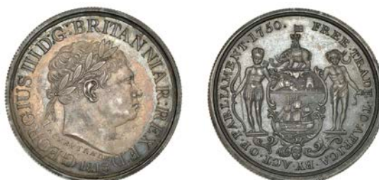
482 George III , Ackey, 1818 (Vice 3; KM. 9). Uneven toning on obverse, otherwise extremely fine, scarce