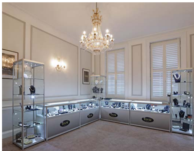
Jewellery viewing room

We hold over 20 auctions each year, the full contents of which are published on the internet around one month before the sale date, together with a unique preview facility which is available as lots are catalogued and photographed. Printed auction catalogues are mailed to subscribers approximately three weeks prior to each sale.