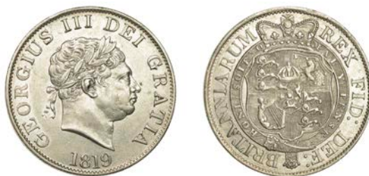
202 Halfcrown, 1819 (ESC 2102 [623]; S 3789). Nearly extremely fine