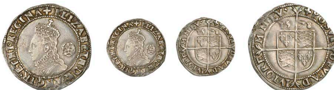
41 Fifth issue, Sixpence, 1578, mm. Greek cross, bust 5A, 3.27g/8h (N 1997; S 2572). About very fine