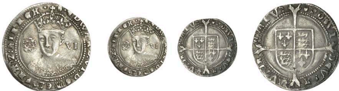
37 Third period, Fine issue, Sixpence, Tower, mm. tun, 2.93g/11h (N 1938; S 2483). Struck slightly off-centre, otherwise abut very fine and toned with an attractive portrait £200-£260