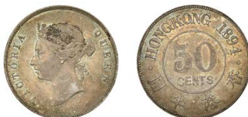
490 Victoria, 50 Cents, 1894 (Prid. 12; KM. 9.1). About extremely fine, attractively toned