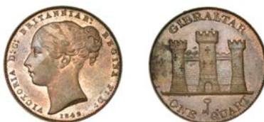
477 Victoria , Quart, 1842/0 (Prid. 6; KM. 2). Extremely fine, obverse with almost full original colour, reverse stained at left