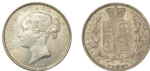
233 Halfcrown, 1884 (ESC 2764 [712]; S 3889). Minor rim nicks, otherwise extremely fine £140-£180