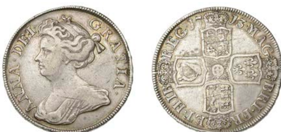
182 Halfcrown, 1713, plain, edge DVODECIMO (ESC 1376 [583]; S 3604). Very fine £360-£400