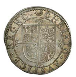
116 Briot's Second Milled issue, Shilling, mm. anchor (flukes to right) and signed B both sides, 5.91g/6h (SCBI Brooker 725-6, same dies; N 2305; S 2859). Adjustment marks on bust, otherwise nearly extremely fine £500-£700