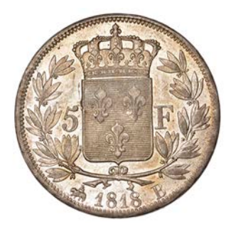
584 Louis XVIII (Second reign), 5 Francs, 1818<sub>B</sub>, Rouen (Gad. 614; KM. 711.2). Extremely fine with some toning £150-£180