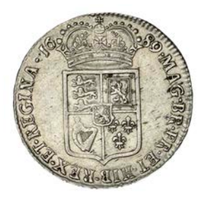
280 Halfcrown, 1689, first shield, caul only frosted, pearls, edge PRIMO (ESC 831; S 3434). Cleaned and with two flan flaws on obverse, otherwise very fine £150-£180