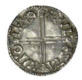
168 Penny, Long Cross type, London, Wulfstan, PVLFSTAN M'O LVND, 1.37g/12h (SCBI Copenhagen 964; BEH 2990-1; N 774; S 1151). A few peckmarks on reverse and flan slightly crimped, otherwise about extremely fine £300-£400