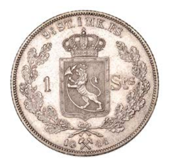
644 Carl XIV Johan , Speciedaler, 1844, Kongsberg (NM 15; Dav. 242; KM. 313). Lightly cleaned, otherwise extremely fine, scarce