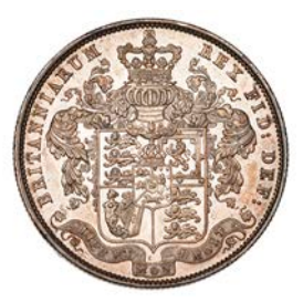
362 Halfcrown, 1825 (ESC 2371; S 3809). Sometime cleaned, otherwise nearly extremely fine, reverse better £200-£300