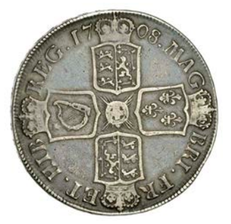
293 Crown, 1708E, edge SEPTIMO (ESC 1356; S 3600). Scratch on forehead and obverse sometime lightly cleaned, otherwise good fine £100-£120