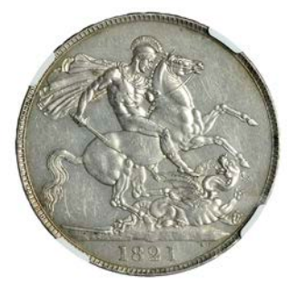
359 Crown, 1821, edge SECUNDO (ESC 2310; S 3805). Cleaned, otherwise extremely fine [slabbed NGC AU Details, Surface Hairlines]