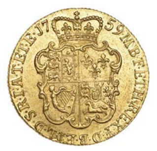
300 Guinea, 1759 (EGC 622; $ 3680). Light surface marks, otherwise good extremely fine, peripheral mint bloom £2,400-£3,000