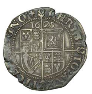
110 Tower mint, Sixpence, Gp A, type 1, 1625, mm. lis, reads MAG BR FR ET HI, rev. mint mark to left of cross, 2.77g/3h (cf. SCBI Brooker 572; N 2235; S 2805). A couple of small edge splits and a little weak in places, otherwise good fine, reverse better £150-£200