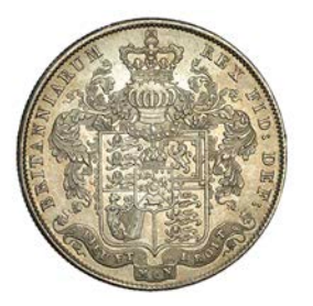
363 Halfcrown, 1826 (ESC 2375; S 3809). Good extremely fine