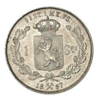
645 Oscar I, Speciedaler, 1857, Kongsberg (NM 8; Dav. 243; KM. 317). Extremely fine, very rare