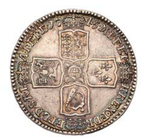
303 Halfcrown, 1745/3, LIMA, edge DECIMO NONO (ESC 1687a; S 3695). Very fine, reverse better