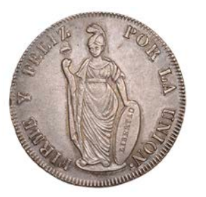
646 Republic, 4 Réales, 1851 MB, Lima (KM. 151.3). About extremely fine, toned