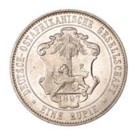
590 Wilhelm II, Rupie, 1897 (KM. 2). Extremely fine