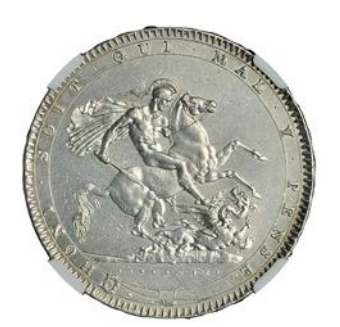
335 Crown, 1820, edge Lx (ESC 2016; S 3787). Cleaned, some contact marks, otherwise extremely fine [slabbed NGC UNC Details, Surface Hairlines] £200-£260