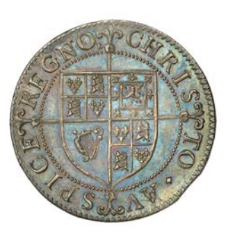
115 Briot's First Milled issue, Sixpence, mm. flower and signed B on obv . only, reads BRITANN, 3.00g/3h (SCBI Brooker 719, same dies; N 2301; S 2855). Almost mint state £1,000-£1,200