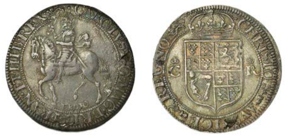
130 York mint, Halfcrown, Gp 3 [type 5], mm. lion, rev. square-topped shield, 14.53g/12h (Bull 568; Besly 3A; SCBI Brooker 1081, same dies; N 2313; S 2867). Flan flaws both sides, otherwise good very fine £600-£800