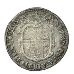
69 Shilling, 1555, English titles and mark of value, 5.62g/6h (N 1968; S 2501). Fine, but obverse very scratched £150-£180