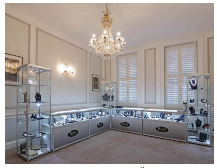
Jewellery viewing room

Our offices, open from 9.30am-5pm, Monday to Friday, include viewing rooms, normally enabling us to offer viewing prior to each auction.