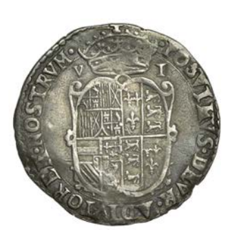
70 Sixpence, 1554, full titles, 3.06g/7h (N 1970; S 2505). Creased and scratch on obverse, otherwise about very fine, good portraits £500-£700