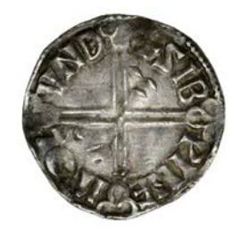
167 Penny, Long Cross type, London, Sibwine, SIBPINE M'O LVND, 1.69g/6h (SCBI Copenhagen 930, same dies; BEH 2901; N 774; S 1151). Peckmarked and flan lightly crimped, otherwise very fine, toned £200-£260