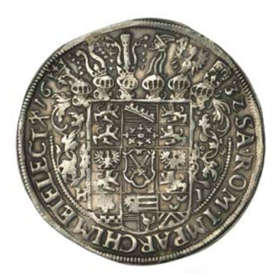
609 SAXONY , Johann Georg I , Thaler, 1632, Dresden, 28.91g/10h (Schnee 845; Dav. 7601). Traces of mounting, otherwise good very fine