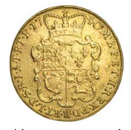
298 Two Guineas, 1740/39 (EGC 575; S 3668). Gilt and removed from a ring mount, fine