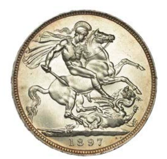
392 Crown, 1897, edge LX (ESC 2602; S 3937). Of bright appearance, minor surface marks, otherwise virtually as struck, reflective fields