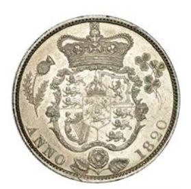
360 Halfcrown, 1820 (ESC 2357; S 3807). Light surface marks, otherwise good extremely fine, reflective fields £300-£400