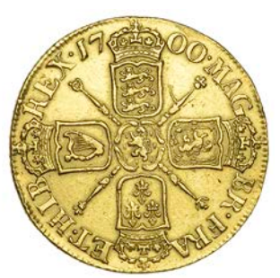
284 Guinea, 1700, second bust (EGC 423; $ 3461). Possibly removed from a mount, otherwise about very fine £800-£1,000