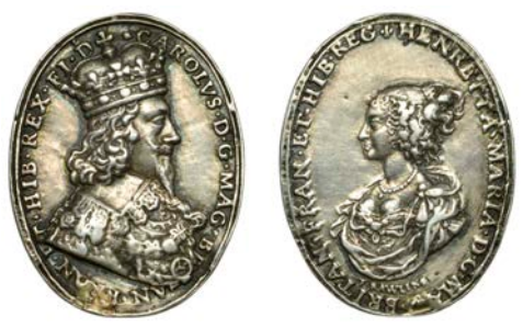
1020 Charles I and Henrietta Maria, a cast silver badge by T. Rawlins, similar, 42 x 32mm, 11.43g (MI I, 354/215; E 169). Cast and chased, repaired at 6 o'clock, otherwise fine £200-£300