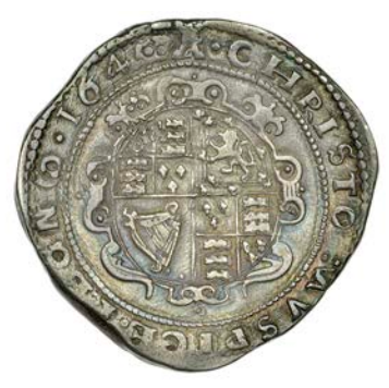
128 Exeter mint, Crown, 1645, mm. castle, date to left of mm., 28.55g/10h (Besly D26; SCBI Brooker 1044, same obv . die; N 2561; S 3062). Nearly very fine, toned