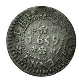
801 Co CORK, Kinsale , Corporation, Penny, 1659, 3.60g/5h (N –; Macalister 375; BW. 545). Fine, patinated Provenance : A Collection of Irish 17th Century Tokens, Bonhams Auction, 26 March 1996, lot 197