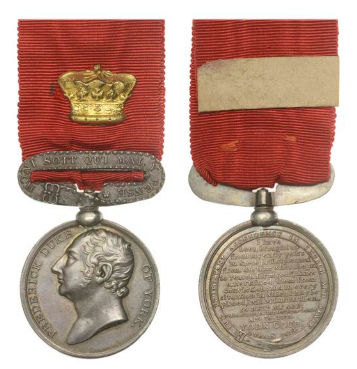
983 Co DUBLIN, Dublin, The York Club, 1824, silver, by I. Parkes, similar, un-named, 37mm, 35.44g (W 1990; D & W 123/178). Good very fine, attractively toned; with usual Garter loop mount Provenance: B. Woodside Collection