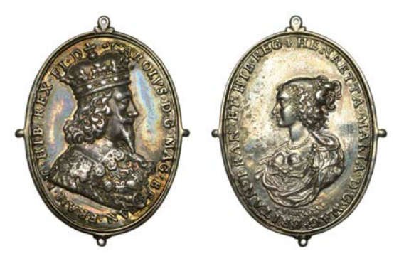
1019 Charles I and Henrietta Maria, a cast silver badge by T. Rawlins, crowned bust of Charles right, rev. draped bust of Henrietta Maria left, 42 x 32mm, 11.90g (MI I, 354/215; E 169). Cast and chased, good very fine, toned; with integral loops for suspension £600-£800