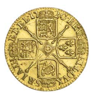
296 Guinea, 1720 (EGC 512; $ 3631). Removed from a ring mount and of bright appearance, otherwise better than very fine £1,000-£1,200