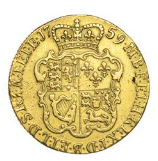
301 Guinea, 1759 (EGC 622; S 3680). Removed from a mount and of bright appearance, otherwise about very fine £600-£800