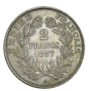
588 Napoleon III, 2 Francs, 1857A, Paris (Gad. 523; KM. 780.1). Extremely fine and toned, rare