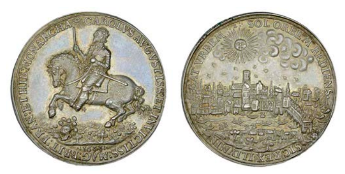
1018 Charles I, Return to London, 1633, a cast silver medal by N. Briot, king on horseback left, holding sceptre in right hand, Eye of Providence above, plumed helm on flowery ground below, rev. sun shines on a panoramic view of the city of London, with St Paul's and old London Bridge, 42mm, 14.49g (MI I, 266/62; E 124b). Has been chased, otherwise good very fine, toned £300-£400