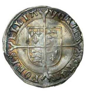
67 Groat, mm. pomegranate, 1.82g/12h (N 1960; S 2492). A little scored on obverse, otherwise about very fine, toned £150-£200