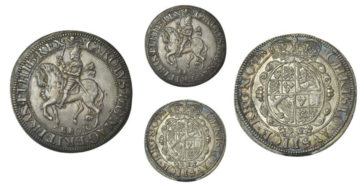
129 York mint, Halfcrown, Gp 2 [type 7], mm. lion, horse's tail between legs, rev. oval garnished shield, 13.84g/12h (Bull 560; Besly 2E; cf. SCBI Brooker 1086-8; N 2315; S 2869). About extremely fine, toned £800-£1,000