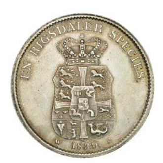
568 Frederik VI , Speciedaler, 1839ws, Copenhagen (Hede 26C; Dav. 73; KM. 695.4). Lightly cleaned and some contact marks, otherwise about extremely fine £100-£120