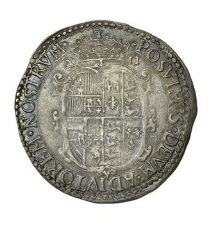
68 Shilling, 1554, full titles and mark of value, 6.32g/1h (N 1967; S 2500). A full round coin, good very fine with clear portraits and attractive toning, rare £1,200-£1,500