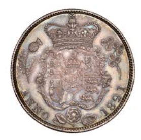
361 Halfcrown, 1821 (ESC 2360; S 3807). Light scratches at bottom of shield, otherwise about as struck, attractively toned £200-£260