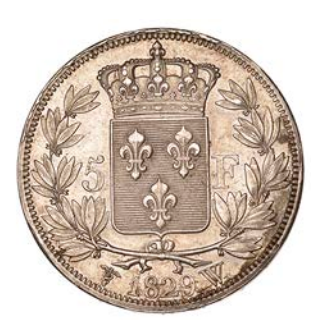
586 Charles X , 5 Francs, 1829w, Lille (Gad. 644; KM. 728.13). About extremely fine