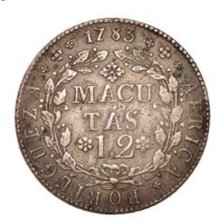
521 Maria III and Peter III , 12 Macutas, 1783 (Gomes 09.01; KM. 25). Cleaned at one time and with minor surface deposit, otherwise good very fine, scarce £300-£400

522 Maria II, Half-Macuta, 1853 (Gomes 01.03; KM. 56). Good very fine