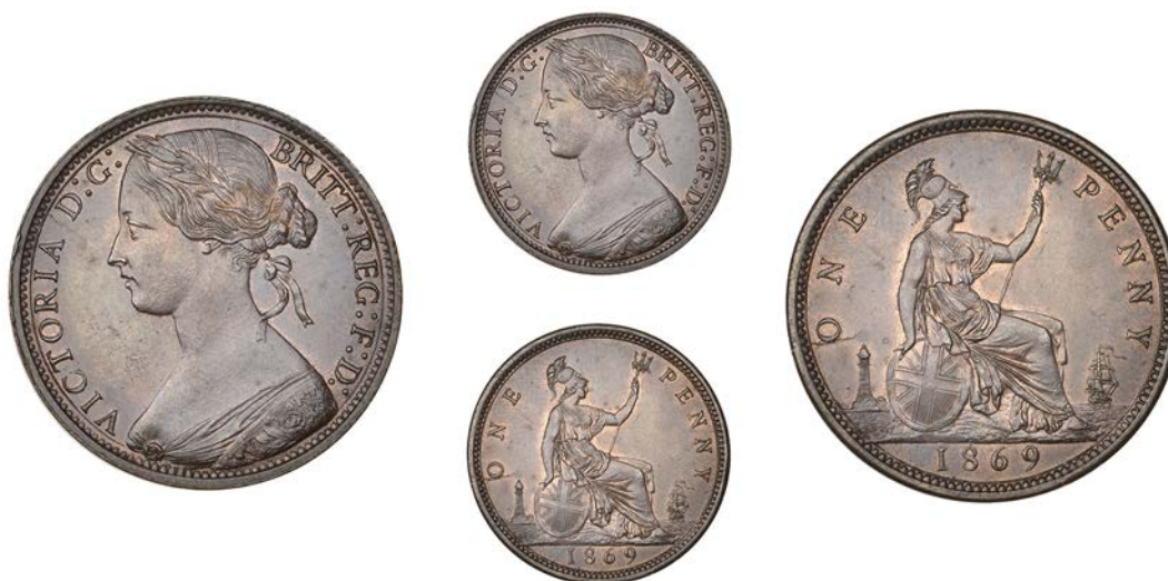
553 Penny, 1869 (F 59; BMC 1685; S 3954). Sometime lightly wiped on obverse, otherwise extremely fine, traces of original colour on reverse, rare £1,500-£1,800