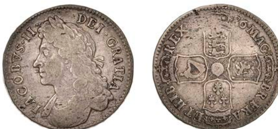
432 Halfcrown, 1686, first bust, edge TERTIO (ESC 751; S 3408). Fine