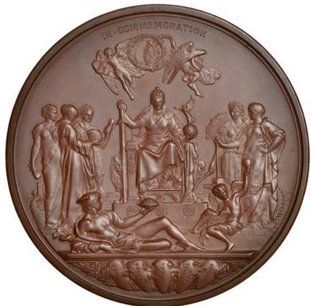
1225 Victoria, Golden Jubilee, 1887 , a bronze medal by L.C. Wyon after Sir J.E. Boehm and Sir F. Leighton, crowned bust left, rev. enthroned figure of Empire surrounded by standing figures representing Science, Letters, Art, etc, Mercury and Time below, 77mm (W & E 2000A.2; BHM 3219; E 1733). Extremely fine; in original fitted case [catch broken] £120-£150