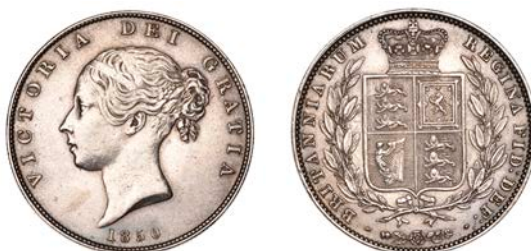
74 Halfcrown, 1850 (ESC 2733; S 3888). Cleaned, otherwise about extremely fine