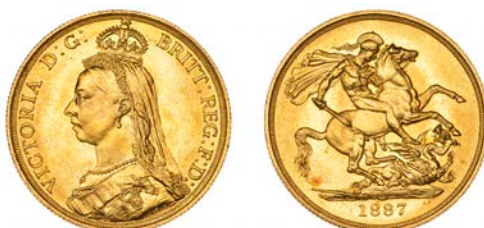
G 499 Two Pounds, 1887 (Hill T23; S 3865). Some hairlines and surface marks, otherwise good extremely fine