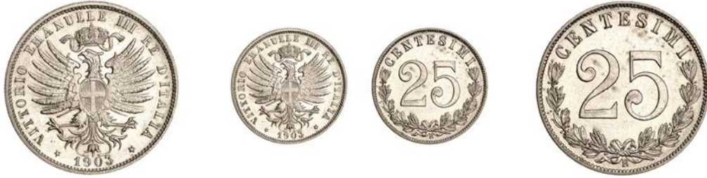
887 Victor Emanuel III , 25 Centesimi, 1903R (MIR 1152b; KM. 36). Extremely fine, scarce