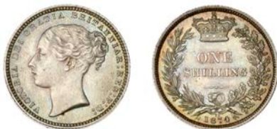
177 Shilling, 1874, die 70 (ESC 3044; S 3906A). Extremely fine, toned