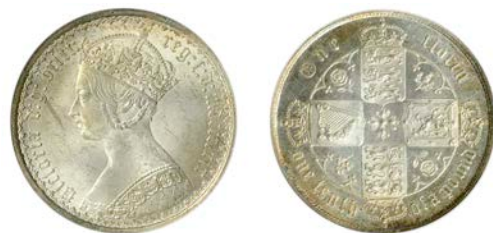
118 Florin, 1869, die 3 (ESC 2867; S 3893). Good extremely fine, mint bloom [slabbed NGC MS 63] £400-£500 Provenance: Heritage Auction (New York), 13-14 January 2015, lot 34986