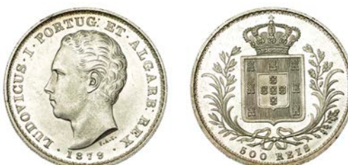
921 Louis I , 500 Réis, 1879 (Gomes 12.13; KM. 509). Lightly hairlined, otherwise about as struck [slabbed NGC MS 62]