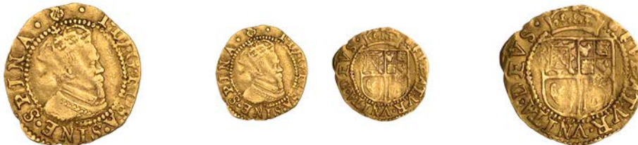
645 James VI , Tenth coinage, Halfcrown, mm. thistle-head, Scottish arms in first and fourth quarters, 1.23g/7h (SCBI 35, 1359; B 6, fig. 992; S 5470). On a slightly irregular flan, otherwise better than fine £300-£400