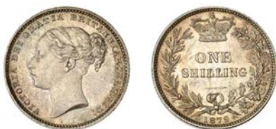
182 Shilling, 1879 (ESC 3061; S 3907). Extremely fine, toned