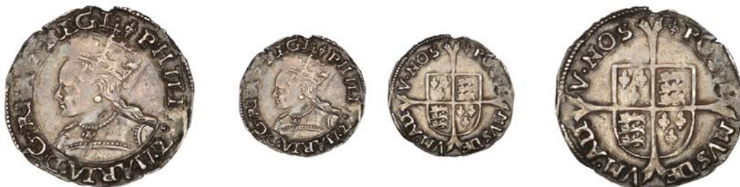
392 Groat, mm. lis, 1.83g/12h (N 1973; S 2508). Small edge chip at top and some light scrapes, otherwise very fine, toned £300-£360 Provenance: R. Inder Collection, Part III, DNW Auction 154, 3 December 2018, lot 186