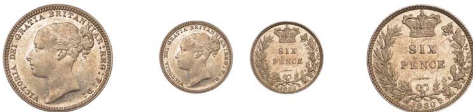
214 Sixpence, 1880 (ESC 3248; S 3912). Minor marks in fields, otherwise good extremely fine