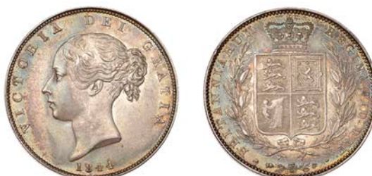
68 Halfcrown, 1844 (ESC 2720; S 3888). About extremely fine, some toning