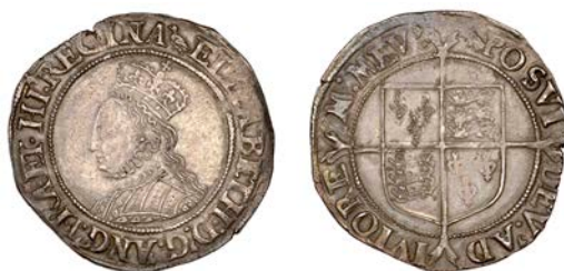
393 Second issue, Shilling, mm. martlet, bust 3C, beaded inner circles, 6.05g/10h (N 1985; S 2555). Tiny edge split, otherwise nearly extremely fine £500-£600