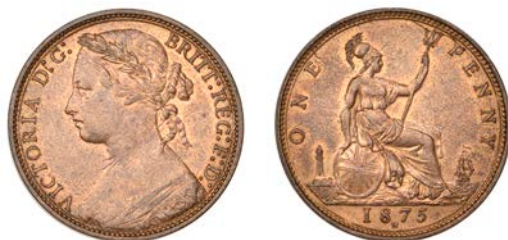
557 Penny, 1875 H , dies Lk (F 85; BMC 1705; S 3955). Light surface marks, otherwise extremely fine, some original colour £400-£500