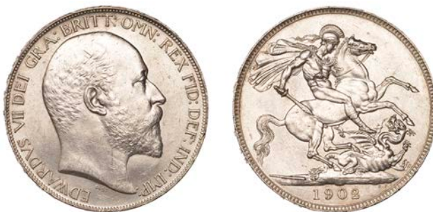
223 Crown, 1902, edge II (ESC 3560; S 3978). A few minor marks, otherwise good extremely fine