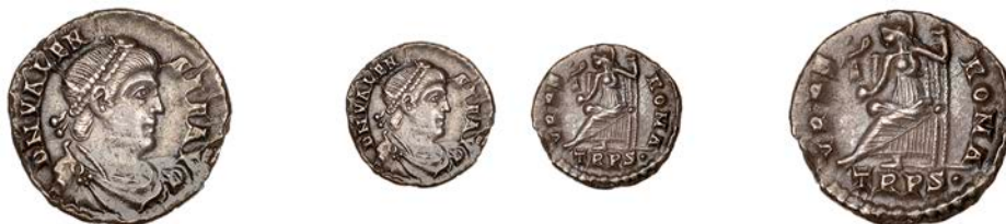
1007 Valens , Siliqua, Trier, 367-75, pearl-diademed, draped and cuirassed bust right, rev. Roma seated left on cuirass, holding Victory on globe and sceptre, TRPS in exergue, 2.27g (RIC 27E; RSC 109+b). About extremely fine, toned £100-£120