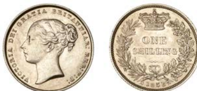
160 Shilling, 1858 (ESC 3011; S 3904). Extremely fine