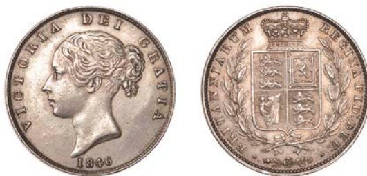
70 Halfcrown, 1846, 8 of date over 6 (ESC 2725; S 3888). Cleaned, otherwise good very fine, rare