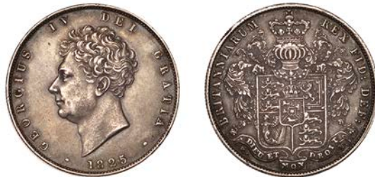
20 Halfcrown, 1825 (ESC 2371; S 3809). Good very fine, dark tone