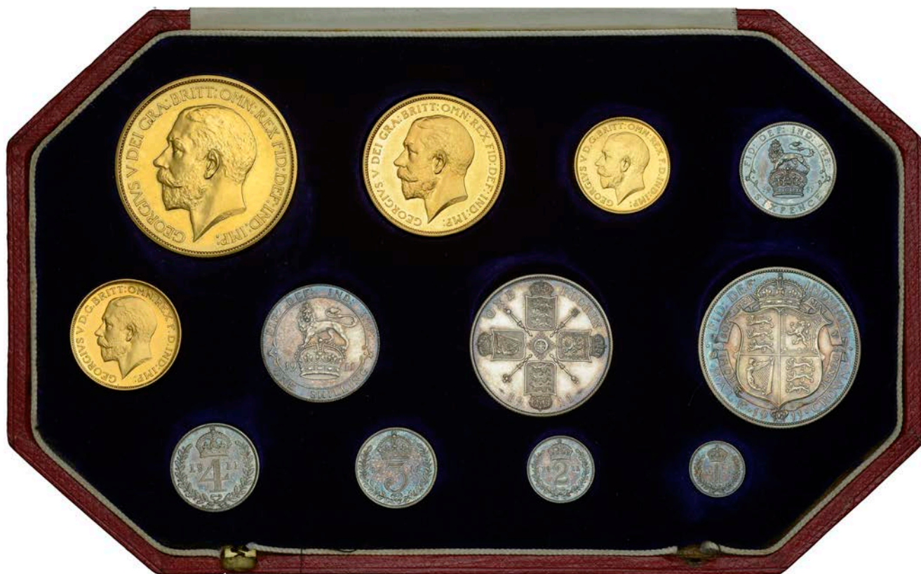
581 Proof set, 1911, comprising Five and Two Pounds, Sovereign and Half-Sovereign, Halfcrown to Maundy Penny [12]. Five and Two Pounds hairlined and with minor surface marks, Sovereign and Half Sovereign brilliant good extremely fine, silver attractively toned; in official case of issue £10,000-£12,000