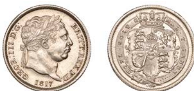
478 Shilling, 1817, RRIT flaw (ESC 2144; S 3790). About mint state, rare £180-£220