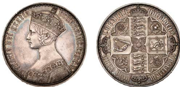
507 'Gothic' Crown, 1847, edge UNDECIMO (ESC 2571; S 3883). Minor rim marks and hairlines, otherwise good extremely fine with attractive tone £3,000-£4,000