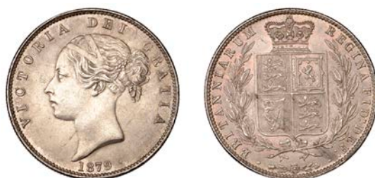
80 Halfcrown, 1879 (ESC 2753; S 3889). Lightly brushed, otherwise extremely fine £240-£300