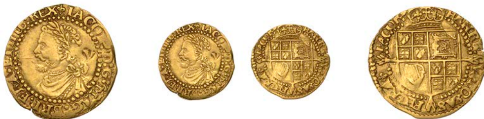
403 Third coinage, Quarter-Laurel, mm. lis, second bust, 2.18g/2h (SCBI Schneider 98; N 2119; S 2642B). About very fine £300-£400