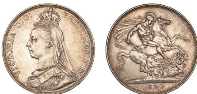
510 Crown, 1890 (ESC 2590; S 3921). Lightly cleaned, otherwise about extremely fine £100-£120