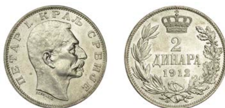
939 Peter I , 2 Dinara, 1912 (KM. 26.1). Good extremely fine [slabbed NGC MS 63]