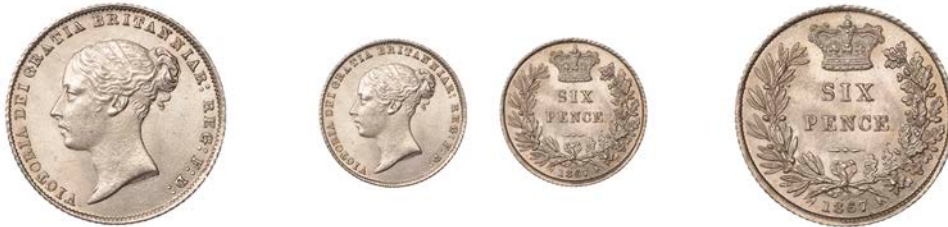
207 Sixpence, 1867, die 10 (ESC 3215; S 3910). Extremely fine