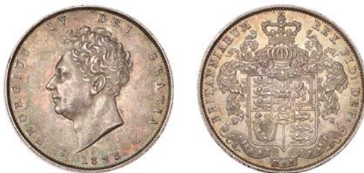
22 Halfcrown, 1828 (ESC 2377; S 3809). Minor contact marks on obverse, otherwise about extremely fine and toned, scarce