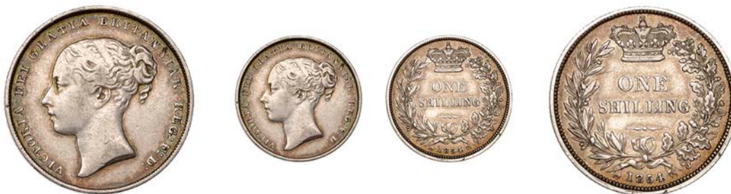
157 Shilling, 1854 (ESC 3004; S 3904). Obverse wiped and now re-toned, otherwise about very fine, very rare £400-£500