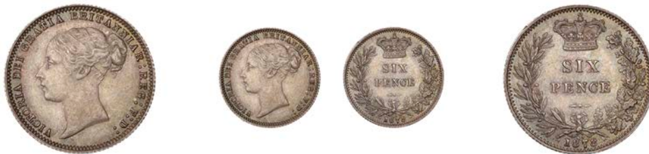
212 Sixpence, 1878, die 37 (ESC 3233; S 3910). Extremely fine, toned