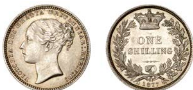
180 Shilling, 1877, die 64 (ESC 3047; S 3906A). Extremely fine