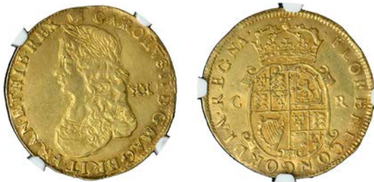
419 Second issue, Unite, mm. crown on obv. only, 1h (Schneider dies O4/R6; SCBI Schneider 397; N 2754; S 3304). Slight obverse double-strike, otherwise good very fine [slabbed NGC XF 45] £5,000-£6,000