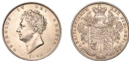
21 Halfcrown, 1826 (ESC 2375; S 3809). Lightly hairlined, otherwise extremely fine