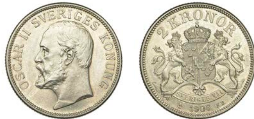
957 Oscar II , 2 Kronor, 1906 EB (SM 59; KM. 773). Good extremely fine [slabbed NGC MS 63]