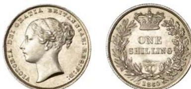
162 Shilling, 1860 (ESC 3018; S 3904). Lightly cleaned, otherwise about extremely fine