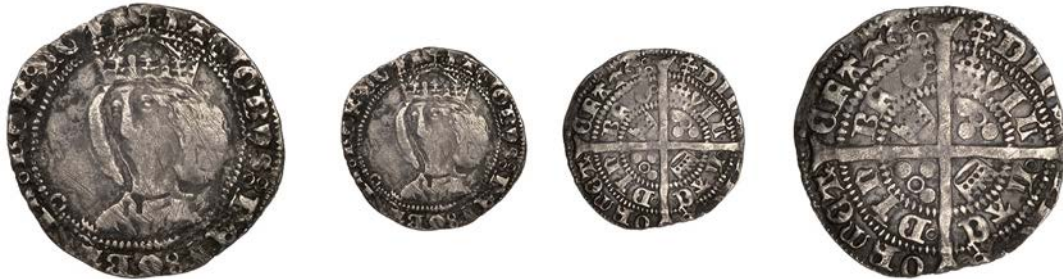
637 James III , Main issue, Groat, Edinburgh, mm. cross fleury on rev. only, annulet on inner circle before bust, reads EDINBVRG, 2.81g/8h (SCBI 35, 784; B 48a, fig. 643; S 5288). Better than fine but obverse surface scratched and scored £200-£260