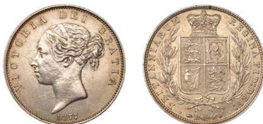
78 Halfcrown, 1877 (ESC 2750; S 3889). Cleaned, otherwise about extremely fine £150-£180