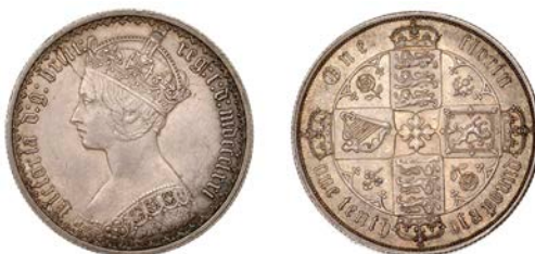
522 Florin, 1871, die 44 (ESC 2874; S 3893). Nearly extremely fine, toned £200-£260