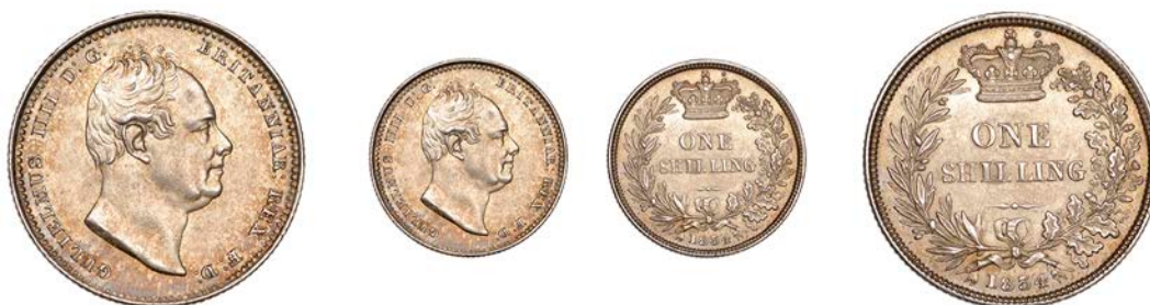
42 Shilling, 1834 (ESC 2489; S 3835). Extremely fine, toned