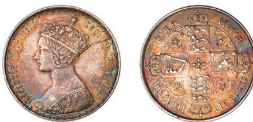
113 Florin, 1864, die 16 (ESC 2854; S 3892). Very fine, colourfully toned