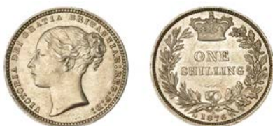
179 Shilling, 1876, die 4 (ESC 3046; S 3906A). Extremely fine