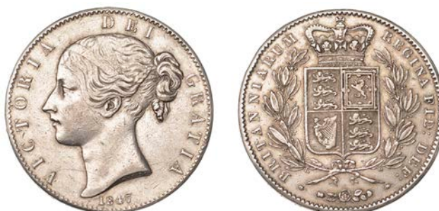
49 Crown, 1847, edge XI (ESC 2567; S 3882). Cleaned, otherwise very fine