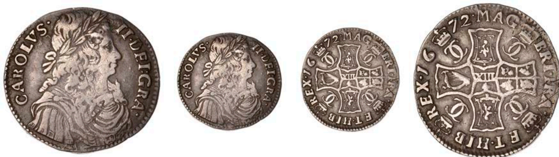
646 Charles II , First coinage, Merk, 1672, type II, leaved thistle below bust, reads DEI · and FRA · , 5.87g/3h (Murray 19; SCBI 35 1582; B 7, fig. 1051; S 5611). Nearly very fine £150-£200