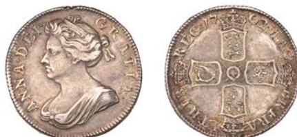
440 Shilling, 1702, first bust (ESC 1385; S 3583). Tiny metal flaw on edge at 12 o'clock, otherwise very fine £200-£260