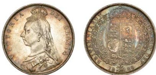
91 Halfcrown, 1889 (ESC 2774; S 3924). Extremely fine, toned £100-£120