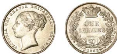
164 Shilling, 1862 (ESC 3021; S 3904). Extremely fine, scarce