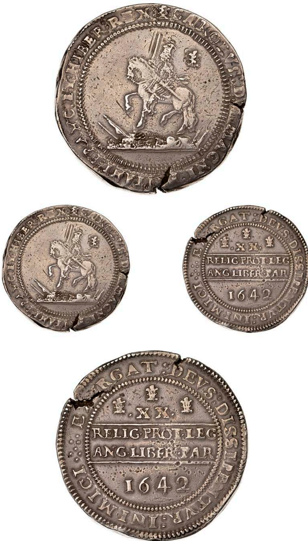
413 Oxford mint, Pound, 1642, mm. Oxford plume on obv. only, Shrewsbury horseman riding over arms and armour without cannon, Oxford plume behind, rev. three Oxford plumes above Declaration, date below, seven pellets before legend, 119.42g/8h (Morr. C-2; SCBI Brooker 861, same dies; N 2399; S 2939). Two peripheral striking splits and minor double striking on obverse, otherwise very fine, toned £6,000-£8,000