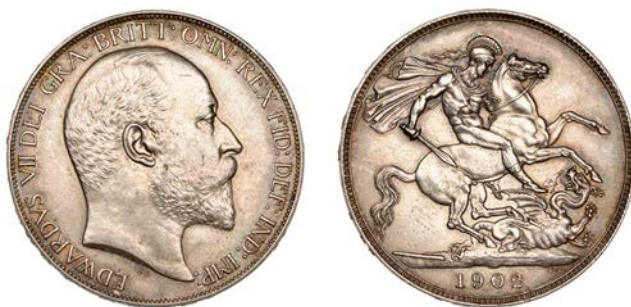
572 Crown, 1902, edge II (ESC 3560; S 3978). Extremely fine with some toning