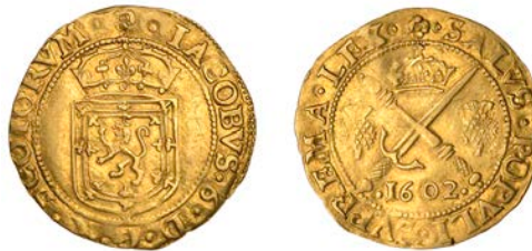
644 James VI , Eighth coinage, Sword and Sceptre piece, 1602, mm. quatrefoil, 4.93g/11h (SCBI 35, 1185ff; SCBI 58, 1307ff; B 4, fig. 956; S 5460). About very fine £1,000-£1,200