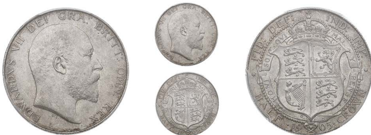
574 Halfcrown, 1905 (ESC 3571; S 3980). Good extremely fine, rare [slabbed PCGS MS 63]