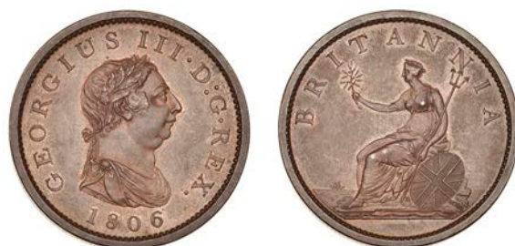
469 Proof Penny, 1806 (late Soho), in bronzed-copper, edge centre-grained, 20.46g/6h (BMC 1328 [KP 32]; Selig 1305; S 3780). Good extremely fine, fields clouded