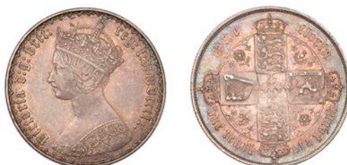
111 Florin, 1860 (ESC 2845; S 3891). Good very fine, attractively toned