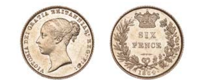
532 Sixpence, 1864, die 33 (ESC 3211; S 3909). Of bright appearance, about mint state