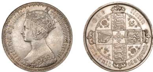
523 Florin, 1887, young head (ESC 2913; S 3901). Extremely fine £300-£400