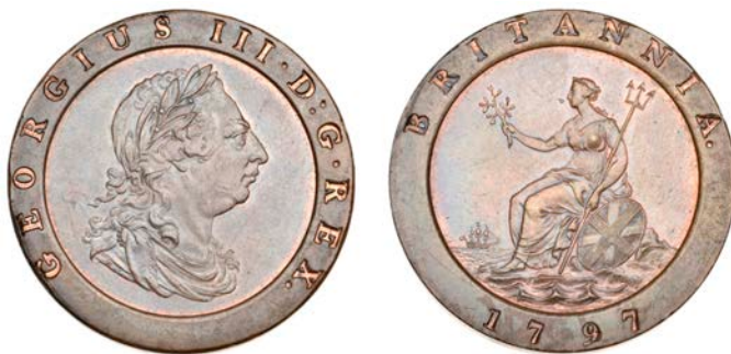
463 Twopence, 1797 (BMC 1077; S 3776). Extremely fine with traces of original colour