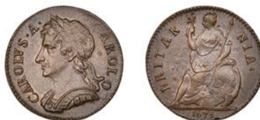
427 Farthing, 1675 (Cooke 706; BMC 528; S 3394). Small spot behind head, otherwise about extremely fine