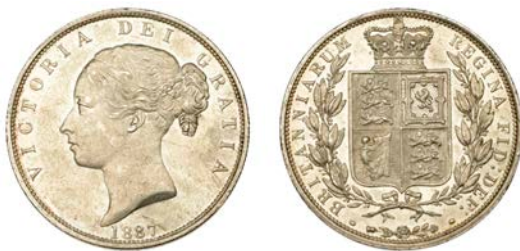
88 Halfcrown, 1887, young head (ESC 2769; S 3889). Lightly cleaned, otherwise about extremely fine £200-£260