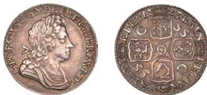
444 Shilling, 1723 ss c, first bust (ESC 1586; S 3647). Nearly extremely fine £150-£180