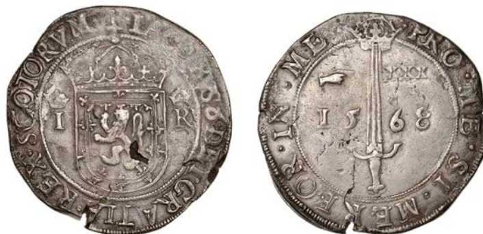
641 James VI , First coinage, Ryal, 1568, 30.10g/11h (SCBI 35, 1206; SCBI 58, 1334-6; B 3, fig. 921; S 5472). Metal flaw in centre of obverse, parts of legends weak and with signs of corrosion, otherwise nearly very fine £400-£500