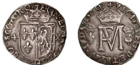
639 Mary , Second period (with Francis), Testoon, type II, 1560, mm. cross, obv. legend ends Q, 5.76g/11h (SCBI 35, 1088ff; SCBI 58, 1019ff; B 13, fig. 884; S 5417). Nearly very fine £240-£300