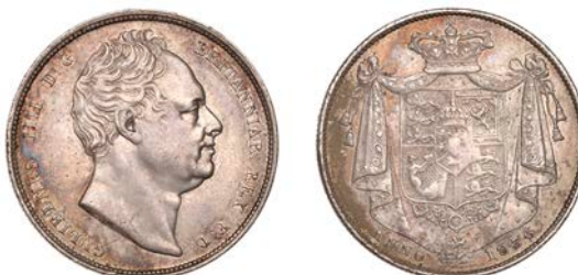
40 Halfcrown, 1836 (ESC 2482; S 3834). Lightly cleaned and with some minor marks, otherwise good very fine £100-£120