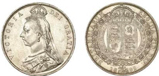
94 Halfcrown, 1892 (ESC 2777; S 3924). Extremely fine £100-£120