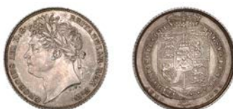
487 Sixpence, 1825 (ESC 2427; S 3814). Extremely fine