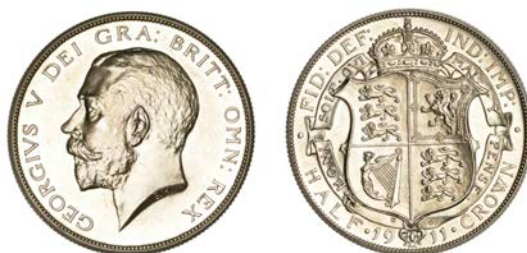
261 Proof Halfcrown, 1911 (ESC 3710; S 4011). Lightly brushed, otherwise brilliant, about as struck