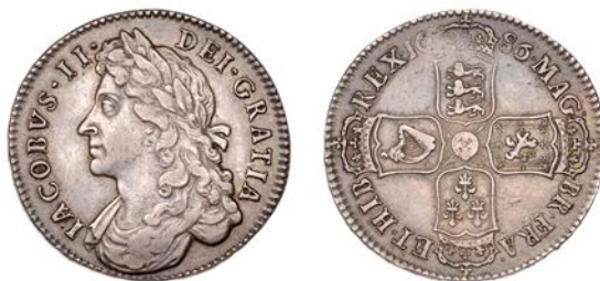
431 Halfcrown, 1686, first bust, edge SECUNDO (ESC 749; S 3408). Very fine or a little better