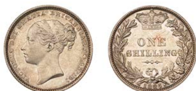
530 Shilling, 1885 (ESC 3076; S 3907). About mint state