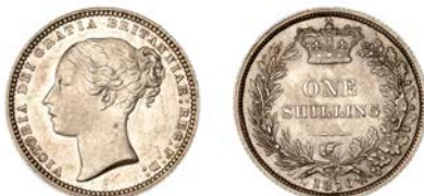
173 Shilling, 1870, die 18 (ESC 3038; S 3906A). Extremely fine £150-£180