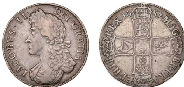
429 Crown, 1687, second bust, edge TERTIO (ESC 743; S 3407). Good fine or better