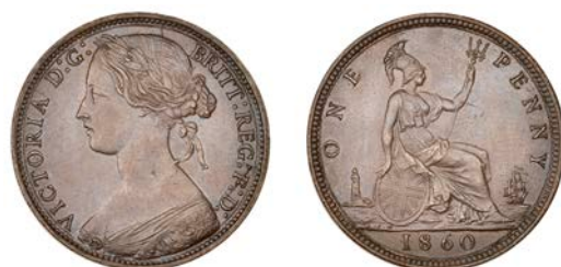
550 Penny, 1860, dies Jd (F 17; BMC 1635; S 3954). Light surface marks, otherwise nearly extremely fine £150-£180