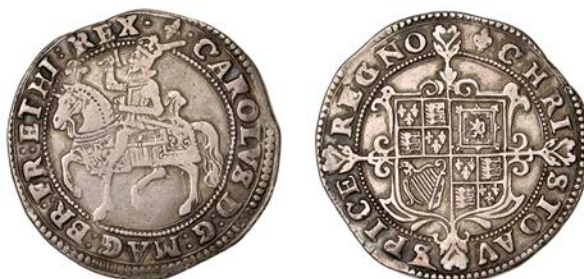
405 Tower mint, Halfcrown, Gp I, type 1a2, mm. lis, first horseman, housings decorated, no groundline below horse, 14.66g/11h (Bull 25a; SCBI Brooker 281, same dies; N 2201; S 2764). About very fine, reverse better, scarce £600-£800