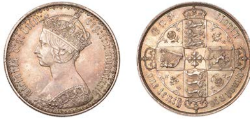
123 Florin, 1874, die 38 (ESC 2881; S 3893). Minor marks on bust, otherwise extremely fine, some toning