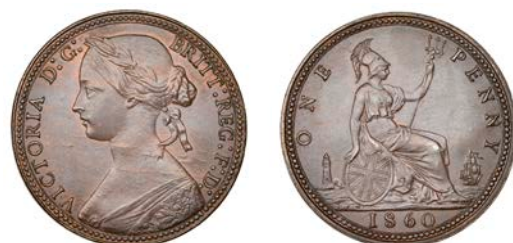
548 Penny, 1860, dies Cc, beaded borders (F 7; BMC 1623; S 3954). Sometime cleaned with surfaces rather dull, otherwise extremely fine, rare £500-£600