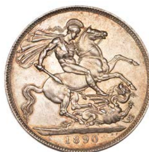
55 Crown, 1890 (ESC 2590; S 3921). Extremely fine