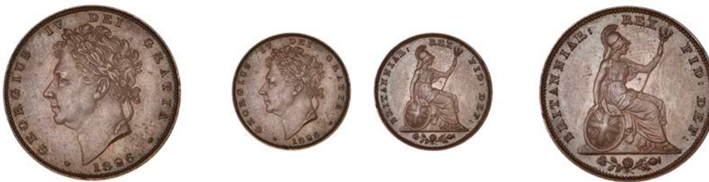
488 Proof Farthing, 1826, bronzed, edge plain, 4.81g/12h (Cooke 249; BMC 1440; S 3825). Some light clouding in fields, otherwise good extremely fine £200-£260