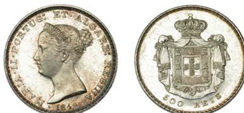
917 Maria II , 500 Réis, 1842 (Gomes 31.05; KM. 471). Obverse hairlined, otherwise good extremely fine, toned [slabbed UNC Details, Obv Cleaned]