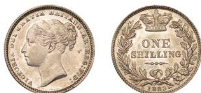
529 Shilling, 1883 (ESC 3072; S 3907). About mint state