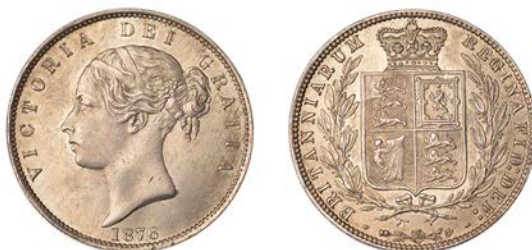
77 Halfcrown, 1876 (ESC 2748; S 3889). Extremely fine £400-£500