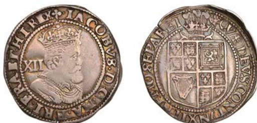
404 Third coinage, Shilling, mm. trefoil (voided on rev.[?]), sixth bust, plume above shield, 5.81g/8h (N 2125; S 2669). On a full flan, nearly very fine, reverse better but slightly off-centre, rare £400-£500 The reverse mintmark looks to have voided leaves with a pellet centre; however it may possibly be the result of the mark being punched over a lis