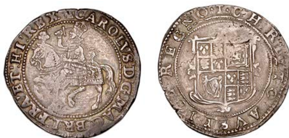
406 Tower mint, Halfcrown, Gp I, type 1a3, mm. cross Calvary, first horseman, housings decorated, no groundline below horse or cross over shield, light garniture, 15.14g/4h (Bull 43/6; SCBI Brooker –; N 2202; S 2766). Nearly very fine, toned £600-£800 Provenance: J.R. Hulett Collection, Part I, DNW Auction 142, 13-15 September 2017, lot 447 [from Baldwin December 1995]