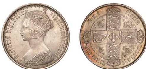
121 Florin, 1872, die 51 (ESC 2878; S 3893). Some minor marks, otherwise about extremely fine £150-£180