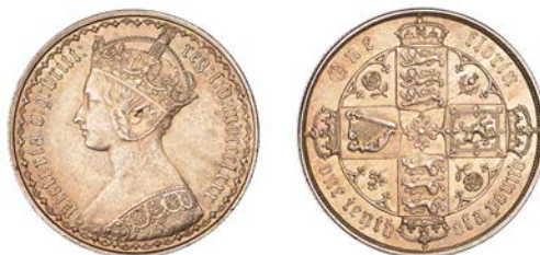
129 Florin, 1880 (ESC 2900; S 3900). Lightly cleaned, otherwise about extremely fine