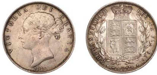
82 Halfcrown, 1881 (ESC 2758; S 3889). Extremely fine