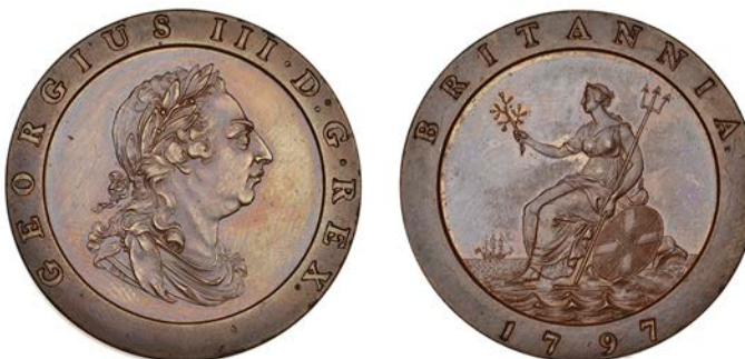
466 Proof Twopence, 1797 (late Soho), in bronzed copper, edge plain, 58.53g/6h (BMC 1068 [KT 2]; Selig 1264; S 3776). Fields lightly hairlined, otherwise good extremely fine