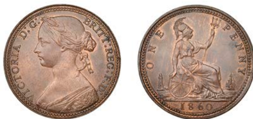
546 Penny, 1860, dies Cb, beaded borders (F 6; BMC 1617; S 3954). Sometime wiped, otherwise nearly extremely fine £200-£260