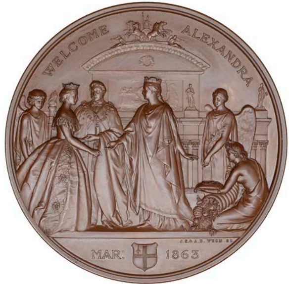
1223 Entry of Princess Alexandra into the City of London, 1863 , a copper medal by J.S. & A.B. Wyon, bust left, rev. Londinia welcoming the Prince of Wales and Princess Alexandra, 77mm (W & E 901.1; BHM 2783; E 1561). Good extremely fine; in case of issue £400-£500