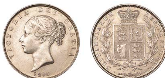
69 Halfcrown, 1845 (ESC 2722; S 3888). Lightly cleaned, otherwise about extremely fine