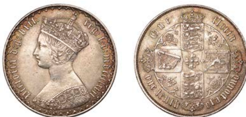
116 Florin, 1867, die 4 (ESC 2860; S 3892). A few minor marks, otherwise about extremely fine £200-£260