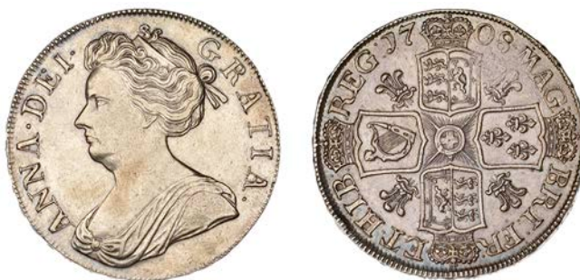
439 Crown, 1708, plumes, edge SEPTIMO (ESC 1347; S 3602). Cleaned at one time and now re-toned, otherwise about extremely fine £2,000-£2,600