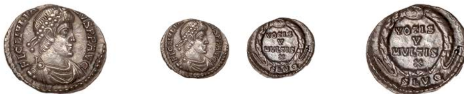
1006 Julian II , Siliqua, Lugdunum, pearl-diademed, draped and cuirassed bust right, rev. VOTIS V MLTIS X in four lines within wreath, 1.99g (RIC 227; RSC 163+b). Extremely fine, attractive grey tone £150-£200