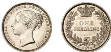
176 Shilling, 1873, die 79 (ESC 3043; S 3906A). Extremely fine