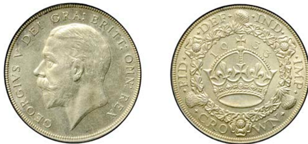
256 Crown, 1933 (ESC 3644; S 4036). Extremely fine [slabbed CGS AU 75]