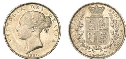
87 Halfcrown, 1886 (ESC 2767; S 3889). Lightly cleaned, otherwise about extremely fine