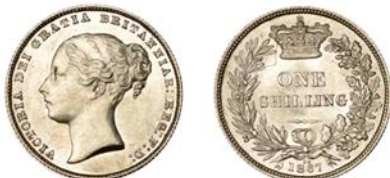
170 Shilling, 1867, second head, die 34 (ESC 3030 [this die number not listed]; S 3905). Extremely fine, rare £200-£260