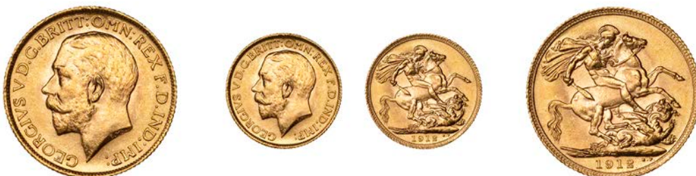
G 578 Sovereign, 1912 (M 214; S 3996). About as struck £400-£460