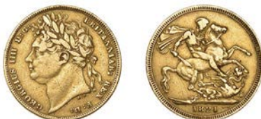
G 480 Sovereign, 1821 (M 5; S 3800). Fine £300-£400