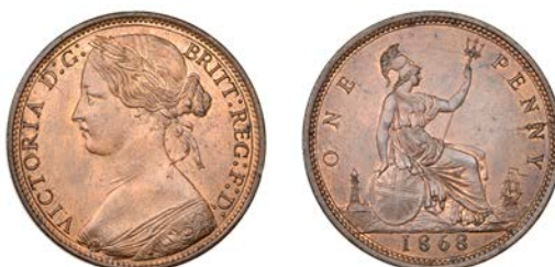
552 Penny, 1868 (F 56; BMC 1682; S 3954). Minor clash marks and some light spotting, otherwise better than extremely fine, traces of original colour £240-£300