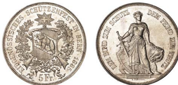
959 Confederation , 5 Francs, 1885, Bern Shooting Festival (HMZ 1343o; Dav. 391; KM. S17). Some minor marks, otherwise extremely fine