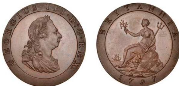
467 Restrike Proof Penny, 1797, in copper, edge plain, 27.95g/6h (BMC 1148 [R 56]; Selig 1295). Good extremely fine, very rare