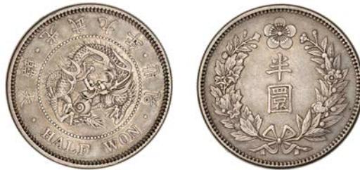
891 Kuang Mu , Half-Won, yr 9 [1905] (KM. 1129). Lightly cleaned, otherwise good very fine