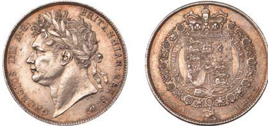
18 Halfcrown, 1823 (ESC 2365; S 3808). Lightly cleaned, otherwise about extremely fine