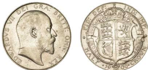
228 Halfcrown, 1906 (ESC 3572; S 3980). Cleaned, otherwise good very fine