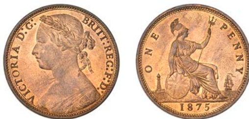
556 Penny, 1875, dies Lg (F 79; BMC 1700; S 3954). Good extremely fine, much original colour £300-£400