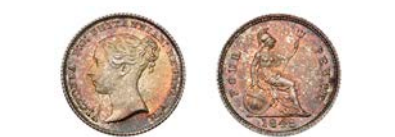
534 Britannia Groat, 1848 (ESC 3340; S 3913). Virtually mint state, toned