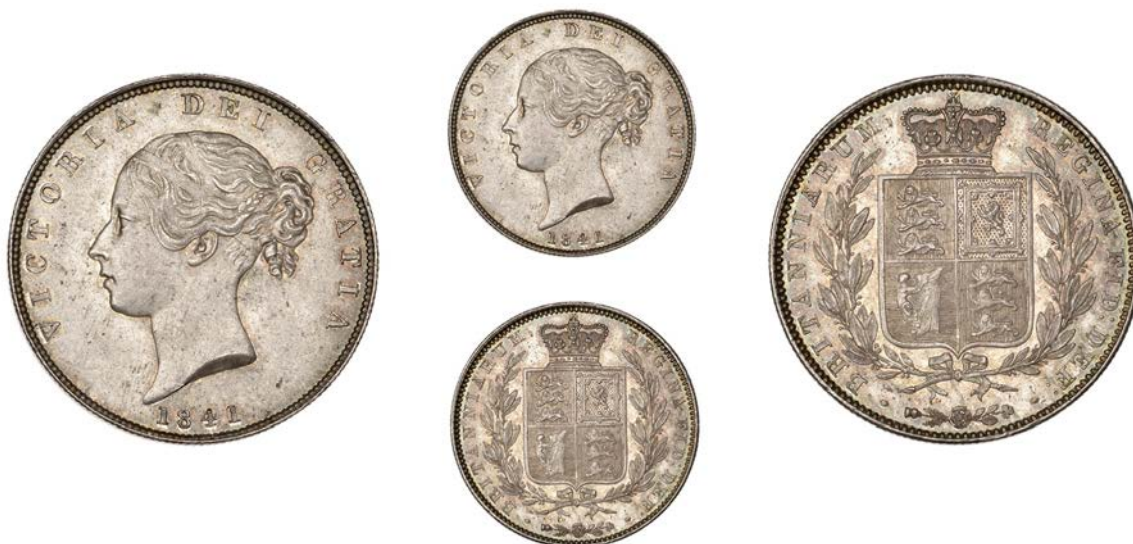
515 Halfcrown, 1841 (ESC 2716; S 3888). Extremely fine and toned, rare Provenance: A Collection of English Coins, Spink Auction 240, 26-7 September 2016, lot 2288