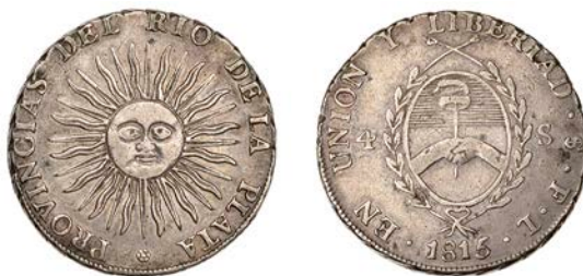
728 RIO DE LA PLATA, 4 Soles, 1815 FL , Potosí (KM. 13). Very fine, rare