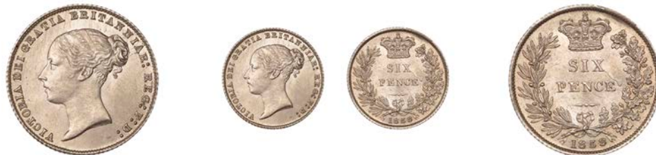
203 Sixpence, 1858 (ESC 3200; S 3908). Extremely fine