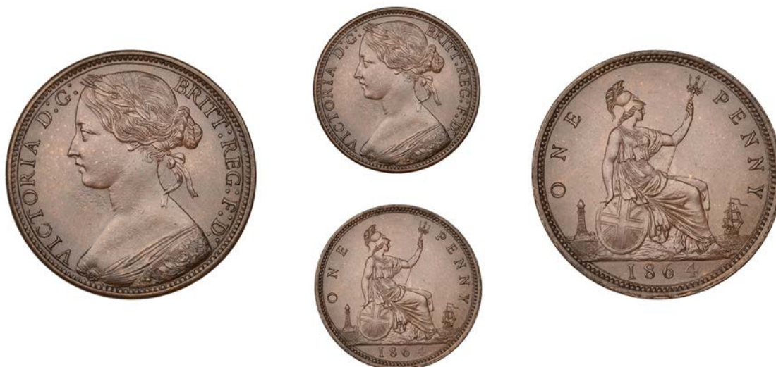
551 Penny, 1864, crosslet 4 (F 48; BMC 1663; S 3954). Small area of flawed metal below chin on obverse and light scratch on reverse, otherwise good extremely fine, dark brown patina £800-£1,000