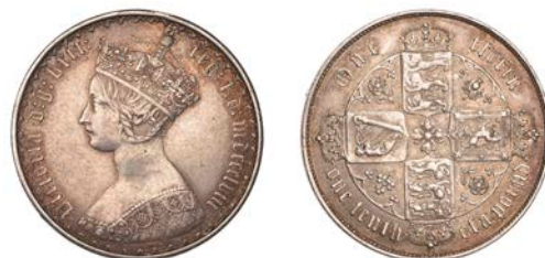
109 Florin, 1858 (ESC 2839; S 3891). Lightly cleaned, otherwise good very fine