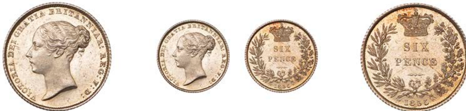
201 Sixpence, 1855 (ESC 3193; S 3908). Lightly brushed, otherwise good extremely fine