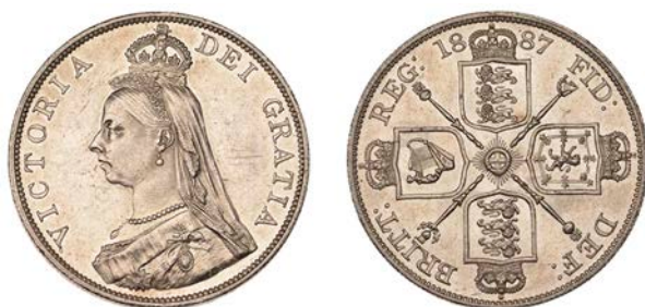
512 Double-Florin, 1887, Arabic numeral (ESC 2697; S 3923). About mint state £150-£180