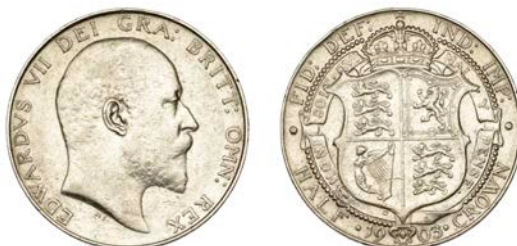
225 Halfcrown, 1903 (ESC 3569; S 3980). Cleaned, otherwise very fine, rare