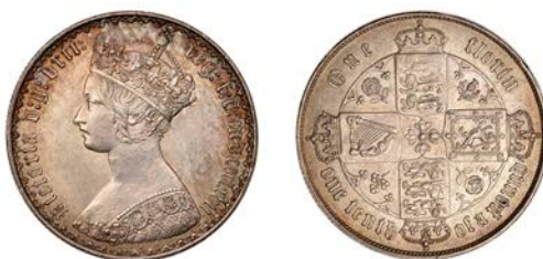
521 Florin, 1867, die 2 (ESC 2860; S 3892). Lightly cleaned at one time but now re-toned, extremely fine, rare £300-£400