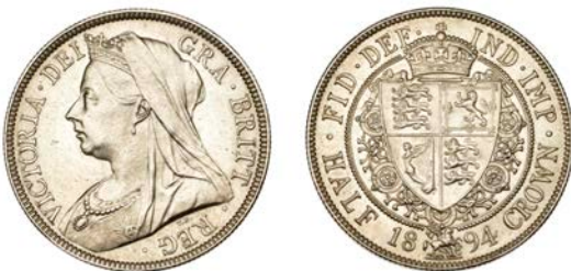
96 Halfcrown, 1894 (ESC 2780; S 3938). Extremely fine £100-£120