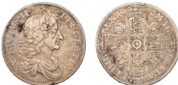
423 Crown, 1676, third bust, edge VICESIMO OCTAVO (ESC 397 [51]; S 3358). Nearly very fine, but a small flan flaw behind bust £160-£200