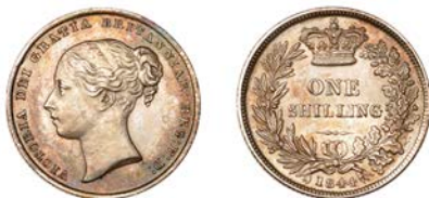
525 Shilling, 1844 (ESC 2990; S 3904). About extremely fine