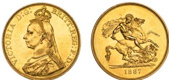
G 497 Five Pounds, 1887 (Hill F30; S 3864). Fields proof-like but hairlined, extremely fine or better