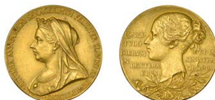
1226 Victoria, Diamond Jubilee, 1897 , a small gold medal by G.W. de Saulles, veiled bust left, rev. young bust left, 26mm (W & E 3000A.2; BHM 3506; E 1817b). Extremely fine; in case of issue £600-£800