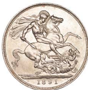
56 Crown, 1891 (ESC 2591; S 3921). Lightly cleaned and with some minor marks, otherwise extremely fine