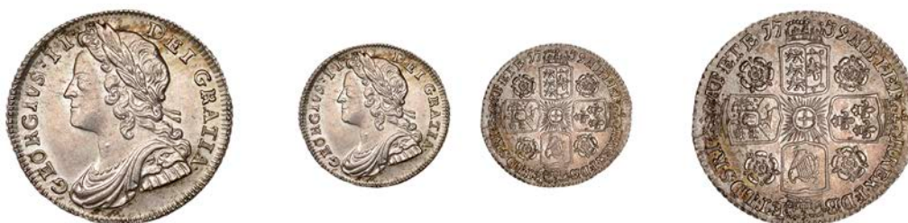
451 Sixpence, 1739, roses (ESC 1749; S 3708). Lightly cleaned, otherwise extremely fine £300-£400