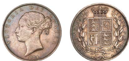
517 Halfcrown, 1884 (ESC 2764; S 3889). Cleaned at one time and now re-toned, otherwise extremely fine