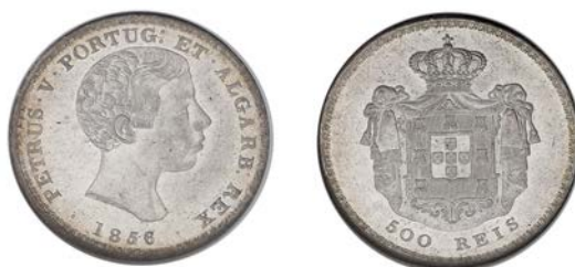
920 Peter V , 500 Réis, 1856 (Gomes 07.02; KM. 494). About as struck [slabbed NGC MS 64]