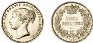
167 Shilling, 1864, die 12 (ESC 3024; S 3905). Lightly cleaned, otherwise extremely fine £100-£120