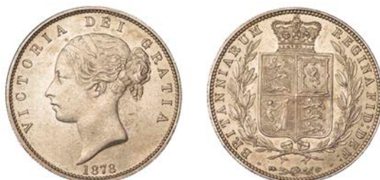
79 Halfcrown, 1878 (ESC 2751; S 3889). Some contact marks, otherwise about extremely fine £200-£260