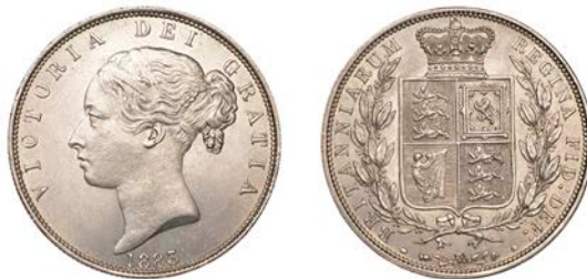
84 Halfcrown, 1883 (ESC 2762; S 3889). Lightly brushed, otherwise extremely fine