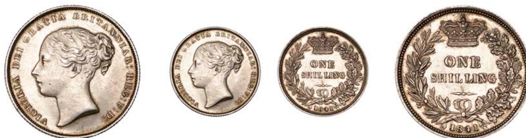
146 Shilling, 1841 (ESC 2986; S 3904). Extremely fine, lightly toned, scarce