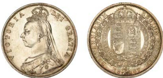
89 Halfcrown, 1887, Jubilee (ESC 2771; S 3924). Good extremely fine £100-£120