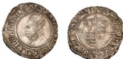
394 Second issue, Groat, mm. cross-crosslet, bust 1F, reads REGINA, 2.03g/11h (N 1986; S 2556). Slightly double-struck on reverse, otherwise good very fine, portrait a little better £200-£260