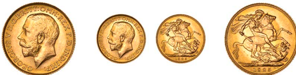
G 579 Sovereign, 1925 (M 220; S 3996). About mint state £400-£460