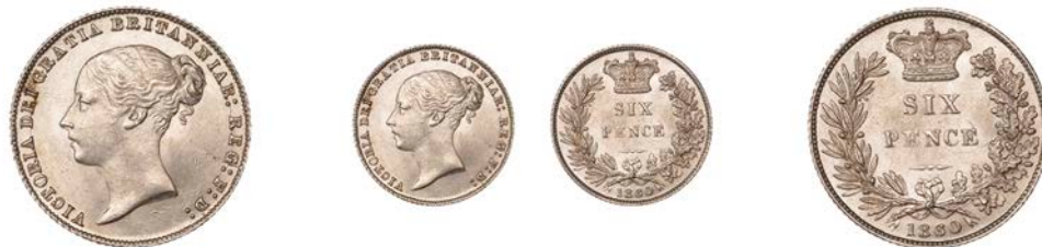
204 Sixpence, 1860 (ESC 3205; S 3908). Extremely fine