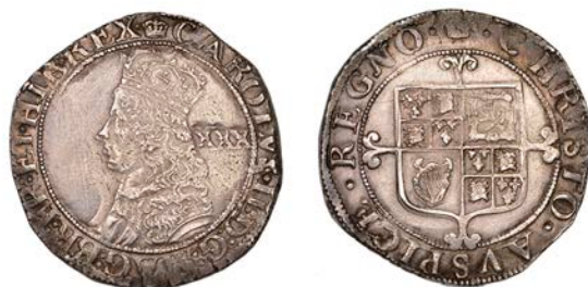
420 Third issue, Halfcrown, mm. crown, reads MAG BR FR, 14.99g/6h (ESC 301; N 2761; S 3321). Portrait somewhat weak and reverse a trifle double-struck, otherwise very fine or better for issue £700-£800