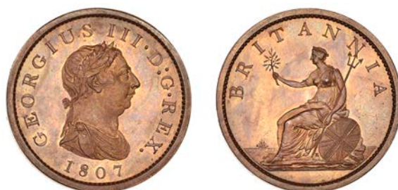
471 Restrike Proof Penny, 1807, in copper, edge plain, 17.74g/6h (BMC – [R 98]; Selig –). Reverse fields lightly wiped, otherwise about as struck