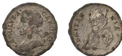
428 Farthing, 1684 (Cooke 691; BMC 536; S 3395). Copper plug; fine for issue, but with some tin pest