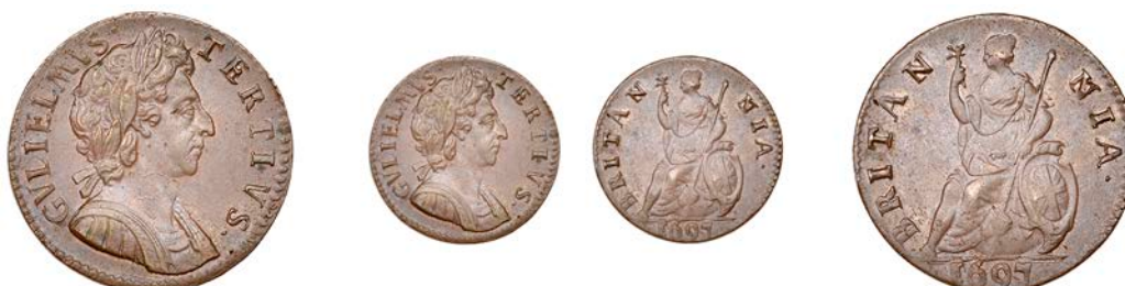
438 Farthing, 1697 (Cooke 543; BMC 659; S 3557). Good extremely fine with some original colour, rare