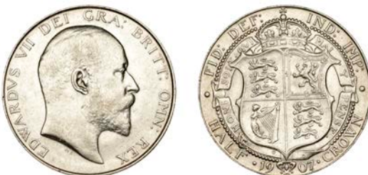
229 Halfcrown, 1907 (ESC 3573; S 3980). Cleaned and with some minor marks, otherwise about extremely fine £100-£120