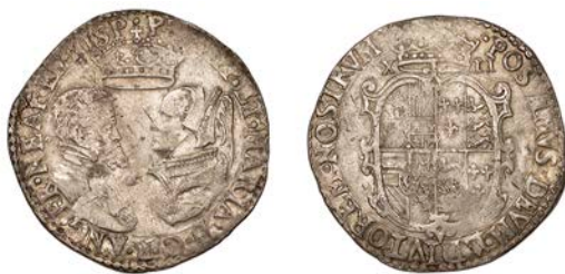
391 Shilling, undated, full titles and mark of value, 6.08g/11h (N 1967; S 2498). Surfaces slightly rough, otherwise about very fine with reasonable portraits £500-£700