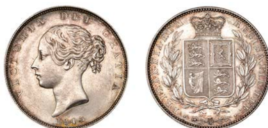
516 Halfcrown, 1843 (ESC 2718; S 3888). A few minor marks, otherwise extremely fine with some toning, scarce