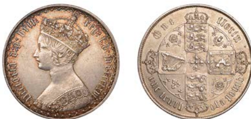
115 Florin, 1866, die 5 (ESC 2858; S 3892). Cleaned and with some minor marks, otherwise about extremely fine £150-£180