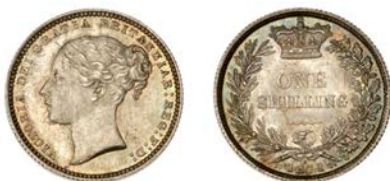
174 Shilling, 1871, die 9 (ESC 3039; S 3906A). Extremely fine £100-£120