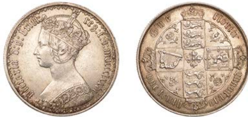
125 Florin, 1876, die 15 (ESC 2884; S 3893). Lightly cleaned, otherwise about extremely fine