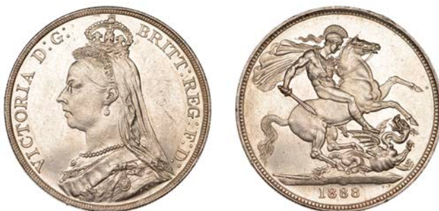
508 Crown, 1888, narrow date (ESC 2587; S 3921). A few minor marks, otherwise good extremely fine £200-£260