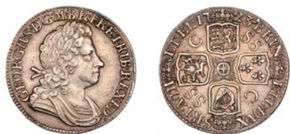
443 Shilling, 1723 ss c, first bust (ESC 1586; S 3647). Nearly extremely fine £150-£180