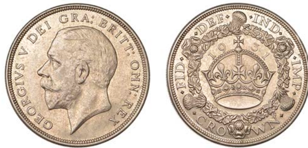
254 Crown, 1931 (ESC 3639; S 4036). About extremely fine