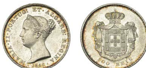
918 Maria II , 500 Réis, 1846 (Gomes 31.09; KM. 471). Extremely fine [slabbed NGC MS 62]