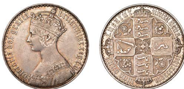
50 'Gothic' Crown, 1847, edge UNDECIMO, 27.93g/6h (ESC 2571; S 3883). Lightly cleaned and with some contact marks, otherwise very fine