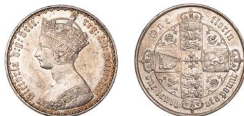
112 Florin, 1862 (ESC 2847; S 3891). Cleaned and with some minor marks, otherwise very fine, rare