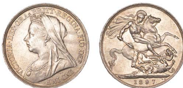
62 Crown, 1897, edge LXI (ESC 2603; S 3937). Extremely fine