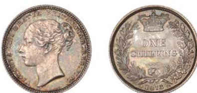
528 Shilling, 1873, die 127 (ESC 3043; S 3906A). Extremely fine, toned