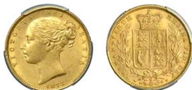
G 731 Victoria, Sovereign, 1873s, shield rev. (M 71; S 3855). About extremely fine [slabbed PCGS AU 58]