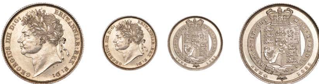
27 Shilling, 1825, type 2 (ESC 2402; S 3811). Good extremely fine, bright appearance £240-£300