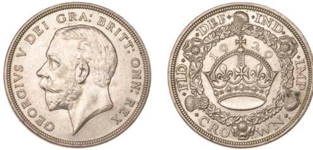
252 Crown, 1929 (ESC 3636; S 4036). About extremely fine