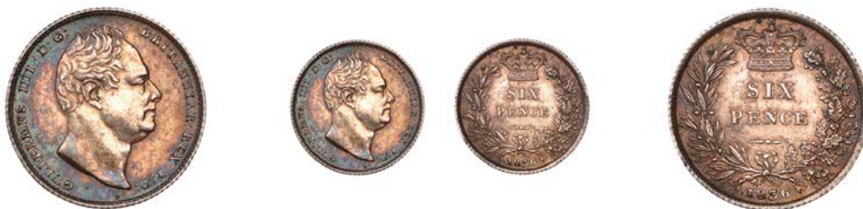
47 Sixpence, 1836 (ESC 2510; S 3836). About extremely fine, toned, scarce