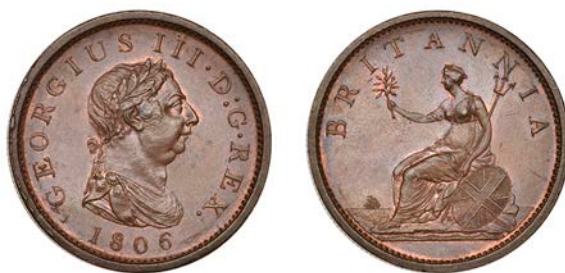
468 Penny, 1806, with incuse hair curl (BMC 1342; S 3780). Good extremely fine