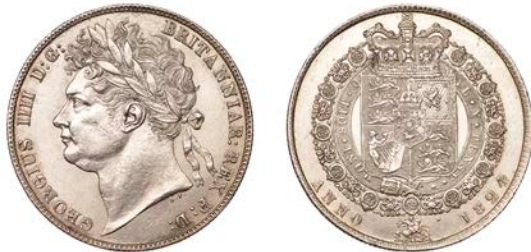
19 Halfcrown, 1824 (ESC 2367; S 3808). Extremely fine