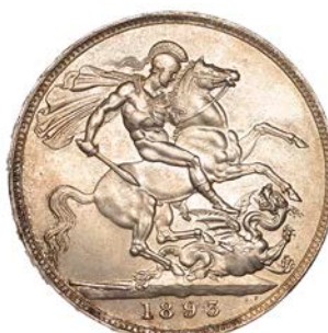
58 Crown, 1893, edge LVI (ESC 2593; S 3937). Good extremely fine