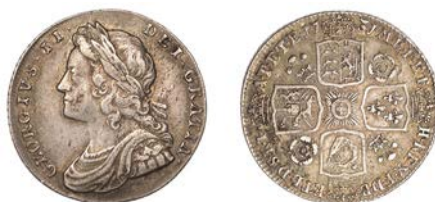
448 Shilling, 1731, roses and plumes (ESC 1703; S 3698). Very fine £200-£260