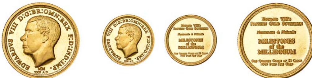
G 582 Fantasy Pattern Sovereign (1/4 oz.), 2000, Milestones of the Millennium, 24ct, 7.58g/12h (Giordano MM25). Brilliant, about as struck, scarce £300-£400