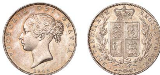
66 Halfcrown, 1842 (ESC 2717; S 3888). Cleaned, otherwise good very fine