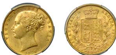
G 733 Victoria, Sovereign, 1878s, shield rev. (M 74; S 3855). About extremely fine [slabbed PCGS AU 58]