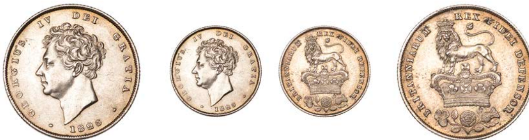
29 Shilling, 1826 (ESC 2409; S 3812). Obverse lightly wiped, otherwise extremely fine, some residual mint bloom, reverse better £100-£120