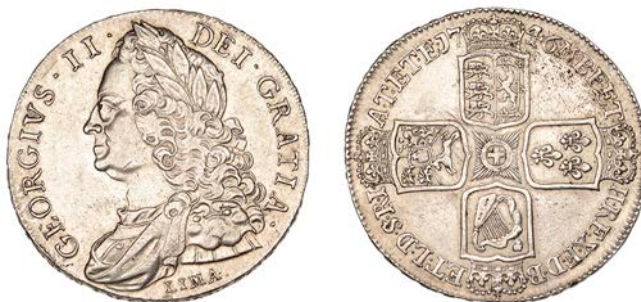
446 Crown, 1746, LIMA, edge DECIMO NONO (ESC 1668; S 3689). Lightly cleaned, otherwise about extremely fine £1,800-£2,200