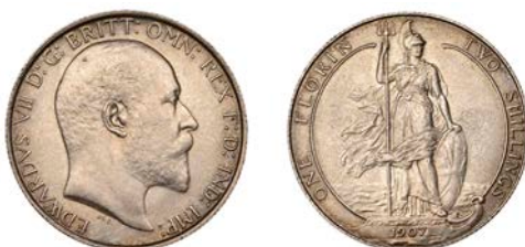
576 Florin, 1907 (ESC 3583; S 3981). Extremely fine