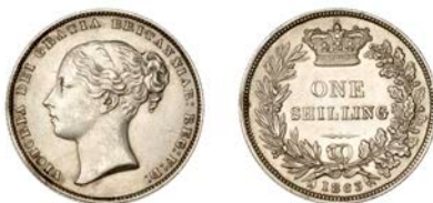
166 Shilling, 1863 (ESC 3022; S 3904). Lightly cleaned, otherwise about extremely fine, rare £300-£400