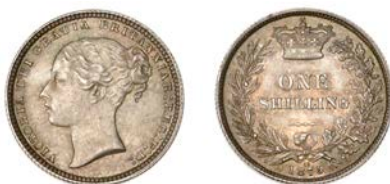
178 Shilling, 1875, die 60 (ESC 3045; S 3906A). Extremely fine, toned