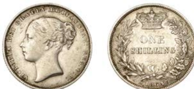
165 Shilling, 1863/1 (ESC 3023; S 3904). Cleaned and with some minor marks, otherwise very fine, very rare