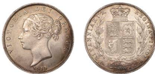
76 Halfcrown, 1875 (ESC 2745; S 3889). Lightly brushed and a few minor marks, otherwise extremely fine £240-£300