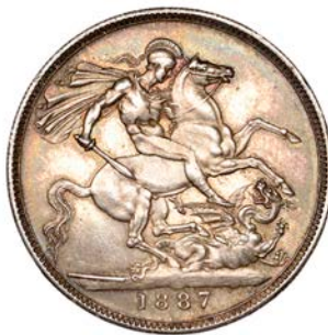
52 Crown, 1887 (ESC 2585; S 3921). Extremely fine, toned