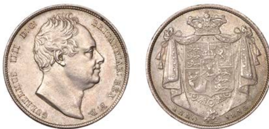
39 Halfcrown, 1835 (ESC 2481; S 3834). Good very fine with some toning, scarce