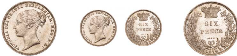
210 Sixpence, 1874, die 35 (ESC 3229; S 3910). Good extremely fine