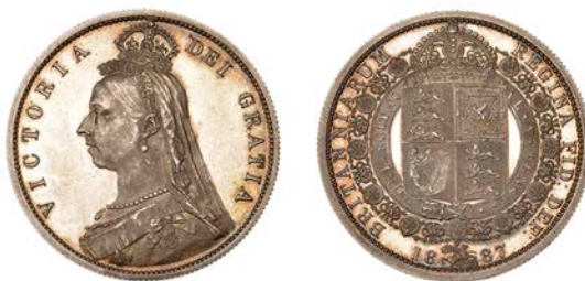
518 Proof Halfcrown, 1887 Jubilee (ESC 2772; S 3924). Surface marks and hairlined, otherwise about extremely fine or better £200-£300