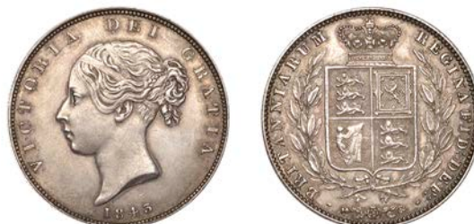
67 Halfcrown, 1843 (ESC 2718; S 3888). Cleaned, otherwise about extremely fine, rare