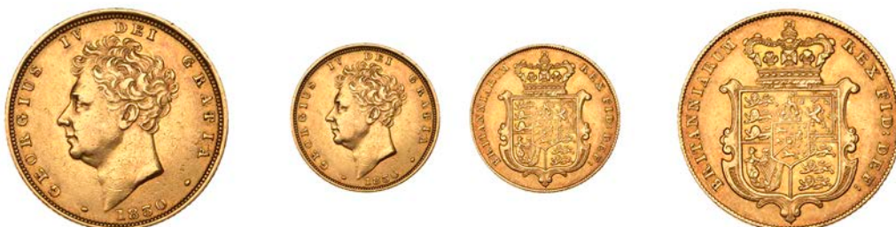
G 483 Sovereign, 1830 (M 15; S 3801). Light scratch in obverse field, otherwise good very fine, reverse better