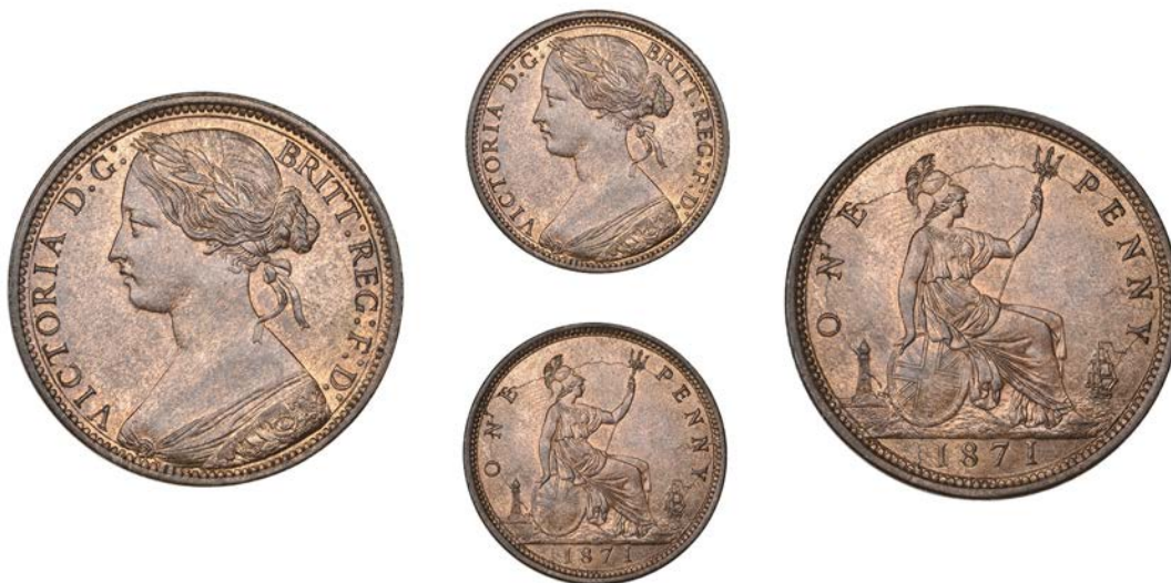
554 Penny, 1871 (F 61; BMC 1687; S 3954). Several die flaws on reverse, otherwise better than extremely fine, traces of original colour £600-£800