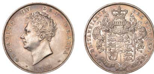
23 Halfcrown, 1829 (ESC 2378; S 3809). Cleaned, otherwise about extremely fine £200-£260