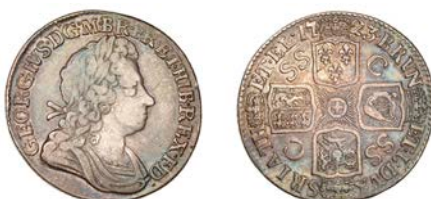
445 Shilling, 1723 ss c, first bust, French arms at date (ESC 1589; S 3647). About very fine and toned, rare £200-£260