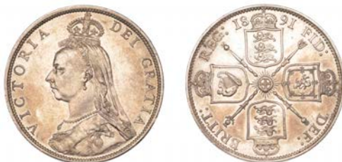
139 Florin, 1891 (ESC 2959; S 3925). About extremely fine, sometime cleaned but now re-toning