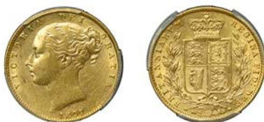
G 732 Victoria, Sovereign, 1877s, shield rev. (M 73; S 3855). Good extremely fine [slabbed PCGS AU 55]