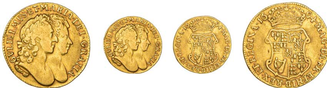
433 Guinea, 1694 (MCE 159; S 3426). Almost very fine