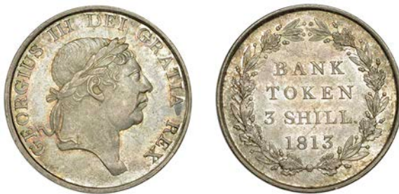
475 Three Shillings, 1813 (ESC 2082; S 3770). About as struck, toned [slabbed NGC MS 65] £400-£500