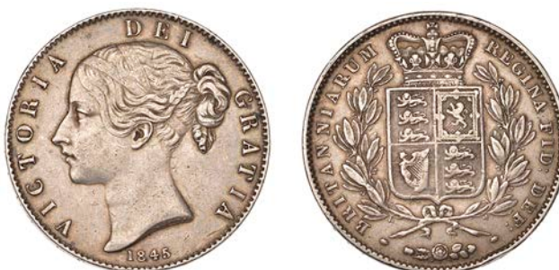
48 Crown, 1845, edge VIII (ESC 2564; S 3882). Lightly cleaned and with some contact marks, otherwise good very fine