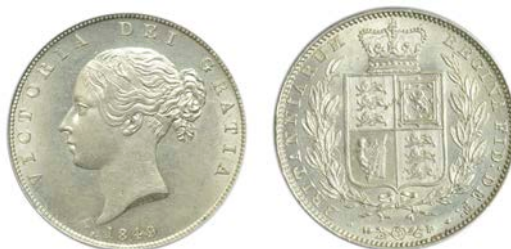
73 Halfcrown, 1849, large date (ESC 2730; S 3888). A few minor marks, otherwise extremely fine [slabbed CGS EF 65]