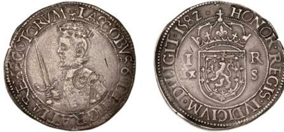
643 James VI , Fourth coinage, Twenty Shillings, 1582, pellet after obv. legend, 14.80g/12h (SCBI 35, 1240-1; SCBI 58, 1476; B 1, fig. 934; S 5489). Small dig in obverse field, otherwise nearly very fine £600-£800