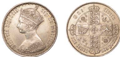
114 Florin, 1865, die 16 (ESC 2857; S 3892). Lightly cleaned and with some minor marks, otherwise about extremely fine