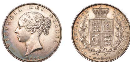
72 Halfcrown, 1848 (ESC 2726; S 3888). Lightly cleaned, otherwise about extremely fine, very rare