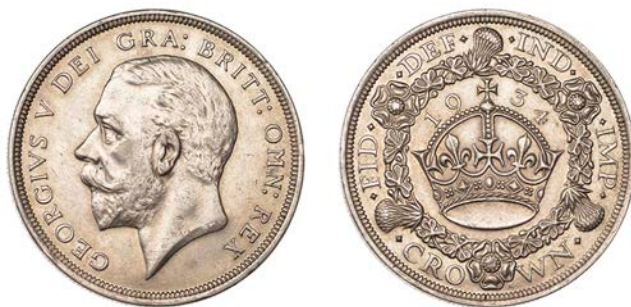
257 Crown, 1934 (ESC 3647; S 4036). Lightly cleaned, otherwise about extremely fine, rare