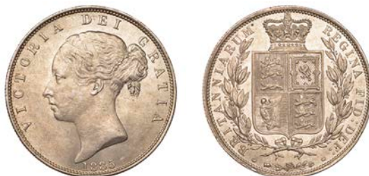
86 Halfcrown, 1885 (ESC 2765; S 3889). Extremely fine