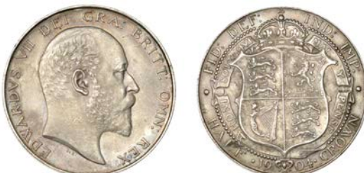
226 Halfcrown, 1904 (ESC 3570; S 3980). Cleaned at one time but now re-toning, good very fine, scarce