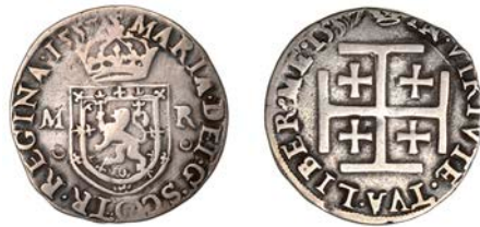
638 Mary , First period, Testoon, type IIIa, 1557, mm. cross potent on obv. , crown on rev. , high-arched crown, annulets below MR, reads DEI · G ·, 5.71g/3h (SCBI 35, 1010-12; SCBI 58, 332ff; B 16, fig. 791; S 5404). Good fine £200-£260