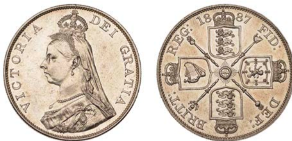
513 Double-Florin, 1887, Arabic numeral (ESC 2697; S 3923). About mint state