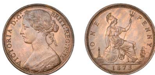
555 Penny, 1873 (F 64; BMC 1689; S 3954). Lightly bagmarked, otherwise good extremely fine £100-£120