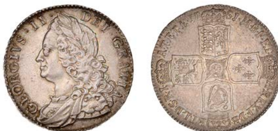
447 Halfcrown, 1751, edge VICESIMO QUARTO (ESC 1693; S 3696). Some minor marks, otherwise about extremely fine and toned, rare £1,800-£2,200 Provenance: J.M. Ashby Collection, Spink Auction 145, 12-14 July 2000, lot 2445 [from Seaby 1945]; Sovereign Rarities Auction 1, 25 September 2018, lot 230