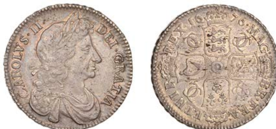
425 Halfcrown, 1676, edge VICESIMO OCTAVO (ESC 471; S 3367). Good very fine, some toning Provenance: P. Pywell-Phillips Collection, Spink Auction 257, 30 October 2018, lot 43