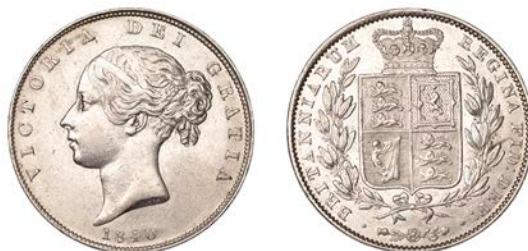
65 Halfcrown, 1840 (ESC 2715; S 3887). Cleaned, otherwise good very fine