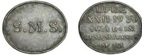
889 Uncertain location, Scottish Missionary Society , oval white metal, s.m.s., rev. LUKE XXII 19 20 THIS DO IN REMEMBRANCE OF ME, 29 x 24mm, 7.57g/6h (Lyll 207 [Sale, lot 236]; Burzinski 6333). Good fine, very rare