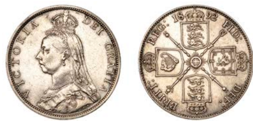
524 Florin, 1892 (ESC 2960; S 3925). Cleaned, otherwise about extremely fine, rare £300-£400