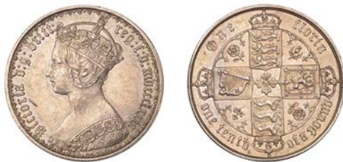
128 Florin, 1879, initials under bust (ESC 2892; S 3897). Extremely fine