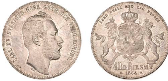
955 Carl XV , 4 Riksdaler Riksmünt, 1864 ST (SM 17; Dav. 356). About extremely fine