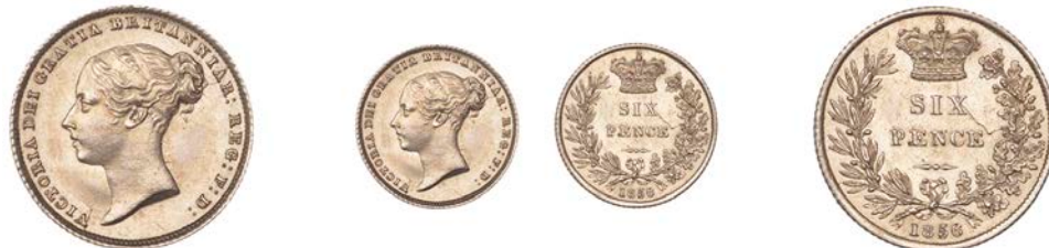
202 Sixpence, 1856 (ESC 3196; S 3908). Extremely fine