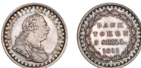
474 Proof Three Shillings, 1811, type A 2 /1 1 , edge plain, 14.71g/12h (ESC 2067; S 3769). Fields lightly hairlined, otherwise brilliant, good extremely fine, very rare