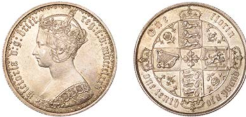
124 Florin, 1875, die 72 (ESC 2883; S 3893). Cleaned, otherwise about extremely fine