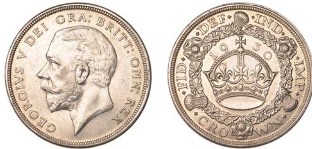
253 Crown, 1930 (ESC 3638; S 4036). About extremely fine