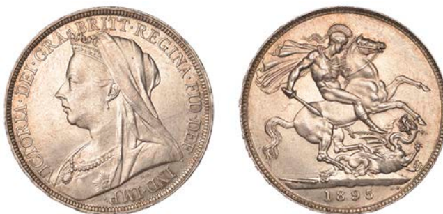
59 Crown, 1895, edge LIX (ESC 2599; S 3937). Lightly brushed, otherwise good extremely fine