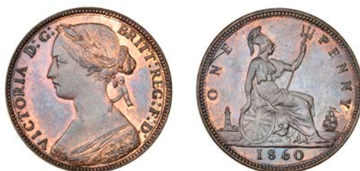
549 Proof Penny, 1860, dies Dd, toothed border, edge plain, 9.24g/12h (Gouby DD; F 12; BMC 1631). Light surface marks and some clouding over fields, otherwise extremely fine, rare £300-£360