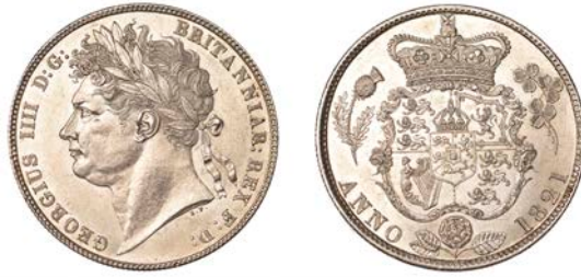
17 Halfcrown, 1821 (ESC 2360; S 3807). Extremely fine