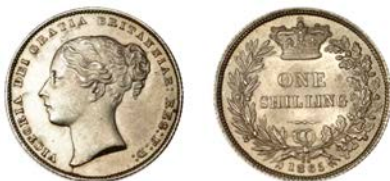
168 Shilling, 1865, die 66 (ESC 3025; S 3905). Extremely fine £120-£150