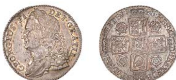
452 Sixpence, 1743, roses (ESC 1752; S 3709). Extremely fine with some toning £240-£300