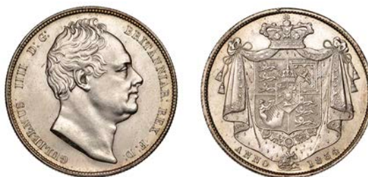
490 Halfcrown, 1834, ww in script (ESC 2478; S 3834). Virtually mint state Provenance: DNW Auction 143, 12-14 December 2017, lot 1189 £500-£600