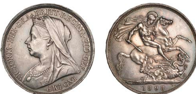
511 Crown, 1898, edge LXI (ESC 2604; S 3937). Extremely fine and toned, rare £240-£300