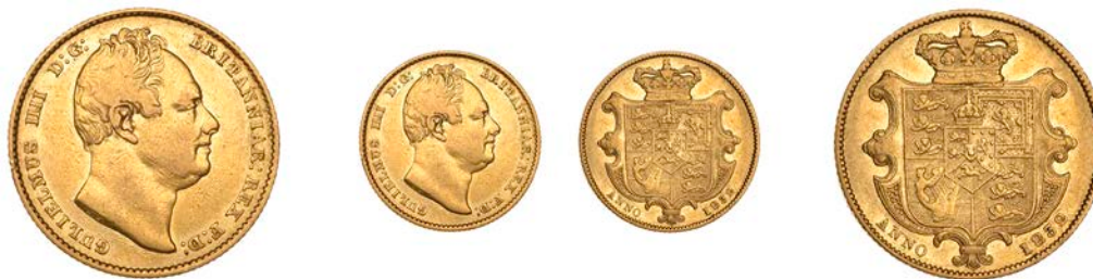
G 489 Sovereign, 1832, second bust (M 17; S 3829B). Almost very fine £600-£800