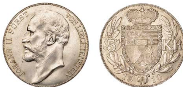
893 Johann II , 5 Kronen, 1910 (HMZ 1376d; Dav. 216; KM. Y4). Extremely fine