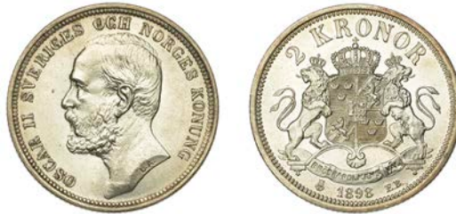
956 Oscar II , 2 Kronor, 1898 EB (SM 55; KM. 761). About as struck [slabbed NGC MS 63]