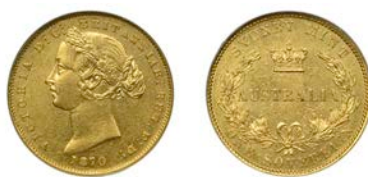
G 730 Victoria, Sovereign, 1870, Sydney (KM. 4; F 10). About extremely fine [slabbed NGC AU 55]