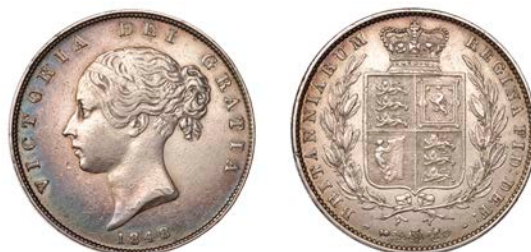
71 Halfcrown, 1848/6 (ESC 2728; S 3888). Cleaned, otherwise good very fine, rare