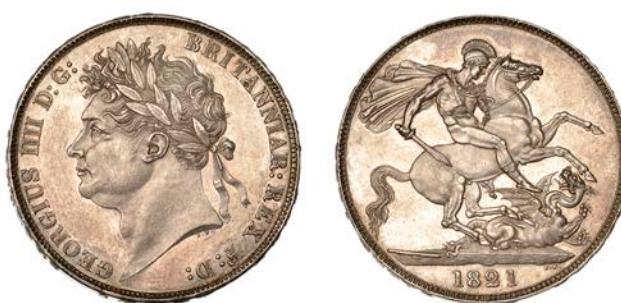
485 Crown, 1821, edge SECUNDO (ESC 2310; S 3805). Good extremely fine