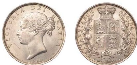
81 Halfcrown, 1880 (ESC 2756; S 3889). About extremely fine £240-£300