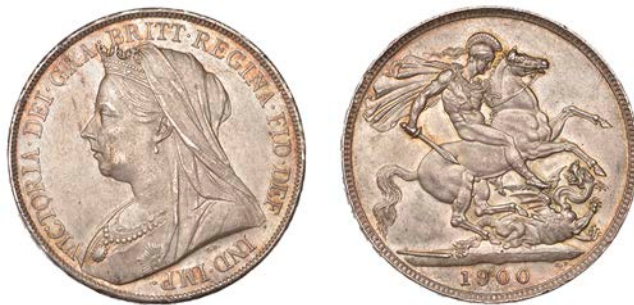
64 Crown, 1900, edge LXIV (ESC 2609; S 3937). Minor marks on obverse, otherwise extremely fine