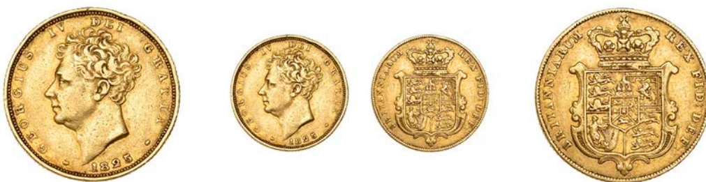
G 482 Sovereign, 1825, type 2 (M 10; S 3801). Good fine