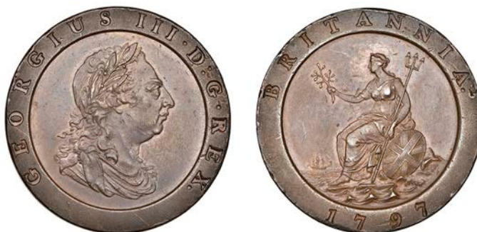
464 Twopence, 1797 (BMC 1077; S 3776). Extremely fine with traces of original colour