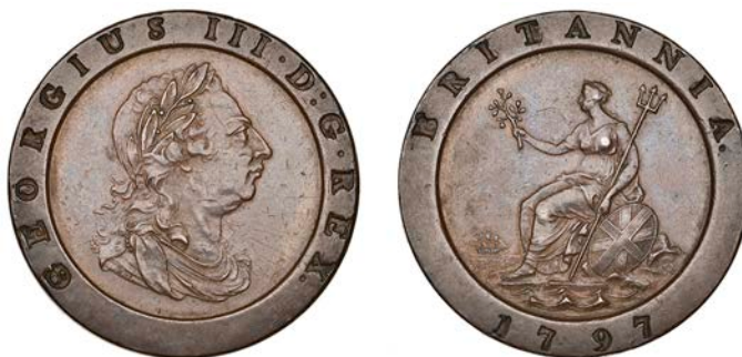
465 Twopence, 1797 (BMC 1077; S 3776). Nearly extremely fine