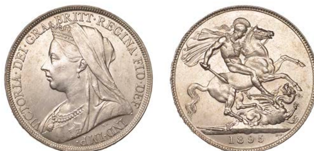
60 Crown, 1895, edge LIX (ESC 2599; S 3937). Lightly cleaned, otherwise extremely fine