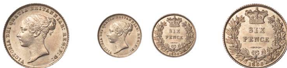
206 Sixpence, 1866, die 36 (ESC 3213; S 3909). Extremely fine