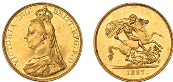
G 495 Five Pounds, 1887 (Hill F30; S 3864). Some hairlines, otherwise good extremely fine