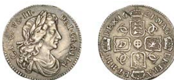
426 Sixpence, 1681 (ESC 577; S 3382). Nearly extremely fine