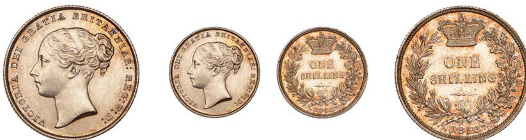
159 Shilling, 1856 (ESC 3007; S 3904). Good extremely fine