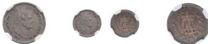
494 Threehalfpence, 1835/4 (ESC 2542; S 3839). Extremely fine, toned [slabbed NGC AU 55] £60-£80