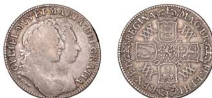
434 Shilling, 1693, stop after GRATIA and REGINA , first v in GVILIELMVS possibly an inverted A (ESC 868 var; S 3437). Obverse fine, reverse nearly very fine