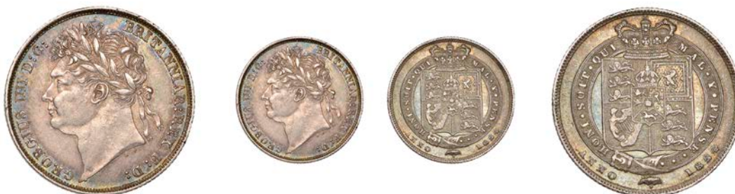
26 Shilling, 1824 (ESC 2400; S 3811). Obverse sometime wiped and now re-toned, otherwise about extremely fine £100-£120

Provenance: D. Wallis Collection, DNW Auction 83, 30 September 2009, lot 3154