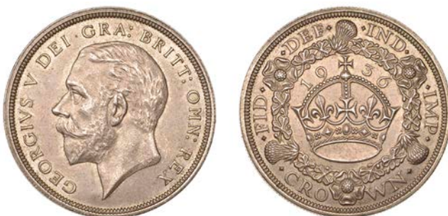
259 Crown, 1936 (ESC 3649; S 4036). About extremely fine