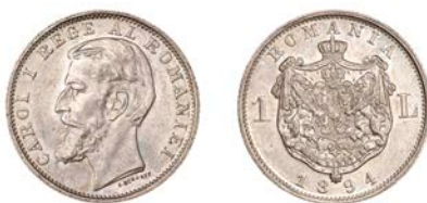
934 Carol I , Leu, 1894 (KM. 24). About extremely fine