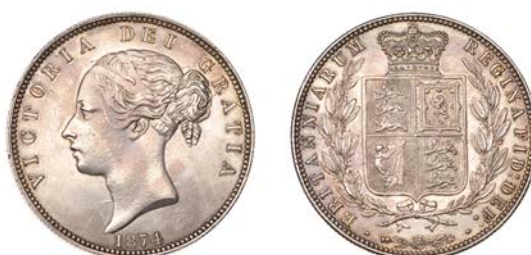
75 Halfcrown, 1874 (ESC 2741; S 3889). Cleaned, otherwise extremely fine