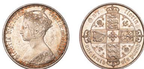
119 Florin, 1870, die 1 (ESC 2870; S 3893). Some minor marks, otherwise extremely fine with proof-like surfaces £400-£500