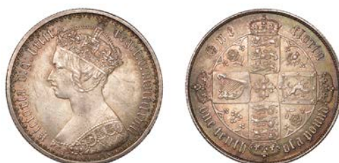
117 Florin, 1868, die 5 (ESC 2866; S 3893). Extremely fine £400-£500