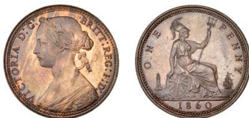
547 Proof Penny, 1860, dies Cb, bronze, beaded borders, edge plain, 9.45g/12h (Gouby CP; F 6A; BMC –). Light surface marks, streaky toning on obverse, otherwise extremely fine, reflective fields, extremely rare £400-£500