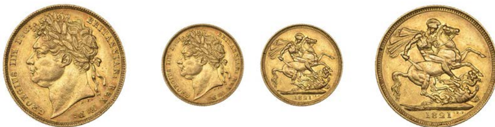
G 479 Sovereign, 1821 (M 5; S 3800). A few rim marks and nicks, otherwise good very fine £800-£1,000