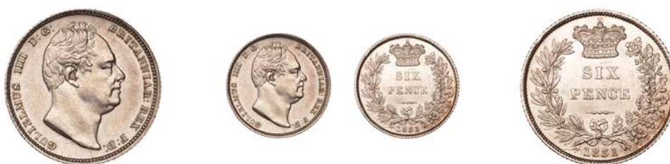
45 Sixpence, 1831 (ESC 2499; S 3836). Extremely fine