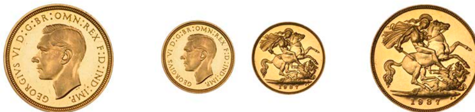
G 583 Proof Half-Sovereign, 1937 (M 543A; S 4077). Brilliant, about as struck, sharp rims £800-£1,000