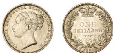
184 Shilling, 1882 (ESC 3071; S 3907). Good extremely fine