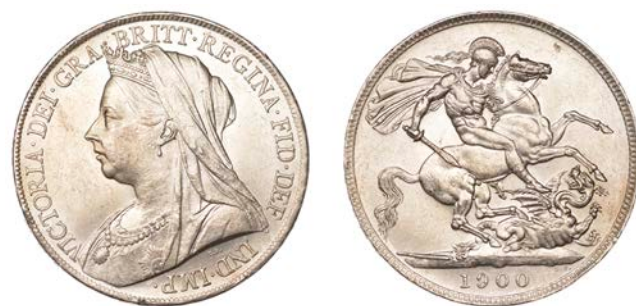
63 Crown, 1900, edge LXIII (ESC 2608; S 3937). Lightly cleaned and with some minor marks, otherwise extremely fine