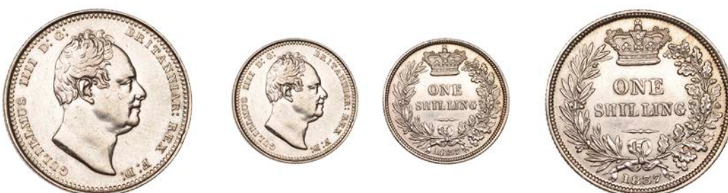
44 Shilling, 1837 (ESC 2497; S 3835). Good very fine, but has been cleaned