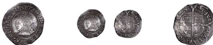
395 Second issue, Penny, mm. cross-crosslet, bust 1H, beaded inner circles, large shield, 0.43g/9h (N 1988; S 2558). Better than very fine, dark tone £150-£200 Provenance: W. Wilkinson Collection, Part IV, DNW Auction 190, 6 April 2021, lot 67 [from M. Vosper September 2006]