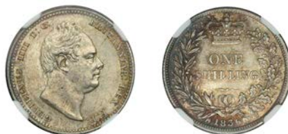
491 Shilling, 1836 (ESC 2494; S 3835). About as struck [slabbed NGC MS 64+] £300-£400