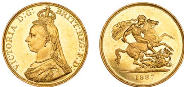
G 496 Five Pounds, 1887 (Hill F30; S 3864). Some hairlines and surface marks, otherwise good extremely fine, with some mint brilliance