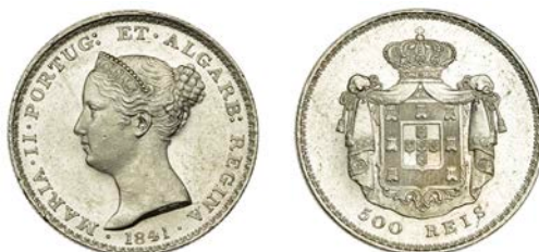
916 Maria II , 500 Réis, 1841 (Gomes 31.04; KM. 471). Good extremely fine [slabbed NGC MS 63]