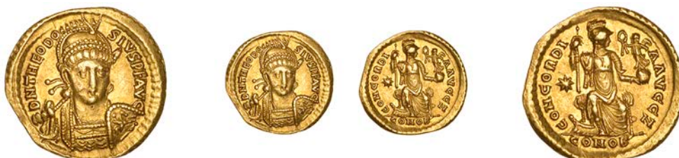
1010 Theodosius II , Solidus, Constantinople, 408-20, D N THEODOSIVS P F AVG, pearl-diademed and cuirassed bust facing, holding spear and shield, rev. CONCORDIA AVGG Z, Constantinoplois seated front, resting right foot on ship's prow, holding Victory on globe and sceptre, 4.34g (RIC 202; RCV 21127). Light graffito in obverse field, otherwise good very fine £400-£500