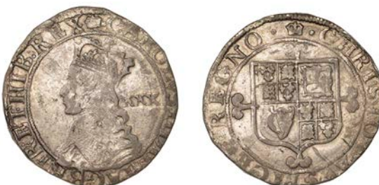
421 Third issue, Halfcrown, mm. crown, reads MAG BR FR, 12.04g/4h (ESC 301; N 2761; S 3321). Small of flan and weak on portrait, otherwise nearly very fine, cleaned £200-£300