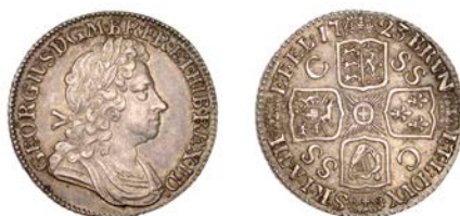
442 Shilling, 1723 ss c, first bust (ESC 1586; S 3647). About extremely fine £200-£260