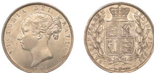
85 Halfcrown, 1884 (ESC 2764; S 3889). Extremely fine