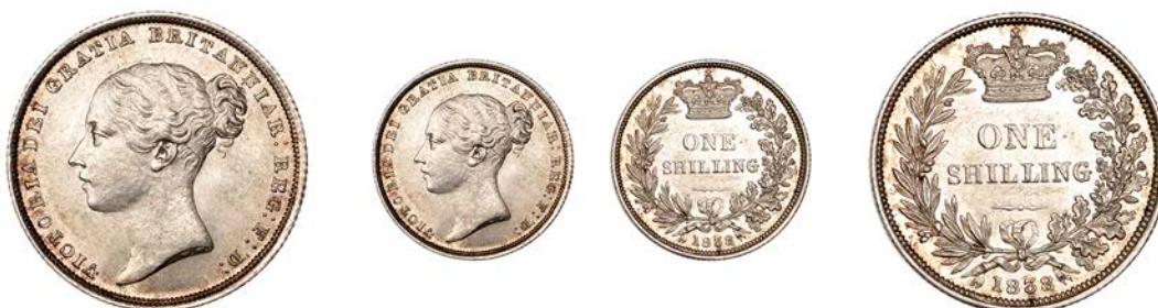
144 Shilling 1838, type 1 (ESC 2973; S 3902). Extremely fine, lightly toned