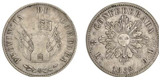
729 CORDOBA, 8 Réales, 1852 (KM. 32). About very fine