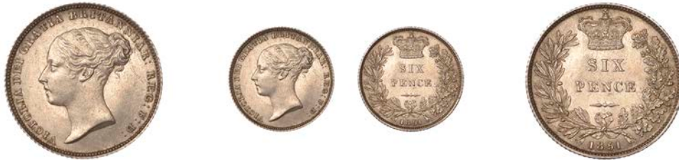
199 Sixpence, 1851 (ESC 3187; S 3908). Extremely fine