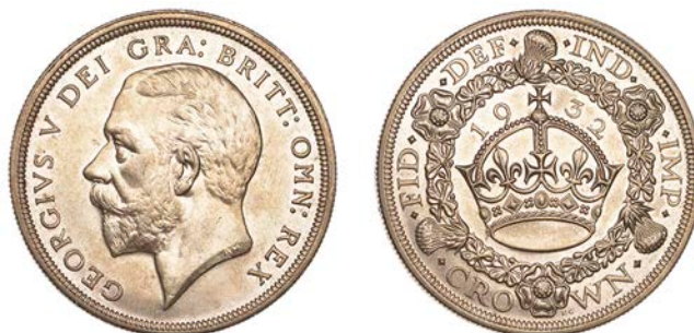
255 Crown, 1932 (ESC 3641; S 4036). Extremely fine