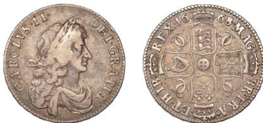
424 Halfcrown, 1668/4, third bust, edge VICESIMO (ESC 449; S 3365). Nearly very fine, rare