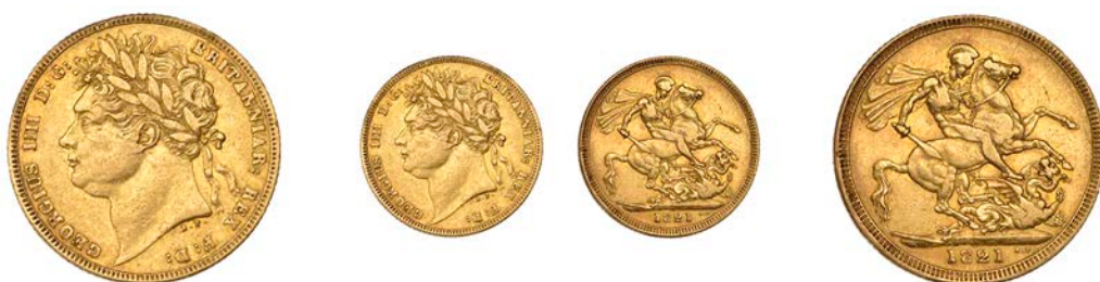
G 481 Sovereign, 1822 (M 6; S 3800). About very fine £600-£800