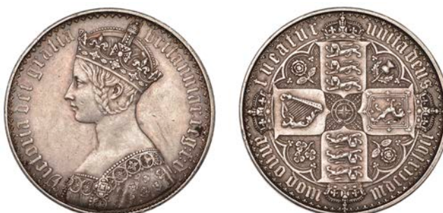
51 Proof 'Gothic' Crown, 1847, edge plain, N over inverted N in UNITA, 28.06g/12h (ESC 2578; S 3883). Cleaned, otherwise good very fine, rare