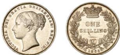
169 Shilling, 1866, die 42 (ESC 3027; S 3905). Lightly cleaned, otherwise extremely fine £100-£120