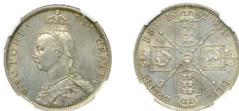
140 Florin, 1892 (ESC 2960; S 3925). Good extremely fine, scarce [slabbed NGC MS 63] Provenance: Stack's Bowers & Ponterio Auction (Baltimore), 16 November 2011, lot 23320