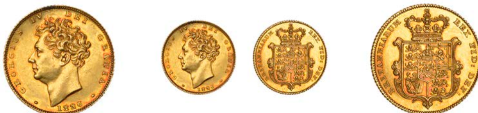
G 484 Proof Half-Sovereign, 1826, edge grained, 4.01g/6h (WR 249; M 407C; S 3804A). Brushed, otherwise good extremely fine