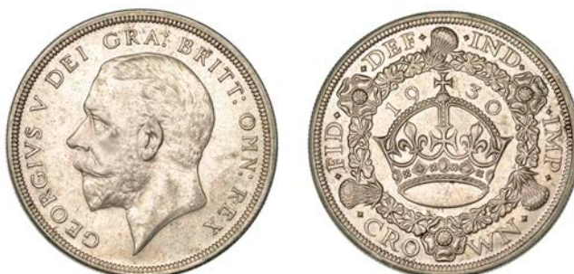
580 Crown, 1930 (ESC 3638; S 4036). Extremely fine £200-£260