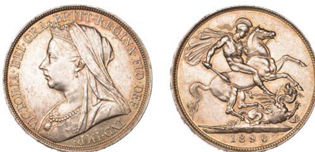
61 Crown, 1896, edge LX (ESC 2601; S 3937). Lightly cleaned and with minor rim knocks, otherwise extremely fine, some toning