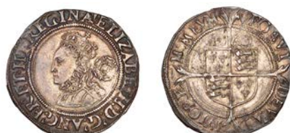
396 Third issue, Sixpence, 1563/2, mm. pheon, bust 1F, normal flan, Tudor rose, reads REGINA, 2.82g/8h (N 1997; S 2561). Weakly struck on date, otherwise good very fine, attractive portrait £240-£300