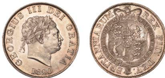
476 Halfcrown, 1820 (ESC 2105; S 3789). Lightly cleaned in the past, otherwise virtually mint state £300-£400 Provenance: Glendining Auction, 23 November 1983, lot 109; A.E. Bray Collection, Glendining Auction, 1 May 1985, lot 213