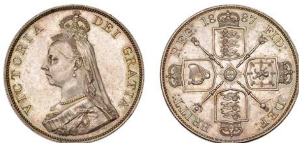
514 Double-Florin, 1887, Arabic numeral (ESC 2697; S 3923). About mint state but a few marks on cheek