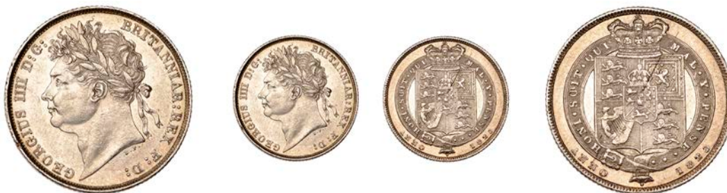
25 Shilling, 1823 (ESC 2398; S 3811). Obverse sometime cleaned and now re-toning, otherwise about extremely fine £150-£180

Provenance: D. Wallis Collection, DNW Auction 83, 30 September 2009, lot 3154