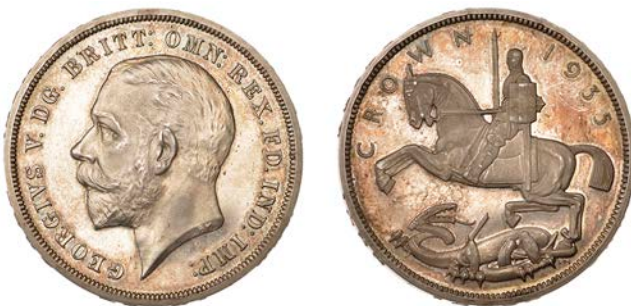
258 Proof Crown, 1935, edge raised xxv, 28.42g/12h (ESC 3655; S 4050). Minor spotting, otherwise about as struck