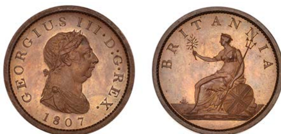
470 Restrike Proof Penny, 1807, in copper, edge plain, 17.91g/6h (BMC – [R 98]; Selig –). About as struck, extremely rare