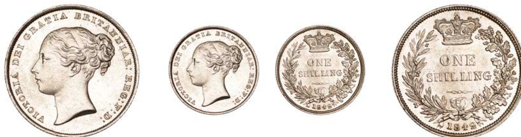
147 Shilling, 1842 (ESC 2987; S 3904). Of bright appearance, good extremely fine

Provenance: D. Wallis Collection, DNW Auction 83, 30 September 2009, lot 3255 [from W.A. Nicholls October 1998]