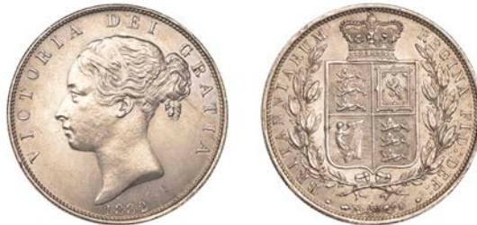
83 Halfcrown, 1882 (ESC 2761; S 3889). Cleaned, otherwise extremely fine