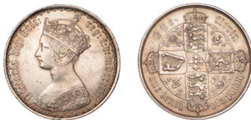
108 Florin, 1857 (ESC 2835; S 3891). Cleaned, otherwise about extremely fine