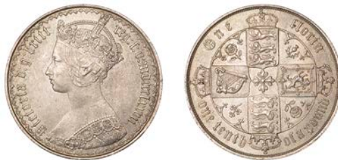
126 Florin, 1877, die 27, stop after date (ESC 2887; S 3895). Extremely fine