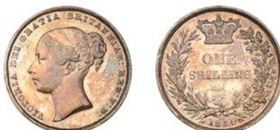
526 Shilling, 1864, die 68 (ESC 3024; S 3905). About extremely fine, toned