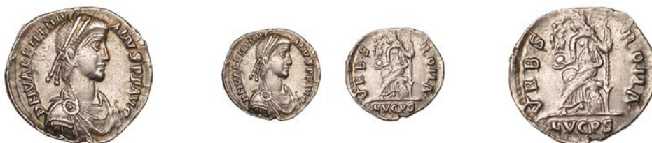
1008 Valentinian II , Siliqua, Lugdunum, 388-92, pearl-diademed, draped and cuirassed bust right, rev. Roma seated left on cuirass, holding Victory on globe and sceptre, LVGPS in exergue, 2.01g (RIC 43a; RSC 76+b). Lightly toned over bright surfaces, minor crazing in fields, otherwise good very fine £150-£180