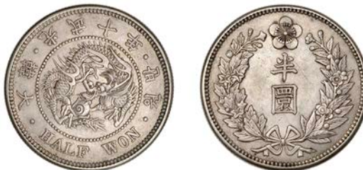
892 Kuang Mu , Half-Won, yr 10 [1906] (KM. 1129). Small scratch in reverse field, otherwise about extremely fine