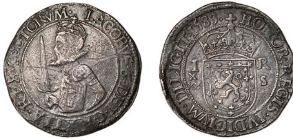
642 James VI , Fourth coinage, Thirty Shillings, 1583, mark of value in two lines, 21.51g/5h (SCBI 35, 1239; SCBI 58, 1464-6; B 3, fig. 933; S 5487). Surfaces rough and marked, particularly obverse, otherwise good fine or better £300-£400