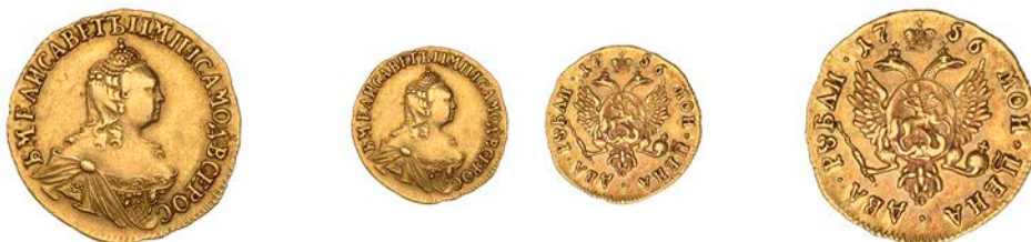
935 Elizabeth , 2 Roubles, 1756, St Petersburg (Diakov 384; Sev. 210; F 115). Edge milling weak from 10 to 2 o'clock, otherwise very fine, scarce