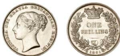
163 Shilling, 1861 (ESC 3019; S 3904). Good extremely fine