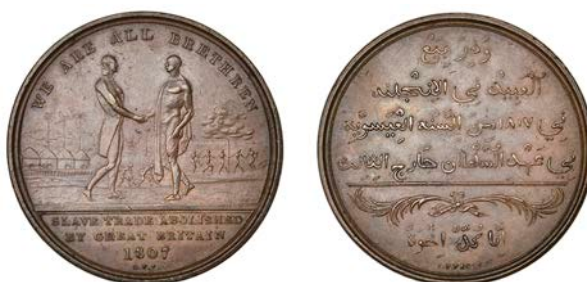
940 Macaulay & Babington , Penny, 1807 [struck 1814], 17.15g/12h (Vice 1; KM. Tn1.1). Good very fine