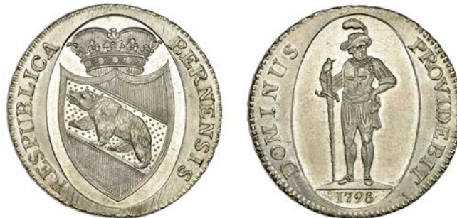
958 BERN , Thaler, 1798 (HMZ 218e; Dav. 1760A; KM. 164). About as struck [slabbed NGC MS 63+ PL]