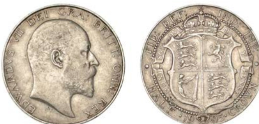
227 Halfcrown, 1905 (ESC 3571; S 3980). Lightly cleaned, otherwise very fine, rare