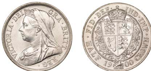
520 Halfcrown, 1900 (ESC 2786; S 3938). About as struck £100-£120