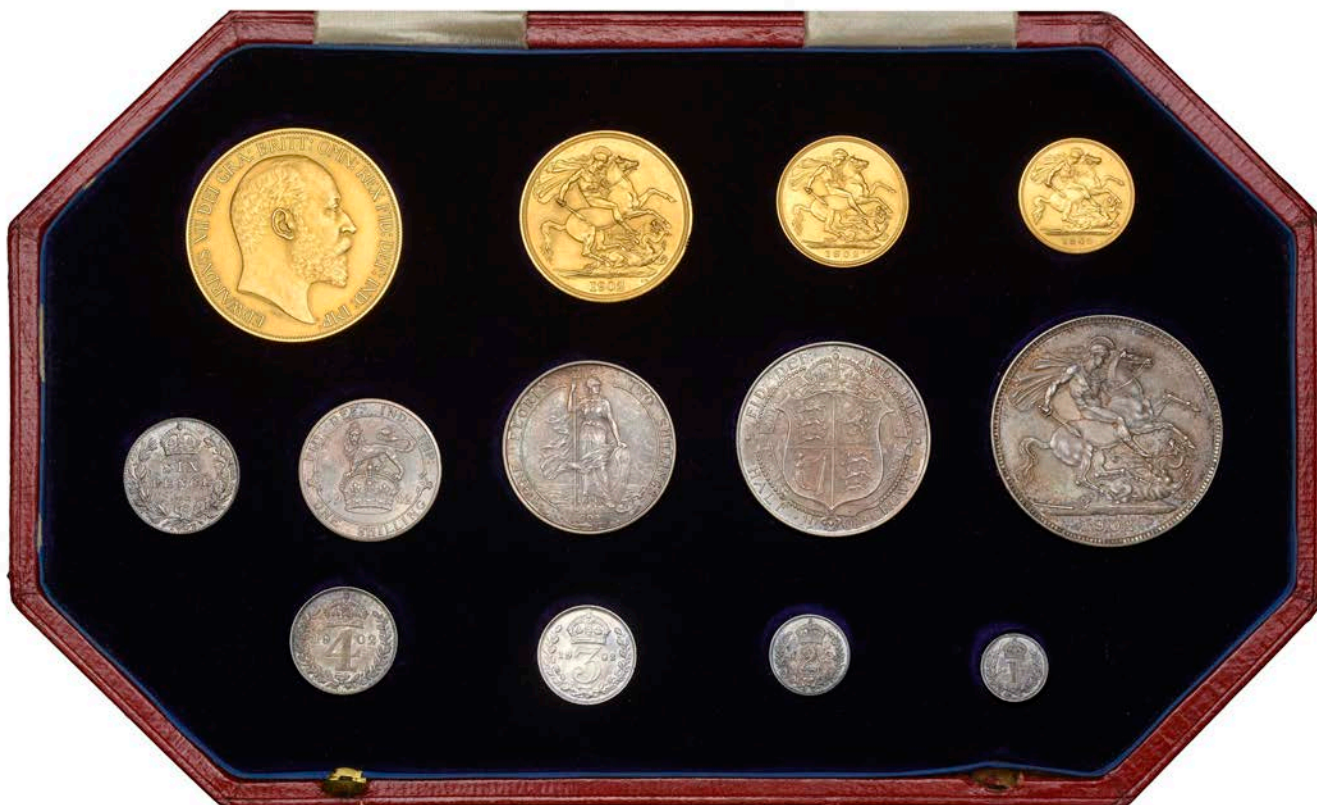
577 Proof set, 1902, comprising gold Five Pounds, Two Pounds, Sovereign and Half-Sovereign, silver Crown to Maundy Penny [13]. Threepence a currency issue, good extremely fine or better, silver with dark tone; in case of issue £5,000-£6,000