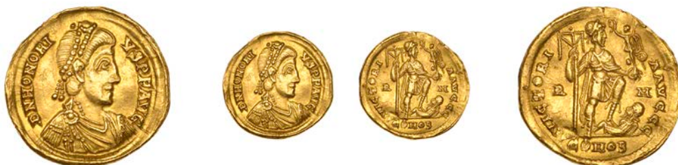
1009 Honorius , Solidus, Rome, 404-8, D N HONORIVS P F AVG, pearl-diademed bust right, rev. VICTORIA AVGGG, Emperor standing right, holding standard and Victory, left foot on captive, 4.36g (RIC 1252; RCV 20918). Several marks on edge and a few surface scuffs, otherwise good very fine, lightly toned £400-£500