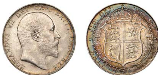
573 Halfcrown, 1904 (ESC 3570; S 3980). Extremely fine, reverse attractively toned