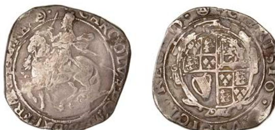
407 Tower mint, Halfcrown, Gp IV, type 4, mm. triangle-in-circle, 14.99g/6h (Bull 463ff; SCBI Brooker 373; N 2214; S 2779). Double-struck on reverse, otherwise good fine £80-£100