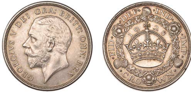
251 Crown, 1928 (ESC 3633; S 4036). A few minor marks, otherwise about extremely fine