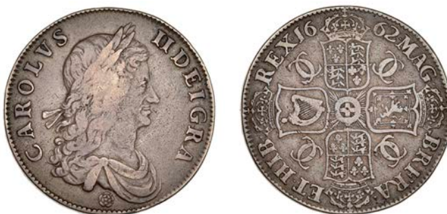
422 Crown, 1662, first bust, rose below, edge dated (ESC 344; S 3351). Nearly very fine £200-£260