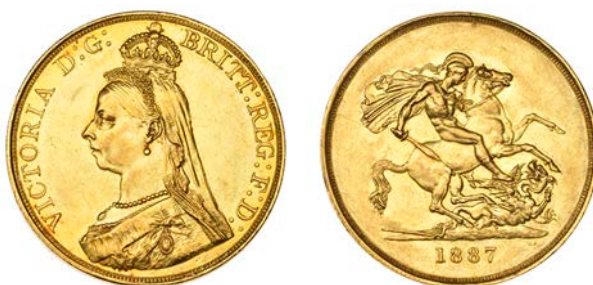
G 498 Five Pounds, 1887 (Hill F30; S 3864). Good very fine