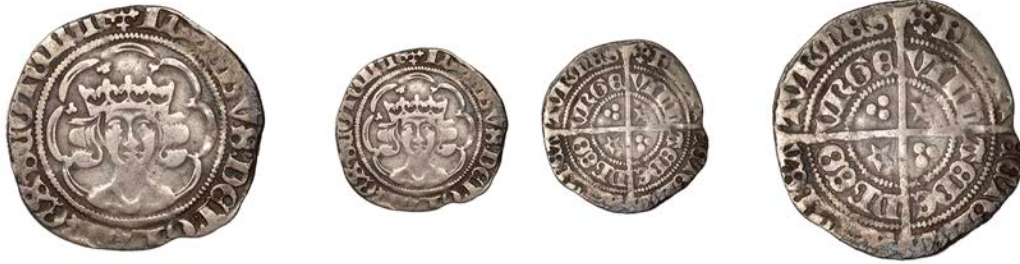
636 James III , Light issue, Groat, Edinburgh, mm. cross fleury, crown with five spikes, pellets in first and fourth quarters, mullets in second and third, reads EDENBEOVRGE, 2.42g/4h (SCBI 35, 763; B 23, fig. 605; S 5280A). Good fine but a little small of flan £200-£260