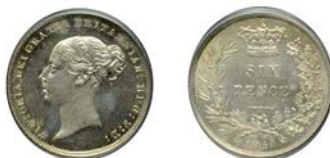
151 Sixpence, 1850, 5 over 3 (ESC 3186; S 3908). About as struck, rare [slabbed MS 64] £200-£300