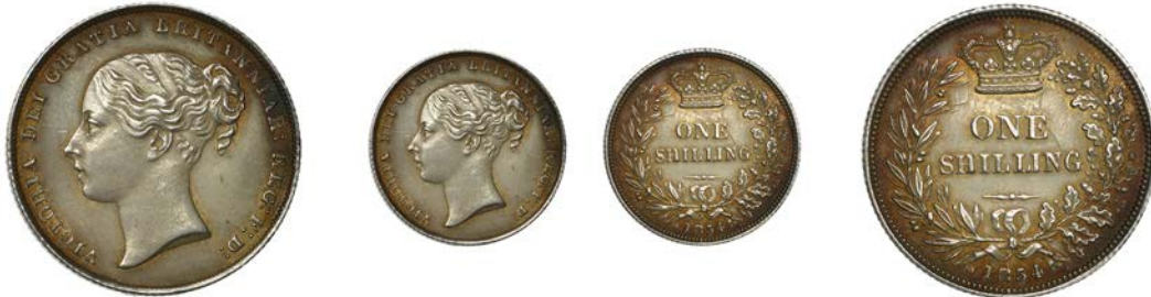
411 Shilling, 1854 (ESC 3004; S 3904). Lightly cleaned, otherwise about extremely fine with some toning, rare