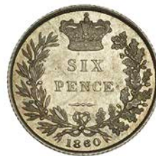
464 Sixpence, 1860, small 6 in date (ESC 3206; S 3908). Extremely fine with proof-like surfaces Provenance: D. Wallis Collection, DNW Auction 83, 30 September 2009, lot 3302