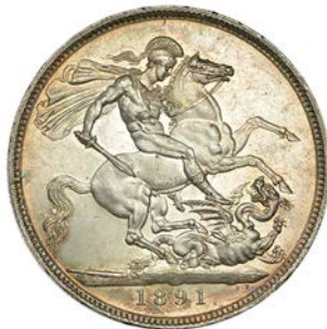
303 Crown, 1891 (ESC 2591; S 3921). Good extremely fine, light tone over residual cartwheel bloom