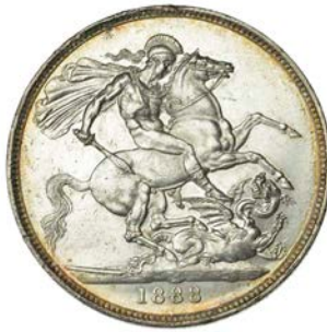
298 Crown, 1888, narrow date (ESC 2587; S 3921). A few edge nicks and light surface marks, otherwise good extremely fine £100-£150