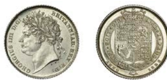
273 Sixpence, 1825 (ESC 2427; S 3814). Good extremely fine Provenance: D. Wallis Collection, DNW Auction 83, 30 September 2009, lot 3166