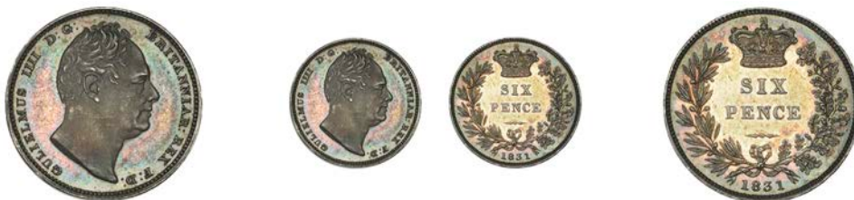
285 Proof Sixpence, 1831, edge plain, 2.73g/6h (ESC 2501; S 3836). About as struck, toned