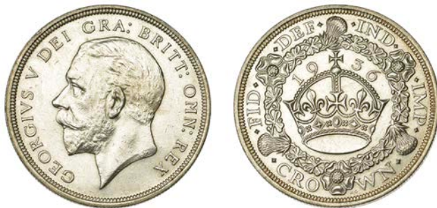
533 Crown, 1936 (ESC 3649; S 4036). Of bright appearance, scratched in fields, and with some contact marks, otherwise about extremely fine