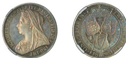
139 Proof Florin, 1893 (ESC 2963; S 3939). Light hairlines, otherwise about as struck, toned [slabbed NGC PF 63+ Cameo]