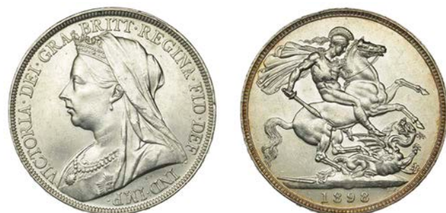
315 Crown, 1898, edge LXII (ESC 2605; S 3937). Of bright appearance and lightly bagmarked, otherwise virtually as struck £240-£300