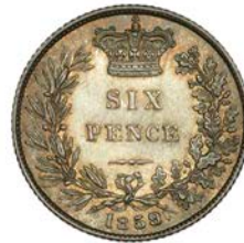
462 Sixpence, 1859/8 (ESC 3204; S 3908). Extremely fine Provenance: Baldwin Auction 77, 27 September 2012, lot 2828