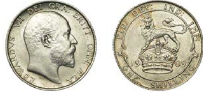
518 Shilling, 1909 (ESC 3595; S 3982). Minor marks on face, otherwise extremely fine, scarce Provenance: DNW Auction 91, 16 March 2011, lot 383