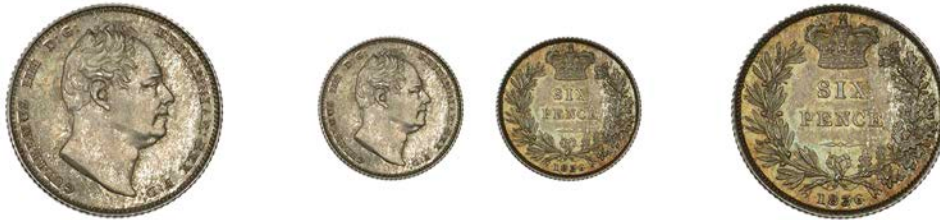
287 Sixpence, 1836 (ESC 2510; S 3836). Extremely fine, reverse proof-like Provenance: S.A. Bole Collection, Part III, DNW Auction 91, 16 March 2011, lot 179