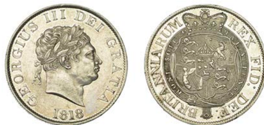
99 Halfcrown, 1818 (ESC 2099; S 3789). Lightly brushed, otherwise extremely fine £240-£300