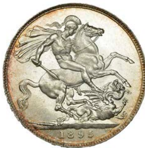
309 Crown, 1895, edge LVIII (ESC 2598; S 3937). Lightly bagmarked, otherwise virtually as struck £300-£400 Provenance: D. Wallis Collection, DNW Auction 83, 30 September 2009, lot 3502