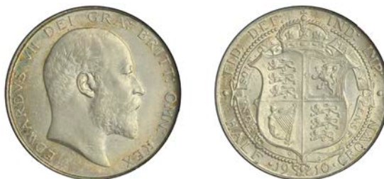
184 Halfcrown, 1910 (ESC 3576; S 3980). Good extremely fine, toned [slabbed NGC MS 63] Provenance: DNW Auction 137, 21-3 September 2016, lot 1446