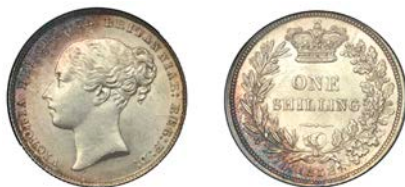
142 Shilling, 1858 (ESC 3011; S 3904). Minor surface marks, otherwise about as struck, toned [slabbed NGC MS 63] £200-£260