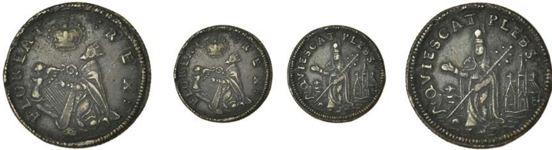
846 St Patrick's coinage , 'Farthing', 5.65g/12h (Martin 1c.3/Ca.5; Whitman 11500; Breen 208; S 6569). Some edge irregularities and minor surface pitting, otherwise very fine or better for issue