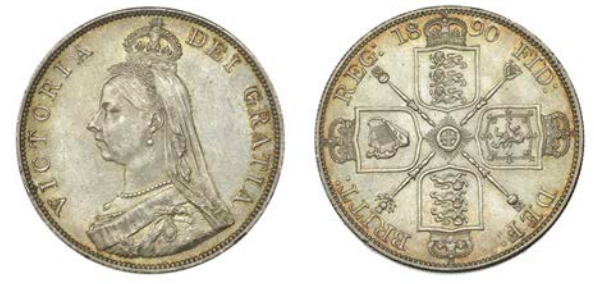
327 Double-Florin, 1889 (ESC 2703; Davies 546, 2D; S 3923). Miniscule edge nick, otherwise good extremely fine, olive tone £100-£120