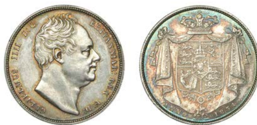
277 Halfcrown, 1834, w.w. in block (ESC 2474; S 3834A). Obverse lightly brushed, otherwise extremely fine and toned, scarce