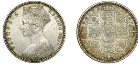
368 Florin, 1849, with initials (ESC 2815; S 3890). Obverse sometime lightly brushed and now re-toned, otherwise extremely fine £200-£260