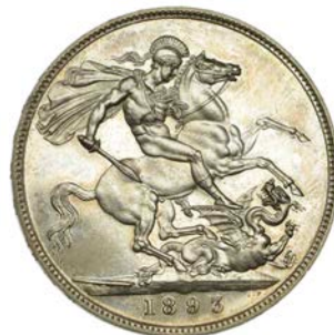
305 Proof Crown, 1893, edge LVII (ESC 2594; S 3937). A few minor marks, otherwise virtually as struck Provenance: P. Hanger Collection, Spink Auction 199, 25 June 2009, lot 129 [from Spink 1997]