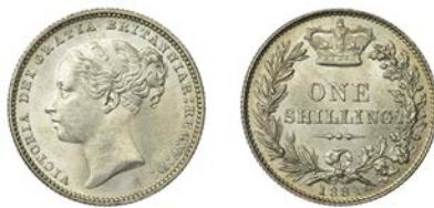
433 Shilling, 1881 (ESC 3068; S 3907). Extremely fine