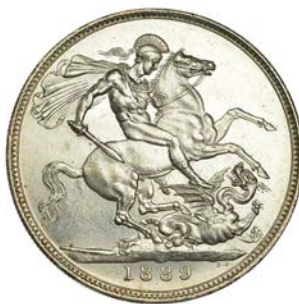
300 Crown, 1889 (ESC 2589; Davies 1A; S 3921). Lightly bagmarked, otherwise good extremely fine