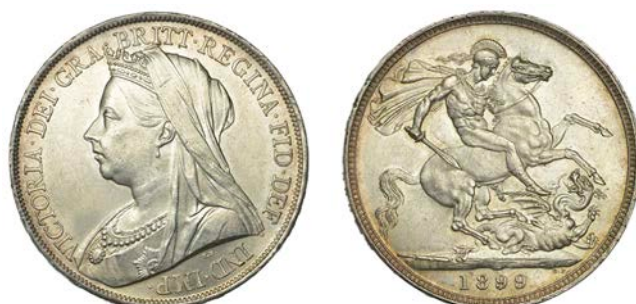
317 Crown, 1899, edge LXIII (ESC 2607; S 3937). Virtually as struck, lightly toned £300-£400