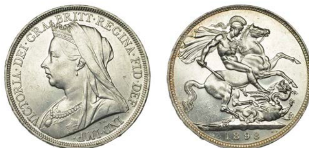
314 Crown, 1898, edge LXI (ESC 2604; S 3937). Of bright appearance and lightly bagmarked, otherwise good extremely fine £200-£260 Provenance: D. Wallis Collection, DNW Auction 83, 30 September 2009, lot 3505