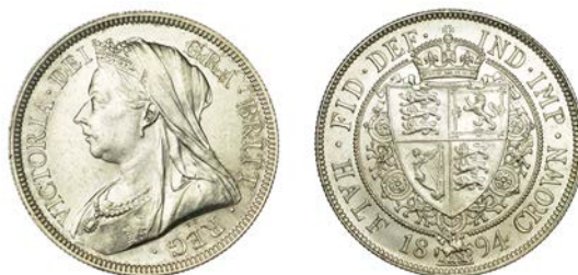
134 Halfcrown, 1894 (ESC 2780; S 3938). A few minor marks, otherwise about as struck