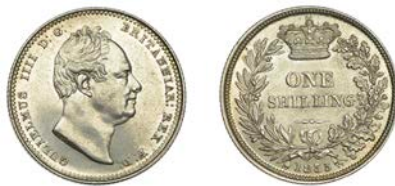
282 Shilling, 1835 (ESC 2492; S 3835). Obverse lightly brushed, otherwise extremely fine