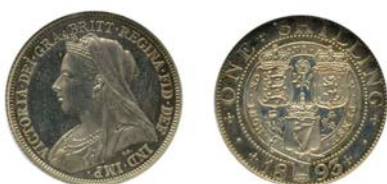
148 Proof Shilling, 1893 (ESC 1362; S 3940). Light hairlines, otherwise about as struck, toned [slabbed NGC PF 63] £150-£200