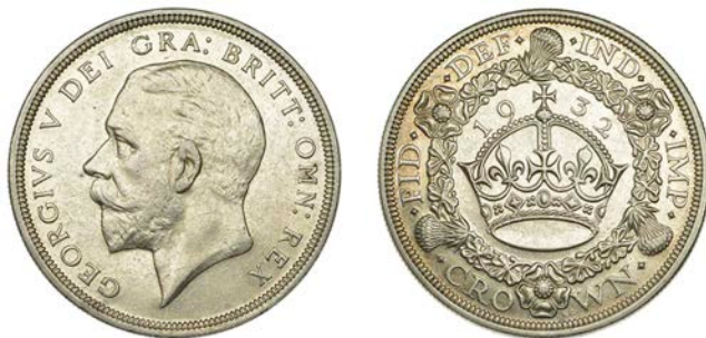
529 Crown, 1932 (ESC 3641; S 4036). Fields marked, otherwise good very fine