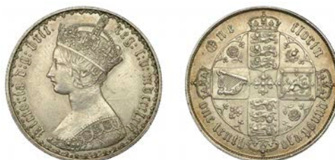
376 Florin, 1862 (ESC 2847; S 3891). Good very fine but obverse brushed, rare £300-£400