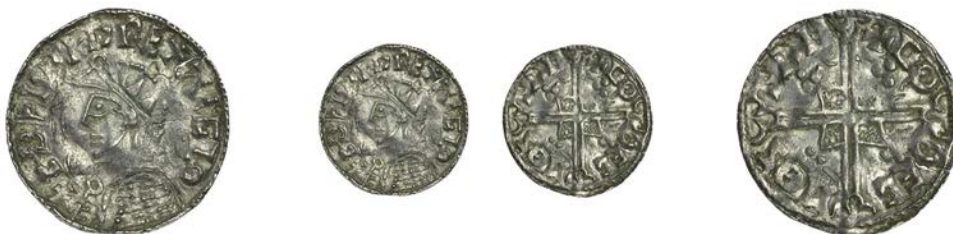
572 Penny, Helmet type, Stamford, Godæg, GODEC MO STAN, 1.23g/6h (BEH 3488; N 775; S 1152). Several small flan cracks, otherwise very fine £150-£180