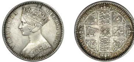
369 Florin, 1849, initials almost completely obliterated (ESC 2817; S 3890). Light surface marks, otherwise about extremely fine, scarce £150-£180