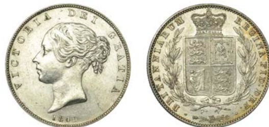
337 Halfcrown, 1849, small date (ESC 2732; S 3888). Light contact marks and of bright appearance, otherwise extremely fine, some residual bloom, rare £500-£600