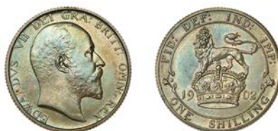
189 Proof Shilling, 1902 (ESC 3588; S 3982). About as struck