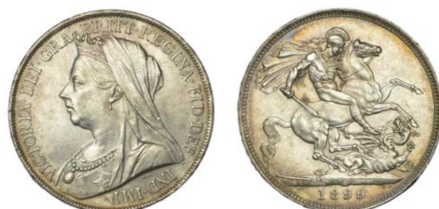
316 Crown, 1899, edge LXII (ESC 2606; S 3937). Obverse field hairlined, otherwise good extremely fine £200-£260