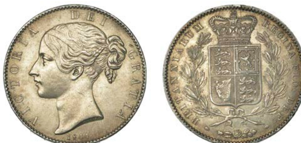
292 Crown, 1844, edge viii , cinquefoil stops (ESC 2562; S 3882). Sometime cleaned and now re-toned, reverse die crack at 12 o'clock, otherwise good very fine