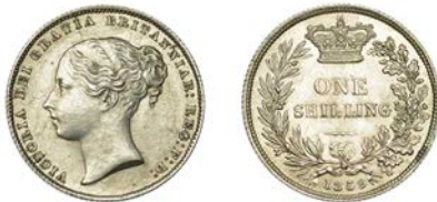
143 Shilling, 1859 (ESC 3015; S 3904). Extremely fine £120-£150