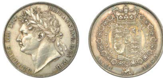
258 Halfcrown, 1823 (ESC 2365; S 3808). Scratch on neck and of bright appearance, otherwise extremely fine £200-£260