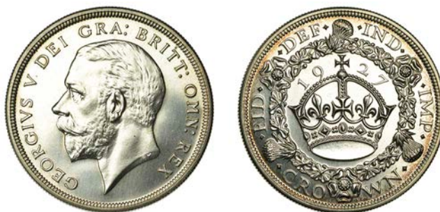
524 Proof Crown, 1927 (ESC 3631; S 4036). Obverse lightly brushed, otherwise about as struck