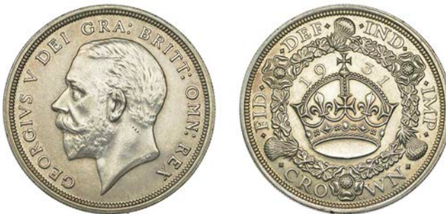
528 Crown, 1931 (ESC 3639; S 4036). Cleaned, otherwise about extremely fine