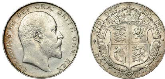
503 Halfcrown, 1905 (ESC 3571; S 3980). Good fine, of bright appearance, toned