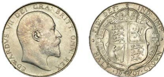
505 Halfcrown, 1907 (ESC 3573; S 3980). A few small rim nicks, otherwise extremely fine Provenance: Spink Auction 199, 25 June 2009, lot 302