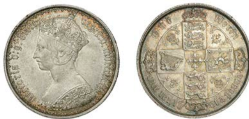
381 Florin, 1872, die 73 (ESC 2878; S 3893). Good extremely fine, grey tone £240-£300