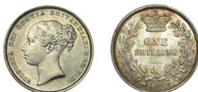
409 Shilling, 1852 (ESC 3001; S 3904). Extremely fine