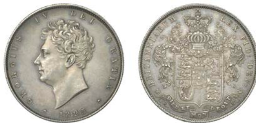
260 Halfcrown, 1825 (ESC 2371; S 3809). Extremely fine, reverse better, lightly toned Provenance: M. Watson Collection, DNW Auction 89, 29 September 2010, lot 1991