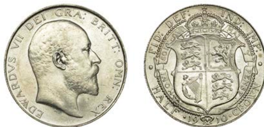
183 Halfcrown, 1910 (ESC 3576; S 3980). About as struck Provenance: DNW Auction 137, 21-3 September 2016, lot 1446