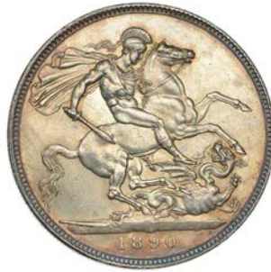
302 Crown, 1890 (ESC 2590; S 3921). Extremely fine, toned