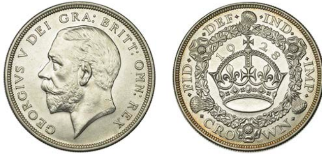
525 Crown, 1928 (ESC 3633; S 4036). A few small surface marks, otherwise good extremely fine