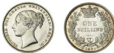
418 Shilling, 1864, die 70 (ESC 3024; S 3905). Extremely fine with proof-like surfaces