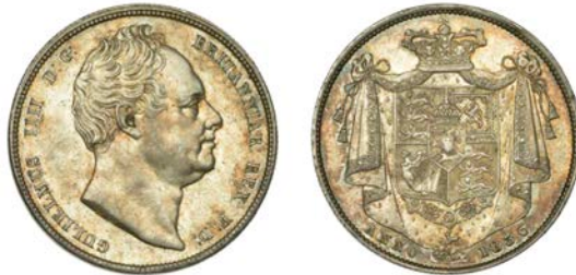
280 Halfcrown, 1836 (ESC 2482; S 3834). Good extremely fine, lightly toned Provenance: DNW Auction 93, 26 September 2011, lot 1720