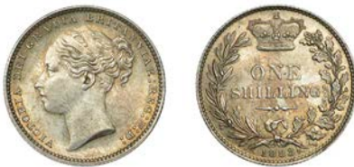
435 Shilling, 1883 (ESC 3072; S 3907). Extremely fine with some toning