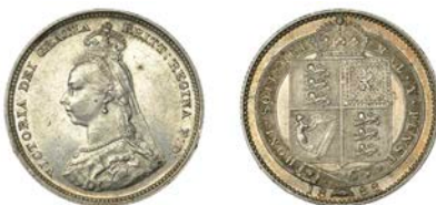
440 Shilling, 1888 (ESC 3139; S 3926). About extremely fine, rare