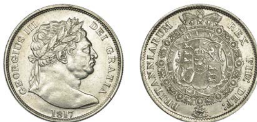
97 Halfcrown, 1817, large head (ESC 2090; S 3788). Lightly cleaned at some time, otherwise extremely fine £200-£260

Provenance: DNW Auction 97, 7 December 2011, lot 342