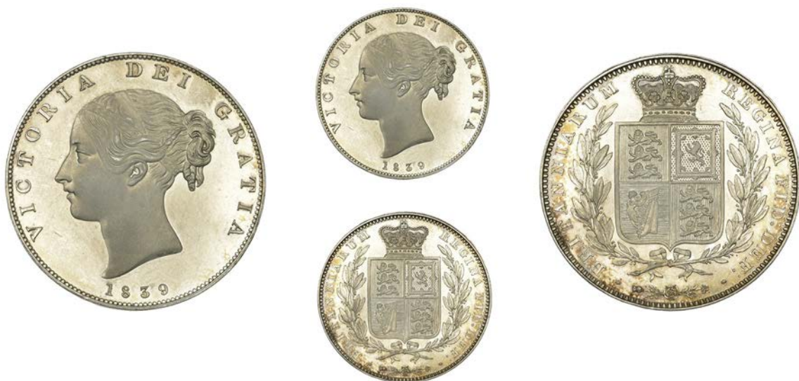
328 Proof Halfcrown, 1839, one plain and one ornate fillet, ww in relief, edge plain, 14.01g/6h (ESC 2708; S 3885). Fields hairlined, otherwise about as struck £3,000-£3,600