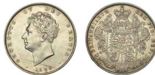
261 Halfcrown, 1826 (ESC 2375; S 3809). Minor stain on obverse, otherwise about as struck, lightly toned Provenance: St James's Auction 18, 27 September 2011, lot 206