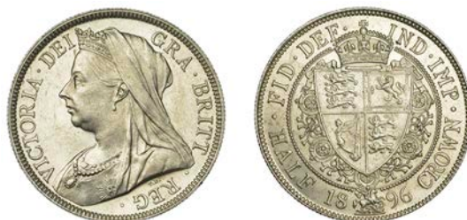
135 Halfcrown, 1896 (ESC 2782; S 3938). Good extremely fine