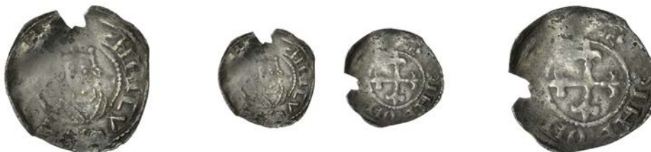
574 Penny, Full Face/Cross Fleury type [BMC XI], uncertain mint, Godwine?, [-]O?[-]PINE : ON : [—], 1.25g/3h (N 866; S 1271). Flan cut at 12 o'clock, area of weakness of legend, otherwise fine £200-£260