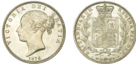
339 Halfcrown, 1874 (ESC 2471; S 3889). Of bright appearance, about as struck, some mint bloom