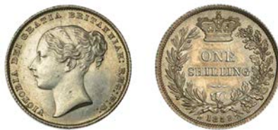
414 Shilling, 1859 (ESC 3015; S 3904). Extremely fine