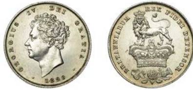
271 Shilling, 1829 (ESC 2413; S 3812). Lightly cleaned, otherwise about extremely fine Provenance: D. Wallis Collection, DNW Auction 83, 30 September 2009, lot 3161