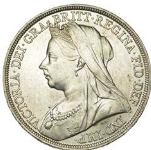
310 Crown, 1896, edge LX (ESC 2600; S 3937). Cleaned, otherwise about extremely fine £80-£100