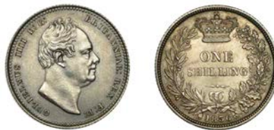
283 Shilling, 1836 (ESC 2494; S 3835). Obverse lightly cleaned, otherwise extremely fine