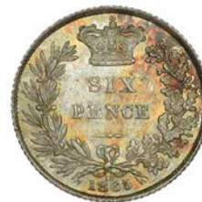
468 Sixpence, 1865, die 18 (ESC 3212; S 3909). Extremely fine, toned Provenance: S.A. Bole Collection, Part I, DNW Auction 89, 29 September 2010, lot 1789 (part)