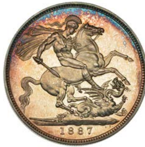
297 Proof Crown, 1887 (ESC 2586; S 3921). Fields lightly hairlined, otherwise practically mint state Provenance: D. Wallis Collection, DNW Auction 83, 30 September 2009, lot 3481