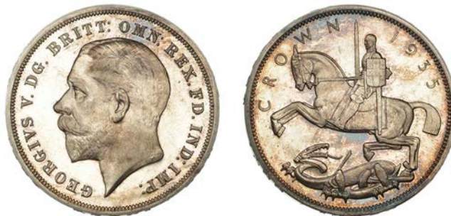
532 Proof Crown, 1935, edge raised xxv, 28.45g/12h (ESC 3655; S 4050). Minor hairlines in fields, otherwise about as struck, brilliant fields