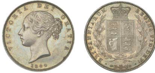
333 Halfcrown, 1844, 4s with serifs (ESC 2720; S 3888). Minor contact marks in fields, otherwise good extremely fine, proof-like fields, toned £400-£600