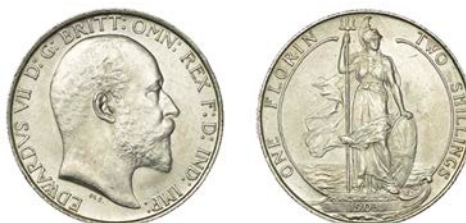
185 Florin, 1903 (ESC 3579; S 3981). About as struck Provenance: DNW Auction 141, 14-16 June 2017, lot 858