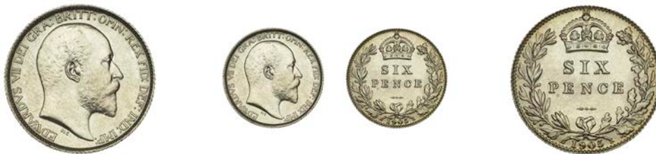
521 Sixpence, 1905 (ESC 3601; S 3983). About as struck