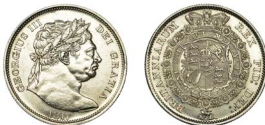
98 Halfcrown, 1817, large head (ESC 2090; S 3788). Cleaned, otherwise extremely fine £200-£260

Provenance: DNW Auction 107, 20 March 2013, lot 526