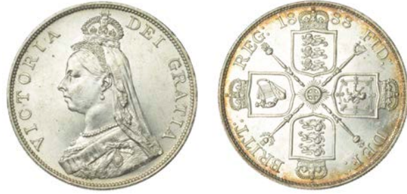
324 Double-Florin, 1888, 1 in VICTORIA missing lower left serif (ESC 2700; Davies 543, 2B; S 3923). A trifle bagmarked, otherwise about as struck £150-£180