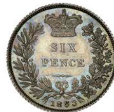
458 Proof Sixpence, 1853, edge grained, 2.83g/6h (ESC 3190; S 3908). About as struck, toned