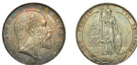
604 Florin, 1903 (ESC 3579; S 3981). A few surface marks, otherwise about mint state, attractive toning