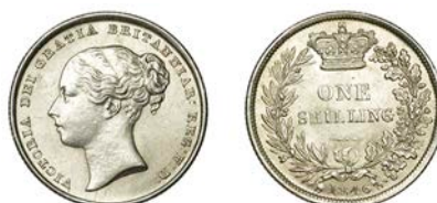
140 Shilling, 1846 (ESC 2992; S 3904). Extremely fine Provenance: Spink Auction 215, 4-5 December 2012, lot 357