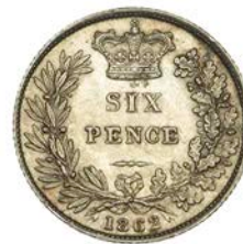
465 Sixpence, 1862 (ESC 3207; S 3908). Light scratch across obverse, otherwise about extremely fine, rare Provenance: D. Wallis Collection, DNW Auction 83, 30 September 2009, lot 3304 (part)