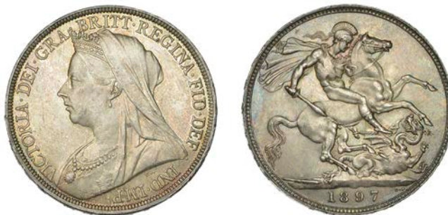
313 Crown, 1897, edge LXI (ESC 2603; S 3937). A few miniscule rim nicks, otherwise virtually as struck, toned £300-£400 Provenance: DNW Auction 97, 7 December 2011, lot 403