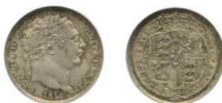
101 Sixpence, 1816 (ESC 2191; S 3791). Virtually mint state, attractively toned [slabbed NGC MS 65] £100-£150