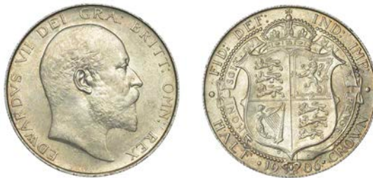
504 Halfcrown, 1906 (ESC 3572; S 3980). A few small rim nicks and light surface marks, otherwise good extremely fine