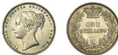
417 Shilling, 1863 (ESC 3022; S 3904). Lightly cleaned, otherwise about extremely fine, rare