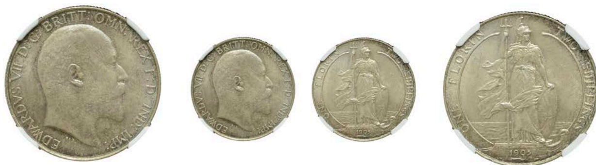
186 Florin, 1905 (ESC 3581; S 3981). About as struck, toned, rare [slabbed NGC MS 64]