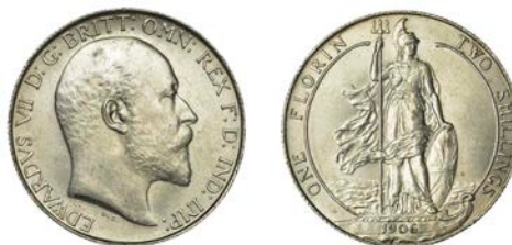
187 Florin, 1906 (ESC 3582; S 3981). Good extremely fine