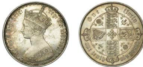
370 Florin, 1852 (ESC 2820; S 3891). Some light surface marks, otherwise extremely fine £200-£260