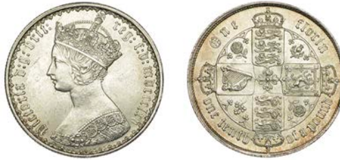
378 Florin, 1865, die 10 (ESC 2857; S 3892). Obverse lightly brushed, otherwise extremely fine, £150-£180