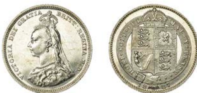
439 Proof Shilling, 1887 (ESC 3138; S 3926). Obverse brushed, otherwise extremely fine