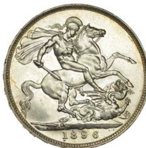
311 Crown, 1896, edge LX (ESC 2601; S 3937). Lightly bagmarked, otherwise virtually as struck £300-£400 Provenance: M. Watson Collection, DNW Auction 89, 29 September 2010, lot 2012