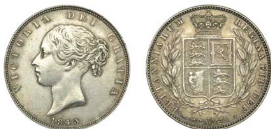
332 Halfcrown, 1843 (ESC 2718; S 3888). Sometime cleaned, now re-toning and with several minor obverse die breaks, otherwise good very fine or a little better £300-£400