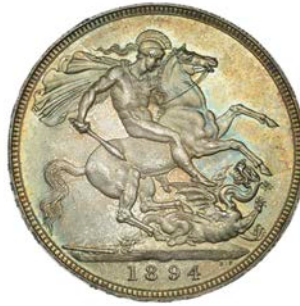
307 Crown, 1894, edge LVII (ESC 2596; S 3937). Some surface marks, otherwise better than extremely fine, toned £100-£150