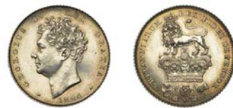
276 Proof Sixpence, 1826, type 3, 2.82g/6h (ESC 2435; S 3815). Lightly brushed, otherwise about as struck Provenance: D. Wallis Collection, DNW Auction 83, 30 September 2009, lot 3168