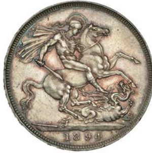
308 Crown, 1894, edge LVIII (ESC 2597; S 3937). Better than extremely fine, red tone around devices £150-£180 Provenance: DNW Auction 93, 26 September 2011, lot 1728