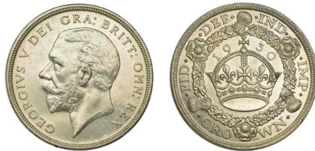
527 Crown, 1930 (ESC 3638; S 4036). A few minute edge nicks, otherwise extremely fine