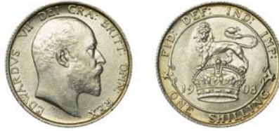
517 Shilling, 1908 (ESC 3594; S 3982). Extremely fine, scarce