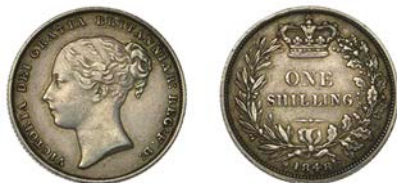
407 Shilling, 1848/6 (ESC 2994; S 3904). Very fine, rare