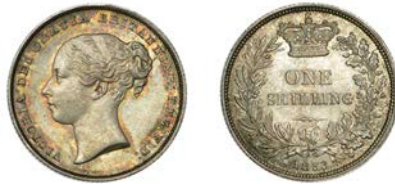
410 Shilling, 1853 (ESC 3002; S 3904). About extremely fine, toned