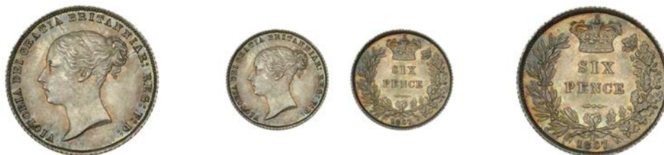
470 Sixpence, 1867, die 11 (ESC 3215; S 3910). Extremely fine, toned Provenance: S.A. Bole Collection, Part I, DNW Auction 89, 29 September 2010, lot 1793 (part)