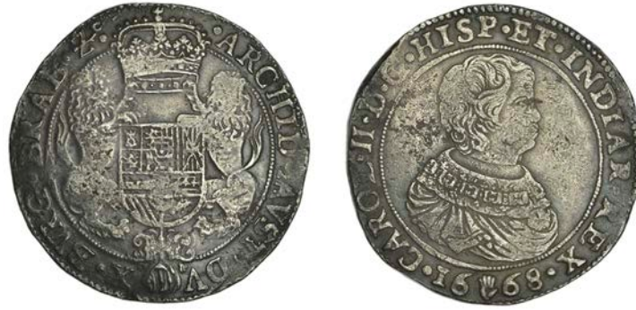
x 845 BRABANT, Charles II , Ducaton, 1668, Antwerp, 32.08g/5h (Delm. 325). Very fine