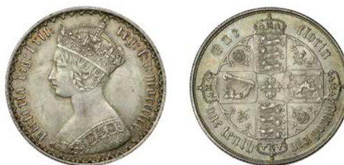
374 Florin, 1859 (ESC 2842; S 3891). Light surface marks, otherwise good very fine, reverse better, olive tone £150-£180