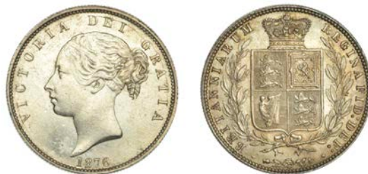
341 Halfcrown, 1876 (ESC 2748; S 3888). Obverse of bright appearance, otherwise extremely fine, reverse better £300-£400

Provenance: St James's Auction 18, 27 September 2011, lot 231