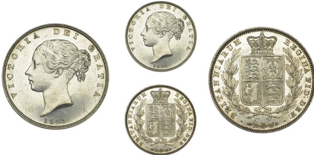
334 Halfcrown, 1845 (ESC 2722; S 3888). Minor surface marks, otherwise about as struck, with residual bloom £700-£900 Provenance: St James's Auction 18, 27 September 2011, lot 221