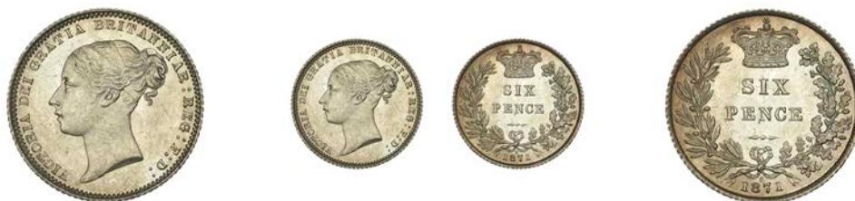
473 Sixpence, 1871, die 8 (ESC 3223; S 3910). Extremely fine Provenance: DNW Auction 79A, 30 September 2008, lot 4802 (part)