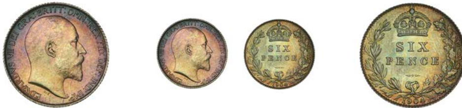
520 Sixpence, 1904 (ESC 3600; S 3983). Good extremely fine, attractively toned Provenance: DNW Auction 79A, 30 September 2008, lot 4836