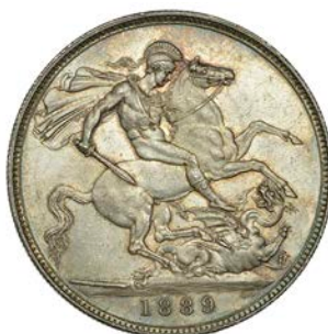
301 Crown, 1889 (ESC 2589; Davies 1C; S 3921). Better than extremely fine, toned Provenance: DNW Auction 93, 26 September 2011, lot 1725 (part)