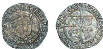
578 Third coinage, Groat, Tower, mm. lis, bust 1, annulets in forks, 2.39g/9h (N 1844; S 2369). Nearly very fine, toned £150-£200