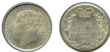
144 Shilling, 1885 (ESC 3076; S 3907). A few minor surface marks, otherwise good extremely fine [slabbed CGS 80] £100-£120