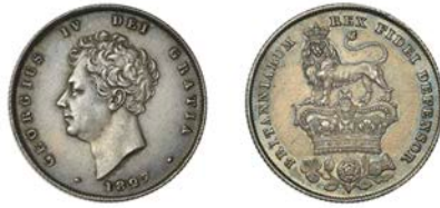
270 Shilling, 1827 (ESC 2412; S 3812). Cleaned, otherwise about extremely fine, rare