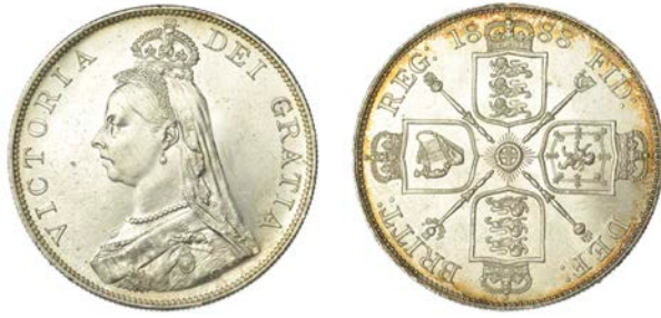
323 Double-Florin, 1888 (ESC 2699; Davies 542, 2B; S 3923). A trifle bagmarked, otherwise about as struck £150-£180