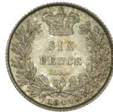
453 Sixpence, 1844, small 44 in date (ESC 3178 var.; S 3908). Extremely fine