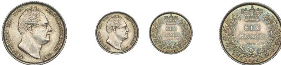
288 Sixpence, 1837 (ESC 2512; S 3836). Extremely fine, toned