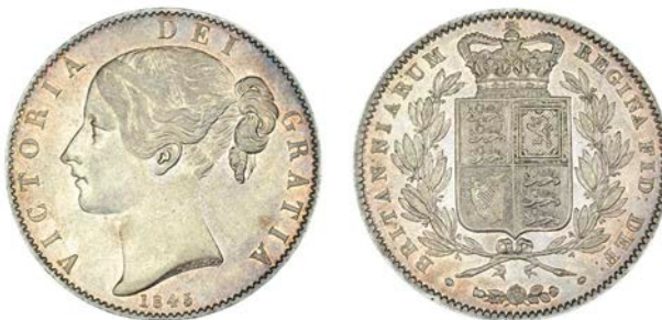
599 Crown, 1845, edge VIII, cinquefoil stops (ESC 2564; S 3882). Some surface marks, otherwise almost extremely fine, toned