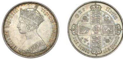
377 Florin, 1864, die 48 (ESC 2854; S 3892). Light surface marks, otherwise nearly extremely fine, reverse better £150-£180