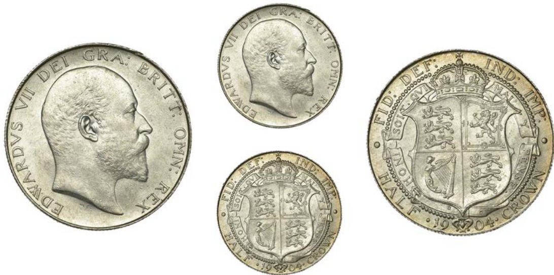
502 Halfcrown, 1904 (ESC 3570; S 3980). A trifle bagmarked, otherwise good extremely fine, residual bloom £800-£1,000