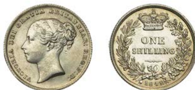
405 Shilling, 1842 (ESC 2987; S 3904). Small dig behind head, otherwise extremely fine