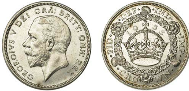
530 Crown, 1933 (ESC 3644 [373]; S 4036). Sometime cleaned, otherwise about extremely fine