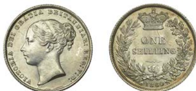
415 Shilling, 1860 (ESC 3018; S 3904). Extremely fine