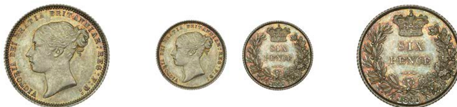
471 Sixpence, 1869, die 8 (ESC 3219; S 3910). Extremely fine, toned Provenance: S.A. Bole Collection, Part I, DNW Auction 89, 29 September 2010, lot 1798 (part)