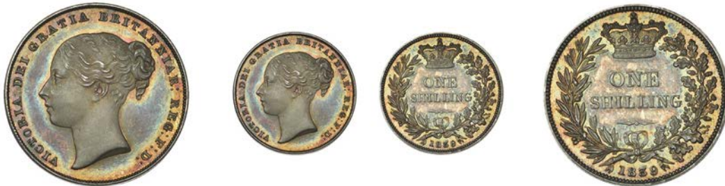
403 Proof Shilling, 1839, edge plain, 5.52g/12h (ESC 2981; S 3904). About as struck and toned, scarce