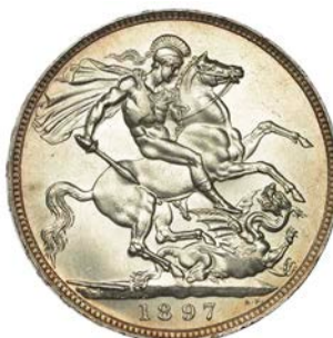
312 Crown, 1897, edge LX (ESC 2602; S 3937). Virtually as struck, reflective fields £300-£400