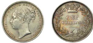
430 Shilling, 1878, die 68 (ESC 3051; S 3907A). Extremely fine with some toning