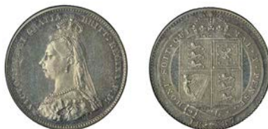
145 Proof Shilling, 1887 (ESC 1352; S 3926). Light hairlines, otherwise good extremely fine, toned [slabbed PCGS PR 64] £200-£300