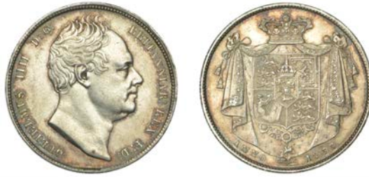
279 Halfcrown, 1835 (ESC 2481; S 3834). About extremely fine