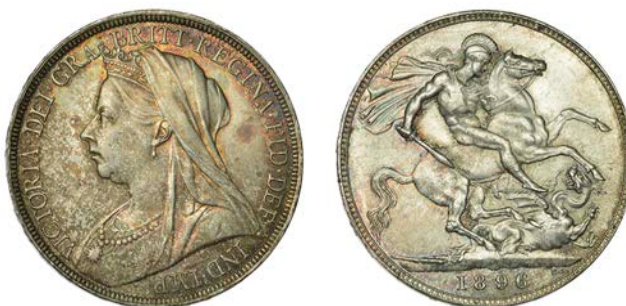
600 Crown, 1896, edge LX (ESC 2601; S 3937). Good extremely fine, attractively toned