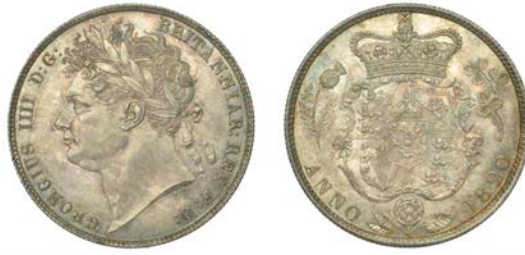
256 Halfcrown, 1820 (ESC 2357; S 3807). About as struck, lightly toned Provenance: DNW Auction 93, 26 September 2011, lot 1713