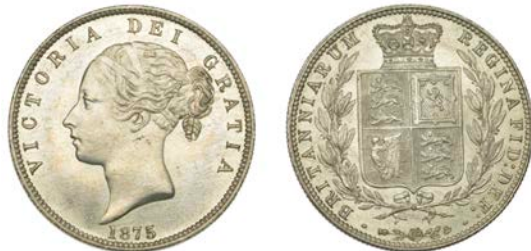
340 Halfcrown, 1875 (ESC 1745; S 3888). Obverse lightly brushed, otherwise about as struck with some residual bloom