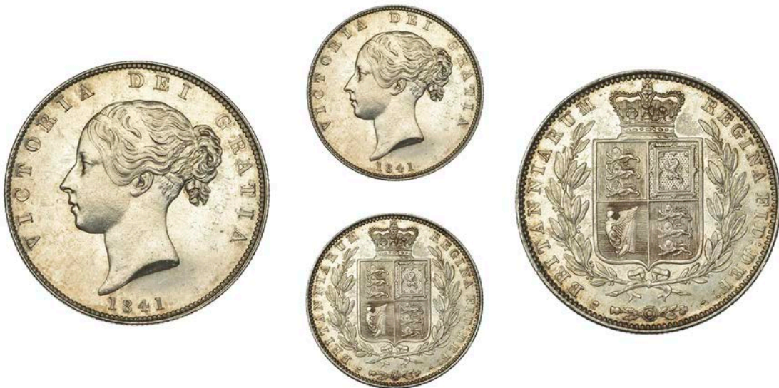
330 Halfcrown, 1841 (ESC 2716; S 3888). Of bright appearance, good extremely fine, extremely rare £3,000-£4,000