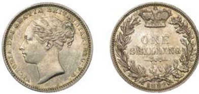
434 Shilling, 1882 (ESC 3071; S 3907). Extremely fine