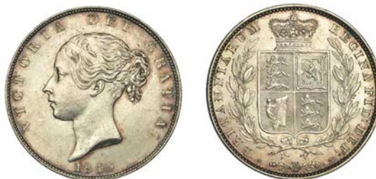
335 Halfcrown, 1846 (ESC 2724; S 3888). Good extremely fine, lightly toned £700-£900 Provenance: St James's Auction 18, 27 September 2011, lot 222