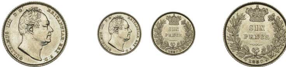
289 Sixpence, 1837, B of BRITANNIAR over R (ESC –; S 3836). Extremely fine, very rare