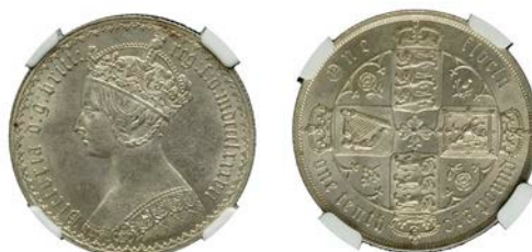
137 Florin, 1887, 46 arcs (ESC 2913; S 3901). Some surface marks, otherwise good extremely fine [slabbed NGC MS 62]