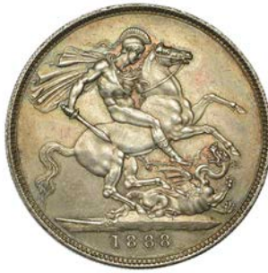
299 Crown, 1888, wide date (ESC 2588; S 3921). Small obverse rim nick at 3 o'clock, otherwise nearly extremely fine, attractively toned, scarce £150-£180