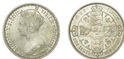
384 Florin, 1876, die 23 (ESC 2884; S 3893). A little scuffed, otherwise extremely fine and toned, scarce £200-£260 Provenance: D. Wallis Collection, DNW Auction 83, 30 September 2009, lot 3465