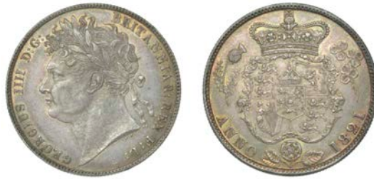
257 Halfcrown, 1821 (ESC 2360; S 3807). Extremely fine or better, toned Provenance: K.J.J. Elks Collection, DNW Auction 81, 30 April 2009, lot 73