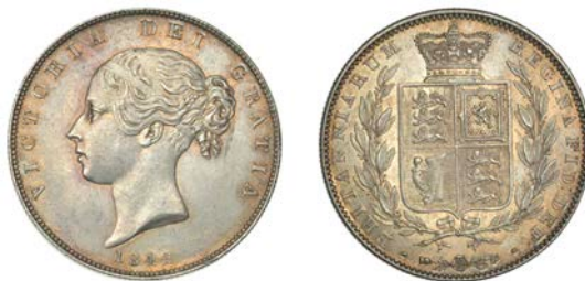
331 Halfcrown, 1842 (ESC 2717; S 3888). Good extremely fine, toned £500-£700