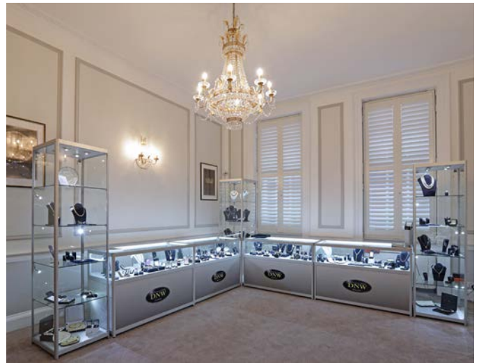
Jewellery viewing room

We hold over 20 auctions each year, the full contents of which are published on the internet around one month before the sale date, together with a unique preview facility which is available as lots are catalogued and photographed. Printed auction catalogues are published three weeks prior to each sale.