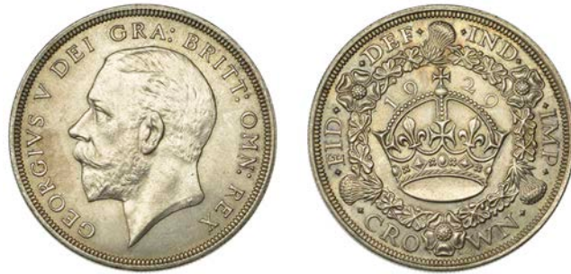
526 Crown, 1929 (ESC 3636; S 4036). Light surface marks, otherwise about extremely fine, toned