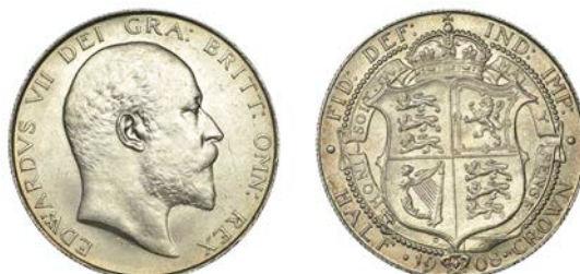
506 Halfcrown, 1908 (ESC 3574; S 3980). About as struck, lightly bagmarked Provenance: St James's Auction 18, 27 September 2011, lot 252