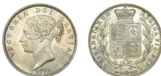
343 Halfcrown, 1878 (ESC 2751; S 3889). Light surface marks on obverse, otherwise good extremely fine

Provenance: St James's Auction 18, 27 September 2011, lot 233