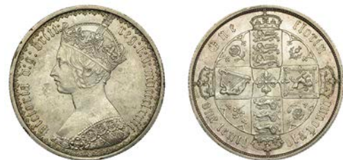
382 Florin, 1873, die 186 (ESC 2879; S 3893). Slight surface marks, otherwise better than extremely fine £150-£200