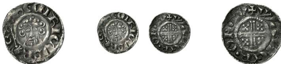
577 Penny, class Vc, London, Walter, WALTER · ON · LV, 1.27g/2h (SCBI Mass 1698ff; N 971; S 1352). Very fine, dark tone £80-£100