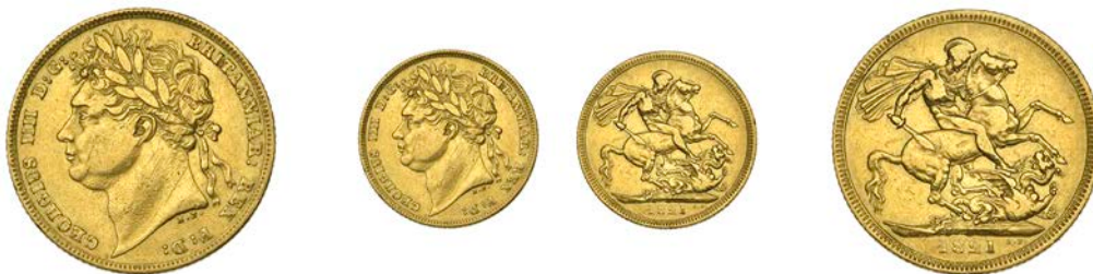
G 598 Sovereign, 1821 (M 5; S 3800). Very fine