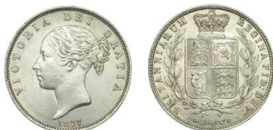
342 Halfcrown, 1877 (ESC 2750; S 3888). About as struck, residual bloom