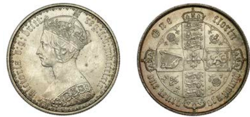
380 Florin, 1869, die 17 (ESC 2867; S 3893). Small spot in obverse field, otherwise extremely fine £150-£200