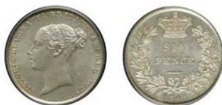
150 Sixpence, 1841 (ESC 3174; S 3908). About as struck, rare [slabbed PCGS MS 65] £200-£260