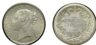
141 Shilling, 1858 (ESC 3011 [1306]; S 3904). About as struck [slabbed PCGS MS 64]