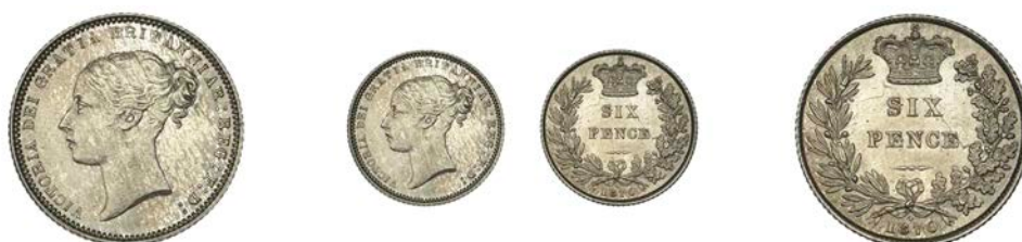
472 Sixpence, 1870, die 4 (ESC 3221; S 3910). Extremely fine Provenance: D. Wallis Collection, DNW Auction 83, 30 September 2009, lot 3309