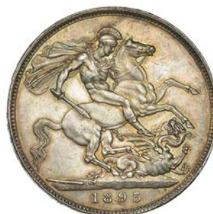
306 Crown, 1893, edge LVII (ESC 2595; S 3937). Better than extremely fine, attractively toned Provenance: DNW Auction 93, 26 September 2011, lot 1726