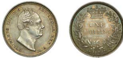
281 Shilling, 1834 (ESC 2489; S 3835). About extremely fine, toned