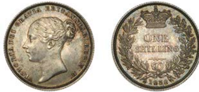
401 Shilling, 1838 (ESC 2973; S 3902). About extremely fine, toned