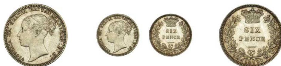
480 Sixpence, 1879, no die number (ESC 3244; S 3911). Good extremely fine