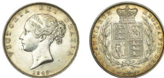
336 Halfcrown, 1849, large date (ESC 2730; S 3888). Light contact marks and of bright appearance, otherwise nearly extremely fine, residual bloom £300-£400