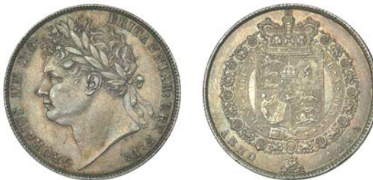
259 Halfcrown, 1824 (ESC 2367; S 3808). Extremely fine, toned