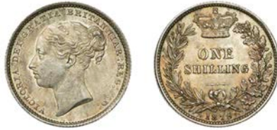
431 Shilling, 1879 (ESC 3061; S 3907). Extremely fine