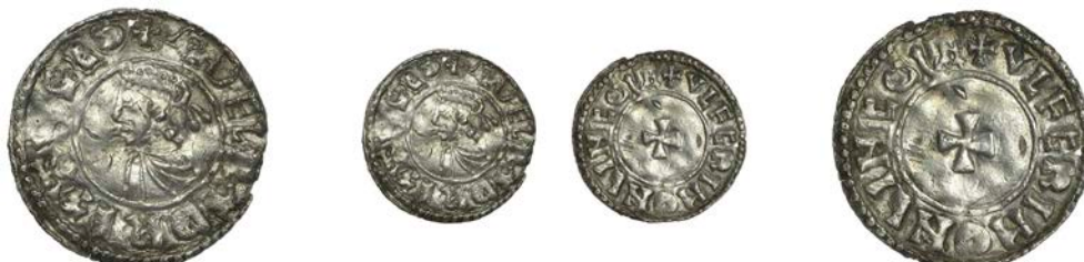
573 Penny, Last Small Cross type, Lincoln, Wulfgrim, VLFRIM ON LINCOL, 1.54g/9h (Mossop pl. xxx, 23, same rev. die; SCBI Lincoln 317, same rev. die; BEH 1963; N 777; S 1154). Small flan crack at 12 o'clock, otherwise very fine £150-£180