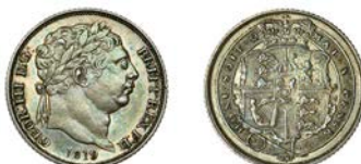
102 Sixpence, 1819, first 1 of date without lower serif (ESC –; S 3791). Extremely fine and very rare £120-£150

Provenance: DNW Auction 141, 14-16 June 2017, lot 749