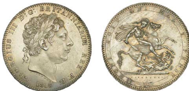
96 Crown, 1818, edge LIX (ESC 2009; S 3787). A couple of tiny surface marks, otherwise good extremely fine with reflective fields £500-£700

Provenance: DNW Auction 97, 7 December 2011, lot 342