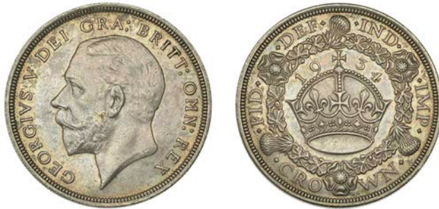
531 Crown, 1934 (ESC 3647; S 4036). Some light surface marks, otherwise about extremely fine, toned