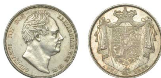
278 Halfcrown, 1834, w.w. in script (ESC 2478; S 3834A). Light surface marks, otherwise about extremely fine