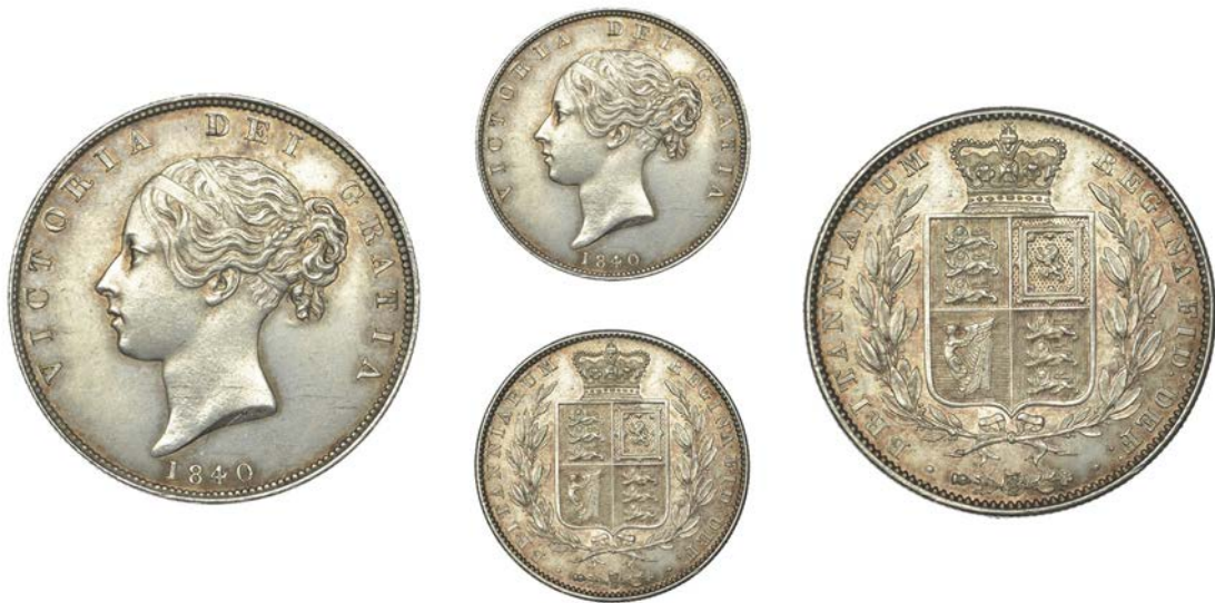
329 Halfcrown, 1840 (ESC 2715; S 3887). Obverse lightly brushed, otherwise good extremely fine, toned £1,000-£1,200 Provenance: St James's Auction 10, 6-7 November 2008, lot 936