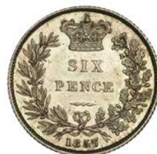
460 Sixpence, 1857 (ESC 3198; S 3908). Extremely fine with proof-like surfaces Provenance: DNW Auction 104, 5 December 2012, lot 601 (part)