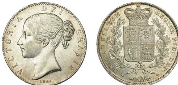
291 Crown, 1844, edge viii , star stops (ESC 2561; S 3882). Obverse fields hairlined, otherwise about extremely fine, reverse with residual bloom