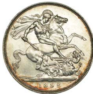
304 Crown, 1892 (ESC 2592; S 3921). Fields lightly marked, otherwise extremely fine