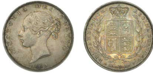
338 Halfcrown, 1850 (ESC 2733; S 3887). Nearly extremely fine, iridescent tone