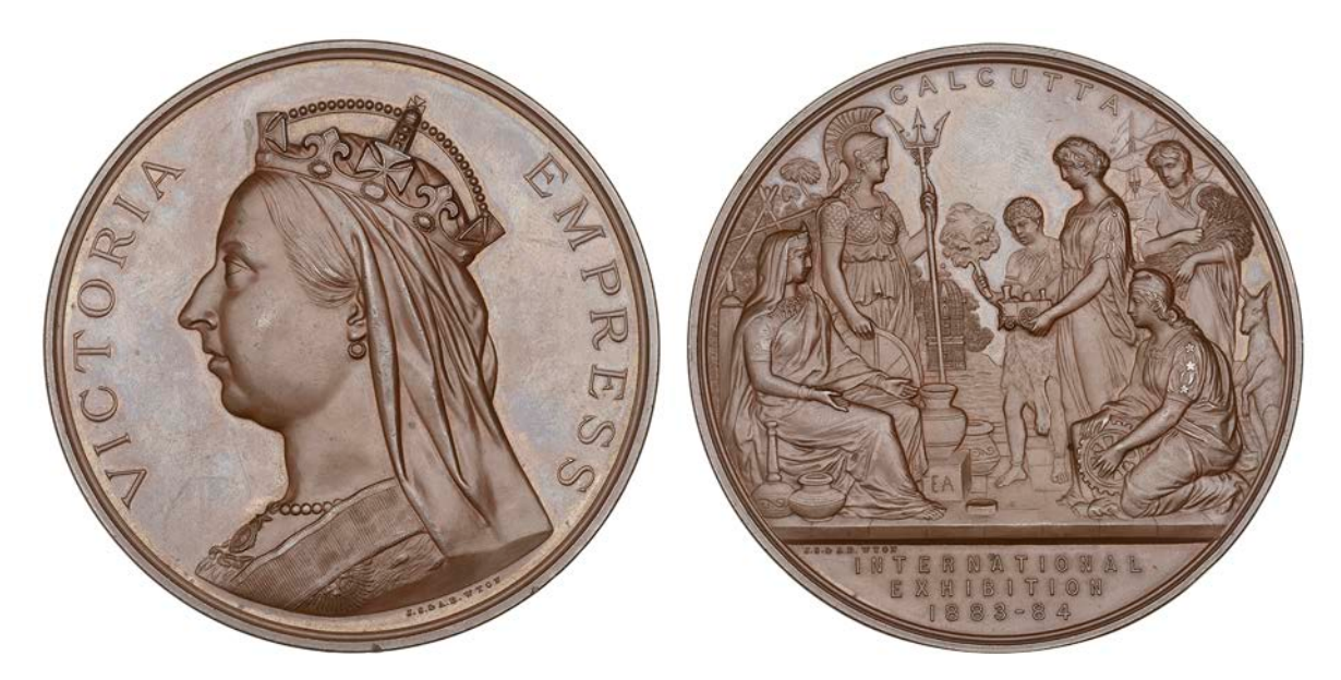
466 INDIA , International Exhibition , Calcutta , 1883-84, a copper medal by J.S. & A.B. Wyon, crowned and veiled bust of Victoria left, rev. India seated and Britannia standing, receiving symbolic offerings from four figures representing parts of the Empire, 76mm (Pudd. 883.2.1). Extremely fine £200-£260

467 LORRAINE , René II (1473-1508), a uniface impression in horn of the obv. of the medal by F. de Saint-Urbain, 59mm ( cf. BDM V, 310). Very fine