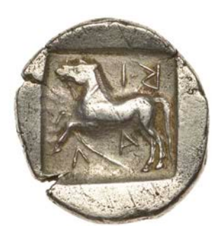
620 THESSALY , Larissa , Drachm, 460-450, Thessalos holding band across horns of bull, petasos flying behind, rev. AA PI, bridled horse bounding right, 5.61g (BCD Thessaly 355.2, same dies; McClean 4587, same dies; Lorber Thessalian pl. 41, 9, same obv. die; BMC 6). Light porosity, very fine £200-£260

Provenance: Gerhard Hirsch Auktion 223 (Munich), 26 September 2002, lot 1582