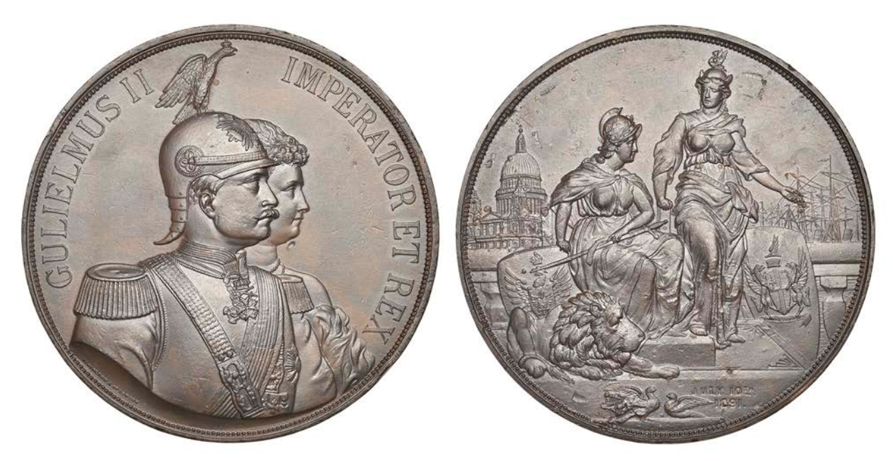
417 Visit of Emperor Wilhelm II to the City of London , 1891, a bronze medal by Elkington & Co. for the Corporation of the City of London, conjoined busts of the Emperor and Empress right, rev. Germania seated to left, Britannia standing to right, each flanked by shield of arms, 80mm (BHM 3412; E 1768). Cleaned, some minor marks, otherwise extremely fine £100-£120