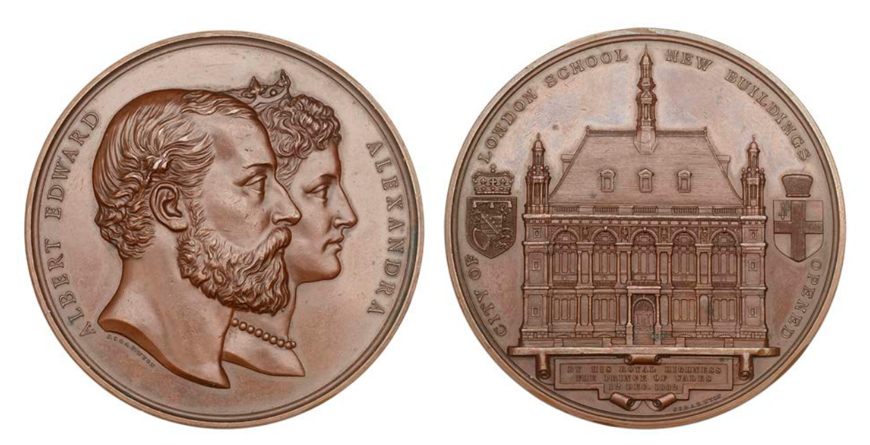
410 New Buildings at the City of London School Opened, 1882, a bronze medal by J.S. & A.B. Wyon for the Corporation of the City of London, conjoined busts of the Prince and Princess of Wales right, rev. frontal elevation of the School, 77mm (W & E 1461A.1; BHM 3133; E 1690). Extremely fine