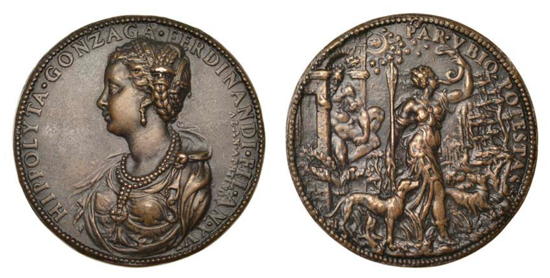
468 MANTUA , Ippolita Gonzaga , 1551, a cast bronze medal by L. Leoni, draped bust left, rev. Ippolita as Diana, walking right, 66mm (Pollard 494; Kress 432). A later aftercast, possibly 19th century, good very fine £100-£120

467 LORRAINE , René II (1473-1508), a uniface impression in horn of the obv. of the medal by F. de Saint-Urbain, 59mm ( cf. BDM V, 310). Very fine