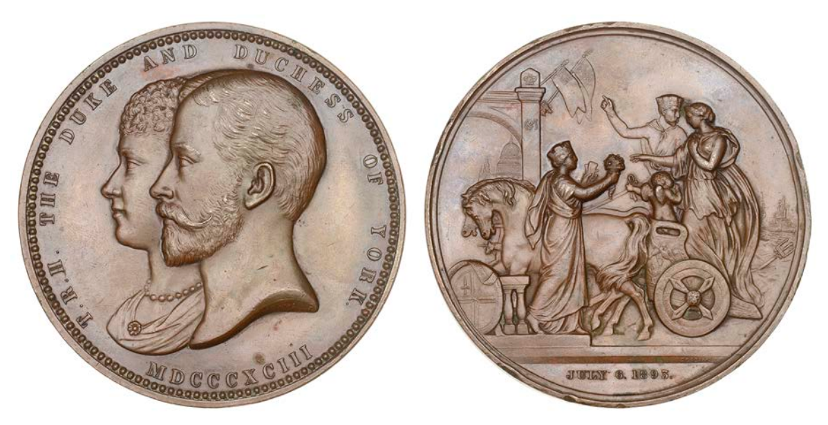
418 Visit of the Duke and Duchess of York to the City of London , 1893, a bronze medal by G.G. Adams for the Corporation of the City of London, conjoined busts left, rev. Duke and Duchess in biga driven by Cupid, being presented with a cornucopia by Londinia, 76mm (W & E 1763; BHM 3452; E 1780). Lightly cleaned, some edge knocks, good very fine £100-£120