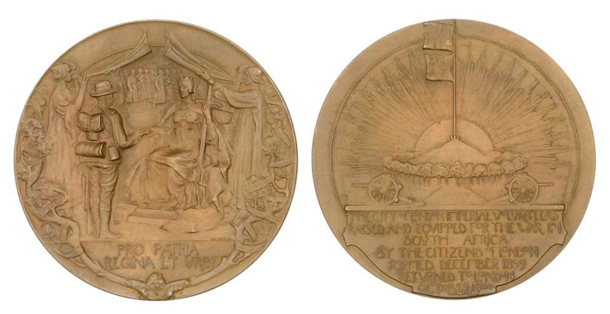
427 City of London Imperial Volunteers , 1900, a bronze medal by Sir George Frampton for the Corporation of the City of London, Volunteer standing before seated Londinia, rev. flagpole on mound surrounded by ring of trees, radiant sun behind, 76mm (BHM 3684; E 1848). About extremely fine; in case of issue [this damaged and repaired] £150-£180