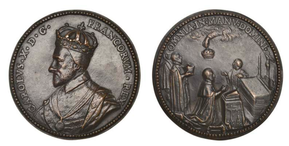
450 FRANCE , Charles X , a cast bronze medal, undated, unsigned, crowned and draped bust left, rev. coronation scene, 60mm. Possibly a slightly later cast, about extremely fine £200-£260