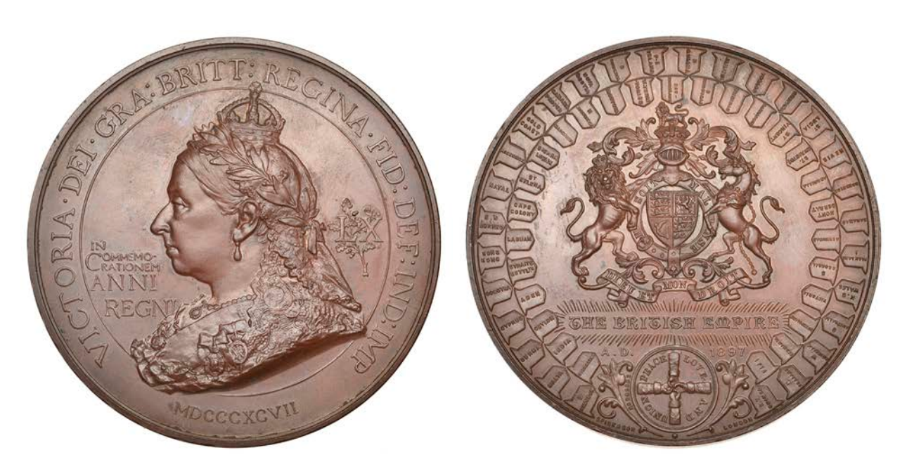
425 Victoria , Diamond Jubilee , 1897, a copper medal by F. Bowcher for Spink, similar, 76mm (W & E 3475A.4; BHM 3511; E 1816). Extremely fine; in contemporary round case by A.B. Savory & Sons, Cornhill, London