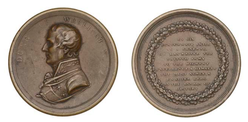
327 British Victories, 1815, a copper box medal, unsigned, uniformed bust of the Duke of Wellington left, rev. legend within wreath, containing 14 paper roundels bearing the names and dates of the battles, 47mm (Eimer 82; BHM 885; E 1075a) [Lot]. Very fine

328 British Victories, 1815, a tubular brass box medal by E. Thomason, lid inset with portrait medalet of Wellington, containing 4 [of 26] brass medalets, each with winged Victory, revs. the battles named, each 16mm, tube 38 x 19mm (Eimer 84; BHM 888; E 1076) [Lot]. Tube very fine, medalets extremely fine