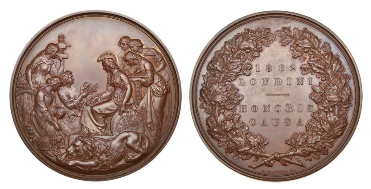
397 International Exhibition, South Kensington, 1862, Prize Medal, a copper award by L.C. Wyon [after D. Maclise], similar, edge named (W.A. Rose, Class IV), 77mm (Allen SK-A001; BHM 2747; E 1553). Good extremely fine; in contemporary fitted case £200-£260

W.A. Rose, City of London; awarded for Oils