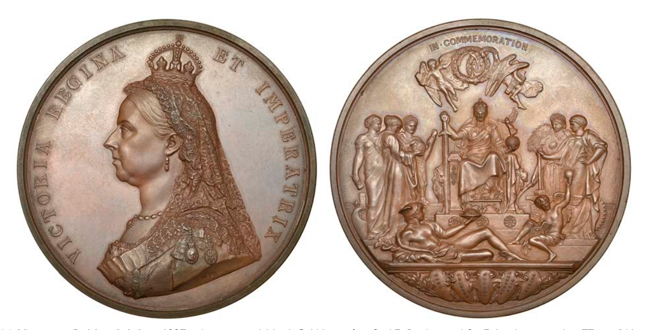
414 Victoria , Golden Jubilee , 1887, a bronze medal by L.C. Wyon after Sir J.E. Boehm and Sir F. Leighton, similar, 77mm (W & E 2000A.1; BHM 3219; E 1733b). Extremely fine; in case of issue