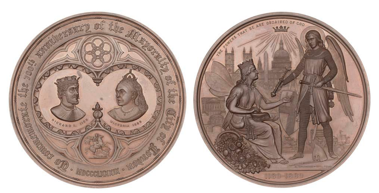
416 700th Anniversary of the Mayoralty of the City of London , 1889, a bronze medal by A. Kirkwood & Sons for the Corporation of the City of London, busts of Richard I and Victoria vis-à-vis in cartouche, rev. St Michael presenting sceptre to kneeling figure of Londinium, St Paul's behind, 77mm (BHM 3377; E 1752). Virtually as struck; in fitted case of issue £500-£700