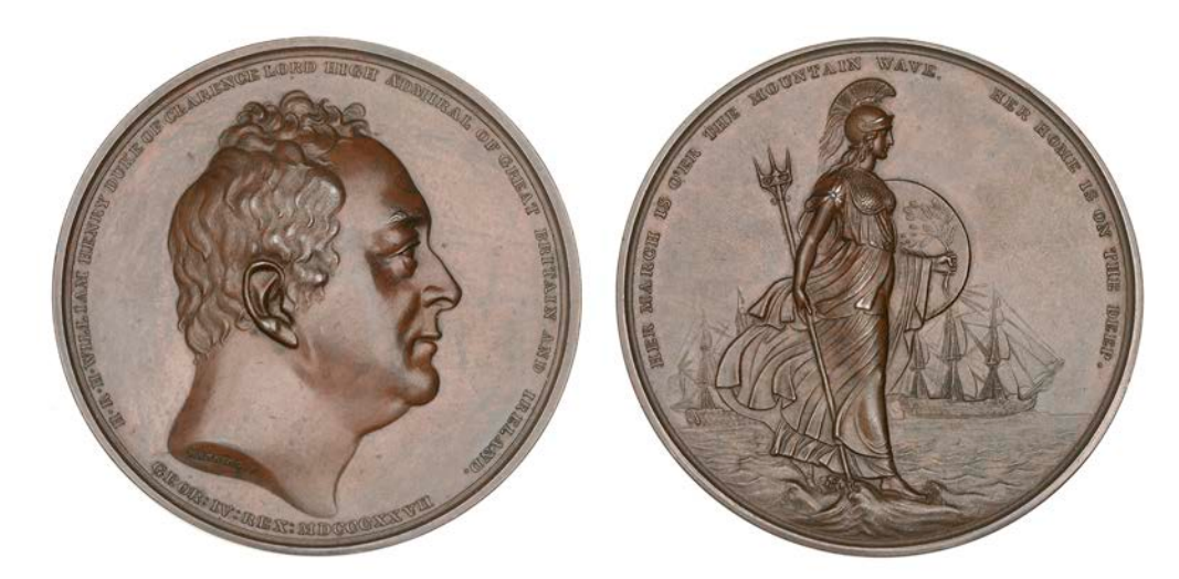
375 Duke of Clarence Appointed Lord High Admiral, 1827, a copper medal by J. Henning, bare head right, rev. Britannia walking right on waves, holding trident and shield, ships in background, 65mm (BHM 1296; E 1192). Lightly cleaned, otherwise extremely fine