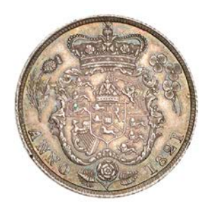
214 Shilling, 1821 (ESC 2396; S 3810). Toned, extremely fine