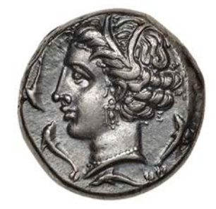
614 SICILY, Lilybaion (as Cape of Melkart [Rash Melqart]), Tetradrachm, c. 330-305, charioteer, holding goad in right hand and reins in left, driving galloping quadriga right, crowned by Nike flying left, rev. head of Tanit left, wearing crown of grain leaves, pearl necklace and triple-pendant ear-ring, two dolphins in front, one below and behind, 1.99g (Jenkins O23/R49 [this combination unlisted]; BMC 8 and de Luynes 918, same obv. die). Good very fine, dark patina £900-£1,200