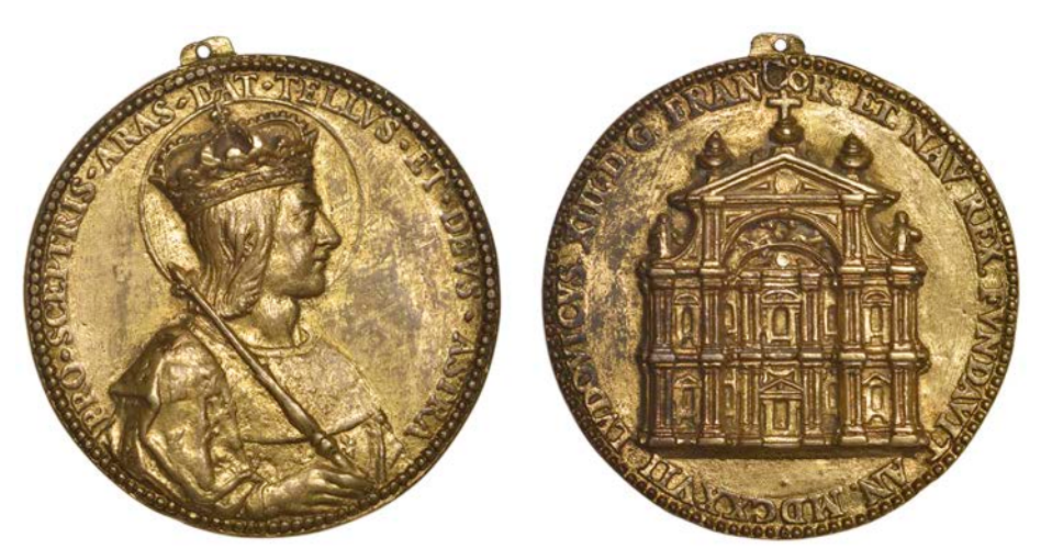
452 FRANCE , Laying of the Foundation Stone of the Church of St Louis, 1627, a cast gilt-bronze medal, unsigned, crowned bust of St Louis right, rev. façade of the church, 57mm (Jones 342). Plugged at top, gilding worn in places, otherwise very fine; with small loop for suspension £200-£260

453 FRANCE , Entry of the Legate into Paris, 1660, a brass medalet, unsigned, 25mm; Count of Anglès, 1818, a copper medal by A. Galle, 41mm; Birth of the Duke of Bordeaux, 1820, a copper medal by J.-P. Montagny, 52mm (BDM IV, 128); Felix de Beaujour, 1827, a bronze medal by J.-J. Barre, 46mm (BDM I, 130); Charles X, a uniface brass cliche, unsigned and undated, 45mm; School of Design, a bronze prize medal by A. Caqué, rev. named (Ch. Barnier, 1847), 41mm; Unveiling of the Statue of Marshal Drouet at Reims, 1849, a copper medal by A. Garnier, 50mm (BDM VII, 340); Universal Exposition, Paris, 1855, a white metal medal by A. Caqué, 50mm; together with a Monneron token and modern copies of medals by Brenet and Jaley [10]. Varied state; one cased