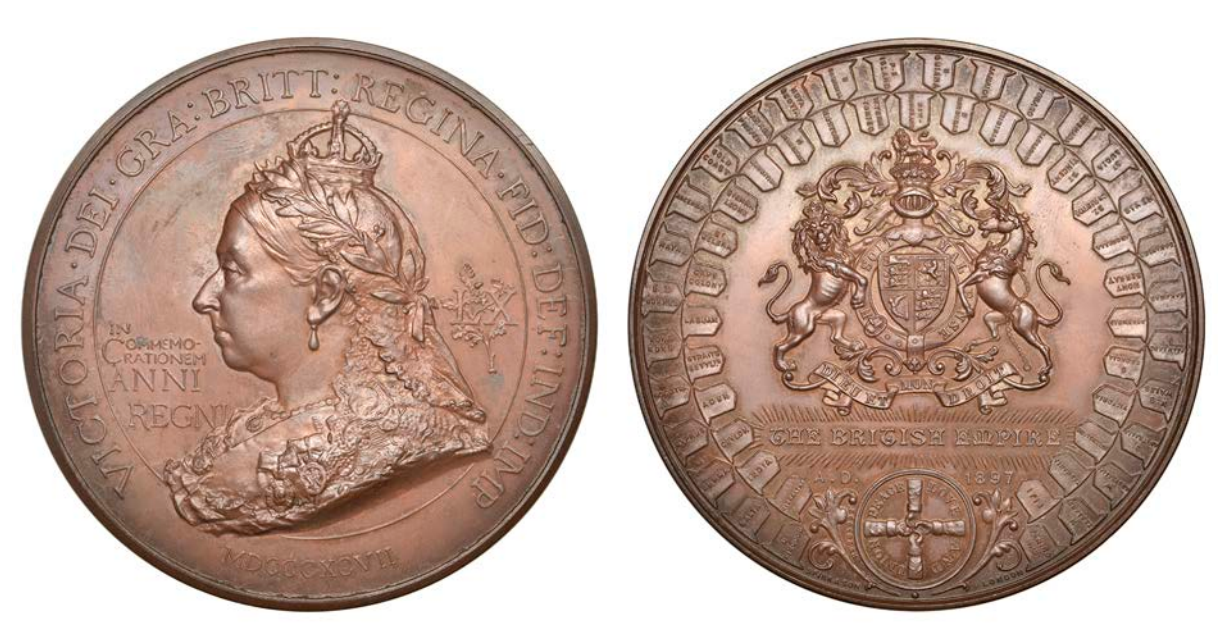
424 Victoria , Diamond Jubilee , 1897, a copper medal by F. Bowcher for Spink, crowned bust left, rev. royal arms with supporters, names of British territories on small shields around, 76mm (W & E 3475A.4; BHM 3511; E 1816). Extremely fine; in red card box of issue

423 Victoria , Diamond Jubilee , 1897, a large silver medal by G.W. de Saulles, similar, 56mm, 83.56g (W & E 3000A.4; BHM 3506; E 1817a). Edge knock, otherwise about extremely fine; in case of issue [this slightly damaged]