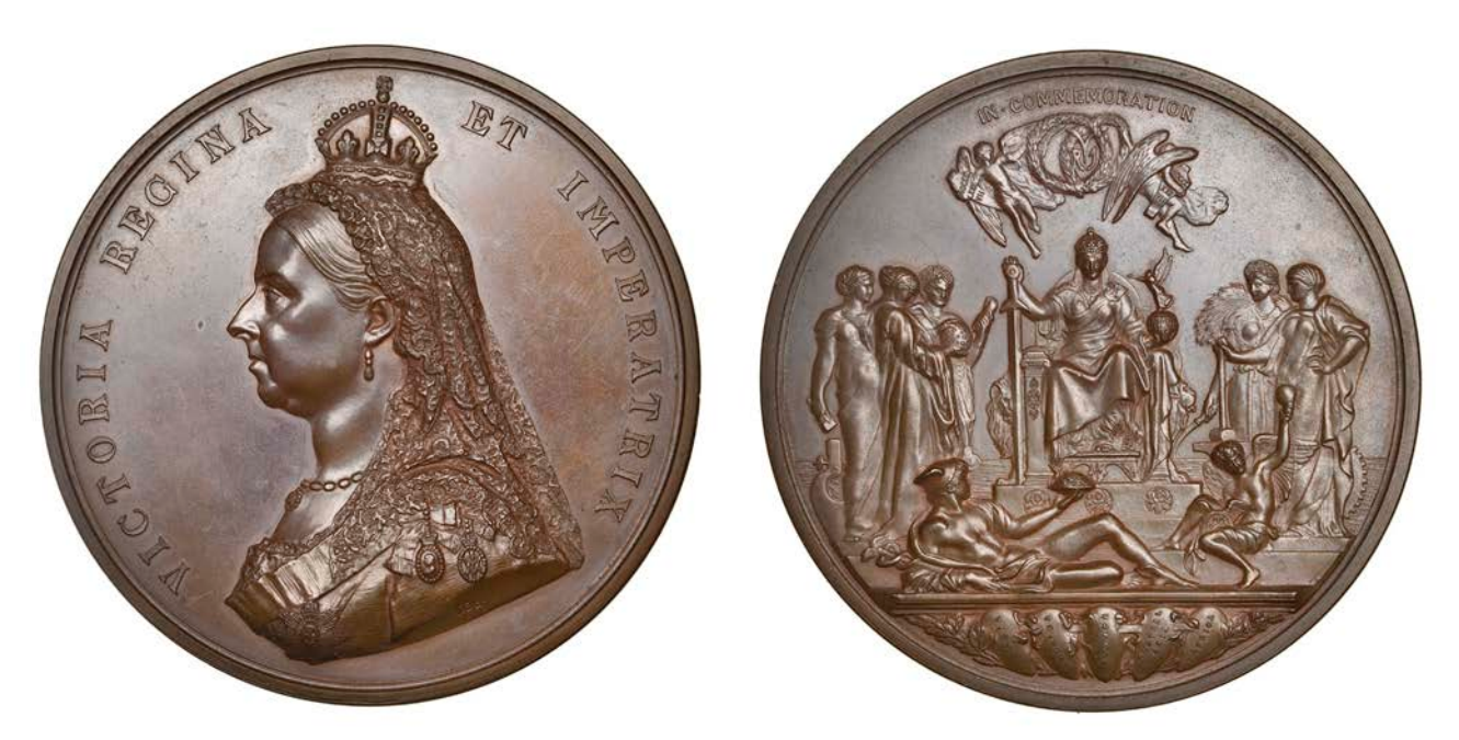
415 Victoria , Golden Jubilee , 1887, a bronze medal by L.C. Wyon after Sir J.E. Boehm and Sir F. Leighton, similar, 77mm (W & E 2000A.1; BHM 3219; E 1733b). Nearly extremely fine; in case of issue £180-£220