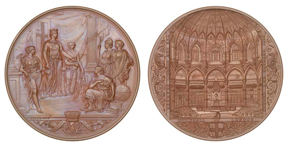
411 Opening of the New Council Chamber at the Guildhall , 1884, a bronze medal by J.S. & A.B. Wyon for the Corporation of the City of London, interior of the Chamber, rev. Londinia, attended by Commerce and Magistracy, addressing her council, 77mm (BHM 3177; Taylor 206a; E 1705). Toned, about as struck; in fitted case of issue