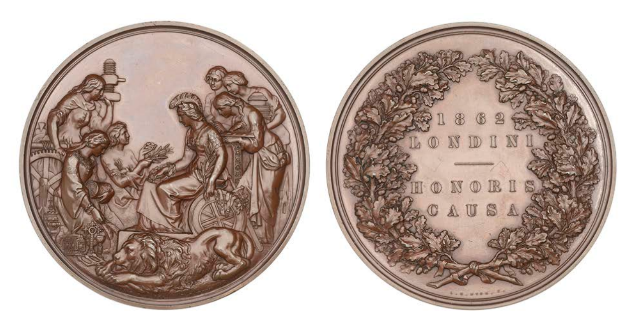
398 International Exhibition, South Kensington , 1862, Prize Medal, a copper award by L.C. Wyon [after D. Maclise], similar, edge named (Christy & Co., Class XX), 77mm (Allen SK-A001; BHM 2747; E 1553). Lightly cleaned, otherwise extremely fine; in contemporary fitted case

W.A. Rose, City of London; awarded for Oils