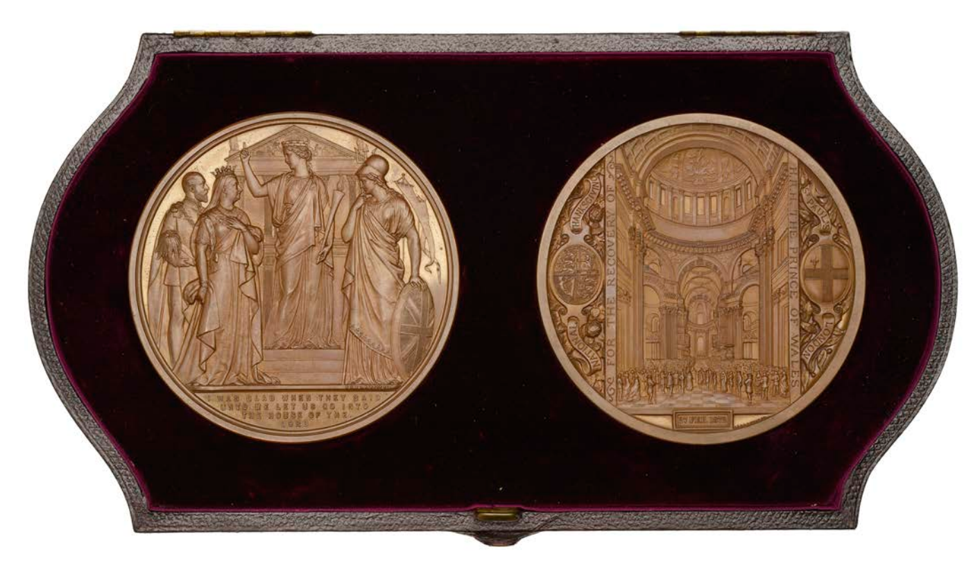
407 National Thanksgiving for the Prince of Wales , 1872, a pair of bronze medals by J.S. & A.B. Wyon for the Corporation of the City of London, Londinia inviting Queen Victoria and the Prince of Wales to enter St Paul's Cathedral, rev. interior of the Cathedral, 77mm (W & E 1160A.1; BHM 2928; Taylor 39k; E 1618) [2]. About as struck; in fitted case of issue £1,000-£1,200