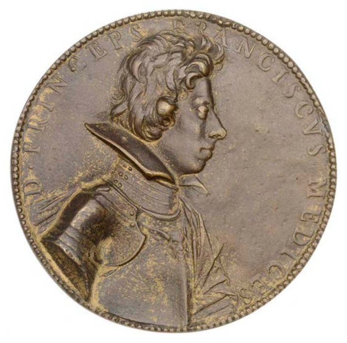
481 TUSCANY , Francesco de Medici , 1613, a uniface cast bronze medal by G. Dupré, armoured bust right, 89mm (Jones 43). A later cast, about very fine £100-£120