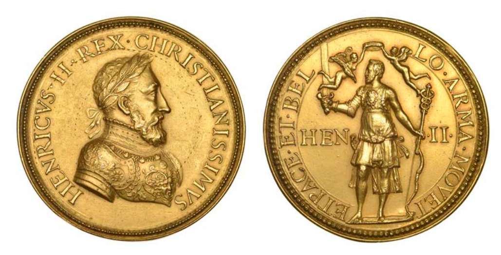
449 FRANCE , Henry II , a cast gilt-bronze medal, undated, unsigned [by E. Delaune?], armoured and laureate bust right, rev. king standing facing, holding sword and caduceus, 61mm. A later cast, some surface marks, otherwise about extremely fine £100-£120