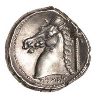
613 SICILY, Carthaginians at Entella, Tetradrachm, uncertain mint in Sicily, c. 300-290, head of Melkart right, wearing lion's skin headdress, rev. horse's head left, 'MHMHNT' in Punic characters below neck truncation; behind, palm tree with cluster of dates, 17.00g (Jenkins O125/R338 [the combination unlisted]; Leu Auction 3, lot 26, same rev. die). Overstruck, traces of undertype visible on obverse, otherwise about extremely fine, struck from artistic dies