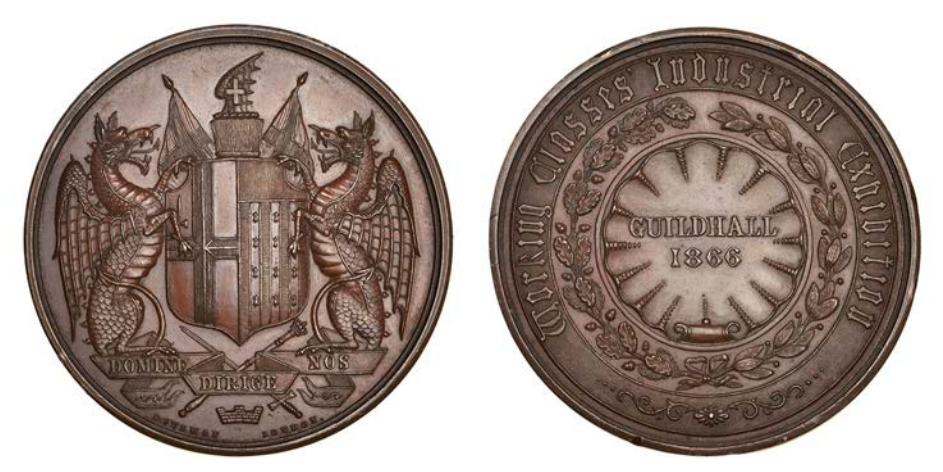
406 Working Classes Industrial Exhibition , 1866, a copper medal by B. Sulman, arms of the City of London, rev. GUILDHALL 1866 on circular scroll within wreath, 56mm (BHM 2871). A few small edge knocks, otherwise extremely fine, very rare £150-£180