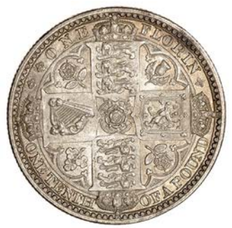
227 Florin, 1849, with initials (ESC 2815; S 3890). Good extremely fine