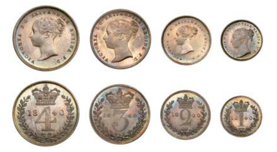
229 Maundy set, 1840 (ESC 3483; S 3916) [4]. About as struck with attractive matching tone