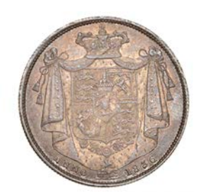
217 Halfcrown, 1836 (ESC 2482; S 3834). About extremely fine