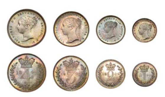
230 Maundy set, 1842 (ESC 3485; S 3916) [4]. About as struck with attractive matching tone