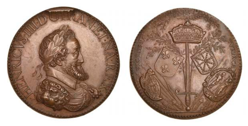
451 FRANCE, Battle of Ivry, 1590, a copper medal [struck 17th-18th century], unsigned, laureate and armoured bust of Henry IV right, rev. crown on sword, flanked by laurel branches and arms of France and Navarre, 48mm. Die break at top of obverse, otherwise extremely fine