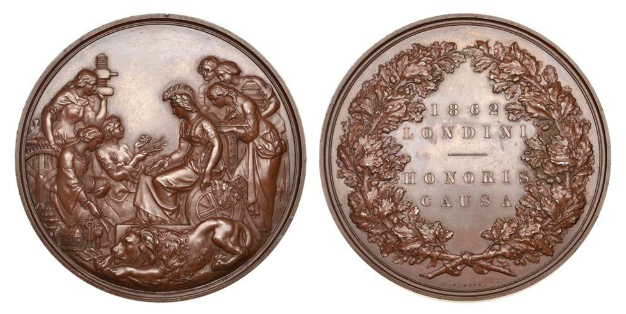
R. Evans & Co., City of London; awarded for Upholstery Trimmings