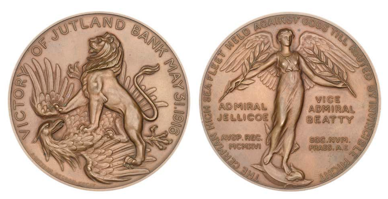
435 Battle of Jutland , 1916, a bronze medal by A.B. Pegram for Spink, British lion trampling German eagle, rev. Victory standing on dolphin, holding laurel branch in each hand, 76mm (BHM 4127; E 1949). Extremely fine; in case of issue