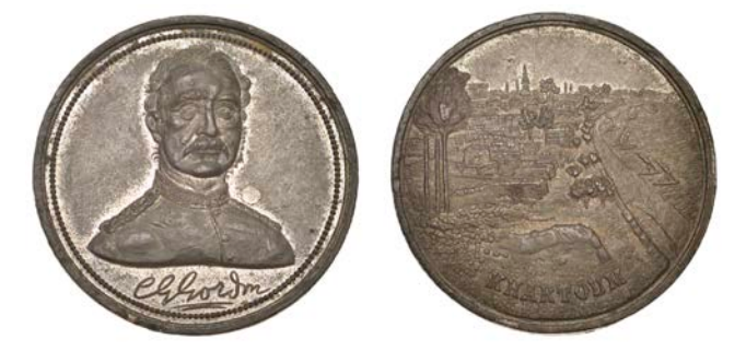
412 Death of General Gordon , 1885, a white metal medal, unsigned, uniformed bust facing, rev. view of Khartoum, 38mm (BHM 3189). About extremely fine, rare