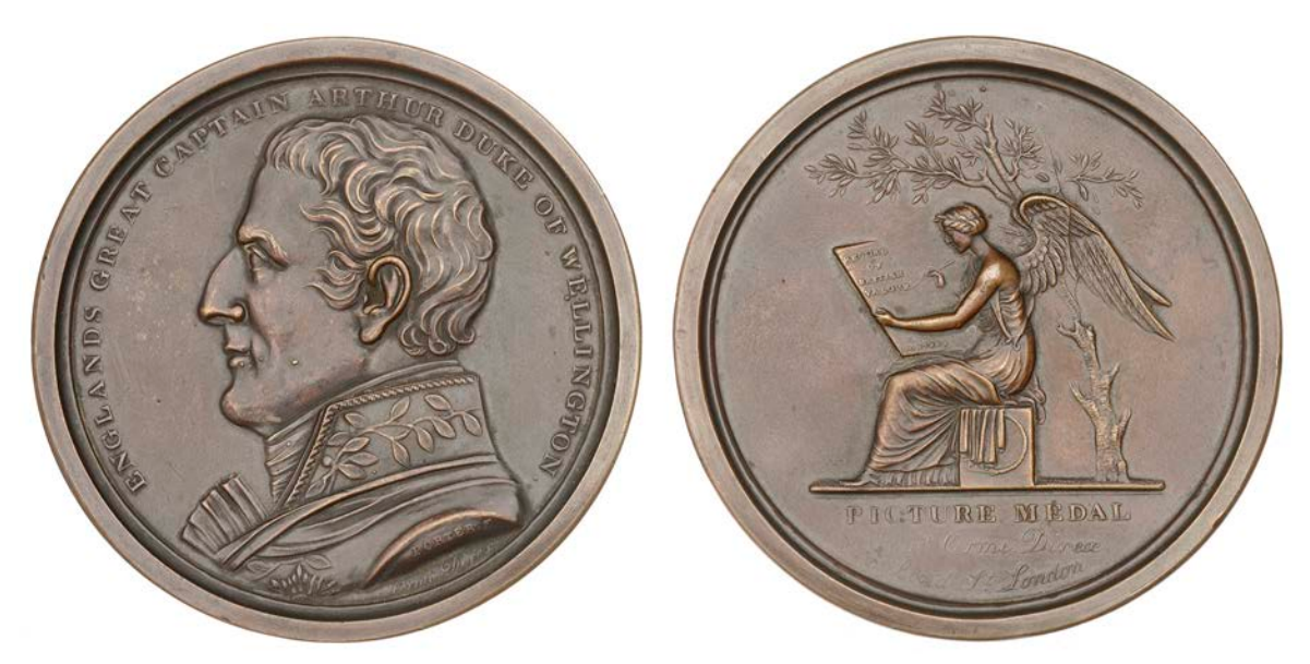
326 British Battles, 1815, a bronze box medal by J. Porter for E. Orme, uniformed bust of Wellington left, rev. Victory seated under a tree and inscribing a tablet, containing a set of 13 aquatint roundels depicting battle scenes, 74mm (Eimer 80; BHM 866; E 1074a) [Lot]. Very fine, scarce