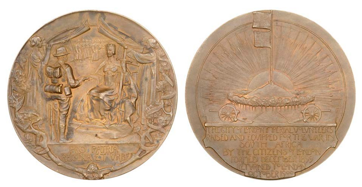
428 City of London Imperial Volunteers , 1900, a bronze medal by Sir George Frampton for the Corporation of the City of London, similar, 76mm (BHM 3684; E 1848). Extremely fine £120-£150

429 Edward VII, Coronation , 1902, a silver medal by G.W. de Saulles, 31mm (BHM 3737); together with other bronze medals (2), and a Dundee silver Shilling token [4]. Very fine or better, one cleaned