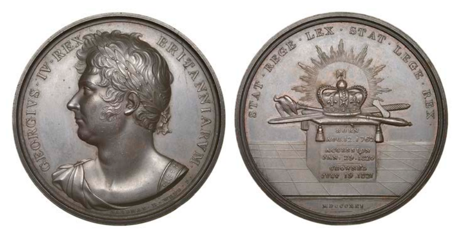
374 George IV , Coronation , 1821, a copper medal by T. Webb [after Hardman], laureate and draped bust left, rev. crown on crossed sword and sceptre, all atop a plinth, 55mm (BHM 1093; E -). About extremely fine £80-£100