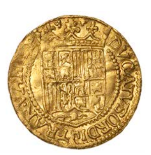
540 OVERIJSSEL , Ducat, undated [1590-3], in the name of Philip II of Spain, 3.42g/11h (Delm. 1048; F 262). Has been gilt, possibly removed from a ring-mount, otherwise good very fine £500-£700