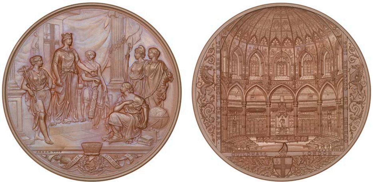
411 Opening of the New Council Chamber at the Guildhall , 1884, a bronze medal by J.S. & A.B. Wyon for the Corporation of the City of London, interior of the Chamber, rev. Londinia, attended by Commerce and Magistracy, addressing her council, 77mm (BHM 3177; Taylor 206a; E 1705). Toned, about as struck; in fitted case of issue £500-£700