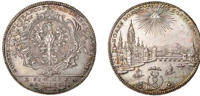
x 515 FRANKFURT, Free City , Thaler, 1772 PCB (Dav. 2226). About extremely fine £400-£500