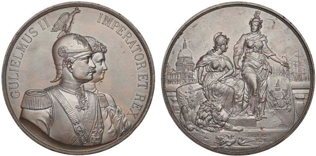
417 Visit of Emperor Wilhelm II to the City of London, 1891 , a bronze medal by Elkington & Co. for the Corporation of the City of London, conjoined busts of the Emperor and Empress right, rev. Germania seated to left, Britannia standing to right, each flanked by shield of arms, 80mm (BHM 3412; E 1768). Cleaned, some minor marks, otherwise extremely fine £100-£120