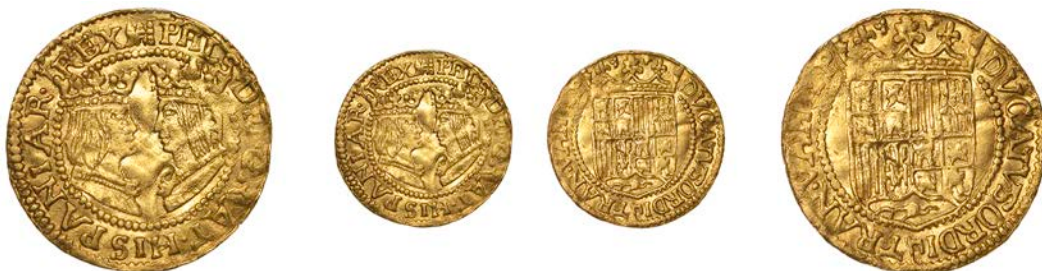
540 OVERIJSEL , Ducat, undated [1590-3], in the name of Philip II of Spain, 3.42g/11h (Delm. 1048; F 262). Has been gilt, possibly removed from a ring-mount, otherwise good very fine