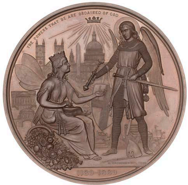
416 700th Anniversary of the Mayoralty of the City of London, 1889 , a bronze medal by A. Kirkwood & Sons for the Corporation of the City of London, busts of Richard I and Victoria vis-à-vis in cartouche, rev. St Michael presenting sceptre to kneeling figure of Londinium, St Paul's behind, 77mm (BHM 3377; E 1752). Virtually as struck; in fitted case of issue £500-£700