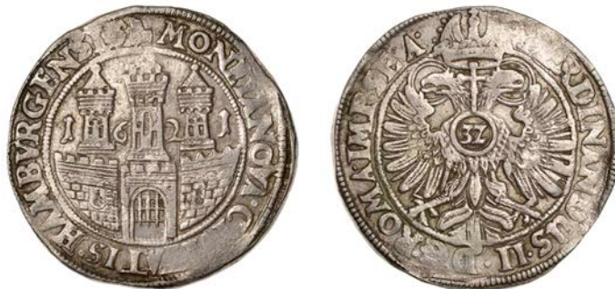
517 HAMBURG, Free City , Thaler, 1621, 28.68g/6h (Dav. 5364). Some weakness in margins, very fine £200-£260