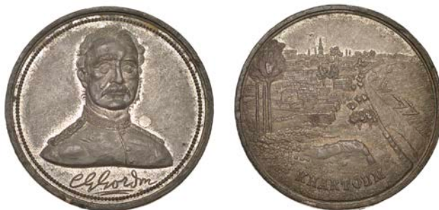
412 Death of General Gordon , 1885, a white metal medal, unsigned, uniformed bust facing, rev. view of Khartoum, 38mm (BHM 3189). About extremely fine, rare £80-£100