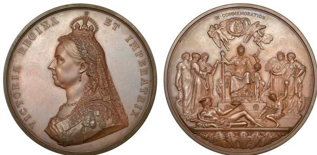
414 Victoria, Golden Jubilee, 1887 , a bronze medal by L.C. Wyon after Sir J.E. Boehm and Sir F. Leighton, similar, 77mm (W & E 2000A.1; BHM 3219; E 1733b). Extremely fine; in case of issue £200-£260