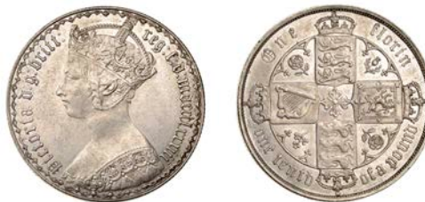
228 Florin, 1883 (ESC 2905; S 3900). About extremely fine £150-£180