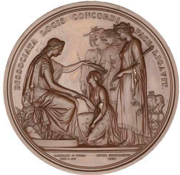
385 Great Exhibition, Hyde Park, 1851, Prize Medal, a copper award by W. and L.C. Wyon, conjoined heads of Victoria and Prince Albert left, trident and dolphins in field, rev. Britannia placing a wreath on kneeling figure of Industry, attended by supporters representing the continents, edge named (Sadler, Fenton & Co., Class XIV), 77mm (Allen HP-A015; BHM 2462; E 1456). Extremely fine; in contemporary fitted case £400-£500 Sadler, Fenton & Co., Belfast; awarded for Shirting