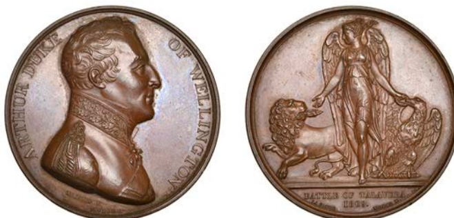
316 Battle of Talavera, 1809 , a copper medal by G. Mills & Lafitte for Mudie, uniformed bust of Wellington right, rev. Victory standing between British lion and French eagle, 41mm (Eimer 4; BHM 673; E 999; Bramsen 867). Extremely fine £100-£120