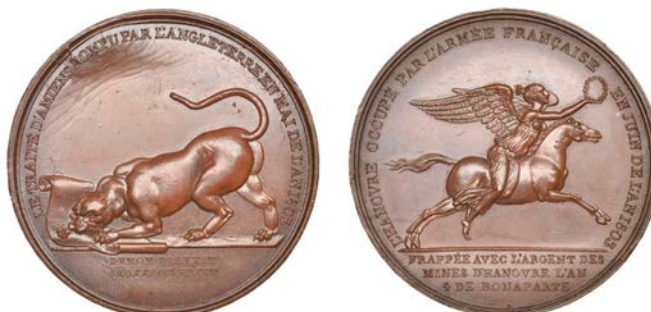
304 Treaty of Amiens Broken and Hanover Occupied , 1803, a copper medal by R. Jeuffroy, English lion biting scroll, rev. Victory on horseback galloping right, 41mm (Bramsens 271; BDM III, 73). About extremely fine, usual flan flaw on obverse £80-£100