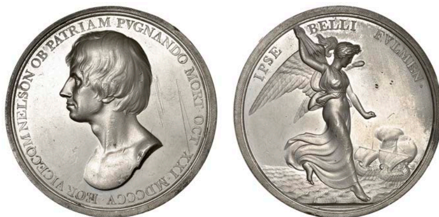
308 Death of Lord Nelson , 1805, a white metal medal by T. Webb, bare head left, rev. Bellona walking right over sea, 54mm (BHM 577; E 957; Bramsen 435). Lightly cleaned, scratched on obverse, other minor marks; about extremely fine, scarce in this metal £80-£100