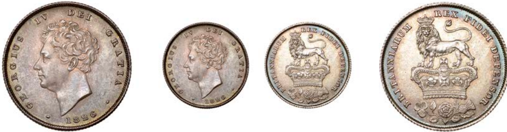
215 Shilling, 1826 (ESC 2409; S 3812). Good extremely fine, attractively toned