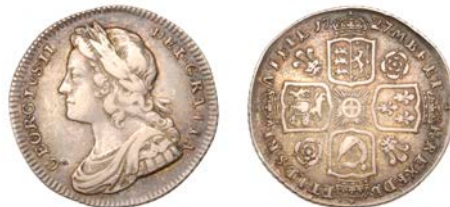
198 Shilling, 1727, roses and plumes (ESC 1694; S 3697). Good fine, toned