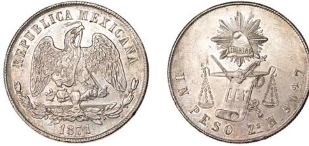
536 Republic , Peso, 1871 H , Zacatecas (KM. 408.8). Lustrous, about extremely fine