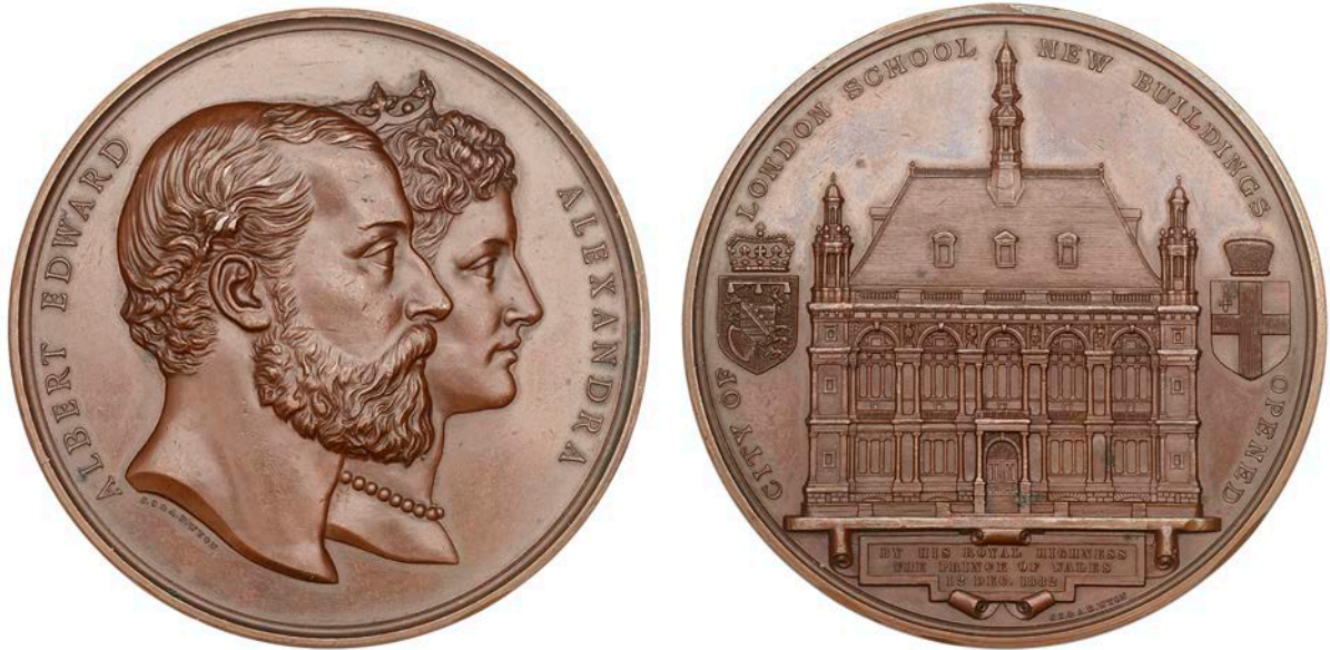
410 New Buildings at the City of London School Opened , 1882, a bronze medal by J.S. & A.B. Wyon for the Corporation of the City of London, conjoined busts of the Prince and Princess of Wales right, rev. frontal elevation of the School, 77mm (W & E 1461A.1; BHM 3133; E 1690). Extremely fine £200-£260