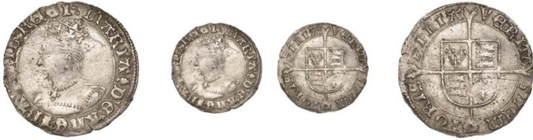
161 Groat, mm. pomegranate, reads REGI, 1.94g/9h (N 1960; S 2492). Light marks, otherwise very fine