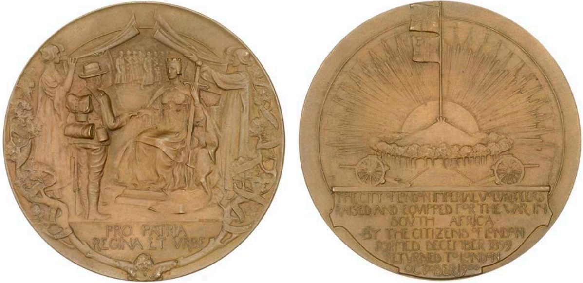
427 City of London Imperial Volunteers , 1900, a bronze medal by Sir George Frampton for the Corporation of the City of London, Volunteer standing before seated Londinia, rev. flagpole on mound surrounded by ring of trees, radiant sun behind, 76mm (BHM 3684; E 1848). About extremely fine; in case of issue [this damaged and repaired] £150-£180