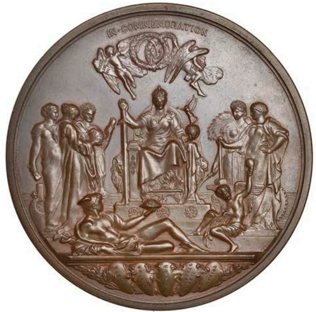
415 Victoria, Golden Jubilee, 1887 , a bronze medal by L.C. Wyon after Sir J.E. Boehm and Sir F. Leighton, similar, 77mm (W & E 2000A.1; BHM 3219; E 1733b). Nearly extremely fine; in case of issue £180-£220