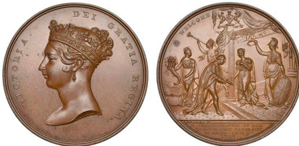
379 Victoria, Visit to the City of London , 1837, a copper medal by J. Barber for Griffin & Hyams, crowned head left, rev. Victoria, attended by Britannia, welcomed by the Lord Mayor, 61mm (W & E 62A.2; BHM 1772; E 1303). Some minor marks, carbon spot in reverse field, otherwise extremely fine; in contemporary fitted case £150-£180