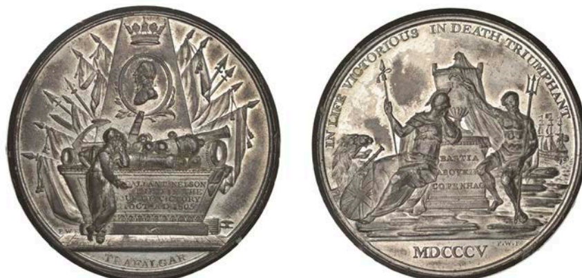
309 Death of Lord Nelson , 1805, a white metal medal by P. Wyon, mourning seaman standing beside tomb, rev. Britannia and Neptune seated beside funerary urn on plinth, 52mm (BHM 579; E 958; Bramsen 434). Some minor marks, otherwise about extremely fine £100-£120