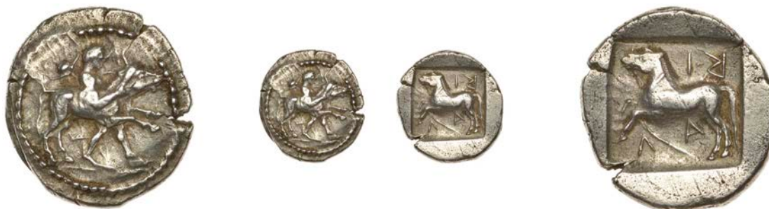
620 THESSALY, Larissa , Drachm, 460-450, Thessalos holding band across horns of bull, petasos flying behind, rev. ΑΑ ΠΙ, bridled horse bounding right, 5.61g (BCD Thessaly 355.2, same dies; McClean 4587, same dies; Lorber Thessalian pl. 41, 9, same obv. die; BMC 6). Light porosity, very fine £200-£260 Provenance: Gerhard Hirsch Auktion 223 (Munich), 26 September 2002, lot 1582