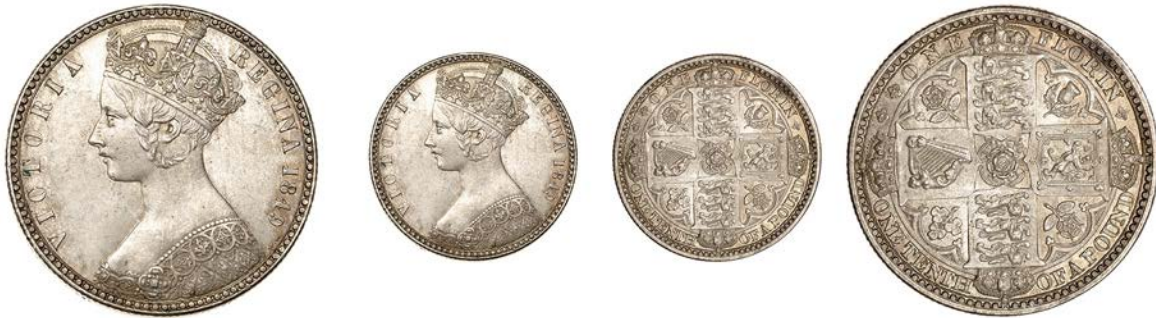
227 Florin, 1849, with initials (ESC 2815; S 3890). Good extremely fine £300-£400