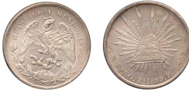
x 537 Republic , Peso, 1899 FZ , Zacatecas (KM. 409.3). Good extremely fine [slabbed ANACS MS 63]