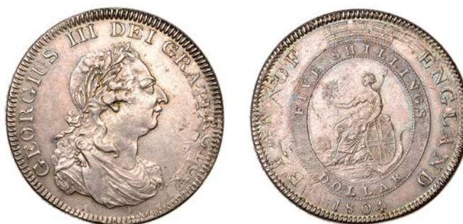
x 205 Dollar, 1804, types A/2, leaf to upright of E in DEI, pellet after REX (ESC 1925; S 3768). Numerous scratches on reverse by edge at 1 o'clock, weakly struck in legends with traces of undertype visible, otherwise very fine, toned