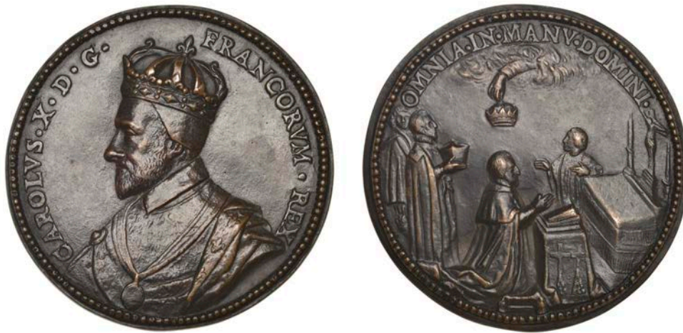
450 FRANCE, Charles X , a cast bronze medal, undated, unsigned, crowned and draped bust left, rev. coronation scene, 60mm. Possibly a slightly later cast, about extremely fine £200-£260