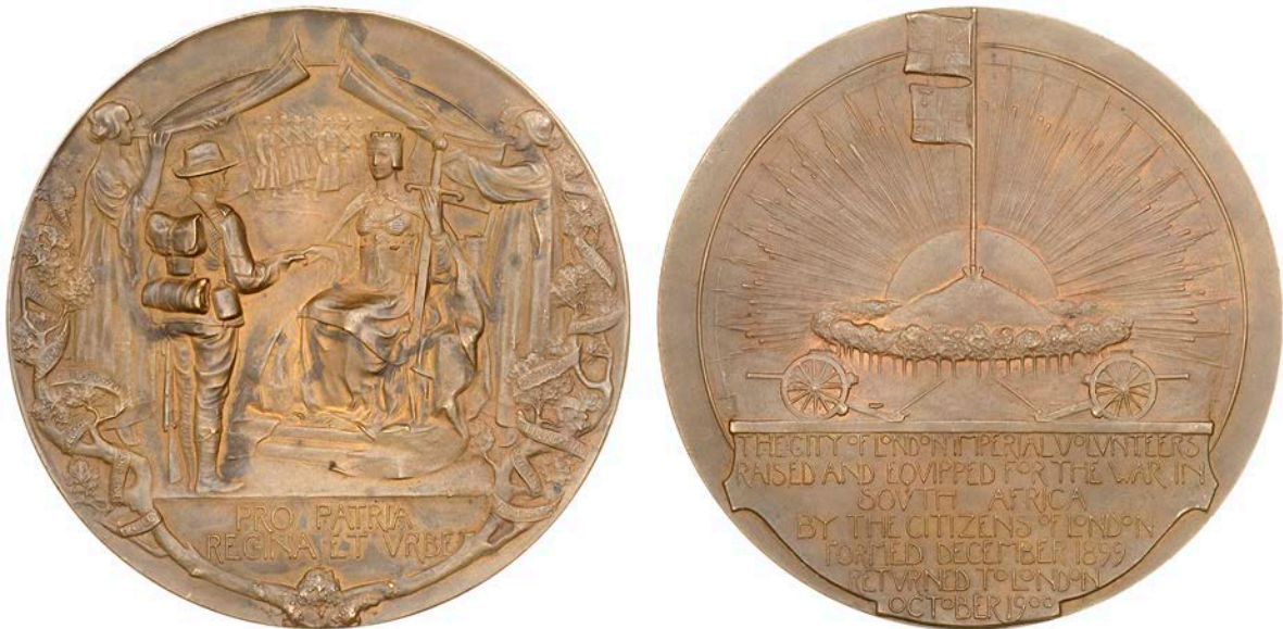
428 City of London Imperial Volunteers , 1900, a bronze medal by Sir George Frampton for the Corporation of the City of London, similar, 76mm (BHM 3684; E 1848). Extremely fine £120-£150