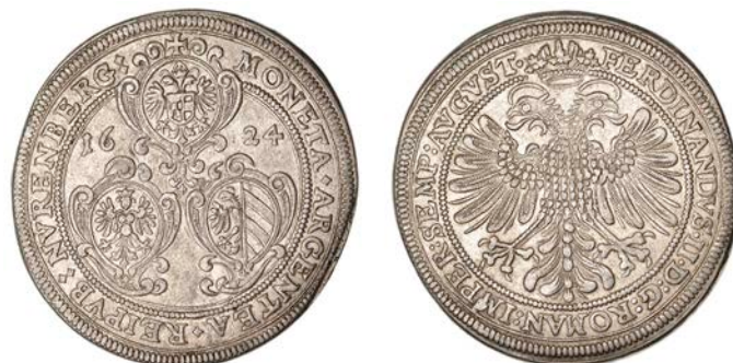
518 NUREMBERG, Free City , Thaler, 1624, 28.66g/12h (Dav. 5637). Good very fine £240-£300