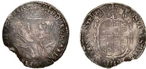
162 Shilling, 1555, English titles and mark of value, 5.75g/11h (N 1968; S 2501). Chipped, scratched and with some surface stress marks, otherwise about very fine for issue