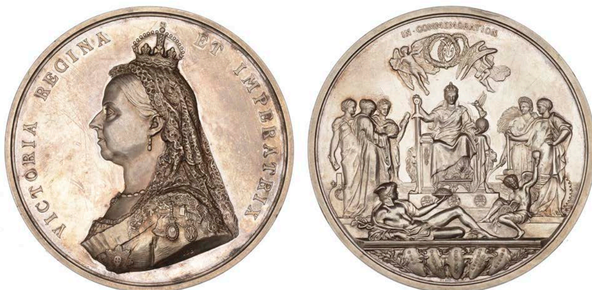
413 Victoria, Golden Jubilee, 1887 , a silver medal by L.C. Wyon after Sir J.E. Boehm and Sir F. Leighton, crowned bust left, rev. enthroned figure of Empire surrounded by standing figures representing Science, Letters, Art, etc, Mercury and Time below, 77mm, 216.16g (W & E 2000A.2; BHM 3219; E 1733b). Polished, some marks in fields, otherwise about extremely fine; in case of issue £400-£500