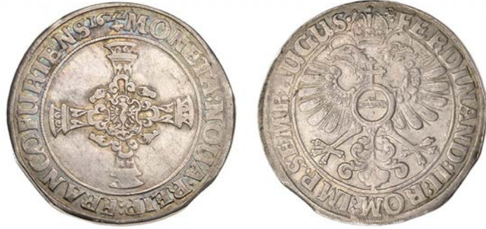
x 514 FRANKFURT, Free City , Thaler, 1622, 28.64g/12h (Dav. 5289). Edge smoothed, otherwise very fine with some toning £150-£180