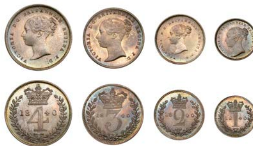
229 Maundy set, 1840 (ESC 3483; S 3916) [4]. About as struck with attractive matching tone £600-£800