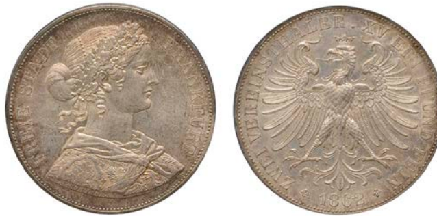
x 516 FRANKFURT, Free City , Double-Thaler, 1862 (Dav. 651). Extremely fine [slabbed ANACS MS 61] £200-£260