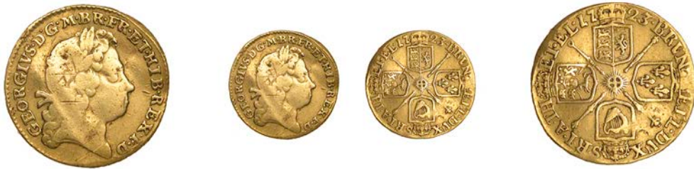
191 Half-Guinea, 1723 (EGC 544; S 3635). Slightly creased, some light scrapes, otherwise fine, rare