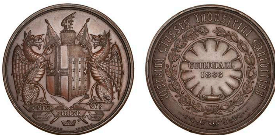
406 Working Classes Industrial Exhibition, 1866, a copper medal by B. Sulman, arms of the City of London, rev. GUILDHALL 1866 on circular scroll within wreath, 56mm (BHM 2871). A few small edge knocks, otherwise extremely fine, very rare £150-£180