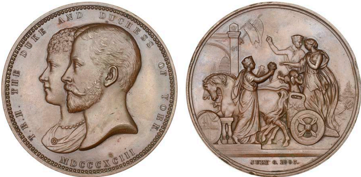
418 Visit of the Duke and Duchess of York to the City of London, 1893 , a bronze medal by G.G. Adams for the Corporation of the City of London, conjoined busts left, rev. Duke and Duchess in biga driven by Cupid, being presented with a cornucopia by Londinia, 76mm (W & E 1763; BHM 3452; E 1780). Lightly cleaned, some edge knocks, good very fine £100-£120