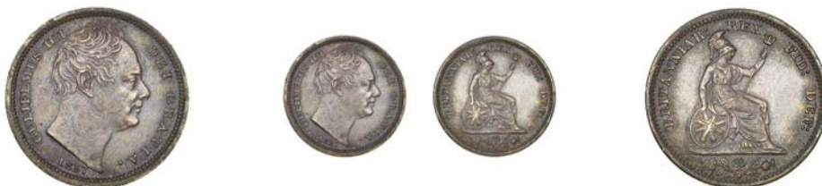
218 Half-Farthing, 1837 (BMC 1476; Cooke 1607; S 3849). About extremely fine, toned, rare