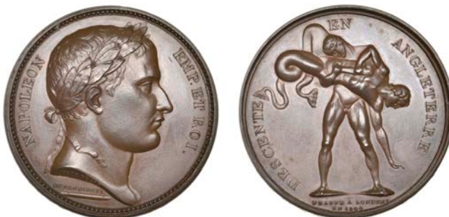
307 Proposed Invasion of England , 1804, a copper medal by J.-P. Droz (and ?) [after Jeuffroy], laureate head of Napoleon right, rev. Hercules holding a merman, edge inscribed COPIED FROM THE FRENCH MEDAL, 41mm (BHM 594; Bramsen 365; BDM I, 624). Extremely fine £100-£120