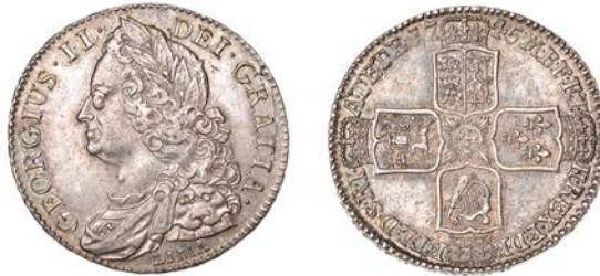
x 196 Halfcrown, 1745 LIMA, edge DECIMO NONO (ESC 1687; S 3695). Good very fine, toned