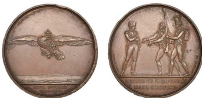
325 Napoleon's Return from Elba , 1815, a copper medal by N. Brenet & B. Andrieu, crowned eagle flying over sea, holding Légion d'Honneur in beak, rev. Napoleon standing before two soldiers, 41mm (Bramsen 1591). Two edge bruises, minor surface dirt, otherwise about extremely fine £60-£80