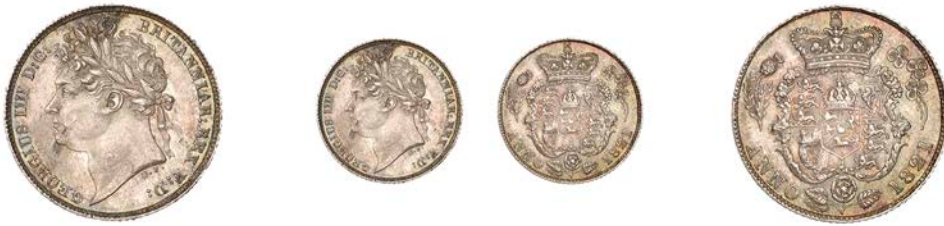
216 Sixpence, 1821 (ESC 2421; S 3813). Toned, extremely fine