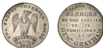
317 Capture of the French Imperial Eagle at Barrosa, 1811 , a silvered-brass medalet, unsigned, eagle standing on ribbon, rev. legend, 26mm (BHM 714). Good very fine, rare £60-£80