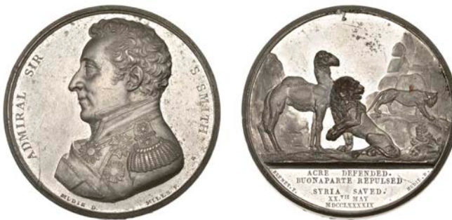
298 Defence of Acre, 1799 , a white metal medal by G. Mills & N. Brenet for Mudie, uniformed bust of Admiral Smith left, rev. British lion protecting Syrian camel from French tiger, 41mm (BHM 476; E 906). A few minor marks, otherwise about extremely fine, rare £100-£120