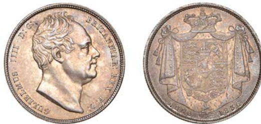
x 217 Halfcrown, 1836 (ESC 2482; S 3834). About extremely fine