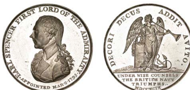
297 Earl Spencer , 1799, a white metal medal by T. Wyon Sr, uniformed bust left, rev. Victory standing facing with head right, blowing trumpet, 38mm (BHM 471; E 913). Brilliant, good extremely fine £60-£80 Provenance: Baldwin Auction 63, 30 September 2009, lot 1258 (part)