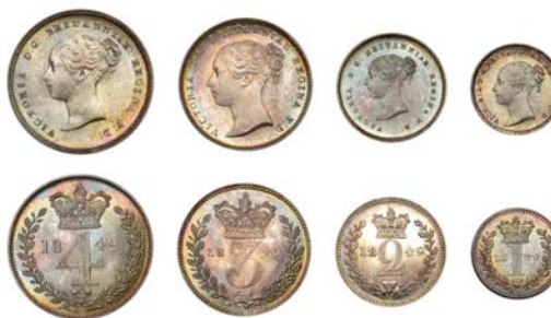
230 Maundy set, 1842 (ESC 3485; S 3916) [4]. About as struck with attractive matching tone £500-£700