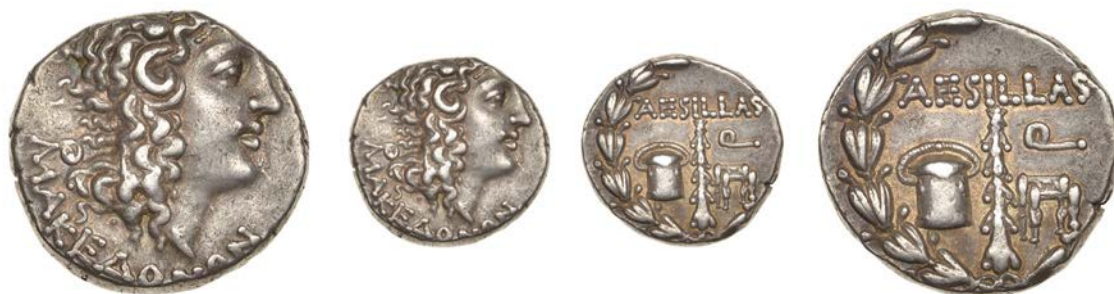
x 616 MACEDONIA, Roman Province , Tetradrachm, struck by the quaestor Aesillas, c. 95-70, ΜΑΚΕΔΟΝΩΝ, head of Alexander the Great right, rev. ΑΕΣΙΛΛΑΣ Q, Fiscus, club and chair within laurel wreath, 16.60g (SNG Ashmolean 3303ff; McClean 3716-6). Better than very fine, toned £200-£260