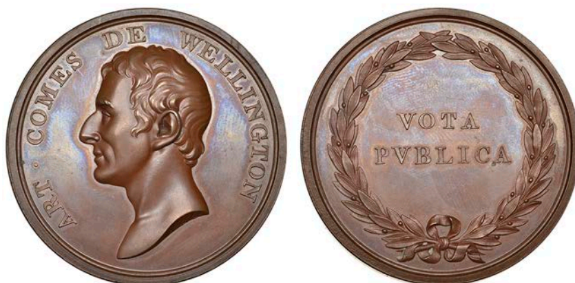
320 Earl of Wellington, 1812 , a copper medal by T. Webb, bare head left, rev. VOTA PVBLICA within wreath, 53mm (Eimer 10; BHM 746; E 1029; Bramsen 1174). Extremely fine; in contemporary fitted case £80-£100