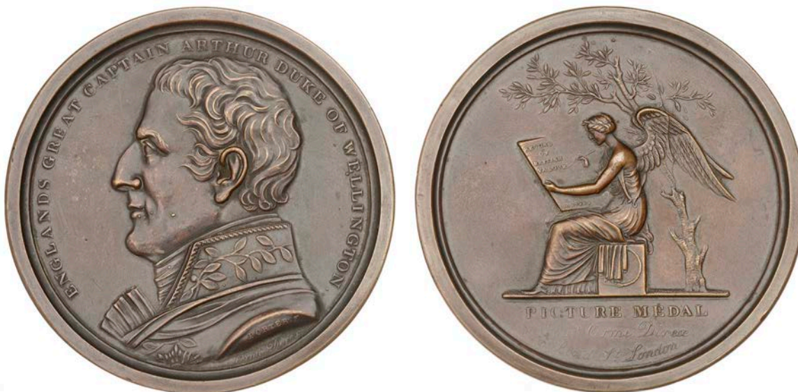
326 British Battles , 1815, a bronze box medal by J. Porter for E. Orme, uniformed bust of Wellington left, rev. Victory seated under a tree and inscribing a tablet, containing a set of 13 aquatint roundels depicting battle scenes, 74mm (Eimer 80; BHM 866; E 1074a) [Lot]. Very fine, scarce £300-£400