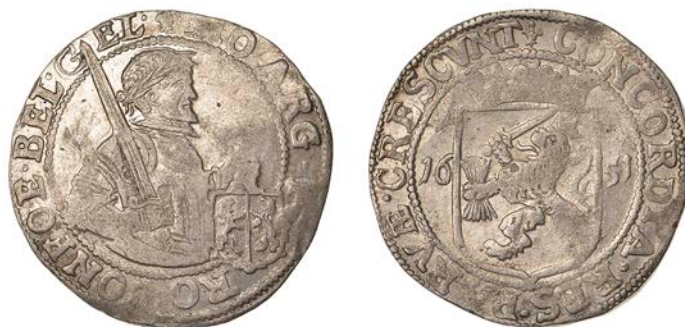
539 GELDERLAND , Rijksdaalder, 1651, 28.61g/5h (Delm. 938; Dav. 4828). Good very fine with some lustre