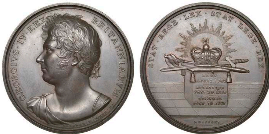
374 George IV, Coronation , 1821, a copper medal by T. Webb [after Hardman], laureate and draped bust left, rev. crown on crossed sword and sceptre, all atop a plinth, 55mm (BHM 1093; E -). About extremely fine £80-£100