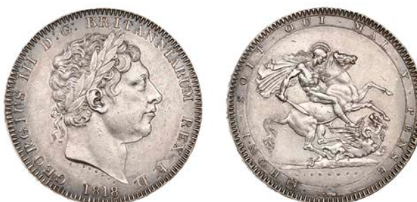
x 206 Crown, 1818, edge LIX (ESC 2009; S 3787). Cleaned, surface marks, good very fine