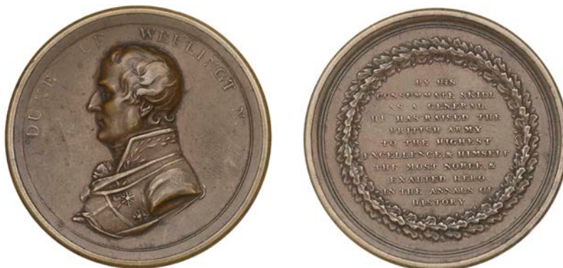
327 British Victories , 1815, a copper box medal, unsigned, uniformed bust of the Duke of Wellington left, rev. legend within wreath, containing 14 paper roundels bearing the names and dates of the battles, 47mm (Eimer 82; BHM 885; E 1075a) [Lot]. Very fine £150-£180