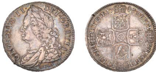
197 Halfcrown, 1746/5 LIMA, edge DECIMO NONO (ESC 1689; S 3695A). Small edge cut, otherwise very fine and toned Provenance: D.L.F. Sealy Collection