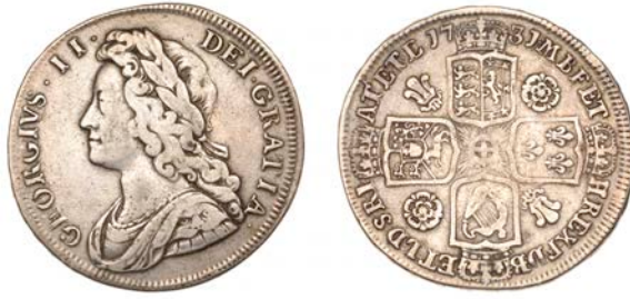
195 Halfcrown, 1731, roses and plumes, edge QVINTO (ESC 1674; S 3692). Fine