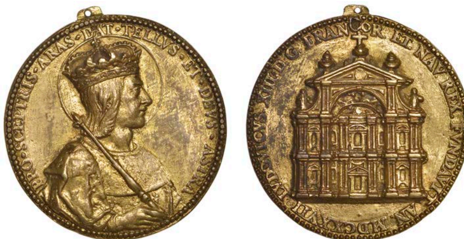
452 FRANCE, Laying of the Foundation Stone of the Church of St Louis , 1627, a cast gilt-bronze medal, unsigned, crowned bust of St Louis right, rev. façade of the church, 57mm (Jones 342). Plugged at top, gilding worn in places, otherwise very fine; with small loop for suspension £200-£260