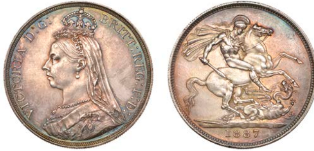
224 Crown, 1887 (ESC 2585; S 3921). Sometime lightly cleaned with resulting hairlines, now re-toning, extremely fine £100-£150