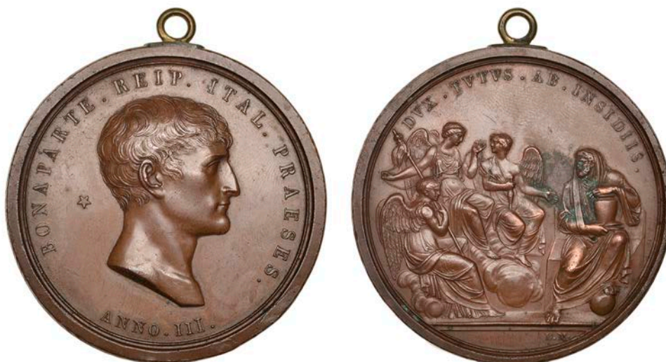
301 Napoleon Preserved from Assassination, 1800 , a copper medal by L. Manfredini, bare head right, rev. Destiny and three Fates, 59mm (Bramsen 77; BDM III, 554). Good very fine; suspension loop added to edge £60-£80