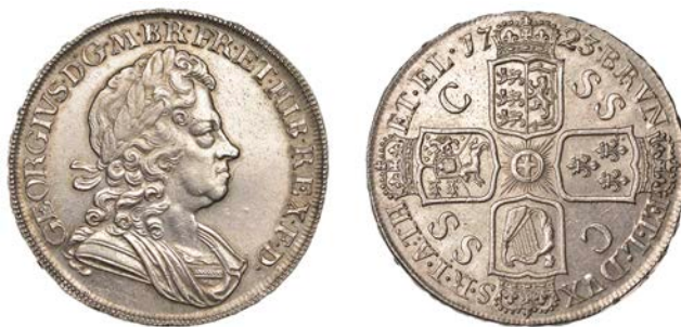
x 192 Crown, 1723 ss c, edge DECIMO (ESC 1545; S 3640). Of bright appearance, extremely fine