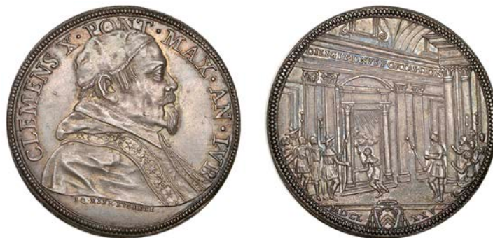
529 Clement X , Piastra, 1675, 32.11g/12h (Berman 2006; Dav. 4077). Toned, about extremely fine