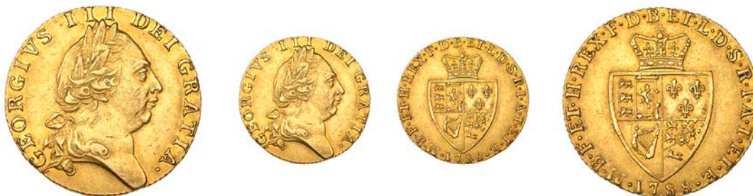
202 Guinea, 1788, fifth bust (EGC 713; S 3729). A few minor marks, otherwise good very fine