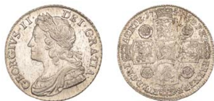
200 Shilling, 1741, roses (ESC 1717; S 3701). Sometime cleaned, fleck-marks, very fine