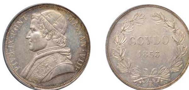
530 Pius IX , Scudo, 1853 \text{r} , yr VIII (Berman 3309; Dav. 194). About extremely fine [slabbed ANACS AU 55]