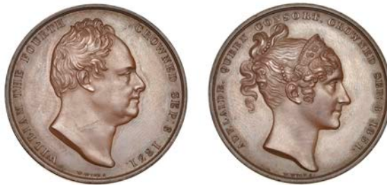
377 William IV, Coronation , 1831, a copper medal by W. Wyon, bare head right, rev. head of Queen Adelaide right, 33mm (BHM 1475; E 1251). Extremely fine; in case of issue £150-£180