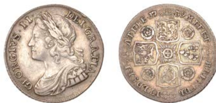
199 Shilling, 1739, roses, smaller garter star (ESC 1715; S 3701). Light marks, about very fine, scarce