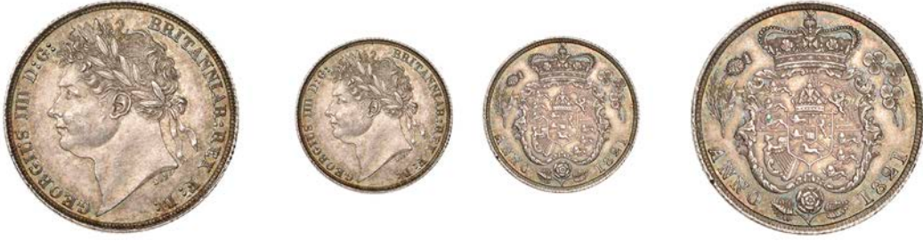
214 Shilling, 1821 (ESC 2396; S 3810). Toned, extremely fine