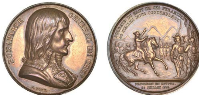
294 Napoleon in Egypt , 1798, a copper medal by A. Bovy [struck 1841-2], uniformed bust right, rev. Napoleon on horseback amidst troops, pyramids behind, 41mm (Julius 626; BDM I, 246). Cleaned at one time, otherwise about extremely fine £60-£80