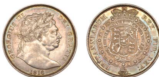
207 Halfcrown, 1816 (ESC 2086; S 3788). About extremely fine, peripheral toning