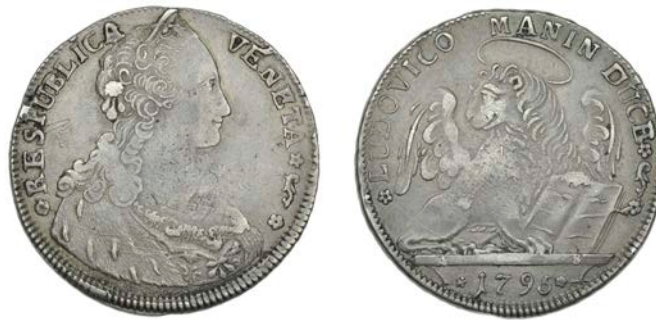
528 VENICE , Lodovico Manin, Tallero, 1795 (Paolucci 35; Dav. 1575). About very fine, toned