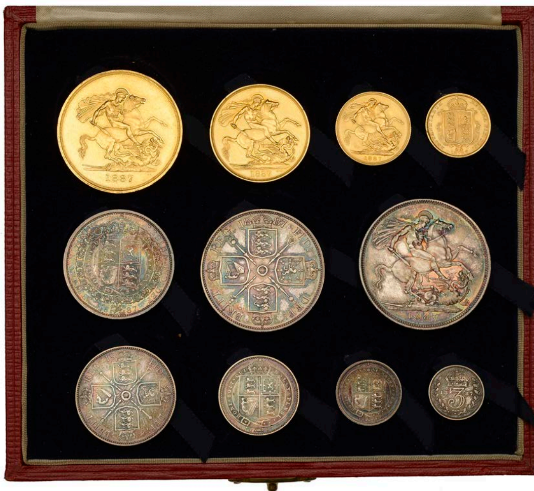
243 Specimen set, 1887, comprising Five and Two Pounds, Sovereign and Half-Sovereign, Crown to Threepence [11]. The gold extremely fine but hairlined, the silver varied state £3,600-£4,000