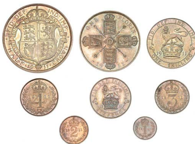
244 Proof set, 1911, comprising Halfcrown to Maundy Penny [8]. Brilliant, attractive matching tone; in leather case of issue £800-£1,000