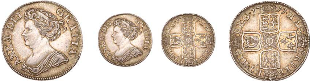
189 Shilling, 1711, fourth bust (ESC 1408; S 3618). About extremely fine, grey tone