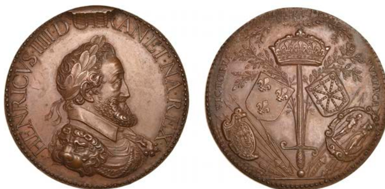
451 FRANCE, Battle of Ivry , 1590, a copper medal [struck 17th-18th century], unsigned, laureate and armoured bust of Henry IV right, rev. crown on sword, flanked by laurel branches and arms of France and Navarre, 48mm. Die break at top of obverse, otherwise extremely fine £80-£100