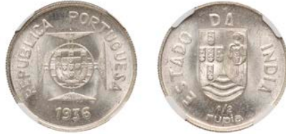
526 PORTUGUESE INDIA , Half-Rupia, 1936 (Gomes 07.01; KM. 23). About as struck [slabbed NGC MS 65]