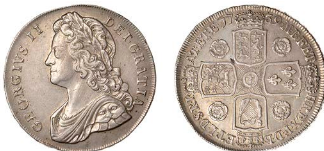
x 194 Crown, 1739, roses, edge DVODECIMO (ESC 1665; S 3687). Some adjustment marks, good very fine, attractive light tone £1,000-£1,200