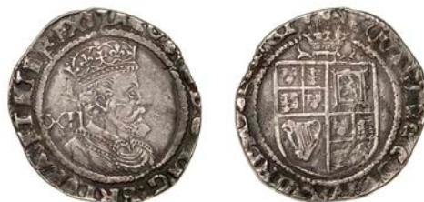
165 Third coinage, Shilling, mm. thistle, sixth bust, plume over shield, 5.51g/12h (N 2125; S 2669). Removed from a mount and with some surface marks, otherwise good fine, scarce