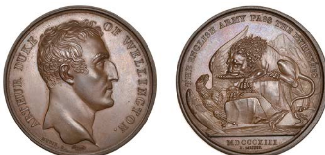
322 English Army Passes the Pyrenees, 1813 , a copper medal by N. Brenet for Mudie, bare head of Wellington right, rev. British lion attacking French eagle, 41mm (Eimer 29a; BHM 760; E 1034; Bramsen 1285). Extremely fine £100-£120