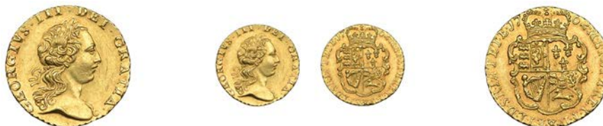
203 Quarter-Guinea, 1762 (EGC 886; S 3741). Hairlined, scratch before face, otherwise extremely fine