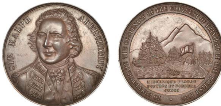
333 Centenary of the Capture of Trinidad, 1897 , a copper medal, unsigned, uniformed bust of Sir Ralph Abercromby facing, rev. view of the harbour at Port of Spain, 48mm (BHM 3623; E 1809). Extremely fine; in fitted case [this somewhat distressed] £100-£120