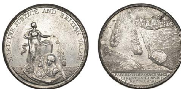
303 Battle of Copenhagen , 1801, a white metal medal, unsigned, Justice standing behind column, portrait medallions of Admirals Parker and Nelson in front, rev. view of the battle, 39mm (BHM 510; E 933). Lightly cleaned, some minor marks, otherwise about extremely fine, rare £60-£80