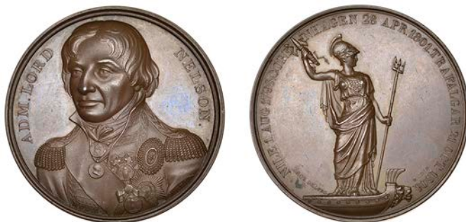
310 Death of Lord Nelson , 1805, a copper medal by T. Webb & J.-P. Droz for Mudie, uniformed bust facing, rev. Bellona standing on prow of ship, holding thunderbolt and sceptre, 41mm (BHM 595; E 962; Bramsen 436). Extremely fine £100-£120