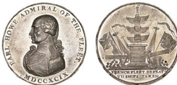
296 Death of Earl Howe , 1799, a white metal medal by T. Wyon Sr, uniformed bust left, rev. rostral column, crossed flags and trophies behind, 38mm (BHM 468; E 909). Some minor marks, otherwise about extremely fine £60-£80