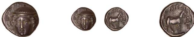
617 THRACE, Ainos , Tetrobol, c. 400-397, head of Hermes facing slightly left, wearing petasos, rev. goat standing right, flaming torch at right, 2.27g (May, Ainos 345; Sear 1569). Very fine and toned, very rare £200-£300 Provenance: DNW Auction A5, 29 June 2008, lot 849