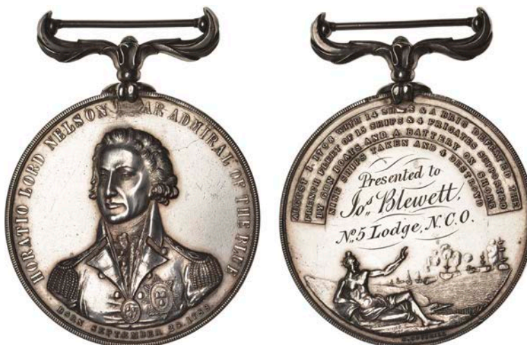
295 Battle of the Nile , 1798, a silver medal by E. Cottrill, uniformed bust of Nelson facing, rev. river god Nilus reclining left, watching the battle, legend in and below cartouche above, named (Presented to Jos. Blewett, No. 5 Lodge N.C.O.), 49mm (BHM –; E –). Lightly polished, otherwise about extremely fine, rare, with suspension bar; in contemporary fitted case £200-£260 This is a later copy of the original medal by Hancock & Kempson (BHM 448)