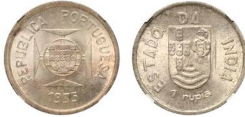
525 PORTUGUESE INDIA , Rupia, 1935 (Gomes 10.01; KM. 22). About as struck [slabbed NGC MS 65]