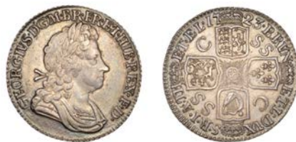
193 Shilling, 1723 ss c, first bust (ESC 1586; S 3647). Better than very fine, toned