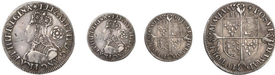
164 Milled coinage, Sixpence, 1562, mm. star, plain dress, 2.97g/6h (Borden/Brown 23, O2/R2; N 2025/2; S 2594). Face weak, otherwise very fine