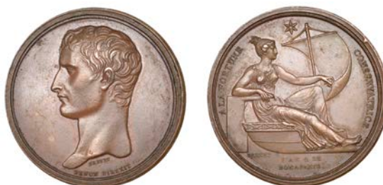
305 Preparation for the Invasion of England , 1803, a copper medal by N. Brenet, bare head of Napoleon left, rev. Fortune seated right in ship with hand on tiller, 34mm (Bramsens 275; BDM I, 274). Good very fine £60-£80