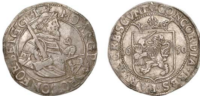
538 GELDERLAND , Rijksdaalder, 1650, 28.90g/10h (Delm. 938; Dav. 4828). Good very fine