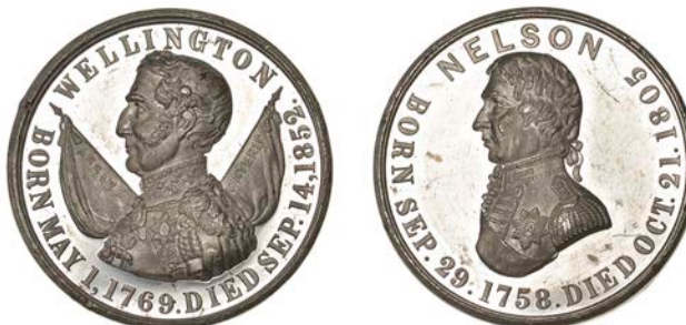
332 Death of the Duke of Wellington, 1852 , a white metal medal by J. Taylor (?), uniformed bust left, crossed flags behind, rev. uniformed bust of Nelson left, 38mm (Eimer 160; BHM -; E -). Brilliant, extremely fine, rare £100-£120