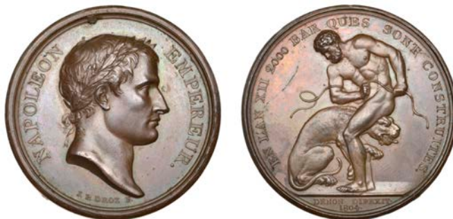
306 Proposed Invasion of England , 1804, a copper medal by J.-P. Droz, laureate head of Napoleon right, rev. Hercules subduing English lion, 41mm (Bramsen 320; BDM I, 624). Small punch-mark on edge, otherwise about extremely fine £80-£100