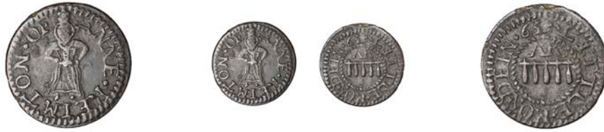
85 Little Munden , Anne Keimton, Farthing, [16]65, 1.26g/12h (N 2232; BW. 139). Good fine, rare; the only issue for the village