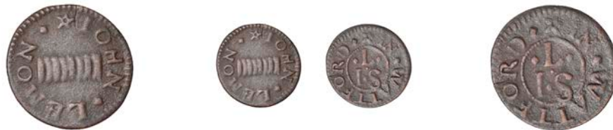
116 Watford , John Lemon, Farthing, 0.72g/3h (N –; BW. 217). Good fine, extremely rare

Provenance: *N 2301 Watford Museum [by exchange] November 1983; N 2302 P.D. Greenall Collection, Baldwin Auction 16, 30 October 1997, lot 50 (part) [from Baldwin April 1989]