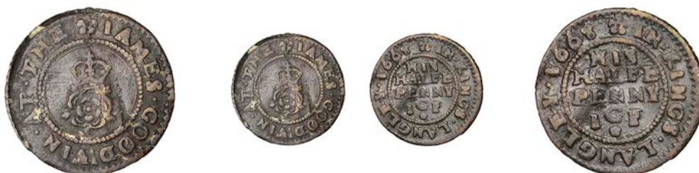
83 Kings Langley , Christor. Buckcok, Farthing, 1656, 1.21g/6h (N 2229; BW. 134); James Goodwin, Halfpenny, 1668, 1.12g/12h (N 2230/1; BW. 136) [2]. Good fine but second with crease mark; the only issues for the town £60-£80

Provenance: N. Bagshawe Collection, Glendining Auction, 3 November 2000, lot 838