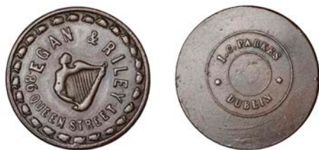
271 Co DUBLIN, Dublin , Egan & Riley, copper by Parkes [1865-72], 28mm (Rice 136; Todd 88; cf. DNW 136, 1368). Good very fine, very rare £120-£150 Provenance: Bt Baldwin 1993