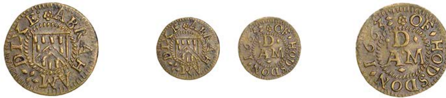
79 Hoddesdon , Abraham Dixe, Farthing, 1663, 0.67g/9h (N 2224, recté 1663; BW. 127, recté 1663). Very fine and very rare, the date clear £100-£150

Provenance: C. Street Collection; bt C.S. June 1993