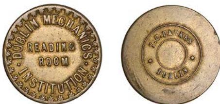
269 Co DUBLIN, Dublin , Dublin Mechanics Institution, Reading Room, brass, by Parkes [1865-72], 28mm (Rice 128; Todd 83; cf. DNW 136, 1364). Very fine £80-£100 Provenance: Bt C.J. Denton 1992