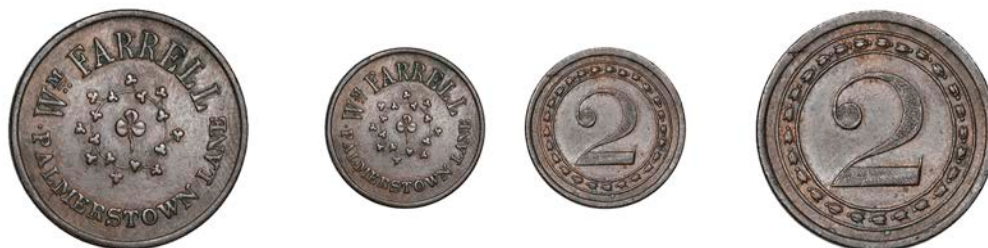
273 Co DUBLIN, Dublin , William Farrell, copper Twopence, 21mm (Rice 159; Todd 104; 'Dublinia' 424; cf. DNW 136, 1374). About extremely fine, rare £120-£150 Provenance: Bt M. Eden 1991