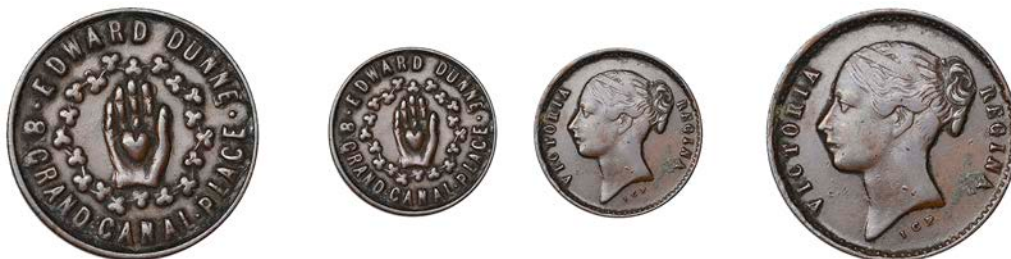
270 Co DUBLIN, Dublin , Edward Dunne, copper, by Parkes [1861-72], 22mm (Rice 133; Todd 85; W 6025; 'Dublinia' 422; cf. DNW 136, 1366). Very fine £90-£120 Provenance: Bt S. Byrne 1989