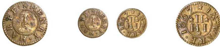
113 Ware , Henry Harte, Farthing, 1667, 0.70g/12h (N –; BW. 207). Very fine and very rare