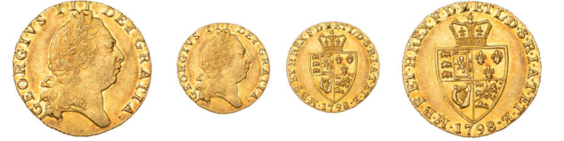
136 Guinea, 1798, fifth bust (EGC 732 var.; S 3729). About extremely fine