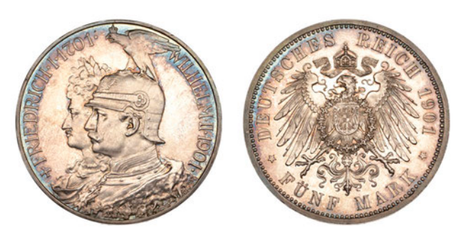
429 PRUSSIA, Wilhelm II, Proof 5 Marks, 1901 (Dav. 790; KM. 526). Fields lightly hairlined, otherwise about as struck, toned £240-£300

428 MAINZ , Johann Philipp von Schönborn, Ducat, 1655MF, 3.34g/1h (KM. 107; F 1656). Traces of mounting on edge, otherwise very fine £400-£500