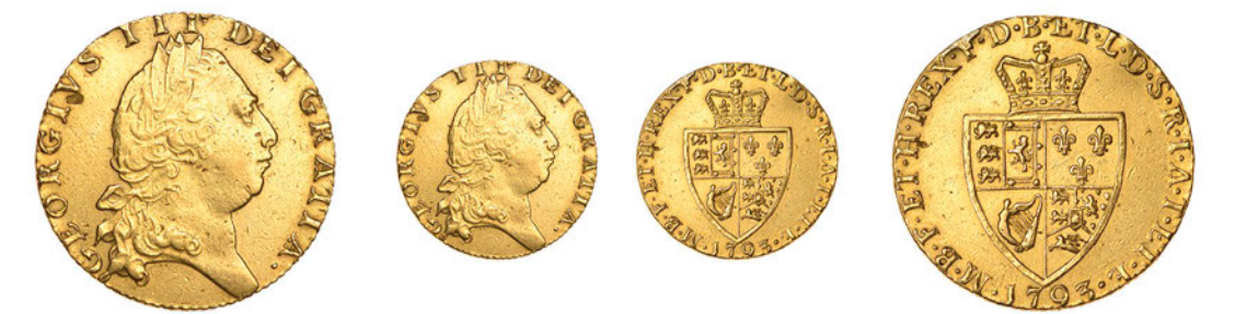
135 Guinea, 1793, fifth bust (EGC 723; S 3729). Traces of mounting on edge, otherwise very fine