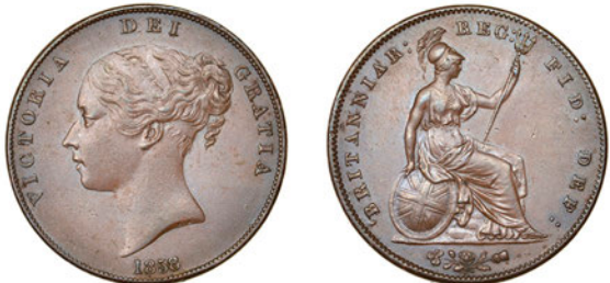
199 Penny, 1858/3, first A in BRITANNIAR repaired (BMC 1515; S 3948). About extremely fine