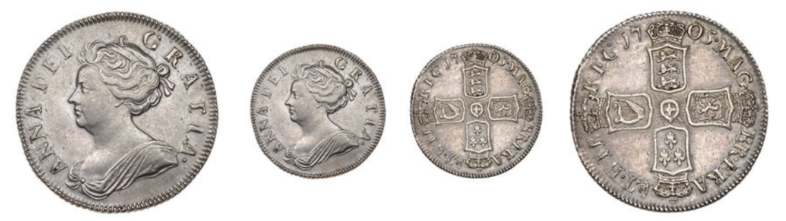
123 Shilling, 1705 (ESC 1391; S 3587). Good very fine and toned, rare