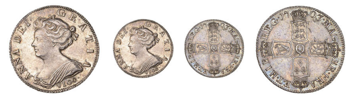
122 Shilling, 1703 VIGO (ESC 1388; S 3586). Extremely fine and toned

121 Crown, 1707, edge SEPTIMO (ESC 1344; S 3601). Cleaned, old graffiti on obverse, otherwise about very fine, reverse better £200-£260 Provenance: Baldwin Argentum Auction, 6 February 2016, lot 86