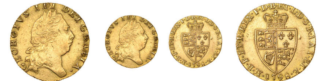
137 Guinea, 1798 (9 over 8?), fifth bust (EGC -; S 3729). Traces of mounting on edge, otherwise very fine, the overdate very rare