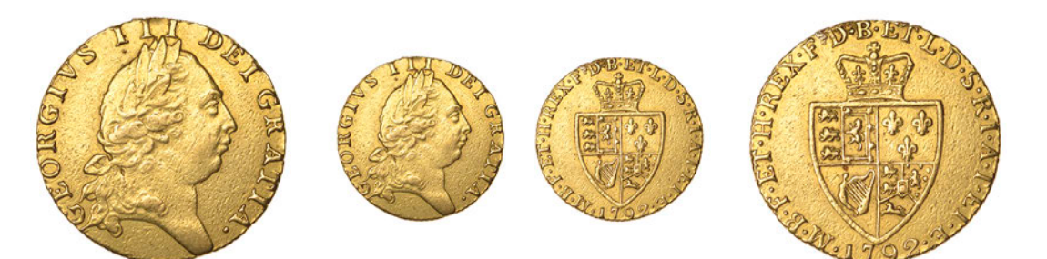
134 Guinea, 1792, fifth bust (EGC 720; S 3729). Traces of mounting on edge, otherwise very fine