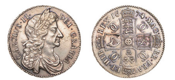
105 Halfcrown, 1674, fourth bust, edge vicesimo sexto (ESC 466; S 3367). Nearly extremely fine, rare thus