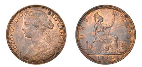
201 Penny, 1860, dies Dd, double-punched obv. legend, boat clear of sea on rev. (F 10; BMC 1629; S 3954). About extremely fine, but with a streaky patina and perhaps some light lacquering on reverse £70-£90