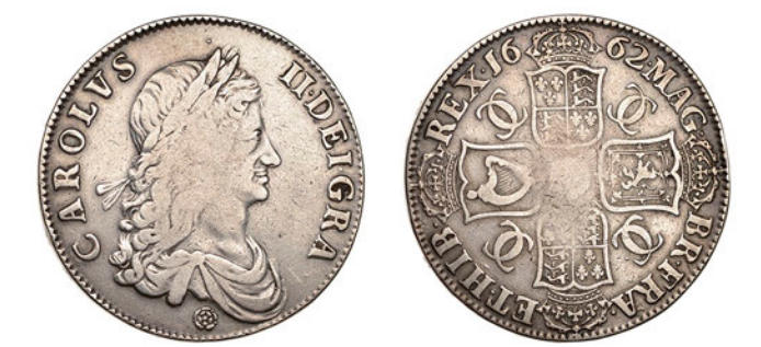
101 Crown, 1662, first bust with rose below, stop after HIB (ESC 340; S 3350). Centres weak, otherwise about very fine

British Milled Coins from Various Properties