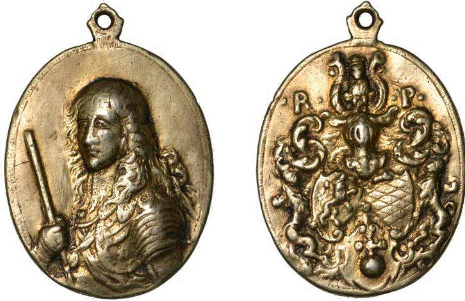
Lot 74: Prince Rupert, 1645, a silver-gilt medal or military reward

participated in them. For these projects the Platts drew primarily upon the collection of the Department of Coins and Medals at the British Museum, but also examined the collections held by the Ashmolean, Fitzwilliam and Hunterian Museums, the Museum of London, the National Museum of Scotland and the American Numismatic Society.