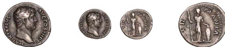
476 Hadrian , Denarius, 130-3, bare head right, rev. Germania standing left, holding spear and shield, 3.19g/6h (RIC II.3 1519; RSC 805; BMC 837). Good fine, toned and scarce £90-£120