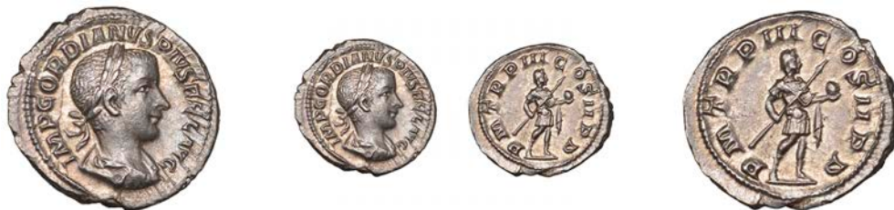
529 Gordian III , Denarius, laureate, draped and cuirassed bust right, rev. P M TR P III COS II P P, Gordian standing right, holding spear and globe, 2.85g/6h (RIC 115; RSC 243). About extremely fine, scarce £80-£100