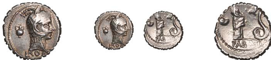
327 L. Roscius Fabatus , Denarius, c. 64, head of Juno Sospita right, wearing goat-skin headdress, amphora behind, L ROSC[ ] below truncation, rev. female standing right, feeding serpent, oil lamp to left, FABATI in exergue, 3.84g (Craw. 412/1 [symbols 3]; RSC Roscia 3). Off-centre, good very fine £150-£200