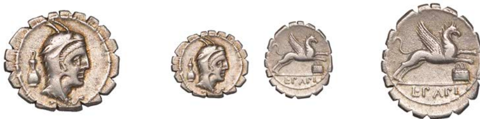
291 L. Papius , serrate Denarius, c. 79, head of Juno Sospita right wearing goatskin headdress, jug behind, rev. griffin springing right, two-handled basket below, L PAPI in exergue, 3.92g (Craw. 384/1 [symbols 108]; RSC Papia 1). Very fine £100-£120