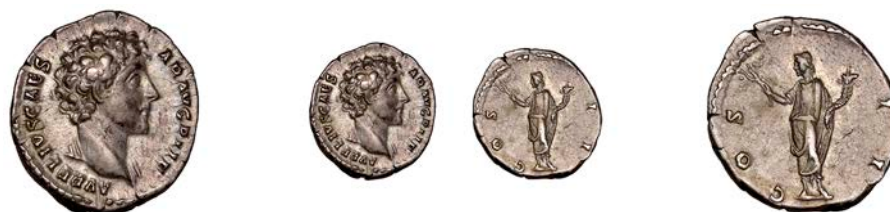
495 Marcus Aurelius (as Cæsar), Denarius, c. 145-60, draped bust right, rev. COS II, Honos standing left, holding branch and cornucopia, 3.00g/7h (RIC Antoninus Pius 429a; RSC 110). Very fine, toned £90-£120