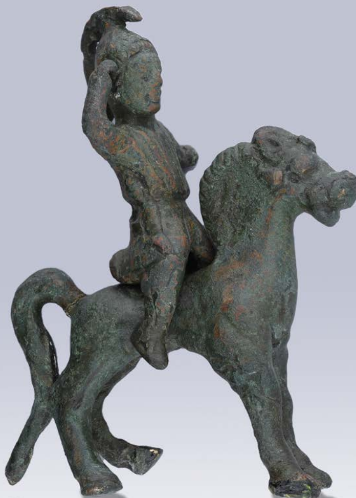
The Lissington Horse and Rider