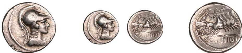
368 C. Considius Paetus , Denarius, 46, bust of Minerva right wearing Corinthian helmet, rev. Victory with palm branch in quadriga right, c CONSIDIVS in exergue, 3.85g (Craw. 465/5; RSC Considia 5). Nearly very fine, reverse good very fine £100-£120