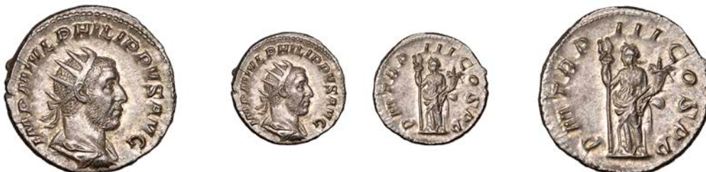
530 Philip I , Antoninianus, 247, radiate bust right, rev. PM TR P III COS PP, Felicitas standing left, holding caduceus and cornucopia, 4.33g/12h (RIC 3; RSC 124). Extremely fine, retaining some bloom £60-£80