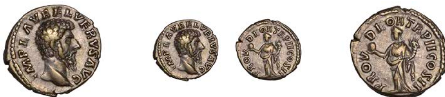
499 Lucius Verus , Denarius, 161-2, bare head right, rev. PROV DEOR TR P II COS II, Providentia standing left, holding globe and cornucopia, 3.44g/6h (RIC 482; RSC 155). Very fine £60-£80 Provenance: Bt Spink 1963