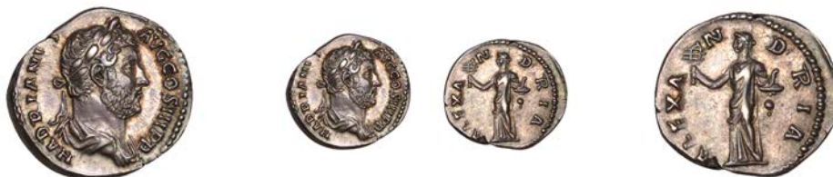
474 Hadrian , Denarius, 130-3, laureate and cuirassed bust right, rev. Alexandria standing left, holding sistrum and bowl containing serpent, 3.45g/7h (RIC II.3 1503; RSC 156b). Good very fine, attractively toned and very rare £240-£300