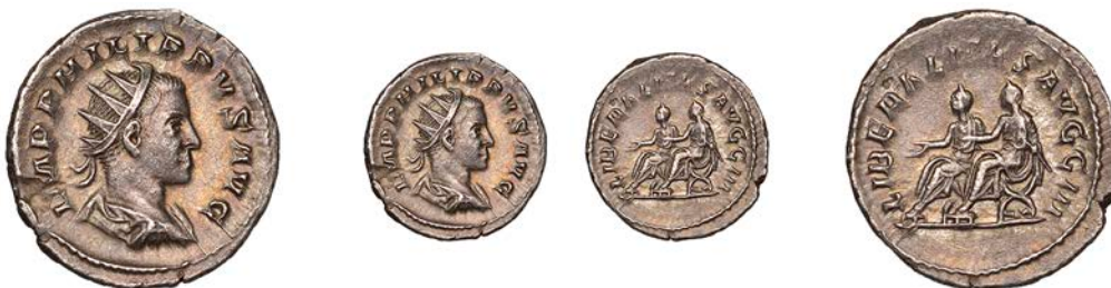
545 Philip I , Antoninianus, 247-9, radiate, draped and cuirassed bust right, rev. LIBERALITAS AVGG III, Philip the Arab and Philip II seated left on curule chairs, 3.58g/12h (RIC 230; RSC 17). Good very fine £50-£60