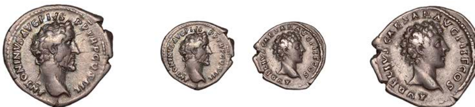
489 Antoninus Pius with Marcus Aurelius (as Cæsar), Denarius, 140, bare head of Pius right, rev. AVRELIVS CAESAR AVG P II F COS, bare head of Aurelius right, 3.26g/12h (RIC 415a; RSC 14; RCV 4524). Very fine, dark toned; both portraits clear