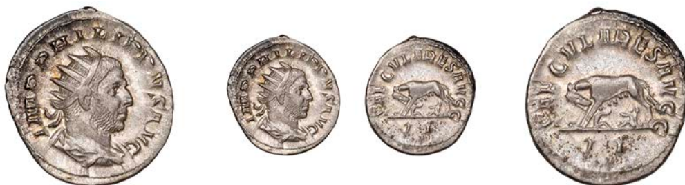
532 Philip I , Antoninianus, 248, radiate bust right, rev. SAEVLARES AVGG, she-wolf suckling twins, 4.30g/12h (RIC 15; RSC 178; RCV 8957). Good very fine £70-£90

Provenance: Reportedly from the Duke of Argyll Collection; bt Spink 1963