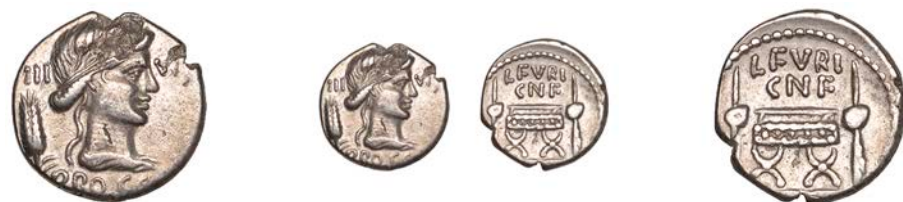
330 L. Furius Cn. f. Brocchus , Denarius, c. 63, head of Ceres right between wheat ear [and barley grain], III VIR in upper fields, BROCC[HI] below truncation, rev. curule chair between fasces, L FVRI CN F above, 3.50g (Craw. 414/1; RSC Furia 23). The barley grain off flan or omitted on this die (?), very fine but some obverse surface damage £100-£150