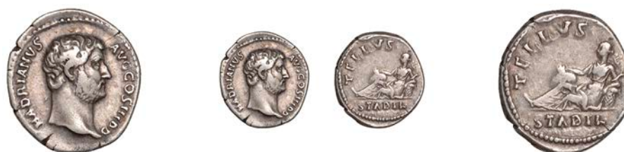
483 Hadrian , Denarius, 130-38, bare head right, rev. TELLVS STABIL, Tellus reclining left on basket of fruit, 3.12g/6h (RIC II.3 2051; RSC 1429; BMC 748). About very fine, scarce £90-£120