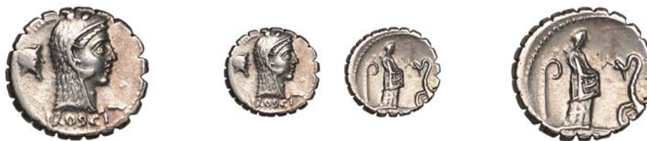
328 L. Roscius Fabatus , Denarius, c. 64, head of Juno Sospita right, wearing goat-skin headdress, bearded head behind, L ROSCI below truncation, rev. female standing right, feeding serpent, lituus to left, FABATI in exergue, 3.92g (Craw. 412/1 [symbols 182]; RSC Roscia 3). Light scratch in reverse field, good very fine £150-£200