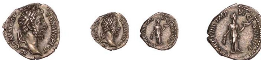
503 Commodus , Denarius, 183-4, laureate head right, rev. P M TRP VIII IMP VI COS III P P, Fides standing right, holding grain ears and basket of fruit, 3.01g/6h (RIC 75; RSC 448). Very fine, clear portrait £60-£80