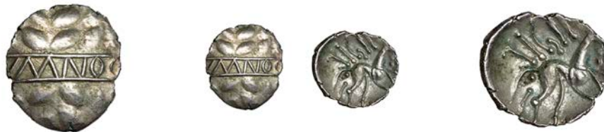
867 CORIELTAUVI, Dumnocoveros Tigirseno , silver Unit, [D]VMNOC on tablet across wreath pattern, rev. stylised horse right, TIGIR above, 1.24g/8h (O'Bee 1090; ABC 1974; BMC 3328-9; S 415). Reverse struck slightly off-centre, otherwise good very fine, extremely rare £400-£500