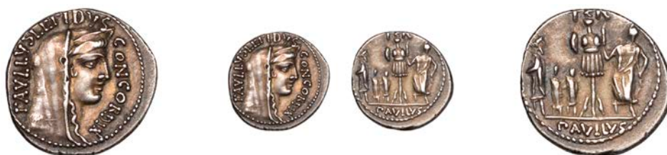
331 L. Aemilius Lepidus Paullus , Denarius, c. 62, veiled and diademed head of Concord right, PAVLLVS LEPIDVS CONCORDIA around, rev. trophy between three captives (King Perseus of Macedon and his two sons) standing right and Paullus standing left, PAVLLVS in exergue, 3.84g (Craw. 415/1; RSC Aemilia 10). Good very fine and toned £100-£120