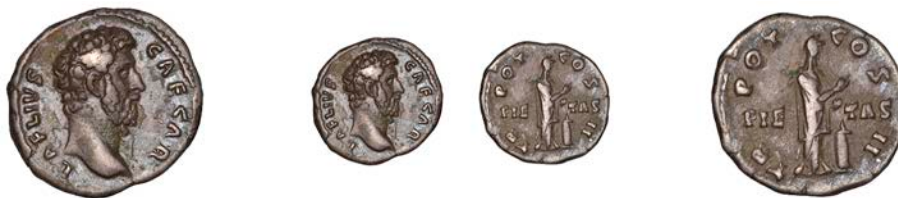
485 Ælius , Denarius, Rome, 137, bare head right, rev. TR POT COS II, Pietas standing right, dropping incense onto altar, PIETAS within field, 2.97g/6h (RIC II.3 2630; RSC 36). Some light surface deposits, very fine, toned