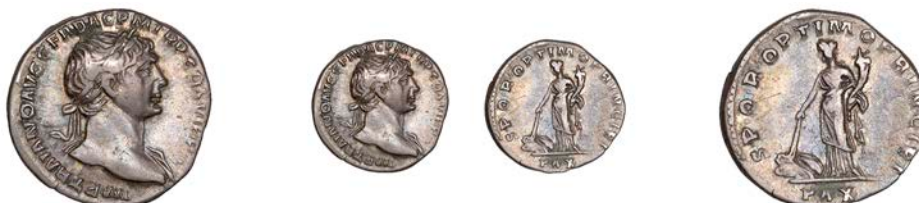
470 Trajan , Denarius, 112, laureate bust right, drapery on left shoulder, rev. SPQR OPTIMO PRINCIPI, Pax standing left, setting fire to pile of arms, 3.34g/7h (RIC 260; RSC 198). Very fine, toned £100-£120