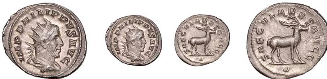
533 Philip I , Antoninianus, 248, radiate bust right, rev. SAEVLARES AVGG, antelope standing right, 3.76g/12h (RIC 19; RSC 182; RCV 8958). Good very fine, grey tone £60-£80