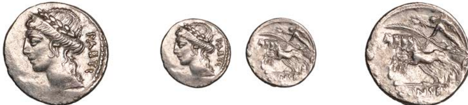
367 C. Considius Paetus , Denarius, 46, diademed and laureate head of Venus left PAETI behind, rev. Victory in quadriga left, [C C]ONSI[DI] in exergue, 3.81g (Craw. 465/4; RSC Considia 7). Of bright appearance, about very fine £100-£120