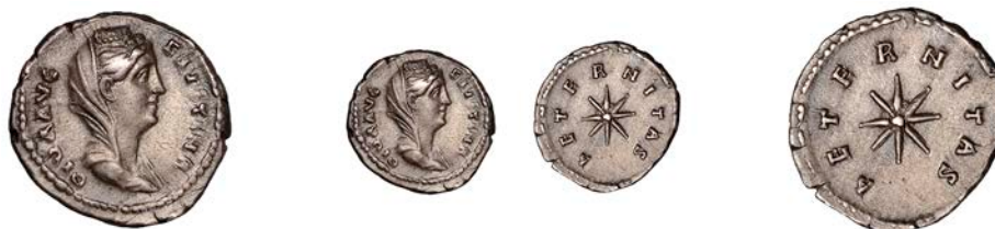
492 Diva Faustina Senior , Denarius, 141-61, veiled and draped bust right, rev. AETERNITAS, star of eight rays, 3.49g/1h (RIC Pius 355; RSC 63). Surfaces brushed, otherwise very fine, toned and rare £90-£120