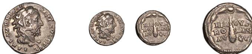
504 Commodus , Denarius, 192, head right wearing lion skin, rev. HERCVL ROMAN AVGV around club, all within wreath, 3.11g (RIC 251; RSC 190). Very fine £90-£120