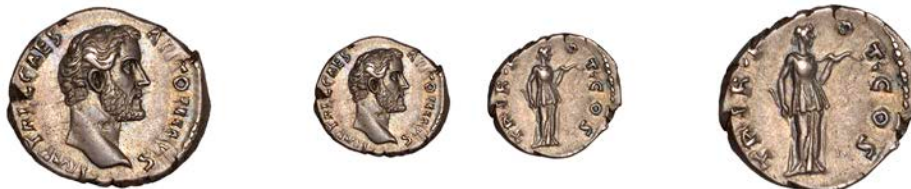
486 Antoninus Pius (as Cæsar), Denarius, 138, bare head right, rev. TRIB POT COS, Diana standing right, holding bow and arrow, 3.57g/6h (RIC II.3 2728; RSC 1058). Good very fine, attractively toned and scarce