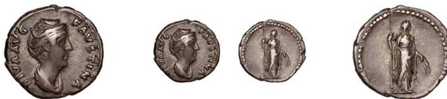
493 Diva Faustina Senior , Denarius, 146-61, draped bust right, hair bound up in pearls, rev. Ceres standing left, holding sceptre and grain ears, 3.26g/12h (RIC Pius 404b; RSC 297). About very fine, toned and rare £70-£90