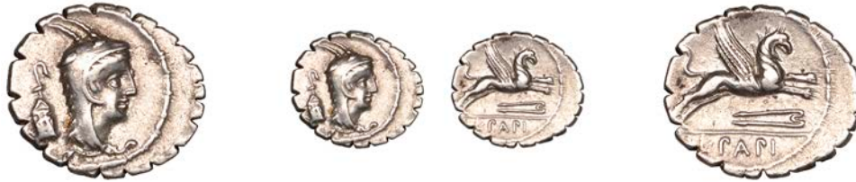
289 L. Papius , serrate Denarius, c. 79, head of Juno Sospita right wearing goatskin headdress, lantern (or incense-burner) behind, rev. griffin springing right, pincers below, L PAPI in exergue, 3.74g (Craw. 384/1 [symbols 68]; RSC Papia 1). Very fine £100-£120