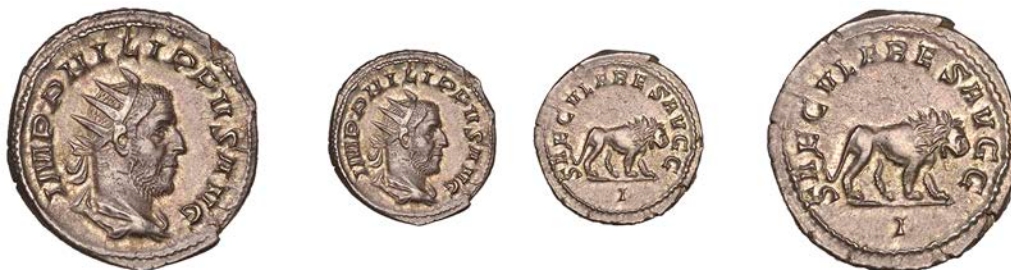
531 Philip I , Antoninianus, 248, radiate and draped bust right, rev. SAEVLARES AVGG, lion walking right, 4.13g/6h (RIC 12; RSC 173; RCV 8956). Good very fine £60-£80

Provenance: Reportedly from the Duke of Argyll Collection; bt Spink 1963