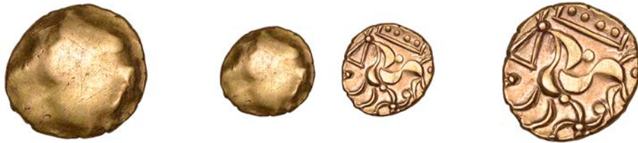
849 CORIELTAUVI , Early Uninscribed issues, Stater, Domino type, worn wreath pattern, rev. stylised horse left, box containing four pellets above, four-armed spiral below, 5.43g (O'Bee 5175; ABC 1758; BMC 3185-6; S 393). Well-centred on a round, rose-gold flan, better than very fine, rare £400-£500