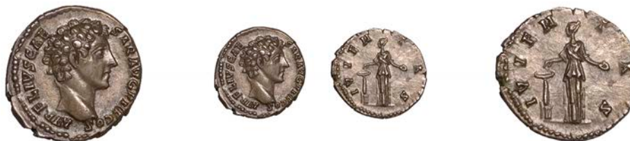
494 Marcus Aurelius (as Cæsar), Denarius, c. 140-44, bare head right, rev. IUVENTAS, Juventas standing left, dropping incense over cadelabrum, 3.43g/7h (RIC Antoninus Pius 423a; RSC 389). Extremely fine, toned £150-£180