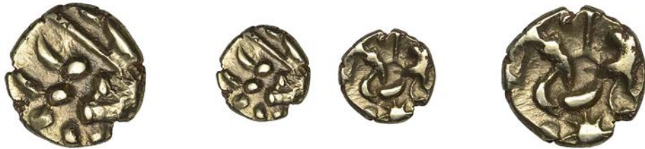
848 CORIELTAUVI , Early Uninscribed series, Stater, South Ferriby type, wreath pattern, rev. stylised horse left on ground line, 'anchor' shape above, eight-pointed star below, 5.34g (O'Bee 5018; ABC 1743; BMC 3148ff; S 390). Very fine, compact flan £240-£300