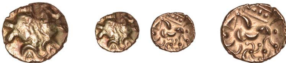
850 CORIELTAUVI , Early Uninscribed issues, plated Stater, Domino type, worn wreath pattern, rev. stylised horse left, box containing four pellets above, four-armed spiral below, 5.30g (cf. O'Bee 5175; ABC 1758; BMC 3185-6; S 393). Much residual plating, toned, very fine and rare £300-£360