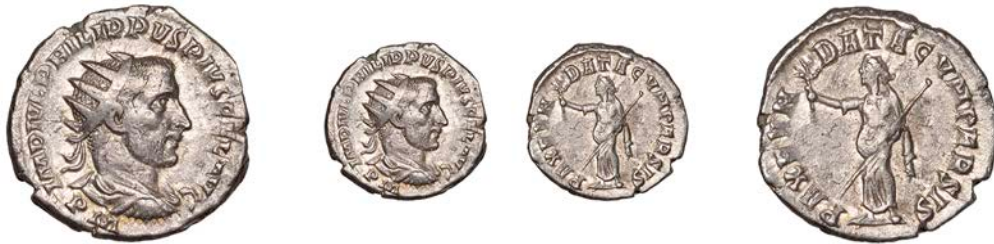
542 Philip I , Antoninianus, Antioch, 244-5, radiate and draped bust right, rev. PAX FVNDATA CVM PERSIS, Pax standing left with branch and transverse sceptre, 4.52g/12h (RIC 72; RSC 114). Good very fine, rare £80-£100