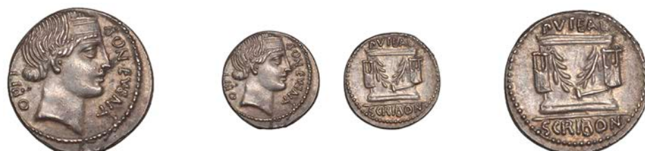
332 L. Scribonius Libo , Denarius, c. 62, diademed head of Bonus Eventus right, BON EVENT before, LIBO behind, rev. Scribonian wellhead decorated with garland and two lyres, hammer at base, PVTEAL above, SCRIBON in exergue, 3.88g (Craw. 416/1a; RSC Scribonia 8a). Obverse slightly off-centre, otherwise good very fine and toned £150-£200