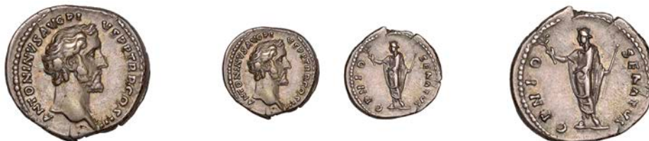
487 Antoninus Pius , Denarius, 141-3, bare head right, rev. GENIO SENATVS, Genius standing left, holding branch and sceptre, 3.26g/6h (RIC 69; RSC 398). Good very fine, attractively toned