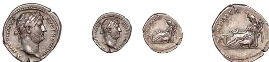
473 Hadrian , Denarius, 130-3, laureate bust right, drapery on far shoulder, rev. Africa reclining left, holding scorpion and cornucopia, basket of corn-ears at feet, 2.97g/6h (RIC II.3 1494; RSC 138; BMC 820). Very fine, strong portrait and attractively toned £120-£150