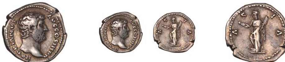
475 Hadrian , Denarius, 130-3, bare-headed bust right, rev. Asia standing left, foot on prow, holding reaping hook and rudder, 3.23g/6h (RIC II.3 1507; RSC 188; RCV 3462). About very fine, scarce £90-£120