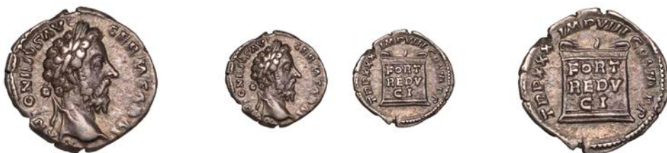
496 Marcus Aurelius , Denarius, 176, M ANTONINVS AVG GERM SARM, laureate head right, rev. TR P XXX IMP VIII COS III P P, lighted altar inscribed FORT REDV CI, 3.31g/6h (RIC 360; RSC 939). Very fine, dark patina; the type very rare £200-£260 Provenance: SCMB January 1966 (A86)