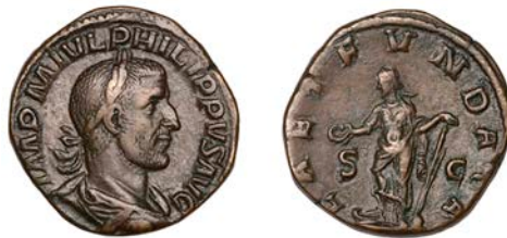
544 Philip I , Sestertius, laureate and draped bust right, rev. LAET FVNDATA, Laetitia standing left on ship's prow holding patera and rudder, 20.12g/12h (RIC 176a; RCV 8998). Strong very fine, brown patina £70-£90

Provenance: First bt Seaby 1964; second SNC April 1962 (2938)