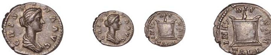
505 Crispina , Denarius, 178-82, draped bust right, rev. DIS GENI TALV BVS, lighted altar, 2.79g/6h (RIC Commodus 281; RSC 15; RCV 5999). Trace of surface porosity, very fine, toned and scarce £60-£80