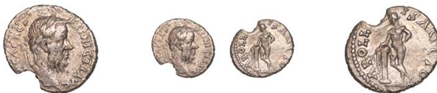
685 Pescennius Niger , Denarius, Antioch, 194, laureate head right, rev. Apollo leaning on column and holding laurel branch in hand, 2.08g (RIC 2a; RSC 3; RCV 6100). Chipped, otherwise very fine and rare £120-£150