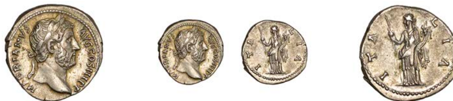
479 Hadrian , Denarius, c. 134-8, laureate bust right, rev. Italia standing left, holding sceptre and cornucopiae, 3.45g/6h (RIC II.3 1540; RSC 869; BMC 853-4). Good very fine £150-£180