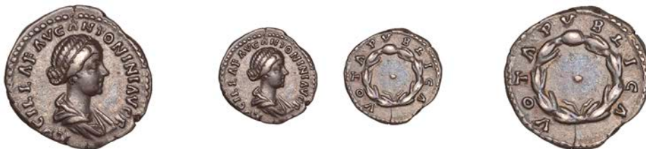
501 Lucilla , Denarius, 164-80, draped bust right, hair tied up in bun, rev. VOTA PVBLICA around laurel wreath, pellet in middle, 3.26g/6h (RIC 792; RSC 99). Hairline flan split at 12 o'clock terminating within the legend, otherwise very fine, attractively toned £120-£150