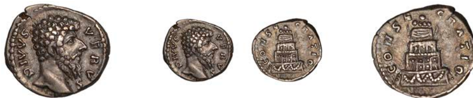
500 Divus Lucius Verus , Denarius, after 169, bare head right, rev. CONSECRATIO, crematorium of four tiers, surmounted by quadriga, 3.28g/12h (RIC Marcus Aurelius 596b; RSC 58). Very fine £60-£80 Provenance: Bt Seaby 1973