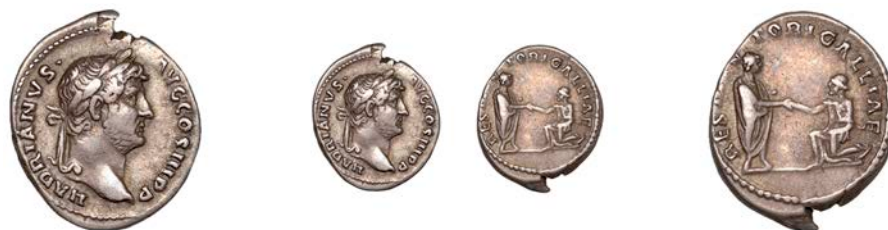
482 Hadrian , Denarius, 130-3, laureate head right, rev. RESTITVTORI GALLIAE, Hadrian standing right, holding volumen, about to raise Gallia who is kneeling left, 3.49g/6h (RIC II.3 1573; RSC 1257; BMC 879-80). About very fine, toned and scarce £120-£150