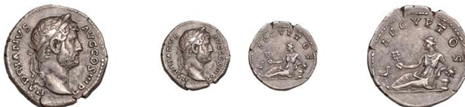
472 Hadrian , Denarius, 130-3, laureate head right, rev. Ægyptos reclining left, holding up sistrum, ibis in front, 3.17g/6h (RIC II.3 1481; RSC 100; BMC 801-4). A few light marks, very fine and toned £120-£150