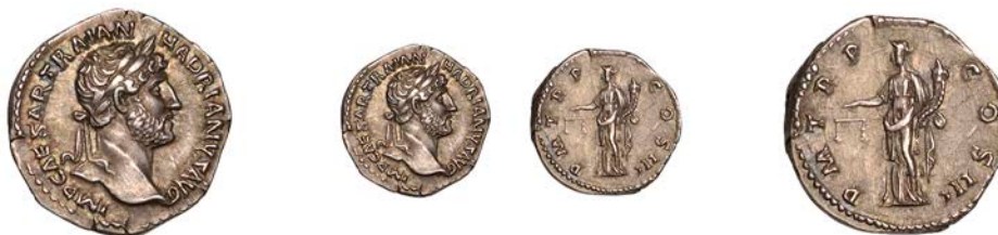
471 Hadrian , Denarius, 120-1, laureate head right, rev. P M TR P COS III, Aequitas-Moneta standing left, holding scales and cornucopia, 3.24g/7h (RIC II.3 385; RSC 1120; BMC 152). About extremely fine, toned £150-£180