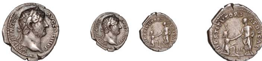
481 Hadrian , Denarius, 130-3, laureate head right, rev. RESTITVTORI AFRICAE, Hadrian standing left, holding volumen, about to raise Africa who is kneeling right, holding grain ears and wearing elephant skin headdress; between them, stalks of grain, 3.05g/6h (RIC II.3; 1569; RSC 1229; BMC 871-3). Area of smoothing at 1 o'clock, about very fine £60-£80