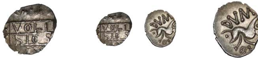
868 CORIELTAUVI, Volisios Dumnocoveros , silver Unit, VOLI SIO in two lines on tablet across wreath pattern, rev. stylised horse right, DVM[NO]CO around, 1.11g/3h (O'Bee 5239; ABC 1983; BMC 3339; S 417). Reverse struck slightly off-centre, otherwise good very fine, lightly toned and excessively rare £300-£360