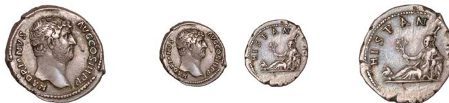
478 Hadrian , Denarius, 130-3, bare head right, rev. Hispania reclining left on rocks, holding branch, rabbit by feet, 3.28g/7h (RIC II.3 1535; RSC 822; BMC 846-7). Very fine, attractively toned £200-£260