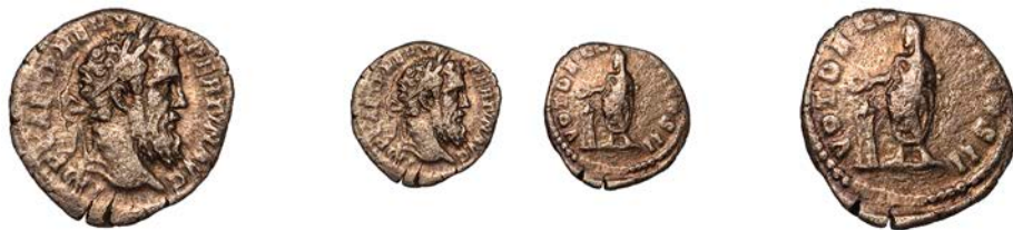
681 Pertinax , Denarius, 193, laureate head right, rev. VOT DECEN TR P COS II, emperor standing left, holding patera over tripod, 3.06g (RIC 13; RSC 56). Some surface porosity, otherwise about very fine £200-£260