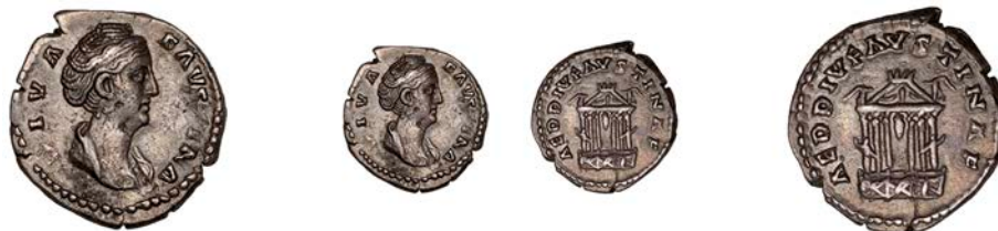
491 Diva Faustina Senior , Denarius, 146-61, draped bust right, hair bound up in pearls, rev. AED DIV FAVSTINAE, hexastyle temple, 3.29g/12h (RIC Pius 343; RSC 1). Small pit on cheek, otherwise very fine, toned £70-£90