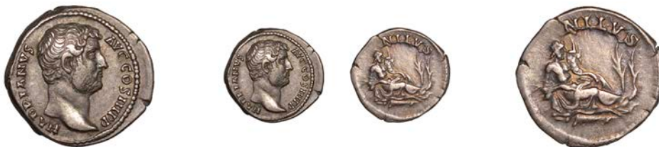
480 Hadrian , Denarius, 130-3, bare-headed bust right, rev. Nilus reclining right holding reed and cornucopia, crocodile below, reeds by feet, 3.33g (RIC II.3 1544; RSC 991e; BMC 865). Very fine, toned and scarce £150-£180