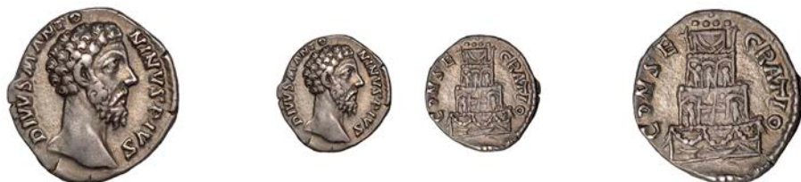
497 Divus Marcus Aurelius , Denarius, after 180, bare head right, rev. CONSECRATIO, crematorium of four tiers, surmounted by quadriga, 3.15g/12h (RIC Commodus 275; RSC 97). Very fine, lightly toned, scarce £90-£120 Provenance: Bt Baldwin 1972