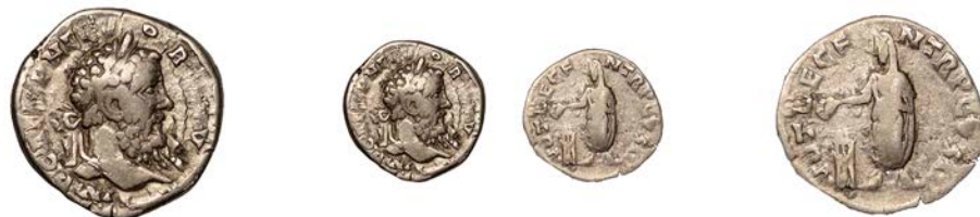
682 Pertinax , Denarius, 193, laureate head right, rev. VOT DECEN TR P COS II, emperor standing left, holding patera over tripod, 3.57g (RIC 13; RSC 56). Good fine £200-£260