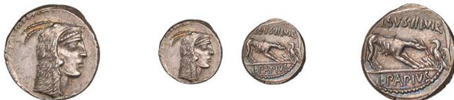
369 L. Papius Celsus , Denarius, 45, head of Juno Sospita right, wearing goat-skin headdress, rev. she-wolf standing right, placing stick on fire, to right, eagle standing left, fanning the flames, [CE]LSVS III VIR above, L PAPIVS in exergue, 3.67g (Craw. 472/1; RSC Papia 2). Extremely fine and lightly toned £200-£300