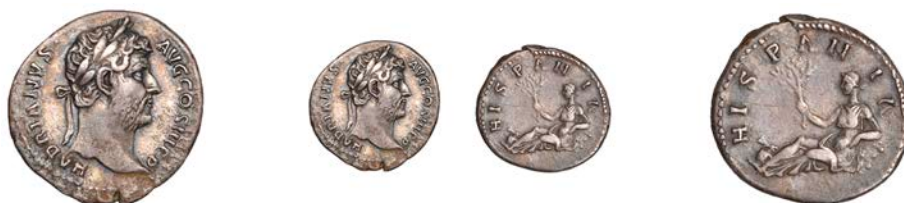
477 Hadrian , Denarius, 130-3, laureate head right, rev. Hispania reclining left on rocks, holding branch, rabbit by feet, 3.02g/7h (RIC II.3 1533; RSC 830; BMC 849). Very fine, toned £150-£180