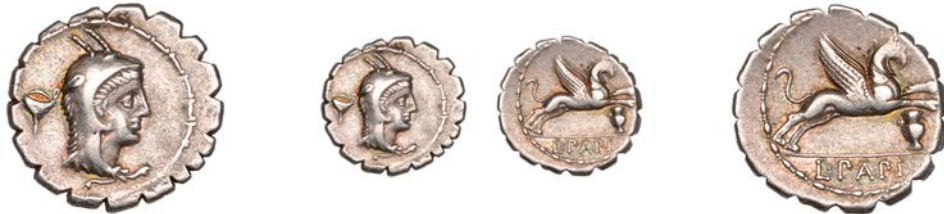
290 L. Papius , serrate Denarius, c. 79, head of Juno Sospita right wearing goatskin headdress, filter (?) behind, rev. griffin springing right, amphora below, L PAPI in exergue, 3.98g (Craw. 384/1 [symbols 99]; RSC Papia 1). Very fine £100-£120