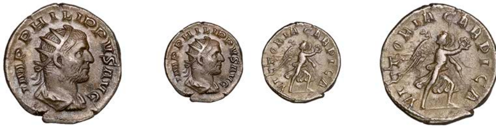
541 Philip I , Antoninianus, 247, radiate and draped bust right, rev. VICTORIAE CARPICA, Victory advancing right, holding wreath and palm frond, 3.34g/12h (RIC 66; RSC 238; RCV 8973). Very fine and toned; the reverse type rare and of historical interest £120-£150