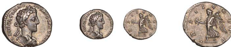
502 Commodus , Denarius, 177, laureate, draped and cuirassed bust right, rev. TR P II COS P P, Victory advancing left, holding wreath and palm frond, 3.40g/6h (RIC Marcus Aurelius 642; RSC 745). Very fine, toned £70-£90