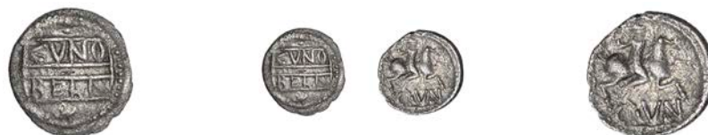
872 CATUVELLAUNI, Cunobelin , silver Unit, Horseman type, CVNO BELI on two tablets within beaded circle, rev. horseman right, CVN below, 1.22g/10h (ABC 2858; BMC -; S 302). Granular surfaces, good fine, rare £120-£150