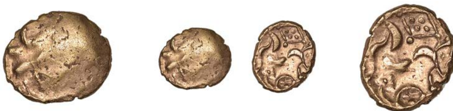
851 CORIELTAUVI , Early Uninscribed issues, Stater, Kite/Wheel type, wreath pattern, rev. stylised horse left, 'kite' shape containing four pellets above, wheel and three pellets below, 5.23g (cf. O'Bee 5174; ABC –; CCI 04.0842; S 392). Good fine, the variety very rare £300-£360