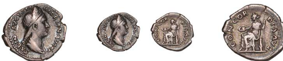
484 Sabina , Denarius, 130-3, diademed and draped bust right wearing stephane, rev. Concordia seated left, 3.38g/6h (RIC II.3 2504; RSC 12; BMC 905-6). Good fine £60-£80