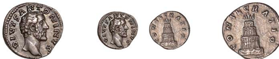
490 Divus Antoninus Pius , Denarius, 161, bare head right, rev. CONSECRATIO, crematorium of four tiers, surmounted by quadriga, 3.36g/1h (RIC 436; RSC 164a). Good very fine, dark tone