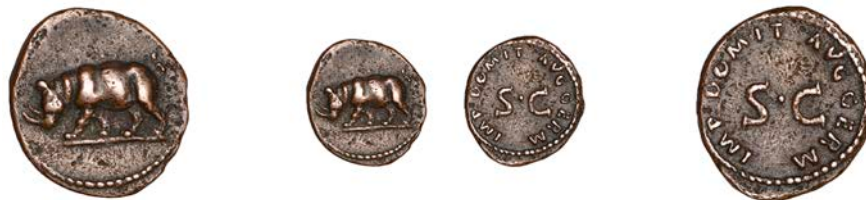
469 Domitian , Quadrans, Rome, 84-5, rhinoceros walking left, rev. IMP COMIT AVG GERM, large SC, 2.20g/6h (RIC 250). Light porosity, very fine, brown patina £90-£120