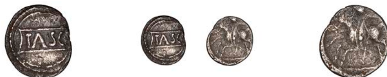
870 CATUVELLAUNI, Tasciovanus , silver Unit, Cavalryman type, TASC in panel within plain field, rev. warrior on horseback left, 1.15g/12h (ABC 2640; BMC 1677-9; S 238). Granular surfaces, fine, rare £90-£120