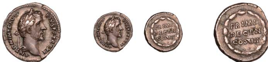
488 Antoninus Pius , Denarius, 147-8, laureate head right, rev. PRIMI DECEM COS IIII in three lines within wreath, 3.24g/5h (RIC 171a; RSC 670). Very fine, toned and scarce