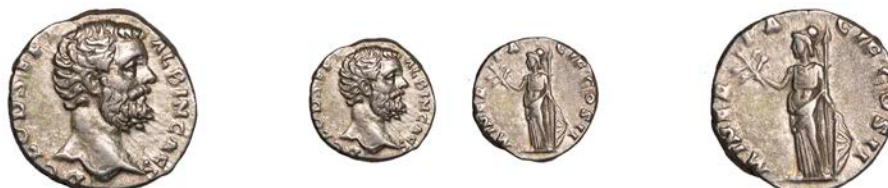
506 Clodius Albinus (as Cæsar), Denarius, 194-5, bare head right, rev. MINER PACIF COS II, Minerva standing left, holding olive branch and shield, 3.07g (RIC 7; RSC 48; RCV 6144). Good very fine £200-£260