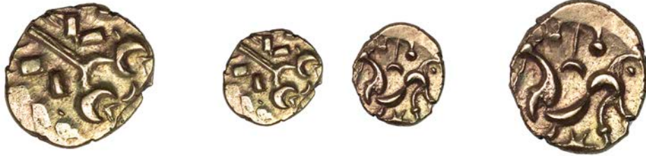
847 CORIELTAUVI , Early Uninscribed series, Stater, South Ferriby type, wreath pattern, rev. stylised horse left, 'anchor' shape above, six-pointed star below, 5.63g (O'Bee 1015; ABC 1743; BMC 3148ff; S 390). Reverse struck off-centre, good very fine, toned £300-£360