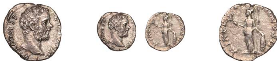
687 Clodius Albinus (as Cæsar), Denarius, 194-5, bare head right, rev. Minerva standing left, holding olive branch and shield, 2.77g (RIC 7; RSC 48; RCV 6144). Very fine, portrait better £100-£120