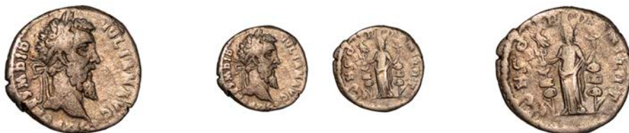
683 Didius Julianus , Denarius, 193, laureate head right, rev. Concordia standing left, holding two standards, 2.68g (RIC 1; RSC 2; RCV 6072). Good fine £240-£300