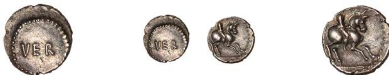
869 CATUVELLAUNI, Tasciovanus , silver Unit, Regal Rider type, VER in field, pellet border around, rev. king on horseback right, 1.33g/4h (ABC 2625; BMC 1674-6; S 234). Slightly off-centre, otherwise better than very fine, rare £120-£150