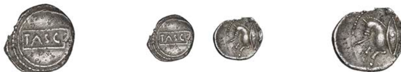
871 CATUVELLAUNI, Tasciovanus , silver Unit, Cavalryman type, TASC in panel within plain field, rev. warrior on horseback left, 1.15g/12h (ABC 2640; BMC 1677-9; S 238). Reverse struck slightly off-centre and with some light pitting, very fine, rare £90-£120