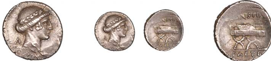
366 C. Considius Paetus , Denarius, 46, laureate head of Apollo right, A behind, rev. wreath on curule chair, [C CO]NSIDI above, PAETI in exergue, 3.72g (Craw. 465/2a; RSC Considia 2). About very fine, toned £100-£120