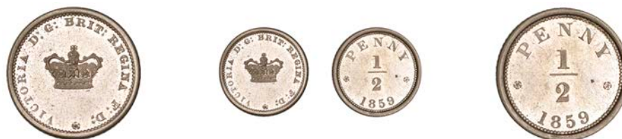
411 Pattern Decimal Halfpenny, 1859, unsigned, in cupro-nickel, crown, rev. value, edge incusely dotted, 2.48g/12h (F 745 [not in Sale]; BMC 2037). Minor spotting, otherwise brilliant and practically as struck, extremely rare

Provenance: A Collection of British Coins sold on behalf of the Royal Flying Corps Veterans Association, DNW Auction 138, 21 September 2016, lot 965