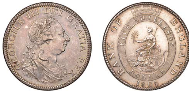
319 Dollar, 1804, types E/2, no stop after REX (ESC 1951; S 3768). Graffiti below bust, otherwise about extremely fine