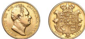
G 347 Sovereign, 1832, second bust (M 17; S 3829B). Good fine, cleaned