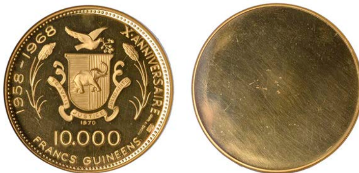
978 Republic , 10,000 Francs, 1970, a uniface trial strike of the rev. in gilt-brass (cf. KM 20). Virtually as struck, very rare [slabbed NGC PF 67 Ultra Cameo] £400-£500