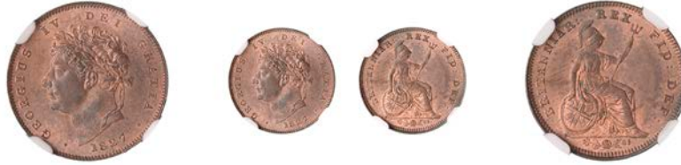
345 Third-Farthing, 1827 (BMC 1453; S 3827). Good extremely fine with original colour [slabbed NGC MS 64 RB]