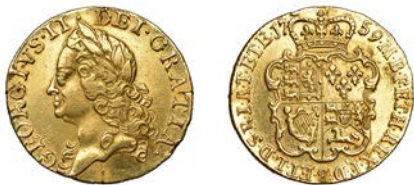
282 Guinea, 1759 (EGC 622; S 3680). Lightly polished, traces of mounting on edge, otherwise very fine