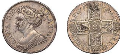
271 Shilling, 1711, fourth bust (ESC 1408; S 3618). Some haymarking, particularly on queen's face, very fine