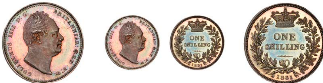
349 Proof Shilling, 1831, edge plain, 5.67g/6h (ESC 2488; S 3835). Lightly brushed, otherwise about as struck, toned