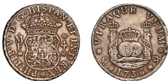
1049 Philip V , 4 Reales, 1736 MF , Mexico City, 13.21g/12h (CCT 897; Cayón 9099). Lightly cleaned, otherwise good very fine