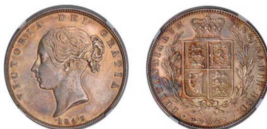
384 Halfcrown, 1843 (ESC 2718; S 3888). Cleaned, otherwise about extremely fine, rare [slabbed NGC AU Details, Cleaned] £1,000-£1,200