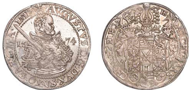
947 SAXONY, August , Thaler, 1574 HB , Dresden, 29.16g/9h (Schnee 725; Dav. 9798). Lightly cleaned, good very fine £200-£260