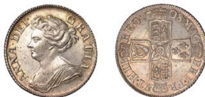
268 Shilling, 1708, third bust (ESC 1399; S 3610). Good extremely fine, lightly toned