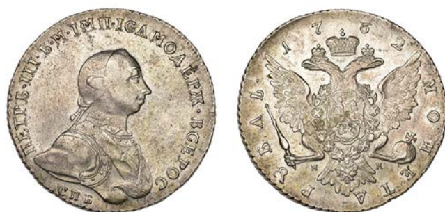
1115 Peter III , Rouble, 1762 Н , St Petersburg, edge grained right, 24.38g/12h (Bit. 11; Diakov 7; Dav. 1682). About extremely fine, scarce