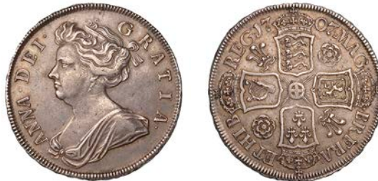
265 Halfcrown, 1707, roses and plumes, edge SEXTO (ESC 1365; S 3582). A few light marks, otherwise good very fine, toned