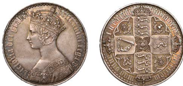
378 'Gothic' Crown, 1847, edge UNDECIMO (ESC 2571; S 3883). Small edge bruise, otherwise good very fine, toned