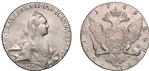
1119 Catherine II , Rouble, 1769CA, St Petersburg, 20.62g/12h (Bit. 206; Dav. 1684). Cleaned, otherwise very fine