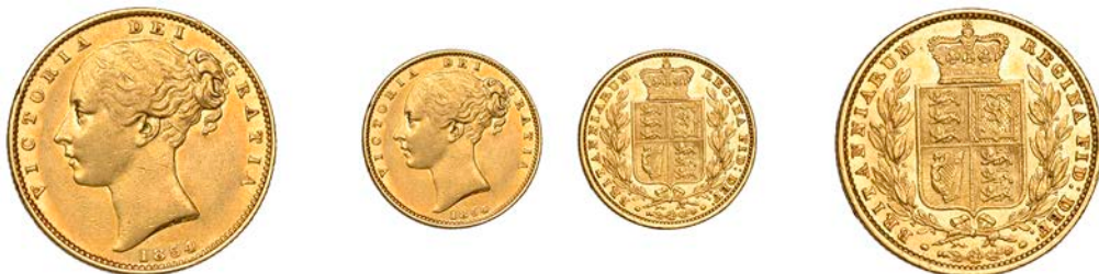
G 370 Sovereign, 1854, ww incuse (M 37; S 3852D). Good very fine