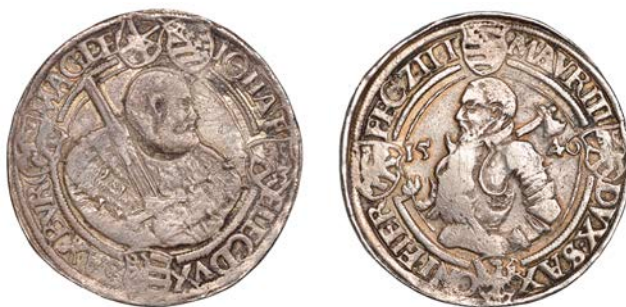
942 SAXONY, Johann Friedrich and Moritz , Thaler, 1546, Buchholz, 28.36g/11h (Schnee 117; Dav. 9736). Scratched and tooled in places, otherwise very fine £300-£400