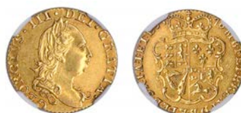
296 Half-Guinea, 1776, fourth bust, stop after GRATIA (EGC 817; S 3734). About extremely fine [slabbed NGC AU 55]

Provenance: A Small Collection of Gold Coins, the Property of a Gentleman