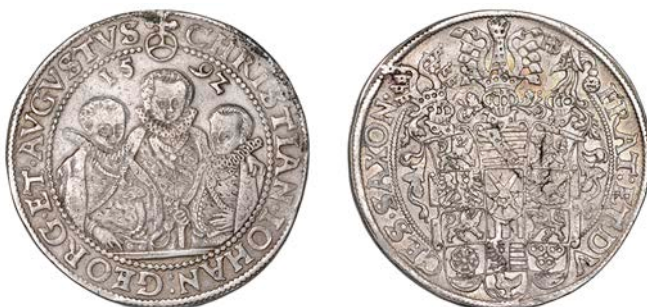
950 SAXONY, Christian II, Johann Georg and August , Thaler, 1592 HB , Dresden, 29.05g/4h (Schnee 754; Dav. 9820). Very fine £150-£180