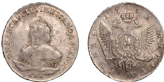
1114 Elizabeth , Rouble, 1751 И , St Petersburg, 25.15g/12h (Bit. 267; Diakov 244; Dav. 1677). Very fine