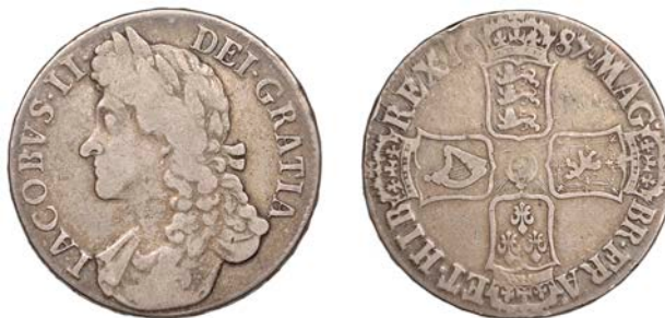
249 Crown, 1687, second bust, edge TERTIO (ESC 743; S 3407). Fine