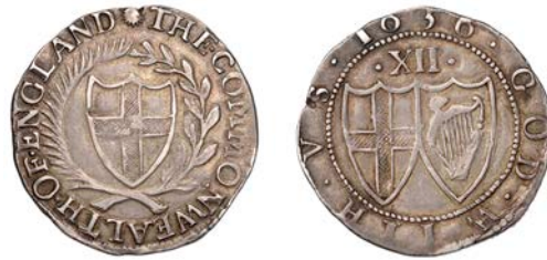
232 Shilling, 1656, mm. sun on obv. only, no stops by mint mark, 5.99g/2h (ESC 153; N 2724; S 3217). Better than very fine, attractively toned; the variety very rare