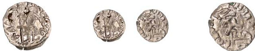
x 1104 WALLACHIA, Mihail I (1418-20), Ducat, ΙΜΜ ΧΑΛΒΟ, rev. ΙΜΜΧ ΑΛΒΟΙ, 0.34g/7h (MBR 224). Very fine £100-£120