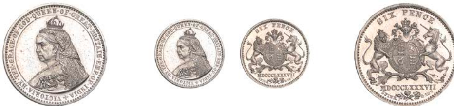
389 Pattern Sixpence, 1887, by J. Rochelle Thomas for Spink, in aluminium, crowned bust left, rev. crowned arms and supporters, SPINK & SON below, edge plain, 0.75g/6h (ESC 3307). Some obverse surface marks, otherwise about extremely fine, extremely rare