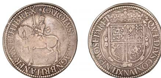
588 Third coinage, Briot's issue, Thirty Shillings, mm. flower on obv. , thistle head on rev. , signed b both sides, 14.48g/6h (Bull 6; Murray p.133 & pl. iii, 14; SCBI 35, 1427-9; B 6, fig. 1006; S 5553). Fine £200-£260