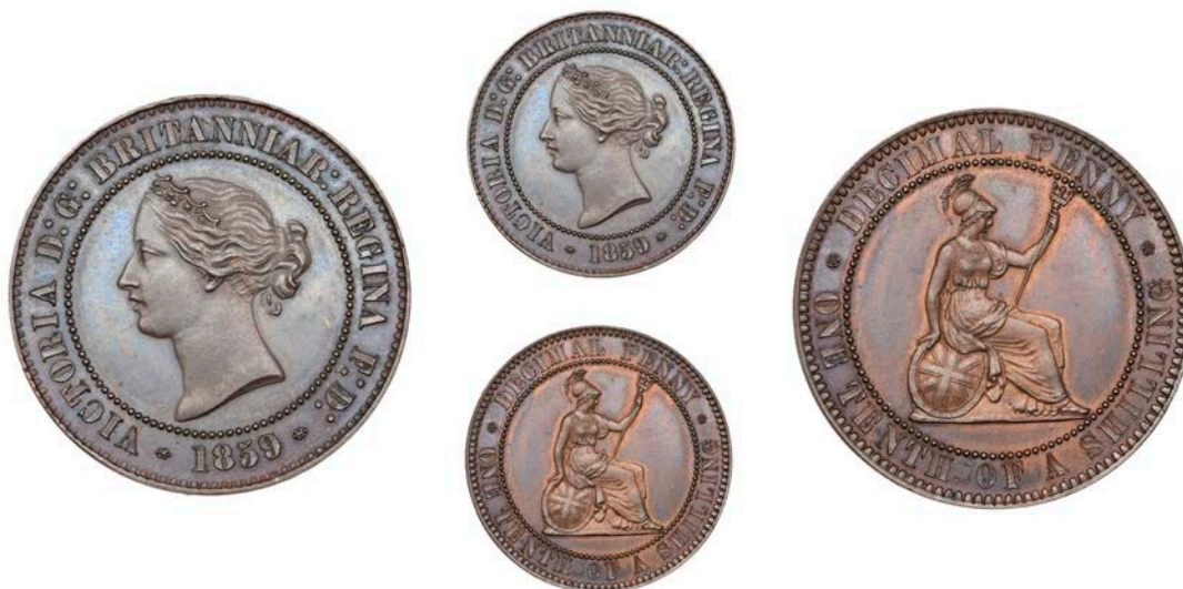
410 Pattern Decimal Penny, 1859/7, by L.C. Wyon and J. Wyon, in nickel-bronze, bust left with jewelled diadem, recut ornaments flanking date, rev. Britannia seated right, DECIMAL PENNY above, ONE TENTH OF A SHILLING below, edge plain, 9.07g/12h (F 685, recté nickel-bronze; BMC 1980; cf. Norweb II, 675). Virtually as struck with a hint of original colour on reverse, extremely rare

Provenance: DNW Auction 79, 24 September 2008, lot 4038