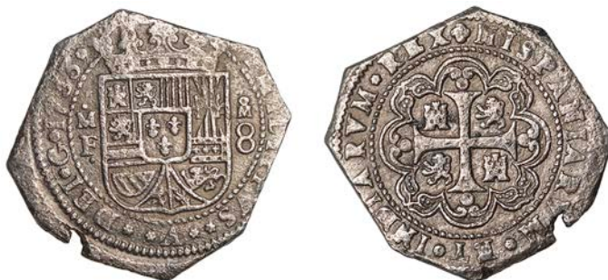
1042 Philip V , 8 Reales, 1733 MF , Mexico City, 23.64g/12h (CCT 690; Cayón 9359). Waterworn, otherwise good very fine £400-£500 Provenance: From the wreck of the Hollandia (sunk in 1743)