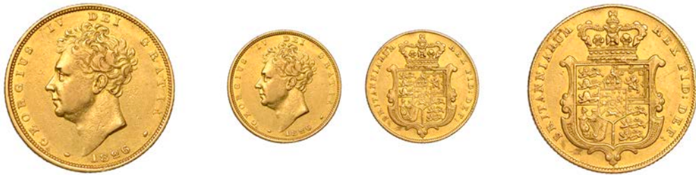
G 338 Sovereign, 1826 (M 11; S 3801). Lightly cleaned, very fine