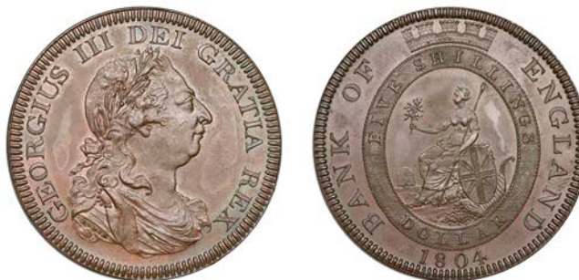
320 Proof Dollar, 1804, in copper, types E/2, on a thick flan, edge plain, 35.93g/6h (L & S 79; ESC 1956; Selig 1240). Some minor adhesion, otherwise good extremely fine, very rare