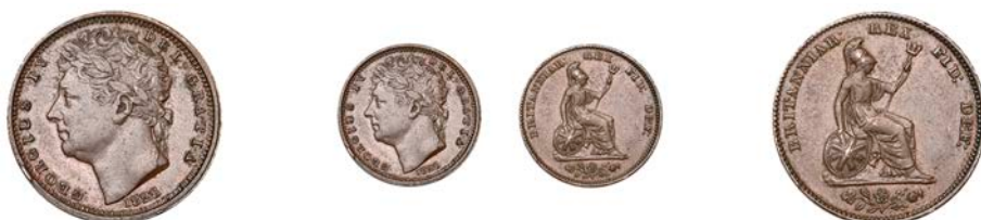
343 Half-Farthing, 1828 (BMC 1446; S 3826). About extremely fine