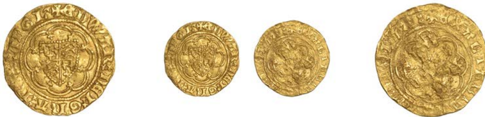
143 Treaty period, Quarter-Noble, London, double saltires after GLORIA, curule x, 1.61g/3h (SCBI Schneider 90-1; Stewartby B1; N 1243; S 1510). Struck from a heavily worn reverse die, otherwise very fine £300-£360