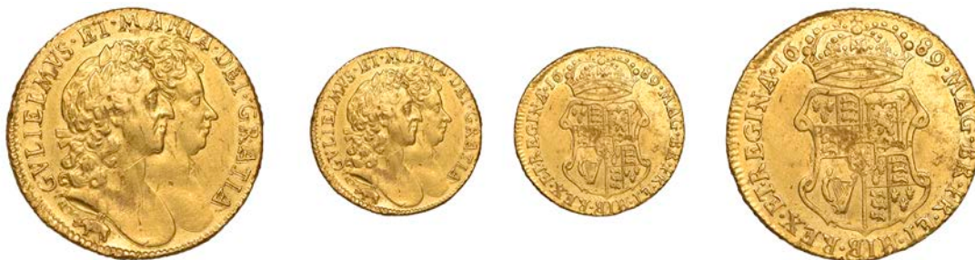
252 Guinea, 1689, elephant and castle (EGC 361; S 3427). Surfaces a little marked, otherwise good very fine, rare