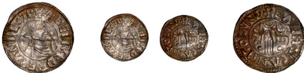
x 57 Penny, Second Hand type, London, Ealhstan, EALHSTAN M-O LVND, 1.49g/3h (BEH –; N 768; S 1146). Nearly very fine but crimped and cracked through centre £150-£200

Provenance: W.C. Wells Collection; F. Elmore Jones Collection, Glendining Auction, 12-13 May 1971, lot 743; Lord Stewartby Collection, Part I, Spink Auction 234, 22 March 2016, lot 220