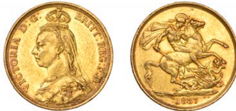
G 362 Two Pounds, 1887, large date (Hill T26; S 3865). Some contact marks, otherwise good very fine