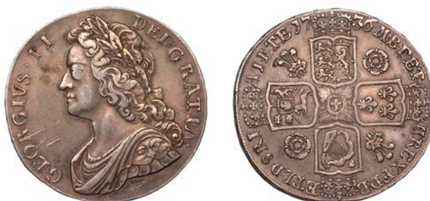
285 Crown, 1736, roses and plumes, edge NONO (ESC 1664; S 3686). Small scrapes in obverse field, otherwise very fine