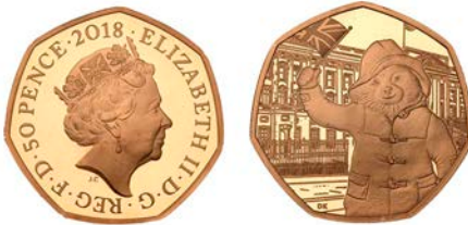
G 495 Proof Fifty Pence, 2018, in gold , Paddington Bear (S H59). Brilliant, as struck; in de-luxe case of issue with certificate £600-£800