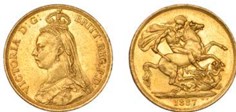
G 363 Two Pounds, 1887, large date (Hill T26; S 3865). Some contact marks, otherwise good very fine