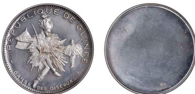
980 Republic , 500 Francs, [1969], a uniface trial strike of the obv. in silvered-brass (cf. KM 16). Virtually as struck, very rare [slabbed NGC PF 66 Ultra Cameo] £400-£500