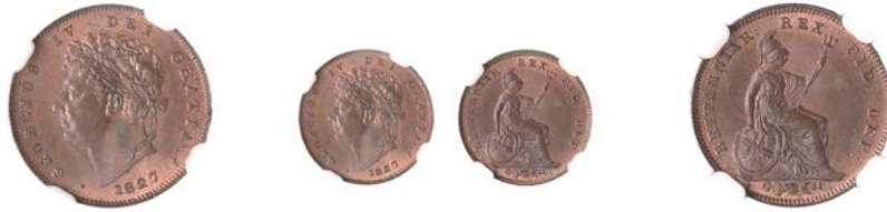
344 Third-Farthing, 1827 (BMC 1453; S 3827). Good extremely fine with original colour [slabbed NGC MS 65 BN]