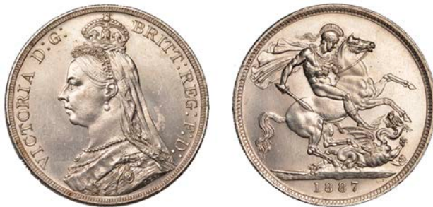
381 Crown, 1887 (ESC 2585; S 3921). Extremely fine £100-£120