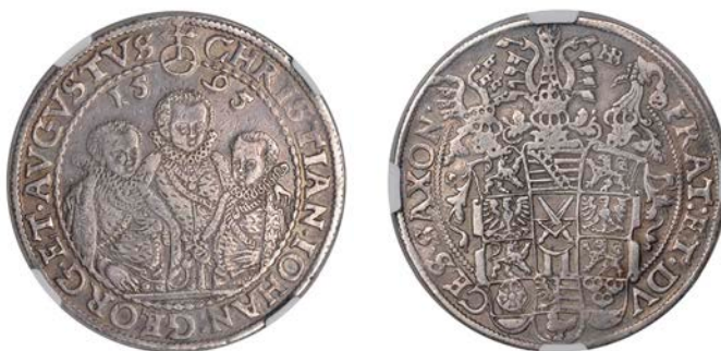
951 SAXONY, Christian II, Johann Georg and August , Thaler, 1595 HB , Dresden (Schnee 754; Dav. 9820). Very fine [slabbed NGC XF 45] £150-£180