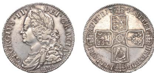
287 Halfcrown, 1746 LIMA, v over u in GEORGIVS, edge DECIMO NONO (ESC 1690; S 3695A). Lightly cleaned, otherwise good very fine, rare