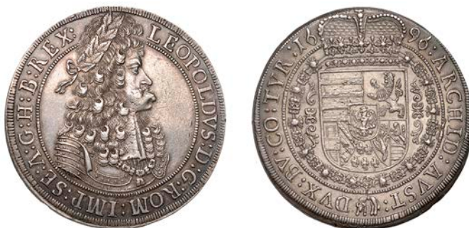
873 Leopold I , Thaler, 1696, Hall, 28.73g/12h (MT 755; Dav. 3245). About extremely fine