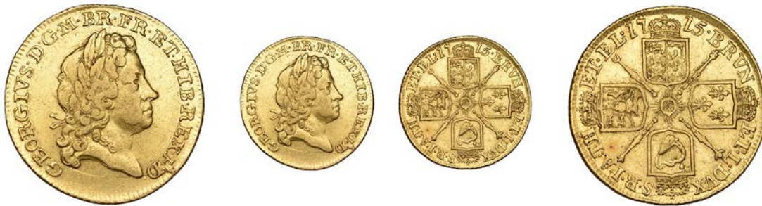
273 Guinea, 1715, third bust (EGC 503; S 3630). Almost very fine