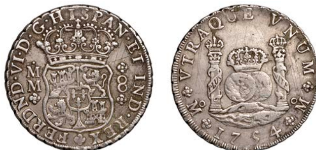
1053 Ferdinand VI , 8 Reales, 1754 MM , Mexico City, 26.96g/12h (CCT 294; Cayón 10595). Scratched, otherwise very fine £200-£260