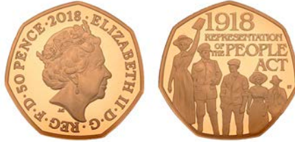
G 493 Proof Fifty Pence, 2018, in gold , Representation of the People Act (S H57). Brilliant, as struck; in de-luxe case of issue with certificate £600-£800