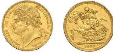
G 337 Sovereign, 1821 (M 5; S 3800). Surfaces scuffed and wiped, otherwise about extremely fine