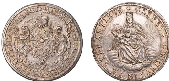
934 BAVARIA, Maximilian I , Thaler, 1626, 29.04g/12h (Dav. 6074A). Fields tooled, traces of mounting on edge, otherwise very fine £200-£260