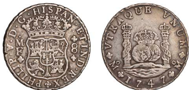
1048 Philip V , 8 Reales, 1747 MF , Mexico City, posthumous issue, 26.77g/12h (CCT 710; Cayón 9466). About very fine