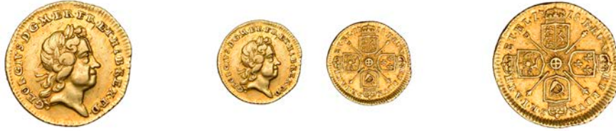
276 Quarter-Guinea, 1718 (EGC 550; S 3638). Good very fine