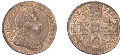
278 Shilling, 1723 ssc, first bust (ESC 1586; S 3647). About extremely fine