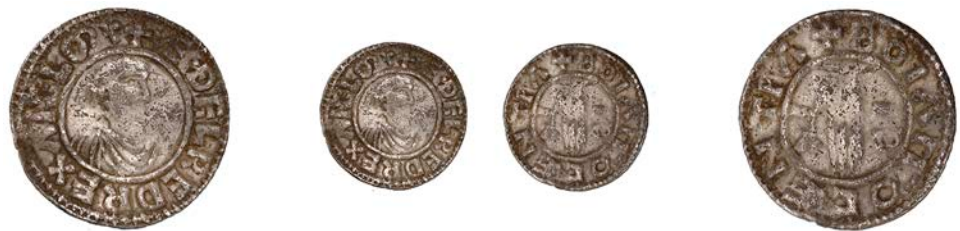
55 Penny, First Hand type, Canterbury, Boga, BOIA M o CÆNTPA, 1.48g/9h (BEH 132; N 766; S 1144). Fine