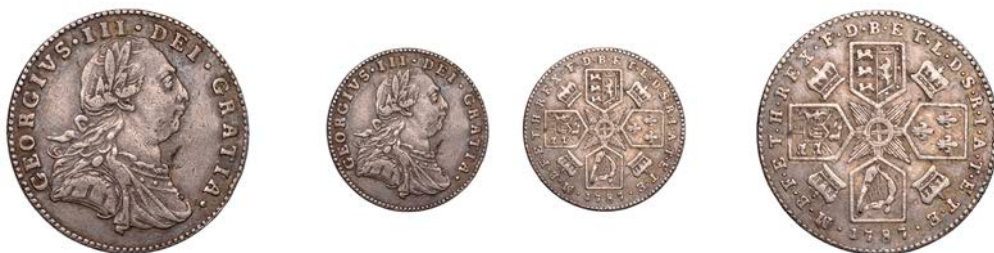
302 Proof or Pattern Sixpence, 1787, by L. Pingo, with semée of hearts, dotted borders, edge plain, 3.68g/12h (ESC 2212; Selig 1228). About very fine and toned, scarce