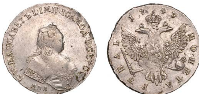
1113 Elizabeth , Rouble, 1743, Krasny, 25.77g/12h (Bit. 108ff; Diakov 52ff; Dav. 1678). Flan flaw to right of bust, otherwise very fine £300-£400

Provenance: DNW Auction 190, 6-7 April 2021, lot 1065