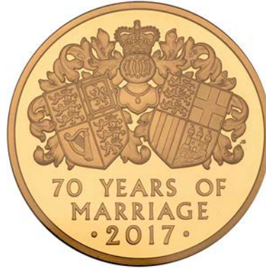
G 471 Proof Ten Pounds, 2017, in gold , Platinum Wedding (S M10). About as struck; in de-luxe case of issue with certificate, rare £6,000-£8,000