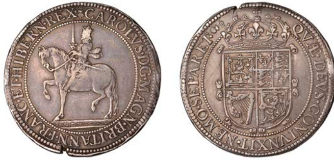
585 Third coinage, Briot's issue, Sixty Shillings, mm. thistle and b, 29.80g/6h (SCBI 35, 1424-6, same dies; S 5552). Traces of mounting on edge, otherwise very fine £1,000-£1,200