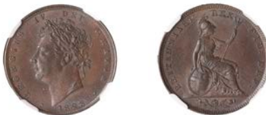
342 Farthing, 1828 (BMC 1443; S 3825). Good extremely fine [slabbed NGC MS 64 BN]