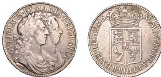
253 Halfcrown, 1689, first shield, caul and interior frosted, reads FRA, edge PRIMO (ESC 829; S 3434). Good fine and toned, the variety very rare