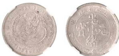
903 EMPIRE, Kiangnan , 20 Cents, 1901 (L & M 238; KM Y143a.6). About extremely fine [slabbed NGC AU 58] £200-£260