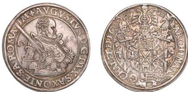
944 SAXONY, August , Thaler, 1568 HB , Dresden, 28.75g/11h (Schnee 721; Dav. 9798). Good very fine £200-£260