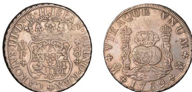
1058 Charles III , 8 Reales, 1769 MF , Mexico City, 26.86g/12h (CCT 828; Cayón 11968). Lightly cleaned, otherwise very fine