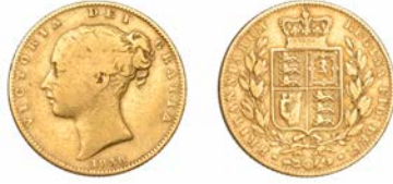
G 366 Sovereign, 1838 (M 22; S 3852). Fine