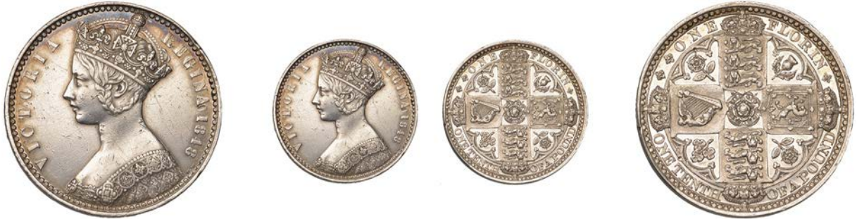
386 Pattern Florin, 1848, by W. Wyon, in silver, crowned bust left, rev. cruciform shields with emblems in angles, edge plain, 10.68g/12h (ESC 2917; S 3890). Obverse cleaned, some contact marks and edge marks, otherwise good very fine, rare