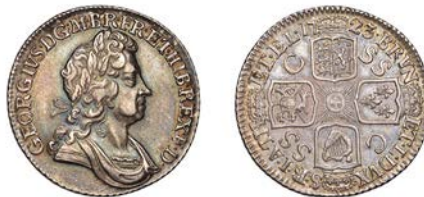
x 279 Shilling, 1723 ssc, second bust (ESC 1591; S 3648). Good very fine, toned

Provenance: D. Wallis Collection, DNW Auction 83, 30 September 2009, lot 3048