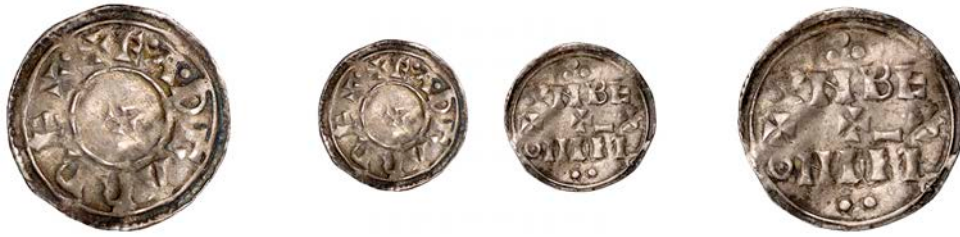
54 Penny, Two Line type [HT 1, NE V], Hunbein [Ubeinn], rev. VNBE ONI M in two lines divided by three crosses, trefoil of pellets above and below, 1.23g/8h (CTCE 74; SCBI BM 978, same obv. die; N 741; S 1129). Flan crimped, otherwise good fine, toned £300-£360