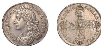
251 Shilling, 1686 (ESC 765; S 3410). Good very fine, toned