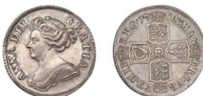
269 Shilling, 1708, third bust (ESC 1399; S 3610). Minor surface deposit, otherwise extremely fine