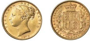
G 373 Sovereign, 1872, die 28 (M 56; S 3853B). Good very fine, reverse better