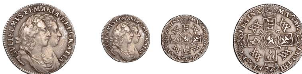
256 Sixpence, 1693 (ESC 869; S 3438). About very fine, toned