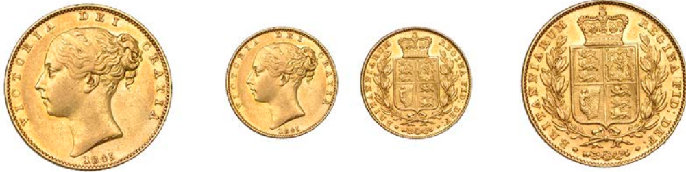
G 367 Sovereign, 1845, narrow date (M 28B; S 3852). Good very fine