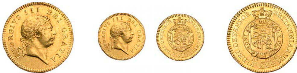
G 299 Half-Guinea, 1804, seventh bust (EGC 849; S 3737). Lightly brushed, about extremely fine

Provenance: A Small Collection of Gold Coins, the Property of a Gentleman