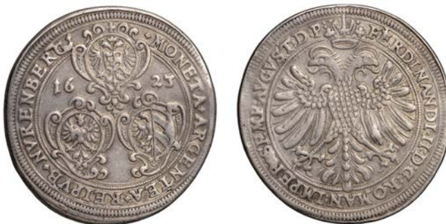
936 NUREMBERG, Free City , Thaler, 1623, 28.96g/12h (Dav. 5636). Removed from a mount, cleaned, otherwise about very fine £150-£180