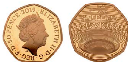
G 498 Proof Fifty Pence, 2019, in gold , Stephen Hawking (S H73). Brilliant; in de-luxe case of issue with certificate £600-£800