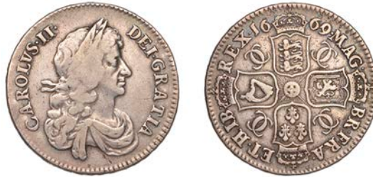
243 Halfcrown, 1669/4, third bust, edge VICESIMO PRIMO (ESC 452; S 3365). Good fine, rare £150-£180