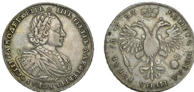
1109 Peter I , Rouble, 1721, Kadashevsky, 28.94g/12h (Bit. 481ff; Diakov 21ff; Dav. 1655). Minor graffiti on reverse, otherwise very fine £700-£900

Provenance: DNW Auction 190, 6-7 April 2021, lot 1062