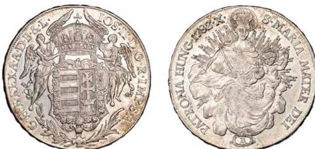
875 Joseph II , Thaler, 1782, Kremnitz, 27.99g/12h (Huszár 1869; Dav. 1168). Lightly cleaned, otherwise good very fine