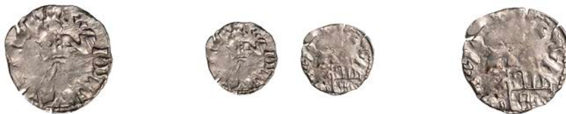
x 1103 WALLACHIA, Mircea cel Batrin (1386-1418), Ducat, type IIc, ΙΜΜΙ [--]ΑΒ, rev. ΡΕΤΡΟΙ ΣΤΑΝΙ, 0.42g/2h (MBR 214). Weak in parts, about very fine £100-£120