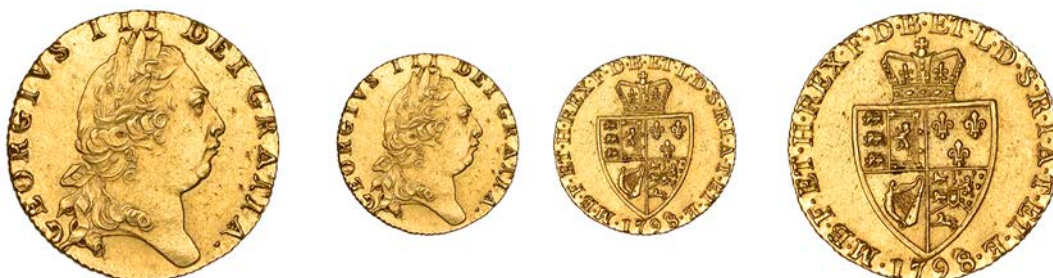
293 Guinea, 1798, fifth bust, 1798/8 (EGC 734; S 3729). Lightly wiped, otherwise about extremely fine, the date overdate clear and interesting