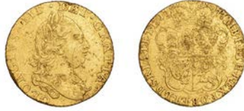
297 Half-Guinea, 1777, fourth bust (EGC 819; S 3734). Some surface and rim marks, good fine