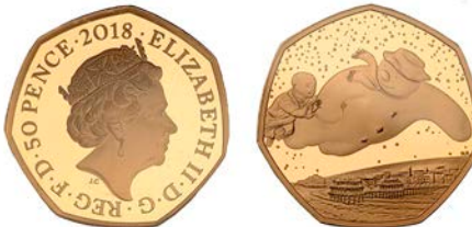
G 496 Proof Fifty Pence, 2018, in gold , The Snowman (S H60). Brilliant, as struck; in de-luxe case of issue with certificate £600-£800