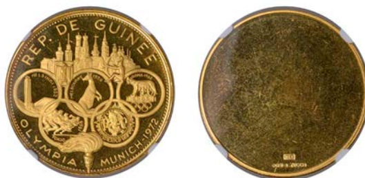
979 Republic , 5000 Francs, [1969], a uniface trial strike of the obv. in gilt-brass (cf. KM 32). Virtually as struck, very rare [slabbed NGC PF 67 Ultra Cameo] £400-£500