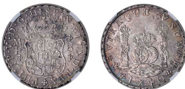
1045 Philip V , 8 Reales, 1740 MF , Mexico City (CCT 703; Cayón 9419-21). Slightly waterworn, some contact marks, otherwise about extremely fine [slabbed NGC AU Details, Saltwater Damage] £300-£400 Traces of a 3 visible under the 4 in the date