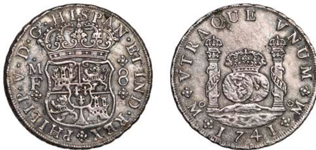
1046 Philip V , 8 Reales, 1741 MF , Mexico City, 26.49g/12h (CCT 704; Cayón 9427). Good very fine