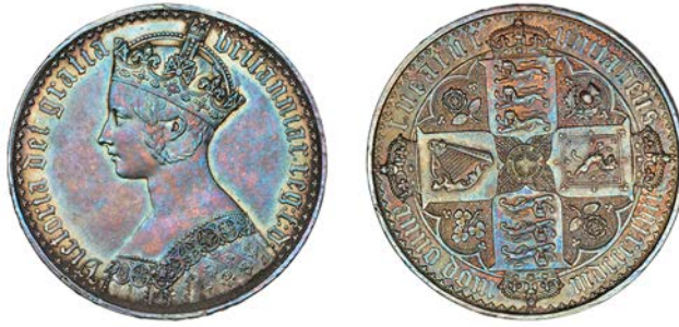
379 'Gothic' Crown, 1847, edge UNDECIMO (ESC 2571; S 3883). Removed from a mount and artificially toned, otherwise good very fine £1,200-£1,500