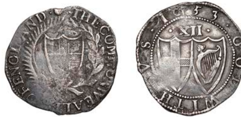
231 Shilling, 1653, mm. sun on obv. only, 5.69g/9h (ESC 124; N 2724; S 3217). Some roughness on obverse, otherwise good fine, dark patina