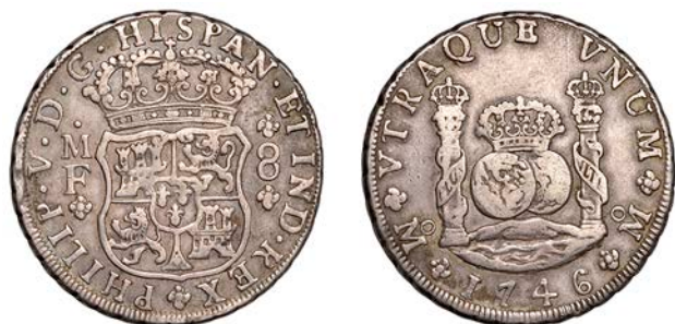
1047 Philip V , 8 Reales, 1746 MF , Mexico City, 26.83g/12h (CCT 709; Cayón 9464). Very fine

Provenance: From the wreck of the Hollandia (sunk in 1743)