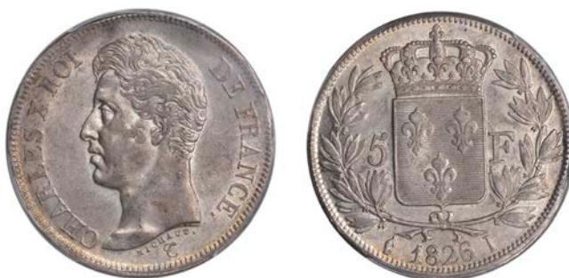
926 Charles X , 5 Francs, 1826 I , Limoges (Gad. 643; KM 720.6). About extremely fine, rare [slabbed PCGS AU 58] £200-£260