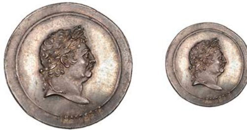
333 Uniface portrait trial for a Sixpence, by J. Barber, in silver, laureate head right within solid circular border, signed I BARBER F below, 2.31g (ESC 2228). Extremely fine, attractively toned, very rare