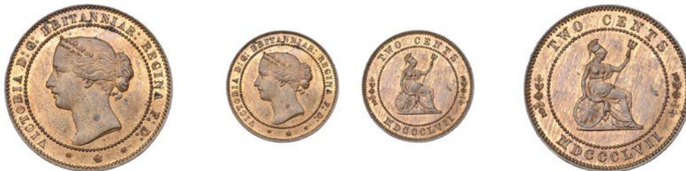
409 Pattern Two Cents, 1857, by L.C. Wyon, in bronze, coronetted bust left, rev. Britannia seated right, national emblems as stops, edge plain, 2.15g/12h (F 679 [Sale, lot 192]; BMC 1975). A few spots on obverse, otherwise practically as struck with much original colour, very rare