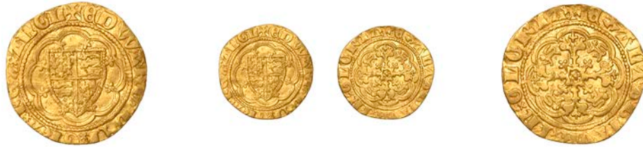
141 Treaty period, Quarter-Noble, London, no mark before EDWARD, double saltire stops and treaty x both sides, 1.47g/9h (SCBI Schneider 81ff; Stewartby p.258, B1; N 1243; S 1510). Clipped, otherwise very fine £300-£400