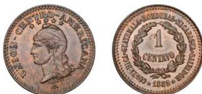
900 Essai Centavo, 1889, 4.99g/6h (Bruce E21). Good extremely fine £100-£120