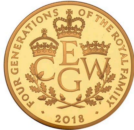
G 472 Proof Ten Pounds, 2018, in gold , Four Generations of the Royal Family (S M12). About as struck; in de-luxe case of issue with certificate, rare £6,000-£8,000