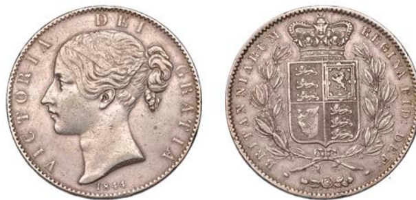
377 Crown, 1844, edge VIII, cinquefoil stops (ESC 2562; S 3882). Some contact marks, very fine