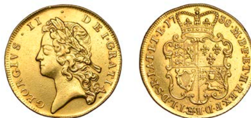
280 Two Guineas, 1738 (EGC 567; S 3667B). Cleaned and gilt, otherwise good very fine