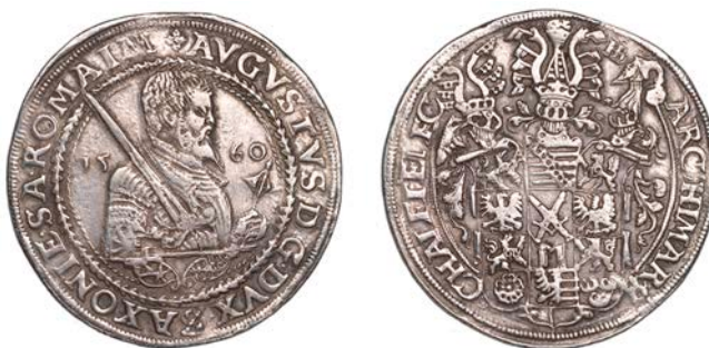
943 SAXONY, August , Thaler, 1560 HB , Dresden, 28.59g/12h (Schnee 713; Dav. 9795). Fields tooled, traces of mounting on edge, otherwise very fine £150-£180