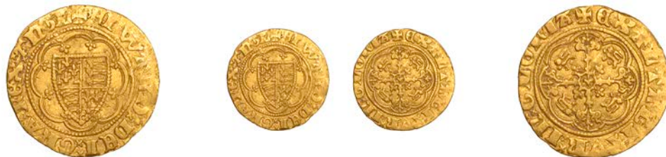
144 Treaty period, Quarter-Noble, London, annulet before EDWARD, barred A in GRA, double saltire stops and curule x both sides, 1.86g/7h (SCBI Schneider 91; Stewartby p.258, B2; N 1244; S 1511). Slightly short of flan, otherwise very fine £400-£500