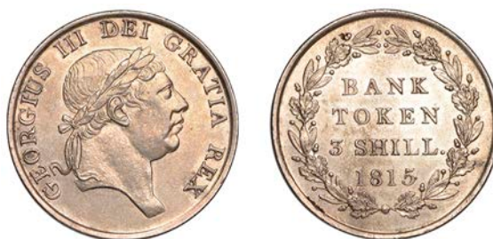
322 Three Shillings, 1815 (ESC 2084; S 3770). Lightly cleaned, about extremely fine

Provenance: Baldwin Argentum Auction, 7 June 2008, lot 152