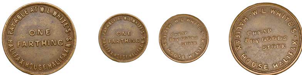
899 NOVA SCOTIA, Halifax , W.L. White, brass Farthing, undated, 22mm (Charlton NS-17A1). Very fine, scarce £100-£120