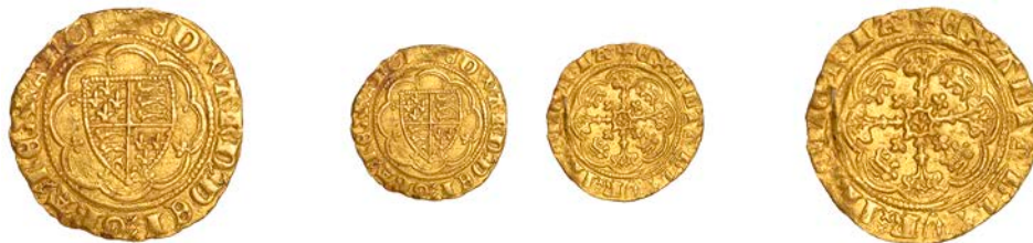
145 Treaty period, Quarter-Noble, London, annulet before EDWARD, 1.93g/4h (SCBI Schneider 91; N 1244; S 1511). Minor edge damage and small perforation, otherwise very fine £300-£400