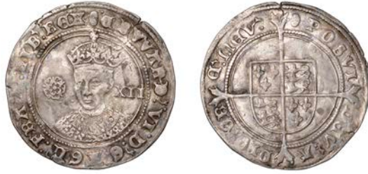
193 Third period, Fine issue, Shilling, mm. tun, 5.78g/11h (N 1937; S 2482). Tiny edge split, very fine, strong portrait