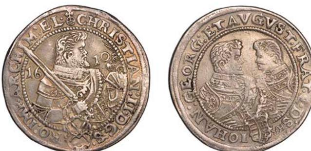
954 SAXONY, Christian II, Johann Georg and August , Thaler, 1610 HR , Dresden, 28.76g/5h (Schnee 767; Dav. 7566). Lightly cleaned, otherwise very fine £150-£180