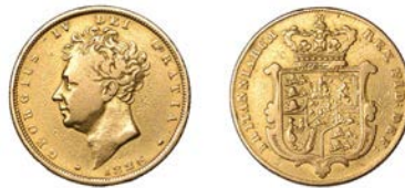
G 339 Sovereign, 1826 (M 11; S 3801). Good fine, cleaned