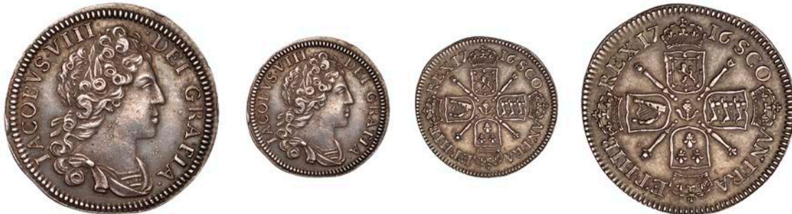
596 Pattern Guinea, 1716, type I, restrike by M. Young from dies by N. Roettiers [struck c. 1828], in silver, laureate bust right, reads IACOBVS · VIII , etc, rev. cruciform shields, leaved thistle in centre, sceptres in angles, edge plain, 7.29g/6h (Woolf 33:2; B 2, fig. 1095; S 5725). Usual rust marks on obverse die and light scratch on cheek, otherwise extremely fine or better