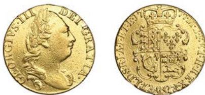
291 Guinea, 1777, fourth bust (EGC 695; S 3728). Polished and gilt, mount-marks on edge, otherwise very fine