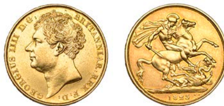
G 334 Two Pounds, 1823, edge IV (Hill T6; S 3798). Cleaned, otherwise good very fine