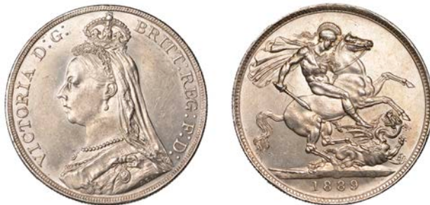
382 Crown, 1889 (ESC 2589; S 3921). Extremely fine £100-£120