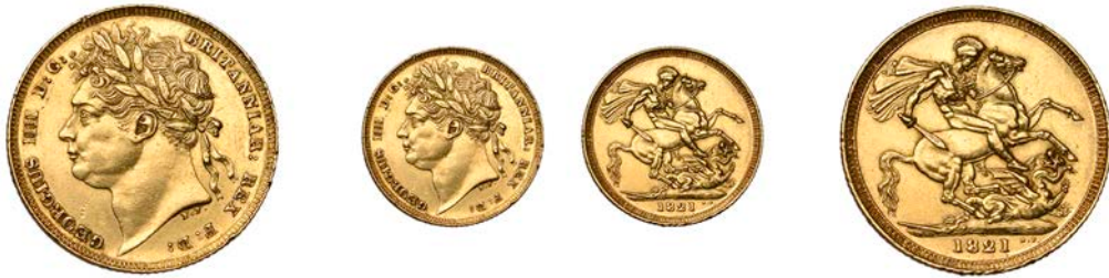
G 336 Sovereign, 1821 (M 5; S 3800). A few light surface and rim marks, otherwise nearly extremely fine