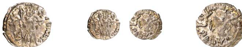
x 1107 WALLACHIA, Mihail I (1418-20), Ducat, ΙΜΜΧΑ Λ[--], rev. ΙΜΜΧΑ ΙΑΒΟΥ, 0.30g/10h (MBR 226). About very fine and toned, rare £100-£120