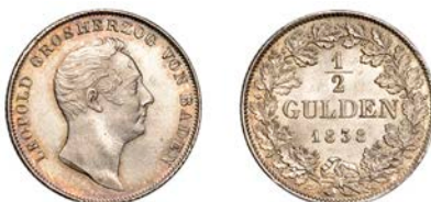
933 BADEN, Leopold I , Half-Gulden, 1838 (KM 209). Good extremely fine with some toning £100-£120