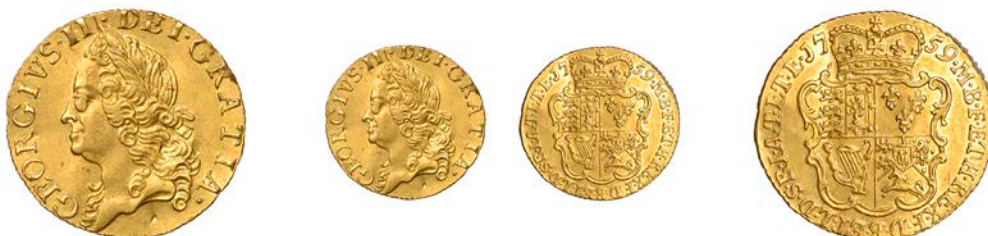
284 Half-Guinea, 1759 (EGC 660; S 3685). Slightly creased, otherwise about extremely fine