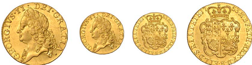
281 Guinea, 1753 (EGC 616; S 3680). Lightly wiped, otherwise about extremely fine, some residual lustre