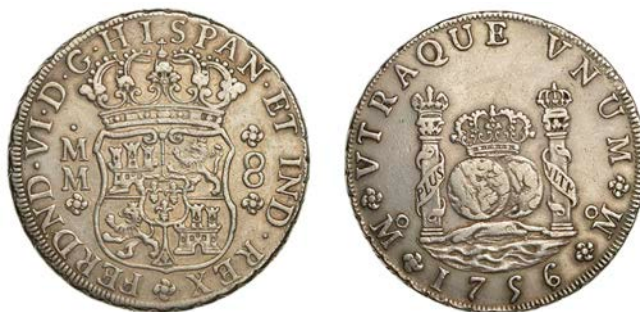
1054 Ferdinand VI , 8 Reales, 1756/5 MM , Mexico City (CCT 298; Cayón 10614). Lightly cleaned, otherwise very fine £240-£300

Provenance: DNW Auction 196, 11-12 October 2021, lot 1830