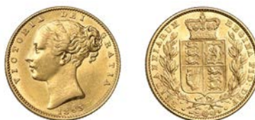
G 371 Sovereign, 1863 (M 46; S 3852D). Good very fine, reverse better