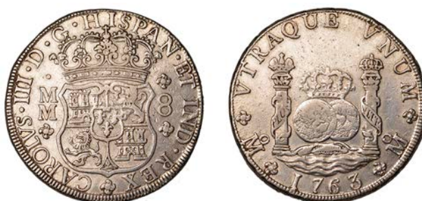
1056 Charles III , 8 Reales, 1763 MF , Mexico City, 26.90g/12h (CCT 821; Cayón 11916). Cleaned, otherwise very fine, scarce

Provenance: DNW Auction 196, 11-12 October 2021, lot 1831