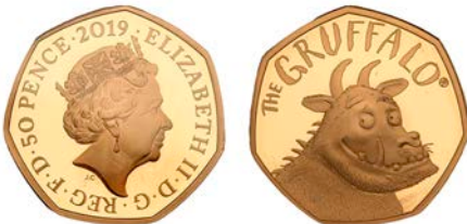
G 497 Proof Fifty Pence, 2019, in gold , The Gruffalo (S H72). Brilliant, as struck; in de-luxe case of issue with certificate £600-£800