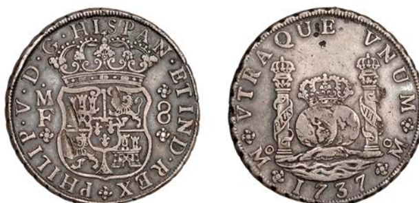
1043 Philip V , 8 Reales, 1737 MF , Mexico City, 26.70g/12h (CCT 700; Cayón 9398). Some digs and scrapes, file-mark on edge, otherwise very fine £200-£260