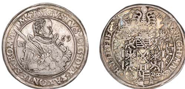
945 SAXONY, August , Thaler, 1569 HB , Dresden, 28.72g/8h (Schnee 721; Dav. 9798). Very fine £150-£180