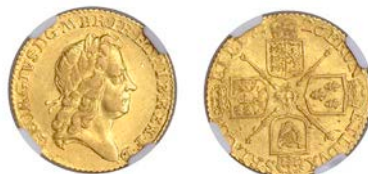
275 Half-Guinea, 1726, second bust (EGC 547; S 3637). Good very fine with some lustre [slabbed NGC AU 53]

Provenance: A Small Collection of Gold Coins, the Property of a Gentleman