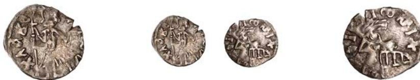
x 1106 WALLACHIA, Mihail I (1418-20), Ducat, ΙΜΜΙ ΧΑΛΒΟ, rev. ΙΜΜΙΧ ΑΛΒΟΙ, 0.33g/10h (MBR 224). Small edge split, very fine £100-£120