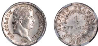
925 Napoleon I , Franc, 1811 D , Lyon (Gad. 447; KM 692.5). Adjustment marks on bust, otherwise extremely fine, scarce [slabbed NGC AU 58] £200-£260