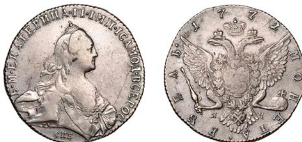
1120 Catherine II , Rouble, 1772яч, St Petersburg, 24.29g/12h (Bit. 212; Dav. 1684). Cleaned, otherwise very fine