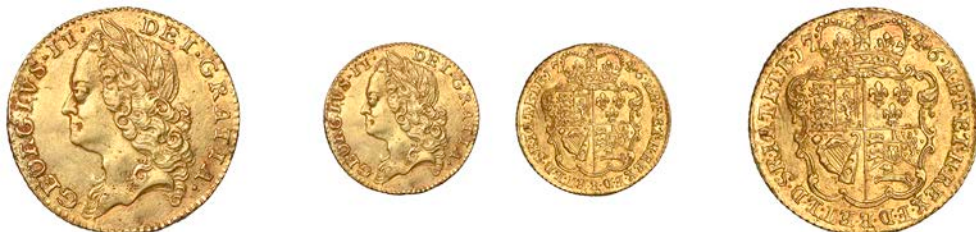
283 Half-Guinea, 1746 (EGC 648; S 3683A). Good very fine