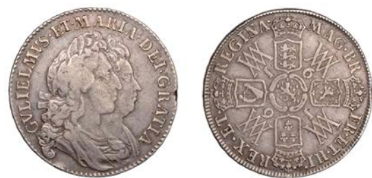
255 Halfcrown, 1691, no stop after BR, edge TERTIO (ESC 852; S 3436). About very fine