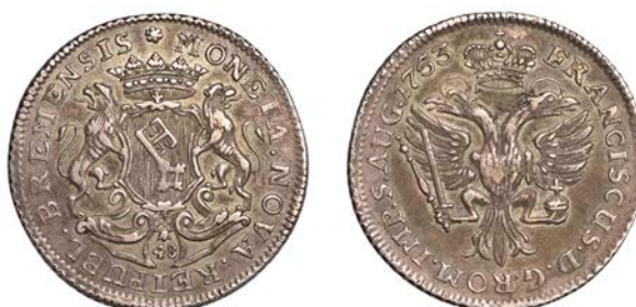
935 BREMEN, Free City , 48 Grote, 1753, 16.96g/12h (Dav. 320A; KM 200). Very fine £120-£150