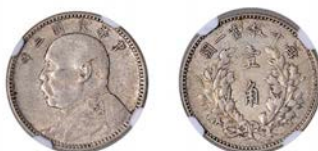
905 REPUBLIC, Yuan Shih-kai , 10 Cents, yr 3 [1914] (L & M 66; KM Y326). Good very fine [slabbed NGC AU 55] £200-£260