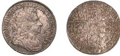
277 Shilling, 1723 ssc, first bust (ESC 1586; S 3647). Heavy flecking, otherwise extremely fine