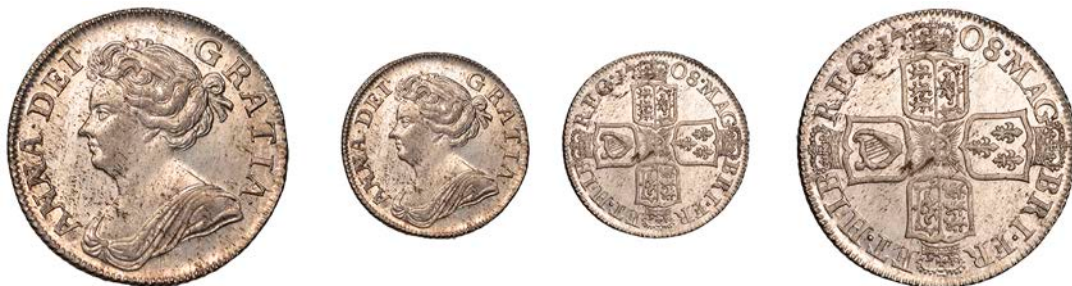
267 Shilling, 1708, third bust (ESC 1399; S 3610). Minor flecking, otherwise good extremely fine