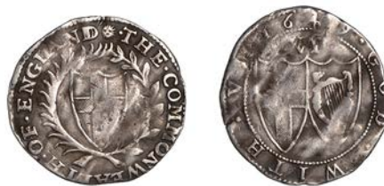
233 Sixpence, 1649, mm. sun on obv. only, 2.79g/3h (ESC 177; N 2727; S 3220). Twice creased with resulting weakness, fine