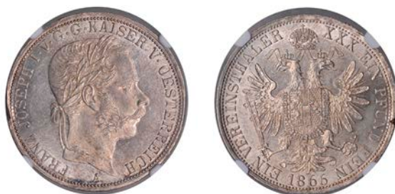
876 Franz Joseph I , Thaler, 1866A (Dav. 26; KM 2245). Extremely fine [slabbed NGC MS 62]