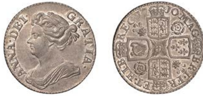
270 Shilling, 1710, third bust, roses and plumes (ESC 1403; S 3614). About extremely fine, lustrous