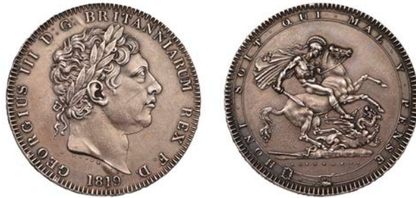
332 Crown, 1819, edge LIX (ESC 2010; S 3787). Cleaned and artificially toned, scratch on face, otherwise about extremely fine