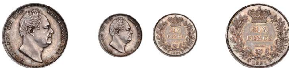
350 Proof Sixpence, 1831, edge plain, 2.83g/6h (ESC 2501; S 3836). Minor rim knocks, otherwise good extremely fine and toned