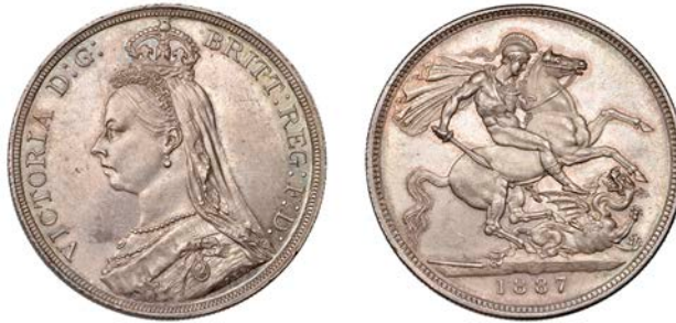
380 Crown, 1887 (ESC 2585; S 3921). A few minor marks, otherwise extremely fine, toned £100-£120