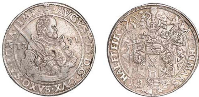
946 SAXONY, August , Thaler, 1571 HB , Dresden, 29.12g/9h (Schnee 725; Dav. 9798). Traces of mounting on edge, otherwise very fine £150-£180