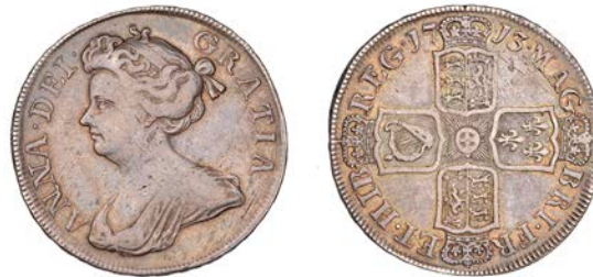
266 Halfcrown, 1713, edge DVODECIMO (ESC 1376; S 3604). A few surface marks, nearly very fine