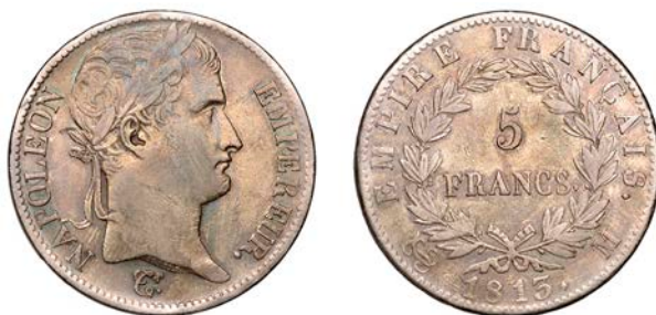
924 Napoleon I , 5 Francs, 1813 M , Toulouse (Gad. 584; KM 694.10). Some contact marks, otherwise very fine and toned £200-£260