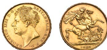
G 335 Two Pounds, 1823, edge IV (Hill T6; S 3798). Cleaned, traces of mounting on edge, otherwise good very fine