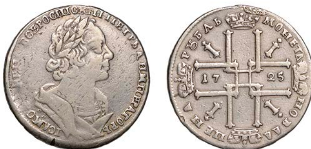
x 1111 Peter I , Rouble, 1725, Moscow, 27.58g/12h (Bit. 983ff; Diakov 54-7; Dav. 1662). Cleaned, ex-mount, otherwise good fine £200-£260