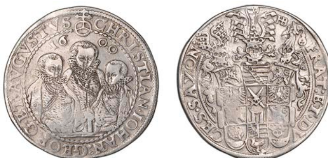
952 SAXONY, Christian II, Johann Georg and August , Thaler, 1600 HB , Dresden, 29.14g/10h (Schnee 754; Dav. 9820). About very fine £120-£150