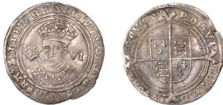
195 Third period, Fine issue, Sixpence, mm. y, 3.10g/4h (N 1938; S 2483). A little weak on king's face, otherwise very fine, rare