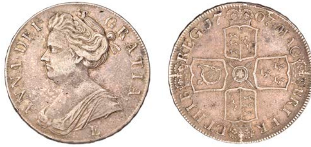
264 Crown, 1707E, edge SEXTO (ESC 1351; S 3600). Very fine