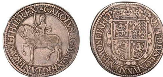
587 Third coinage, Briot's issue, Thirty Shillings, mm. flower on obv. , thistle head on rev. , signed b both sides, 14.62g/6h (Bull 6; Murray p.133 & pl. iii, 14; SCBI 35, 1427-9; B 6, fig. 1006; S 5553). About very fine, toned £300-£360