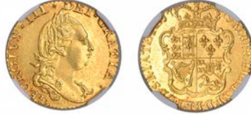
298 Half-Guinea, 1779, fourth bust (EGC 822; S 3734). Extremely fine [slabbed NGC MS 62+]