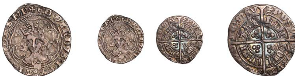
146 Treaty period, Halfgroat, London, mm. cross potent, double annulet stops on obv. , double saltire stops on rev. , 2.14g/7h (N 1259; S 1620). Slightly small of flan, otherwise nearly very fine, darkly toned £100-£150

Provenance: DNW Auction 91, 16 March 2011, lot 483