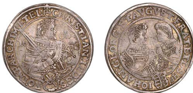
953 SAXONY, Christian II, Johann Georg and August , Thaler, 1608 HR , Dresden, 29.13g/6h (Schnee 767; Dav. 7566). Very fine £150-£180