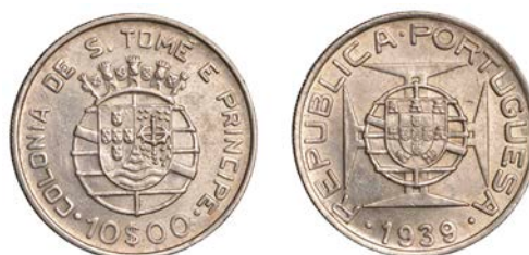
1125 Portuguese Administration , 10 Escudos, 1939 (Gomes 22.01; KM 7). Extremely fine, scarce