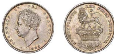
341 Shilling, 1825, type 3 (ESC 2405; S 3812). Good extremely fine and attractively toned