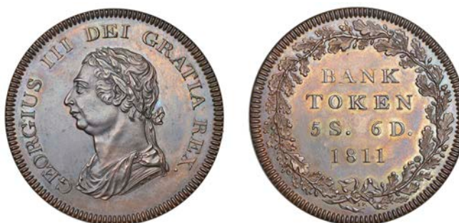
321 Pattern Five Shillings and Sixpence, 1811, types K/5a, struck in copper on a thin flan, 22.48g/12h (L & S 128; ESC 1998). Extremely fine, scarce

Provenance: D. Wallis Collection, DNW Auction 83, 30 September 2009, lot 3104