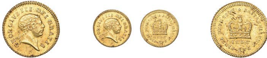
G 300 Third-Guinea, 1806 (EGC 876; S 3740). Minor flecking, good very fine