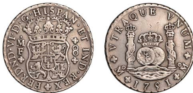
1051 Ferdinand VI , 8 Reales, 1751 MF , Mexico City, 26.65g/12h (CCT 290; Cayón 10565). Cleaned, otherwise very fine £150-£180