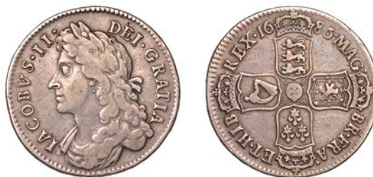
250 Halfcrown, 1686, first bust, edge SECUNDO (ESC 749; S 3408). About very fine