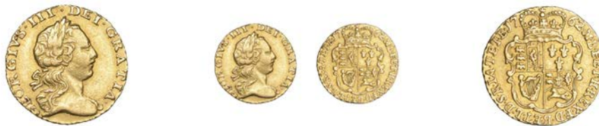
301 Quarter-Guinea, 1762 (EGC 886; S 3741). Possible traces of mounting on edge, otherwise very fine