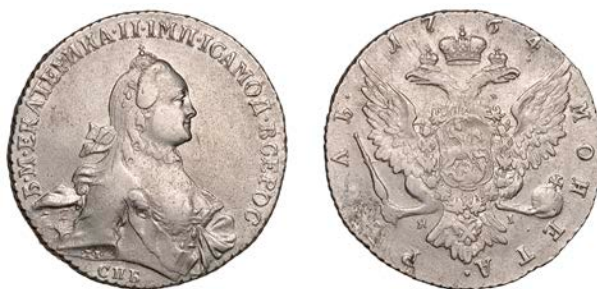
1117 Catherine II , Rouble, 1764 Я , St Petersburg, 23.80g/12h (Bit. 185; Dav. 1683). Cleaned, otherwise very fine