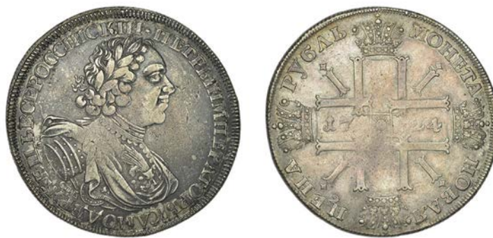
1110 Peter I , 'Sun' Rouble, 1724, St Petersburg, 28.46g/11h (Bit. 1317; Diakov 15; Dav. 1659). About very fine, scarce £2,000-£2,600