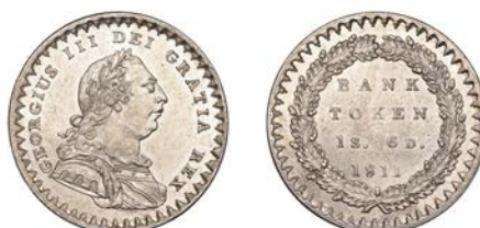
323 Eighteen Pence, 1811 (ESC 2112; S 3771). Good extremely fine

Provenance: D. Wallis Collection, DNW Auction 83, 30 September 2009, lot 3109