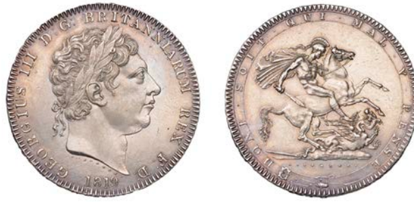
331 Crown, 1819, edge LIX (ESC 2010; S 3787). Cleaned, otherwise about extremely fine