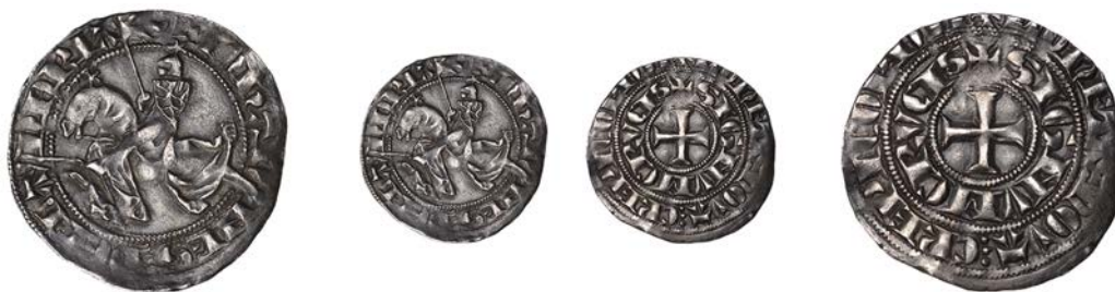
931 CREVECOEUR, Jean de Flandre (1313-15), Petit Gros, 1.94g/3h (PA 6924; B 2075). Good very fine, dark tone £200-£260