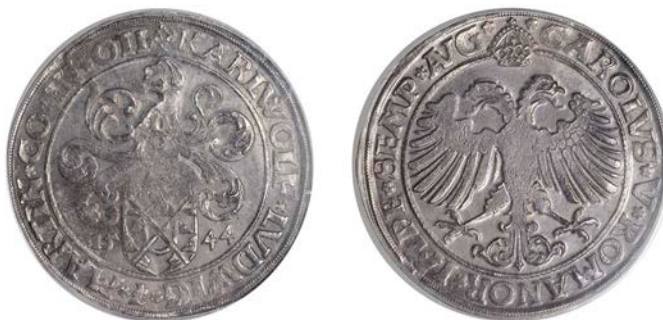
937 ÖTTINGEN, Karl Wolfgang, Ludwig XV and Martin , Thaler, 1544 (Dav. 9618). About extremely fine [slabbed PCGS Cleaned, AU Detail] £240-£300