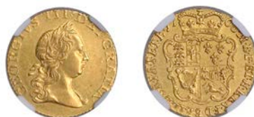
294 Half-Guinea, 1763, first bust (EGC 800; S 3731). Good very fine, reverse better, very rare [slabbed NGC AU 58]