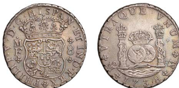
1044 Philip V , 8 Reales, 1738 MF , Mexico City, 26.60g/12h (CCT 701; Cayón 9405). Cleaned at one time and now re-toned, scratched on both sides, otherwise very fine £200-£260