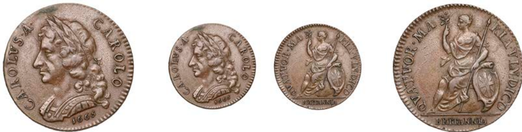
245 Pattern Farthing, 1665, by J. Roettier, in copper, laureate bust left, long hair, rev. Britannia seated left, edge plain, 23mm, 6.51g/12h (Cooke 793; BMC 434). Minor adhesion, otherwise nearly extremely fine £500-£700

Provenance: DNW Auction 86, 16-17 June 2010, lot 683