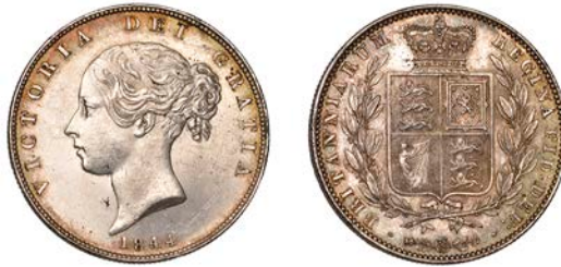
385 Halfcrown, 1844 (ESC 2720; S 3888). Extremely fine, reverse lightly toned, rare this nice