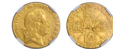
274 Half-Guinea, 1724, first bust (EGC 545; S 3635). Some minor marks, otherwise very fine with traces of lustre, very rare [slabbed NGC VF 30]