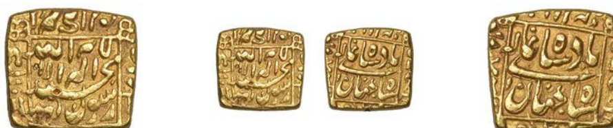
983 MUGHAL , a jeweller's copy of a square mohur of Shah Jahan I, no mint or date, 10.67g/12h. A few light scrapes and scratches, otherwise very fine £400-£500