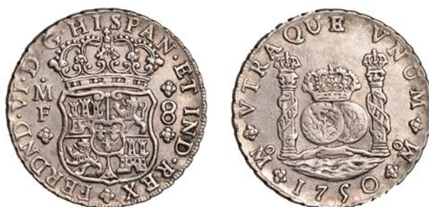
1050 Ferdinand VI , 8 Reales, 1750 MF , Mexico City, 26.25g/12h (CCT 289; Cayón 10559). Cleaned, otherwise very fine