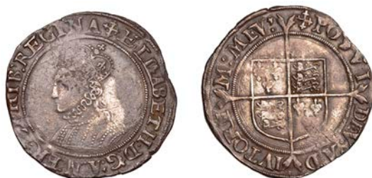
197 Second issue, Shilling, mm. cross-crosslet, bust 1A, 5.63g/8h (N 1985; S 2555A). Fine, reverse better, patchy toning, rare