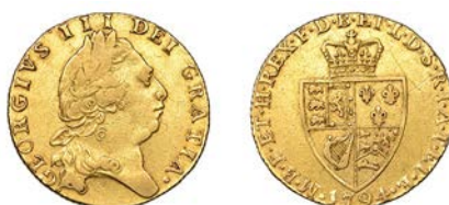
292 Guinea, 1794, fifth bust (EGC 725; S 3729). Cleaned, scratches on reverse, otherwise about very fine