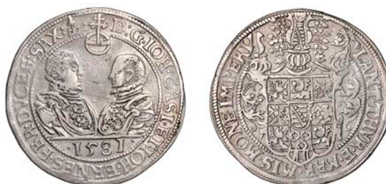
941 SAXE-COBURG-EISENACH, Johann Casimir and Johann Ernst II , Half-Thaler, 1581 B , Saalfeld, 14.34g/12h. Lightly cleaned, small scratch in centre of obverse, otherwise very fine, rare £150-£180