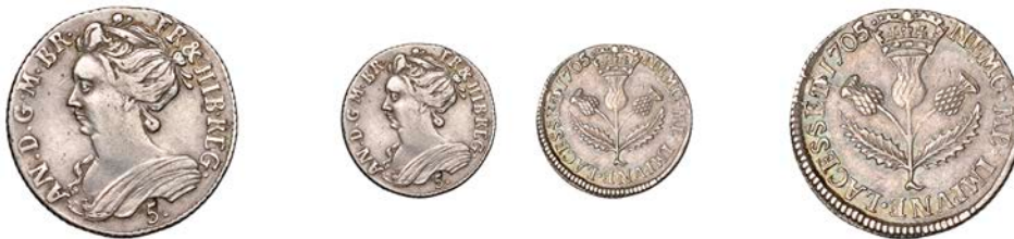
595 Five Shillings, 1705/4, 2.40g/12h (S 5704). Lightly cleaned, otherwise very fine