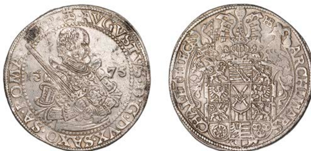
948 SAXONY, August , Thaler, 1575 HB , Dresden, 29.13g/4h (Schnee 725; Dav. 9798). Lightly cleaned, very fine £150-£180