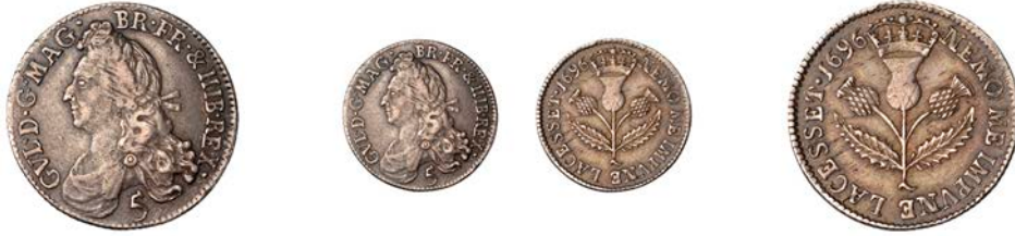
594 Five Shillings, 1696, reads cvl ; stop before date, 2.32g/12h (SCBI 35, 1762-4; S 5688). Very fine, toned