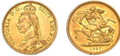
G 360 Two Pounds, 1887, small date (Hill T25; S 3865). Some contact marks, otherwise good very fine