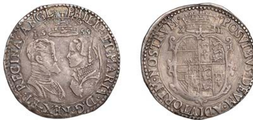
196 Shilling, 1555, English titles, with mark of value, 5.64g/6h (N 1968; S 2501). Scratches in fields on both sides, otherwise a pleasing very fine