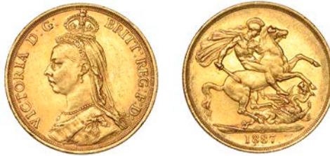
G 361 Two Pounds, 1887, large date (Hill T26; S 3865). Good very fine