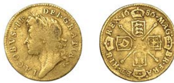
248 Half-Guinea, 1686 (EGC 338; S 3404). Fine