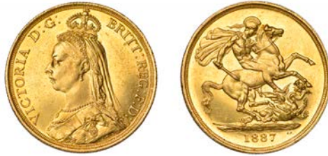
G 359 Two Pounds, 1887 (Hill T23; S 3865). Extremely fine