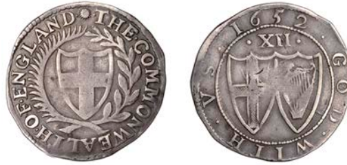
230 Shilling, 1652, mm. sun on obv. only, 5.86g/8h (ESC 103; N 2724; S 3217). Good fine, toned