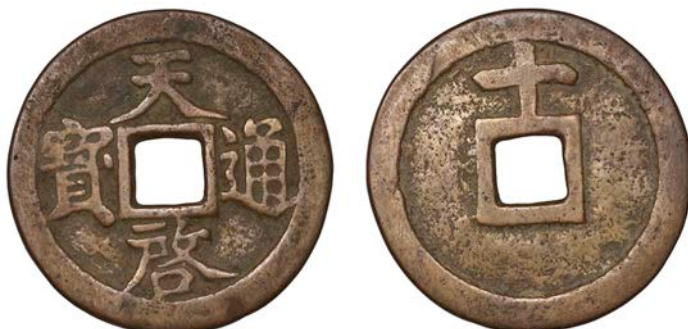
902 MING DYNASTY, Xi Zong (1621-27), Tian Qi, 10 Cash, 18.92g (H 20.226). About very fine £150-£180 Provenance: Sir Gerard Clauson Collection