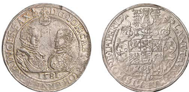
940 SAXE-COBURG-EISENACH, Johann Casimir and Johann Ernst II , Thaler, 1581 B , Saalfeld, 28.79g/1h (Schnee 170; Dav. 9756). Lightly cleaned, good very fine £200-£260