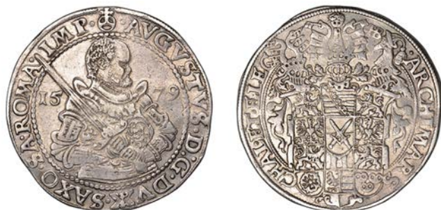
949 SAXONY, August , Thaler, 1579 HB , Dresden, 29.06g/6h (Schnee 725; Dav. 9798). Very fine £150-£180