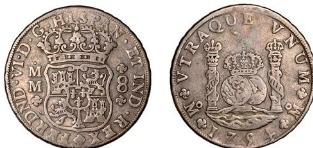
1052 Ferdinand VI , 8 Reales, 1754 MM , Mexico City, 26.50g/12h (CCT 294; Cayón 10595). About very fine £300-£400