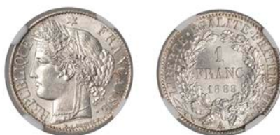
927 Third Republic , Franc, 1888 A , Paris (Gad. 465a; KM 822.1). About as struck [slabbed NGC MS 65] £100-£120