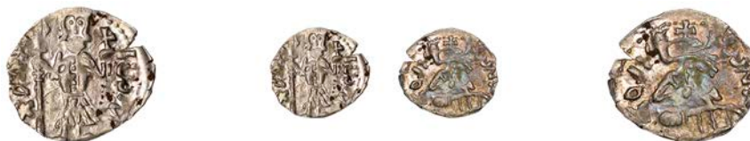
x 1105 WALLACHIA, Mihail I (1418-20), Ducat, ΙΜΜ ΧΑΛΒ, rev. ΙΜΜΧ ΑΛΒΟΙ, 0.33g/12h (MBR 224). Very fine, reverse toned £100-£120