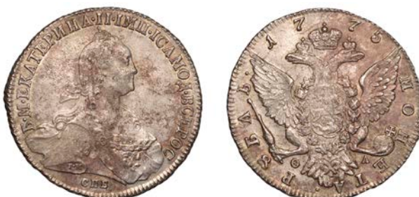
1121 Catherine II , Rouble, 1775еА, St Petersburg, 22.72g/11h (Bit. 219; Dav. 1684). Minor discolouration, otherwise good very fine