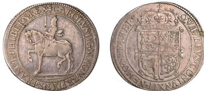
586 Third coinage, Briot's issue, Sixty Shillings, mm. thistle and b, 29.98g/6h (SCBI 35, 1424-6, same dies; S 5552). Scratched in centre of reverse, otherwise about very fine £600-£800