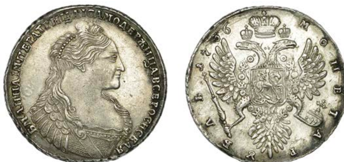
1112 Anna , Rouble, 1736, Kadashevsky, 25.93g/12h (Bit. 125; Diakov 1; Dav. 1673). Some scratches on reverse, otherwise good very fine £600-£800

Provenance: DNW Auction 190, 6-7 April 2021, lot 1065