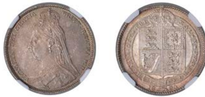
388 Shilling, 1890 (ESC 3144; S 3927). Good extremely fine or better, attractively toned [slabbed NGC MS 64]