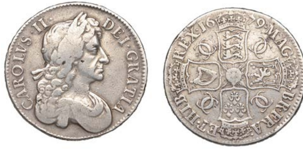
242 Crown, 1679, fourth bust, edge TRICESIMO PRIMO (ESC 405; S 3359). Lightly cleaned, some contact marks, otherwise about very fine £200-£260