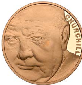
G 473 Proof Five Pounds, 2015, in gold , Winston Churchill (S L38). Brilliant, as struck; in case of issue £2,000-£2,600 No. 253 of 620 issued