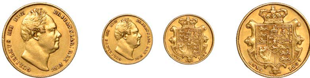
G 348 Sovereign, 1837 (M 21; S 3829B). Very fine, reverse better, minor marks on edge