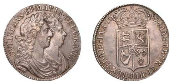
254 Halfcrown, 1689, first shield, caul only frosted, pearls, edge PRIMO (ESC 831; S 3434). Some light marks, good very fine, toned