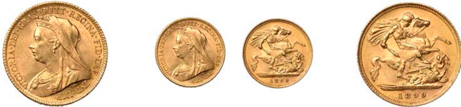
G 376 Half-Sovereign, 1899 (M 494; S 3878). Extremely fine