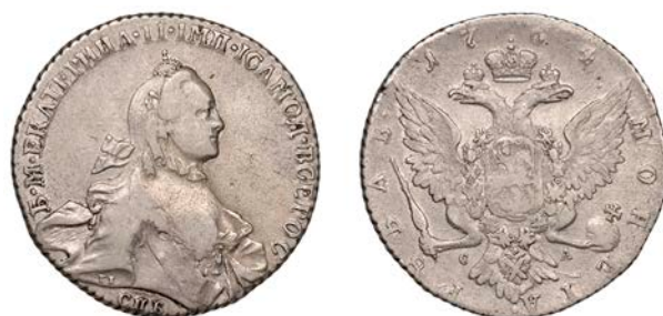
1118 Catherine II , Rouble, 1764 СА , St Petersburg, 23.69g/12h (Bit. 186; Dav. 1683). About very fine