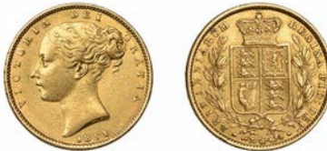
G 369 Sovereign, 1851 (M 34; S 3852C). Very fine