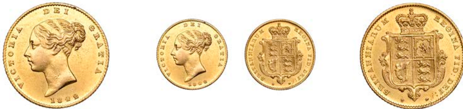
G 374 Half-Sovereign, 1842 (M 416; S 3859). Wiped, good very fine