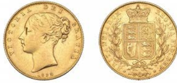
G 365 Sovereign, 1838 (M 22; S 3852). Good fine