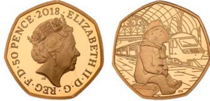
G 494 Proof Fifty Pence, 2018, in gold , Paddington Bear (S H58). Brilliant; in de-luxe case of issue with certificate £600-£800