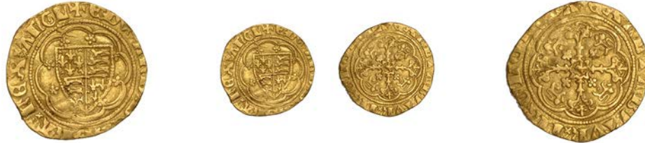
142 Treaty period, Quarter-Noble, London, double saltire stops, curule x, 1.52g/8h (SCBI Schneider 90-1; N 1243; S 1510). Slightly clipped, good fine or better £300-£400