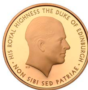
G 474 Proof Five Pounds, 2017, in gold , Duke of Edinburgh (S L56). About as struck; in de-luxe case of issue with certificate £1,500-£2,000