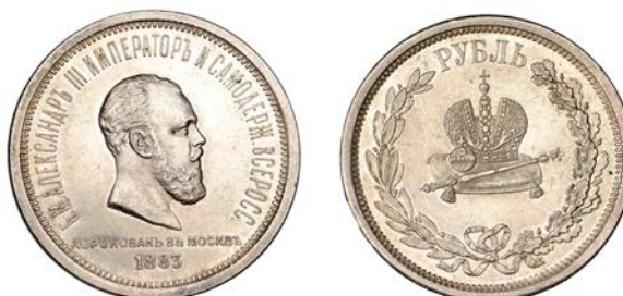
1122 Alexander III , Rouble, 1883, Coronation commemorative (Bit. 217; Dav. 291; KM Y43). Lightly cleaned, otherwise good extremely fine [slabbed NGC UNC Details, Cleaned]