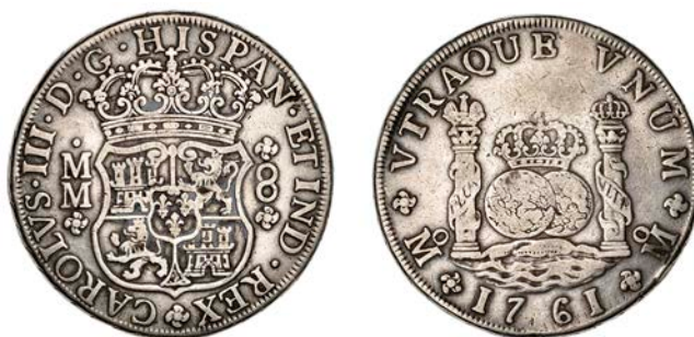
1055 Charles III , 8 Reales, 1761 MM , Mexico City (CCT 818; Cayón 11893). About very fine, minor deposit on obverse