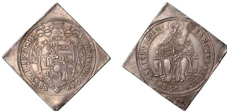
878 SALZBURG, Wolf Dietrich von Raitenau (1587-1612), Klippe Thaler, undated, 28.80g/12h (Probszt 823; Dav. 8184). Toned, good very fine