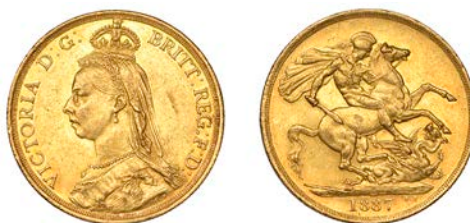
G 364 Two Pounds, 1887, large date (Hill T26; S 3865). Some contact marks, good very fine