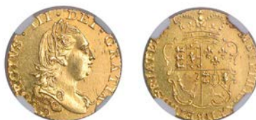
295 Half-Guinea, 1775, fourth bust (EGC 815; S 3734). A few minor marks, otherwise extremely fine [slabbed NGC MS 62] £1,500-£1,800

Provenance: A Small Collection of Gold Coins, the Property of a Gentleman