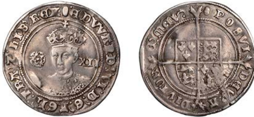
194 Third period, Fine issue, Shilling, mm. tun, 5.92g/6h (N 1937; S 2482). Slightly creased, surface flaws on reverse, otherwise very fine