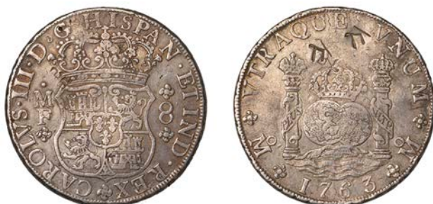
1057 Charles III , 8 Reales, 1763 MF , Mexico City, 27.09g/12h (CCT 822; Cayón 11919). Good very fine, chopmarked on both sides