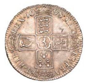
348 Halfcrown, 1698, edge DECIMO (ESC 1034; S 3494). Has been gilt at one time, traces of mounting on edge, otherwise good very fine £120-£150