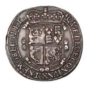
806 Third coinage, Falconer's Anonymous issue, Thirty Shillings, mm. leaved thistle on obv. , thistle-head on rev. , 14.85g/6h (Murray 2; Bull 23; SCBI 35, 1519 var.; B 50; S 5557). Very fine, toned