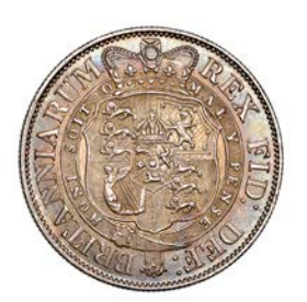
452 Halfcrown, 1817, small head (ESC 2096; S 3789). Toned, about extremely fine