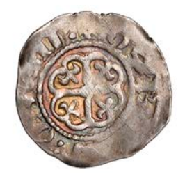
From the F. Elmore Jones and J.C. Sadler Collections

145 Penny, Cross Moline type [BMC I], Ipswich , Osbern, Osb[ER]N: ON: GIP, reads STIEFNE R, 1.36g/2h (Sadler III, p. 169, fig. 1065, this coin; N 873; S 1278). Weak in places, surface flaws on obverse, otherwise good fine and attractively toned, rare £700-£800