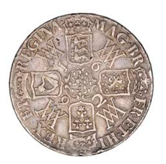
337\, Crown, 1692, edge _{\rm QVARTO} (ESC 822; S 3433). Some minor marks, good fine