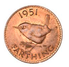
598 Farthing, 1951, struck in copper-nickel , edge plain, 2.84g/12h. Toned, about as struck, extremely rare