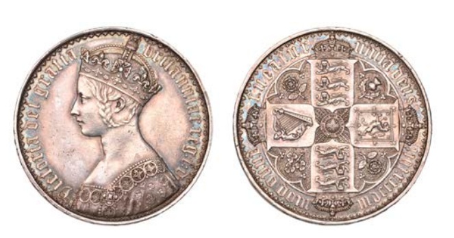
493 'Gothic' Crown, 1847, edge UNDECIMO (ESC 2571; S 3883). Surfaces marked and hairlined, otherwise better than very fine with some toning £2,000-£2,600