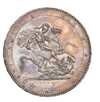
449 Crown, 1819, edge LIX (ESC 2010; S 3787). Light surface marks and hairlines, nearly extremely fine