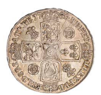
393 Crown, 1736, roses and plumes, edge NONO (ESC 1664; S 3686). Nearly very fine, reverse a little better