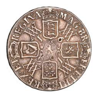
336 Crown, 1691, edge TERTIO (ESC 820; S 3433). Fine or better