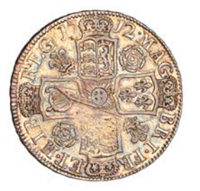
367 Halfcrown, 1712, roses and plumes, edge UNDECIMO (ESC 1374; S 3607). Cleaned at one time and now re-toned, adjustment marks on reverse, otherwise very fine £150-£180