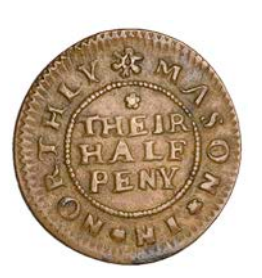
1087 North Leigh , William and Ann Mason, Halfpence (2), 3.49g/12h (M 116; N 3661a, this piece; D 110A), 1.78g/12h (M 115; N 3662a, this piece; BW. 110) [2]. First very fine but with some staining on obverse, rare, second good fine; both the issues for the town £80-£100

Provenance: M 115 Norweb Collection, Spink Auction 104, 6 July 1994, lot 415 (part); *M 116 R.A. Nott Collection, Norweb Collection, Spink Auction 104, 6 July 1994, lot 382 (part)