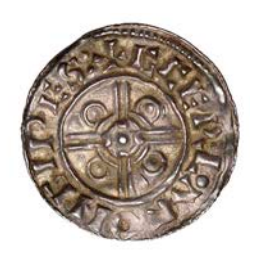
From the J.C. Sadler Collection

98 Penny, Pointed Helmet type, Ipswich , 'Gcerlaf', GCERLAF ON GIPES:, reads CNVT: EX ANG, 1.07g/3h (Sadler II, p.56, fig. 504, this coin; BEH 942; N 787; S 1158). Slightly creased with a few peckmarks, very fine, toned and extremely rare £700-£900