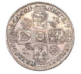
405 Sixpence, 1728, roses and plumes (ESC 1740; S 3707). Very fine, reverse better, toned