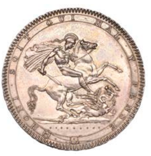
448 Crown, 1818, edge LIX (ESC 2009; S 3787). Sometime cleaned, otherwise extremely fine