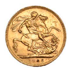
Salvaged from the SS Egypt

559 Sovereign, 1908 (M 180; S 3969). Good very fine, a few marks and nicks; in contemporary leather case of Lloyd's of London, accompanied with certificate £440-£500