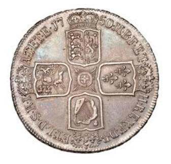
394 Crown, 1750, edge VICESIMO QVARTO (ESC 1670; S 3690). Sometime cleaned and now toned, good very fine