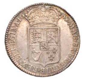
338 Halfcrown, 1689, first shield, caul and interior frosted, pearls, edge PRIMO (ESC 826; S 3434). Lightly cleaned at one time, otherwise about extremely fine with some toning £600-£800