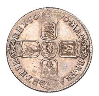
351 Shilling, 1696N, first bust (ESC 1184; S 3501). Toned, about extremely fine