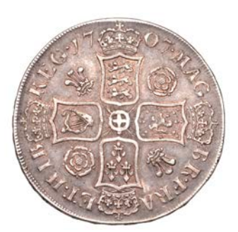
363 Crown, 1707, roses and plumes, edge SEXTO (ESC 1343; S 3578). A few minor marks, otherwise good very fine