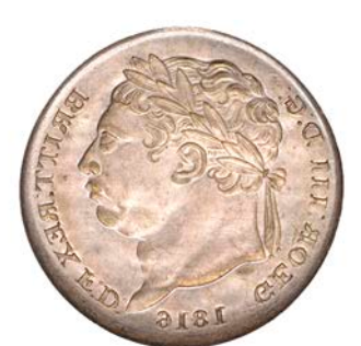
453 Shilling, 1816, obverse brockage (cf. ESC 2140; cf. S 3790). About as struck, beautifully toned, rare