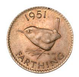
597 Farthing, 1951, struck in copper-nickel, edge plain, 2.84g/12h. About as struck, extremely rare