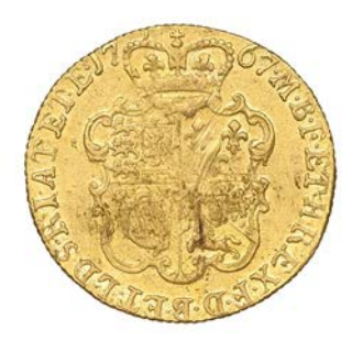
406 Guinea, 1767, third bust (EGC 677; S 3727). Very fine, some surface marks both sides, rare