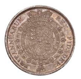
451 Halfcrown, 1817, large head (ESC 2090; S 3788). Good extremely fine, richly toned