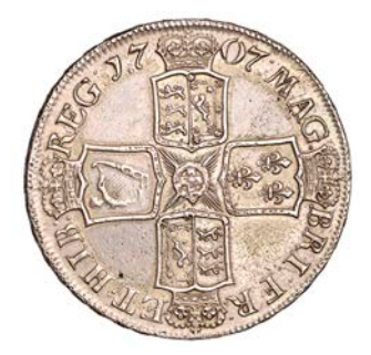
365 Crown, 1707E, edge SEXTO (ESC 1352; S 3600). Cleaned and possibly gilt at one time, some pitting, trace of mount on edge, otherwise very fine £150-£180