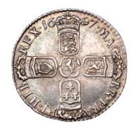
359 Sixpence, 1697, third bust, large crowns (ESC 1233; S 3538). Nearly extremely fine but probably sometime cleaned