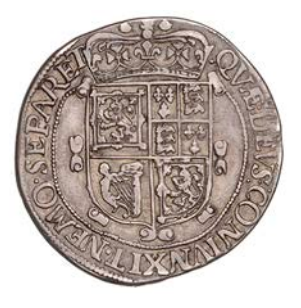
805 Third coinage, Falconer's Anonymous issue, Thirty Shillings, mm. small leaved thistle crowned on obv . only, rev . small crowns above large crown on rev. , 14.54g/7h (Bull 17; Murray 1; cf . SCBI 35, 1519; B –; S 5557). Good fine, reverse better, the variety very rare