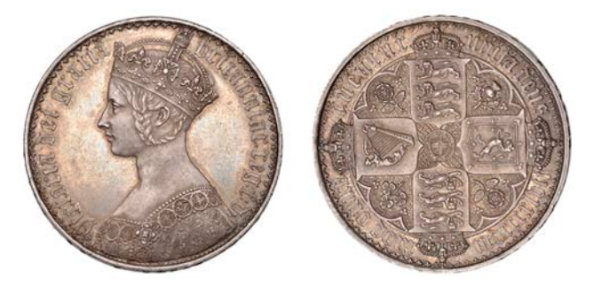
492 'Gothic' Crown, 1847, edge UNDECIMO (ESC 2571; $ 3883). Toned, about extremely fine [slabbed NGC PF 61] £4,000-£5,000