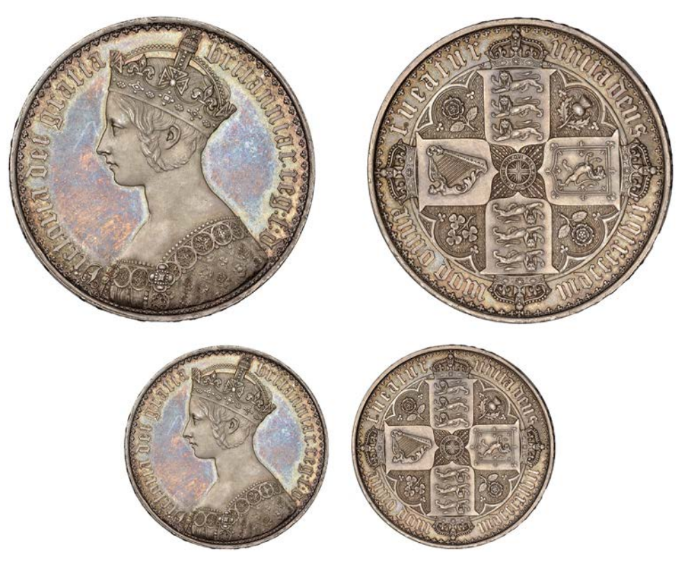
491 'Gothic' Crown, 1847, edge UNDECIMO, 28.32g/6h (ESC 2571; S 3883). Toned, good extremely fine [slabbed NGC PF 64] £20,000-£26,000