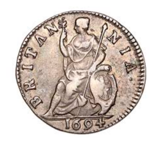
346 Proof Farthing, 1694, in silver , no stop after MARIA, first A of BRITANNIA unbarred, edge plain, 5.00g/5h (BMC 627; Cooke 630). Very fine, rare