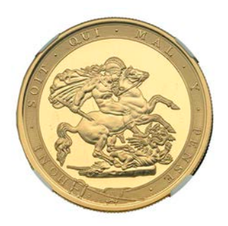
599 Five Pounds, 2017 (Hill F115; S SE15). Virtually as struck [slabbed NGC MS 69 DPL]