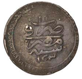
1701 Selim III , Qirsh, Misr 1203h, yr 16, 12.26g/12h (OC 28-031; ICV 3447). Two small test-marks on obverse, otherwise very fine with dark tone, rare