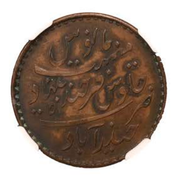
1279 HYDERABAD, Mir Mahbub 'Ali Khan, Pattern Rupee, 1301h, struck in copper, Farkhanda Bunyad Haidarabad, edge plain (cf. Album 31/2519; KM –). Minor discolouration, otherwise extremely fine, extremely rare [slabbed NGC UNC Details, Stained] £1,500-£2,000