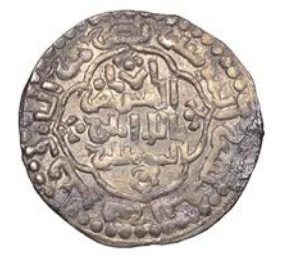
1749 al-Mustansir, Dirham, Madinat al-Salam 639h, 2.96g/10h (Jafar 149; A 272; ICV 472). Very fine and toned