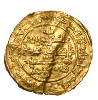
1778 Sanjar, Dinar, Madinat al-Salam 513h, citing the caliphal heir Abu Ja'far, 2.77g/12h (Jafar S.MS.513C; A 1686; ICV 1835). Creased, otherwise very fine, extremely rare £300-£400