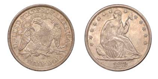
1549 Half-Dollar, 1872s. About extremely fine, toned