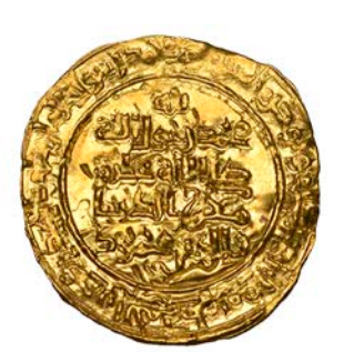
1779 Mahmud II, Dinar, Madinat al-Salam 513h, 2.09g/1h (Jafar S.MS.513A; A 1688; ICV 1839). Good very fine, rare