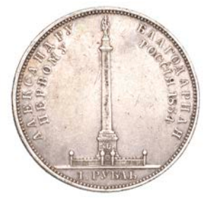
1447 Nicholas I, Rouble, 1834, Alexander I Monument, 20.78g/12h (Bit. 894; Dav. 285). Lightly cleaned, some minor marks, otherwise very fine