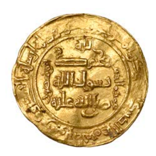
1746 al-Mustazhir , Dinar, Madinat al-Salam 496h, citing the heir Abu Mansur, 4.31g/9h (Jafar A.MS.496A; A B266; ICV 464). Slightly creased, some weakness in margins, otherwise very fine, extremely rare