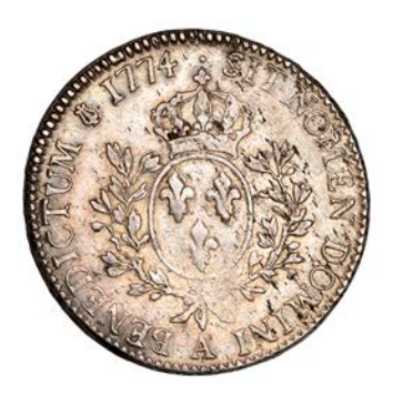
1195 Louis XVI , Écu aux lauriers, 1774A, Paris, 29.35g/6h (Dup. 1708; Gad. 356). Some flecking, otherwise good very fine, the date very rare £600-£800

1196 Consulate, 5 Francs, AN 8Q, Perpignan, 24.69g/6h (Gad. 563a; KM 639.8). Fine