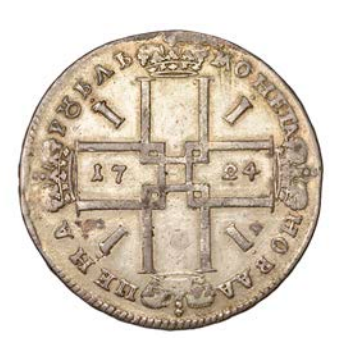
1444 Peter I , Rouble, 1724, Krasny, 28.85g/12h (Bit. 921-53; Diakov 23ff; Dav. 1660). Has been gilt, lightly tooled in places, otherwise about very fine £200-£260