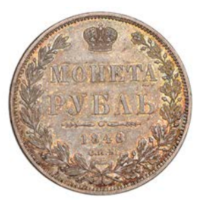
1448 Nicholas I , Rouble, 1848<sub>H</sub>, St Petersburg (Bit. 218; KM C168.1). Good very fine, toned Provenance : D.L.F. Sealy Collection