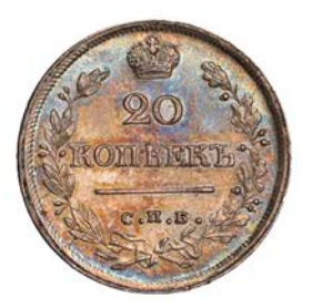
Nicholas I , 20 Kopecks, 1826нг, St Petersburg (Bit. 98; KM C128). About extremely fine, attractively toned Provenance : D.L.F. Sealy Collection