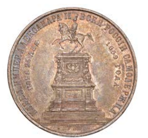
1452 Alexander II , Rouble, 1859, Nicholas I Monument (Bit. 567; KM Y28). Some minor marks, otherwise very fine and toned £400-£500 Provenance: D.L.F. Sealy Collection

1453 Alexander II, 10 Kopecks, 1858фБ, St Petersburg (Bit. 65; KM C164.1). Extremely fine, toned