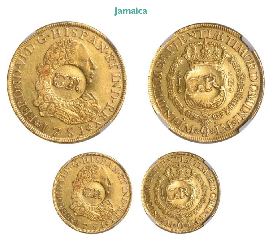
1344 Authority of November 1758, Doubloon (valued at Five Pounds), a Ferdinand VI, 8 Escudos, 1751, Lima, both sides centrally countermarked with floriate GR raised within a circular indent (Prid. 1; Gordon 1; KM 11.3; F 1). Coin good very fine, countermarks very fine, very rare [slabbed NGC XF 45] £20,000-£26,000