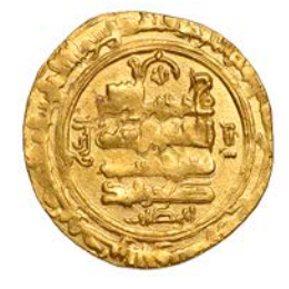
1776 Tughril Beg, Dinar, Madinat al-Salam 449h, 3.52g/1h (Jafar S.MS.449A; A 1665; ICV 1811). Some weakness of strike, otherwise about extremely fine, rare £300-£400