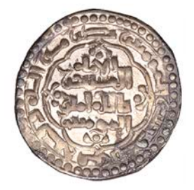
1747 al-Mustansir, Dirham, Madinat al-Salam 636h, 2.82g/6h (Jafar 139; A 272; ICV 472). Minor hornsilver, otherwise very fine £100-£120