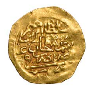
1648 Ibrahim , Sultani, Misr, date (1049) unclear, 3.41g/10h (Pere 429; A 1376; ICV 3209). Minor peripheral weakness, very fine, rare £300-£400