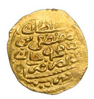
1652 Mustafa II, Sultani, Misr 1106h, 3.43g/7h (OC 22-021; ICV 3252). Minor peripheral weakness, good very fine, rare