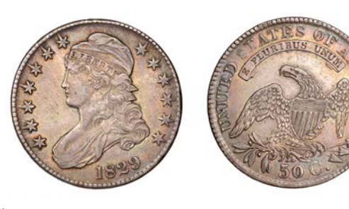
1548 Half-Dollar, 1829. Very fine and toned