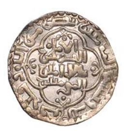
1748 al-Mustansir, Dirham, Madinat al-Salam 637h, 2.99g/5h (Jafar 143; A 272; ICV 472). Slightly wavy flan, very fine