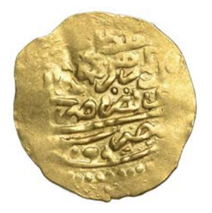
1650 Suleyman II, Sultani, Misr 1099h, 3.47g/12h (OC 20-009; ICV 3230). Flat in parts, otherwise very fine, rare