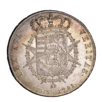
1329 TUSCANY , Ferdinand III , Francescone, 1791, Pisa, 27.48g/6h (MIR 404/1; Dav. 1521). Some minor marks, otherwise good very fine and toned, rare