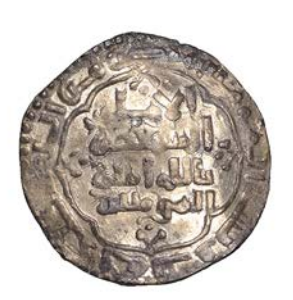
1751 al-Musta'sim, Dirham, Madinat al-Salam 640h, 2.90g/3h (Jafar 162; A 276; ICV 475). Slightly bent, otherwise good very fine