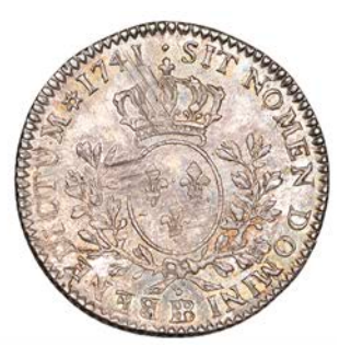
1194 Louis XV , Fifth-Écu au bandeau, 1741BB, Strasbourg, 5.89g/6h (Dup. 1682; Gad. 299). Some light adjustment marks, otherwise extremely fine and toned £200-£260