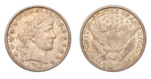
1553 Half-Dollar, 1913. About extremely fine, scarce