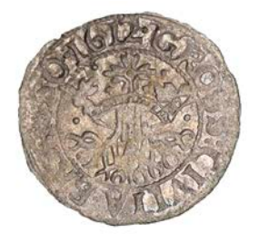
1441 TRANSYLVANIA , Brasov (Kronstadt) , City coinage, Groschen, 1612, 1.06g/5h (Resch 5ff). Small perforations in margin, otherwise good very fine, rare