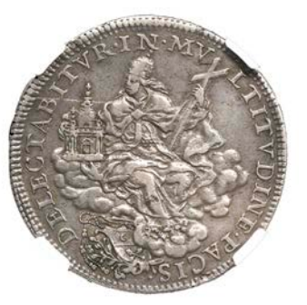
1338 Innocent XII , Half-Piastra, yr II [1692] (Berman 2234; KM 554). Scratch on face, otherwise very fine [slabbed NGC XF Details, Obv Scratched]