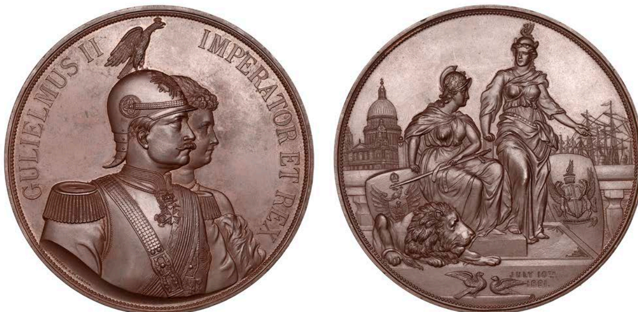
x 1189 Visit of Emperor Wilhelm II to the City of London , 1891, a bronze medal by Elkington & Co. for the Corporation of the City of London, conjoined busts of the Emperor and Empress three-quarters right, rev. Germania seated to left, Britannia standing to right, each flanked by shield of arms, 80mm (W & E 1668A.1; BHM 3412; E 1768). Good extremely fine £400-£500

Sir William Henry Perkin FRS (12 March 1838 – 14 July 1907) was a British chemist and entrepreneur best known for his accidental discovery of the first commercial synthetic organic dye, mauvein, in 1856.