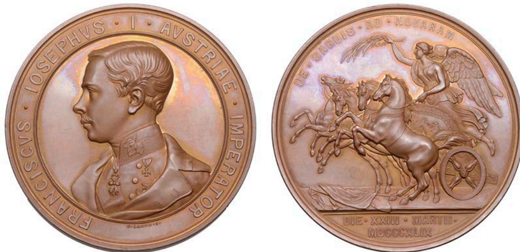
1262 AUSTRIA, Battle of Novara , 1849, a bronze medal by C. Lange, uniformed bust of Franz Joseph I left, rev. Victory in quadriga left, 64mm (BDM III, 298). Good extremely fine £100-£120