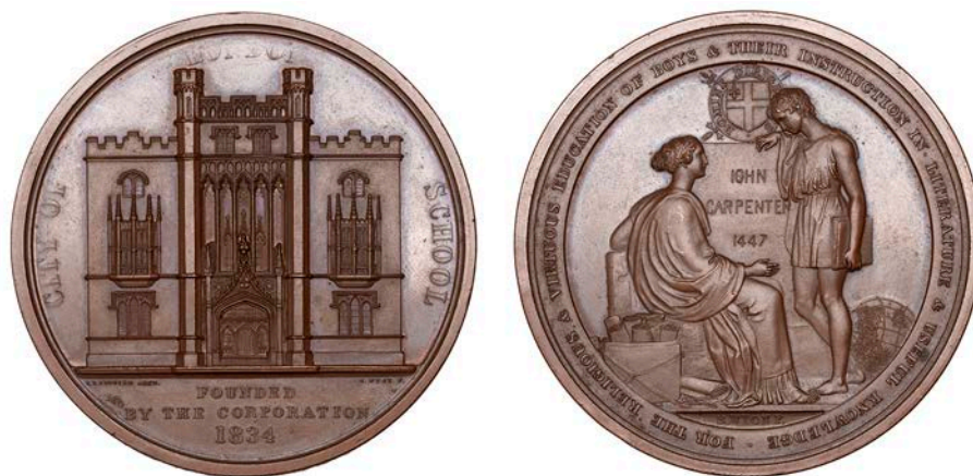
x 1133 Foundation of the City of London School , 1834, a copper medal by B. Wyon, façade of building, rev. youth with seated figure of Knowledge, 58mm (BHM 1680; E 1279; Taylor 120a). Good extremely fine £100-£120