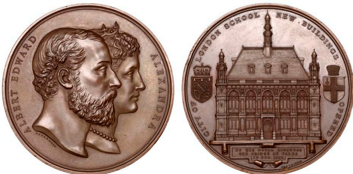
x 1172 City of London School, New Buildings Opened , 1882, a bronze medal by J.S. & A.B. Wyon for the Corporation of the City of London, conjoined busts of the Prince and Princess of Wales right, rev. frontal elevation of the School, 77mm (VW & E 1461A.1; BHM 3133; E 1690; Taylor 202a). Extremely fine £300-£400