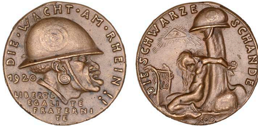
1290 GERMANY, The Watch on the Rhine , 1920, a cast bronze medal by K. Goetz, helmeted African head right, rev. naked female tied to helmeted erect penis, 58mm (K 262). Some casting flaws, otherwise good very fine £100-£120