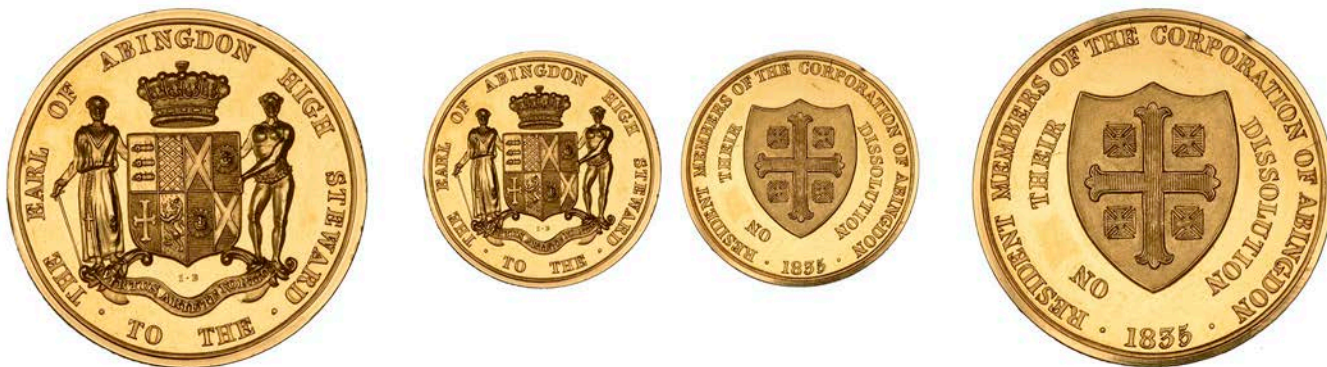
1134 Corporation of Abingdon , 1835, a gold medal, signed I.B. (?), THE EARL OF ABINGDON HIGH STEWARD TO THE, crowned arms with supporters, rev. RESIDENT MEMBERS OF THE CORPORATION OF ABINGDON ON THEIR DISSOLUTION, arms of Abingdon on shield, 32mm, 28.28g. Fields lightly hairlined, small edge knock, otherwise extremely fine, rare; in contemporary fitted case by Rundell Bridge & Co., Ludgate Hill £1,000-£1,200

Provenance: Phillips Auction 31140, date unknown, lot 823; Royal Berkshire Collection