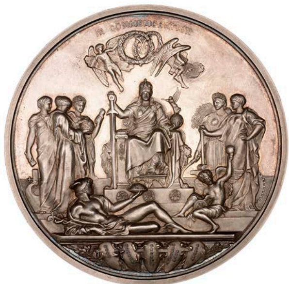
1181 Victoria, Golden Jubilee, 1887 , a silver medal by L.C. Wyon after Sir J.E. Boehm and Sir F. Leighton, crowned bust left, rev. enthroned figure of Empire surrounded by standing figures representing Science, Letters, Art, etc, Mercury and Time below, 77mm, 216.64g (W & E 2000A.2; BHM 3219; E 1733b). Fields hairlined, otherwise extremely fine; in official case of issue £800-£1,000