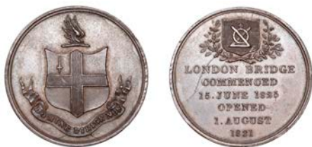
x 1130 Opening of London Bridge , 1831, a copper medal by B. Wyon, arms, crest and motto of the City of London, rev. inscription, Bridge House Estates mark within oak wreath above, 27mm (BHM 1545; E 1247). Extremely fine £60-£80