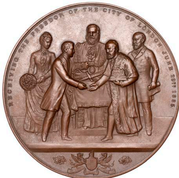
x 1176 Prince Albert Victor Receives the Freedom of the City of London , 1885, a bronze medal by G.G. Adams for the Corporation of the City of London, bare head right within wreath, rev. Prince and Princess of Wales watch Prince Albert receive the Freedom of the City from the Lord Chamberlain, 77mm (W & E 1500A.1; BHM 3182; E 1717). Good extremely fine £300-£400