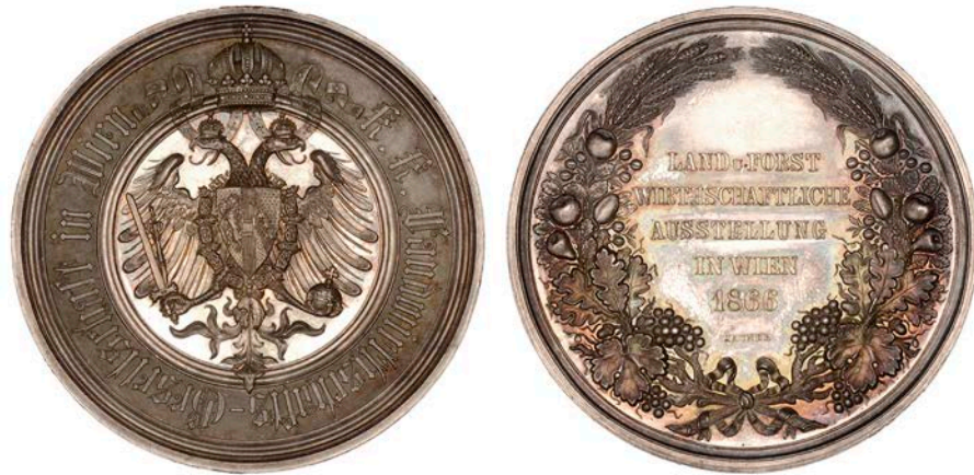
1265 AUSTRIA, Agriculture and Forestry Exhibition, Vienna, 1866 , a silver medal by H. Jauner, crowned imperial eagle, rev. legend within wreath, 57mm, 87.24g. Good extremely fine £200-£260