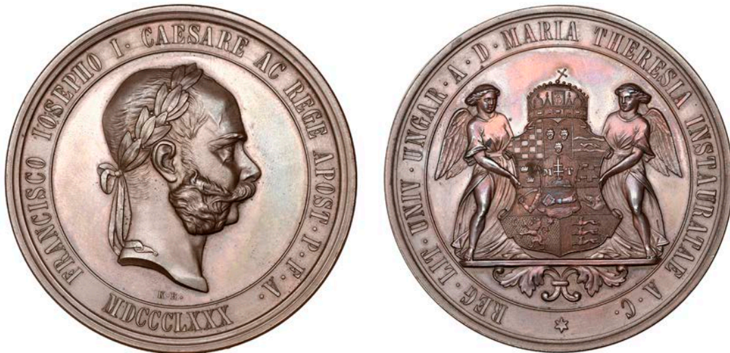
1295 HUNGARY, University of Hungary , 1880, a bronze medal, unsigned [by K. Gerl], laureate head of Franz Joseph I right, crowned arms supported by two angels, 68mm. Extremely fine; in fitted case £100-£120