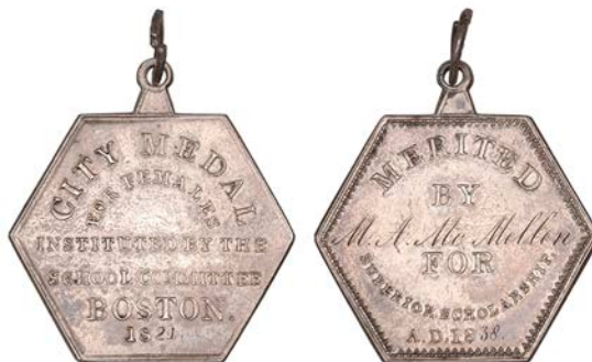
1300 USA, Boston, City Medal for Females , a hexagonal silver award, CITY MEDAL FOR FEMALES INSTITUTED BY THE SCHOOL COMMITTEE BOSTON 1821 (the 21 engraved), rev. MERITED BY M.A. McMellen FOR SUPERIOR SCHOLARSHIP A.D. 1838 (the 38 engraved), 35mm, 15.34g (Sallay C 3 [high R 6 , 3-30 specimens known]). Slightly speckled tone, nearly extremely fine, very rare; integral suspension loop with ring £150-£200