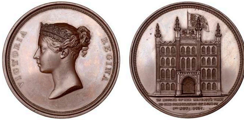
1140 Victoria, Visit to the City of London , 1837, a bronze medal by W. Wyon, diademed head left, rev. façade of the Guildhall, 55mm (W & E 72A.1; BHM 1775; E 1304). Extremely fine or better; in fitted case £300-£400