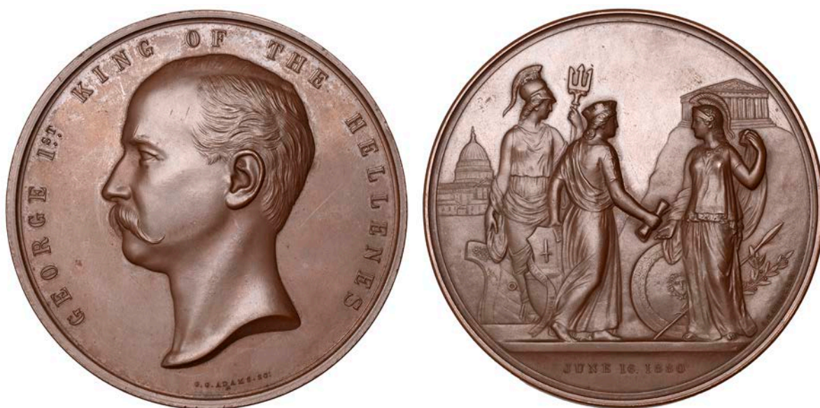
x 1170 Visit of George I of Greece to London , 1880, a bronze medal by G.G. Adams, bust left, rev. Londinia welcoming Hellas, Britannia behind, 76mm (W & E 1372.1; BHM 3077; E 1668). Extremely fine £300-£400