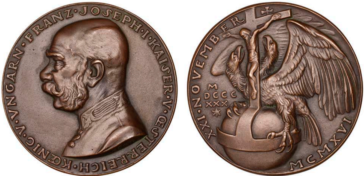
1267 AUSTRIA, Death of Franz Joseph I, 1916 , a cast bronze medal by K. Goetz, uniformed bust left, rev. Christ on cross of orb, eagle behind, 80mm (K 186). About extremely fine £150-£180