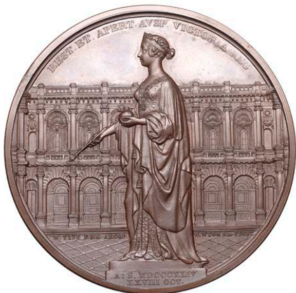
1147 Opening of the New Royal Exchange , 1844, a copper medal by W. Wyon, bust of Thomas Gresham left, rev. statue of Victoria in front of elevation of the Exchange, 73mm (W & E 447A.2; BHM 2185; E 1390). Extremely fine £150-£180