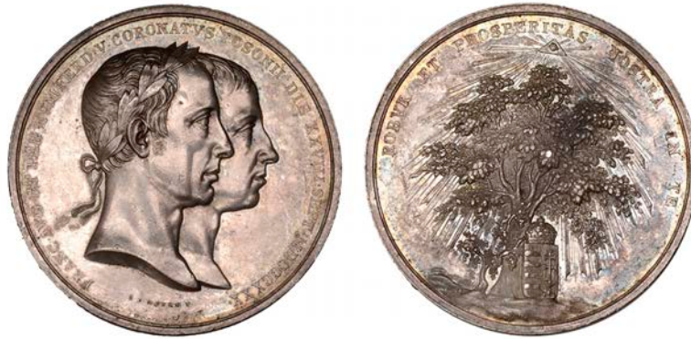
1294 HUNGARY, Coronation of Ferdinand V , 1830, a silver medal by J.D. Boehm, conjoined busts of Franz I and Ferdinand V right, rev. crowned shield resting against trunk of oak tree, 49mm, 43.86g (Mont. 2515; BDM I, 203). Lightly cleaned, otherwise about extremely fine £300-£400