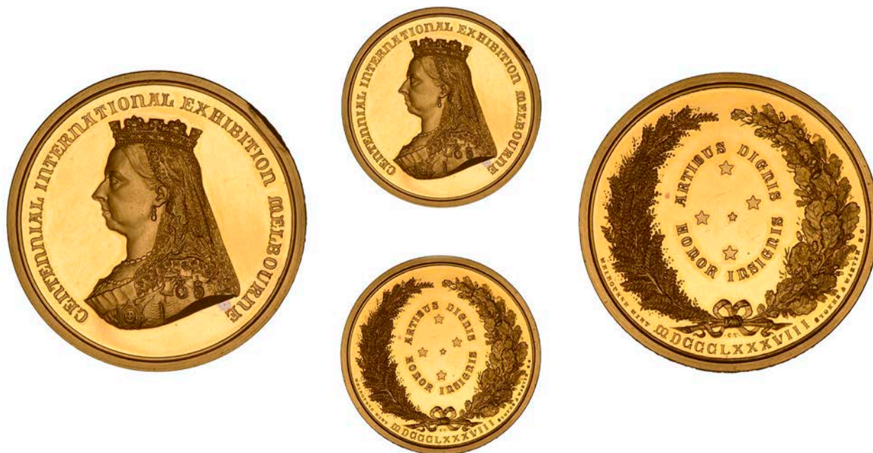
1255 AUSTRALIA, Centennial International Exhibition, Melbourne, 1888 , a gold award medal by Stokes & Martin, coronetted bust of Queen Victoria left, rev. legend within wreath, edge named (Doulton & Co.), 38mm, 45.75g. Edge bruise or file mark at 2 o'clock, otherwise virtually mint state and extremely rare thus; in fitted case of issue £3,000-£3,600

The recipients are doubtless the famous ceramics company based at Lambeth (south London) and Burslem (Staffordshire)