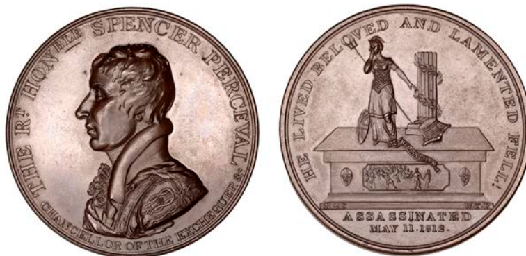
1111 Assassination of Spencer Perceval , 1812, a copper medal by W. Turnpenny for Kempson & Son, bust left, rev. weeping Britannia standing on tomb beside broken pillar, 49mm (BHM 729; E 1022). Extremely fine £100-£120