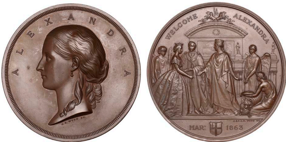
x 1160 Entry of Princess Alexandra into the City of London, 1863, a copper medal by J.S. & A.B. Wyon, bare head left, rev. Londinia welcoming the Prince of Wales and Princess Alexandra, 77mm (W & E 901A.1; BHM 2783; E 1561). Extremely fine £300-£400