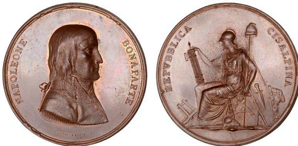
1296 ITALY, Foundation of the Cisalpine Republic , [1797], a copper medal by L. Manfredini, bust of Napoleon right, rev. Cisalpine Republic seated left, holding fasces and Liberty cap on staff, 63mm (Julius 553; BDM III, 554). Extremely fine with some original colour, rare £300-£400