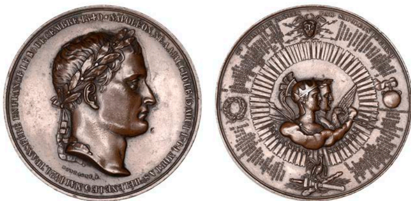
1283 FRANCE, Transfer of Napoleon's Remains to Les Invalides , 1840, a copper medal by J.-P. Montagny [struck 1841-2], laureate head right, rev. conjoined busts of Genius of France and Napoleon right within rayed circle, names of battles around, 53mm (Bramsen 1993). About extremely fine, scarce £100-£120