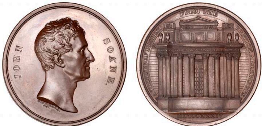
1132 Sir John Soane , 1834, a bronze medal by W. Wyon, bare head right, rev. façade of the Bank of England, 57mm (BHM 1662; E 1278). Extremely fine £120-£150