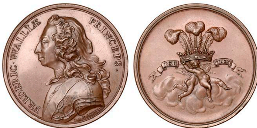
1098 Frederick, Prince of Wales , [c. 1744-7], a copper medal by J.-A. Dassier, armoured bust left, rev. Prince of Wales' feathers supported by two cherubs, 54mm (Eisler 344; E 631). About extremely fine £150-£180