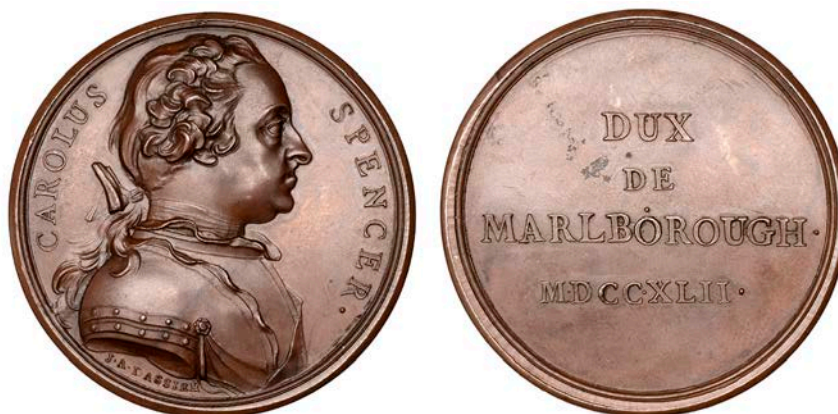
1094 Charles, Duke of Marlborough , 1742, a copper medal by J.-A. Dassier, armoured bust right, rev. legend, 55mm (Eisler 331; E 568). About extremely fine £80-£100