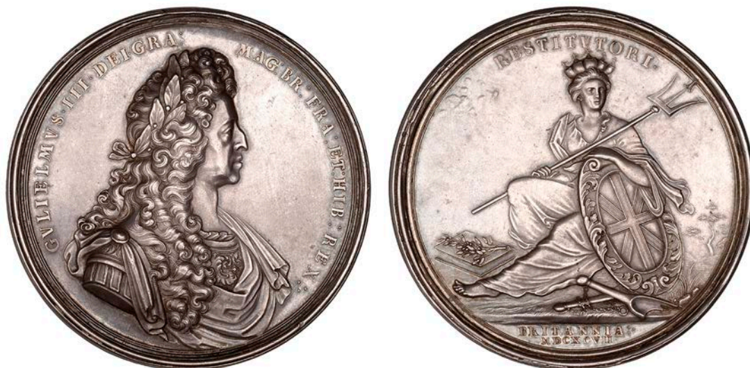
1084 Treaty of Ryswick , 1697, a silver medal, unsigned [by J. Croker], laureate, armoured and draped bust right, rev. RESTITVTORI, Britannia seated left, holding trident and shield, 69mm, 104.03g (MI II, 192/499; Pax 348; E 372). A few minor marks, otherwise extremely fine; in fitted case [this somewhat distressed] £1,500-£1,800