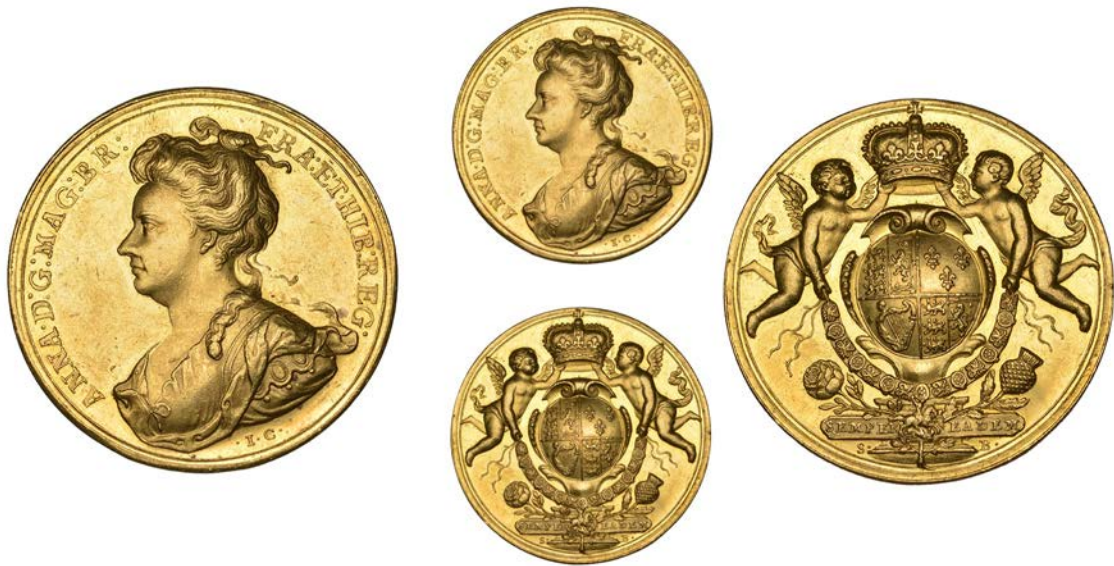
1089 Union of England and Scotland , 1707, a gold medal by J. Croker & S. Bull, bust of Queen Anne left, rev. arms of Britain upon escutcheon, crown above supported by two cherubs, 34mm, 23.31g (MI II, 296/111; E 425). Minor surface marks and hairlines, nearly extremely fine, very rare in gold £5,000-£7,000