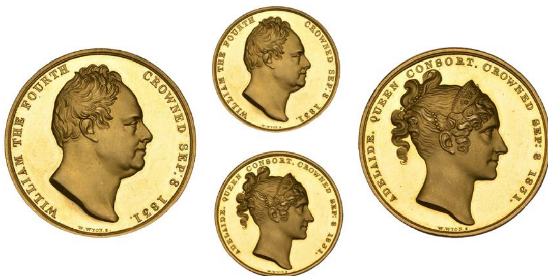
1125 William IV, Coronation , 1831, a gold medal by W. Wyon, bust right, rev. bust of Queen Adelaide right, 33mm, 27.45g (BHM 1475; E 1251). Fields faintly hairlined, otherwise good extremely fine, rare thus; in original fitted case £6,000-£8,000