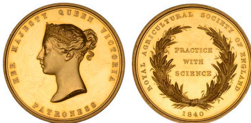
1145 Royal Agricultural Society , 1840, a gold medal by W. Wyon, diademed head of Victoria left, rev. legend within wreath, 55mm, 123.17g (BHM 1985; E 1340). Fields hairlined, some surface marks, otherwise extremely fine, rare; in fitted case £7,000-£9,000