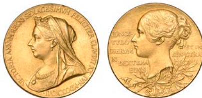
1195 Victoria, Diamond Jubilee , 1897, a small gold medal by G.W. de Saulles, similar, 26mm, 12.79g (W & E 3000A.2; BHM 3506; E 1817b). Lightly wiped, otherwise about extremely fine; in case of issue £800-£1,000