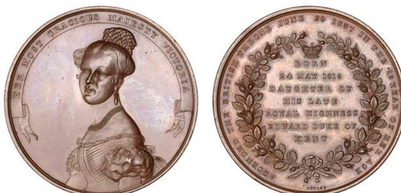
1139 Victoria, Accession, 1837 , a bronze medal by J. Ottley, half-length bust three-quarters left, rev. legend within wreath, 51mm (W & E 40A.2; BHM 1762). Extremely fine, rare £150-£180