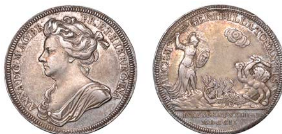
1086 Anne, Coronation , 1702, a silver medal, unsigned [by J. Croker], draped bust left, rev. Anne, as Pallas, standing, hurling thunderbolt at two-headed monster, 35mm, 15.75g (MI II, 228/4; E 390). About very fine, toned £150-£200