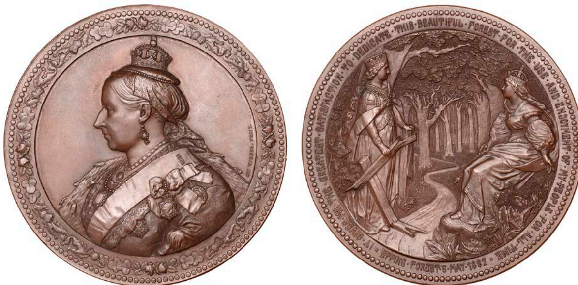
x 1171 Dedication of Epping Forest , 1882, a copper medal by C. Wiener for the Corporation of London, crowned and draped bust of Queen Victoria left, rev. view of the forest, Londinia standing at left, Victoria seated at right, 76mm (W & E 1400; BHM 3128; E 1689). Extremely fine £300-£400