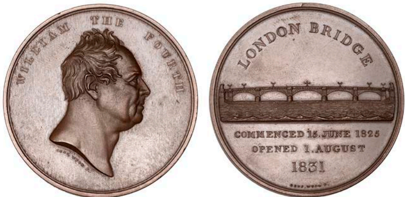
x 1129 Opening of London Bridge , 1831, a copper medal by B. Wyon, bust of William IV right, rev. view of the bridge, 51mm (BHM 1544; E 1245). Extremely fine £100-£120