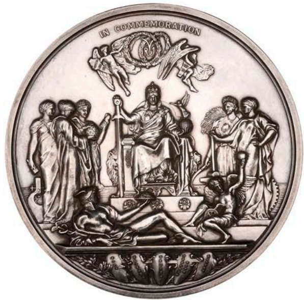
1180 Victoria, Golden Jubilee, 1887 , a silver medal by L.C. Wyon after Sir J.E. Boehm and Sir F. Leighton, crowned bust left, rev. enthroned figure of Empire surrounded by standing figures representing Science, Letters, Art, etc, Mercury and Time below, 77mm, 217.56g (W & E 2000A.2; BHM 3219; E 1733b). Fields brushed, otherwise extremely fine; in case of issue £1,000-£1,200