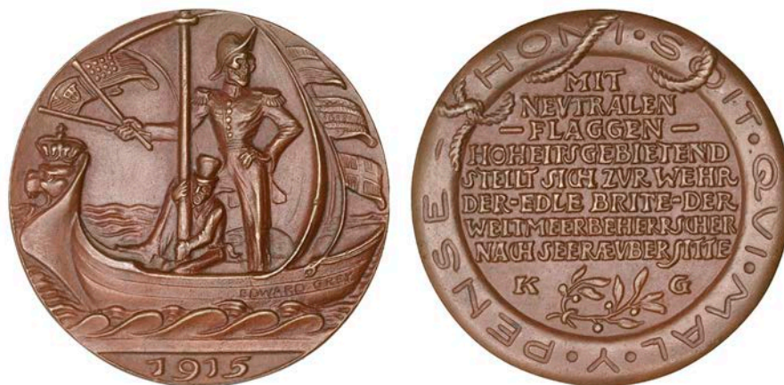
1289 GERMANY, Abuse of Neutral Flags , 1915, a cast bronze medal by K. Goetz, skeleton in naval uniform standing in ship, holding two flags, rev. legend within garter, 57mm (K 165). About extremely fine £120-£150