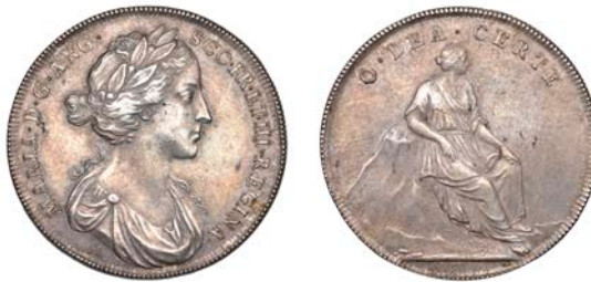
1081 Mary of Modena, Coronation , 1685, a silver medal by J. Roettiers, laureate and draped bust right, rev. queen seated right on a mound, 34mm, 15.13g (MI I, 606/7; E 274). Very fine £150-£180