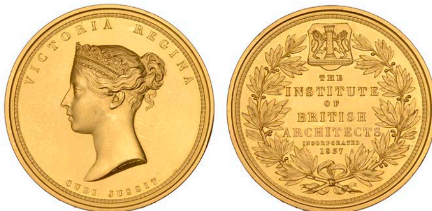
1142 Institute of British Architects (Inc. 1837), a gold medal by W. Wyon, diademed head of Victoria left, rev. legend within wreath, 55mm, 118.41g (BHM 1792). Some surface marks, otherwise about extremely fine, very rare; in contemporary fitted case £7,000-£9,000