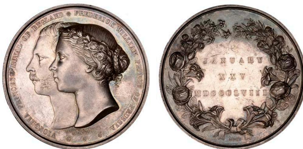
1157 Marriage of the Princess Royal and Frederick William of Prussia , 1858, a silver medal by L.C. Wyon for Hunt & Roskell, conjoined busts left, rev. date within wreath, 63mm, 121.68g (W & E 758A.3; BHM 2627; E 1517). Fields lightly brushed, some surface marks, otherwise extremely fine £600-£800