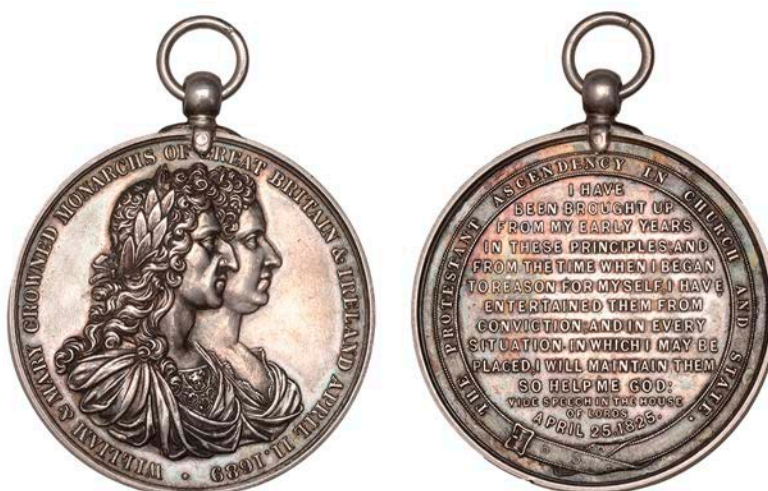
1119 Loyalist Association , 1825, a silver member's medal, unsigned, conjoined busts of William and Mary, rev. Duke of York's speech to the House of Lords, 49mm, 56.29g (cf. BHM 1248). Very fine, loop attached, very rare £150-£180