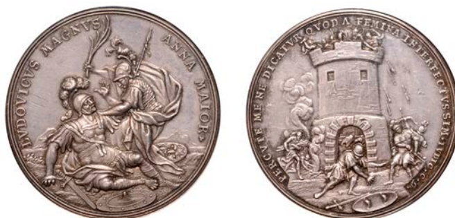
x 1088 Victories over Louis XIV , [1706], a silver medal, unsigned [by P.H. Müller], Anne as Minerva subduing Louis as a Roman warrior, rev. besieged tower, edge inscribed, 43mm (MI II, 289/98; E 422). Some marks and scrapes, otherwise about extremely fine [certified and graded by PCGS as Genuine, Scratch - AU Detail] £300-£400