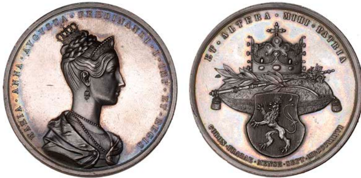
1259 AUSTRIA, Coronation of Maria Anna in Prague , 1836, a bronze medal by J.D. Boehm, crowned bust right, rev. crown, sceptre and laurel branch on cushion, arms below, 47mm (Mont. 2558; BDM I, 203-4). Lightly cleaned, otherwise extremely fine £100-£120