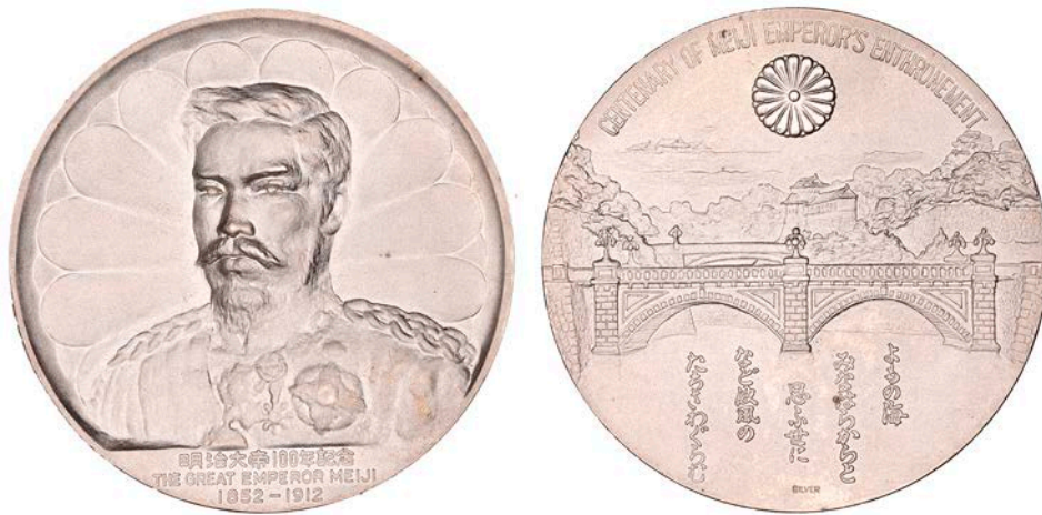
1297 JAPAN. Centenary of the Enthronement of Emperor Meiji , [1968], a silver medal, uniformed bust of Mutsuhito facing, rev. bridge, chrysanthemum flower above, 60mm. Extremely fine £100-£120