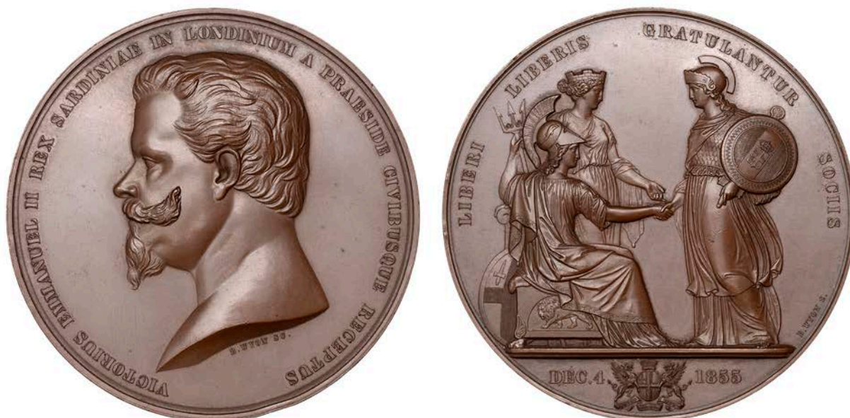
x 1155 Reception of Victor Emanuel II of Sardinia at the Guildhall , 1855, a copper medal by B. Wyon for the Corporation of the City of London, bare head left, rev. Britannia and Londinia greet Sardinia, 76mm (W & E 717A.1; BHM 2567; E 1499). Good extremely fine £300-£400