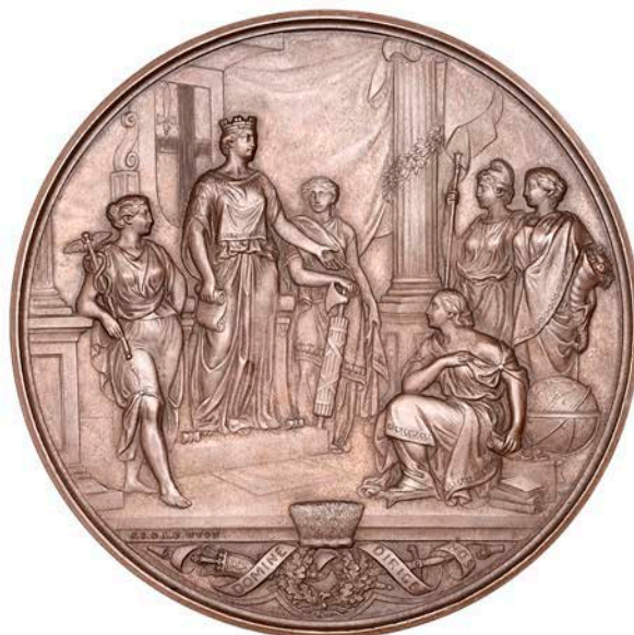
x 1175 Opening of the New Council Chamber at the Guildhall , 1884, a bronze medal by J.S. & A.B. Wyon for the Corporation of the City of London, interior of the Chamber, rev. Londinia, attended by Commerce and Magistracy, addressing her council, 77mm (BHM 3177; E 1705; Taylor 206a). Extremely fine £400-£500