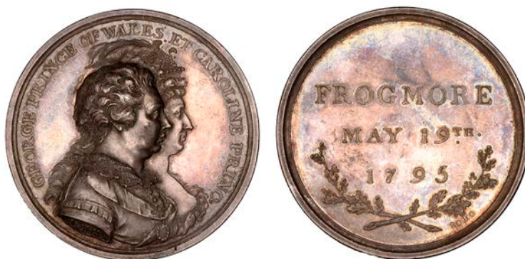
1105 Visit of the Prince and Princess of Wales to Frogmore , 1795, a silver medal by C.H. Küchler, conjoined busts right, rev. legend above wreath, 48mm, 64.83g (BHM 401; E 865b). Toned, about extremely fine, rare £400-£500