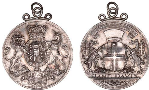
1108 City of London , silver Broker's Pass, c. 1801-30, by J. Milton, Royal arms, rev. City of London arms, named (Jane Davis), 40mm (E 936). Good very fine; with loop and ring for suspension £200-£260