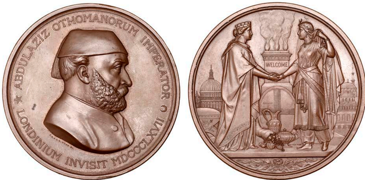
x 1162 Visit of Sultan Abdul Aziz to the City of London , 1867, a copper medal by J.S. and A.B. Wyon, bust right wearing fez, rev. Londinia greets figure of Turkey, symbolic buildings behind, 76mm (V & E 1065.1; BHM 2872; E 1591). Extremely fine £300-£400