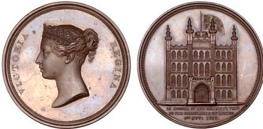
1141 Victoria, Visit to the City of London , 1837, a bronze medal by W. Wyon, diademed head left, rev. façade of the Guildhall, 55mm (W & E 72A.1; BHM 1775; E 1304). Extremely fine £240-£300