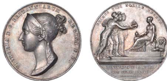
1144 Victoria, Coronation , 1838, a silver medal by B. Pistrucci, diademed bust left, rev. Victoria seated left, being offered the crown by Britannia, Scotia, and Hibernia, 37mm, 19.51g (BHM 1801; E 1315). Good very fine, toned £200-£260