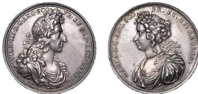
1083 William and Mary, Coronation , 1689, a silver medal by G. Hautsch, bust of William right, rev. bust of Mary left, edge CORONAT WEST MONAST D XI APRIL ANNO MDCLXXXIX, 40mm, 29.29g (MI I, 667/37). Good very fine, toned, very rare £300-£400