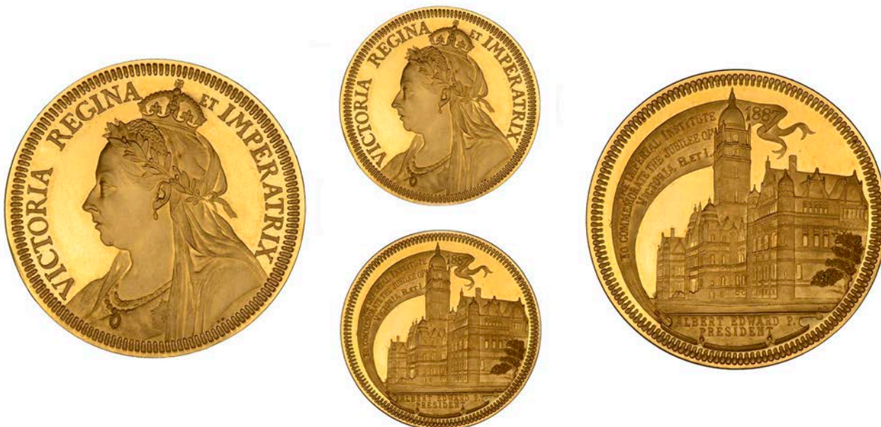
1184 Victoria, Golden Jubilee , 1887, a gold medal by T. Brock & J. Pinches for the Imperial Institute, crowned and laureate bust left, rev. elevation of the Institute, legend in banner to left, 38mm, 28.55g (V & E 2030A.4; BHM 3226; E 1737; Taylor 221b). Minimal hairlining, better than extremely fine and extremely rare thus; housed in a contemporary fitted case £2,400-£3,000

The obverse of this medal displays an early prototype bust by Thomas Brock, later modified for the 1893 Recoinage to replace Boehm's unpopular 'Jubilee' portrait.