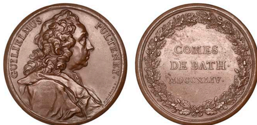
1097 William Pulteney , 1744, a copper medal by A. Dassier, bust right, rev. legend and date within wreath, 55mm (Eisler 338; E 585). Minor surface marks, otherwise good very fine £60-£80