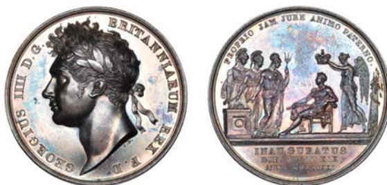
1118 George IV, Coronation , 1821, a silver medal by B. Pistrucci, similar, 35mm, 17.11g (BHM 1070; E 1146a). Good extremely fine, reflective fields with blue toning £300-£400