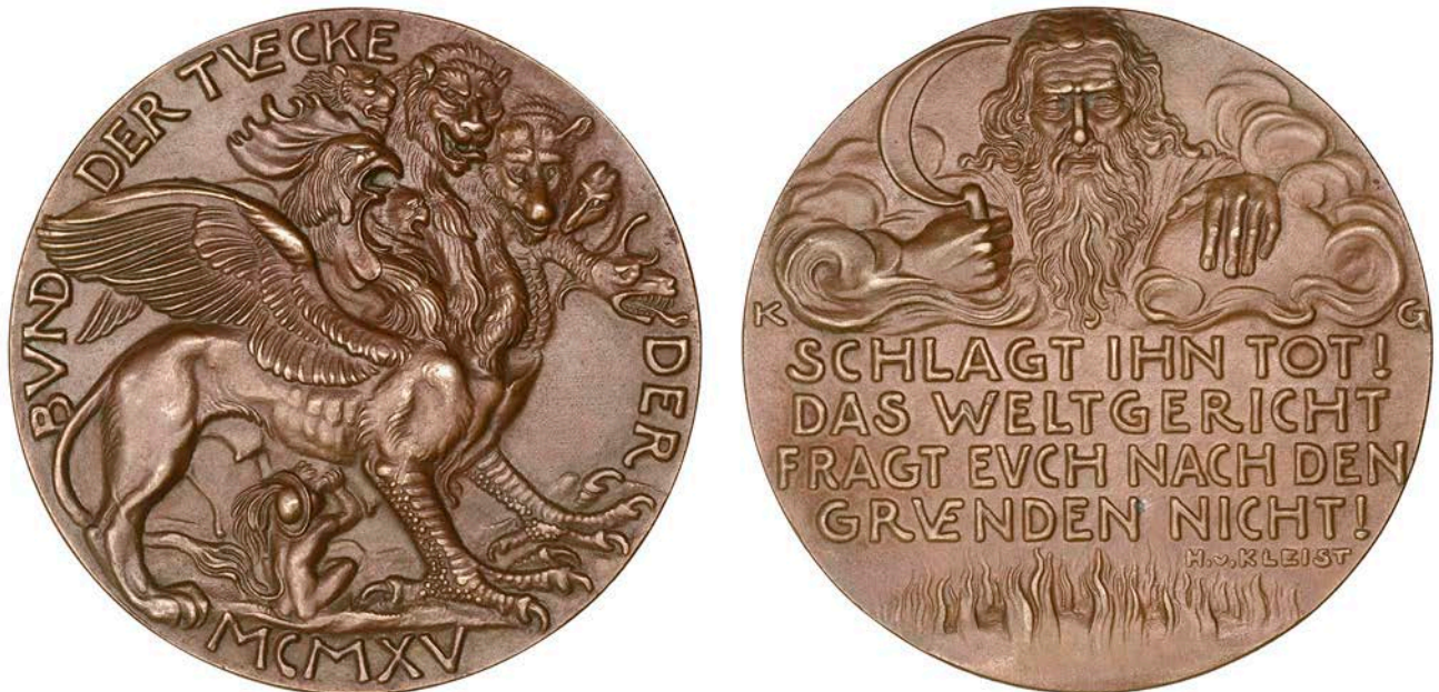
1288 GERMANY, Pact of Malice , 1915, a cast bronze medal by K. Goetz, many-headed monster right, infant suckling below, rev. legend, God in heaven above holding scythe, 82mm (K 160). About extremely fine £240-£300