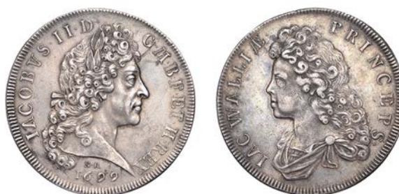
1085 Prince James and the Legitimacy of Succession , 1699, a silver medal by N. Roettiers, bust of James II right, rev. bust of Prince James left, 27mm, 13.02g (Woolf 15:4; MI II, 202/516; E 380). Good very fine and toned, rare £300-£400