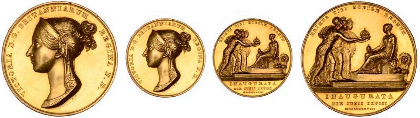
1143 Victoria, Coronation , 1838, a gold medal by B. Pistrucci, diademed bust left, rev. Victoria seated left, being offered the crown by Britannia, Scotia, and Hibernia, 37mm, 30.85g (W & E 88A.3; BHM 1801; E 1315). Fields brushed, otherwise extremely fine; in fitted case £4,000-£5,000