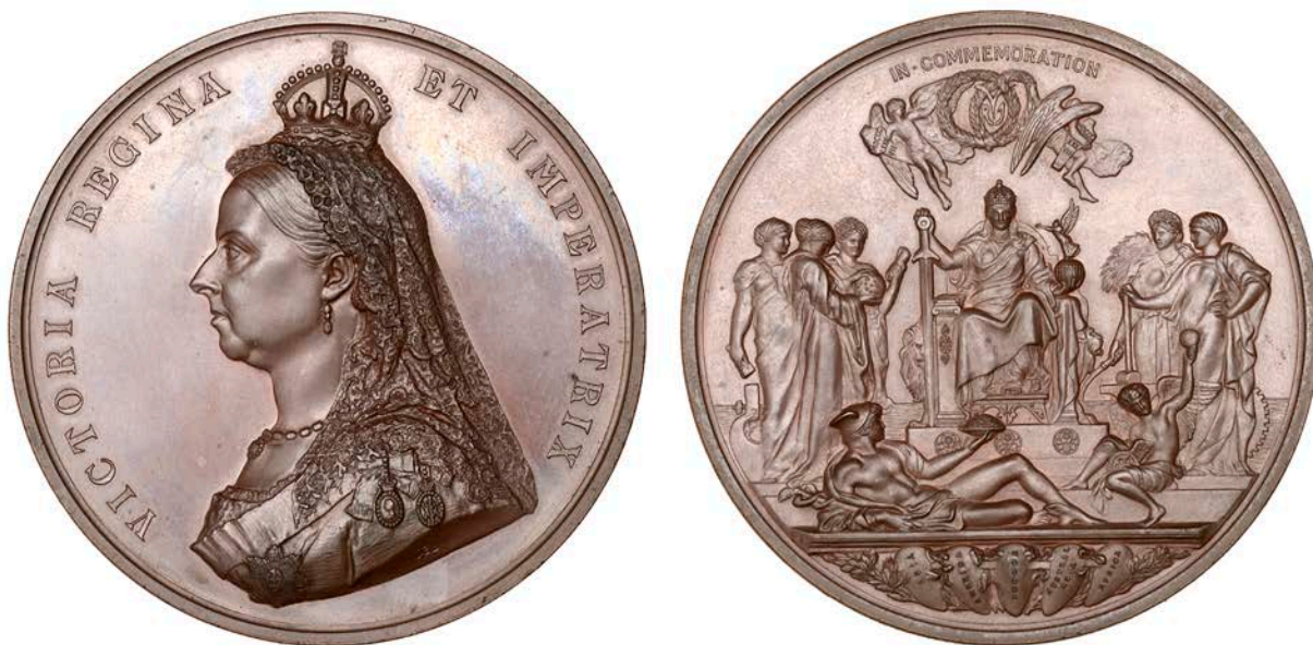
1182 Victoria, Golden Jubilee , 1887, a bronze medal by L.C. Wyon after Sir J.E. Boehm and Sir F. Leighton, crowned bust left, rev. enthroned figure of Empire surrounded by standing figures representing Science, Letters, Art, etc, Mercury and Time below, 77mm (V & E 2000A.2; BHM 3219; E 1733). Good extremely fine, in original fitted case retaining paper insert £200-£260