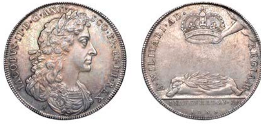
1080 James II, Coronation , 1685, a silver medal by J. Roettiers, laureate bust right, rev. crown held over wreath on cushion, 34mm, 15.48g (MI I, 605/5; E 273). Better than very fine, iridescent tone £200-£260