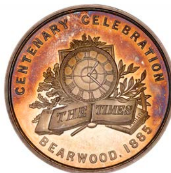
1177 Centenary of 'The Times' Newspaper , 1885, silver and bronze medals by Strongi'th'arm, three conjoined busts right, rev. clock, oak and laurel branches behind, each 45mm (BHM 3202; E 1712) [2]. Extremely fine £70-£90