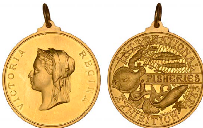
1173 International Fisheries Exhibition, South Kensington , 1883, a gold medal by L.C. Wyon and L.F. Day for Pinches, veiled and coronetted bust of Victoria left, rev. various types of fish, some in a net, 45mm, 62.35g (BHM 3153; E 1694; Allen Pt 3). With added loop for suspension and associated (?) mark on reverse, obverse surface wiped, otherwise nearly extremely fine, rare; in tan case of issue £4,000-£4,600