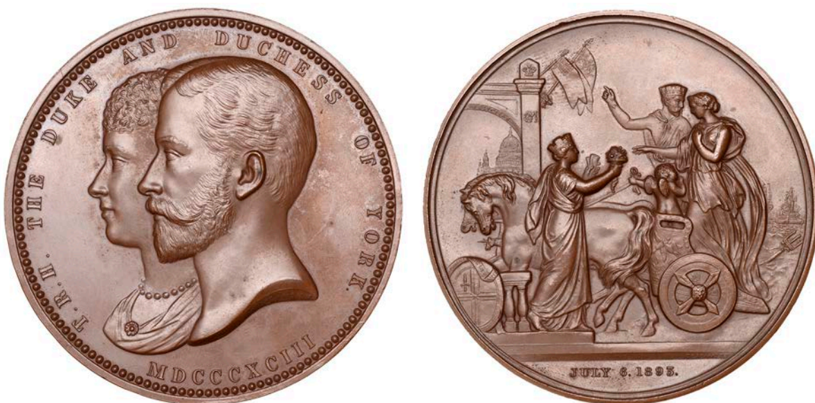
x 1190 Visit of the Duke and Duchess of York to the City of London , 1893, a bronze medal by G.G. Adams for the Corporation of the City of London, conjoined busts left, rev. Duke and Duchess in biga driven by Cupid, being presented with a cornucopia by Londinia, 76mm (W & E 1763A.1; BHM 3452; E 1780). Extremely fine £300-£400