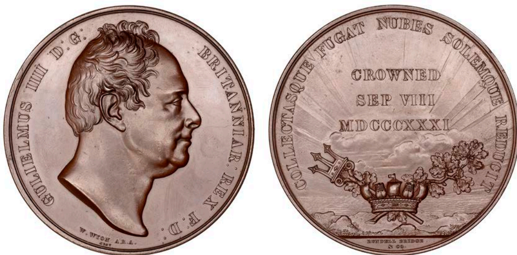
1127 William IV, Coronation , 1831, a copper medal by W. Wyon for Rundell Bridge & Co., bare head right, rev. crown with ship's sails and hulls as top ornaments, crossed trident and oak branch behind, 68mm (BHM 1476; E 1248). Extremely fine, scarce £200-£260