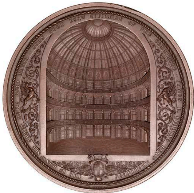
x 1149 Opening of the New Coal Exchange , 1849, a copper medal by B. Wyon for the Corporation of the City of London, medallion portraits of the Queen, Prince Albert, the Prince of Wales and the Princess Royal, rev. interior of the Coal Exchange, 89mm, flan thickness 10mm (W & E 581A.2; Taylor 161c; BHM 2357; E 1435). Good extremely fine £500-£700