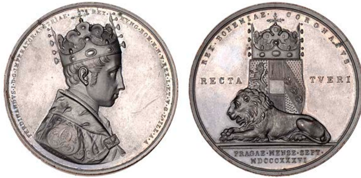
1258 AUSTRIA, Coronation of Ferdinand I in Prague , 1836, a bronze medal by J.D. Boehm, crowned bust right, rev. lion, crowned arms behind, 47mm (Mont. 2556; BDM I, 203). Extremely fine £200-£260