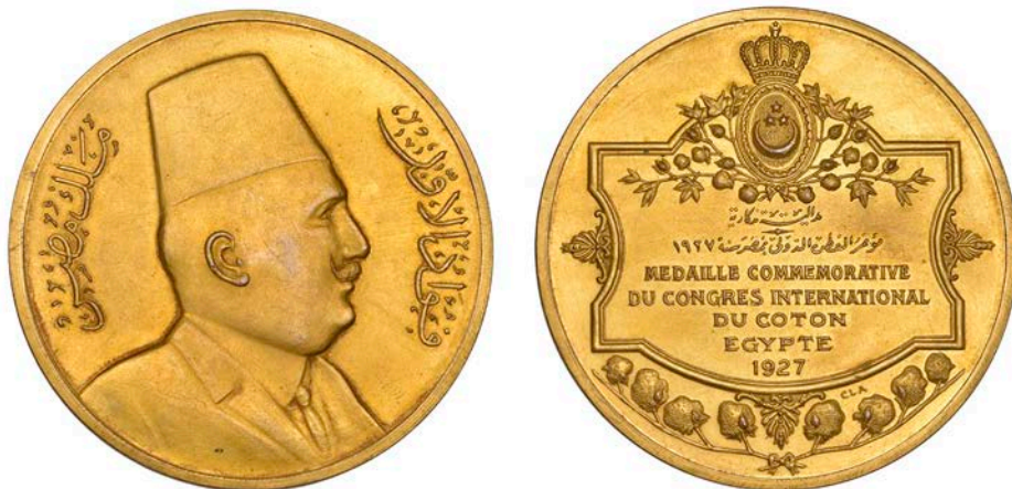
1268 EGYPT, International Cotton Congress, 1927 , a gilt-bronze medal, signed C.L.A., bust of Fuad right, rev. inscription within cartouche, 57mm. Gilding slightly worn on high points, otherwise about extremely fine £150-£180