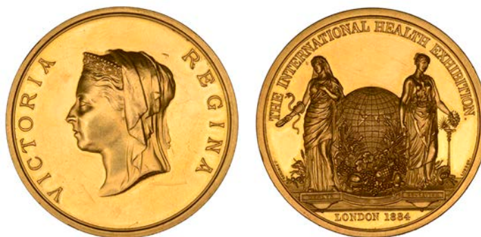
1174 International Health Exhibition, London , 1884, a gold medal by J.C. Wyon & J. Pinches, diademed and veiled head of Victoria left, rev. globe flanked by two standing female figures, 46mm, 57.88g (BHM 3175). Lightly cleaned with resultant hairlining, otherwise about extremely fine and rare; housed in a contemporary fitted case £3,600-£4,000