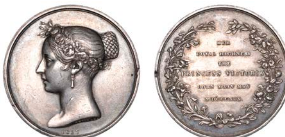
1138 Majority of Princess Victoria, 1837 , a silver medal by W. Wyon, head left with wreath of roses in hair, rev. inscription within wreath, 36mm, 27.56g (BHM 1745A; E 1294). Some surface and rim marks and nicks, otherwise good very fine and rare £150-£200