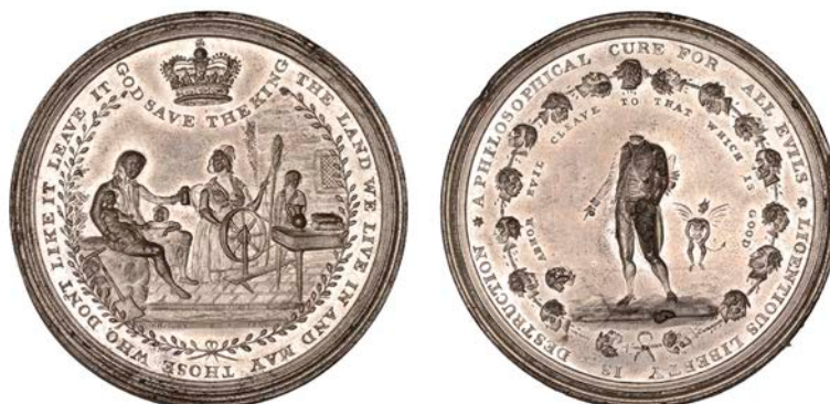
1106 Monarchy and Constitution , 1795, a white metal medal by W. Whitley, domestic scene within wreath, crown above, rev. decapitated French aristocrat, devil to right, 48mm (BHM 407; E 869). Extremely fine £120-£150