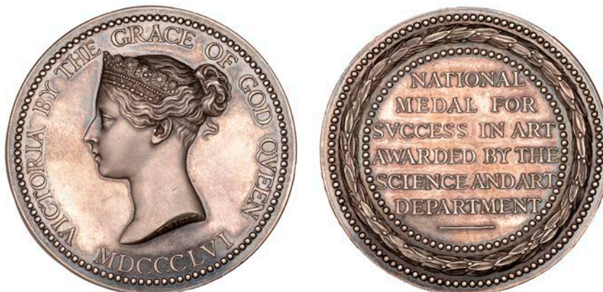
1169 Department of Science and Art , Queen's National Medal, a silver award by W. Wyon, diademed head left, rev. legend within wreath, edge named (William Mills, Birmingham, Stage 15A, 1879), 55mm, 93.83g (E 1511 var.). Extremely fine and toned; in fitted case by Wyon, 80 Boundary Road, London NW £200-£260