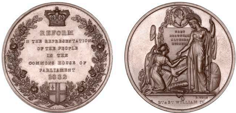
x 1131 Reform Bill Passed , 1832, a copper medal by B. Wyon for the Corporation of London, crowned legend in wreath, rev. Liberty presents Bill of Reform to Britannia, 51mm (BHM 1603; E 1254). Extremely fine £100-£120