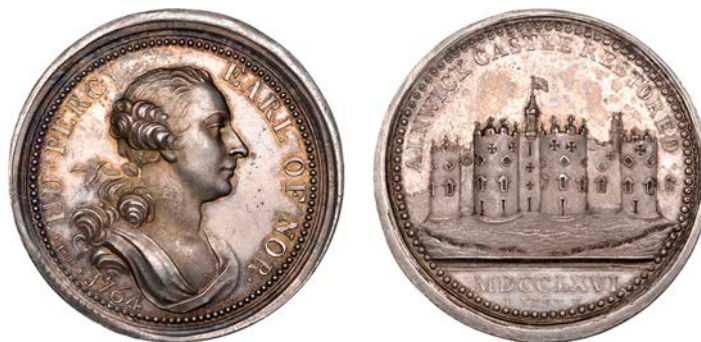
1103 Restoration of Alwick Castle , 1766, a silver medal by J. Kirk, bust of the Duke of Northumberland right, dated 1764 below, rev. view of the castle, 44mm, 39.80g (BHM 107; E 717 var.). Nearly extremely fine with peripheral toning, the variety with dated obverse extremely rare £300-£400