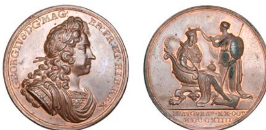
1092 George I, Coronation , 1714, a copper medal by J. Croker, laureate bust right, rev. Britannia crowning king, 34mm (MI II, 424/9; E 470). Good extremely fine, traces of original colour; some staining on reverse £150-£180