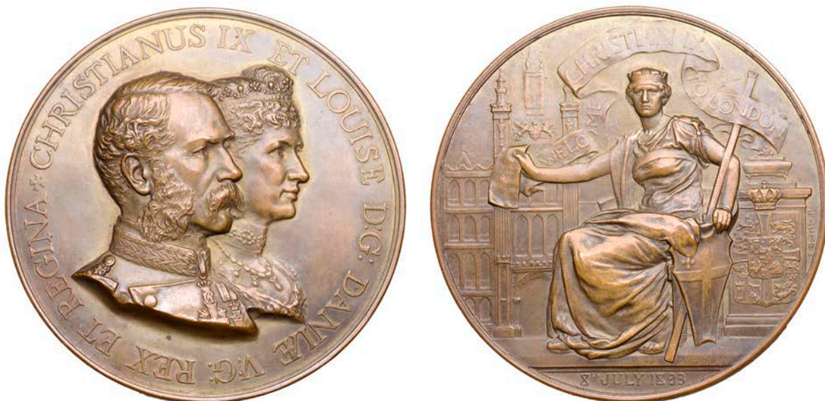
1191 Visit of Christian IX and Louise of Denmark to the City of London , 1893, a light bronze medal by F. Bowcher for the Corporation of the City of London, conjoined busts right, rev. Londinia seated, façade of the Guildhall behind, struck at the Paris Mint, 75mm (W & E 1766A.1; BHM 3454; E 1783). About extremely fine £150-£180