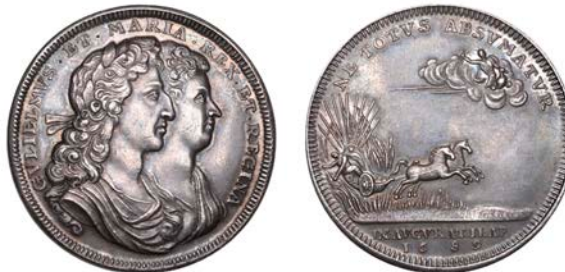
1082 William and Mary, Coronation , 1689, a silver medal, unsigned [by J. Roettiers], conjoined busts right, rev. Jove hurling a thunderbolt at Phæton who is falling from his chariot, 35mm, 21.36g (MI I, 662/25; E 312). Light marks, about extremely fine and toned £300-£400