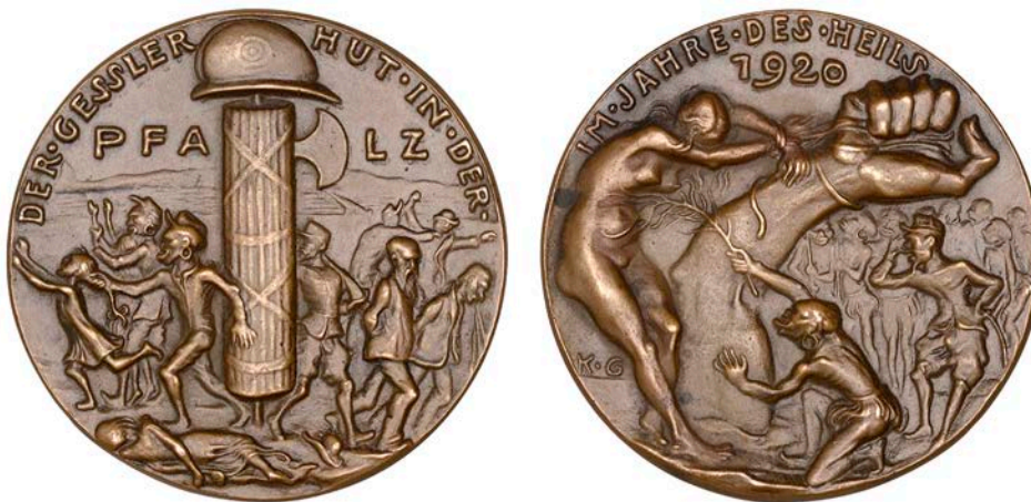
1291 GERMANY, The Gessler Hat in the Palatinate , 1920, a cast bronze medal by K. Goetz, helmeted fasces, rev. arms with clenched fist, 60mm (K 265). Good very fine £100-£120