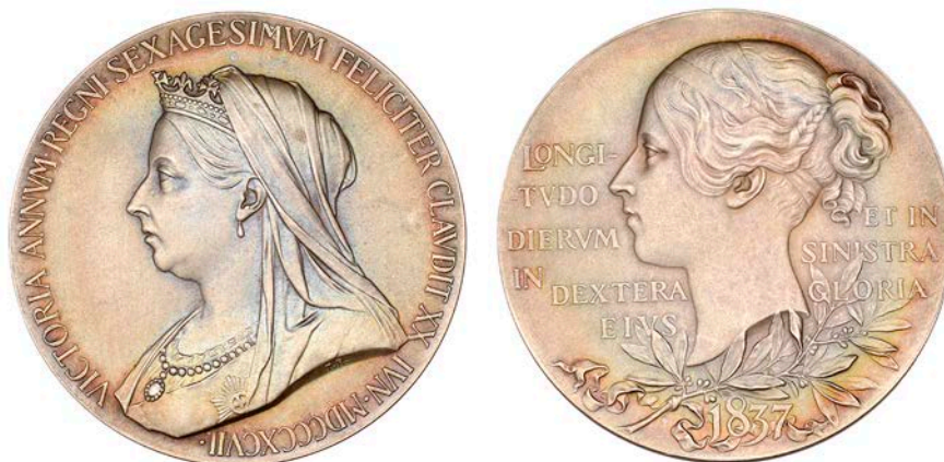
1196 Victoria, Diamond Jubilee , 1897, a silver medal by G.W. de Saulles, veiled bust left, rev. young head left, 55mm, 85.74g (W & E 3000A.4; BHM 3506; E 1817a). Good extremely fine, iridescent toning; in fitted case of issue £100-£120