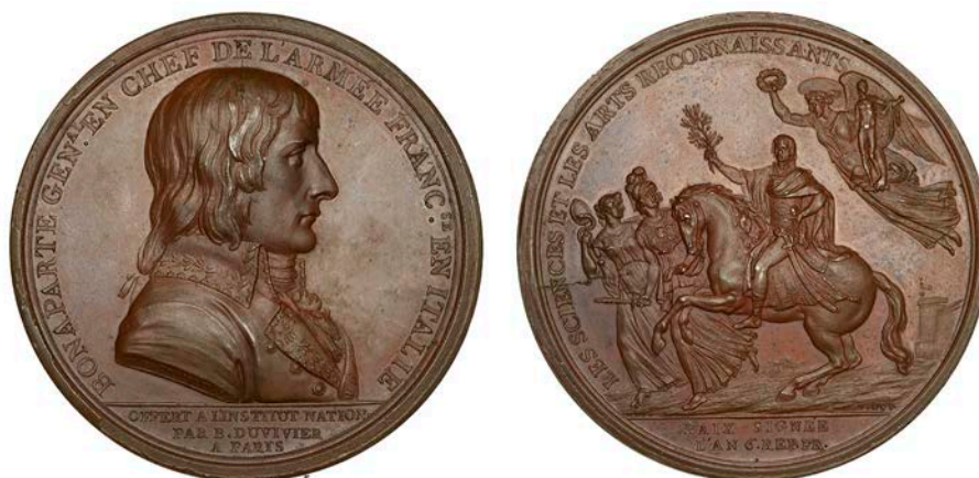
646 Treaty of Campo Formio , AN 6 [1797], a copper medal by B. Duvivier, uniformed bust of Napoleon right, rev. Napoleon on horseback left, accompanied by Wisdom and Valour, about to be crowned by Victory flying above, 58mm (Hennin 811; Julius 575; Pax 674). Good extremely fine £90-£120