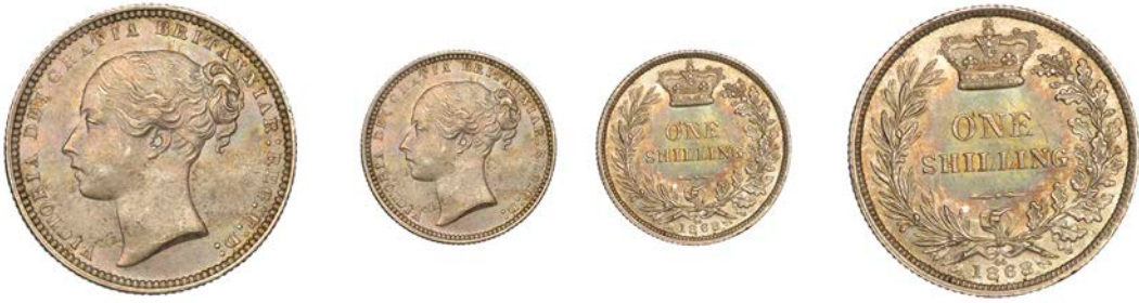
163 Shilling, 1868, die 44 (ESC 3036; S 3906A). Uneven tone, about extremely fine