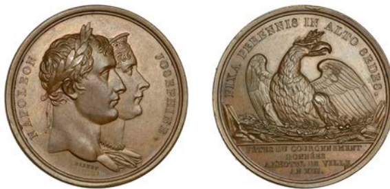
673 Coronation Celebrations , AN 13 [1804], a copper medal by N.G.A. Brenet, conjoined busts right, rev. imperial eagle, 36mm (Bramsen 359; Julius 1297); Extremely fine, tan patina, scarce £80-£100