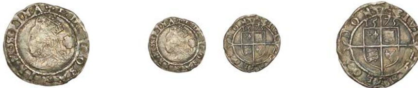
113 Fourth issue, Threehalfpence, 1575, mm. eglantine, bust 3G, 0.69g/1h (N 2000; S 2569). Good fine