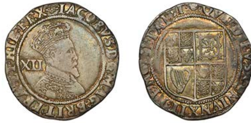
119 Second coinage, Shilling, mm. rose, third bust, 5.84g/6h (N 2099; S 2654). Attractive cabinet tone, good fine, reverse better