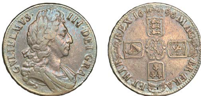
142 Crown, 1696, third bust, edge OCTAVO (ESC 1004; S 3472). Good fine or better