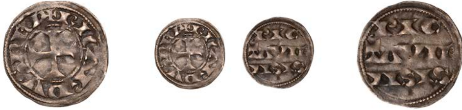
199 Richard I , Denier, Poitou, RICARDVS REX around cross pattée, rev. PICTAVIENSIS in three lines, 1.07g/6h (E 8; S 8008). Very fine