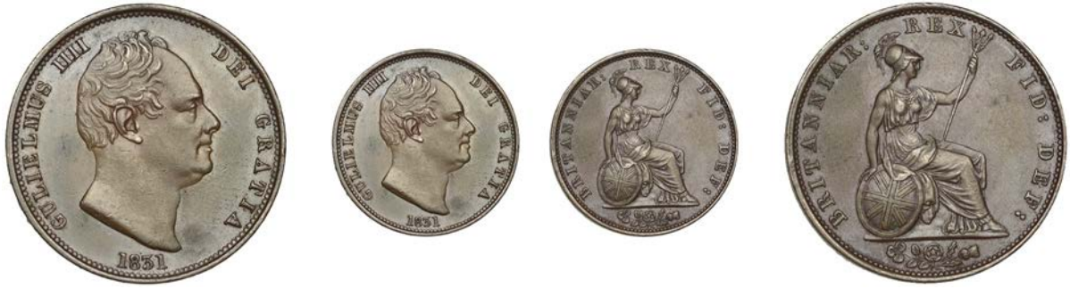
158 Halfpenny, 1831 (BMC 1461; S 3847). About extremely fine