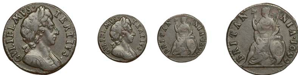
143 Farthing, 1699, type 2 (BMC 681; S 3558). Small mark on king's nose, good fine or better