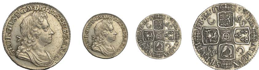
144 Shilling, 1723 ss c, first bust, c over ss under DUX (ESC 1590; S 3647). Once lightly cleaned but since retoned, otherwise good very fine