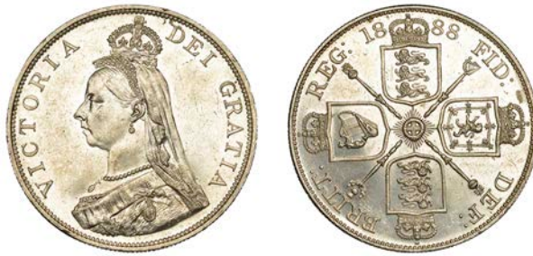
165 Double Florin, 1888 (ESC 2699; S 3923). Some bagmarks, about as struck