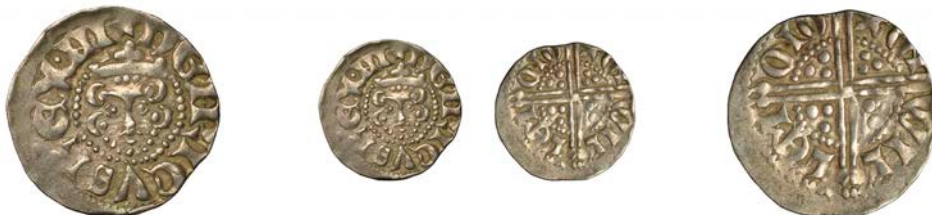
25 Penny, class IIIb, Oxford , Willem, WIL LEM ONO XON, 1.49g/11h (CT Ox67; N 986; S 1363). Slightly off-centre, about very fine, scarce £80-£100