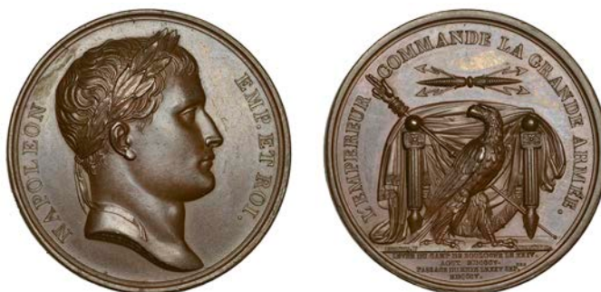
677 Breaking of Camp at Boulogne and Crossing of the Rhine , 1805, a copper medal by J.-P. Droz and N.G.A. Brenet, laureate bust of Napoleon right, rev. eagle standing in front of imperial throne, thunderbolt above, 40mm (Bramsen 430; Julius 1407; BDM I, 274). Light friction mark on eagle's breast, otherwise better than extremely fine £80-£100

The coronation was original scheduled to take place on 23 May, as stated in the exergue of the medal. It was actually held at Milan cathedral three days later, on the 26th