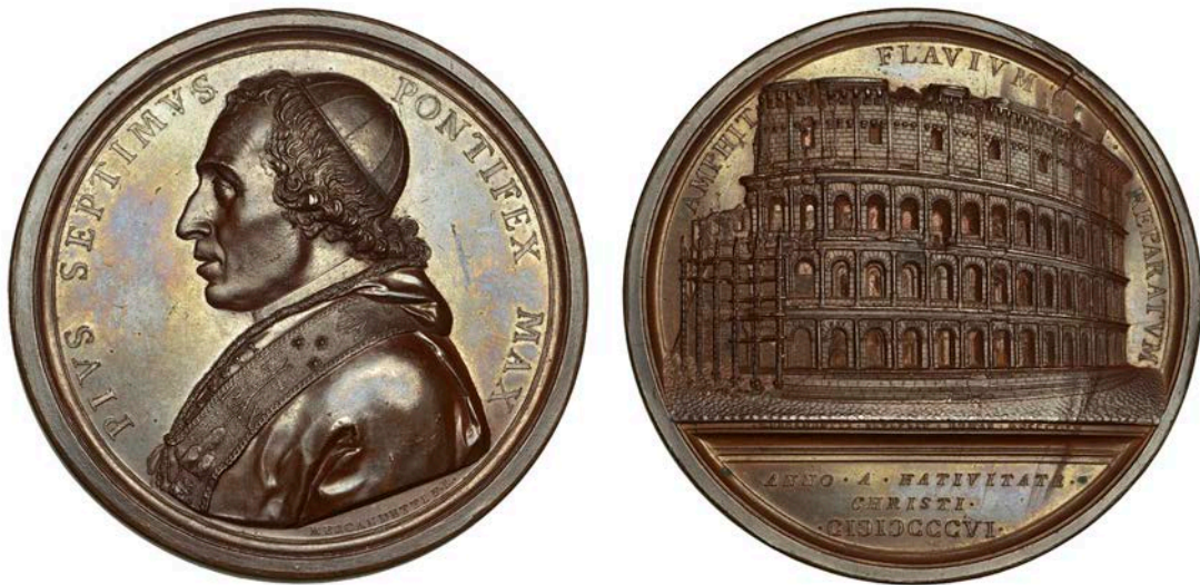
773 PAPAL STATES, Restoration of the Colosseum , 1806, a copper medal by T. Mercandetti, bust of Pius VII left wearing cap, cope and stole, rev. façade of the Colosseum, 68mm (Patrignani 45; Bartolotti 78; Weber 232). Minor die flaw at lower right on reverse, otherwise extremely fine or better, an impressive piece of architectural engraving £150-£200