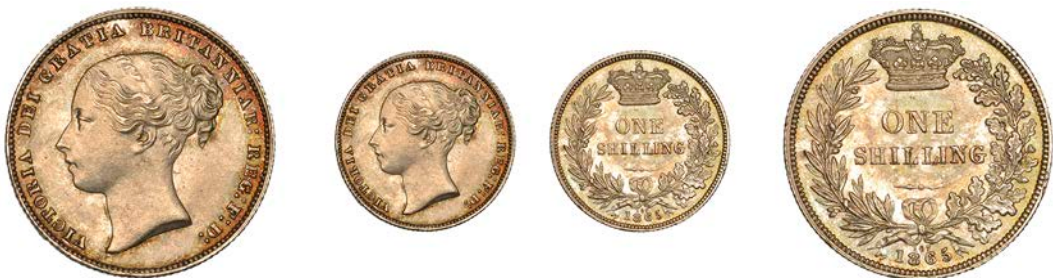
162 Shilling, 1865, die 107 (ESC 3025; S 3905). Attractively toned and lustrous, extremely fine or better