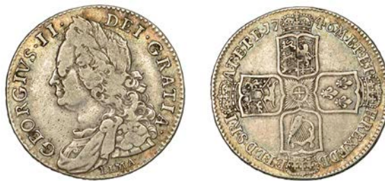
149 Halfcrown, 1746 LIMA, edge DECIMO NONO (ESC 1688; S 3695A). Better than fine