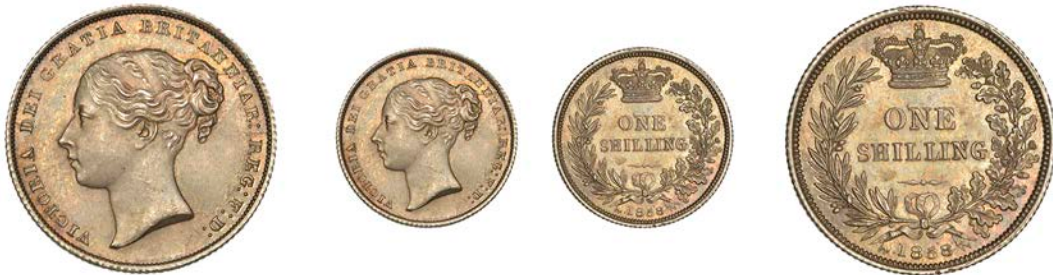
160 Shilling, 1858, broken 5 in date (ESC —; S 3904). Attractive grey cabinet tone, extremely fine