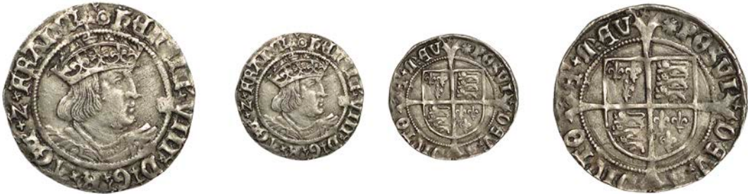
99 Second coinage, Groat, Tower, mm. rose, bust D, saltires in forks, 2.52g/4h (N 1797; S 2337E). Very fine, full flan, surfaces marked £200-£260