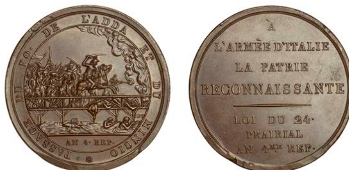
639 Passage of the Po, the Adda and the Mincio , AN 4 [1796], a copper medal by J. Salwirck, French army crossing the bridge at Lodi, rev. inscription, 43mm (Hennin 736; Julius 496). Small metal flaw on rim, otherwise extremely fine £80-£100