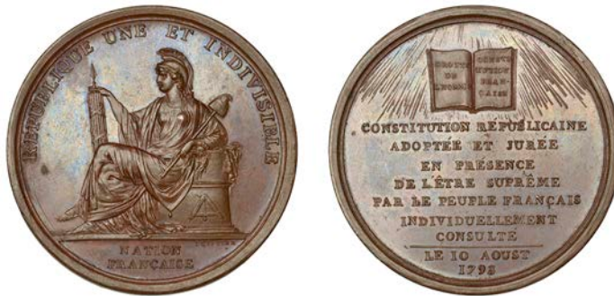
637 Introduction of the New French Constitution , 1793, a copper medal by B. Duvivier, draped figure of the Republic seated left, rev. inscription, open book above, 43mm (Hennin 526; Julius 329). Small carbon spot on obverse, otherwise extremely fine £80-£100