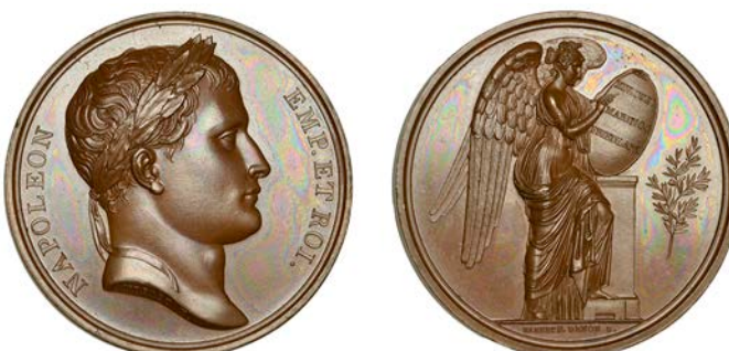
685 Battle of Friedland , 1807, a copper medal by B. Andrieu and A. Galle, laureate bust of Napoleon right, rev. Victory standing right, inscribing shield set on column, olive branch in field to right, 40mm (Bramsen 633; Julius 1740). Good extremely fine, attractive tan patina £80-£100