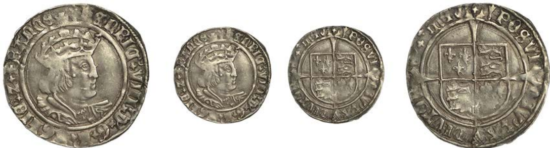
101 Second coinage, Groat, Tower, mm. arrow, bust D, saltires in forks, reads AGLIE Z FRANCE , 2.66g/9h (N 1797; S 2337E). Very fine, light marks, dark toned £120-£150