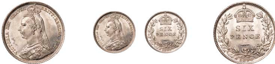
167 Sixpence, 1890 (ESC 3280; S 3929). Virtually mint state