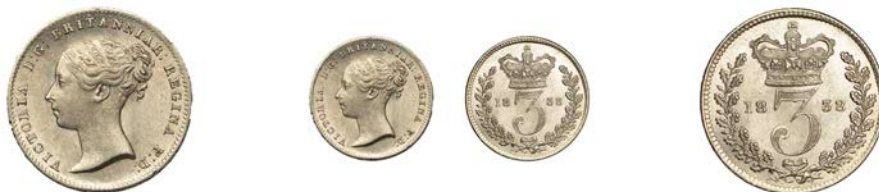
168 Threepence, 1838 (ESC 3362; S 3914). About mint state, scarce