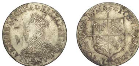
118 Milled coinage, Shilling, intermediate size, mm. star, 5.98g/6h (Borden & Brown 16 [O3/R3]; N 2023; S 2591). Good fine, small scuff on obverse, scarce