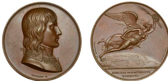
638 Battle of Montenotte , 1796, a copper medal by R. Gayrard and R. Jeuffroy, uniformed bust of Napoleon right, rev. Victory flying right over map of Italy and the Balkans, 40mm (Julius 491; BDM III, 73). Extremely fine £80-£100