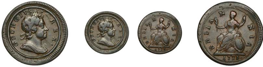
147 Farthing, 1721 (BMC 822; S 3662). Nearly very fine