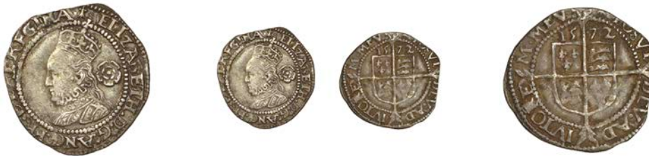
112 Fourth issue, Threepence, 1572, mm. ermine, bust 4D, 1.61g/10h (DIG 3C; N 1998; S 2566). Slightly irregular flan but full weight, about very fine