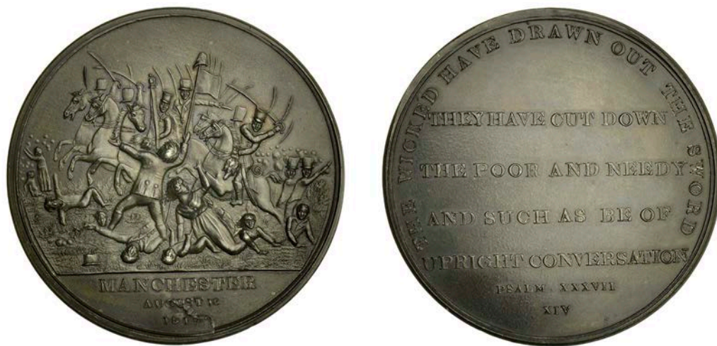
518 The Peterloo Riots, Manchester, 1819 , a copper medal, unsigned, troop of cavalry advancing left, cutting down men, women and children, rev. THE WICKED HAVE DRAWN OUT THE SWORD, THEY HAVE CUT DOWN THE POOR AND NEEDY AND SUCH AS BE OF UPRIGHT CONVERSATION, PSALM xxxvii xiv, 63mm (BHM 989; E 1112). Usual die flaw in obverse exergue, virtually as struck with dark patina, a superb example, extremely rare £300-£400