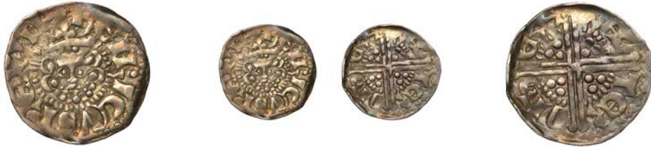
20 Penny, class IIIb, Hereford , Walter, WALTER ON HERE, 1.40g/11h (CT Her18; N 987; S 1363). Good fine or better, scarce £100-£120