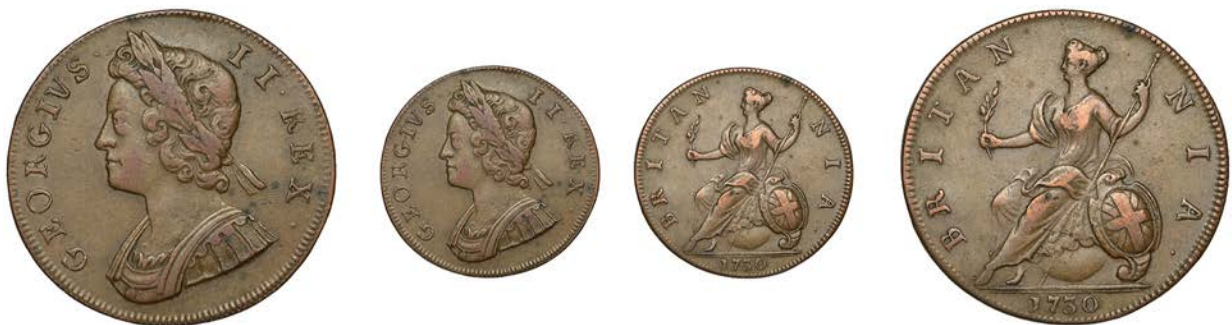
151 Halfpenny, 1730 (BMC 836; S 3717). Nearly very fine