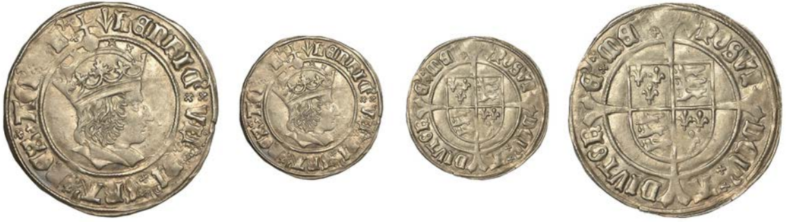
98 Profile issue, Groat, regular type, mm. pheon, triple band to crown, 2.99g/2h (SCBI Ashmolean 839ff; N 1747; S 2258). Very fine, full broad flan, lightly toned £400-£500