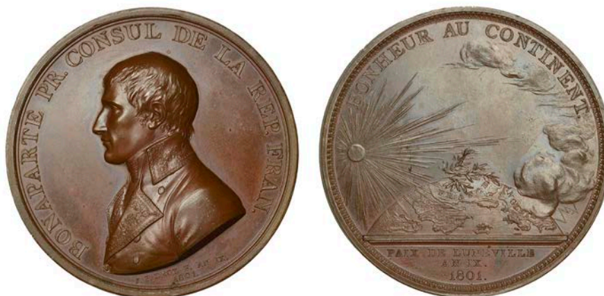
659 Peace of Lunéville , 1801, a copper medal by J.-P. Droz, uniformed bust of Napoleon left, rev. sun shining on globe, France at top with laurel branch, England to right beneath clouds and lightning, 54mm (Bramsen 106; Julius 902; BDM I, 624). Extremely fine or better, scarce £90-£120