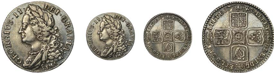
148 Shilling, 1745, LIMA (ESC 1724; S 3703). Darkly toned, about good very fine