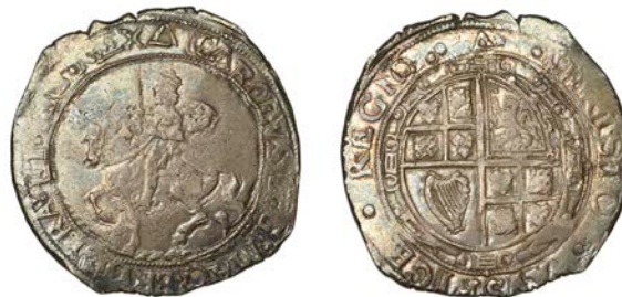
122 Tower mint, Halfcrown, Gp III, type 3a2, mm. triangle, rough ground beneath horse, 15.25g/1h (SCBI Brooker 352; N 2212; S 2776). Some surface crazing, good fine and toned