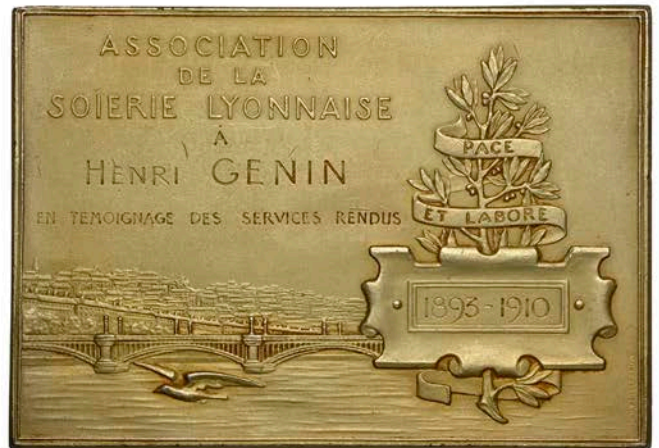
755 FRANCE, Association de la Soierie Lyonnaise , 1910, a silver-gilt award plaque by A. Poncet for L. Penin, seated female presenting a length of cloth to the city goddess, loom and spinning wheel behind, landscape in background, rev. Rhone bridge and cityscape, named (A Henri Genin en Tmoignage des Service Rendus) 83 x 58mm, 166.00g. Extremely fine and very rare £90-£120