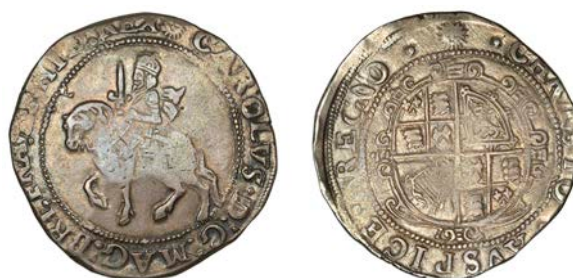
123 Tower mint (under Parliament), Halfcrown, Gp III, type 3a3, mm. sun, 15.07g/3h (SCBI Brooker 363; N 2213; S 2778). Nearly very fine and attractively toned

Provenance: Glendining Auction, 6 December 1992, lot 575; A. Morris Collection [from B. Dawson January 1993]; bt L. Bennett