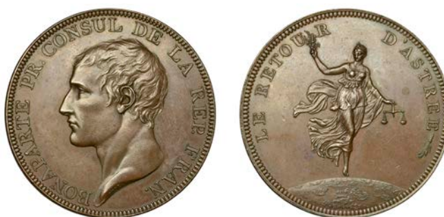
662 Peace of Amiens , 1802, a copper medal by J.-P. Droz, bare-headed bust of Napoleon left, rev. Astræa advancing over globe, holding caduceus and balance, 40mm (Bramsen 199; Julius 1057). About extremely fine, scarce £90-£120

Celebrating the Return of Astræa, goddess of innocence and justice