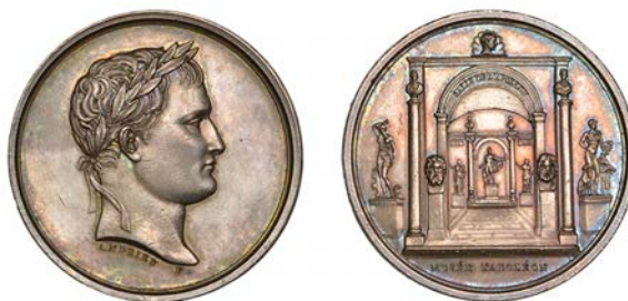
674 Opening of the Salle d'Apollon, the Louvre [1804], a silver medal by B. Andrieu, laureate bust of Napoleon right, rev. view of the gallery; in the rear, the statue of the Apollo Belvedere, 34mm (Bramsen 370; Slg. Julius 1319). Some hairlining, otherwise nearly extremely fine £200-£260