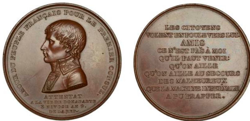
657 Napoleon Preserved from Assassination , AN 9 [1800], a copper medal by H. Auguste, uniformed bust left, rev. inscription, 50mm (Bramsen 76; Julius 857). About extremely fine, tan patina £90-£120

The assassination attempt took place in the rue Saint-Nicaise on Christmas Eve, 1800, when a bomb exploded near Napoleon's carriage en route to the French première of Haydn's oratorio The Creation