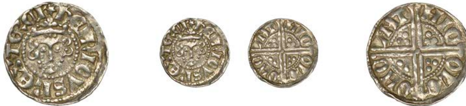
9 Penny, class IIb, Canterbury , Nicole, HICOLE OH CANT, 1.56g/5h (CT C43; N 985/1; S 1361). Very fine £100-£120

Provenance: From the Colchester II (Essex) Hoard, 1969; SCMB May 1971 (821); bt Spink