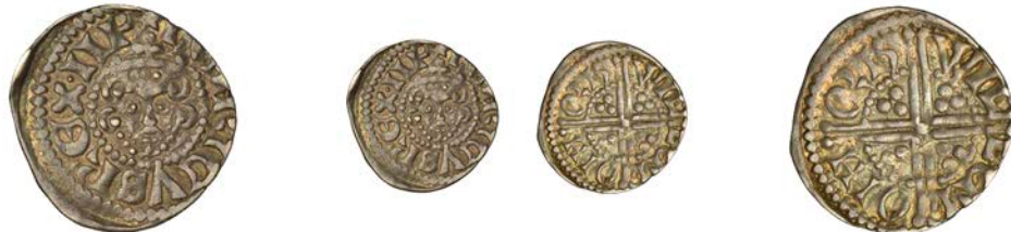
23 Penny, class IIIb, Northampton , Willem, WIL LEM OHH ORH, 1.44g/6h (CT Nor70; N 987; S 1363). Very fine £70-£90

Provenance: Patrick Finn FPL 6, January 1996 (175); J. Sazama Collection, DNW Auction 124. 16 September 2014, lot 2309