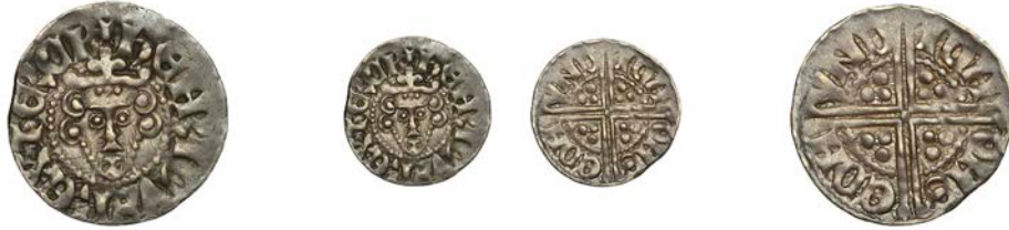
7 Penny, class IIb, Bury St Edmunds , Ion, IOH OH S EDMVND, 1.46g/10h (Eaglen 253; CT Bury 5; N 985/2; S 1361A). Very fine, dark tone £100-£120

Provenance: P Woodhead Collection [from Baldwin August 1961]; bt C.J. Martin