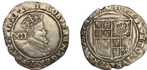
120 Second coinage, Shilling, mm. lis, third bust, 5.87g/10h (N 2099; S 2654). Good fine