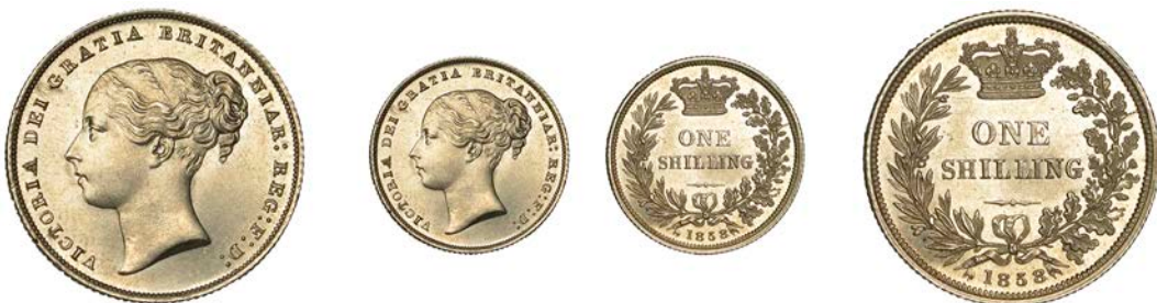
161 Shilling, 1858, second young head, broken 5 in date (ESC -; S 3904). Lustrous, practically as struck, rare