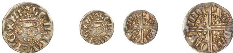
27 Penny, class IIIb, Winchester , Iordan, IVR DAN ONW INC, 1.37g/2h (CT Win59; N 986; S 1363). Very fine, scarce £80-£100