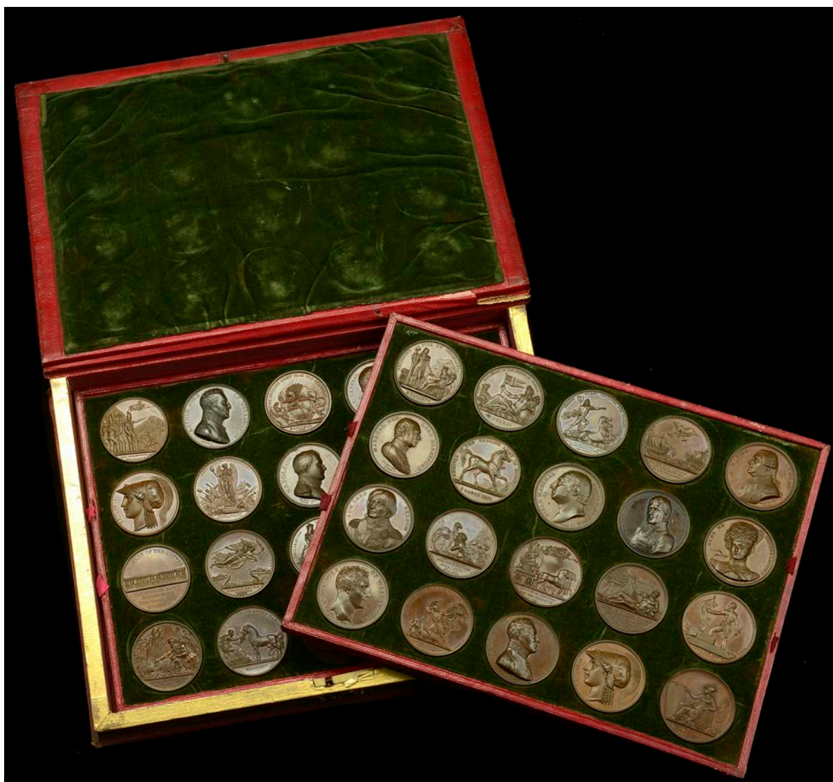
519 Mudie's National Medals, 1820 , a set of 40 copper medals by various artists, struck by E. Thomason for J. Mudie, covering events from Admiral Duncan Victory at Camperdown, 1797, to the Ionian Islands, 1817 (BHM 387, 432, 438, 476, 504, 509, 567, 595, 635, 637, 666, 671, 673, 713, 718, 727, 730, 735, 756, 760-1, 765, 769, 776-7, 789, 825, 854, 859, 867-9, 871, 884, 889, 891 -2, 921, 933, 958; E 856, 882, 886, 906, 929, 934, 952, 963, 988-9, 994, 997, 999, 1016-17, 1021, 1024, 1026, 1033-7, 1042, 1046 -7, 1050, 1058, 1064, 1066, 1068-9, 1077-80, 1081, 1085, 1094, 1102) [40]. Extremely fine and better, a most attractive original set; in original double-layer gilt-tooled maroon case with lock (no key) £3,000-£4,000