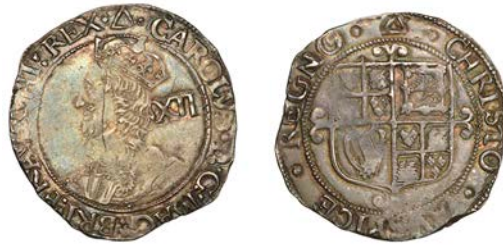
129 Tower mint, Shilling, Group F, type 4.4, mm. triangle, 5.64g/10h (N 2231; S 2799). Flan flaw across king's head, otherwise good very fine, attractively toned £70-£90