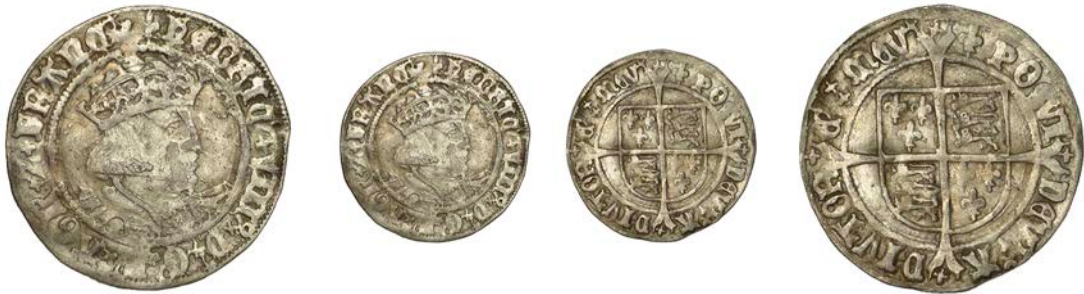
100 Second coinage, Groat, Tower, mm. lis, bust D, saltires in forks, 2.52g/10h (N 1797; S 2337E). Worn obverse die, full flan, good fine £80-£100