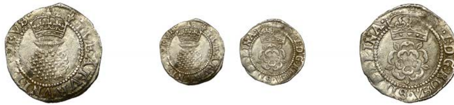
121 Third coinage, Halfgroat, mm. lis (N 2127; S 2671). Very fine