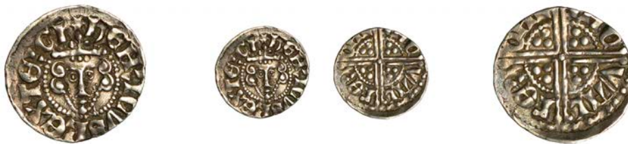
12 Penny, class IIb, Lincoln , Walter, WAL TER ONL INC, 1.34g/9h (CT Lin 7; N 985/1; S 1361). Off-centre, about very fine £70-£90