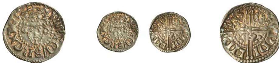
11 Penny class IIb, Exeter , Philip, PHILIP [OH ECCE], 1.53g/6h (Brettell 345; CT 5ff; N 985; S 1361). Very fine and toned but reverse legend blundered by double strike £120-£150