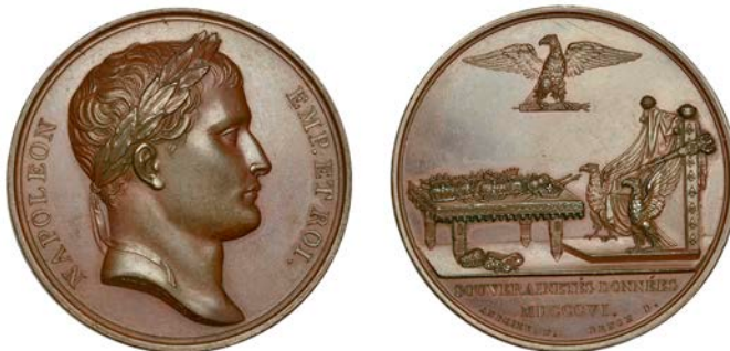
683 Sovereignities Granted , 1806, a copper medal by B. Andrieu, laureate bust of Napoleon right, rev. table set with sceptres and crowns, three fallen to the ground, beside throne decorated with eagles, upon which sits trophy-tipped sceptre, French imperial eagle on fasces above, 41mm (Bramsen 553; Julius 1624). Extremely fine £80-£100

Commemorates the emperor's approval for the creation of the kingdoms of Bavaria and Württemberg