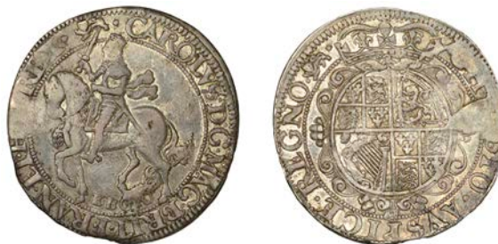
132 York mint, Halfcrown, Gp 2 [type 7], mm. lion, 14.36g/12h (Besly 2l; Bull 564; SCBI Brooker 1086-7; N 2315; S 2869). Die breaks on both sides in advanced state, nearly very fine £600-£800