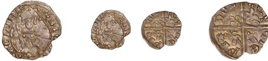
200 Henry IV-VI , Hardi d'argent, pellets below fleurs-de-lis on rev., reads CIE FRA DNS AQL, 0.90g/6h (W 282; E 233; S 8147). On an irregular flan, very fine, the error reading rare

Provenance: DNW Auction 57, 19 March 2003, lot 813