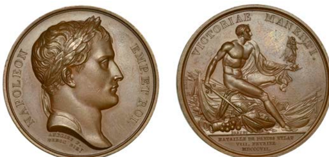
684 Battle of Eylau , 1807, a copper medal by N.G.A. Brenet, laureate bust of Napoleon right, rev. Napoleon as Diomedes, seated right on pile of flags and arms, holding sword and Victory, 40mm (Bramsen 628; Julius 1727). Good extremely fine £80-£100

Commemorates the emperor's approval for the creation of the kingdoms of Bavaria and Württemberg