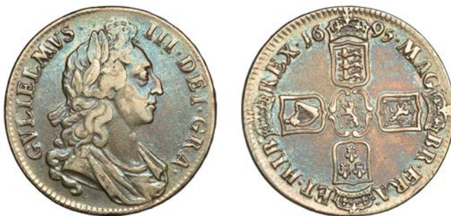
141 Crown, 1695, first bust, edge SEPTIMO (ESC 990; S 3470). Nearly very fine, toned