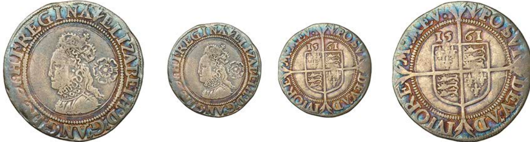
111 Third issue, Sixpence, 1561, mm. pheon, bust 1F, normal flan, Tudor rose, small shield, 2.85g/1h (N 1997; S 2561). Fine, evenly worn and attractively toned