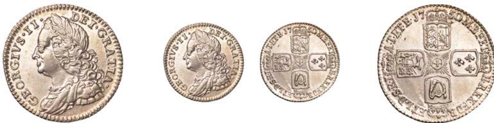
150 Sixpence, 1750 (ESC 1760; S 3711). Of bright appearance, good very fine, scarce