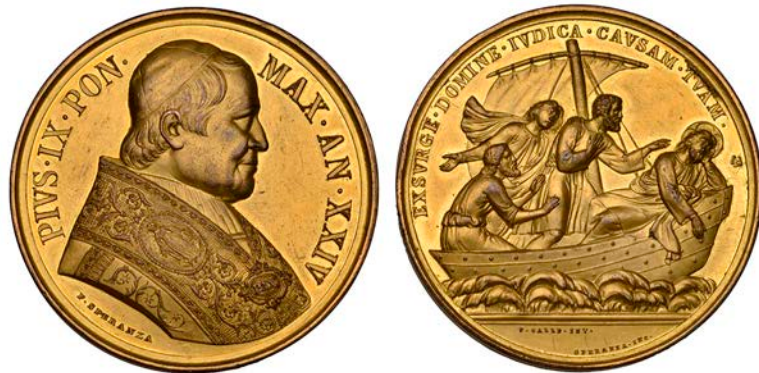
774 PAPAL STATES, Defence of the Rights of the Church , 1869, a gilt-bronze medal by F. Speranza, bust of Pius IX in robes right, rev. boat sailing to right in a stormy sea, three apostles imploring a sleeping and reclined figure of Christ to awaken, 48mm (Bartolotti XXIV, 45). Reverse rim bruise at 9 o'clock, usual raised die flaw above TVM, otherwise extremely fine, rare as a gilt medal £100-£150

The legend on the reverse almost certainly refers to the political situation which led to the end of the Papal States as an entity