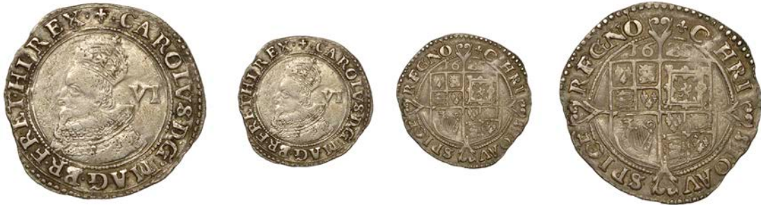
130 Tower mint, Sixpence, Gp A, type 1, 1625, mm. lis (to right of cross limb on rev.), 2.86g/11h (SCBI Brooker 570; N 2235; S 2805). Slightly weak on bust, otherwise nearly very fine, £120-£150