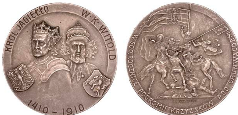
776 POLAND, 500th Anniversary of the Battle of Grunwald , 1910, a silver medal by K. Czaplicki, crowned armoured busts of King Vladislav II Jagiello of Poland and Grand Duke Vytautas of Lithuania, rev. battle scene, 50mm, 39.68g (Strzałkowski 154). Nearly extremely fine, rare in the large size £100-£150