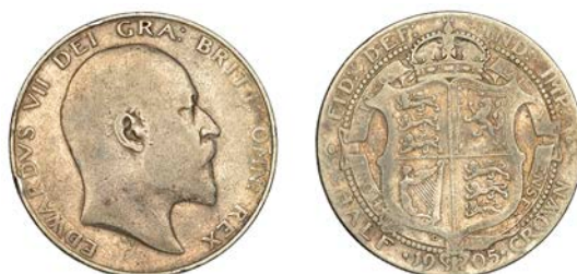
169 Halfcrown, 1905 (ESC 3571; S 3980). Edge mark at 9 o'clock, fair to fine, rare