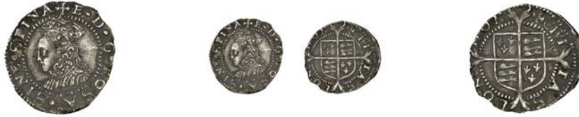
110 Second issue, Penny, mm. cross-crosslet, 0.51g/9h (N 1998; S 2558). Very fine