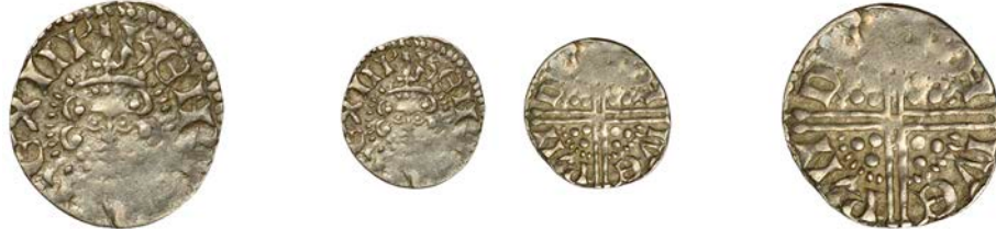
21 Penny, class IIIb, Ilchester , Randulf, RAN DVL FON IVE, 1.44g/1h (CT 17; N 987; S 1363). Nearly very fine but flat in places, rare £100-£120

Provenance: A. Morris Collection [from M. Trenerry 2000]; bt L. Bennett