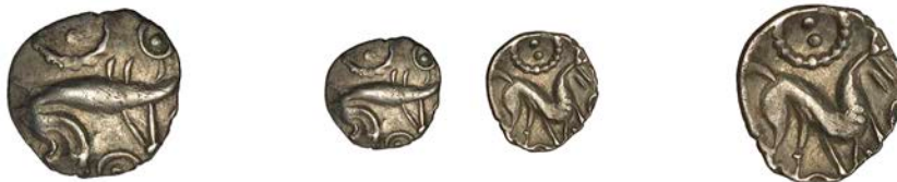
138 CORIELTAUVI , early uninscribed issues, silver Unit, South Ferriby type, boar right, pellets surrounding, rev. stylised horse bounding right, pellet ring above, 1.29g (ABC 1800; BMC 3214-7; S 397). Very fine or better, toned £120-£150