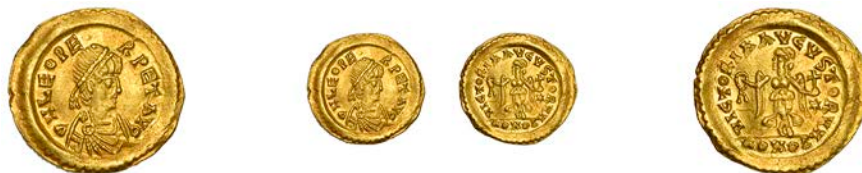
342 Leo I , Tremissis, Constantinople, 462-6, pearl-diademed, draped and cuirassed bust right, rev. Victory advancing facing, holding wreath and globus cruciger, star in right field, 1.49g (RIC 611; RCV 21421). Good very fine £200-£300