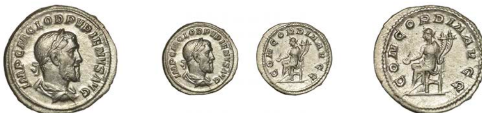
323 Pupienus , Denarius, 238, laureate, draped and cuirassed bust right, rev. Concordia seated left, holding orb and cornucopia, 2.50g (RIC 1; RSC 6; BMC 42). Bright surfaces, otherwise very fine £200-£260