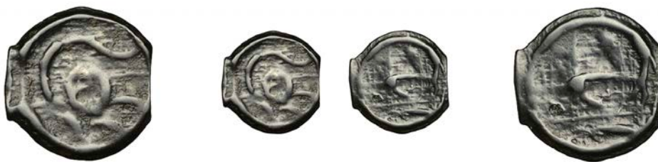
107 CANTIACI , cast Potin Unit, outlined head left, rev. outline of bull, 1.74g (ABC 153; BMC 674-75; VA 112; S 63). Dark patina, very fine £20-£30