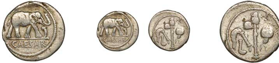
263 Julius Caesar , Denarius, Military mint travelling with Caesar, 49-8, elephant walking right, trampling on dragon, CAESAR in exergue, rev. emblems of the pontificate; simpulum, aspergillum, axe and apex, 3.23g/11h (Craw. 443/1; BMCRR Gaul 27-30; RSC 49). Porous surface on reverse, otherwise very fine £200-£260