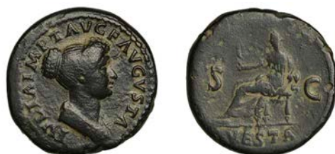
305 Julia Titi , Dupondius, 80-81, draped bust right, rev. Vesta seated left holding palladium and sceptre, sc in field, VESTA in exergue, 15.53g (RIC 398; BMC 257). Dark patina, good fine £100-£120