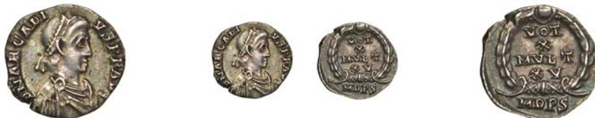
338 Arcadius , Siliqua, Mediolanum, 383-408, pearl-diademed, draped and cuirassed bust right, rev. VOT X MVLT XV across four lines within wreath, MDPS in exergue, 1.32g (RIC 13; RSC 27c). Lightly clipped, otherwise with a pleasing tone, about good very fine £100-£120