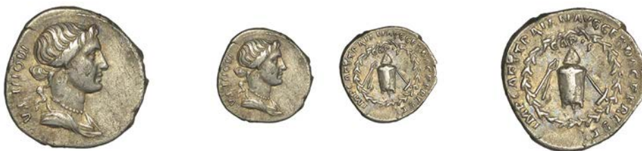
309 Trajan , Denarius, Restoration issue, draped bust of Juno Moneta facing right, MONETA, rev. IMP CAES TRAIAN AVG GER DAC PP REST, anvil, pincers, hammer and dies with CARISVS above, all within a laurel wreath, 2.97g (RIC 805; BMC 688; RSC 32). A few light surface marks, otherwise very fine and extremely rare £5,000-£6,000

Provenance: Found in Little Gransden (South Cambridgeshire) and recorded on the PAS (LIN-38C231)