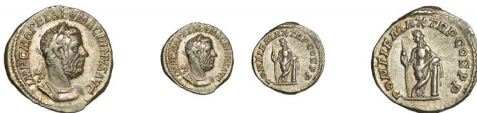
321 Macrinus , Denarius, 217-8, laureate, draped and cuirassed bust right, rev. Felicitas standing front, head to left, holding long caduceus and cornucopia, 3.69g (RIC 24; BMC 40). Very fine £100-£120