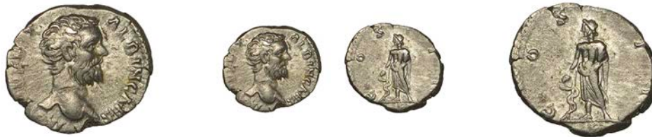
319 Clodius Albinus , Denarius, Rome, 194-5, bare head right, [-] ALBIN CAES, rev. COS II, Aesculapius standing, holding snake road entwined with serpent, 2.97g/12h (RIC 2a; RSC 9). Very fine £60-£80