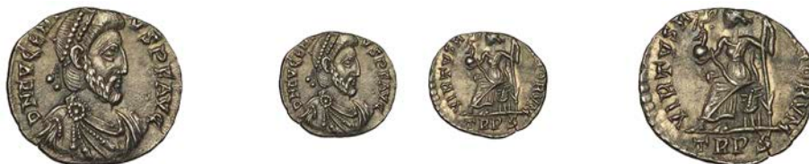
339 Eugenius , Siliqua, Trier, 392-94, pearl-diademed, draped and cuirassed bust right, rev. Roma seated left on cuirass, holding reversed spear and Victoriola on globe, 1.69g (RIC 106d; RSC 14a). Hairline crack at 7 o'clock on obverse, lightly clipped, otherwise toned and good very fine £300-£400