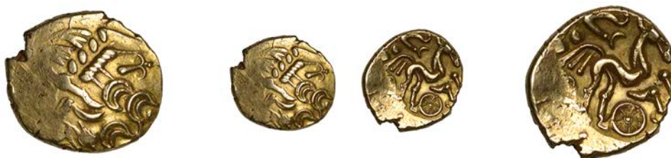
111 ATREBATES and REGNI , Uninscribed series, gold Stater, British Qa [Selsey Two Faced type], devolved head of Apollo, with hidden face visible, rev. disjointed triple-tailed horse right, charioteer's arm above, seven-spoked wheel below, 5.77g (Sills 153; ABC 485; BMC 445; S 38). Good very fine, some weakness in places £500-£700