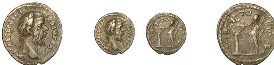
318 Pescennius Niger , Denarius, Antioch, 193-4, laureate head right, rev. Victory standing left inscribing shield atop column, 2.85g (RIC 83b; RSC 72a). Toned, fine and very rare £300-£400