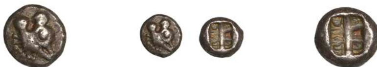
206 LYCIA , uncertain Dynast, Third-Stater, c. 520-500 BC, lion's head with open jaws left, rev. three lines forming a table shape with two raised pellets above, all within incuse square, 2.96g/3h (cf. Rosen 681 [Stater of similar style]). Very fine and dark toned; the issue rare £300-£400