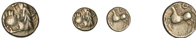
184 EASTERN CELTS, Danubian , silver Drachm, Kugelwange type, laureate head of Zeus right, rev. horse left, ring above, 2.23g (Flesche 616; Lanz 509). Very fine £100-£120