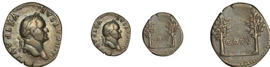
302 Vespasian , Denarius, 74, laureate head right, IMP CAESAR VESP AVG, rev. COS V between two laurel trees, 2.98g/6h (RIC 681; RSC 110). Dark tone, very fine £90-£120