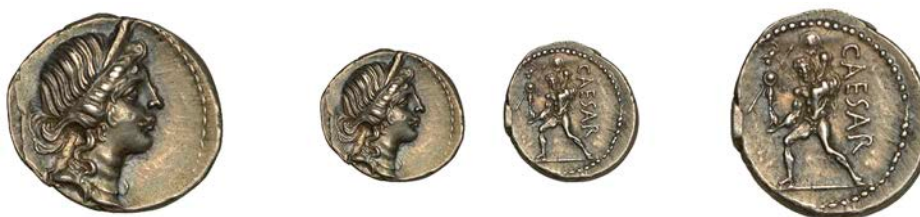
266 Julius Caesar , Denarius, military mint moving with Caesar in Africa, 47-6, diademed head of Venus right, her hair rolled back and tied into a knot, rev. CAESAR downwards to right, Aeneas walking left holding the Palladium in right hand, carrying his father Anchises on left shoulder, 3.70g/3h (Craw. 458/1; BMCRR East 31-5; RSC 12). About extremely fine, well struck up and attractively toned £900-£1,200