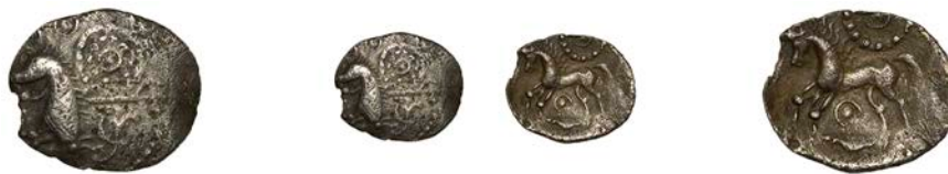
136 CORIELTAUVI , uninscribed issues, silver Unit, Proto Boar type, boar right, rev. horse left, pellet-and-ring and annulet above, pellet-in-annulet below, 1.29g (ABC 1779; BMC 3194ff; VA 855; S 396). Surfaces slightly coarse, obverse fine, reverse about very fine, rare £100-£120