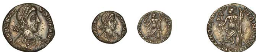
340 Honorius , Siliqua, Mediolanum, 395-402, pearl-diademed, draped and cuirassed bust right, rev. Roma seated left on cuirass, holding reversed spear and Victoriola on globe, 1.12g (RIC 1228; RSC 59b). Clipped with some obverse pitting, otherwise very fine £50-£70