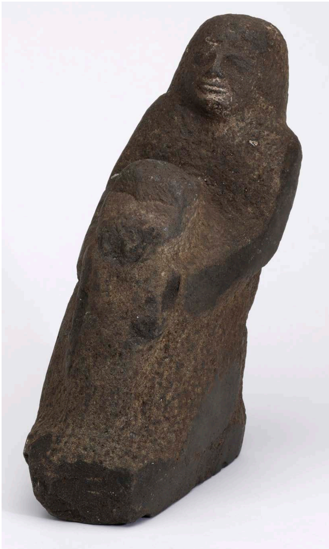
487 Egypt , Late Period - Ptolemaic Period (664 - 30 BC), a naophorous statue, dark grey hard stone, possibly basalt. of a kneeling male official holding a smaller figure of a deity or shrine, 28 x 16.5 x 10 cm, 6.9 kg. Heavily worn with the facial details of the official reworked £200-£300

Provenance: From an old UK collection from Lincolnshire