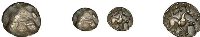
139 CORIELTAUVI, Vepo , silver Unit, Vepo Vep type, trace of design, rev. horse right, vEP above, pellet triad below, 1.16g (ABC 1866; VA 963-5; BMC 3277-82). Dark patina, good very fine £150-£180