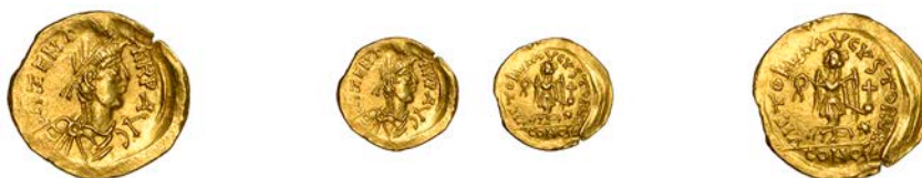
343 Zeno I (second Reign), Tremissis, Constantinople, 476-91, pearl-diademed, draped and cuirassed bust right, rev. Victory advancing facing, holding wreath and globus cruciger, star in field, 1.43g (RIC 914; RCV 21532). Flan a little irregular, otherwise good very fine £200-£300