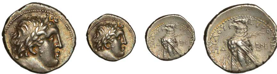
208 PHOENICIA, Tyre , Shekel, yr 94 [33-2], laureate head of Melkart right, rev. eagle standing left on prow, palm frond over shoulder, \Upsilon\Delta above club to left, \text{BN} to right, 14.24g (BMC 178; RPC 4631). Struck a little off-centre, otherwise very fine, grey toned with golden highlights £200-£260