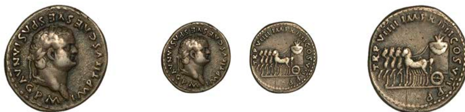
303 Titus , Denarius, 79, laureate bust right, IMP TITVS CAES VESPASIAN AVG PM, rev. TRP VIII IMP XIII COS VII PP, slow quadriga containing corn-ears advancing left, 3.50g/5h (RIC 25; RSC 278). Some light porosity, otherwise good fine £90-£120