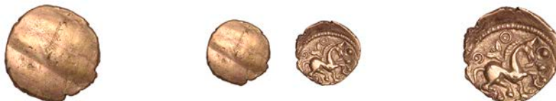
109 CANTIACI, Dubnovellanus , Quarter-Stater, Trefoil type, blank with banding, rev. horse right with corded mane, triskele and pellets-in-annulets above, 1.32g (ABC 312; BMC 2475-7; VA 170; S 171). Off centre, nearly extremely fine £300-£400