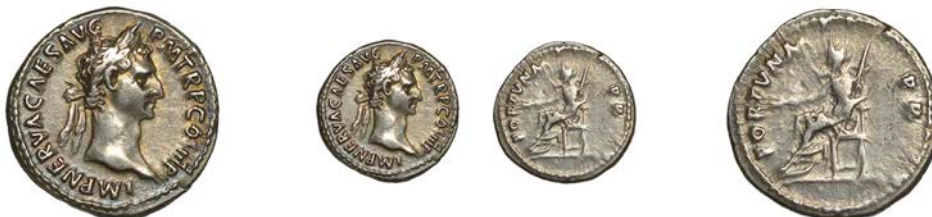
308 Nerva , Denarius, 96-98, laureate head right, rev. Fortuna seated left holding out corn ears and cradling sceptre, 3.14g (RIC 17; RSC 79; BMC 41). Obverse well-struck, reverse weaker, very fine £200-£260