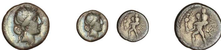
267 Julius Caesar , Denarius, Military mint moving with Caesar in Africa, 47-6, diademed head of Venus right, her hair rolled back and tied into a knot, rev. CAESAR downwards to right, Aeneas walking left holding the Palladium in right hand, carrying his father Anchises on left shoulder, 3.39g/6h (Craw. 458/1; BMCRR East 31-5; RSC 12). Fine £100-£150