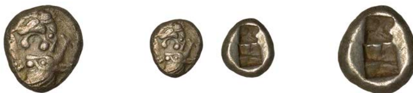
211 ACHÆMENID KINGS OF PERSIA, Cyrus the Great - Darius I , Siglos or Half-Stater, Sardes, c. 550-520, confronted lion and bull, rev. two incuse squares, 5.31g (SNG Ashmolean 762-71; McClean 8637-9; Kraay AGC 78). Nearly very fine, toned over granular surfaces £150-£200