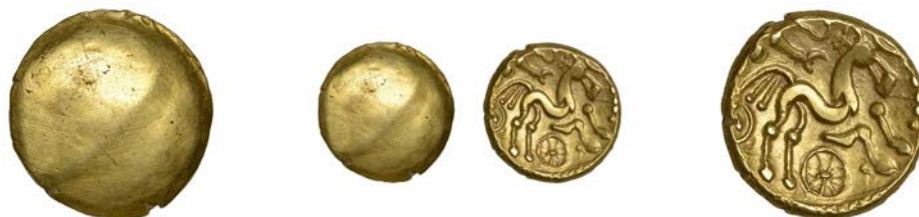
112 ATREBATES and REGNI , uninscribed series, Stater, British Qb, [Selsey uniface type], obv. small trace of design, rev. triple-tailed horse right, arm of charioteer above, ornament around, eight-spoked wheel below, 6.03g (Sills 156; BMC 461ff; ABC 488; VA 216-1; S 39). Some minor die flaws around horse's head and wheel, otherwise very fine, attractive yellowish gold £600-£800