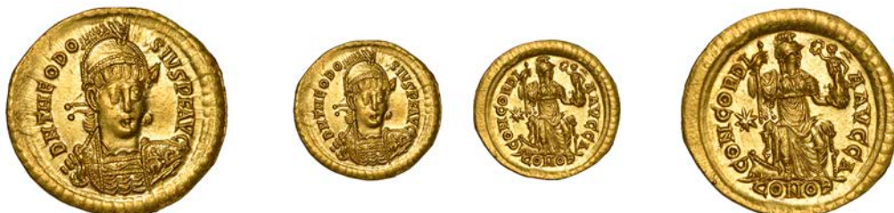
341 Theodosius II , Solidus, Constantinople, 408-20, pearl-diademed and cuirassed bust facing, holding spear and shield, D N THEODOSIVS P F AVG, rev. CONCORDIA AVGG Z, Constantinopolis seated front, resting right foot on ship prow, holding Victoriola on globe and sceptre, 4.49g (RIC 202; RCV 21127). Lustrous, reverse very sharply struck, extremely fine £400-£500