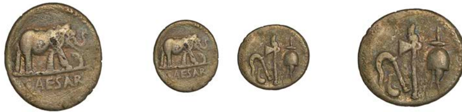
262 Julius Caesar , Denarius, military mint travelling with Caesar, 49-8, elephant walking right, trampling on dragon before, CAESAR in exergue, rev. emblems of the pontificate; simpulum, aspergillum, axe and apex, 3.47g/10h (Craw. 443/1; BMCRR Gaul 27-30; RSC 49). Small areas of corrosion, about fine £90-£120