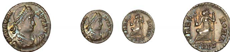
332 Valens , Siliqua, 316, Trier, diademed, draped and cuirassed bust right, D N VALENS P F AVG around, rev. Roma seated left on throne, holding Victory on globe and sceptre, VRBS ROMA around, TR PS in exergue, 2.11g/6h (RIC 27e; RSC 109a). Very fine, prettily toned