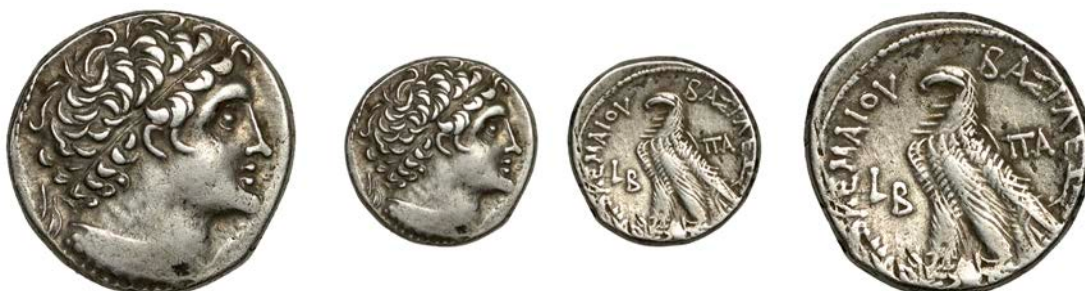
210 PTOLEMAIC KINGS OF EGYPT, Cleopatra III and Ptolemy IX , Tetradrachm, Alexandria, yr 2 [116-5], diademed head of Ptolemy right, rev. [-]ΛΕΜΑΙΟΥ ΒΑΣΙΛ[-] around Eagle standing left on thunderbolt, \text{I}\Theta left, \text{Π}\Lambda right, 14.43g/12h (Svoronos 1660; SNG Copenhagen 348). Good fine £80-£100