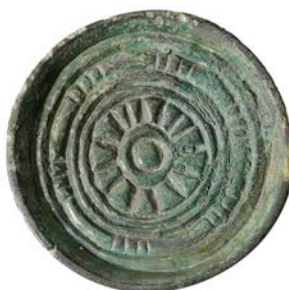
514 Anglo-Saxon , a gilt-bronze saucer Brooch, 6th century, with an angular rim, chip carved design with a central ring and dot motif encircled by radial lines forming a rosette, further enclosed by two concentric rings. Around the perimeter is a border of basketry ornament, 36mm diameter, height 12mm. Hinge and catch plate behind with rust traces of the iron pin, very fine with a smooth olive green patina. £200-£300

Provenance: Found at Eccles villa in Kent in the 1990s