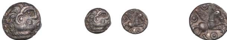
108 CANTIACI, Uninscribed issues , Unit, head right with torc around neck, pellet-in-annulets before and behind, rev. Pegasus right, pellet-in-annulets around, 1.00g/7h (ABC 219; BMC –; S –). About very fine and very rare £600-£800