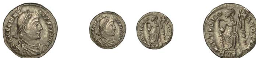
337 Magnus Maximus , Siliqua, Trier, 383-88, pearl-diademed, draped and cuirassed bust right, rev. Roma enthroned facing, head left, holding globe and sceptre, 1.99g (RIC 84b; RSC 20a). Toned, reverse weakly struck, very fine