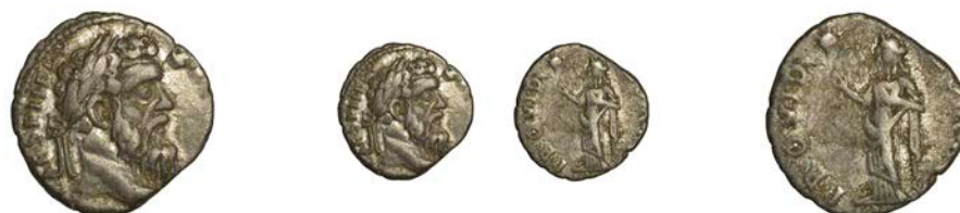
315 Pertinax , Denarius, 193, laureate bust right, rev. Providentia standing left, star in field, 2.52g (RIC 11a; RSC 43). Toned, fine and rare £120-£150