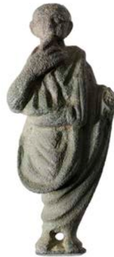
497 Romano-British , 1st century AD, leaded bronze togate figure, depicting a male wearing a himation and standing upright on a small circular base, his right arm bent upwards at the elbow and his index finger extended touching his lips. His left arm is bent at the elbow, hand is missing (which may have held a scroll or a patera), 42 x 20 x 8mm. Provincial style with an oversized hand, clean shaven with a slit mouth and prominent ears; drilled through the top of the head and between the feet for attachment, very fine with a green patina

Provenance: M. O'Bee Collection, acquired in the 1970s.