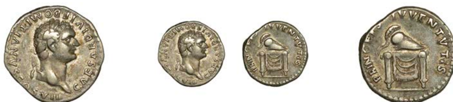
306 Domitian (as Caesar), Denarius, 79-81, laureate bust right, rev. Corinthian helmet set on draped seat, 3.31g (RIC 271; RSC 399a). Good fine £100-£120