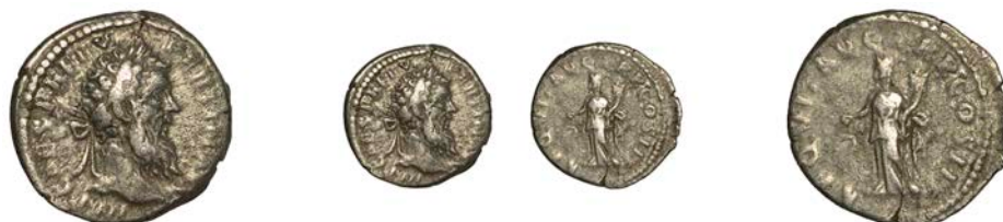
314 Pertinax , Denarius, 193, laureate bust right, rev. emperor standing left, sacrificing out of patera over tripod to left, 3.22g (RIC 13a; RSC 56). Coarse surfaces with some pitting, otherwise fine and rare £200-£260