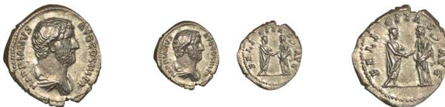
311 Hadrian , Denarius, Rome, 133-5, laureate and draped bust right, HADRIANVS AVG COS III PP, rev. FELICITAS AVG, Hadrian standing front, clasping hands with Felicitas, 3.42g/6h (RIC 1998; RSC 632). Sometime cleaned, otherwise good very fine £100-£150