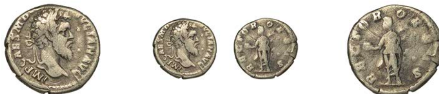
316 Didius Julianus , Denarius, 193, laureate head right, rev. Didius Julianus standing left, holding globe and volumen, 2.75g (RIC 3; RSC 15). Some minor blistering, otherwise fine, very rare £200-£260