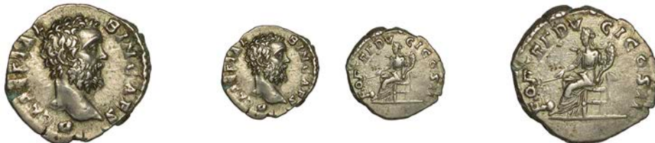
320 Clodius Albinus (as Caesar), Denarius, 194, bare head right, rev. Fortuna seated left holding cornucopia and rudder, 3.22g (RIC 5c; RSC 30a). Good fine £100-£120