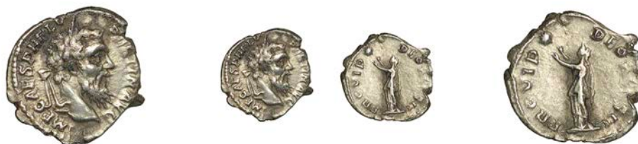
317 Pertinax , Denarius, Rome, 193, laureate head right, IMP CAES P HELV PERTIN AVG, rev. PROVID DEOR [-]s II, Providentia, draped, standing and holding both hands up to a star, 2.55g/6h (RIC 10a; RSC 40). Struck on an irregular flan, fine £100-£150