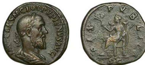
324 Pupienus , Sestertius, 238, laureate and draped bust right, rev. Pax seated left, holding olive branch and sceptre, 20.54g (RIC 22a; BMC 48; RCV 8533). Dark patina with rough reverse surfaces, obverse perhaps smoother, nearly very fine £200-£260