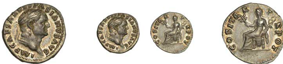
301 Vespasian , Denarius, 70, laureate head right, rev. Pax seated left, holding branch and caduceus, 3.23g (RIC 29; RSC 94h; RCV 2285). Attractively toned and lustrous, good very fine or better with a superb portrait £200-£260