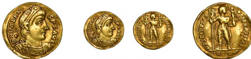
334 Valens , Solidus, Rome, 364-78, pearl-diademed, draped and cuirassed bust right, rev. Valens standing facing, head right, holding labarum in one hand and Victoriola on globe in the other, 4.44g (RIC 2c; RCV 19546). Possibly removed from a mount, otherwise good fine, tone