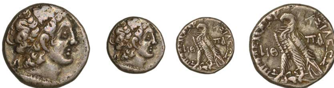
209 PTOLEMAIC KINGS OF EGYPT, Ptolemy X , Tetradrachm, Alexandria, yr 19 [96/5], diademed head right, ΠΤΟΛΕΜΑΙΟΥ ΒΑΣΙΛΕΩΣ, rev. eagle standing left on thunderbolt, \text{L}\text{I}\Theta left, \text{Π}\Lambda right, 13.66g/12h (Svoronos 1679; SNG Copenhagen 368). Good fine £80-£100