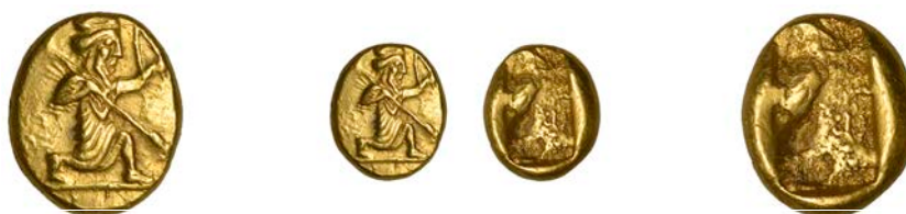
212 ACHAÆMENID KINGS OF PERSIA, Xerxes II to Artaxerxes II , gold Daric, Sardis, c. 420-375, crowned Persian king running right, holding transverse spear and bow, rev. irregular oblong incuse punch, 8.35g (Carradice IIIb, Gp C; Kraay 82; Boston 2205). Good very fine £900-£1,200