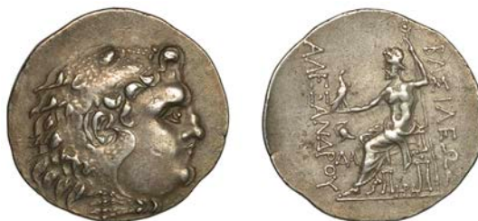
203 BLACK SEA, Mesembria , Tetradrachm, c. 175-125, head of Herakles right wearing lion-skin, rev. ΒΑΣΙΛΕΩΣ ΑΛΕΞΑΝΔΡΟΥ, Zeus seated left, holding eagle and sceptre, Corinthian helmet by knee, ΔΑ monogram below, ΗΡ Α below throne, 16.57g (Price 1054). Better than very fine, grey toned £150-£200