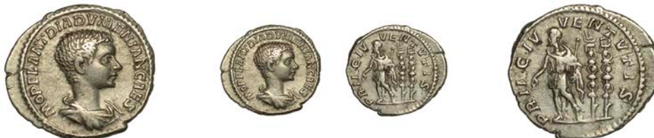
322 Diadumenian , Denarius, 217-8, draped and cuirassed bust right, rev. Diadumenian standing left, standards to right, 2.43g (RIC 108; RSC 14a). Obverse flan crack at 9 o'clock, otherwise very fine £120-£150