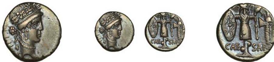
265 Julius Caesar , Denarius, military mint moving with Caesar, spring-summer 48, diademed head of Pietas right, wearing an oak wreath, hair tied back and ornamented with jewels, LII behind, rev. CAESAR below trophy of Gallic arms with shield, horned helmet and carnyx, axe right, 3.88g/3h (Craw. 452/2; BMCRR 3955-8; RSC 18). Discrete banker's marks, otherwise toned and very fine £200-£260