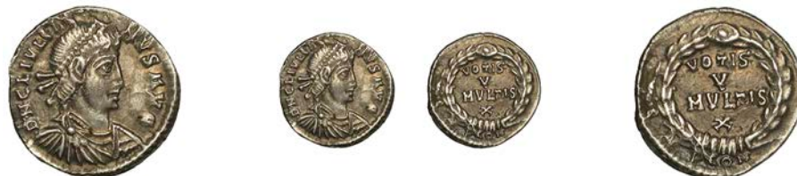
333 Julian II , Siliqua, Arles, 360-63, pearl-diademed, draped and cuirassed bust right, rev. VOTIS V MVLTVS X in four lines within wreath, 2.16g (RIC 295; RSC 161). Toned, good very fine

Provenance: Found as part of the Otterbourne Hoard 17 January 1978; SCMB, March 1989 [OT9]