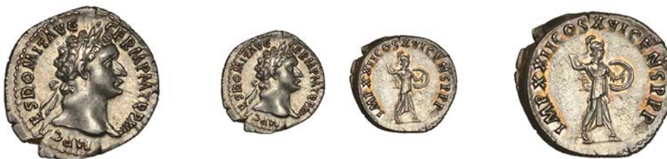
307 Domitian , Denarius, 95-6, laureate head right, rev. Minerva advancing right, holding spear and shield, 3.48g (RIC 787; RSC 95-6). About extremely fine, prettily toned £100-£120