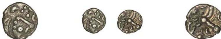
140 DOBUNNI , silver Unit, Cotswold Eagle type, moon head right with annulets for hair, large boss on chin, stalk lips, rev. triple-tailed horse left, floral motif below, 1.10g/7h (ABC 2015; BMC 2953ff; S 377). Struck on a compact flan, about very fine £70-£90