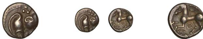
182 CENTRAL GAUL, Aedui , silver Quinarius, helmeted head left, rev. horse left with rings above and below, 1.78g/11h (LT 4805; cf. DT 8291). Struck slightly off-centre, good very fine £100-£120