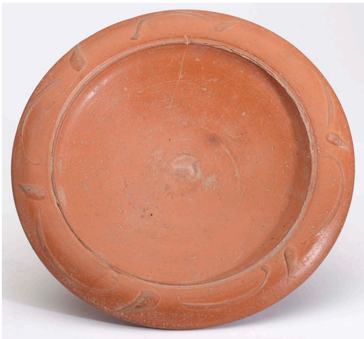
513 Roman , 4th century, North African Arretine red ware bowl, small foot, overhanging rim with Barbotine decoration of simple leaf and stalk, 18.5 x 3 cm. Very fine, with tiny chip to base. £100-£150