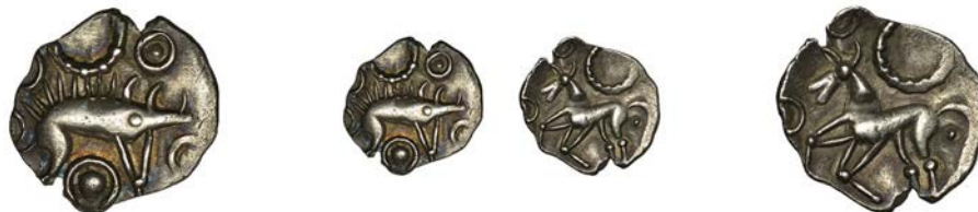
137 CORIELTAUVI , early uninscribed issues, silver Unit, Proto-Boar One Leg type, simplified boar with large ring of pellets above, various rings surrounding, rev. horse left, ring of pellets above, 1.35g (cf. ABC 1797; VA 857-1; S 396). Cabinet tone, struck on a slightly irregular flan, good very fine and scarce thus £200-£300