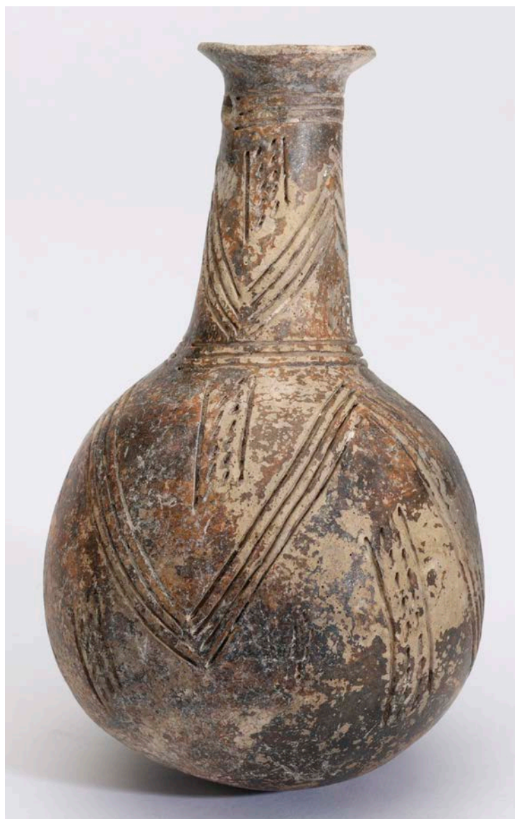
483 Bronze Age, Cyprus, c. 2000 -1500 BC , a bottle, part black and red buff with tapering neck, pierced on two sides with a flared rim. Spherical body with rounded base, incised decoration of incised parallel lines, 13 x 7.5 cm. Very fine, intact with a small chip to the rim £200-£300