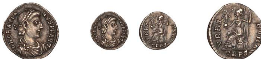
336 Gratian , Siliqua, Trier, 375-8, pearl-diademed, draped and cuirassed bust right, rev. VRBS ROMA, Roma seated left on cuirass, holding reversed spear and Victoriola on globe, TR PS in exergue, 1.75g (Hoxne 348; RIC IX p.23, 46(b); RSC 87+a). Old cabinet tone, traces of red wax around devices, good very fine