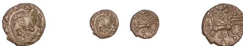
141 DOBUNNI , silver Unit, moon head right, triads of pellets for hair, cross on chin, pellets and crescents before, rev. triple-tailed annuleted horse left, stylised bird's head above, flower motif below, 1.07g/10h (Allen D; ABC 2021; BMC 2968ff; VA 1049; S 377). Very fine or better for issue, scarce thus £100-£150

Provenance: Found near Swinbrooke (Oxfordshire) - PAS BUC-248F28