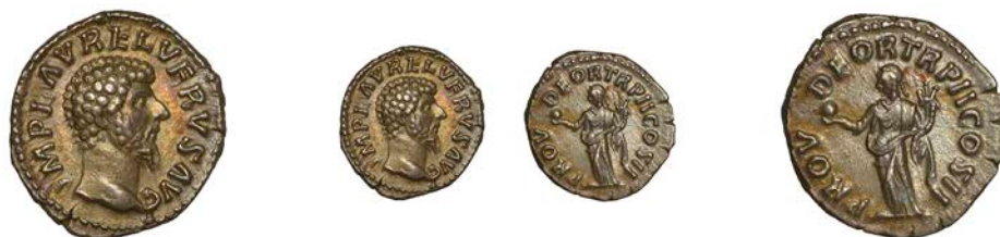
313 Lucius Verus , Denarius, 161-62, bare head right, IMP L AVREL VERVS AVG, rev. PROV DEOR TR PII COS II around Providentia standing left holding globe and cornucopiae, 3.20g/6h (RIC 482; RSC 155). Well centred, very fine and portrait better £80-£100